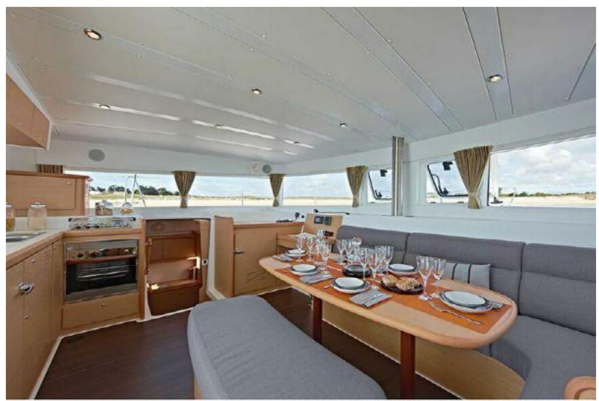
Lagoon 421 - Ne d'Yeu - juin 2009 - Mention obligatoire / Mandatory credit. Photo Necros Claris