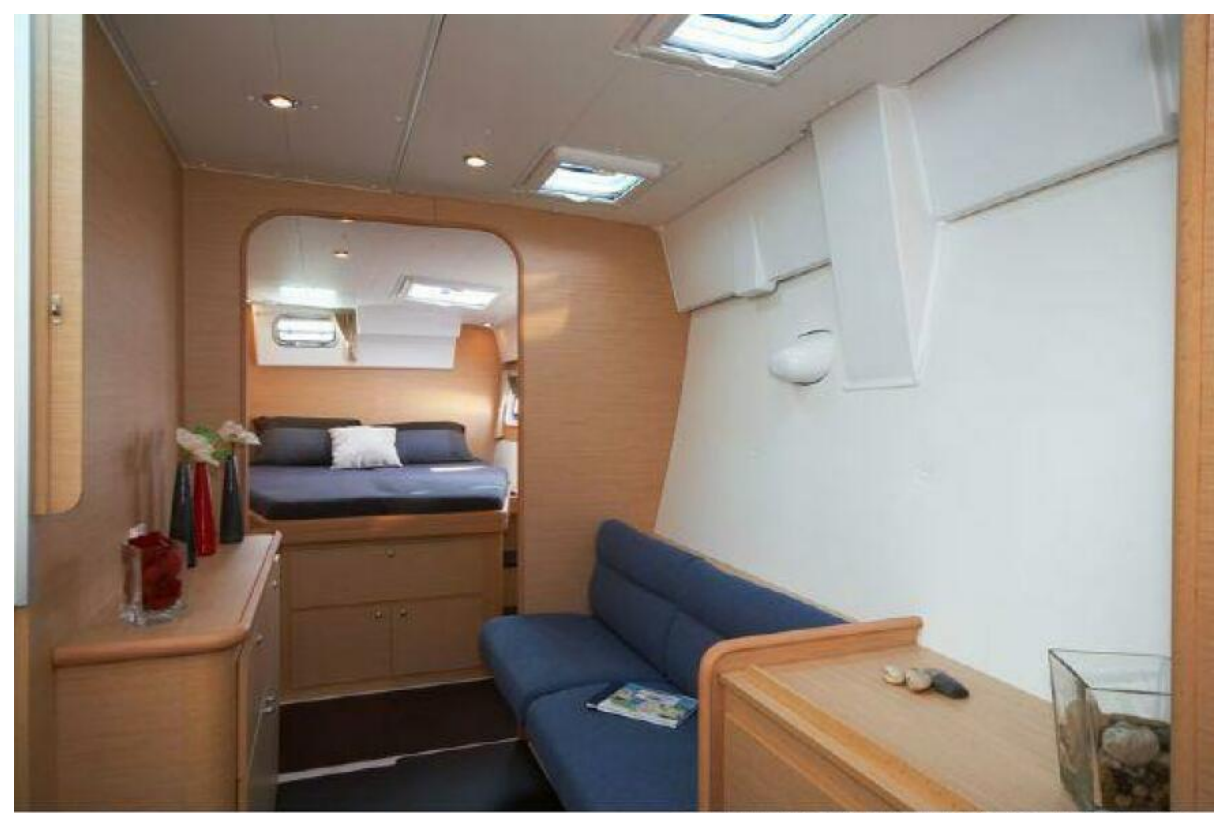
Lagdon 421