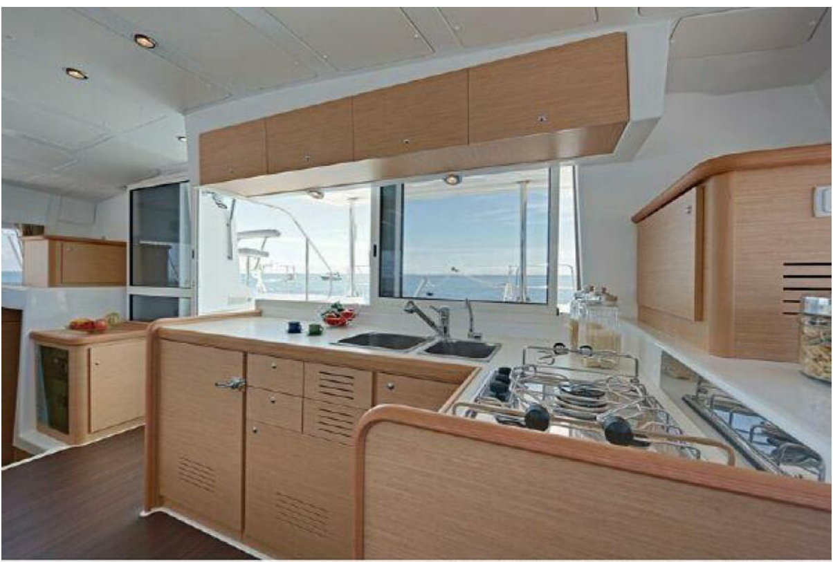
Lagoon 421 - Re d Yeu - Juin 2009