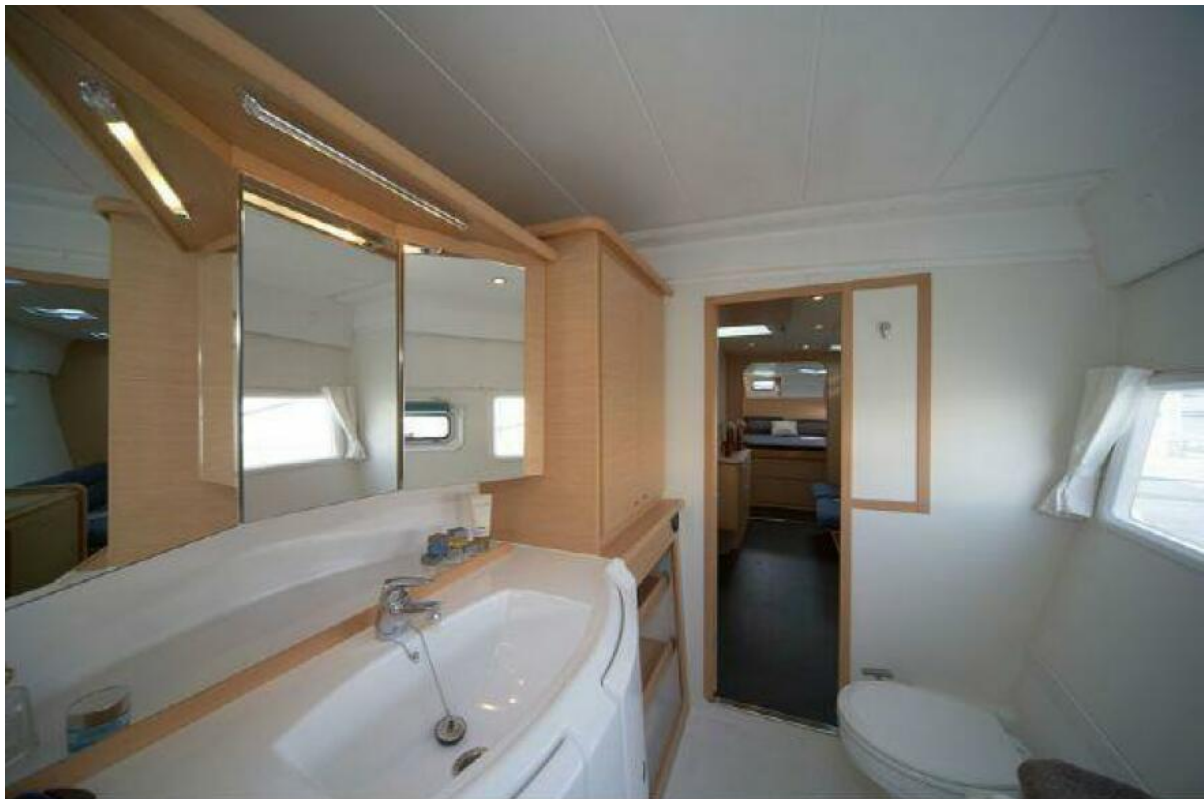
Laggory 421