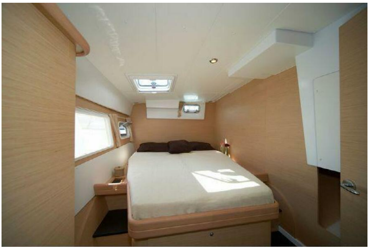
Lagoon 421 - Mention obligatoire / Mandatory credit: Photo Nicolas Claris