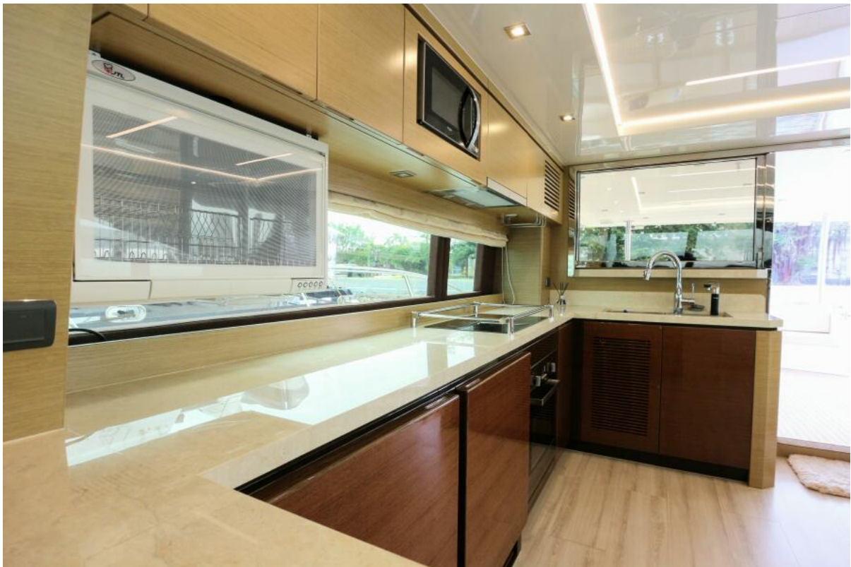
Galley on Stbd Bright, great storage, clean design