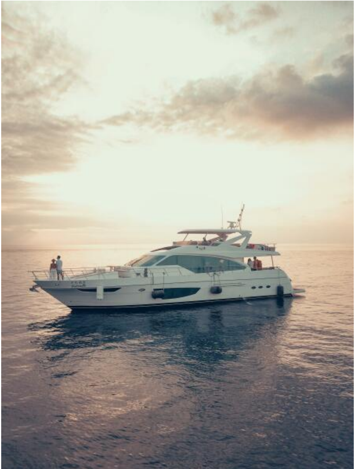
72 Grand Harbour Photos from a delivered vessel on way to transport ship