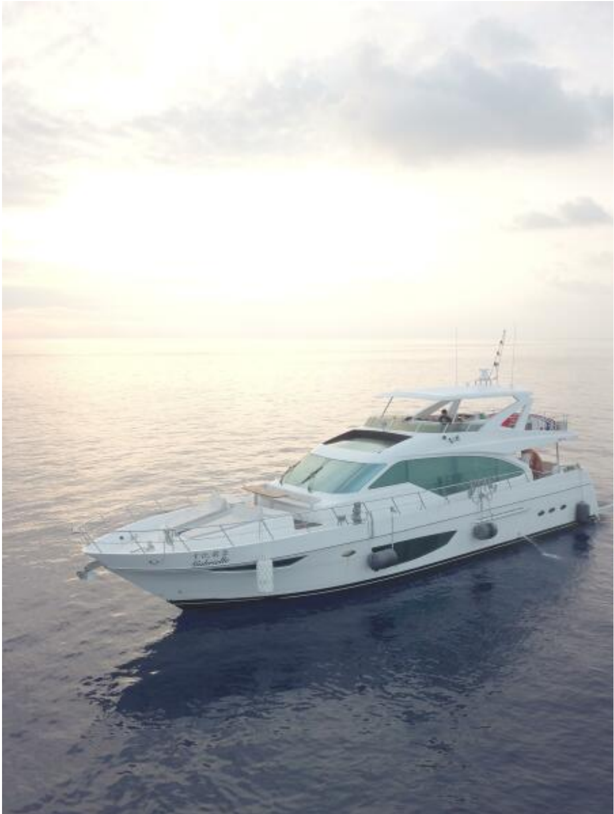
Sunroof Aft half opens for ventilation over Dinette