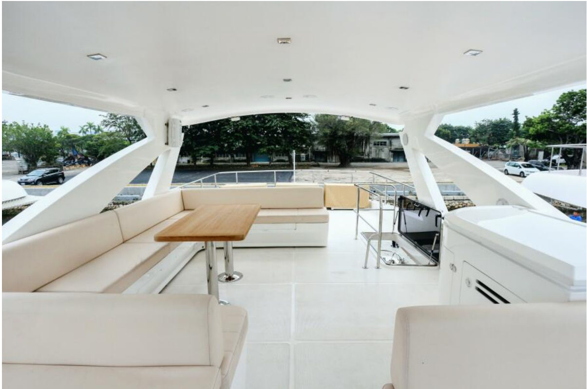
FB spacious Full use of the Upper Deck