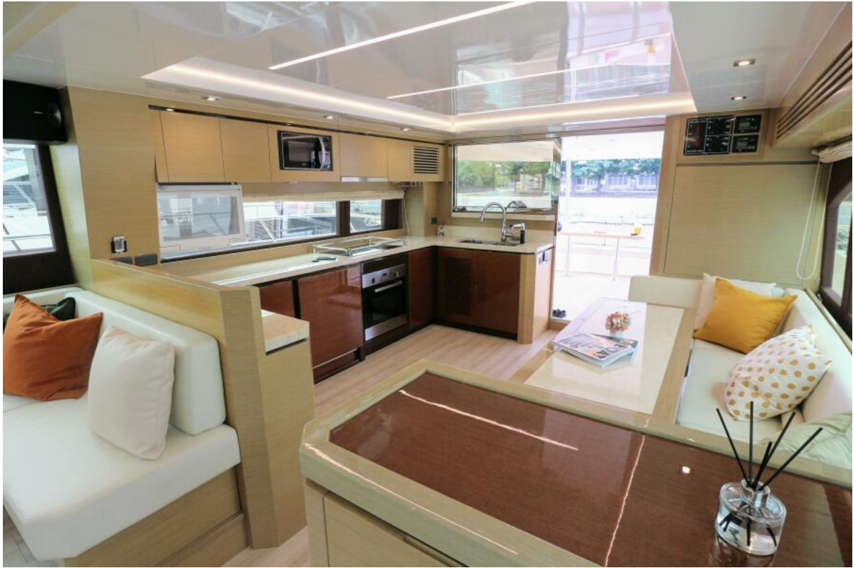
View aft Galley and aft deck entry, seating