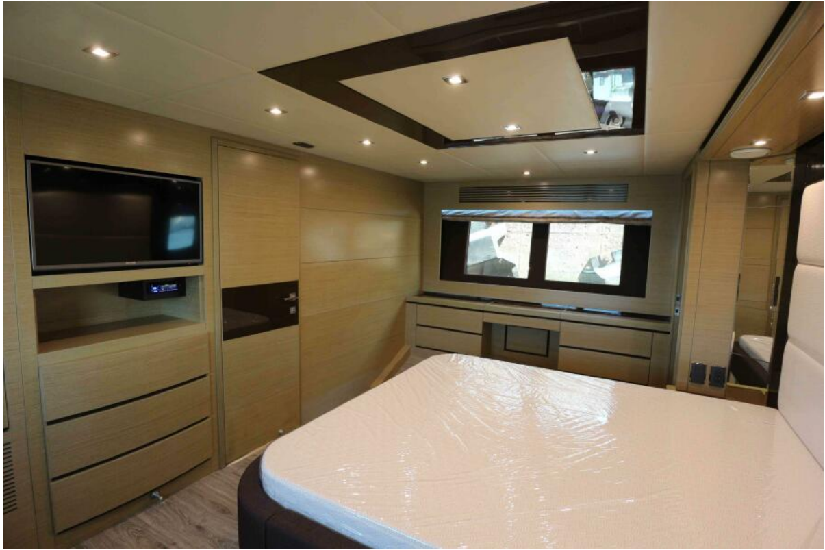
Owners view Fwd Large windows and spacious stateroom