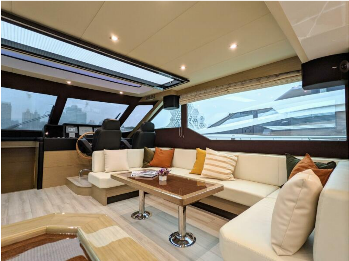
Upper salon Full views with overhead opening hatch