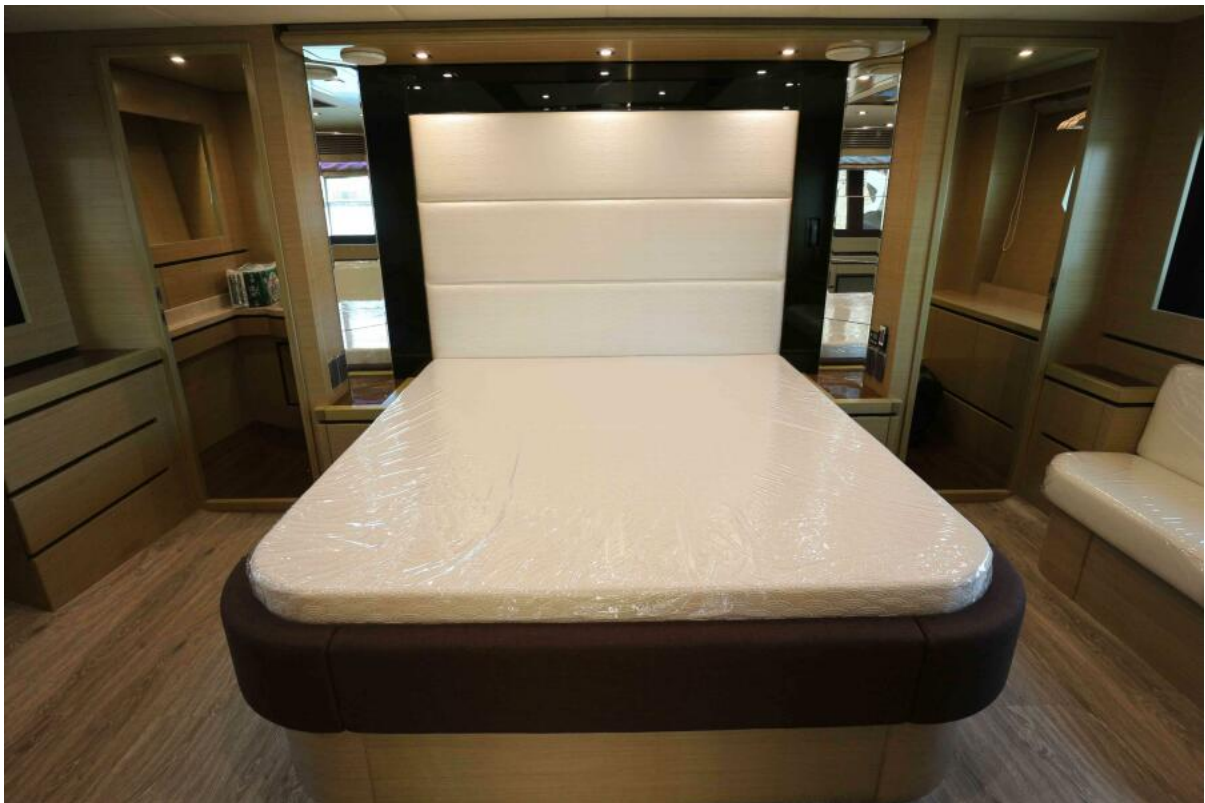
Owner Stateroom Midships Centerline