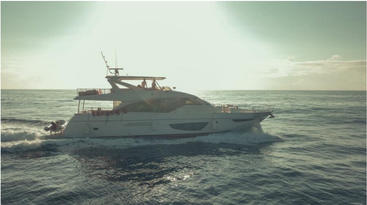
Cruising profile With hydraulic swim platform