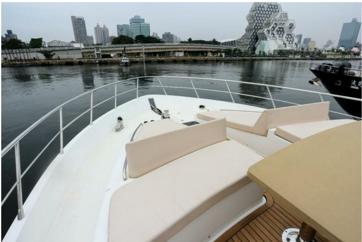
Foredeck seating Settee, Table, and Sun pads with seat backs