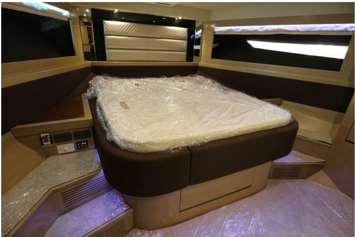
VIP Centerline with bright windows