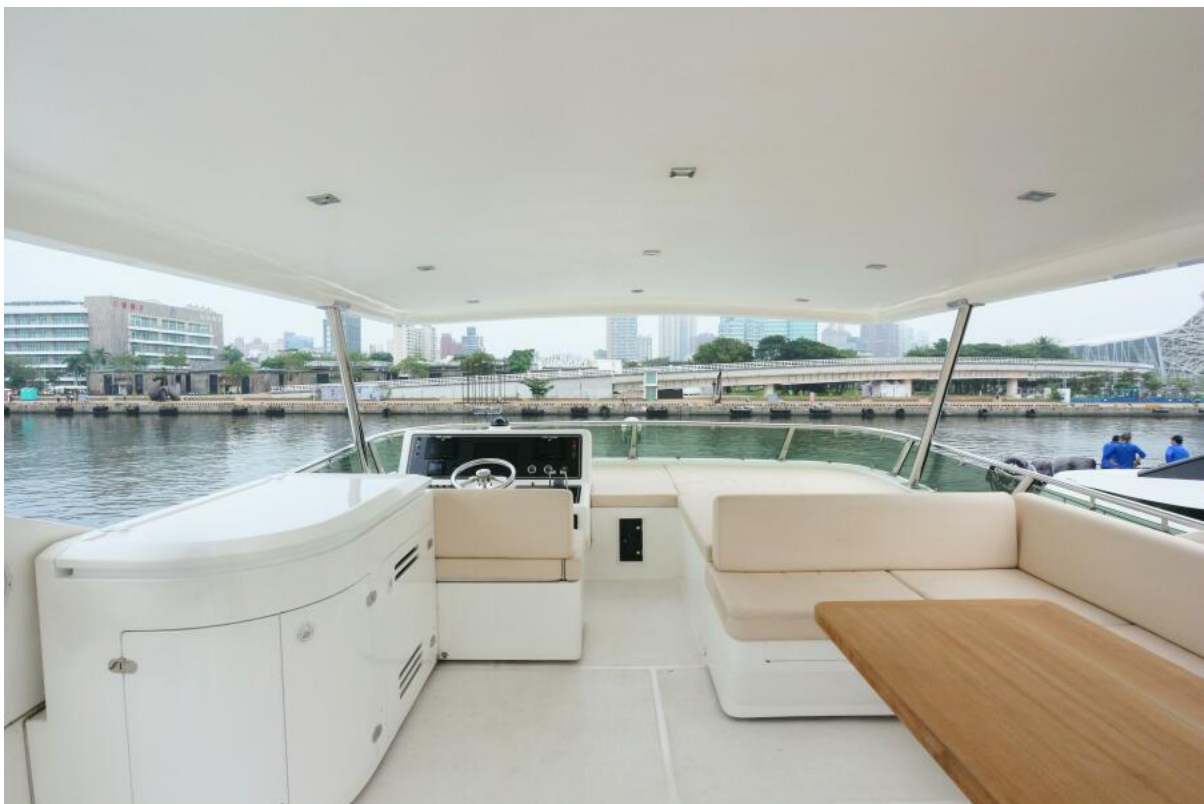
FB meal station Fridge, BBQ, Sink with seating