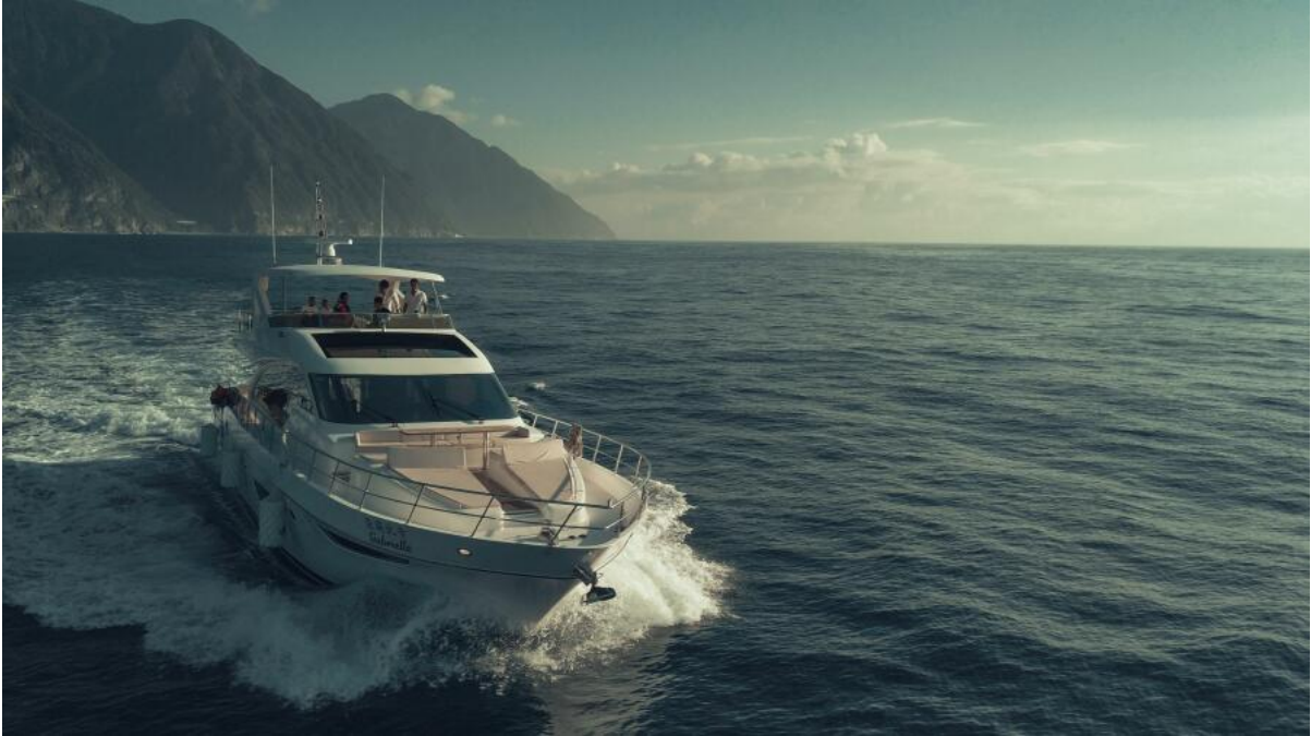
Underway Headed to load onto the yacht transport to new owner