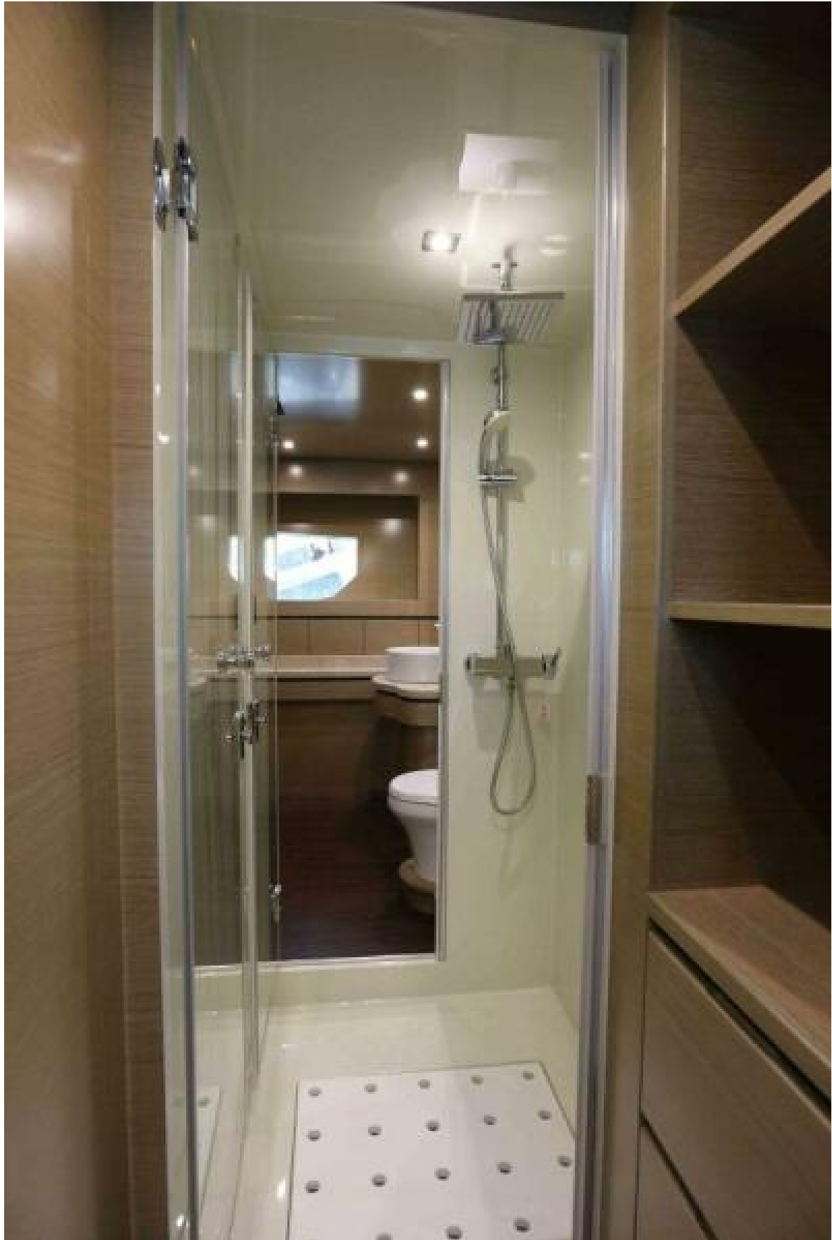
Ensuite head and shower