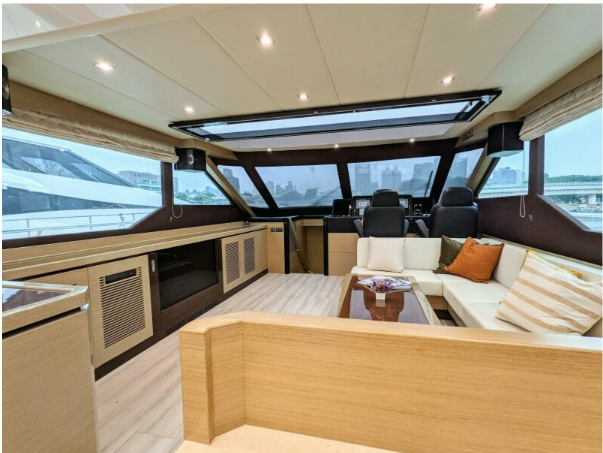
Upper Salon and Helm Bright and spacious