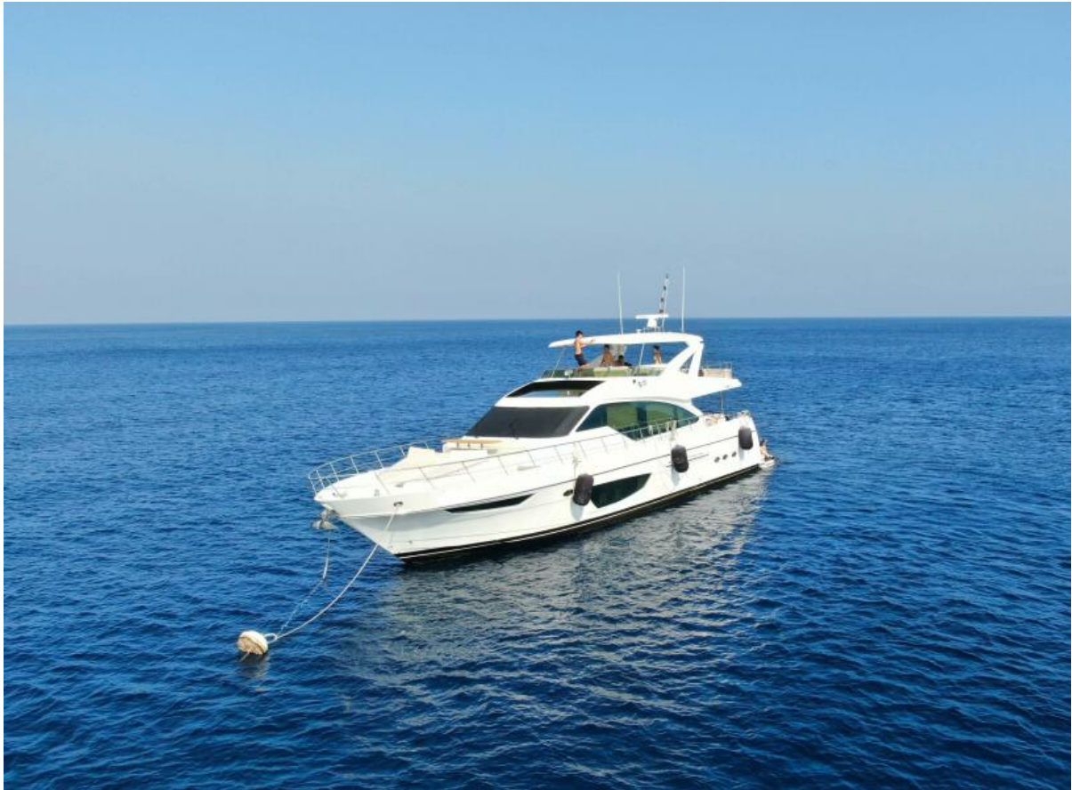
Hardtop Flybridge features Hardtop and lots of room