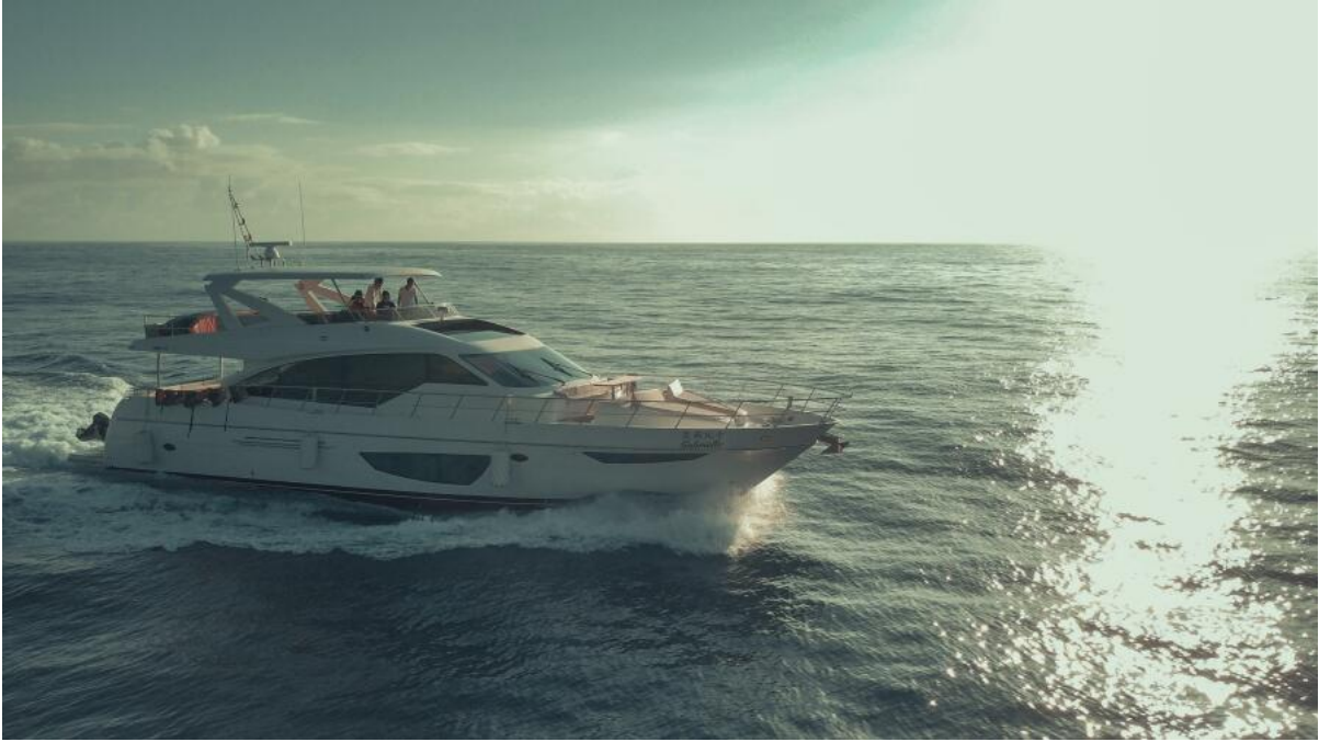
Cruising profile Just before shipping to new owner