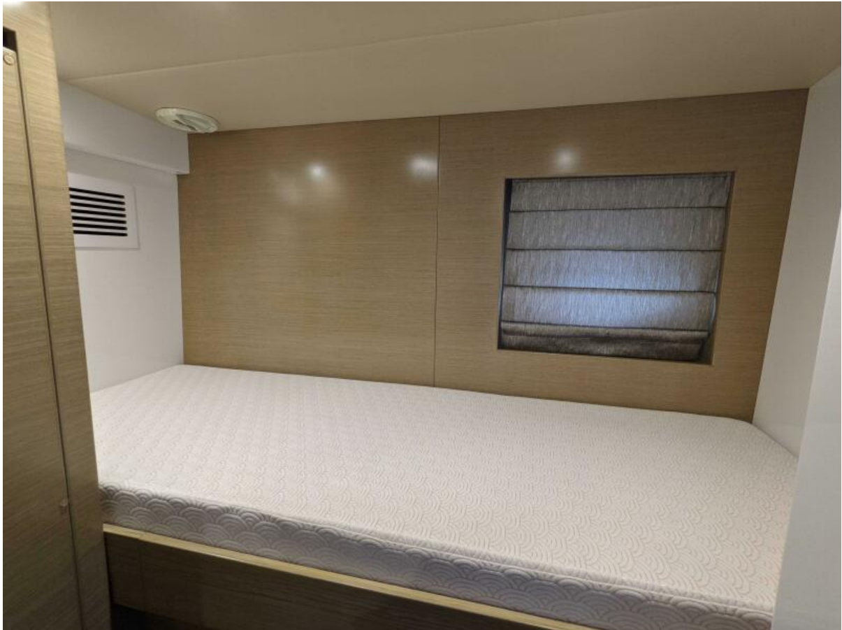
Twin berth outboard