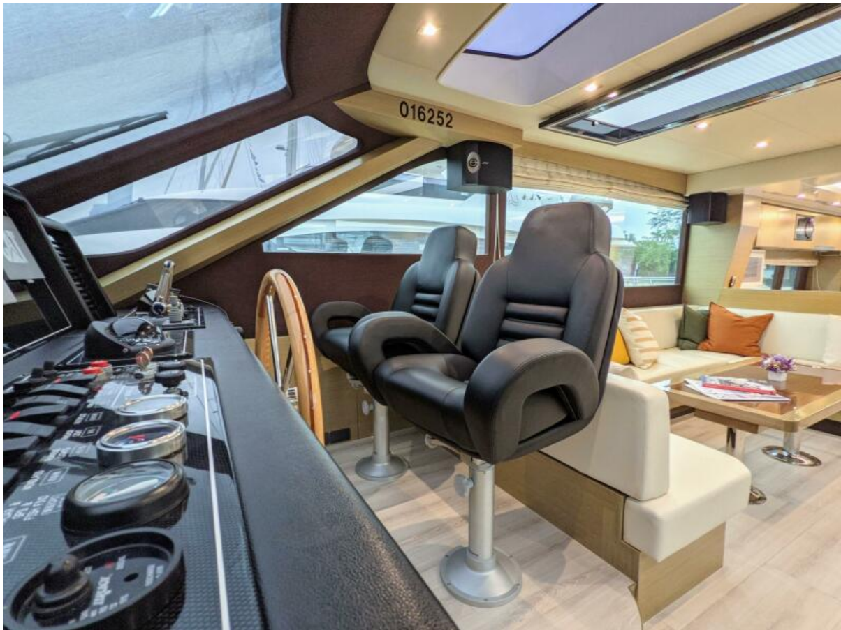
Dual helm chairs Take the helm without missing time with family