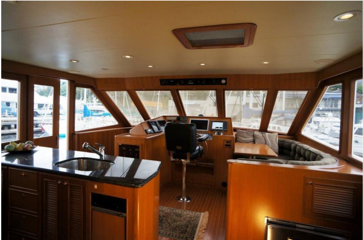
Galley and Helm views