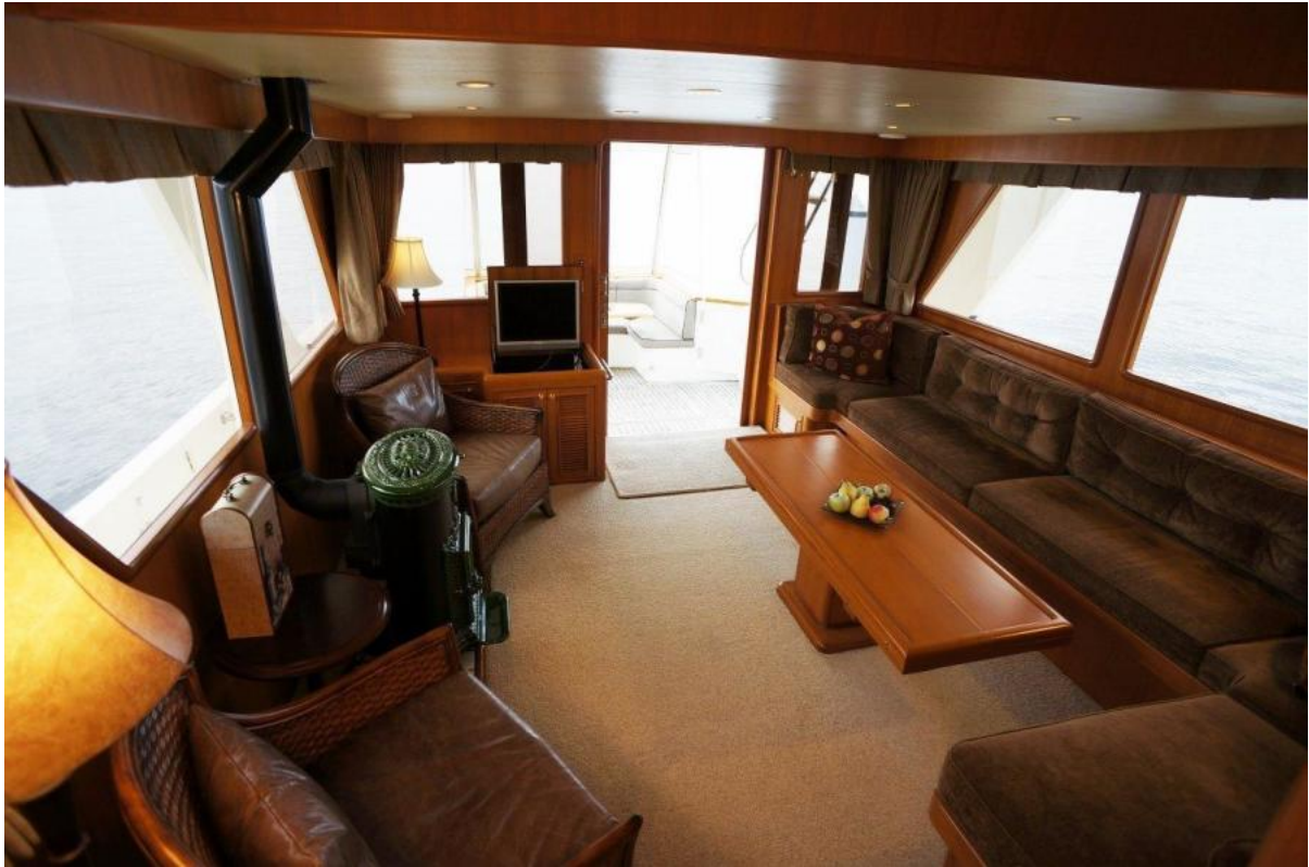
Salon View Aft