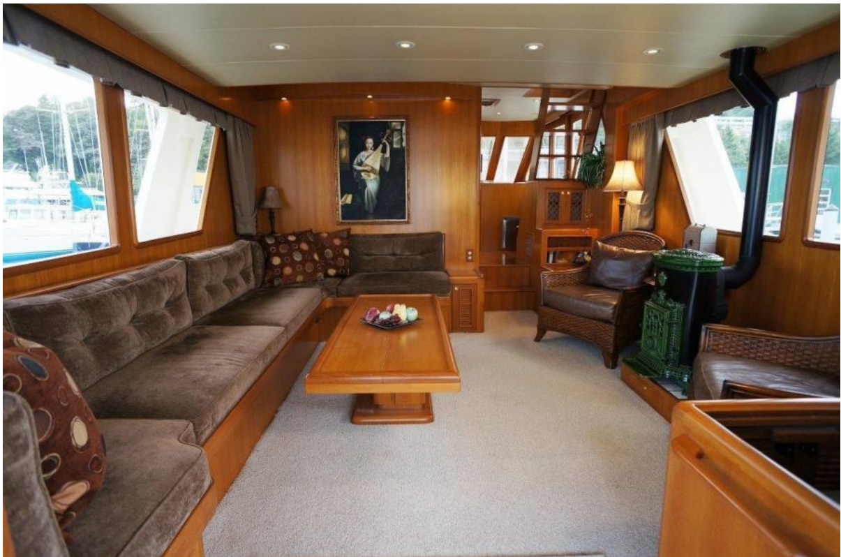
Main Salon Heater not standard, was requested by owner.