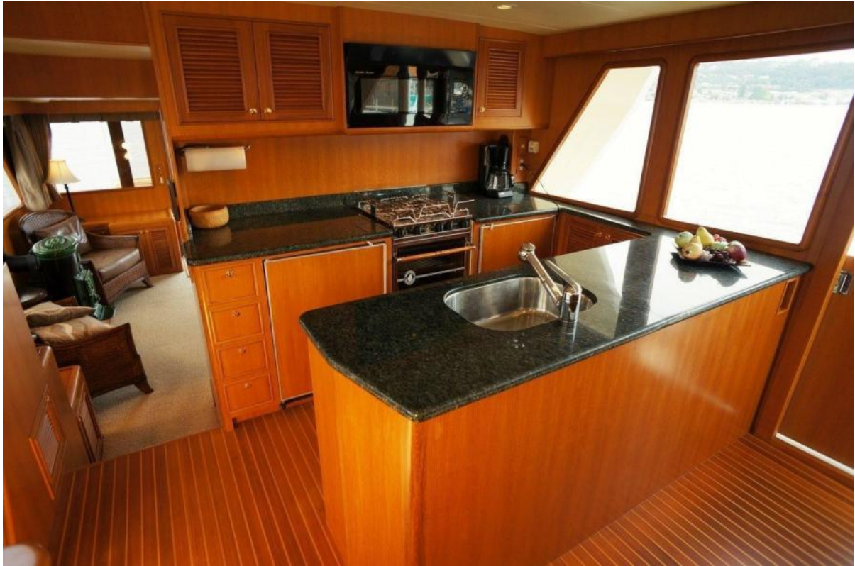
Galley This owner chose under-counter fridge drawers.