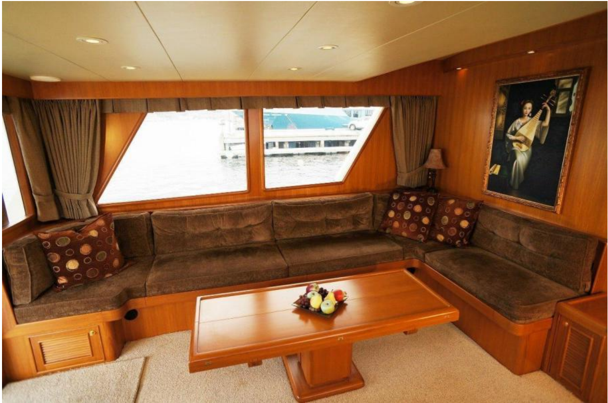
Port Side Main Salon Photos are for reference for new build.