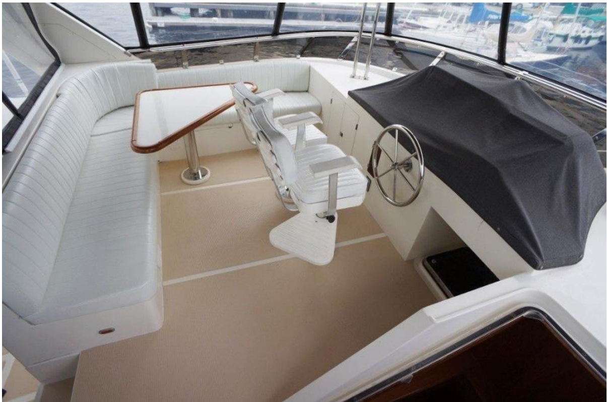
FB Helm and Seating