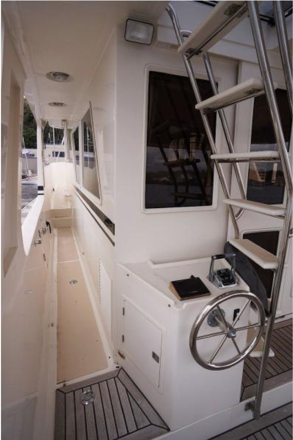
Port Docking Station