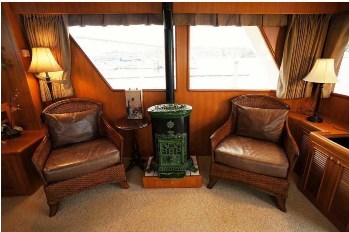
Stbd Salon seating Owner-supply heater. What would you do with this area?