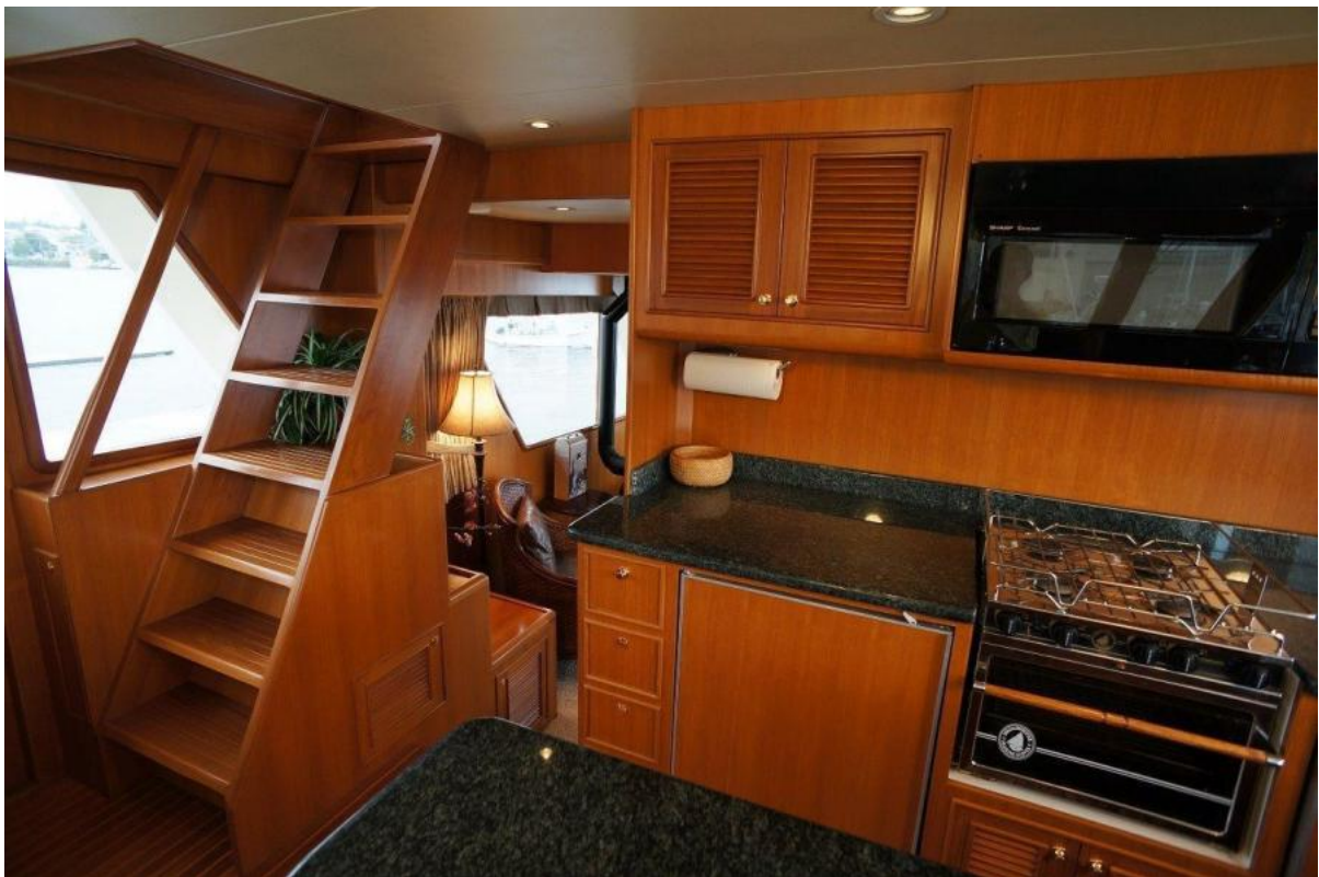
Pilothouse and Galley