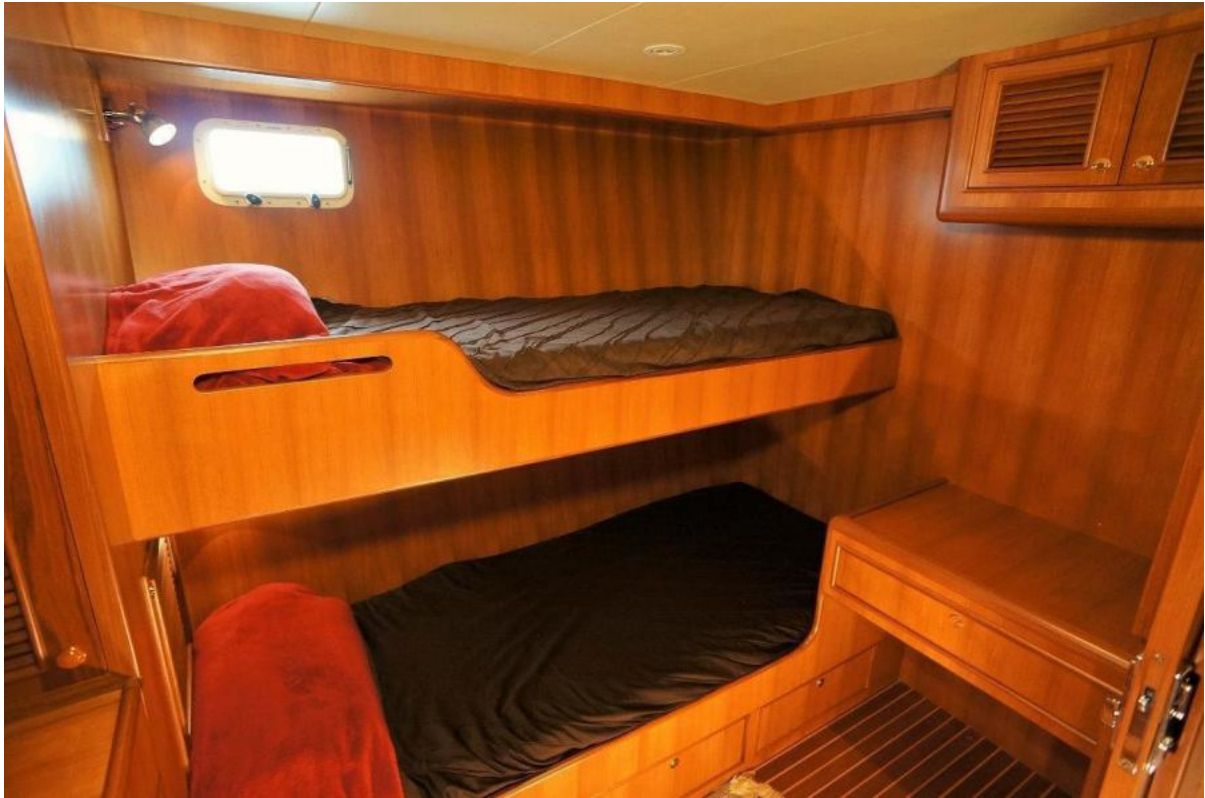
Desk and storage