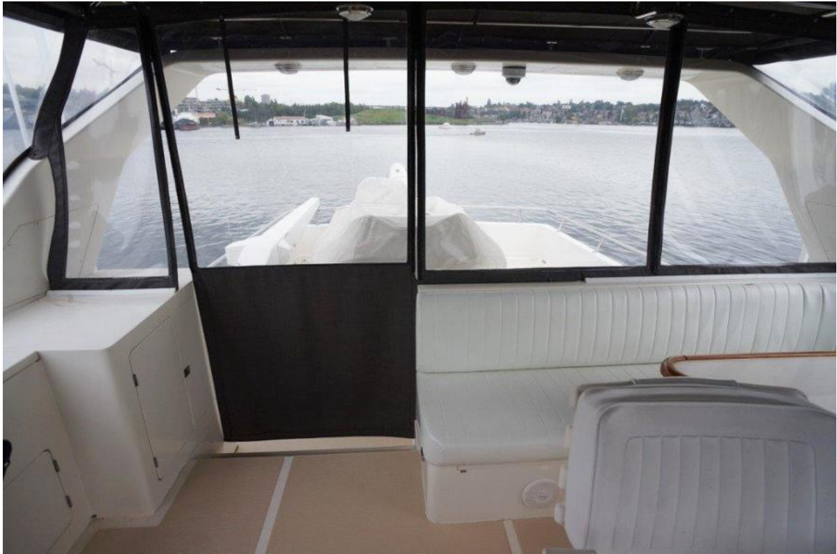
Bimini or Full Enclosure