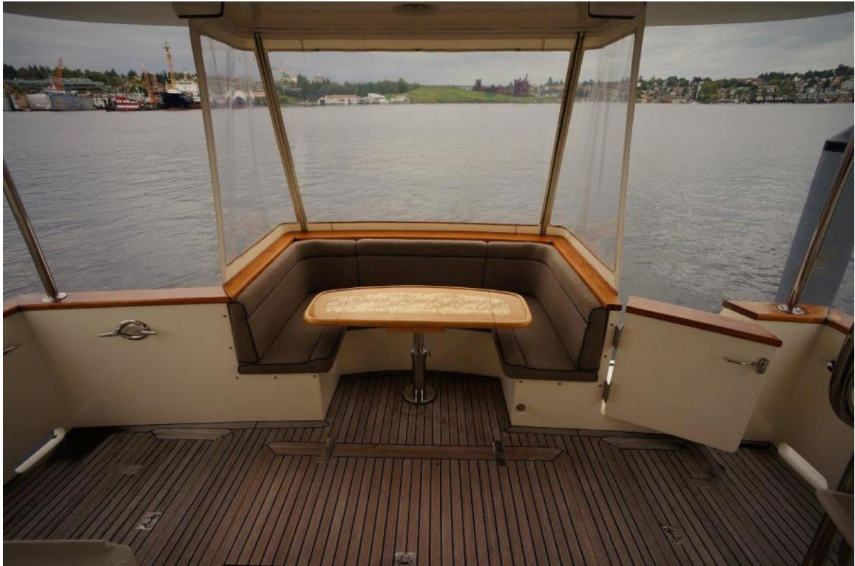
Aft deck settee