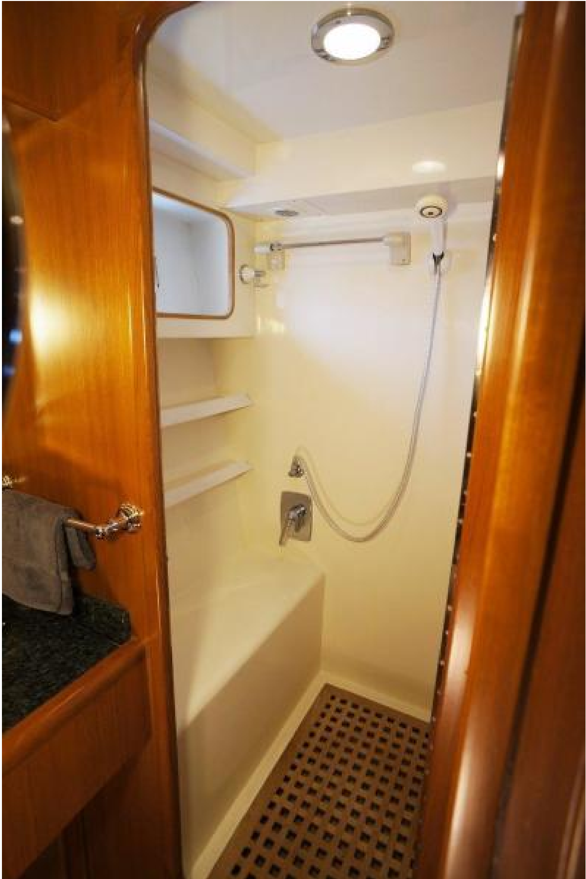
Ensuite shower and head