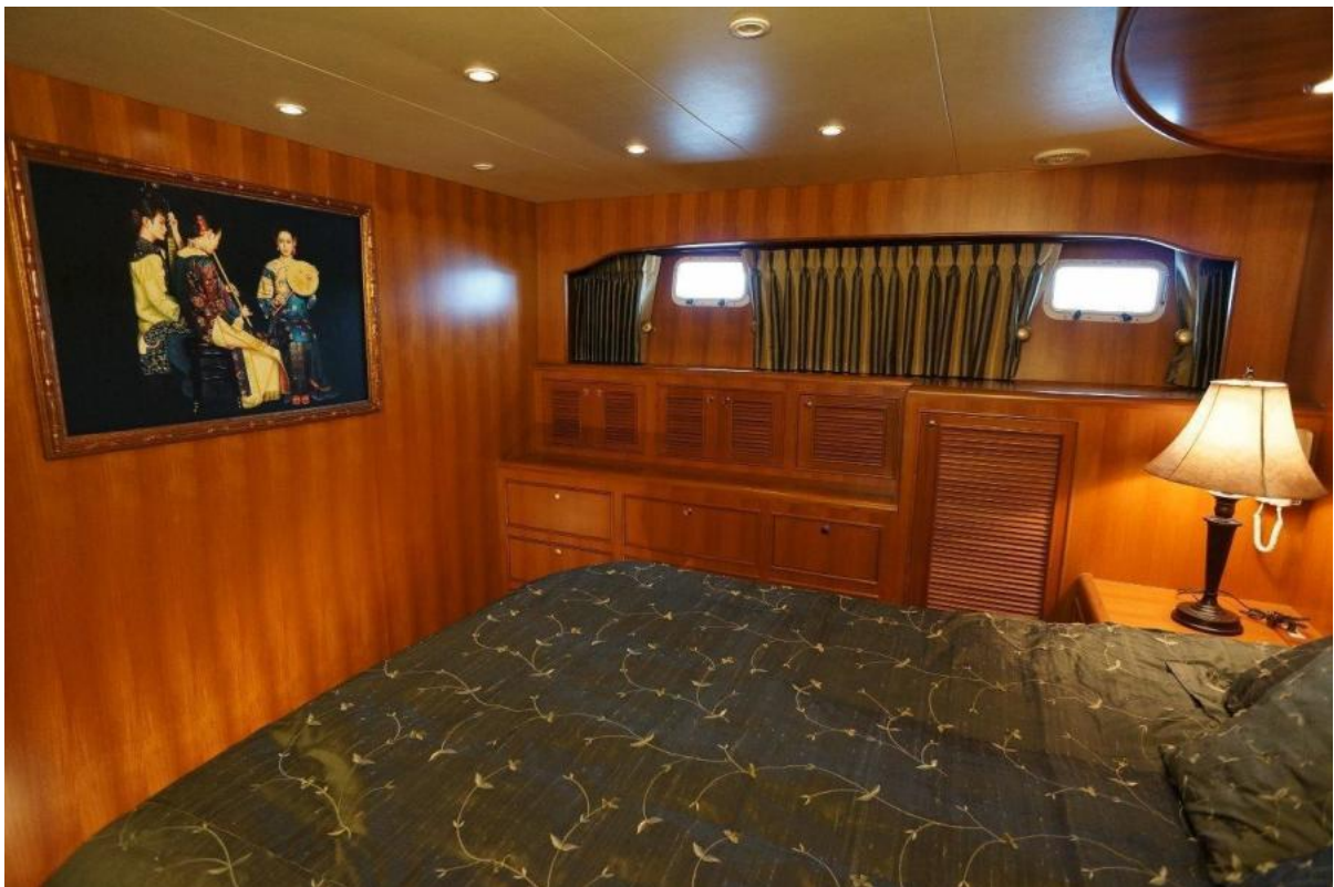
Owner's Stateroom TV and stbd storage