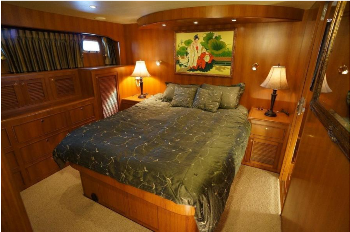
Owner's Stateroom Midships