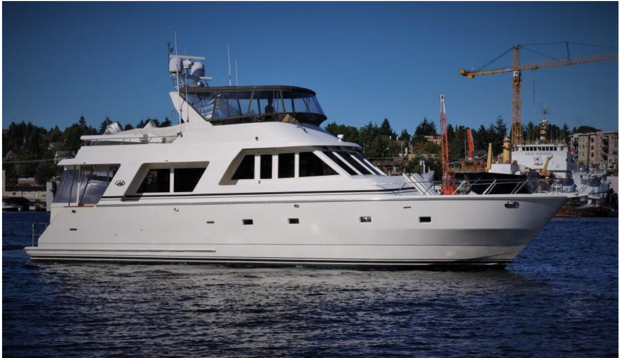
Profile with canvas Optional canvas enclosure