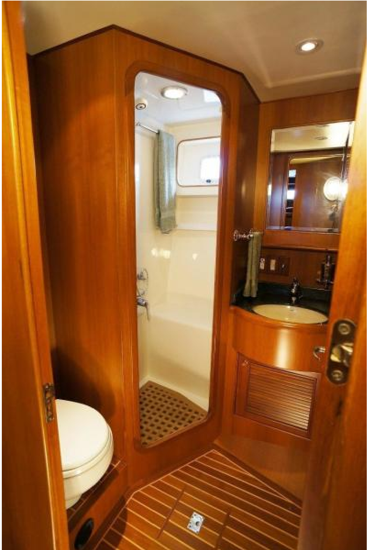
Head and Shower