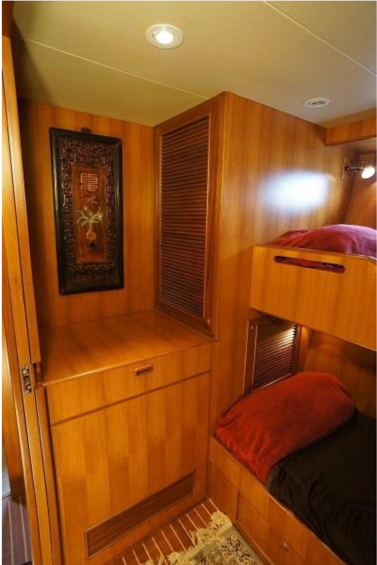
Twin Cabin Drawer Storage