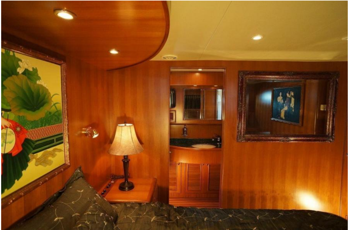
Port Side Owners