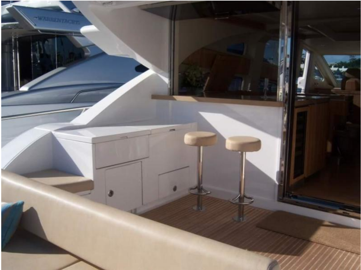
Aft Deck Bar Seating Storage - Seating- Window Bar - Sunpad