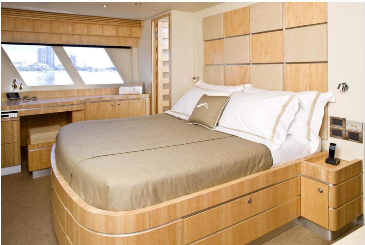
Full beam Master Starboard view