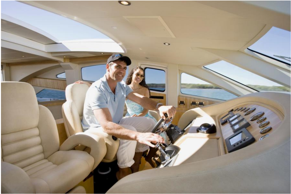
Helm Seating options and great visibility