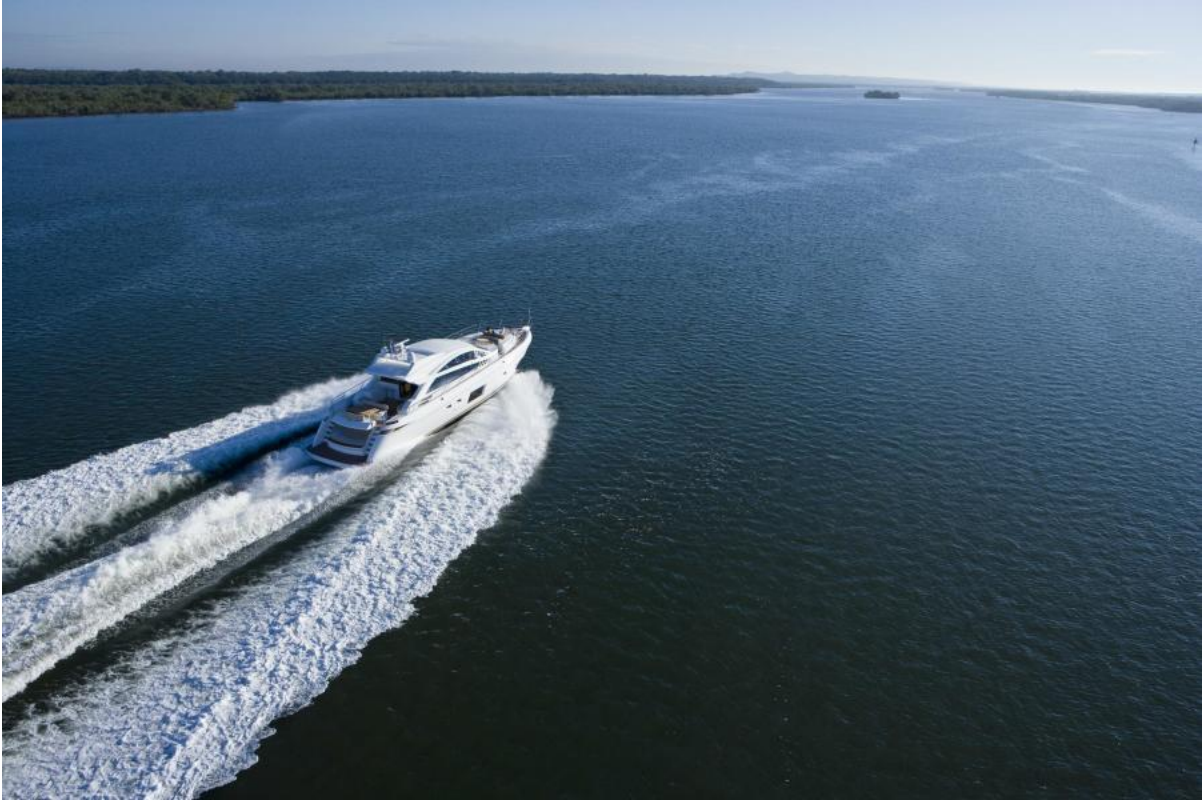
Sunset at speed