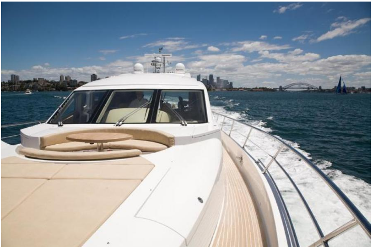
Foredeck details Sunpad - Sidekicks- Helm