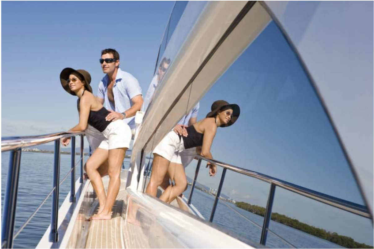
Side Deck details Frameless windows