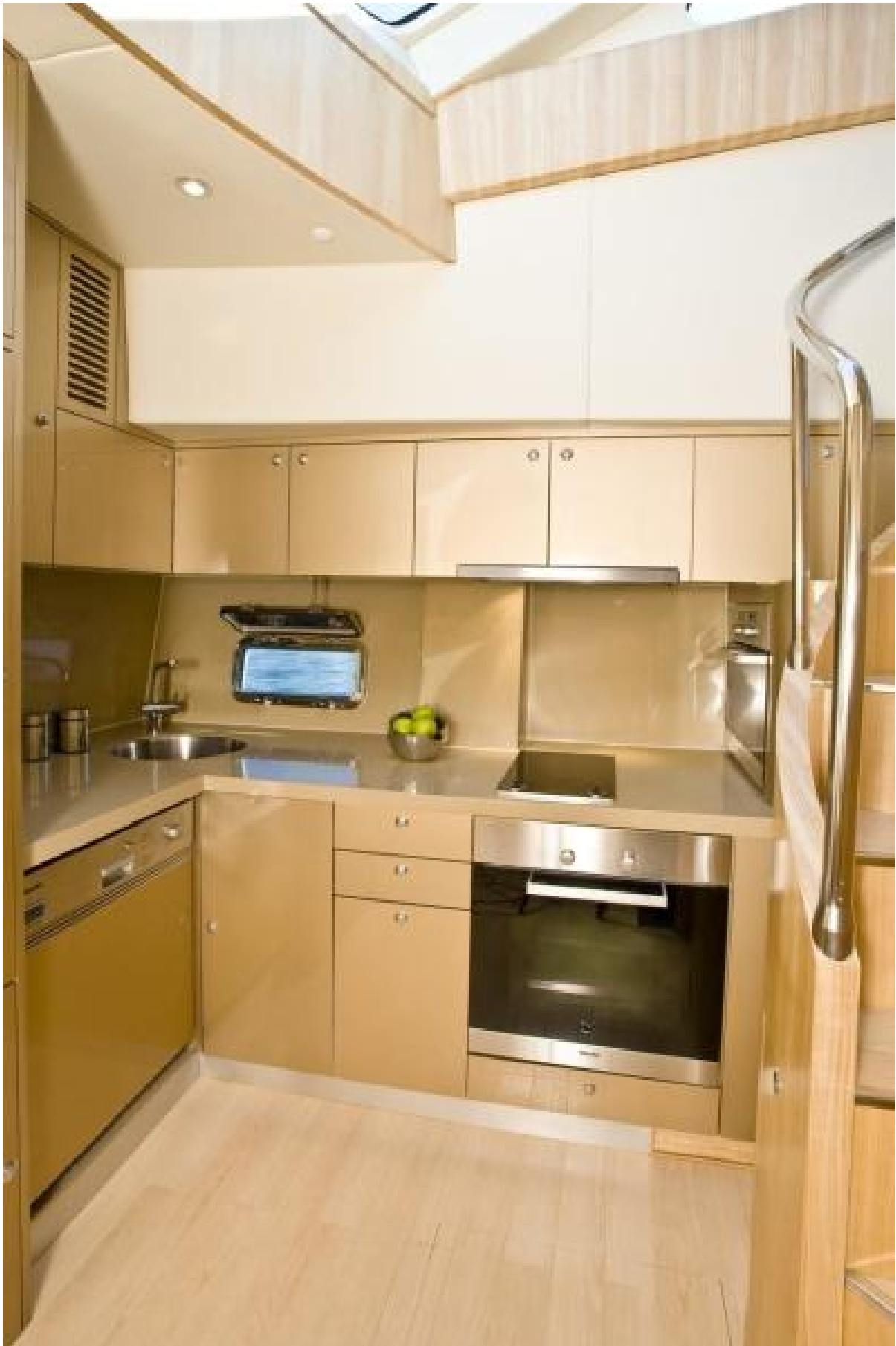
Lower galley Additional galley or laundry space