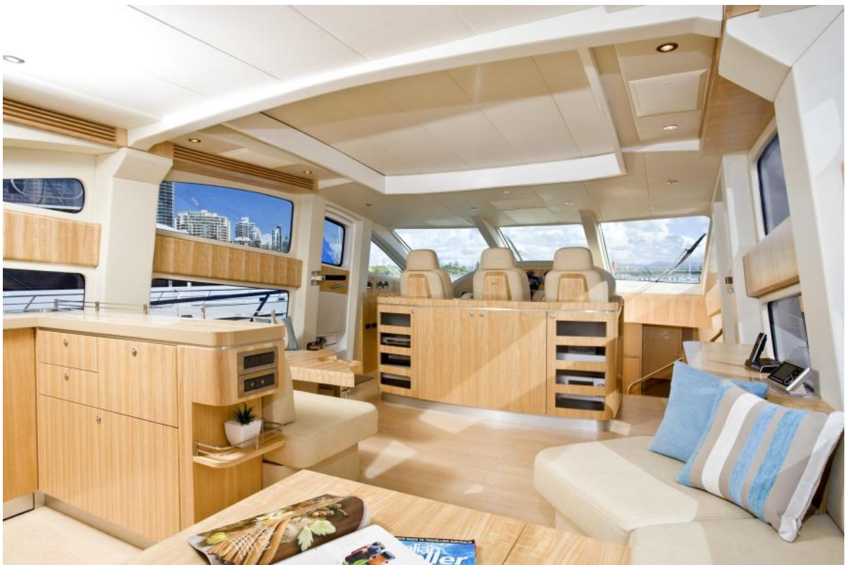
Interior Salon Salon to Bridge View- Sunroof Closed