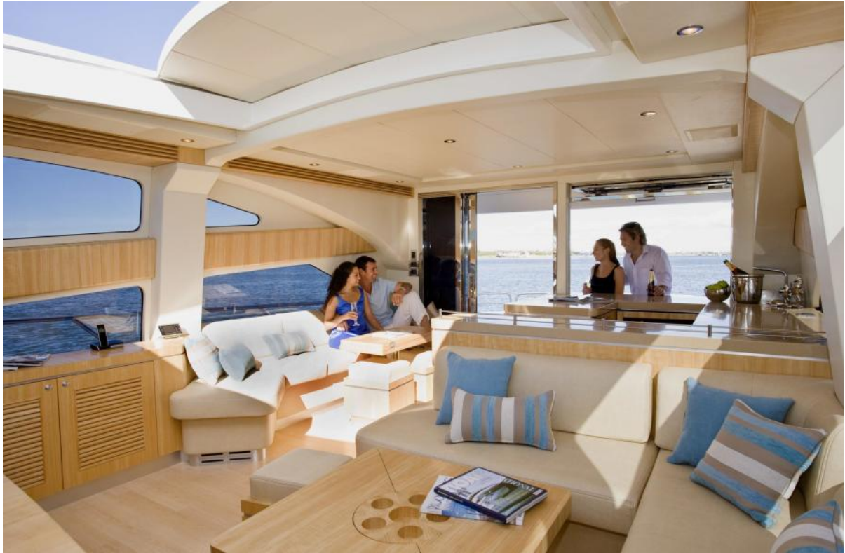
Salon to Aft Deck Bright open design on main deck