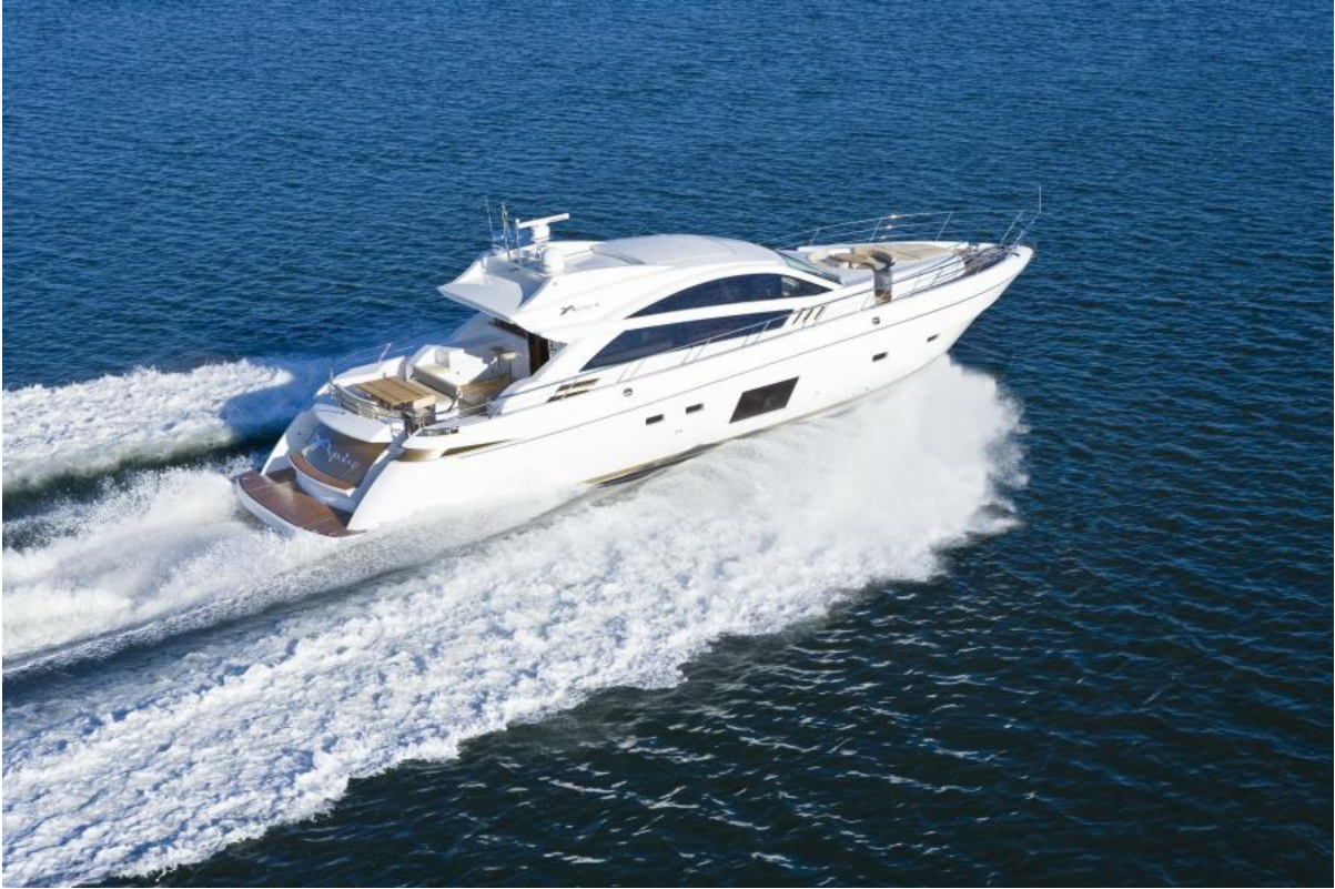
Aquabay 70 express Also Available in Flybridge version