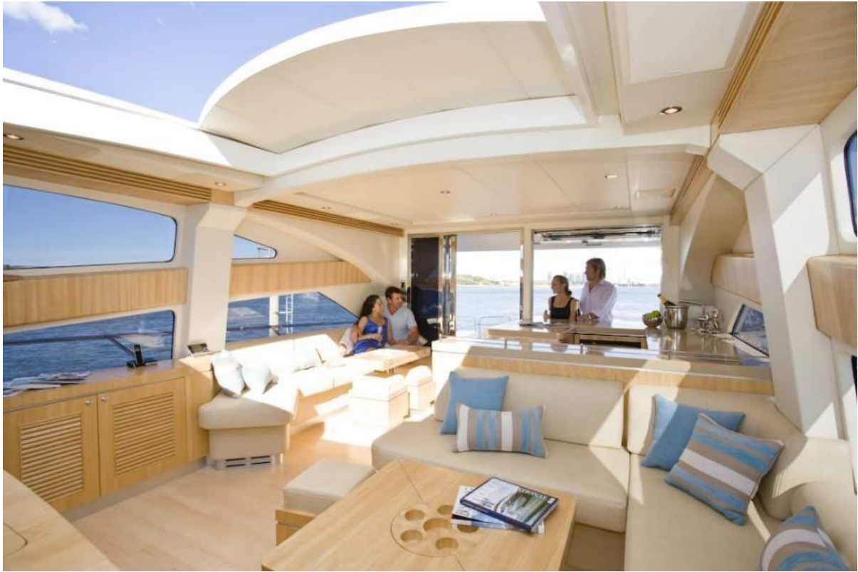
Overhead sun hatch Bright and open design- Sunroof Open