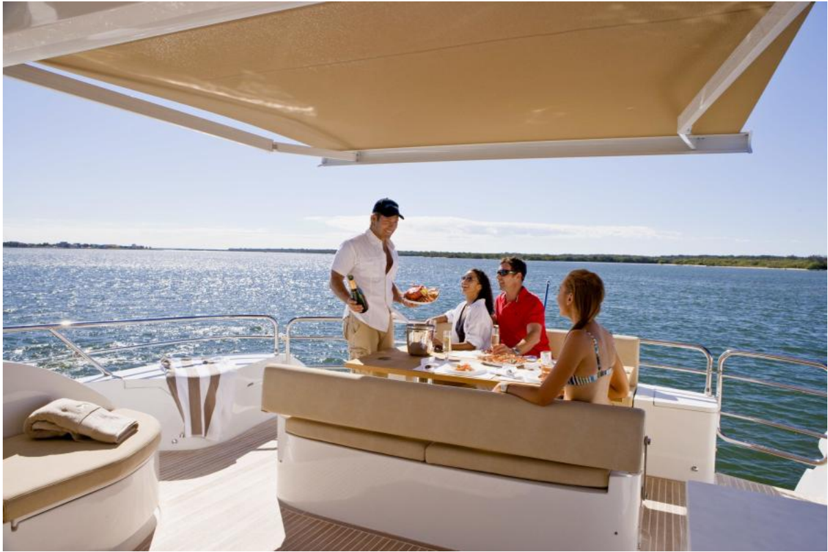
Awning Convertible settee and awning over aft deck