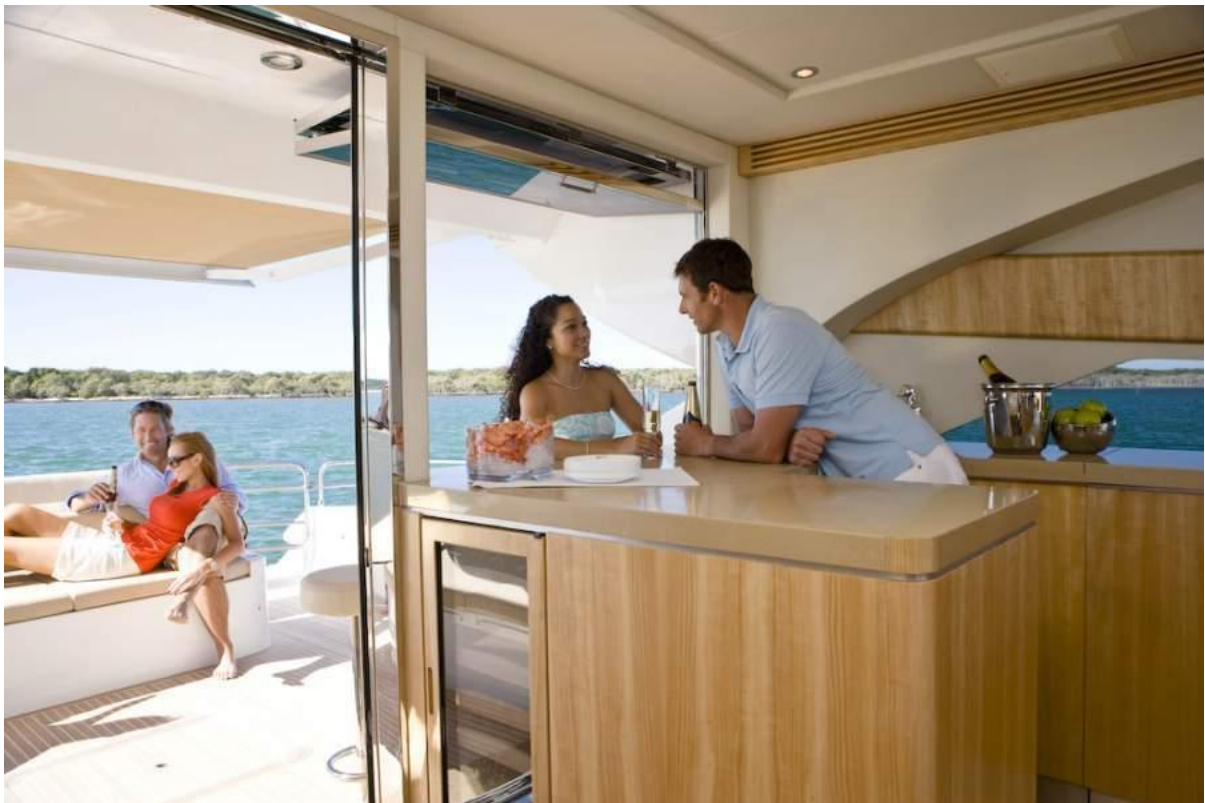
Open to Aft Deck Welcoming entry and window