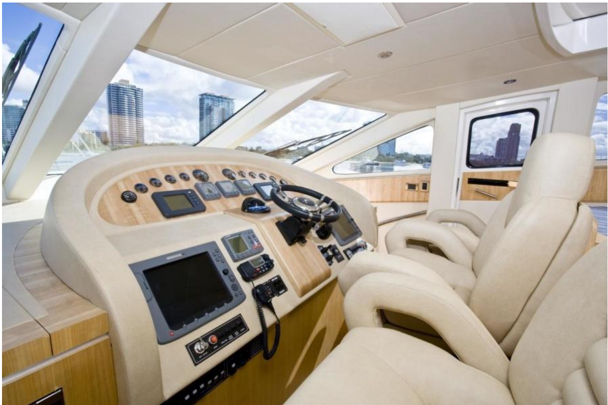
Helm Details Custom helm