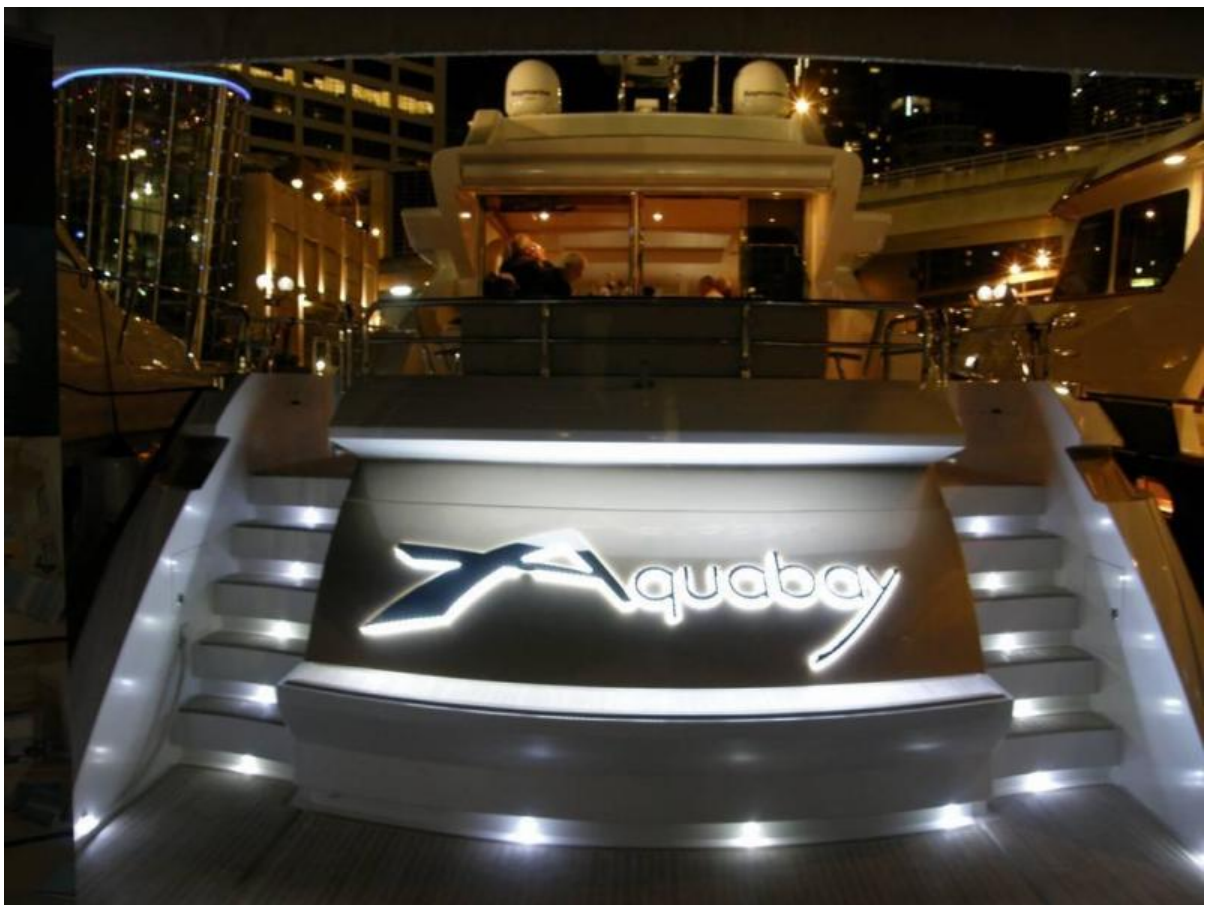
Night shot Aft Deck and stair lighting