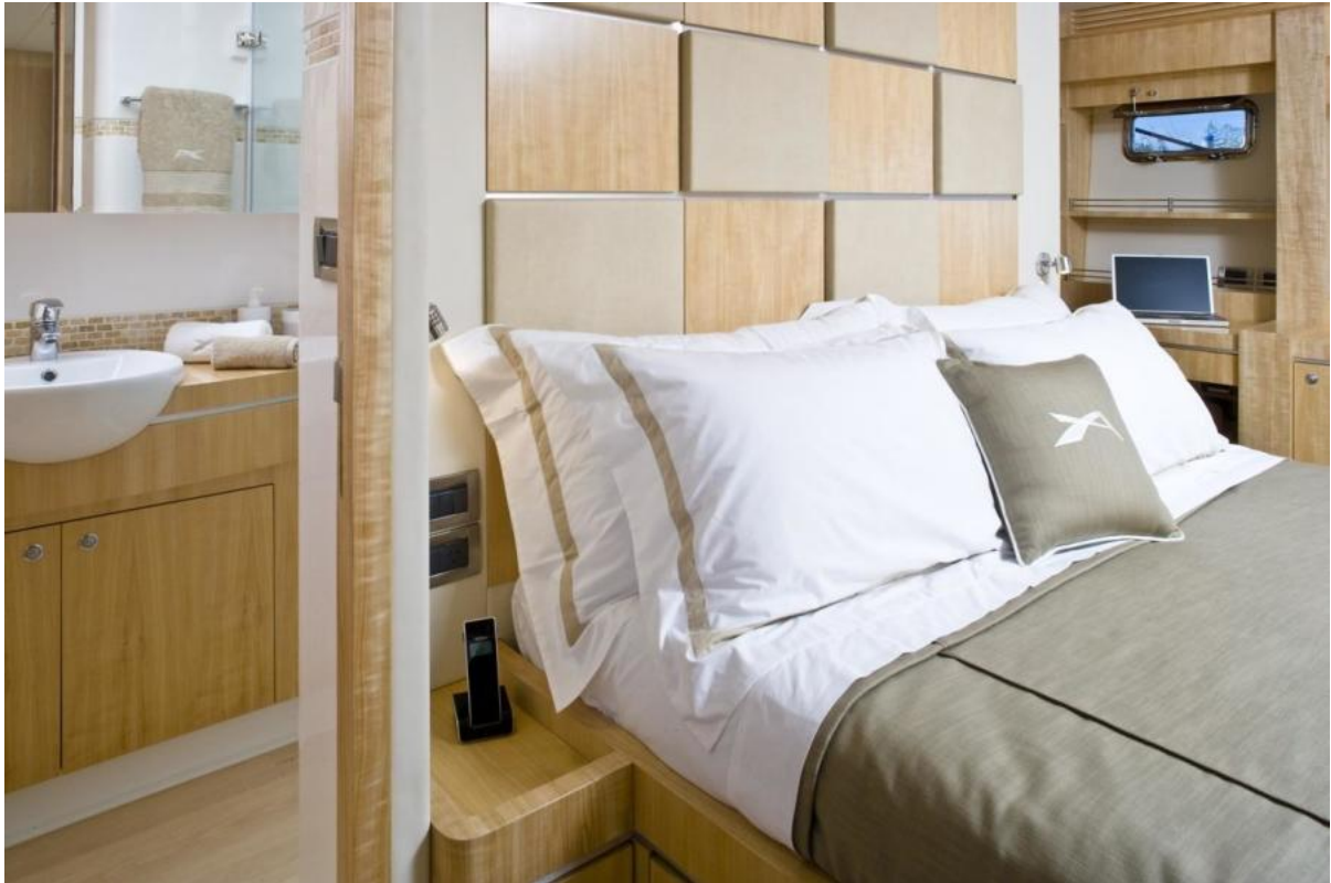
Master and Ensuite Full beam Master and head