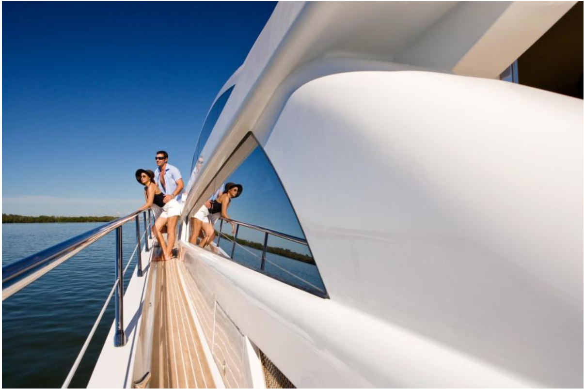
Side deck A