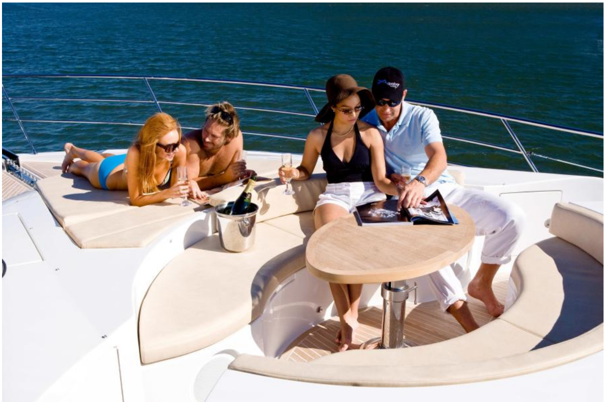
Foredeck Settee Excellent use of space