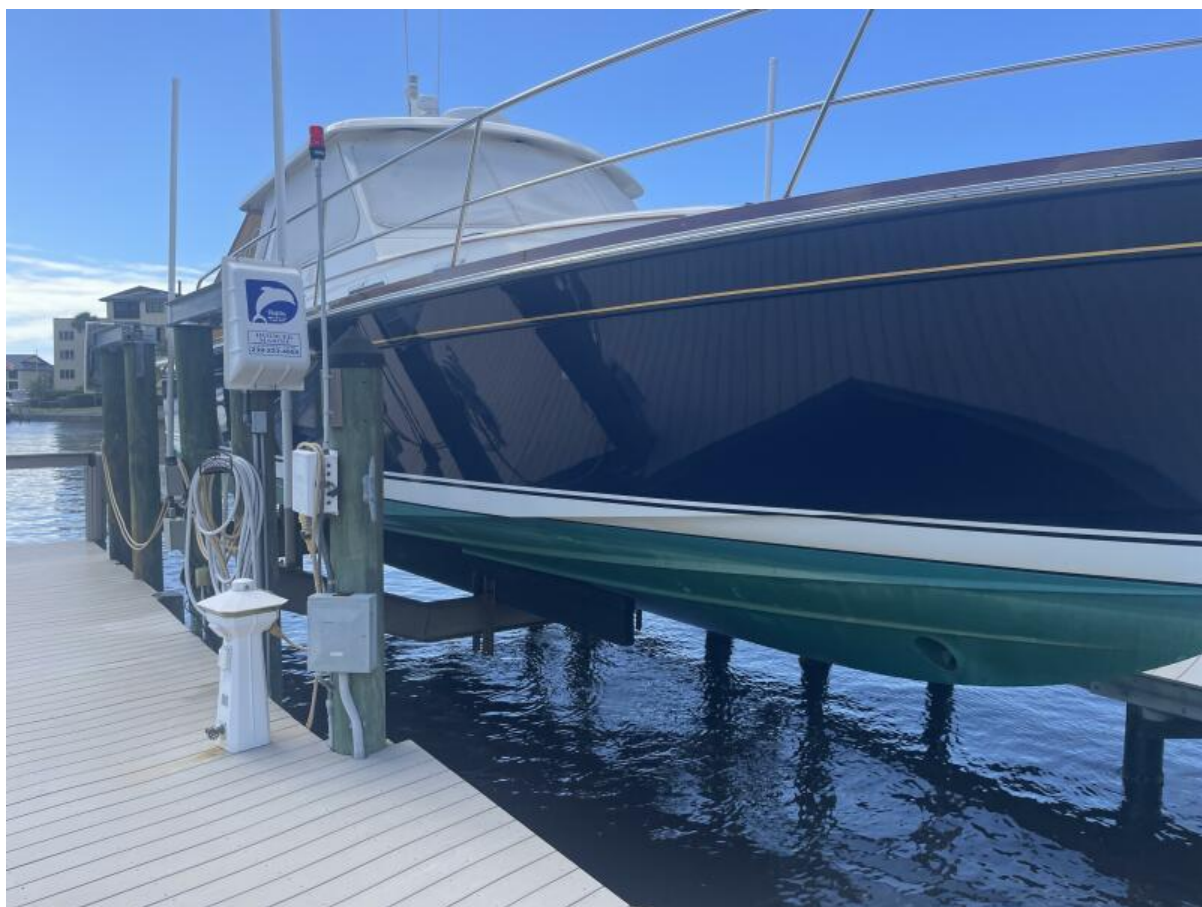
2006 - 38' Sabre Express Bow Thruster