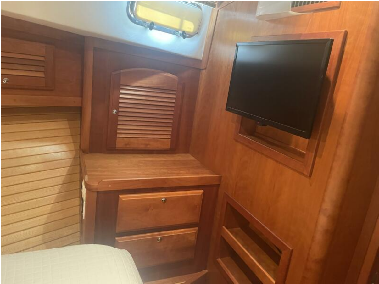
2006 - 38' Sabre Express Storage & Drawers