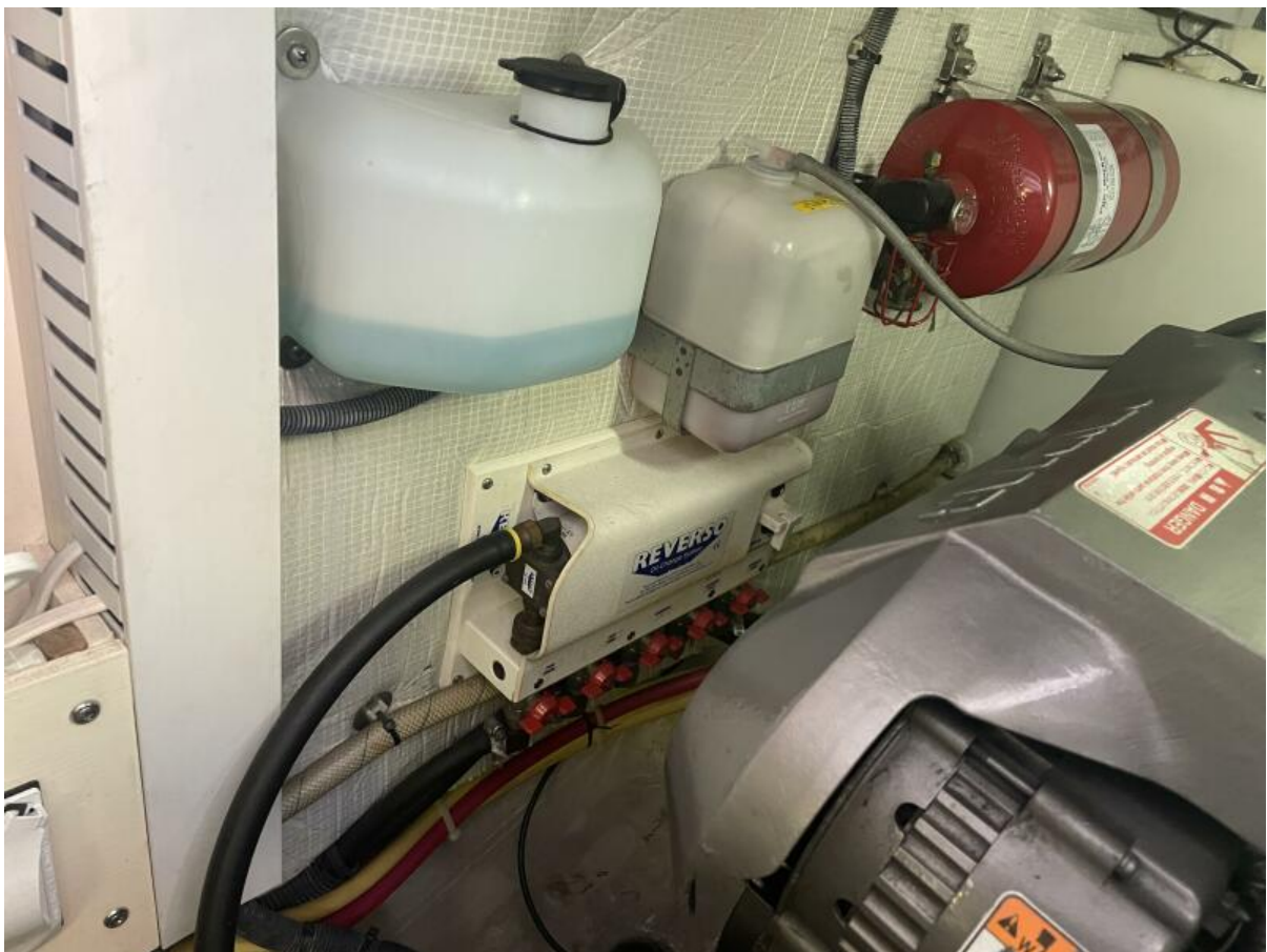
2006 - 38' Sabre Express Reverso Oil Change System