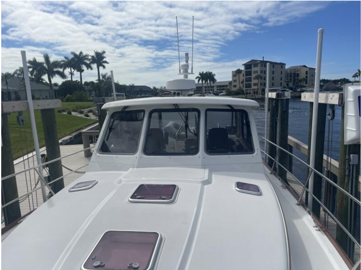
2006 - 38' Sabre Express