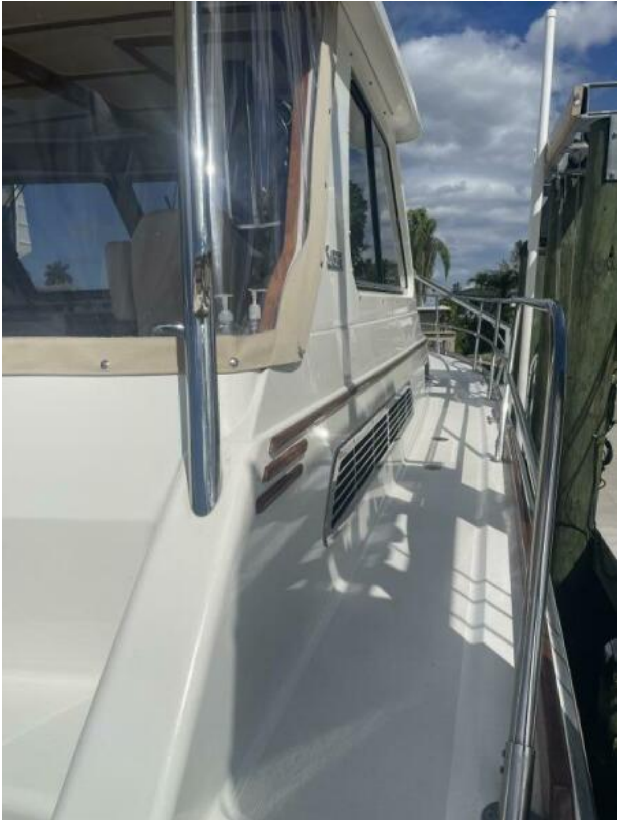
2006 - 38' Sabre Express Note All Hand Rails Are True & Straight