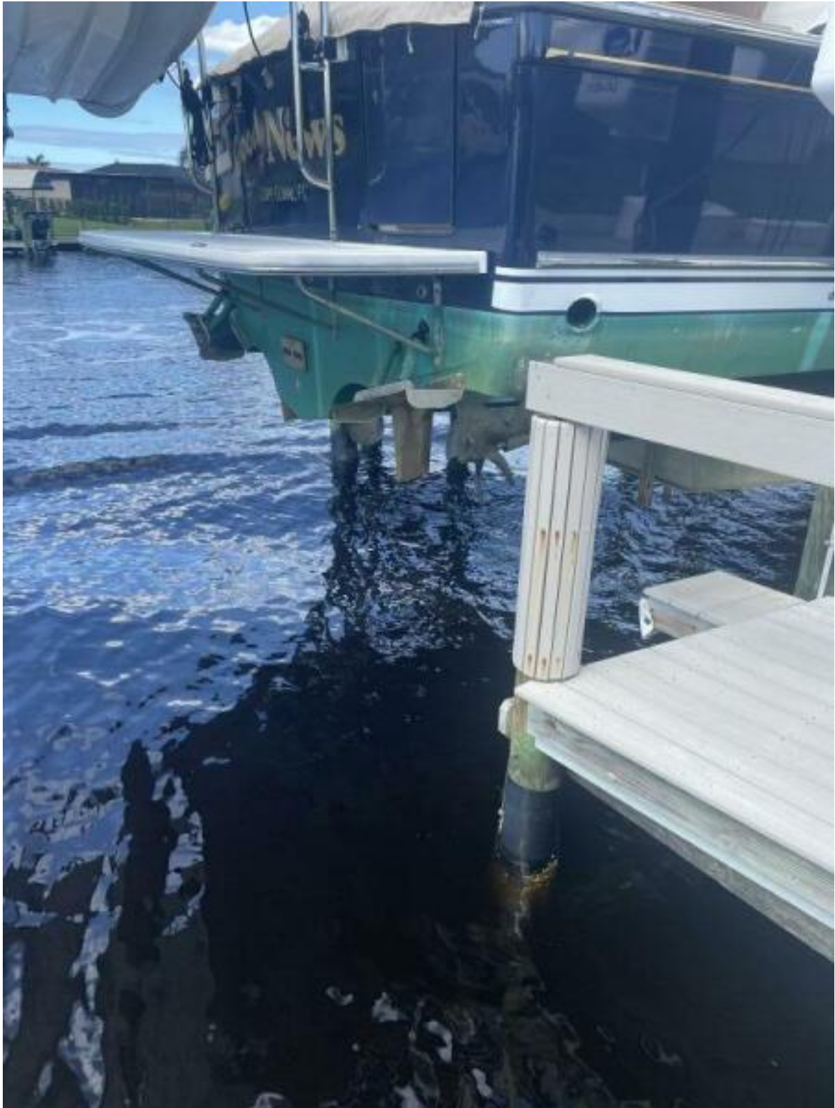
2006 - 38' Sabre Express Running Gear