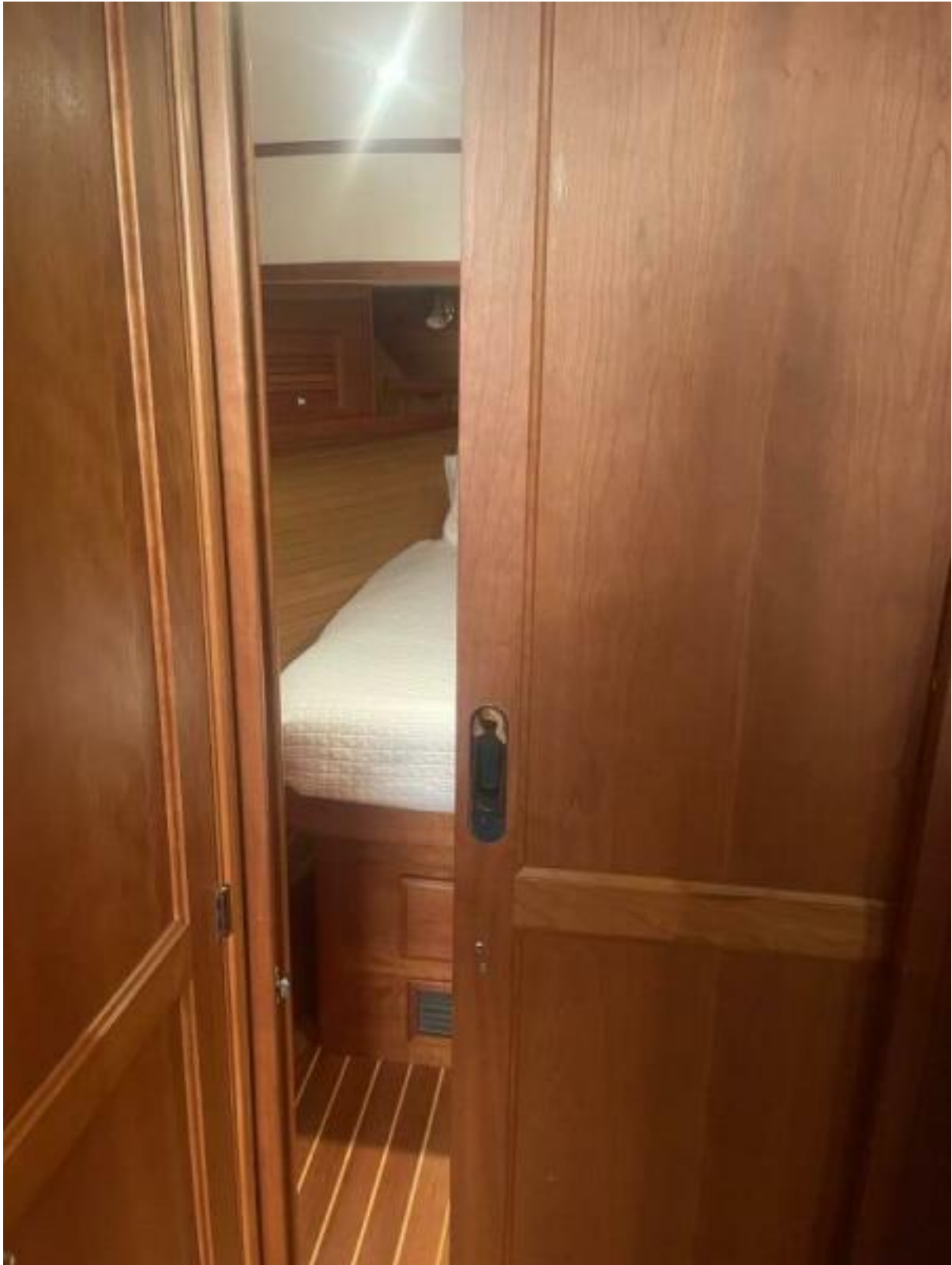
2006 - 38' Sabre Express Wood Door for Privacy