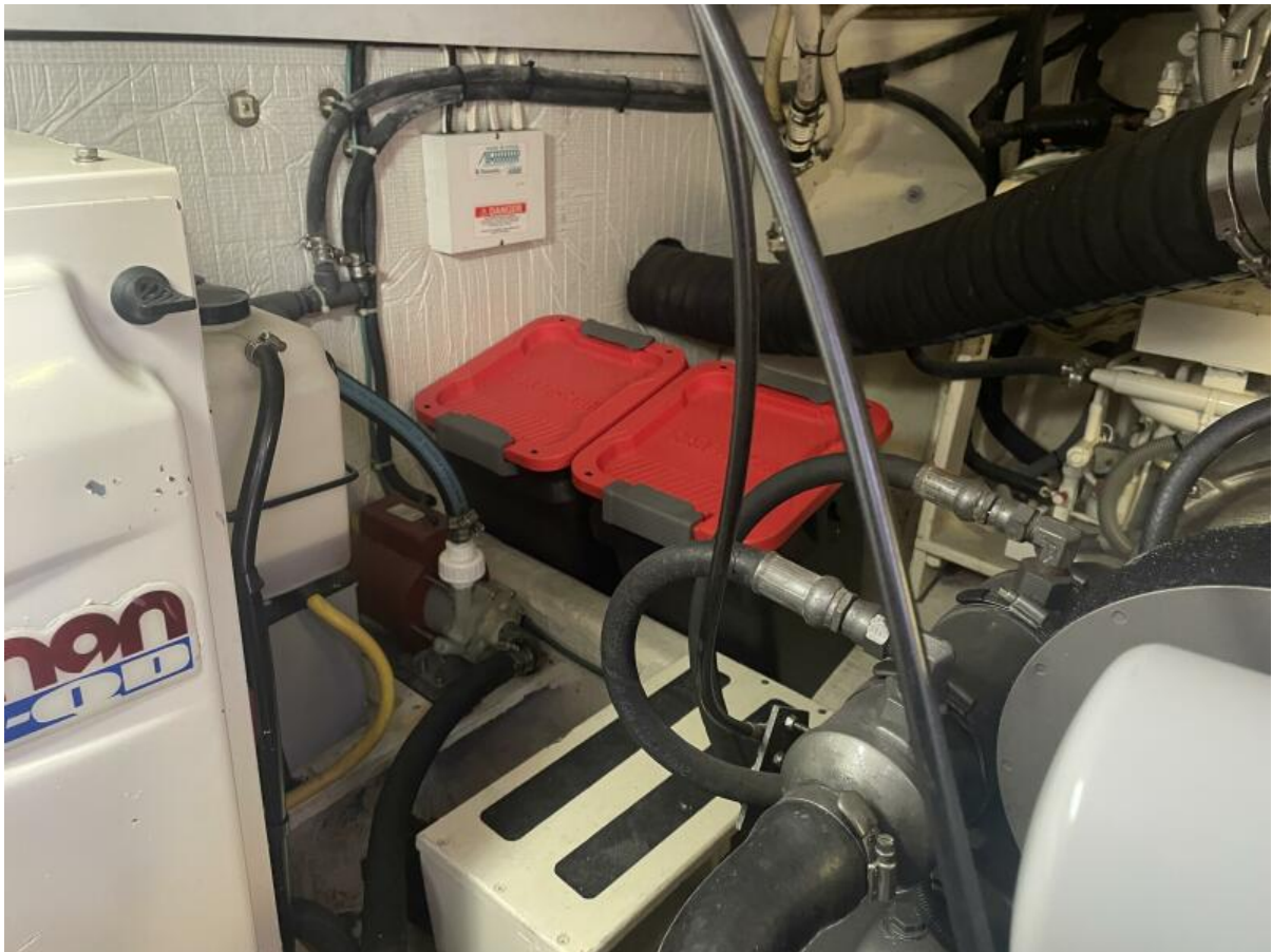
2006 - 38' Sabre Express Storage Boxes