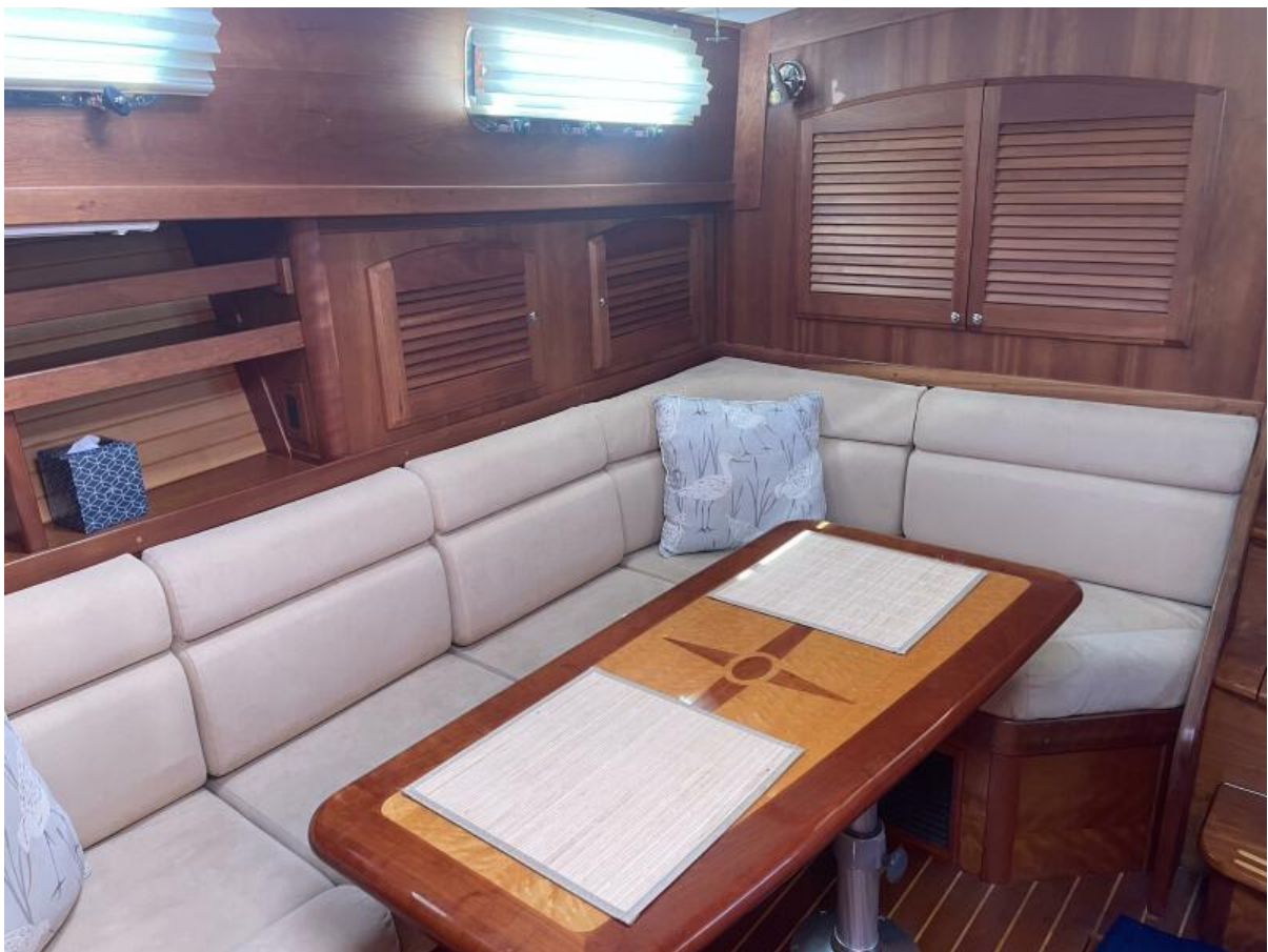
2006 - 38' Sabre Express Settee & Table Convert for Sleeping