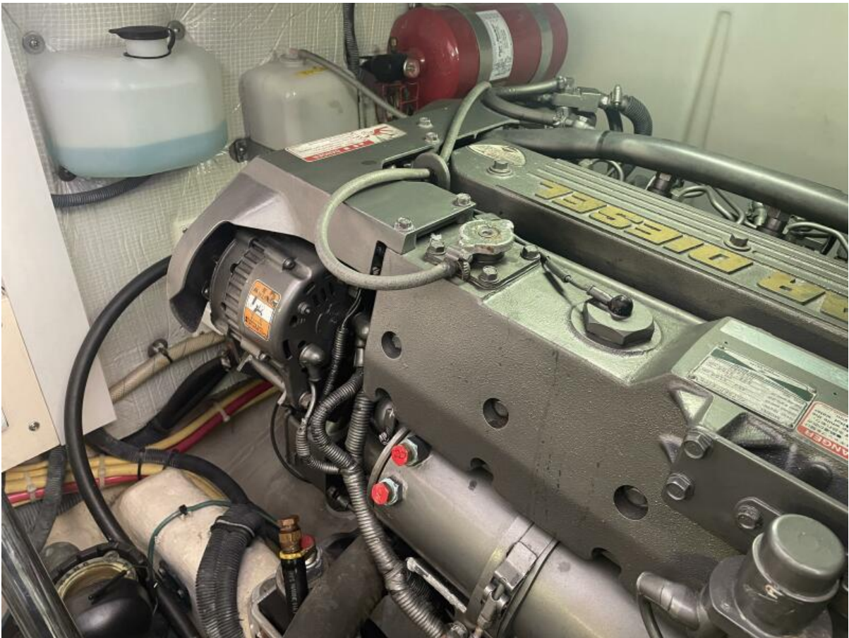
2006 - 38' Sabre Express Easy Access For Maintenance