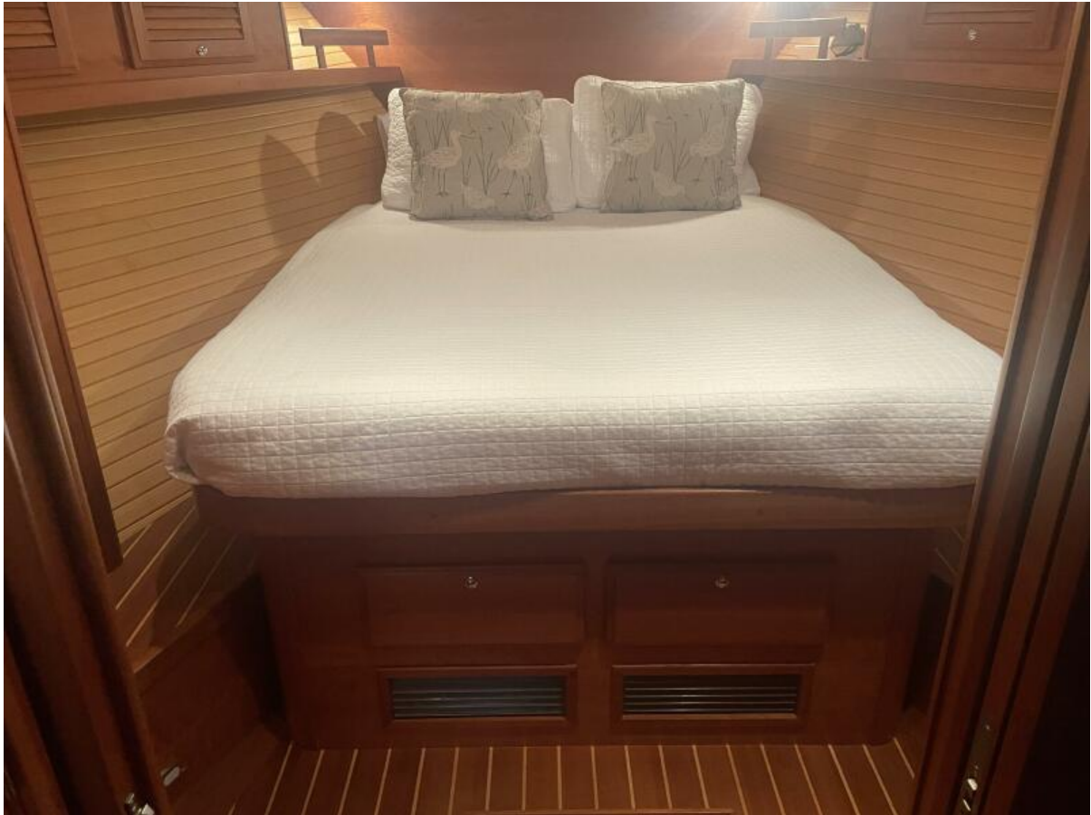
2006 - 38' Sabre Express Queen Size Berth