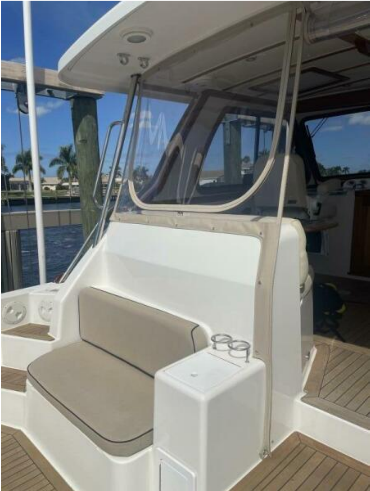
2006 - 38' Sabre Express Sunbrella Upholstered Seating