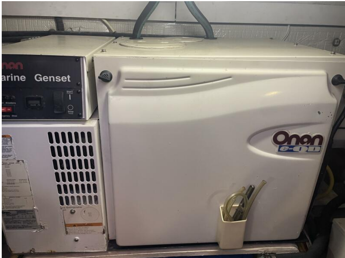
2006 - 38' Sabre Express Onan 9kw Generator