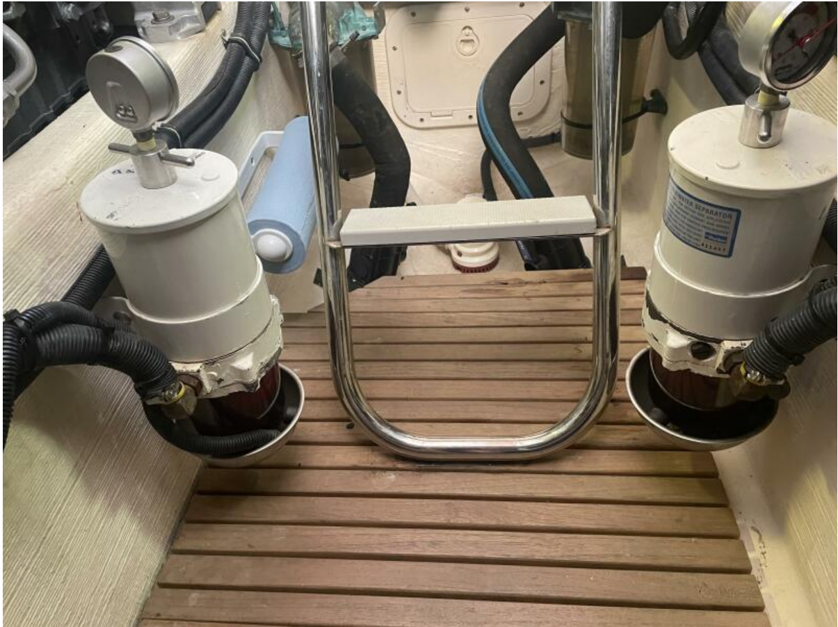
2006 - 38' Sabre Express Racor Fuel Filters w/ Pressure Gauges