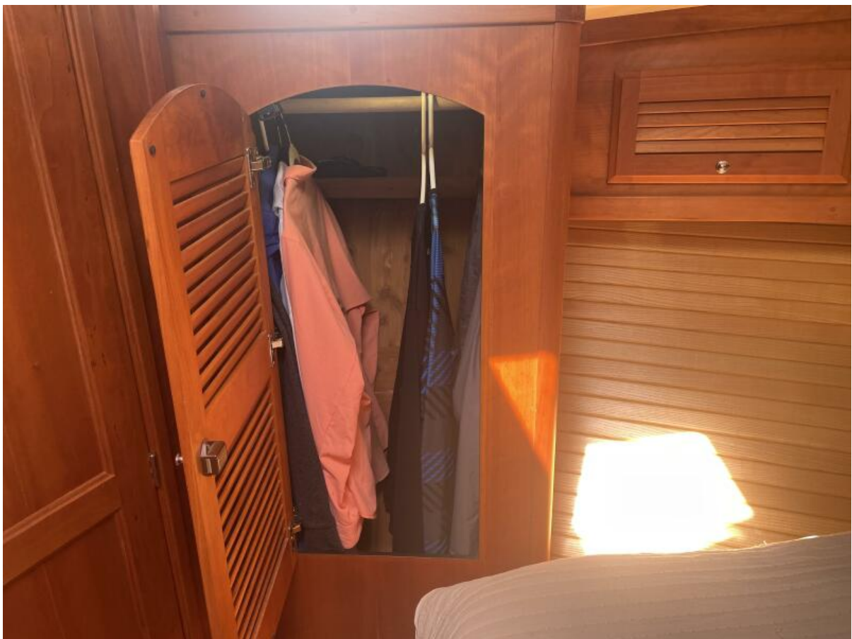
2006 - 38' Sabre Express Cedar Lined Locker