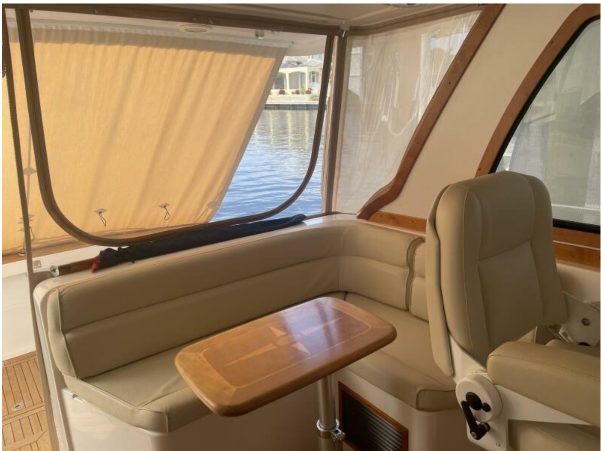
2006 - 38' Sabre Express Comfortable Guest Seating