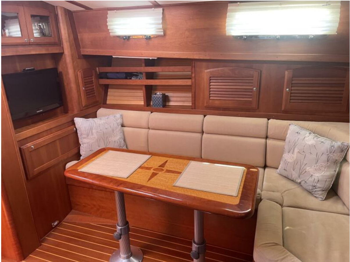
2006 - 38' Sabre Express Salon Seating