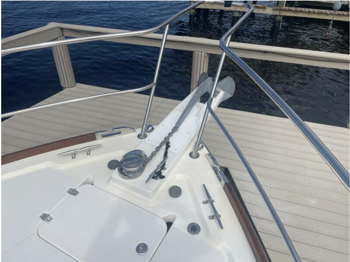
2006 - 38' Sabre Express Windlass & Ground Tackle w/washdown