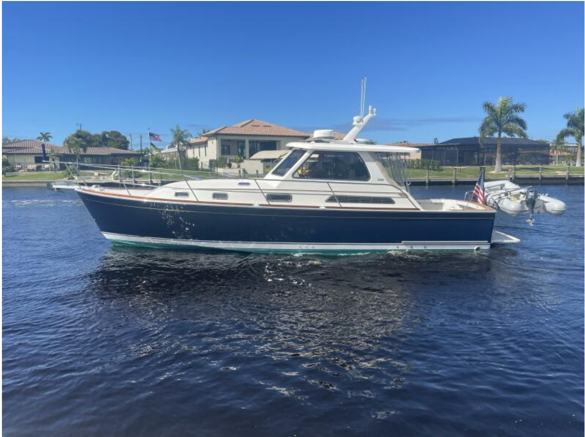
2006 - 38' Sabre Express