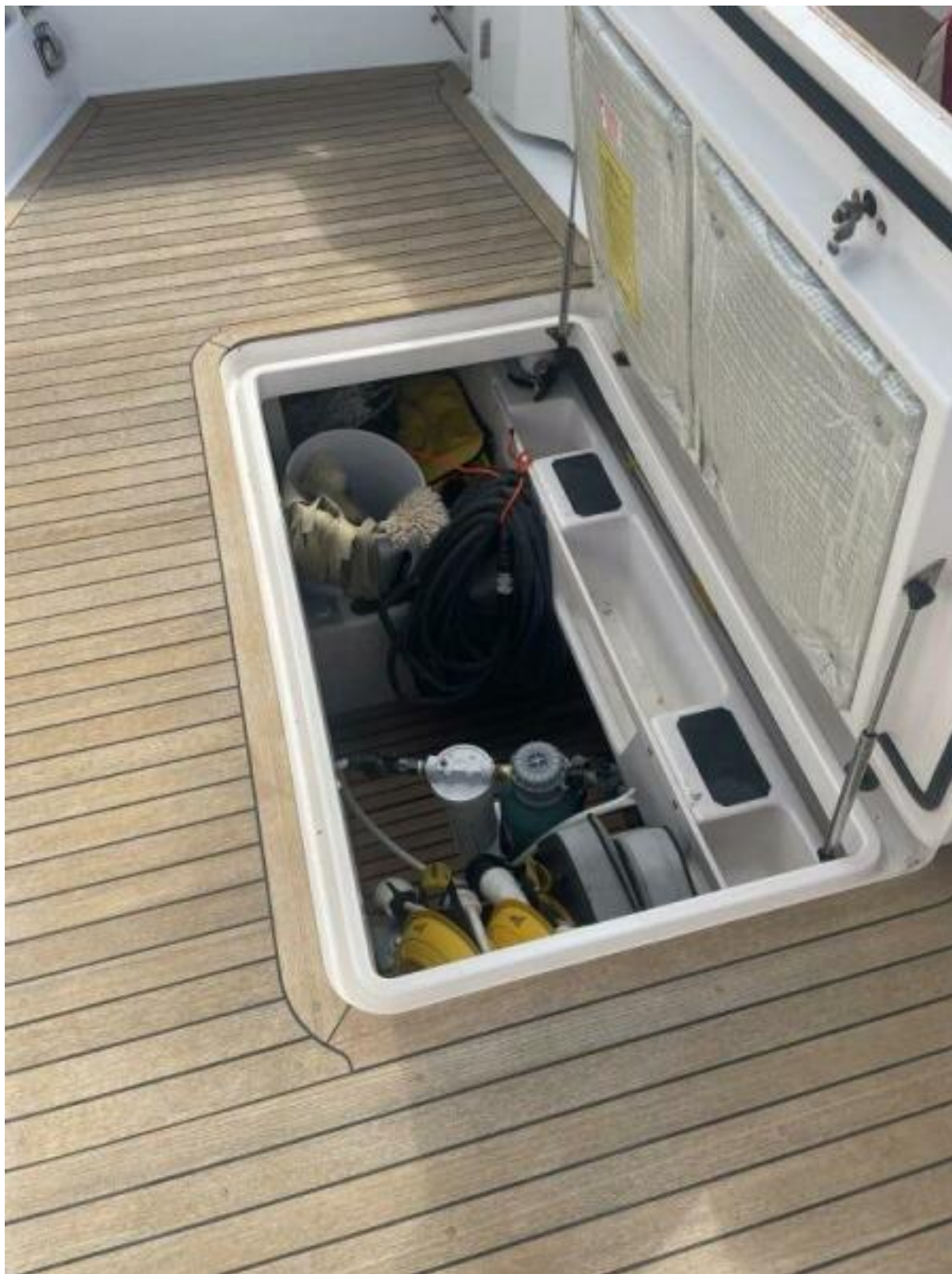
2006 - 38' Sabre Express Cockpit Lazarette