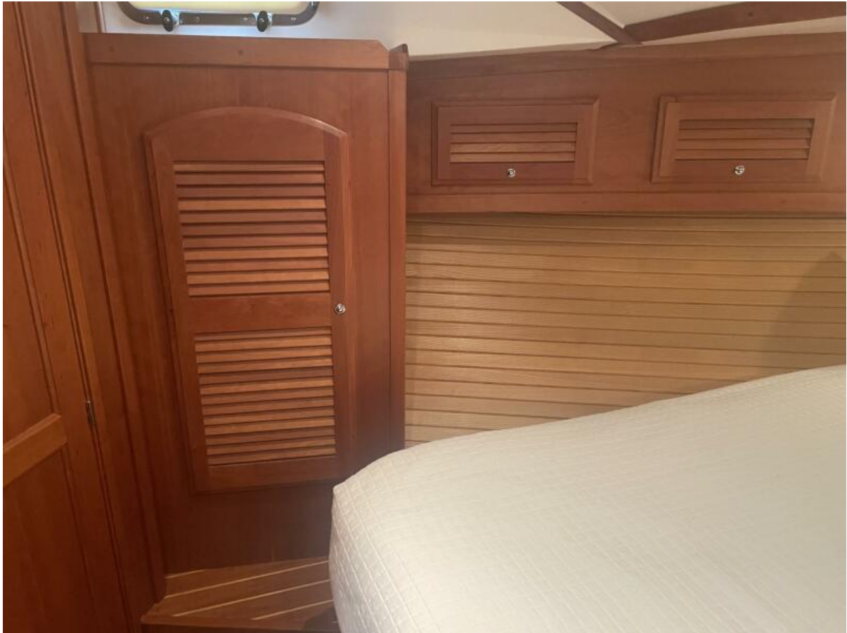
2006 - 38' Sabre Express Ventilated Locker Door