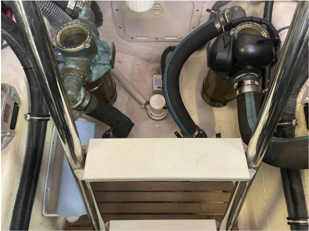
2006 - 38' Sabre Express Easy Access Main Strainers