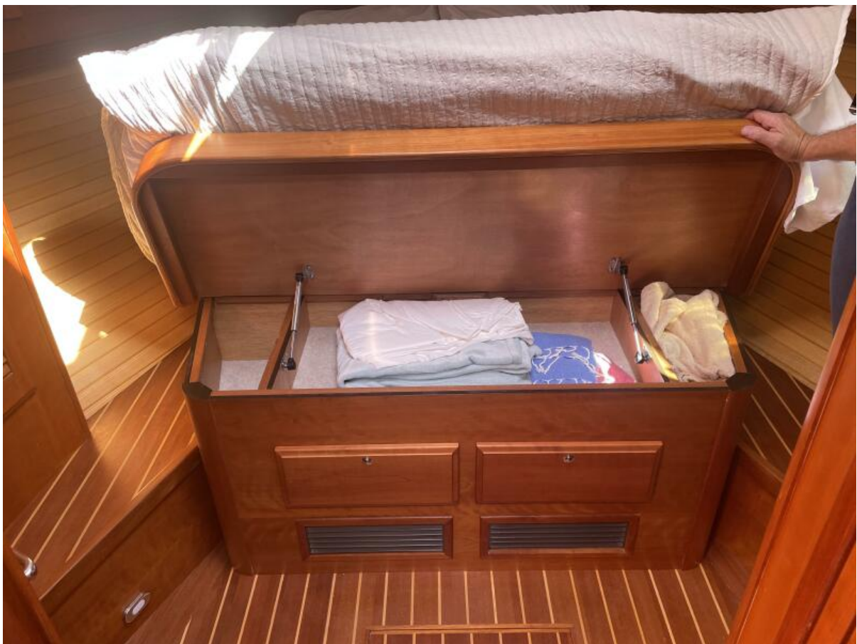
2006 - 38' Sabre Express Under Berth Storage