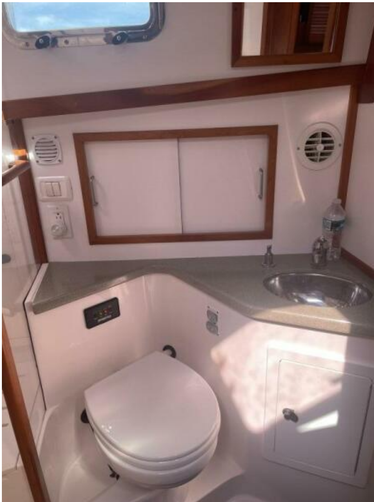
2006 - 38' Sabre Express Lots of Counter Space & Storage