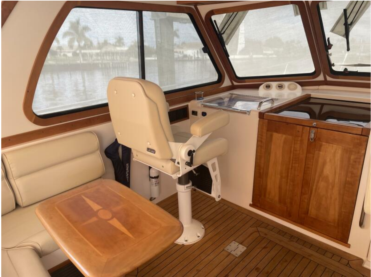
2006 - 38' Sabre Express Stidd Seating & Nav. Storage