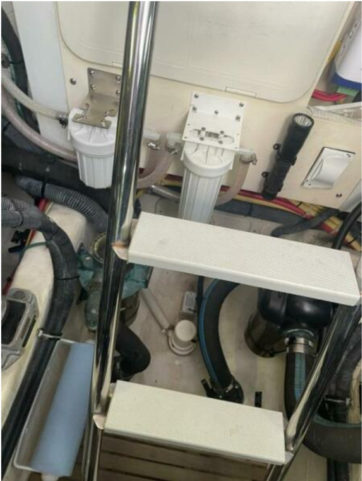
2006 - 38' Sabre Express Fresh Water Filtration