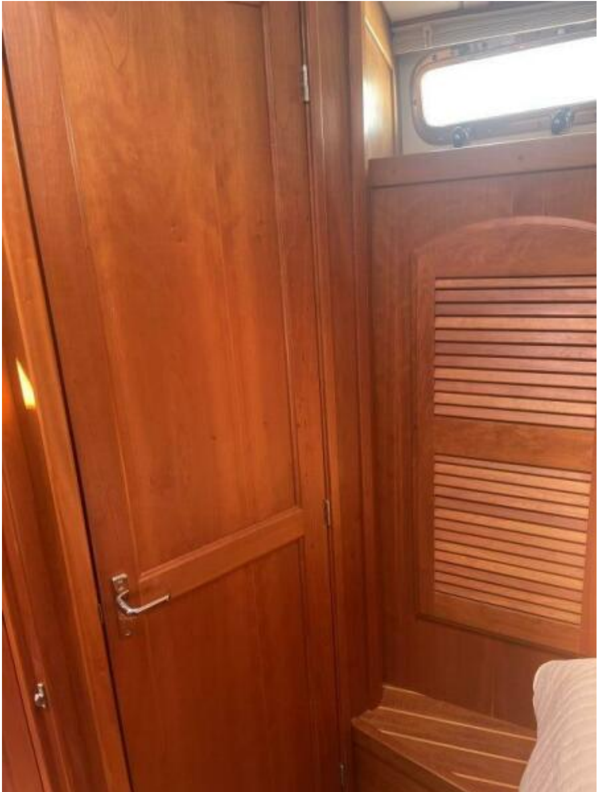
2006 - 38' Sabre Express Door to Head From Owners Cabin