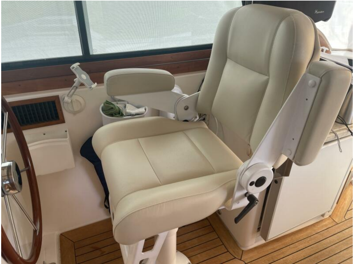
2006 - 38' Sabre Express Captains Adjustable Stidd Seat