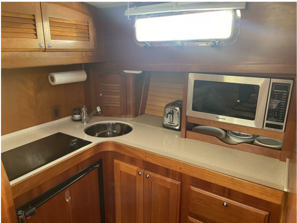
2006 - 38' Sabre Express Great Counter Space & Storage