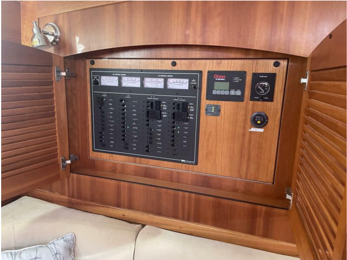
2006 - 38' Sabre Express Main Electrical Panel