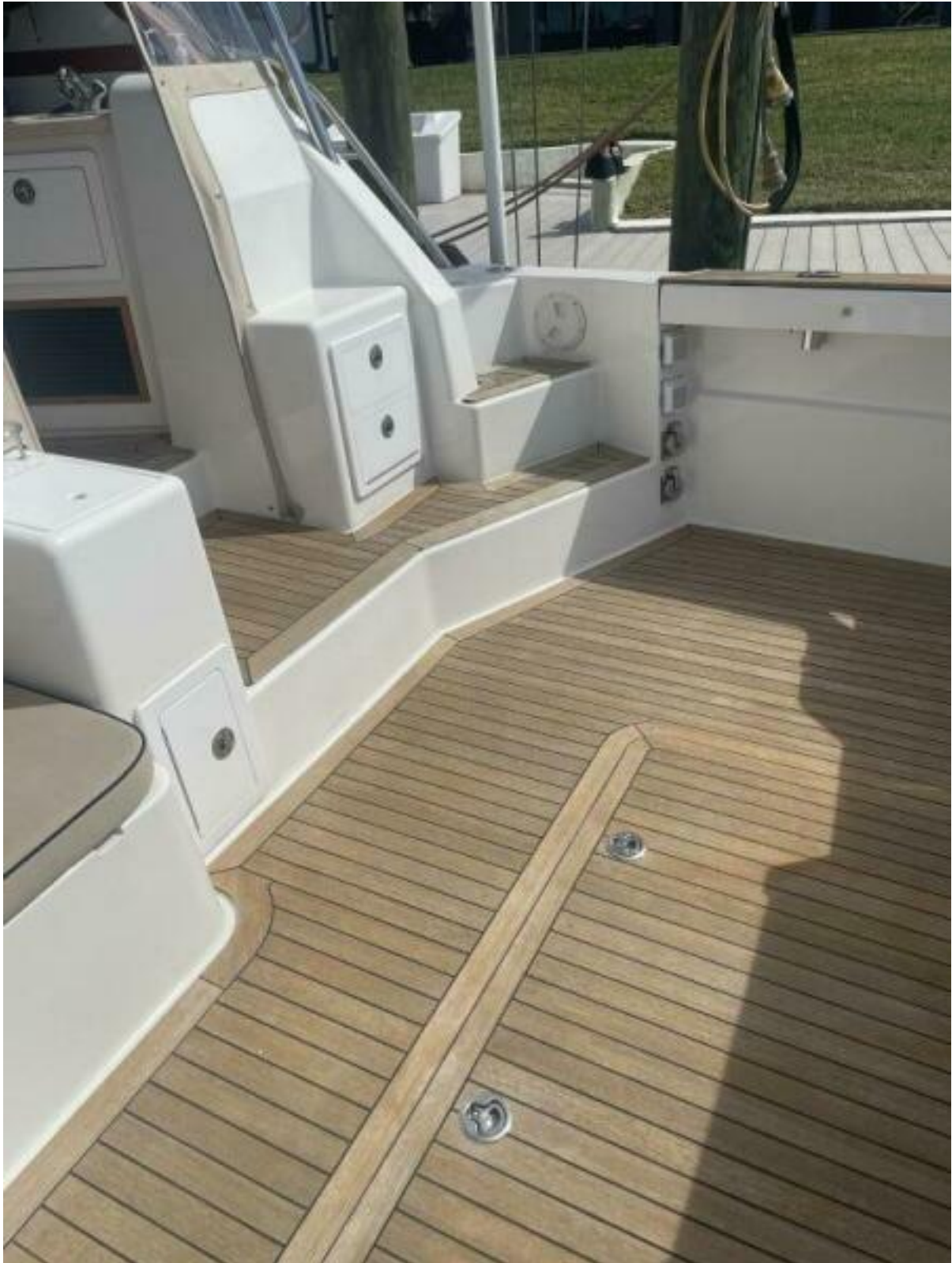
2006 - 38' Sabre Express Storage on Both Side of Entrance