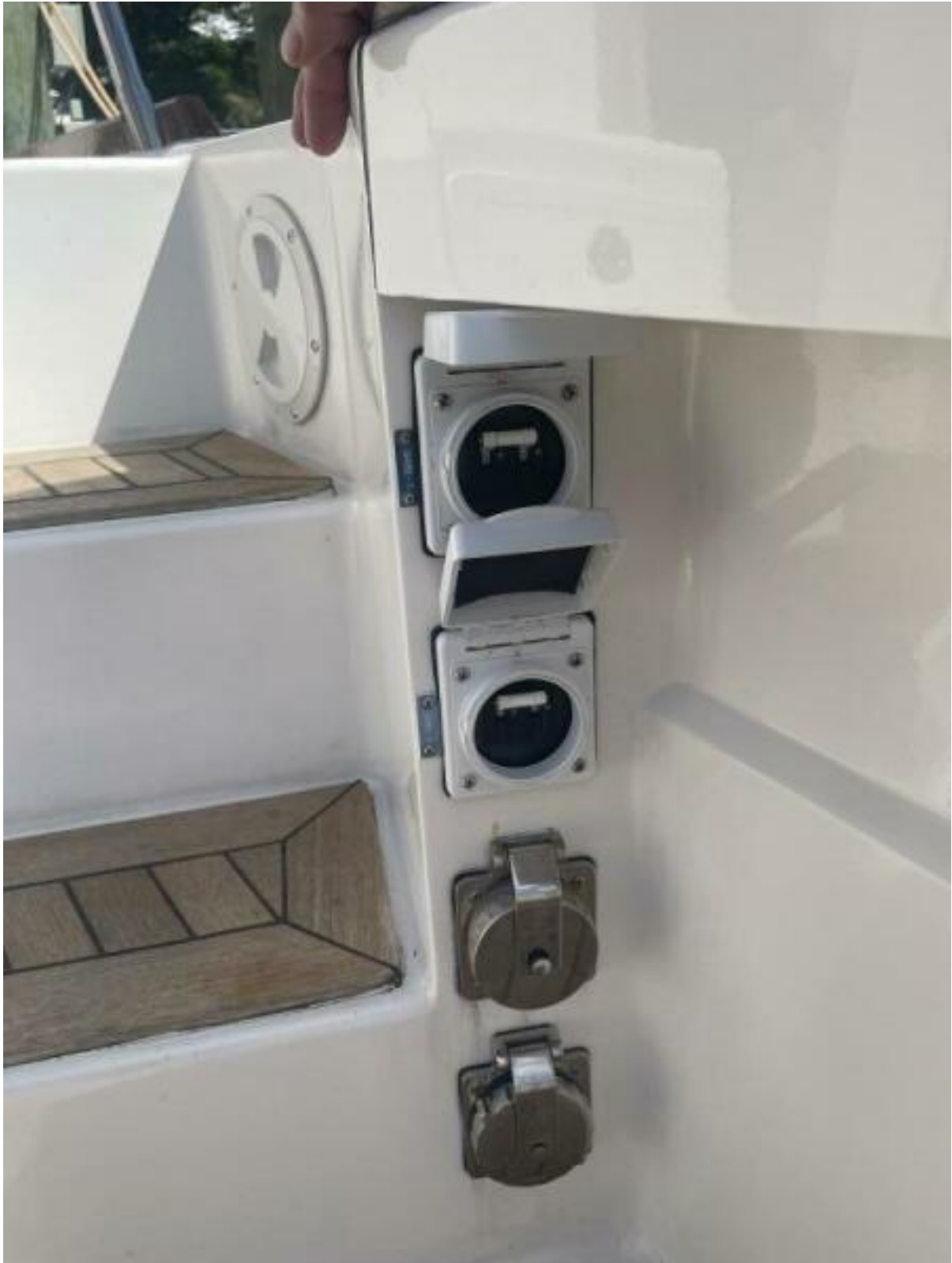
2006 - 38' Sabre Express 2-30 Amp Plugs w/ Cut-off Switches