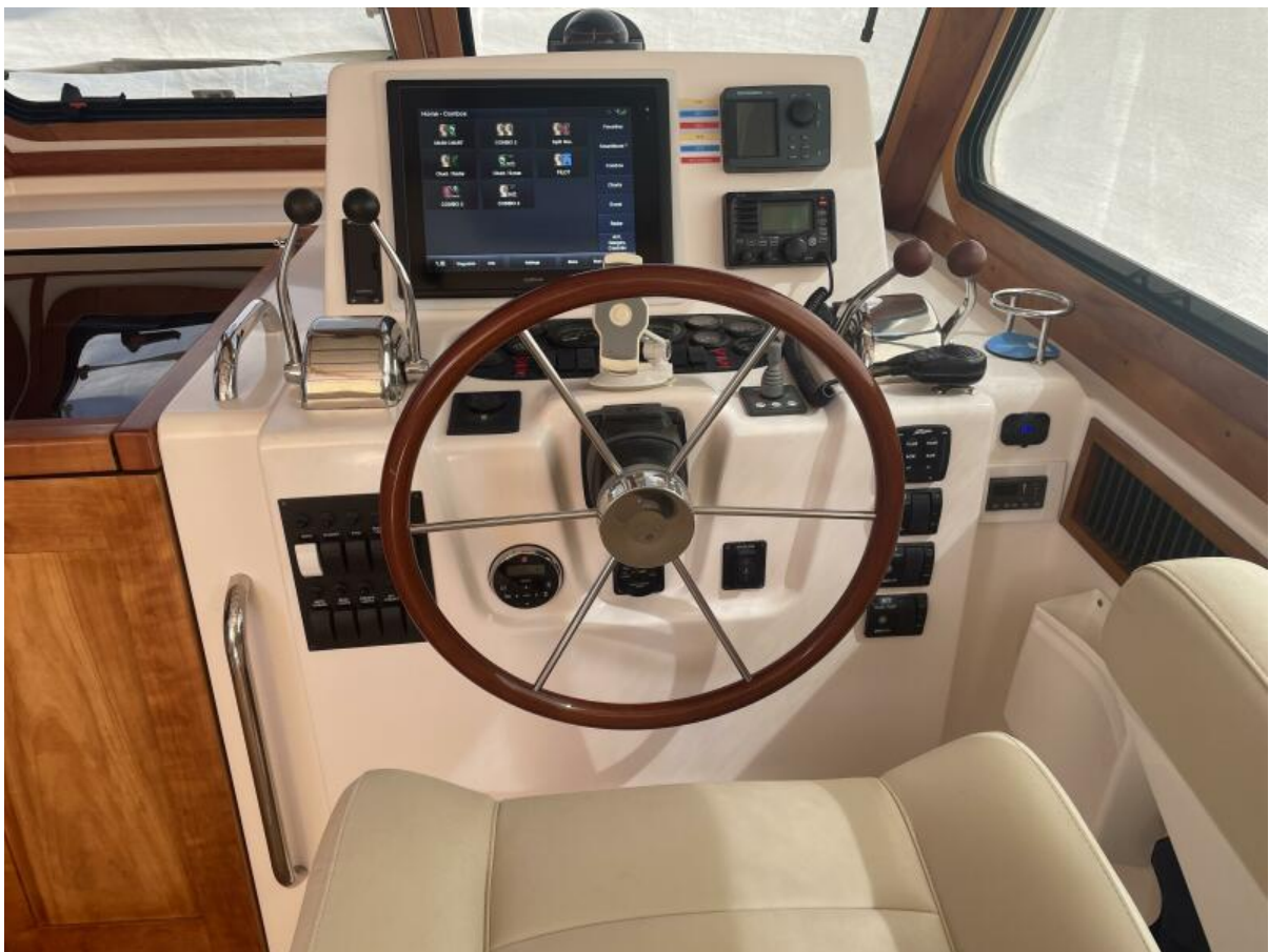
2006 - 38' Sabre Express Updated Helm