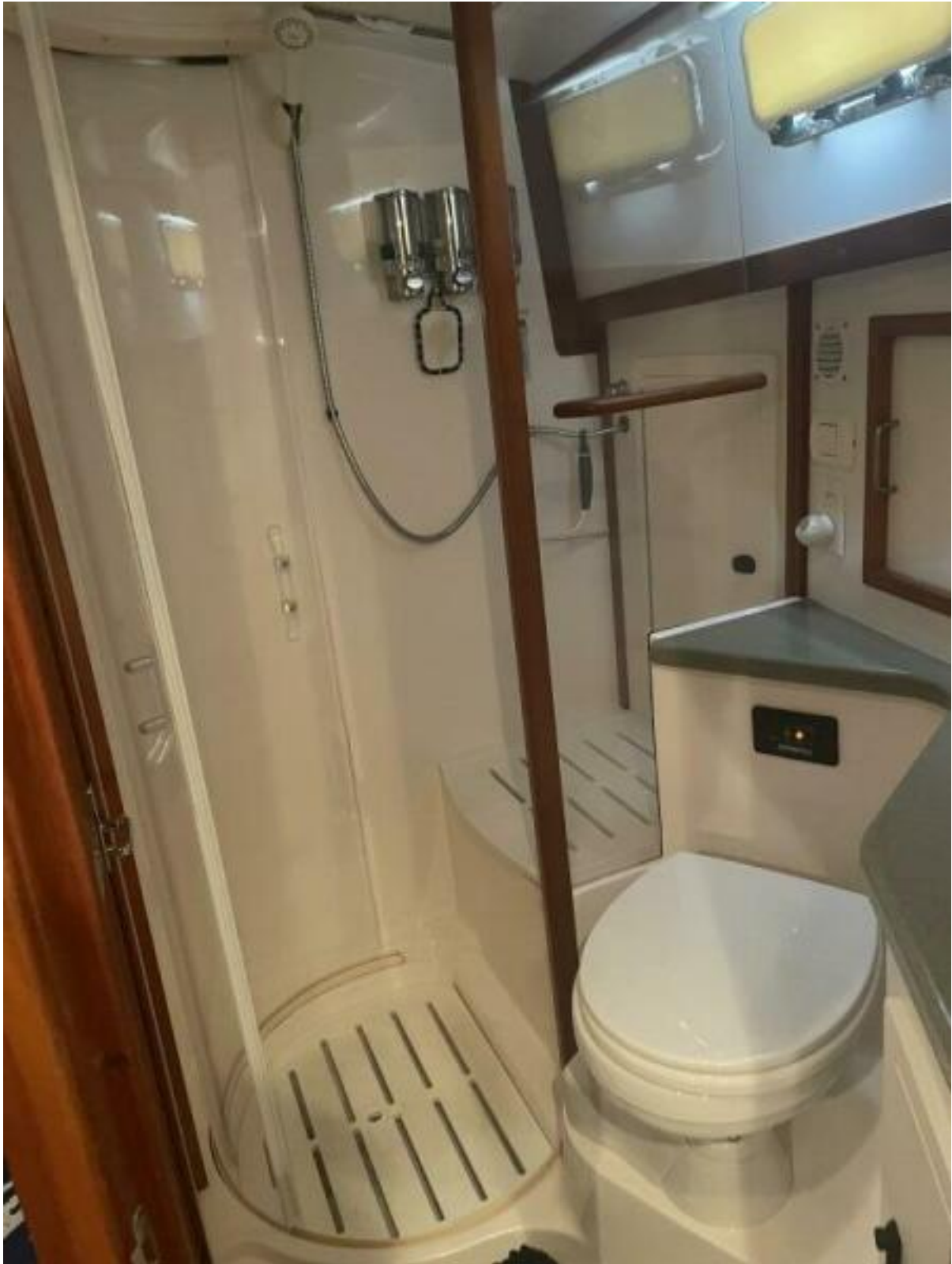
2006 - 38' Sabre Express Separate Enclosed Shower