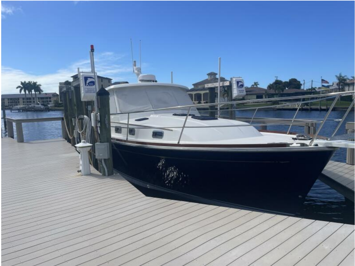
2006 - 38' Sabre Express Window Sunshades