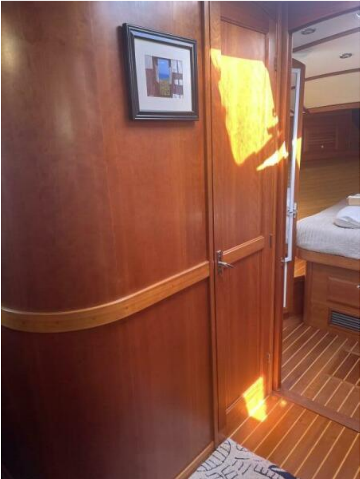
2006 - 38' Sabre Express Beautiful Woodwork Surrounds Enclosed Head