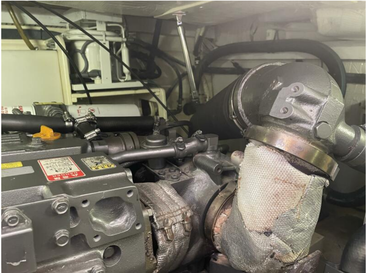
2006 - 38' Sabre Express Port Engine