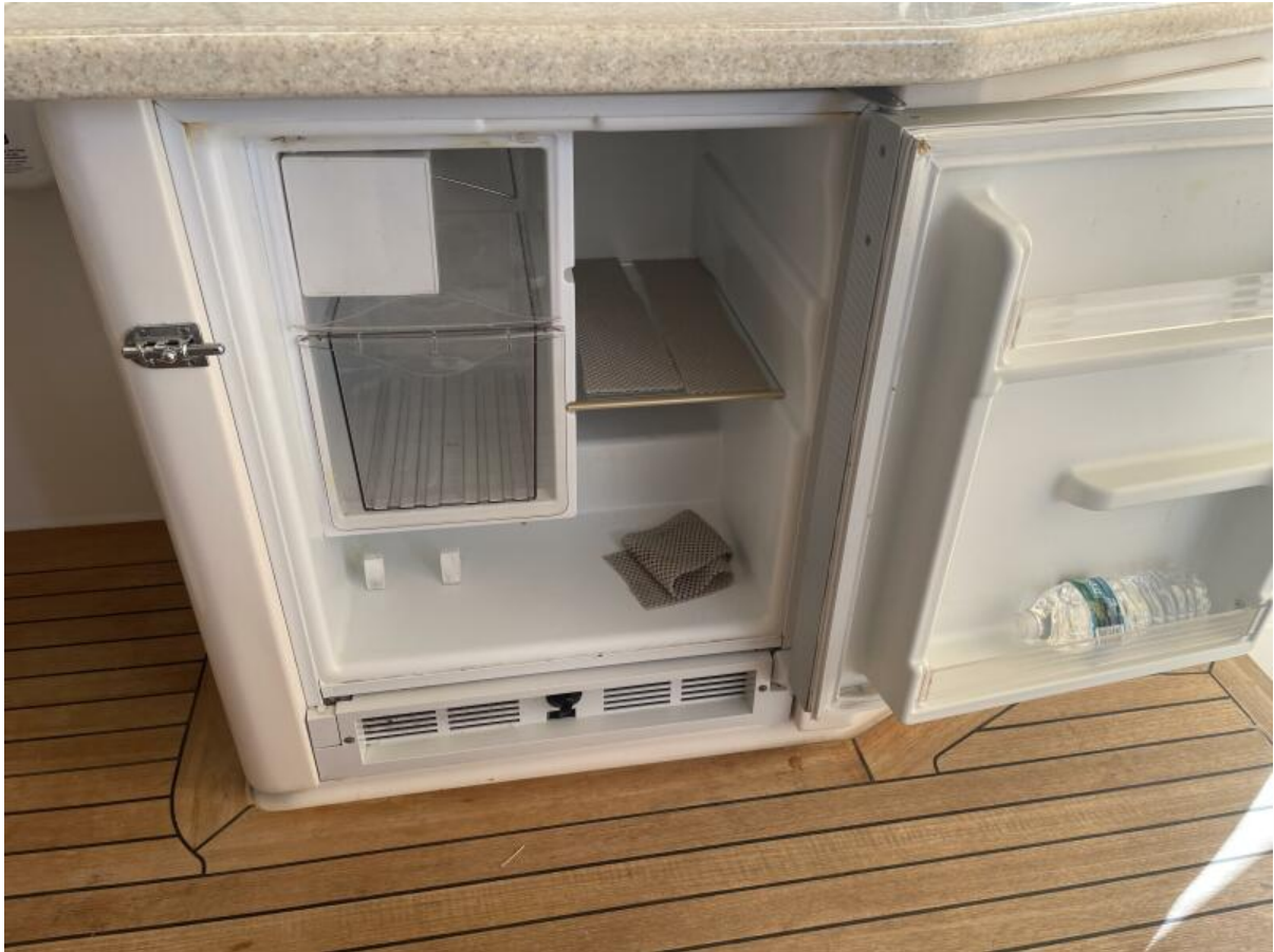
2006 - 38' Sabre Express Fridge & Ice Maker