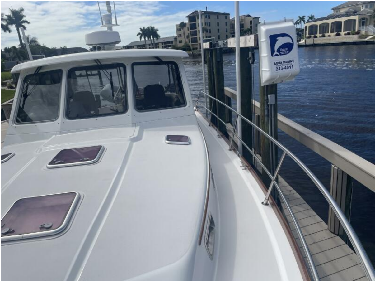
2006 - 38' Sabre Express Wide Side Decks