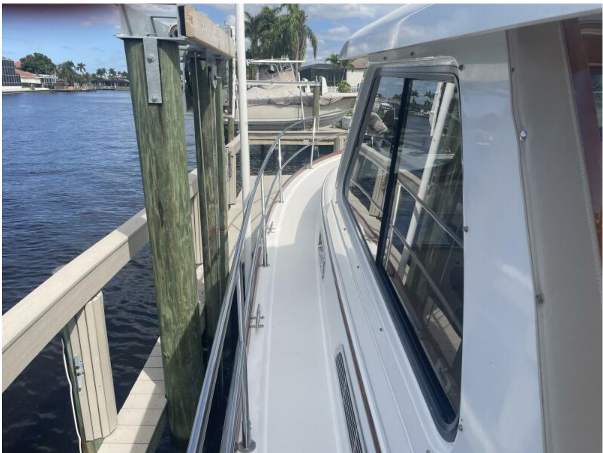
2006 - 38' Sabre Express Aggressive Non-Skid Surfaces