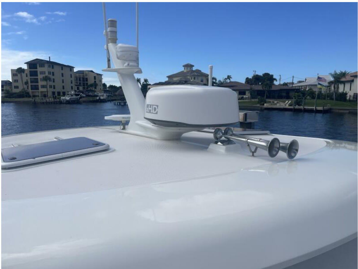
2006 - 38' Sabre Express Garmin HD Radar