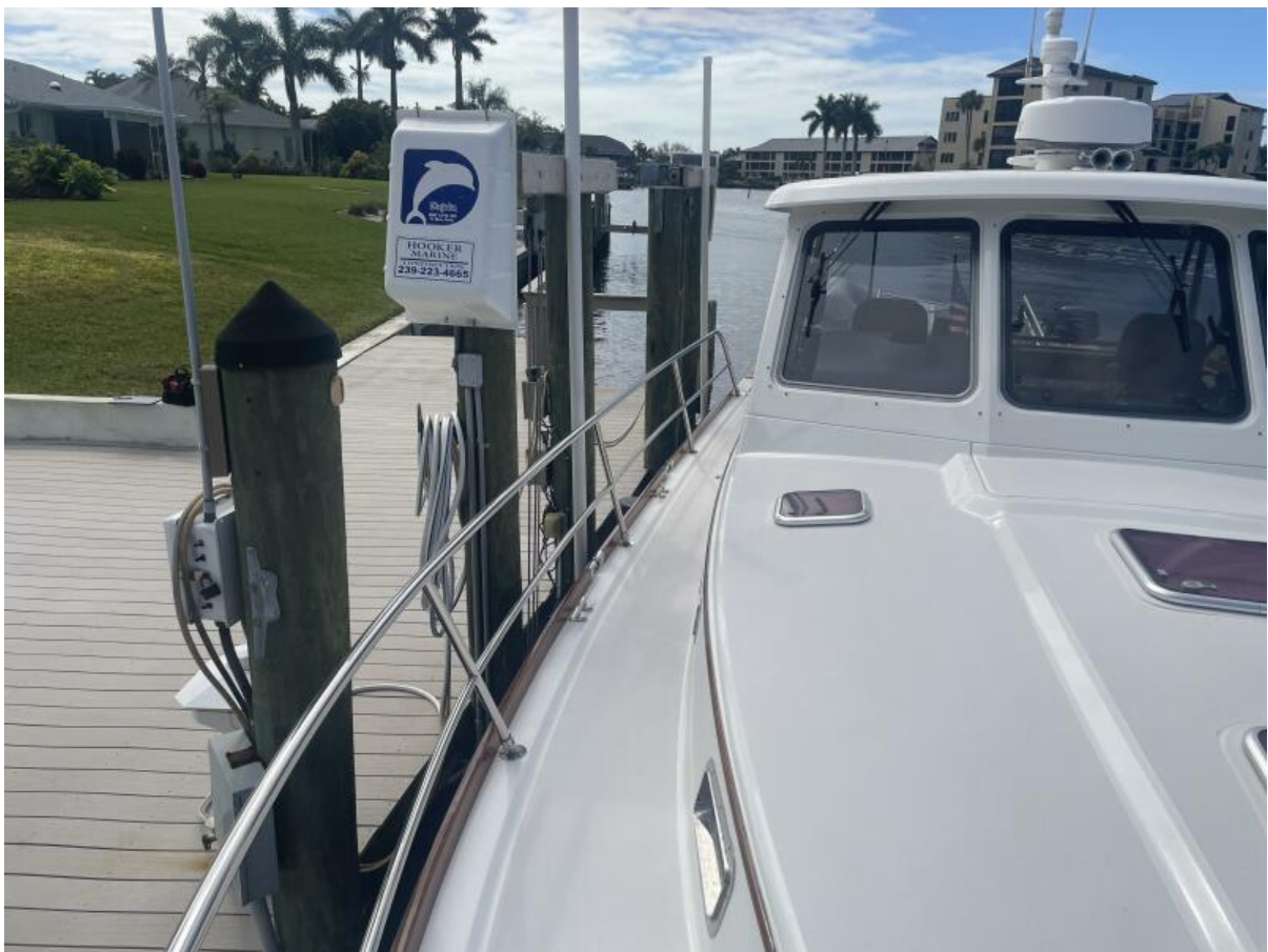
2006 - 38' Sabre Express Sturdy Stainless Bow Rails