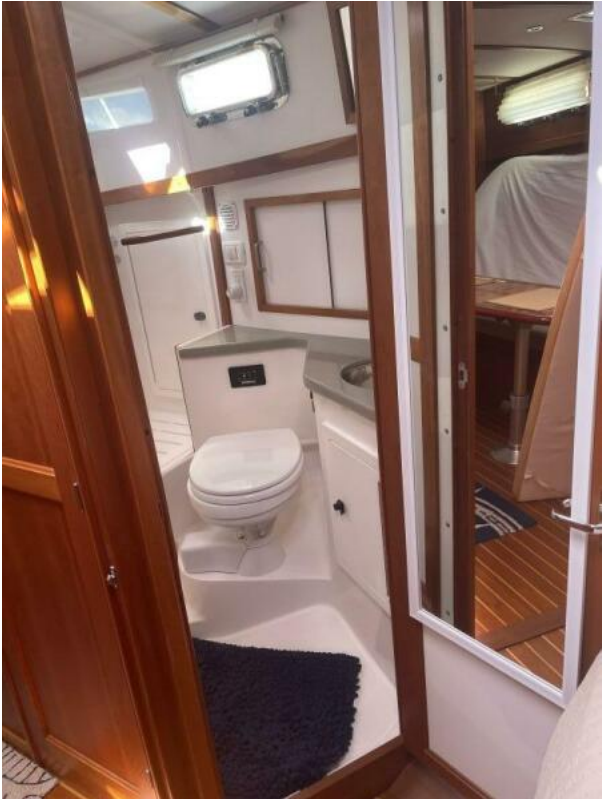
2006 - 38' Sabre Express