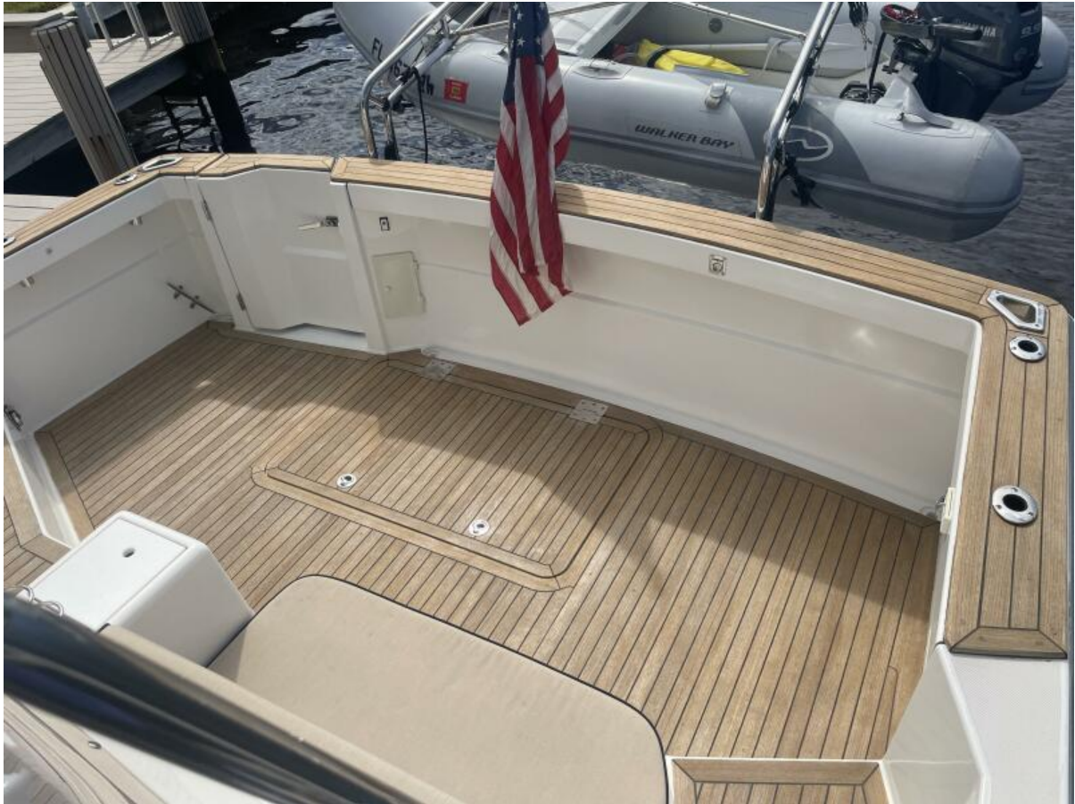
2006 - 38' Sabre Express Beautiful Teak Decking