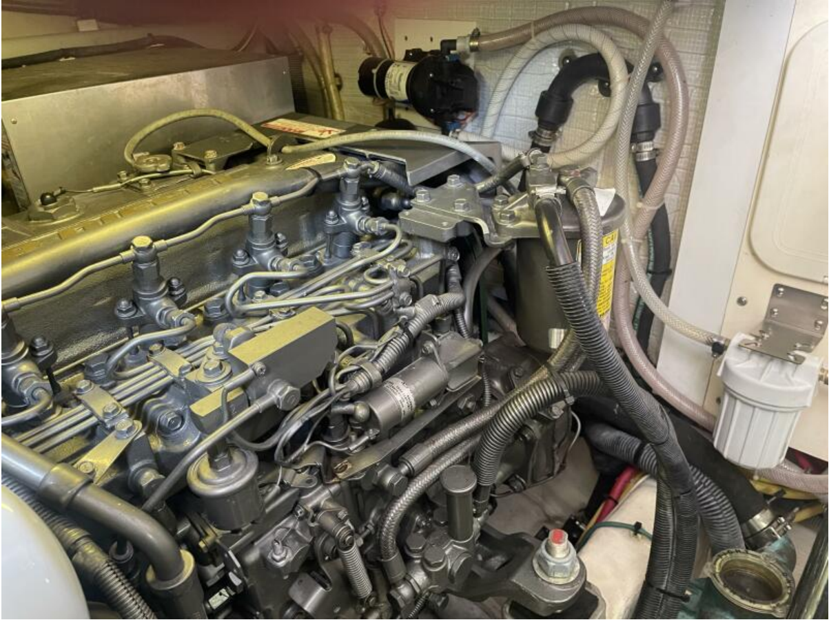
2006 - 38' Sabre Express Stbd. Engine