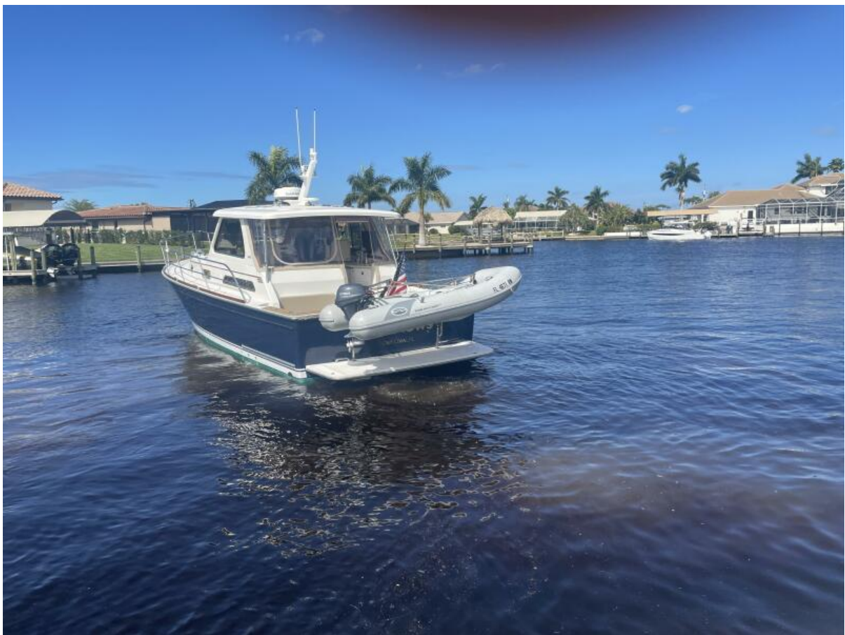
2006 - 38' Sabre Express