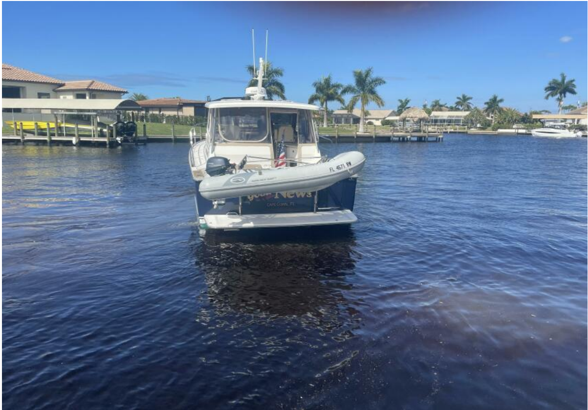
2006 - 38' Sabre Express