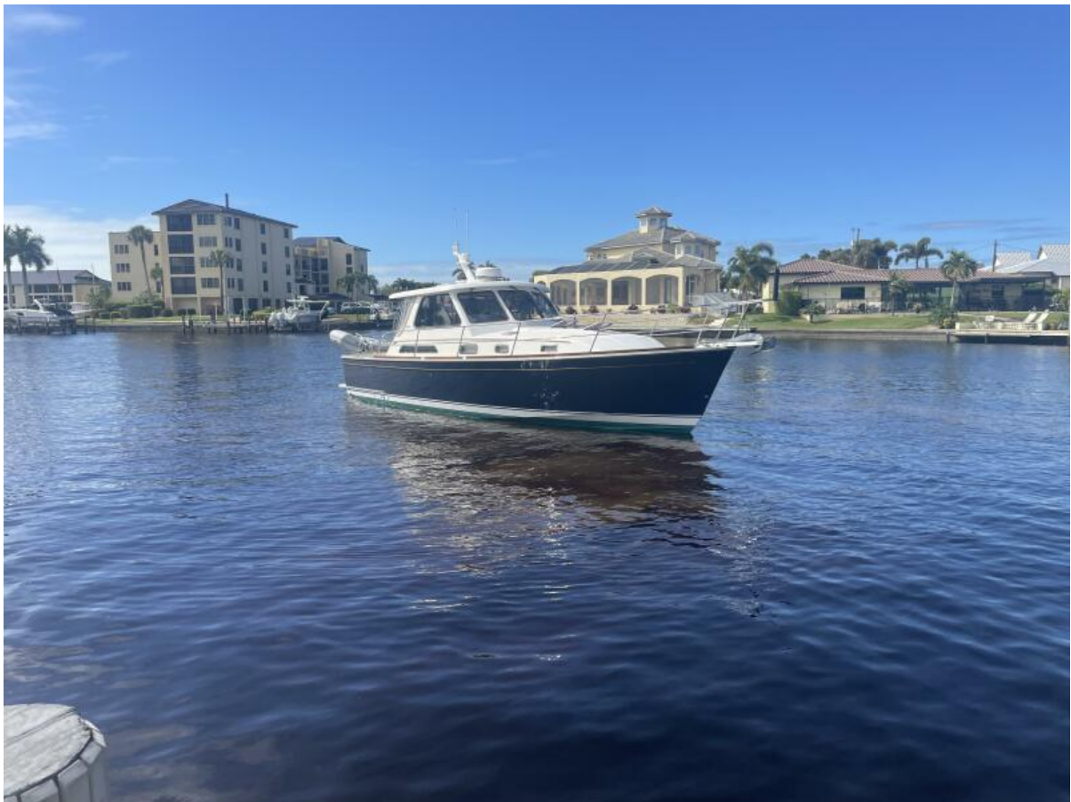
2006 - 38' Sabre Express