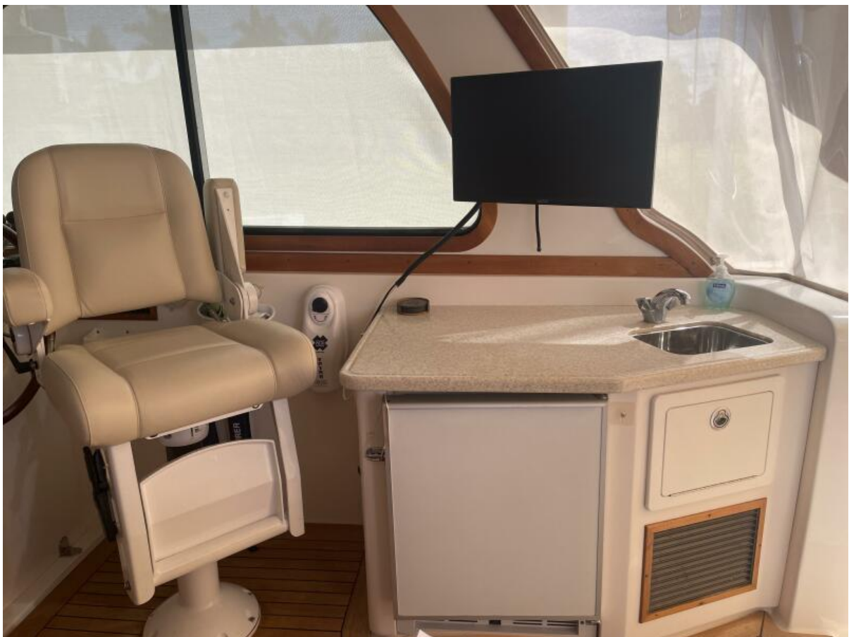
2006 - 38' Sabre Express Wet Bar W/ Fridge & Ice Maker