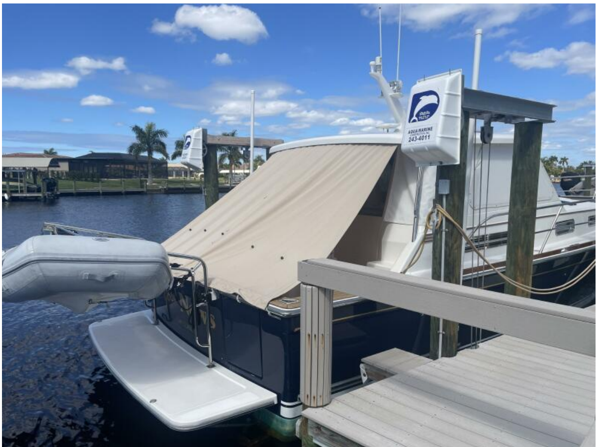
2006 - 38' Sabre Express Cockpit Shade