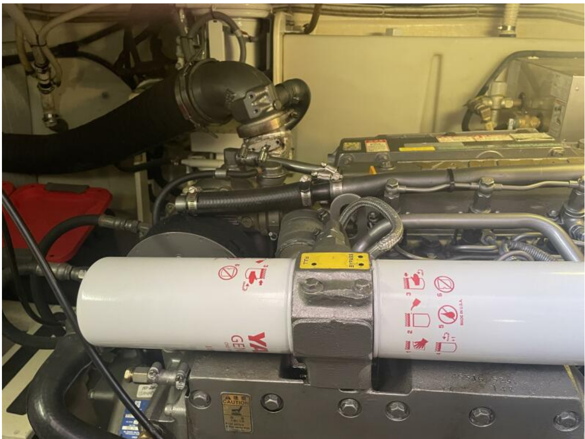
2006 - 38' Sabre Express Easy Access