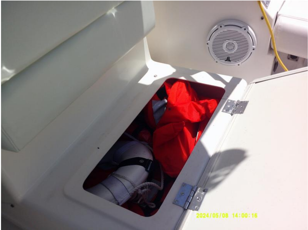
Tiara 3100 Open Helm Storage