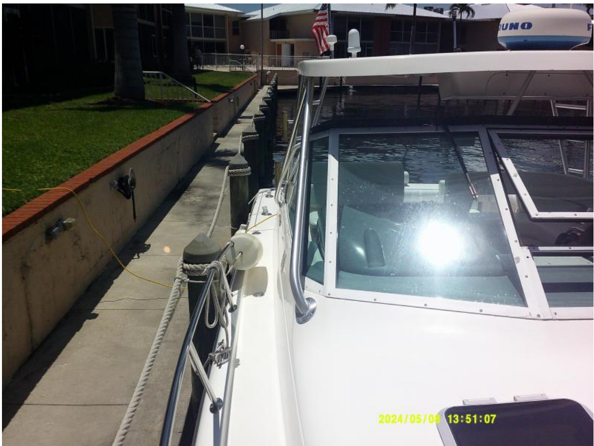
Tiara 3100 Open