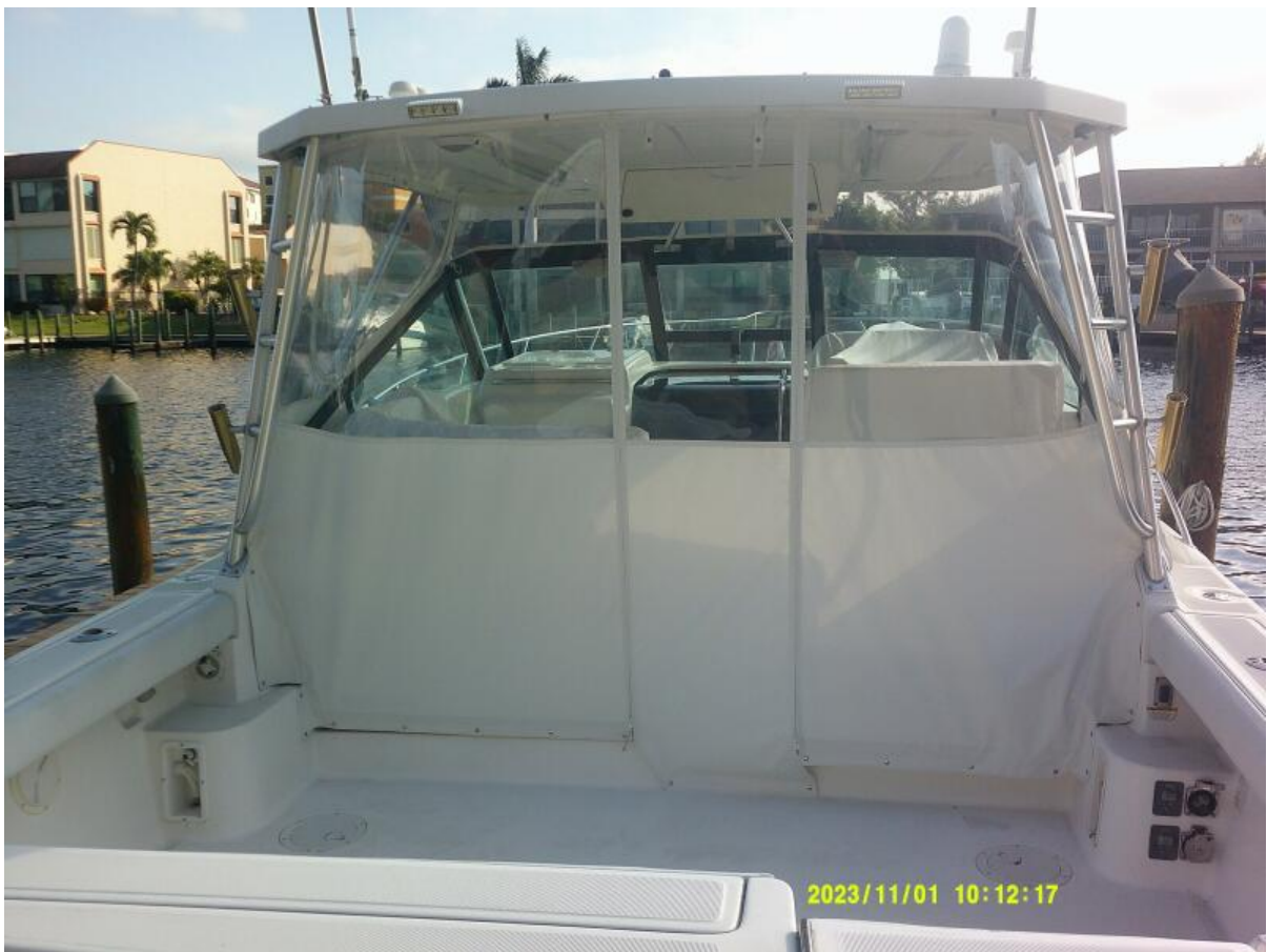
Tiara 3100 Open New Enclosure