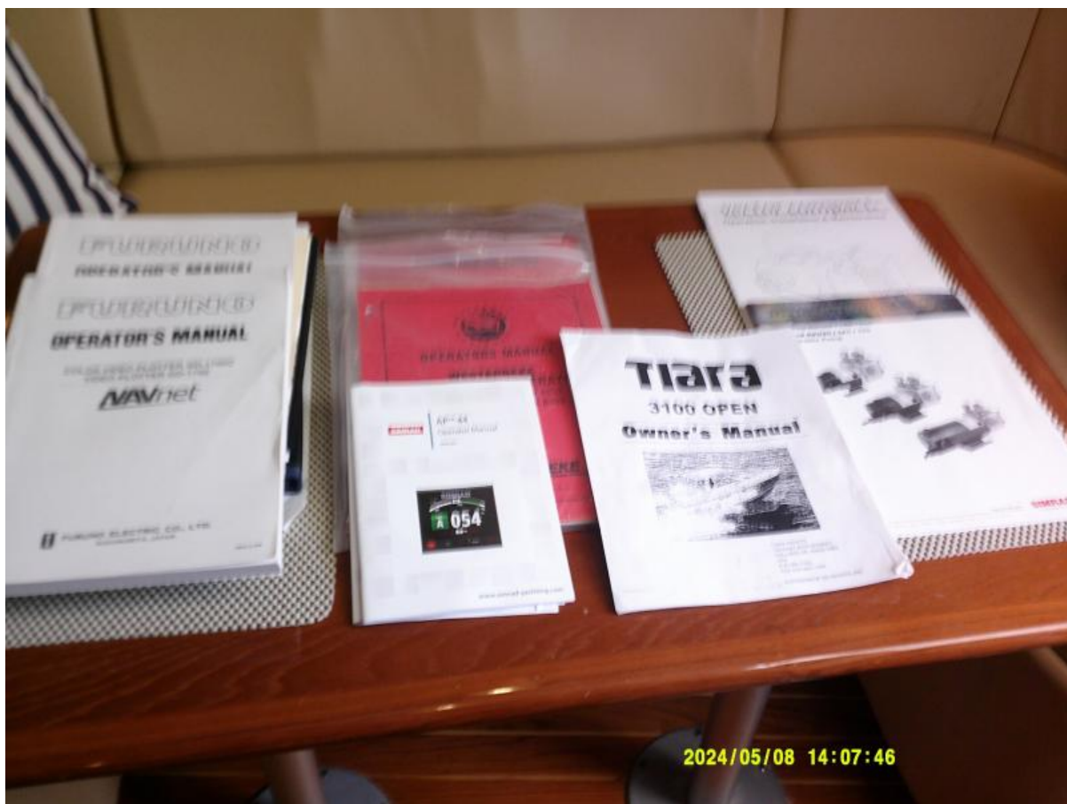
Tiara 3100 Open Tiara & Other Factory Manual