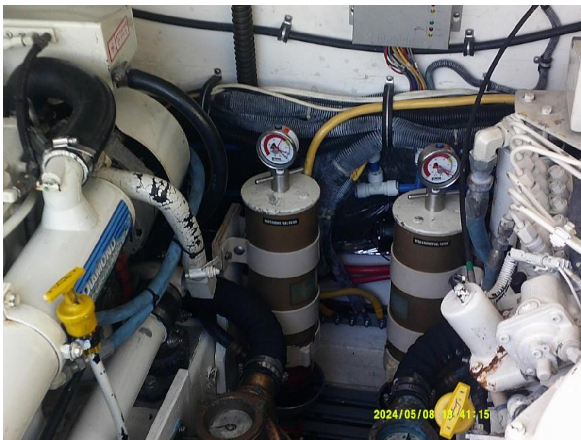
Tiara 3100 Open Racor Fuel Filters