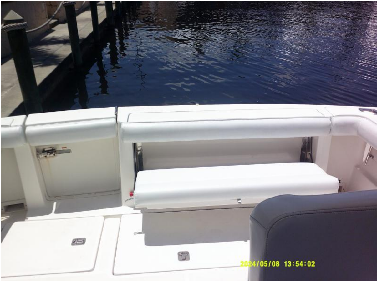
Tiara 3100 Open Cockpit Folding Seat - Down