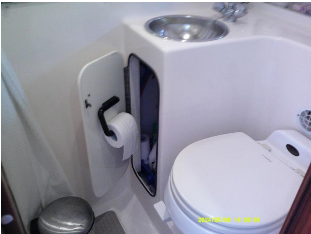
Tiara 3100 Open Head