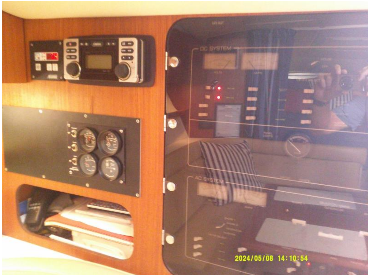
Tiara 3100 Open Clarion Radio Head & Generator Info.