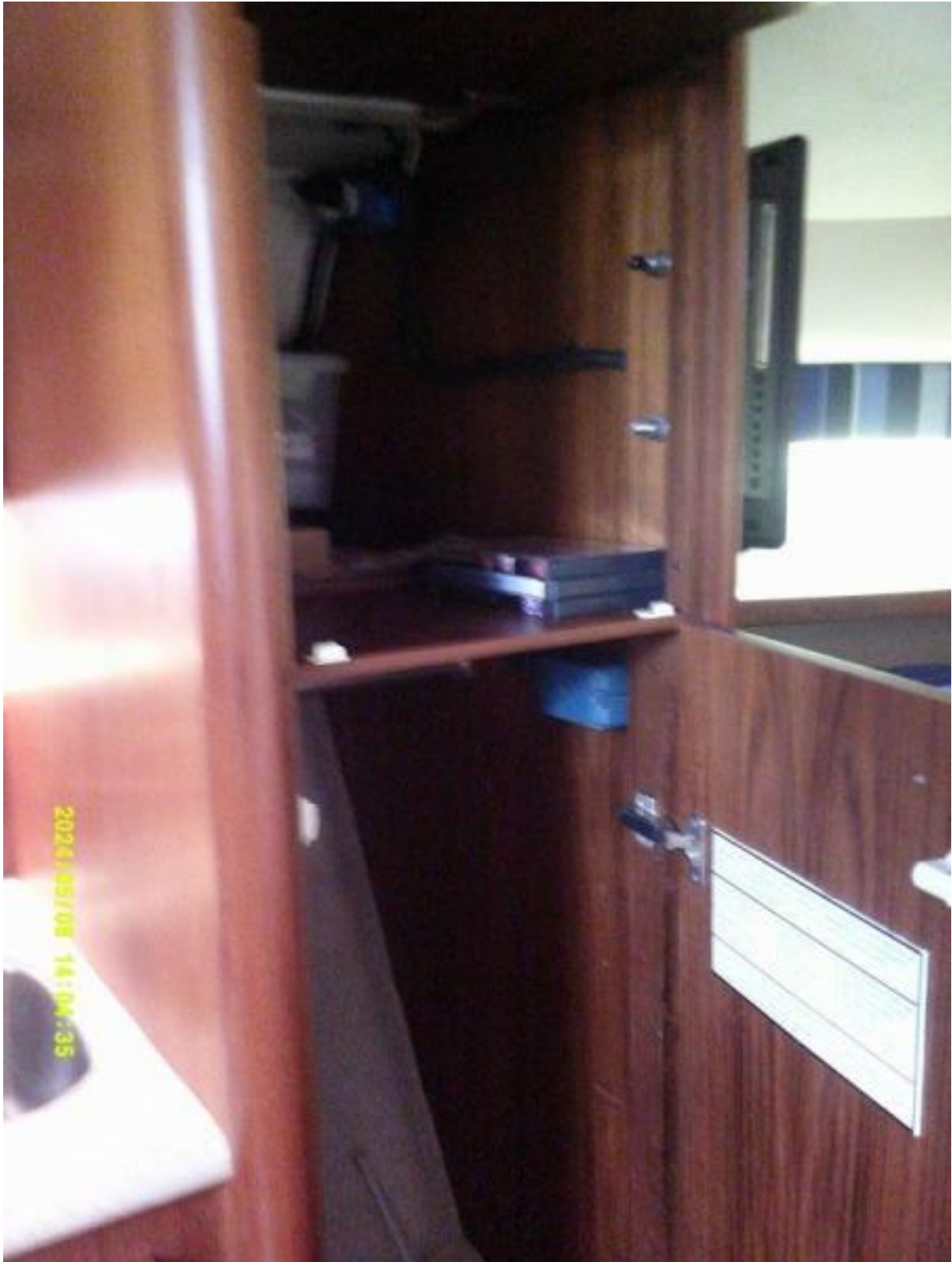
Tiara 3100 Open Bottom: Hanging Locker Top: Storage