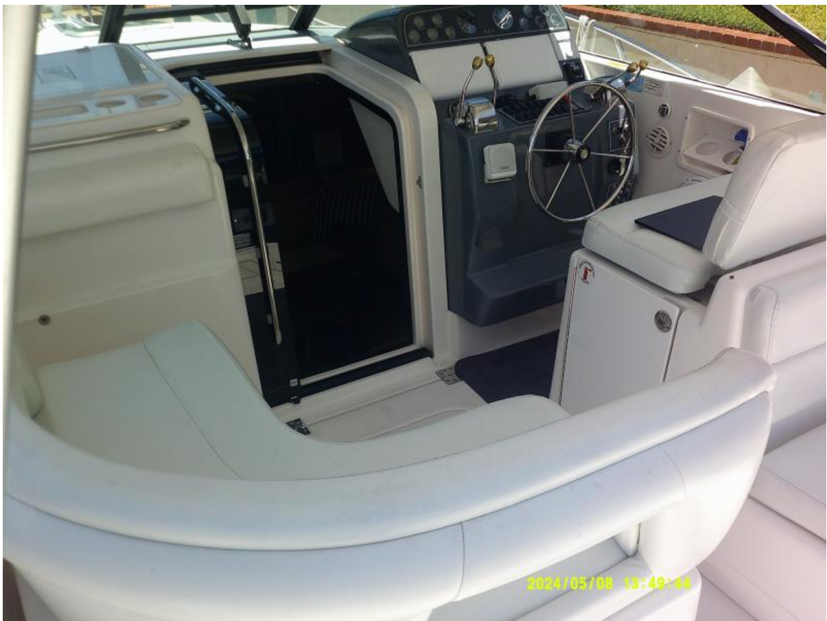
Tiara 3100 Open Helm Area Seating Options