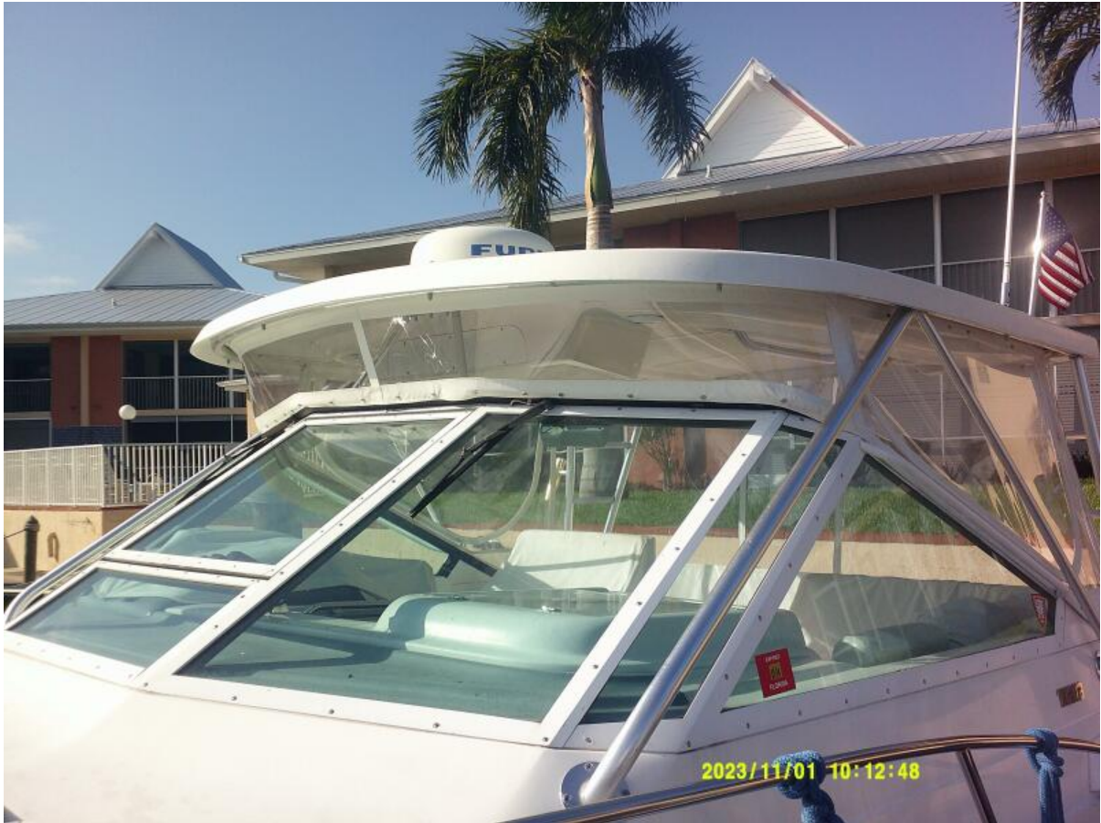
Tiara 3100 Open New Enclosure