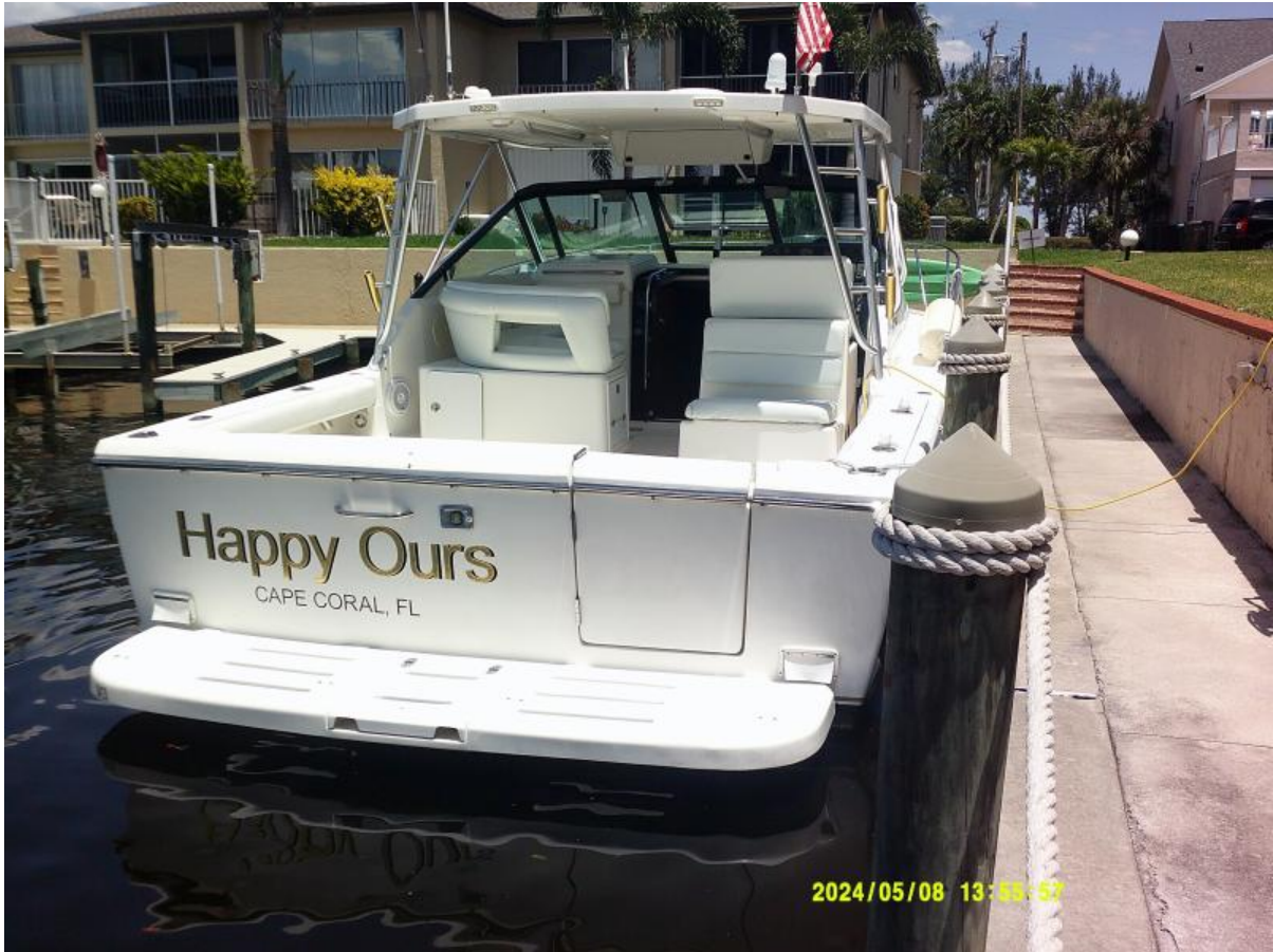
Tiara 3100 Open