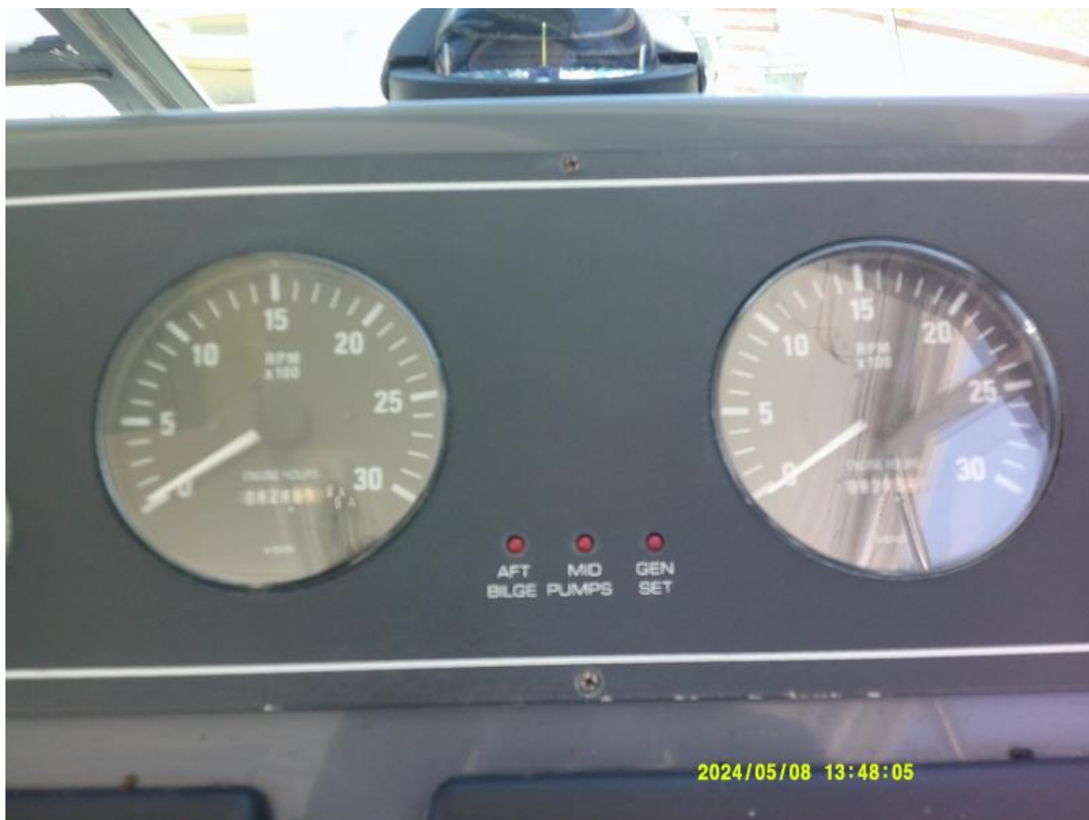
Tiara 3100 Open Note the low engine hours