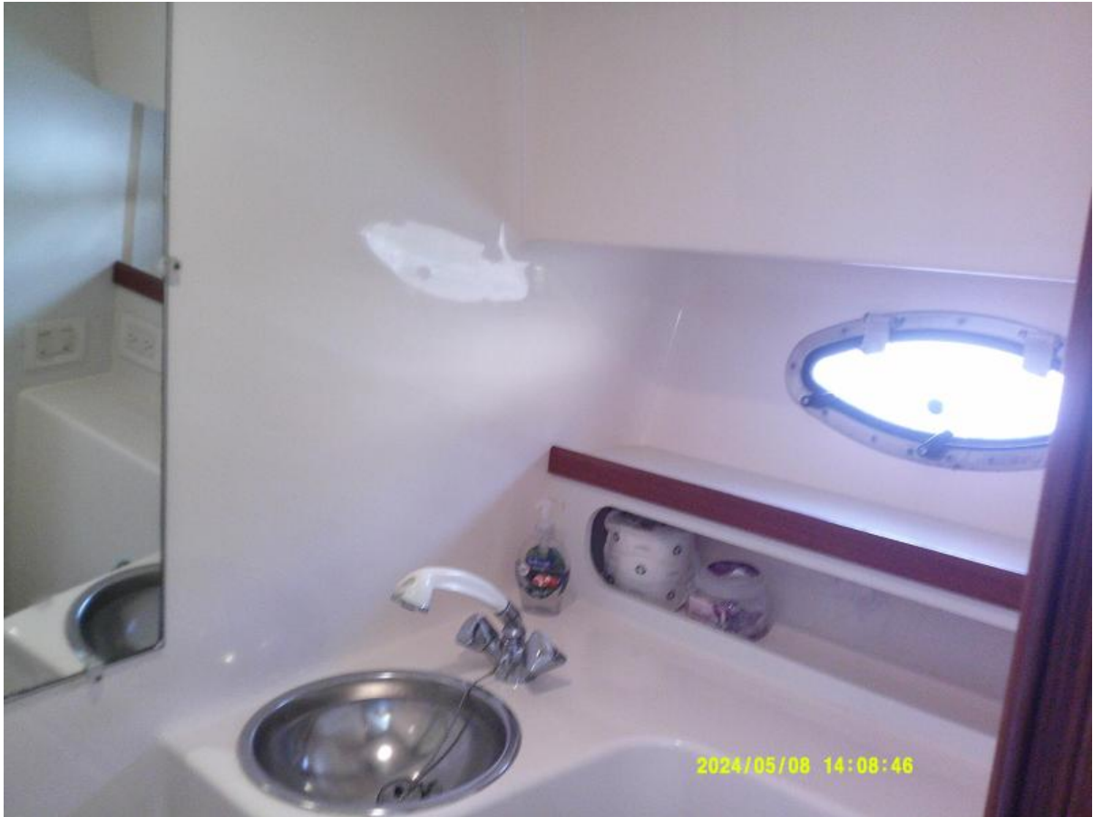
Tiara 3100 Open Head