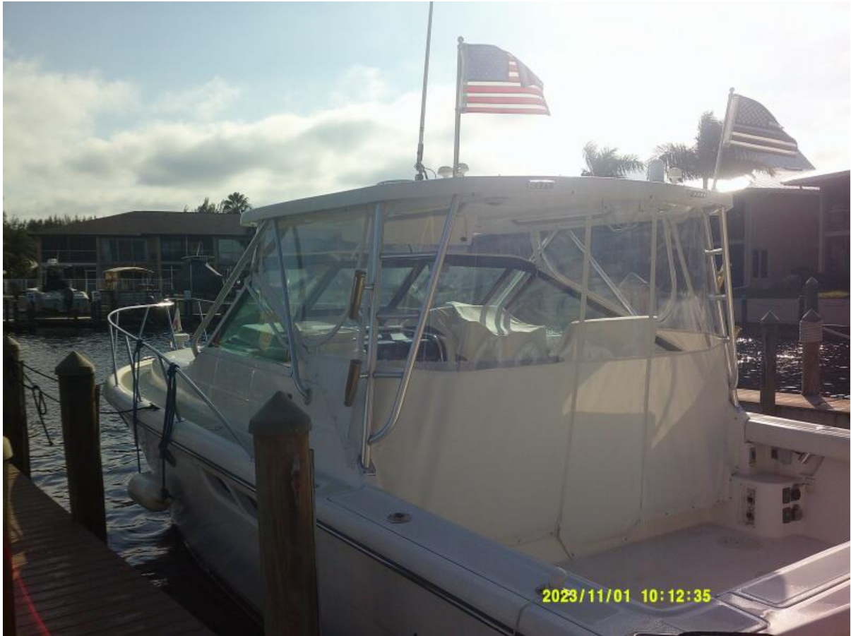
Tiara 3100 Open New Enclosure