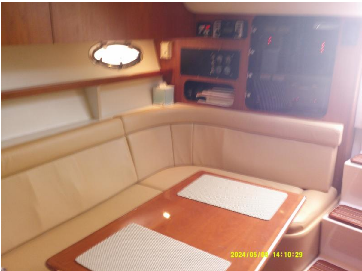
Tiara 3100 Open Settee w/ Tiara Wood Table