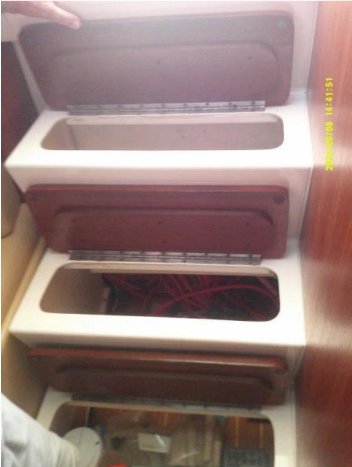
Tiara 3100 Open Battery Switches under stair treads