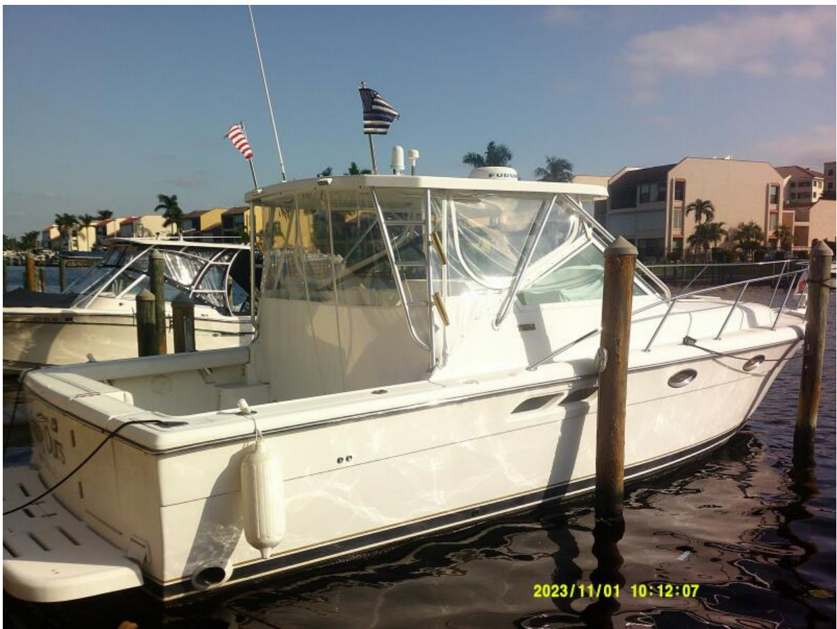
Tiara 3100 Open New Enclosure