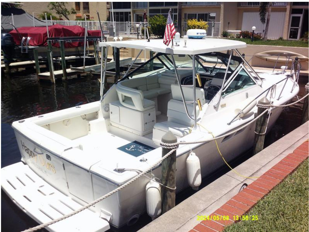
Tiara 3100 Open