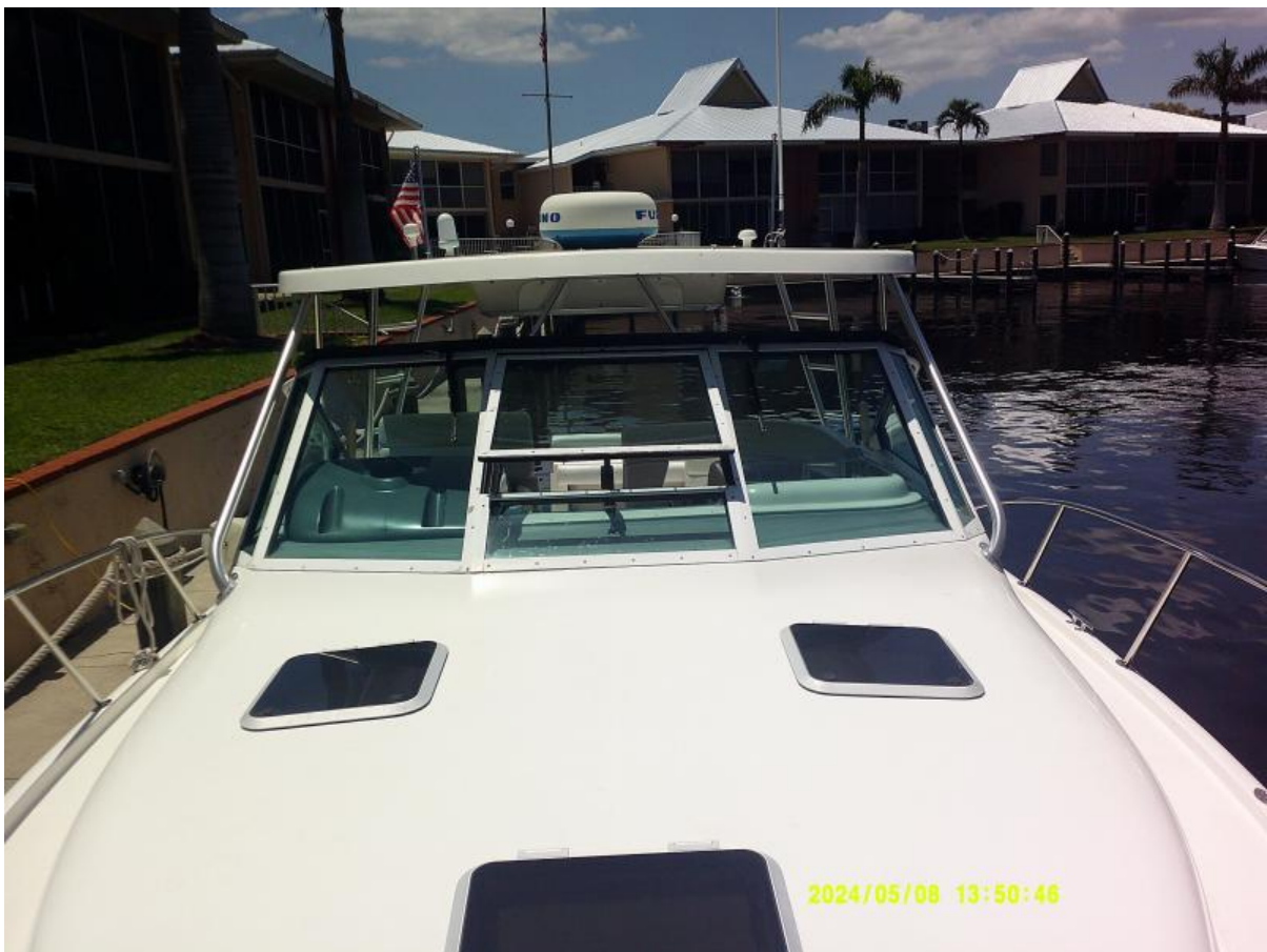
Tiara 3100 Open