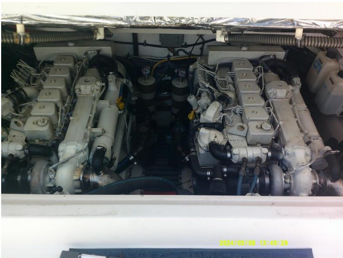
Tiara 3100 Open Engine Room