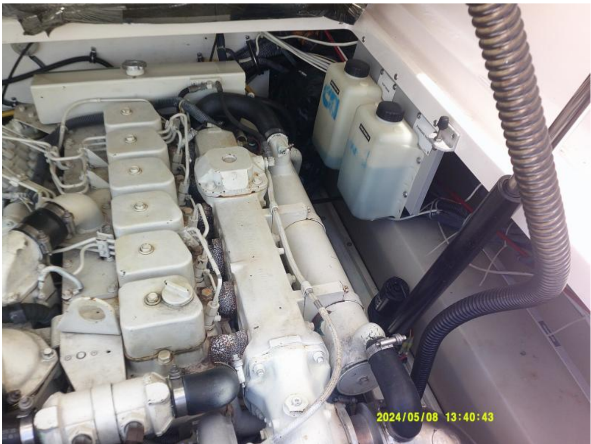
Tiara 3100 Open Starboard - Cummins 6BTA 5.9 Diesels