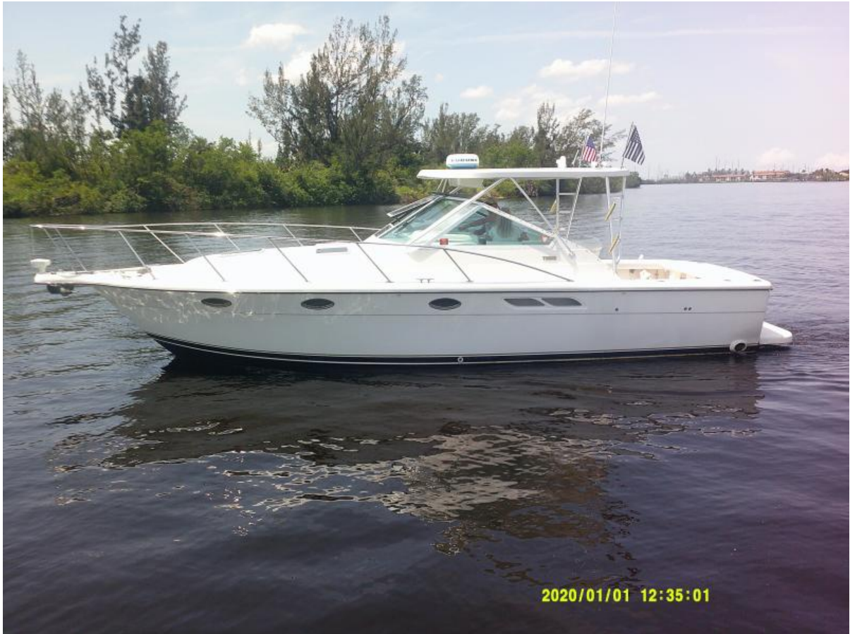
Tiara 3100 Open