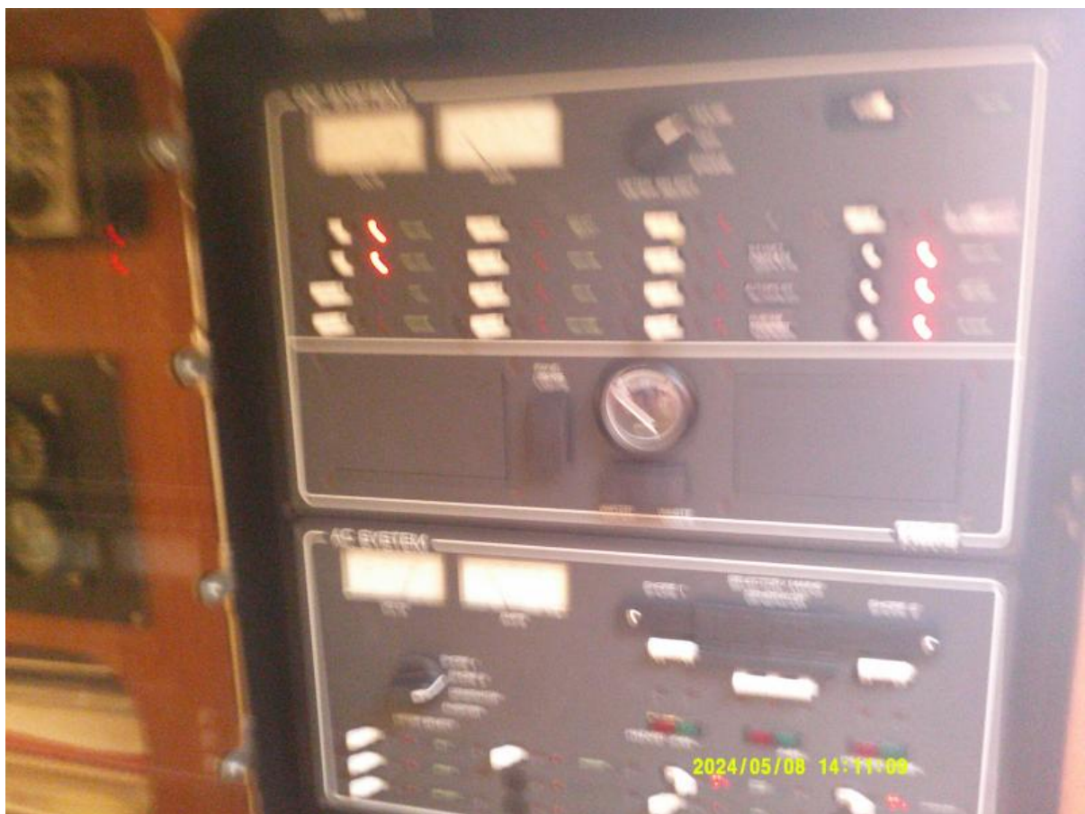
Tiara 3100 Open AC & DC Panels