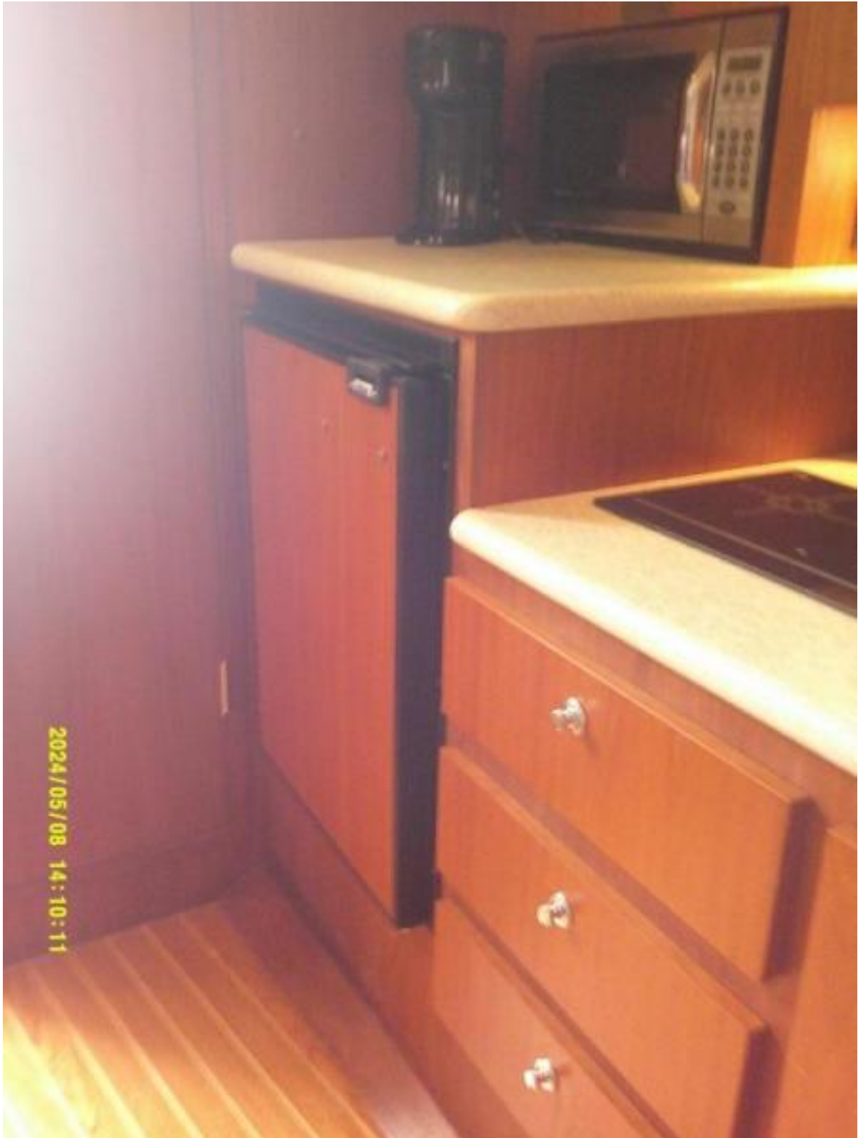
Tiara 3100 Open Galley