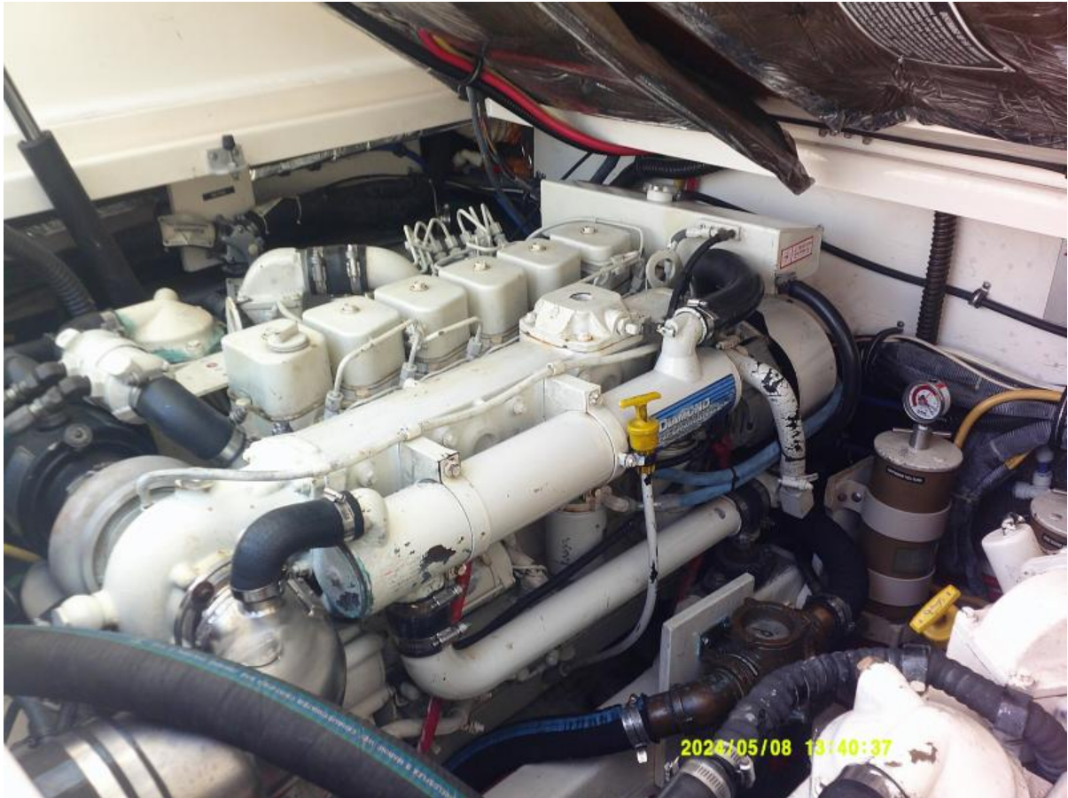
Tiara 3100 Open Port Engine - Cummins 6BTA 5.9 Diesels