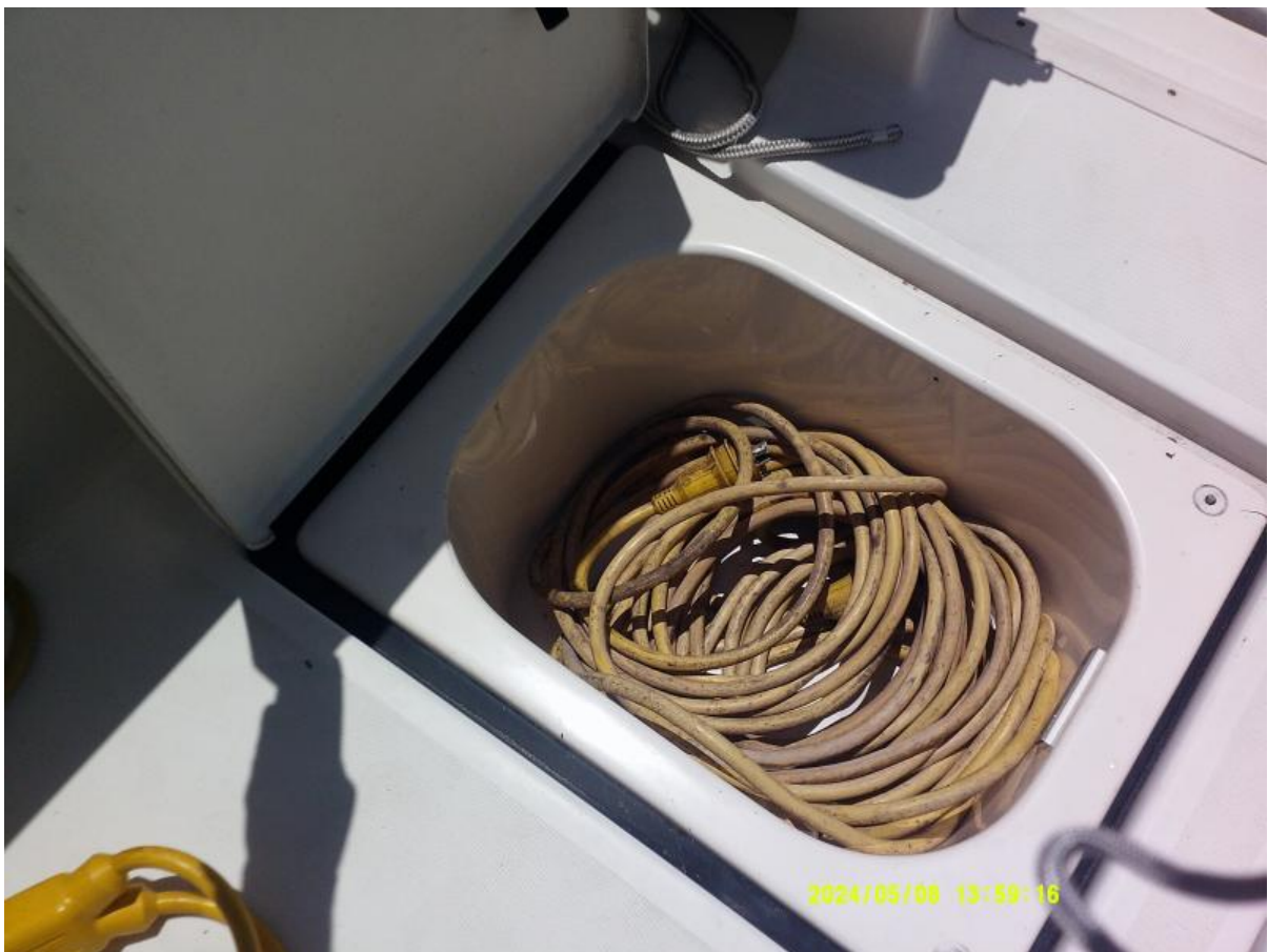
Tiara 3100 Open Sole - Storage