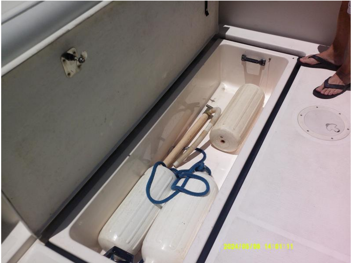
Tiara 3100 Open Sole - Large Fishbox