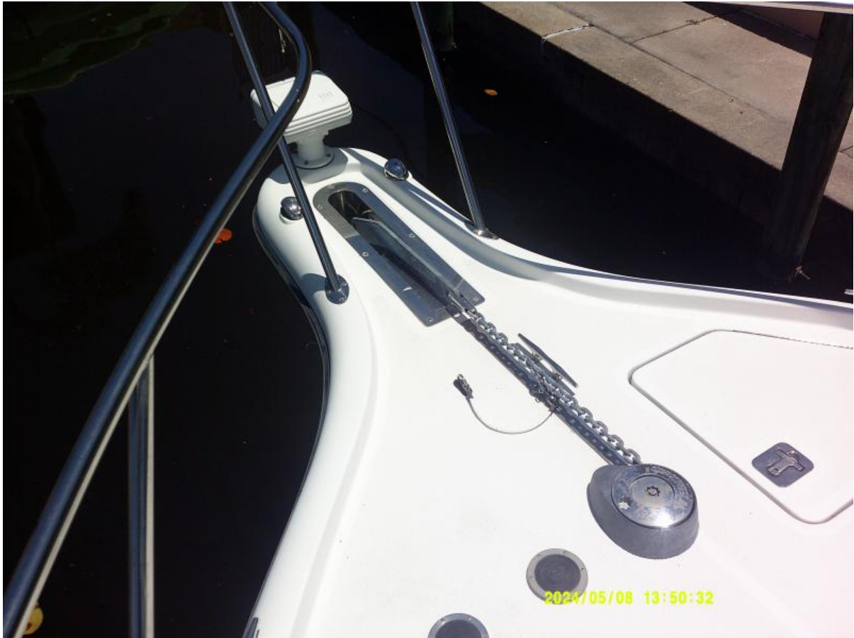
Tiara 3100 Open Anchor Windlass w/foot controls