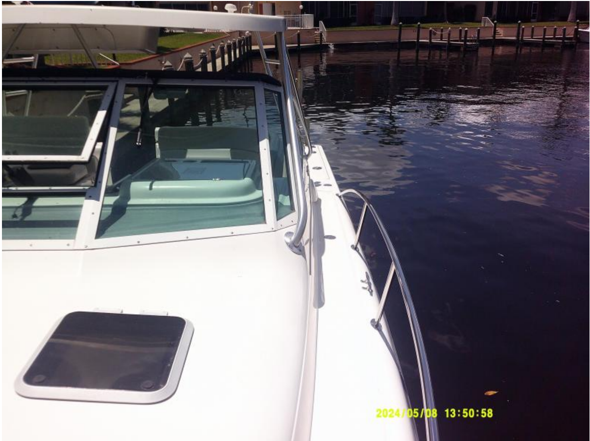
Tiara 3100 Open