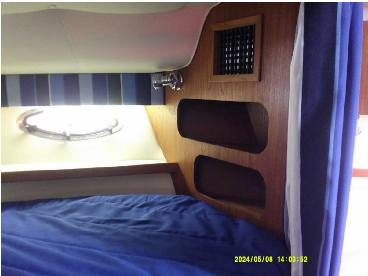
Tiara 3100 Open Berth - Additional Storage