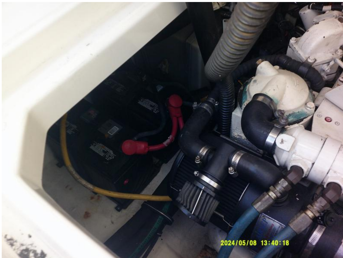
Tiara 3100 Open Batteries