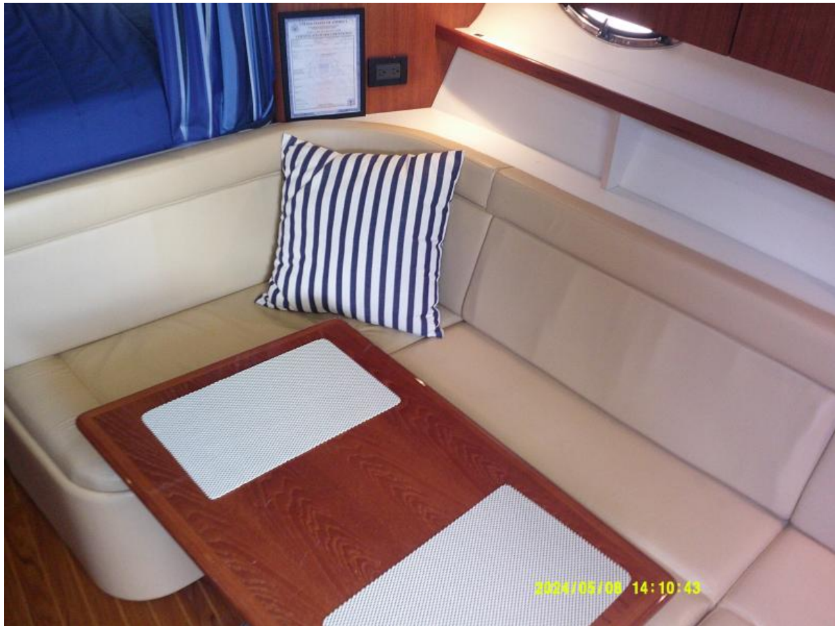
Tiara 3100 Open Settee w/ Tiara Wood Table