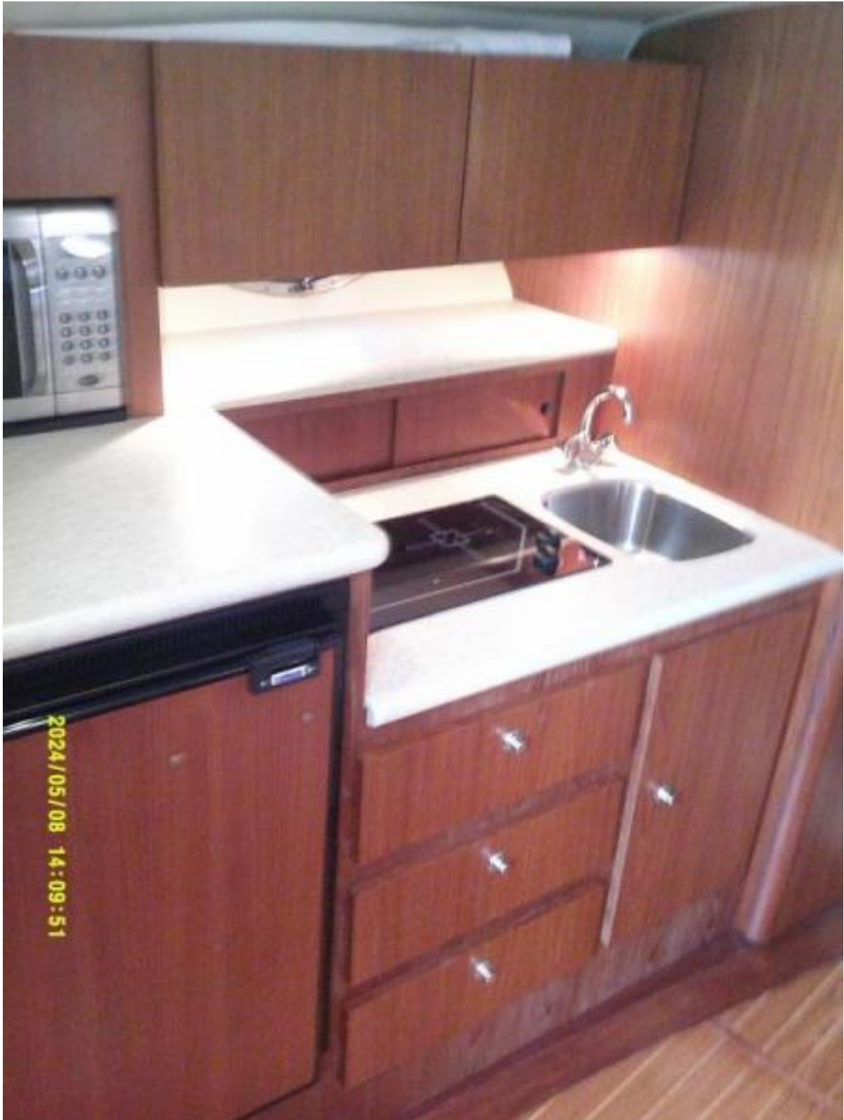
Tiara 3100 Open Galley