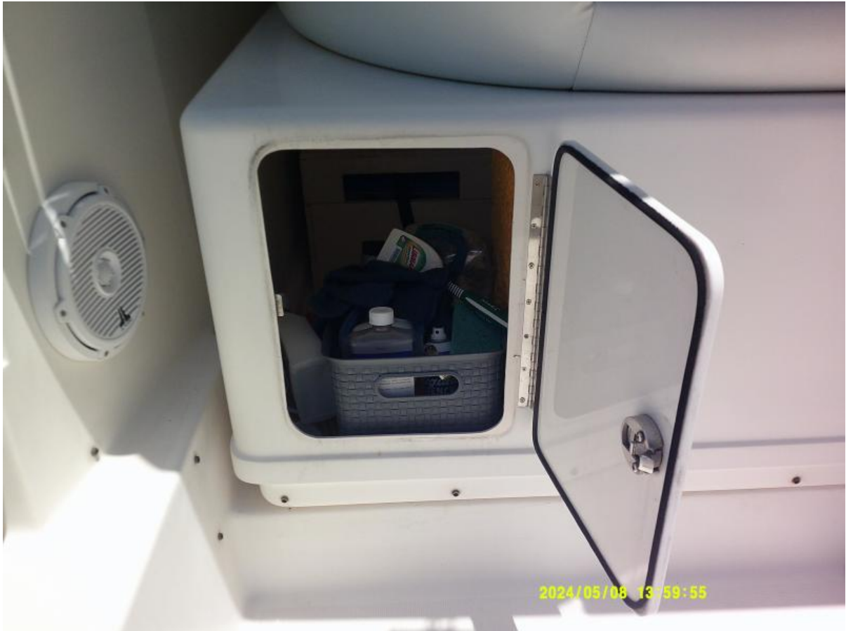
Tiara 3100 Open Cockpit Area Storage