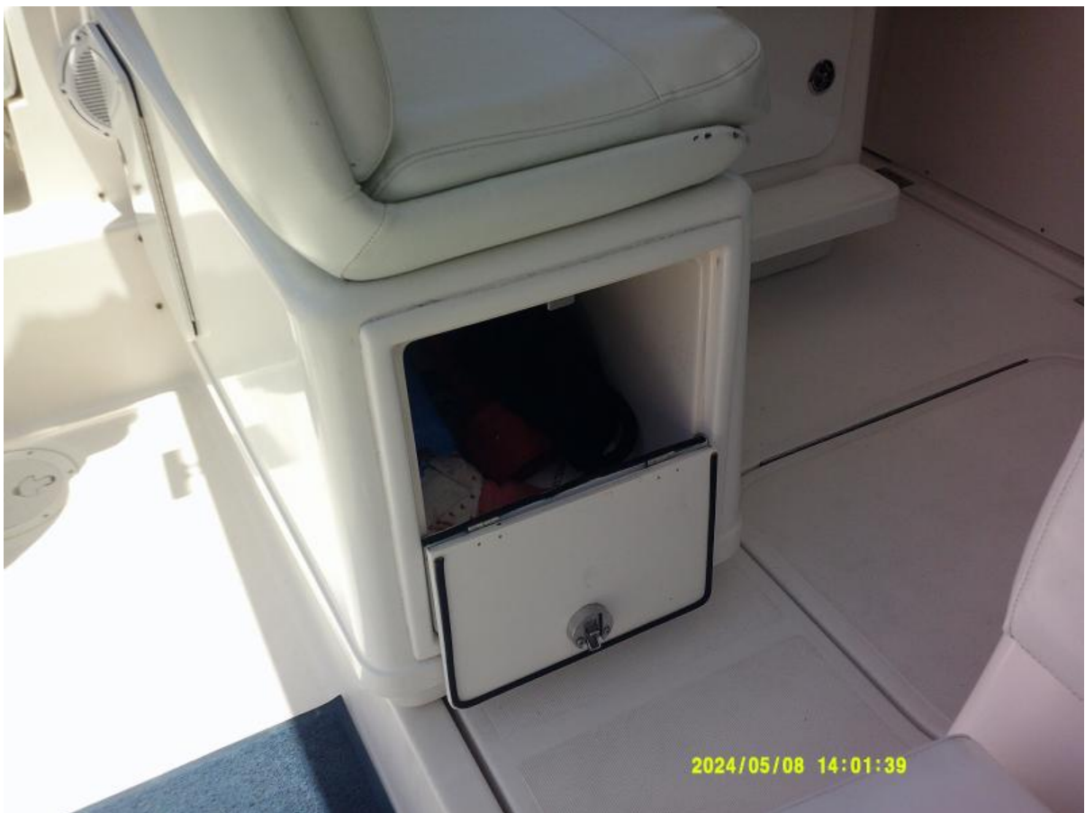
Tiara 3100 Open Cockpit Area Storage