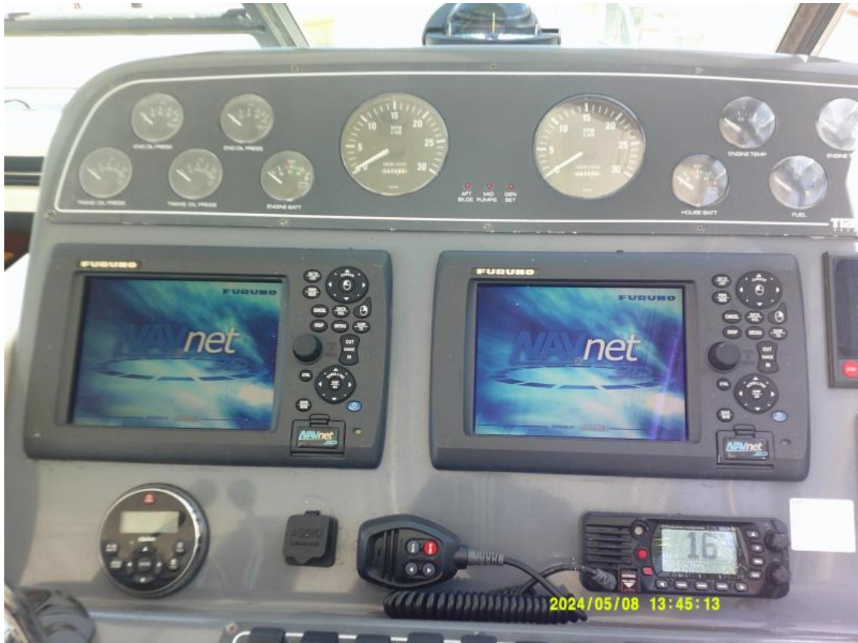
Tiara 3100 Open Helm w/ full complement of electronics