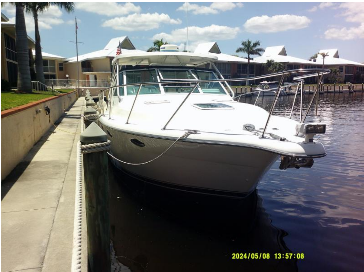
Tiara 3100 Open