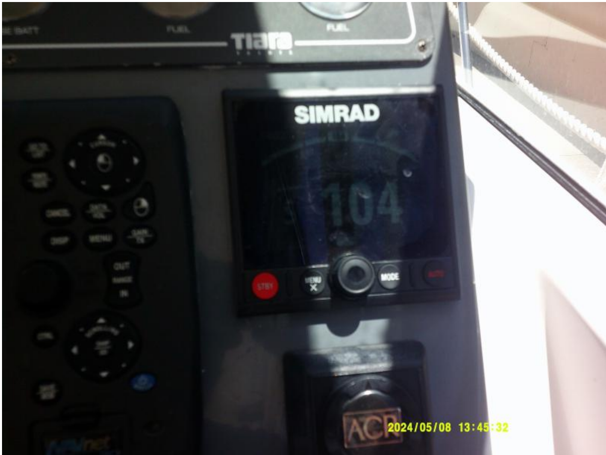
Tiara 3100 Open Newer Simrad Auto Pilot