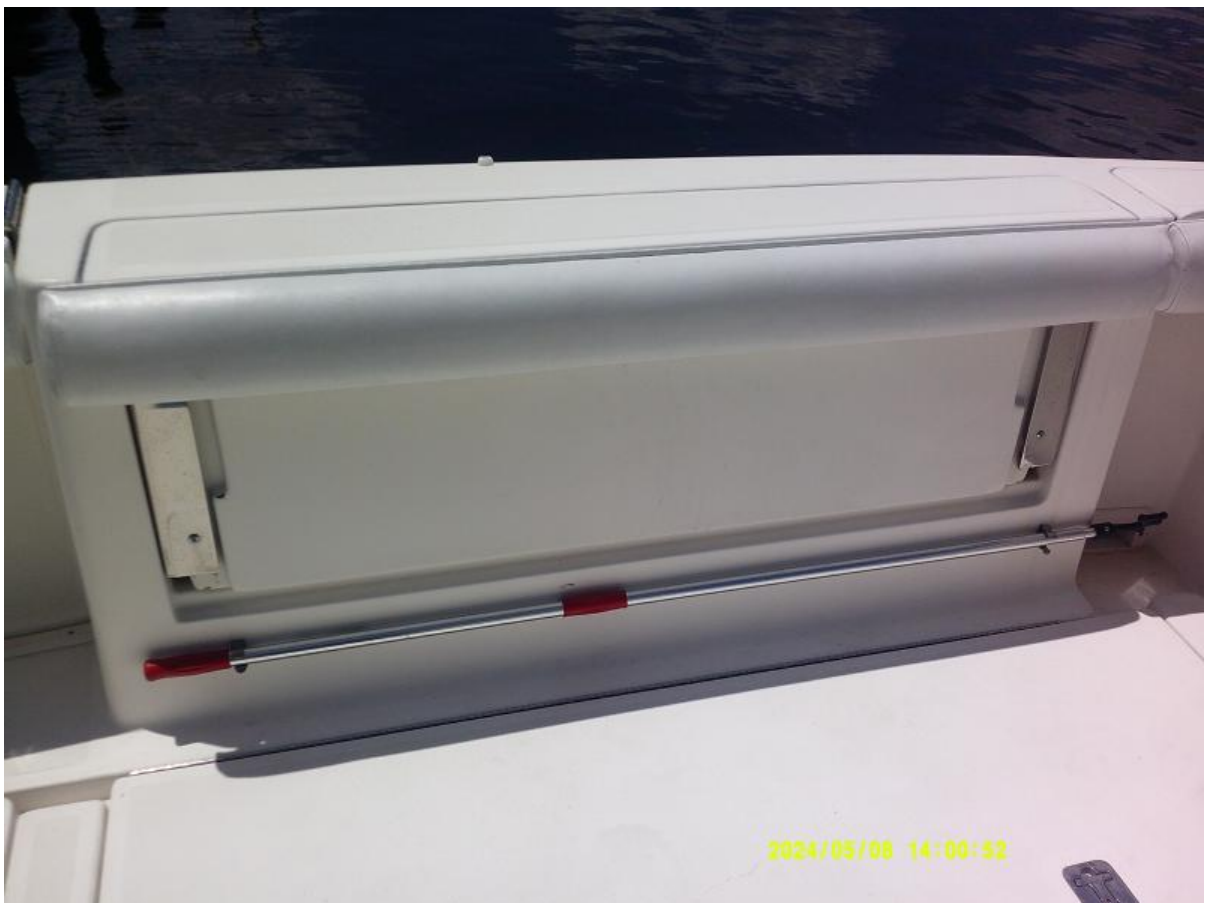
Tiara 3100 Open Cockpit Folding Seat - Up