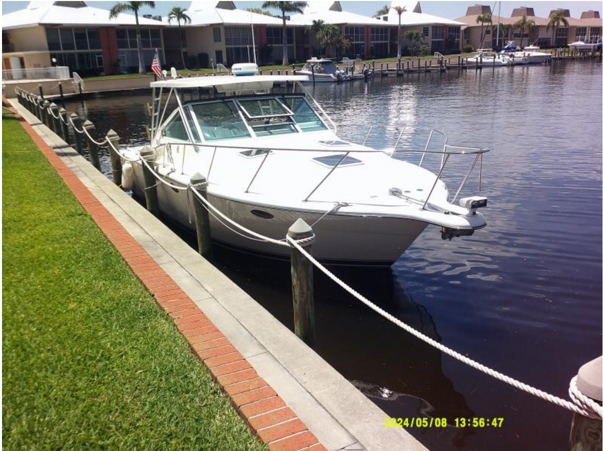
Tiara 3100 Open