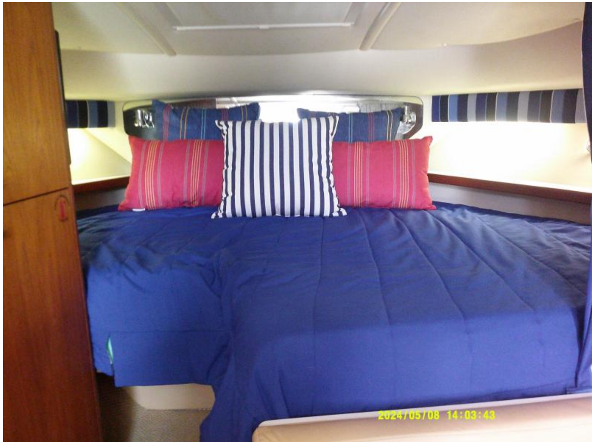
Tiara 3100 Open Oversized Double Berth