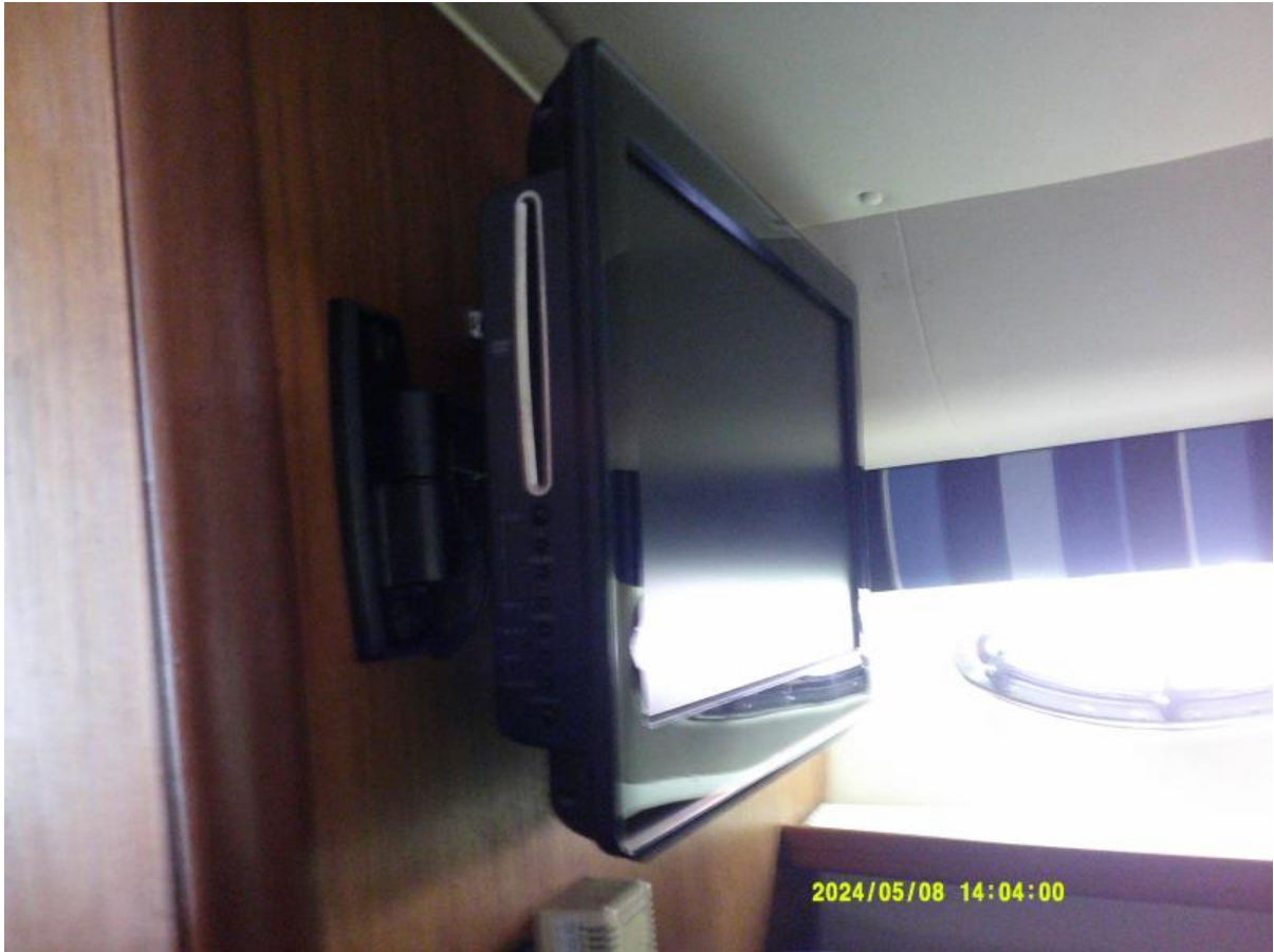
Tiara 3100 Open TV Swivels to service Berth & Salon