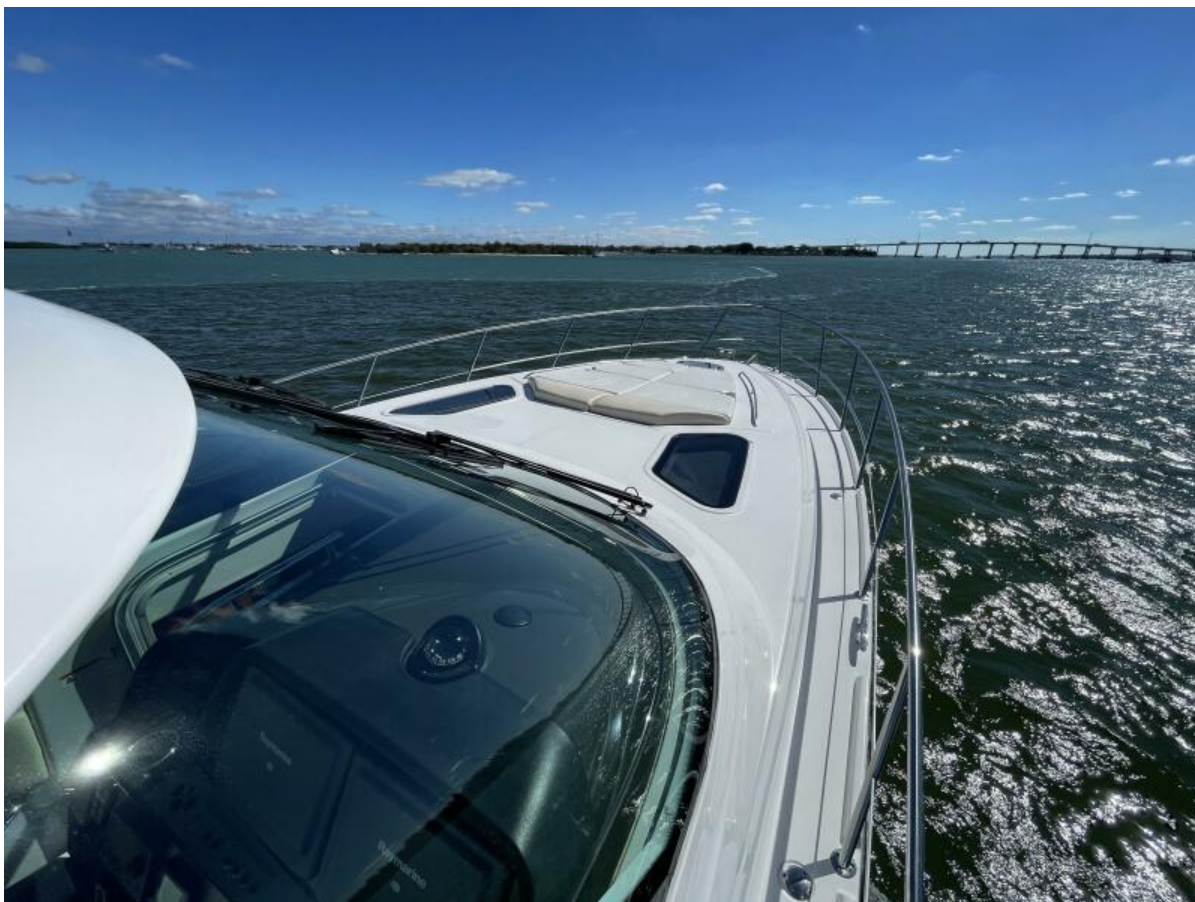
2008 50 Four Winns V458 'Island Girl'