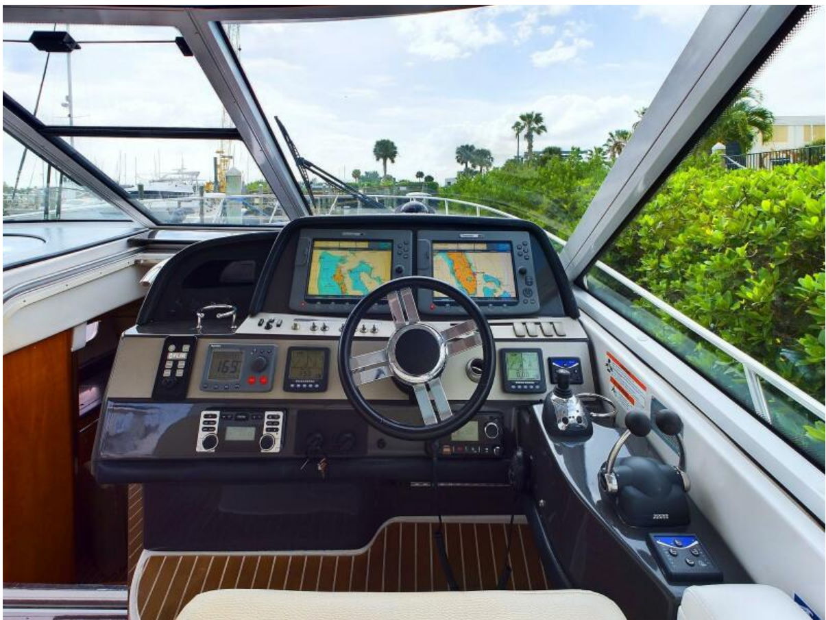
2008 50 Four Winns V458 'Island Girl' Helm