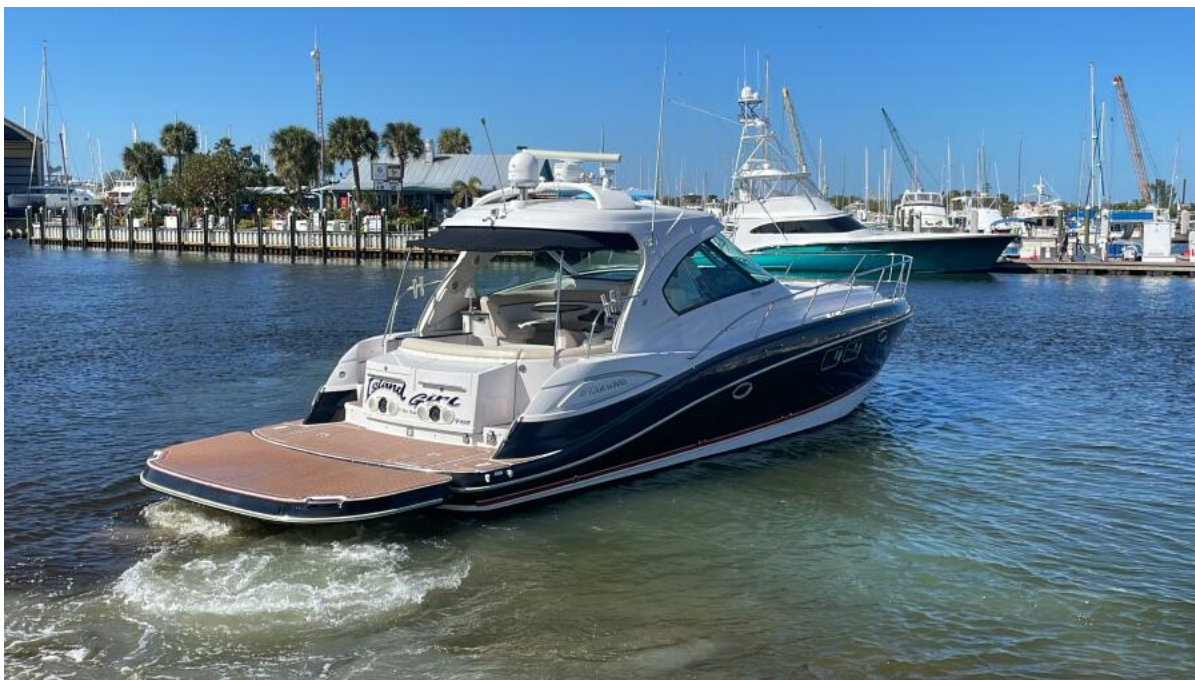
2008 50 Four Winns V458 'Island Girl'