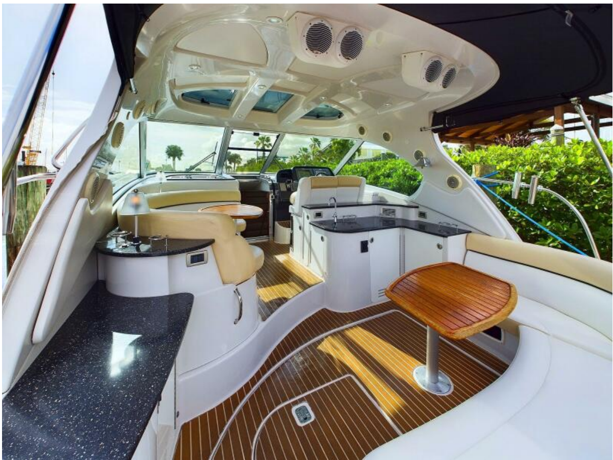
2008 50 Four Winns V458 'Island Girl'