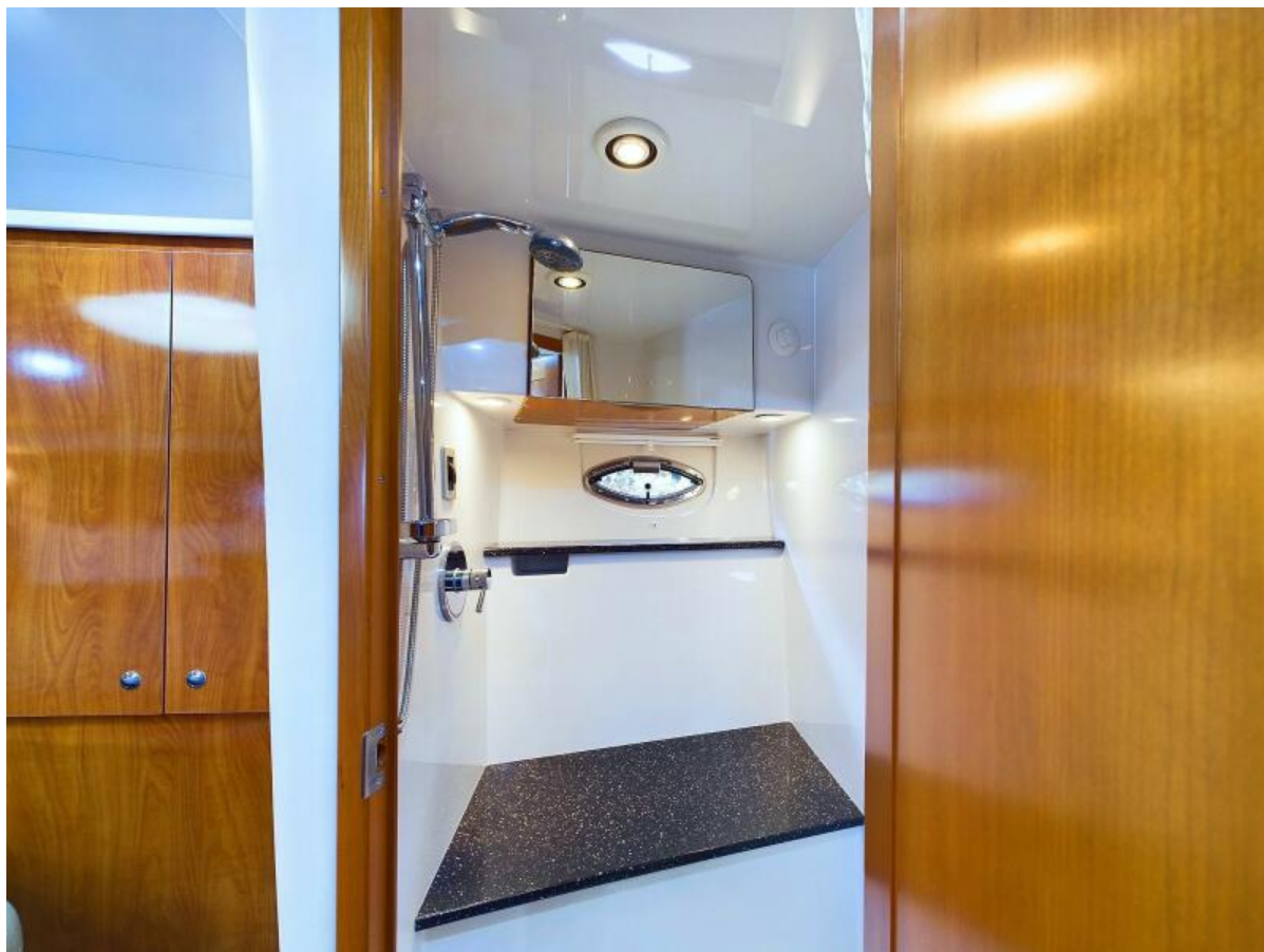
2008 50 Four Winns V458 'Island Girl'