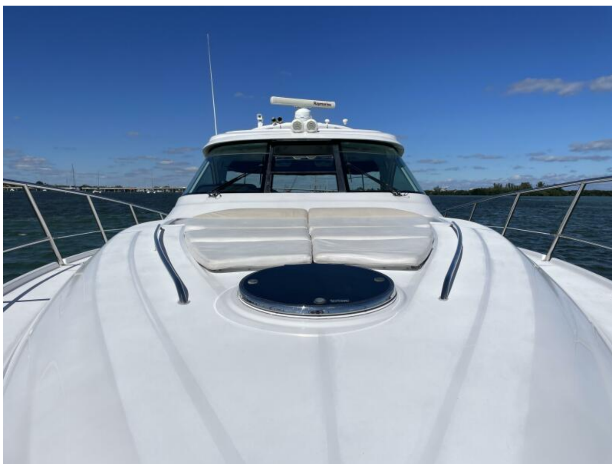
2008 50 Four Winns V458 'Island Girl'