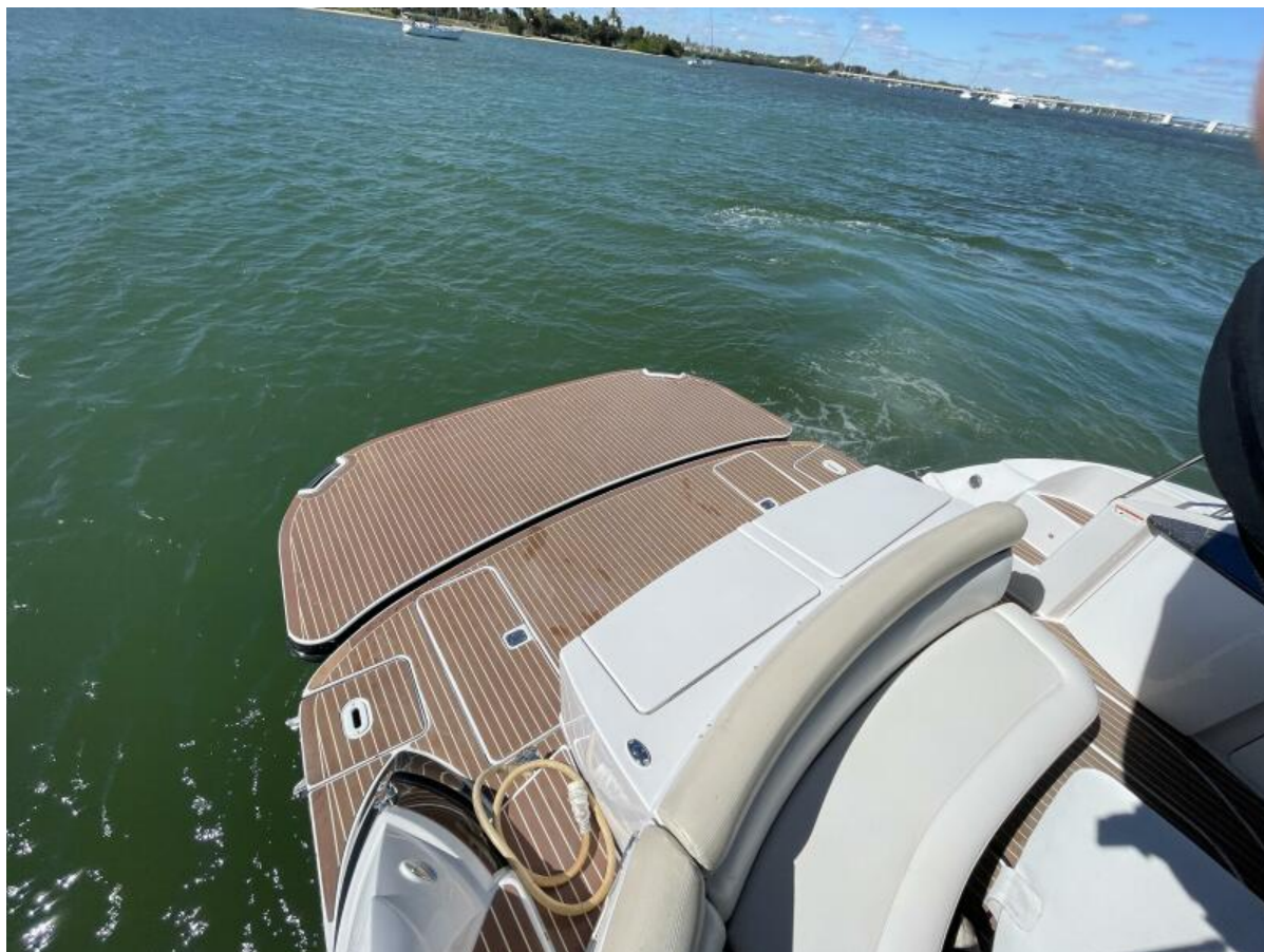
2008 50 Four Winns V458 'Island Girl'