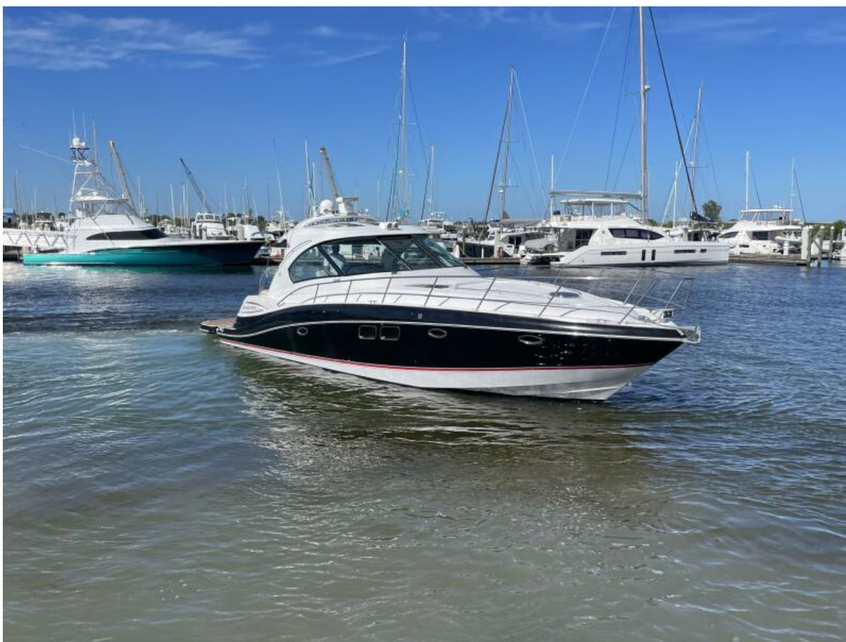
2008 50 Four Winns V458 'Island Girl'