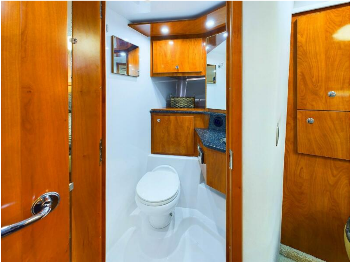
2008 50 Four Winns V458 'Island Girl'