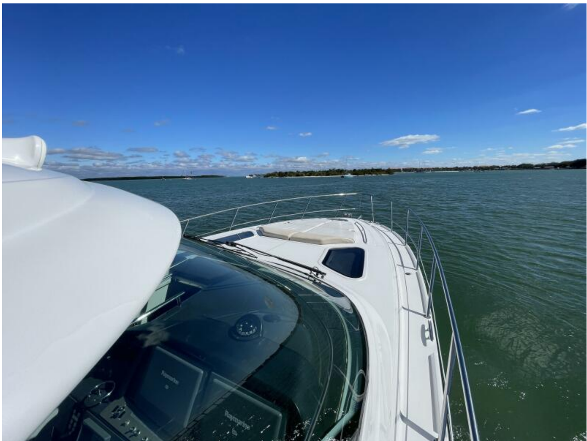
2008 50 Four Winns V458 'Island Girl'