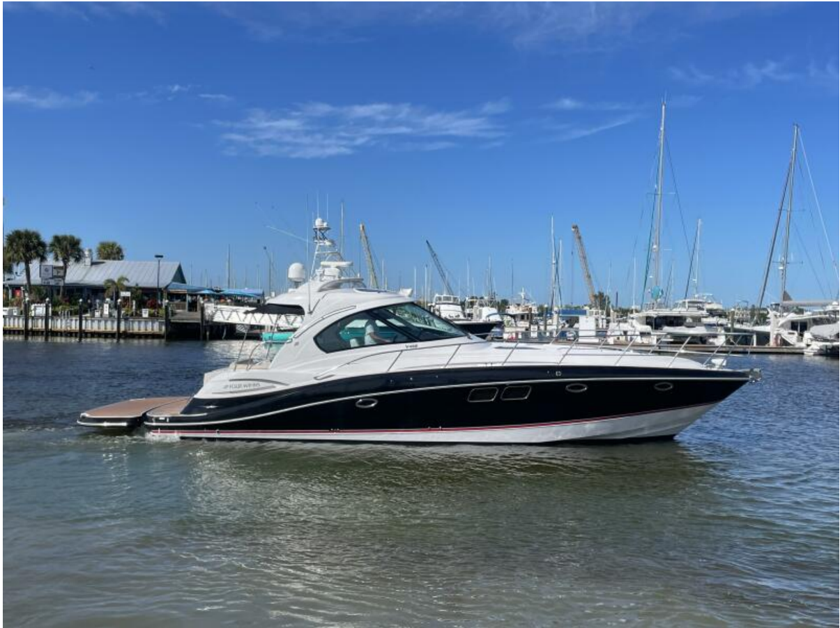
2008 50 Four Winns V458 'Island Girl' Profile