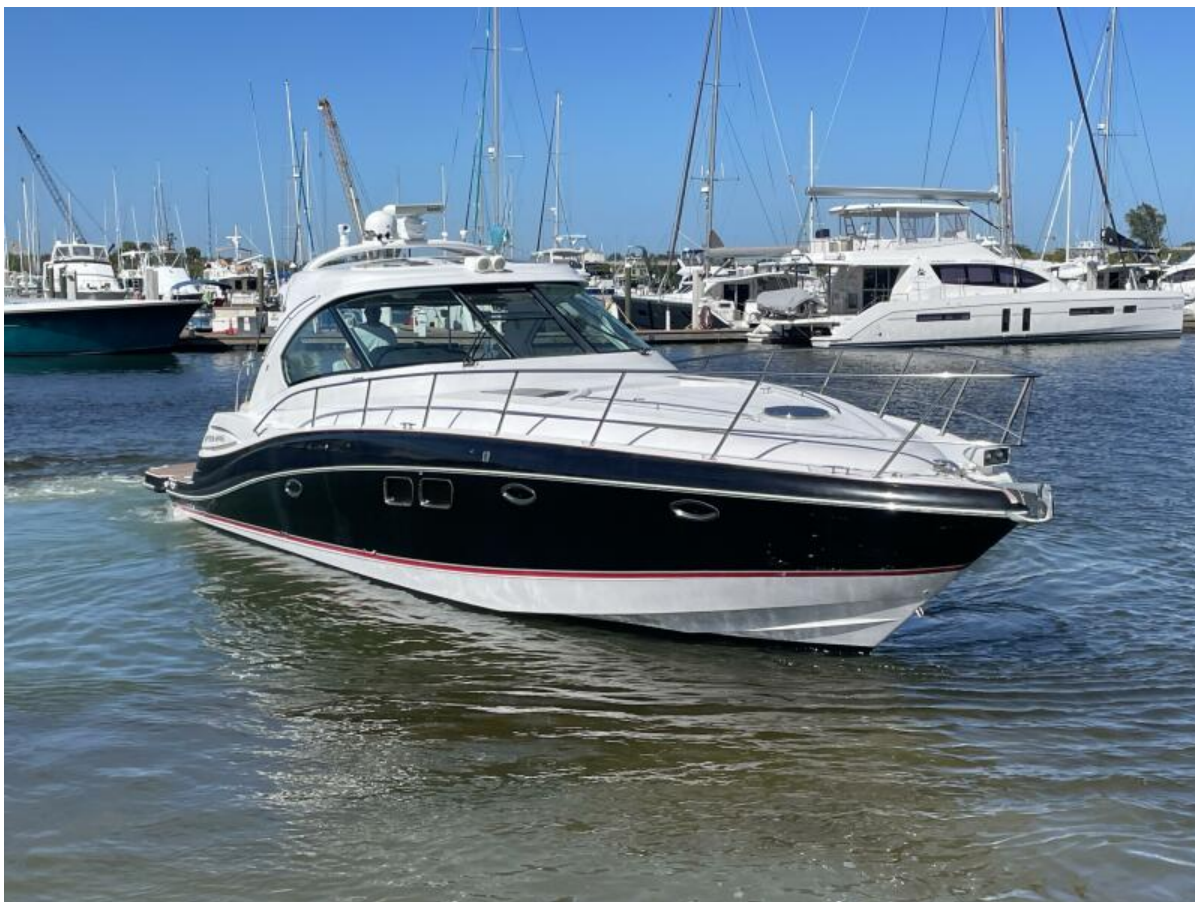
2008 50 Four Winns V458 'Island Girl'