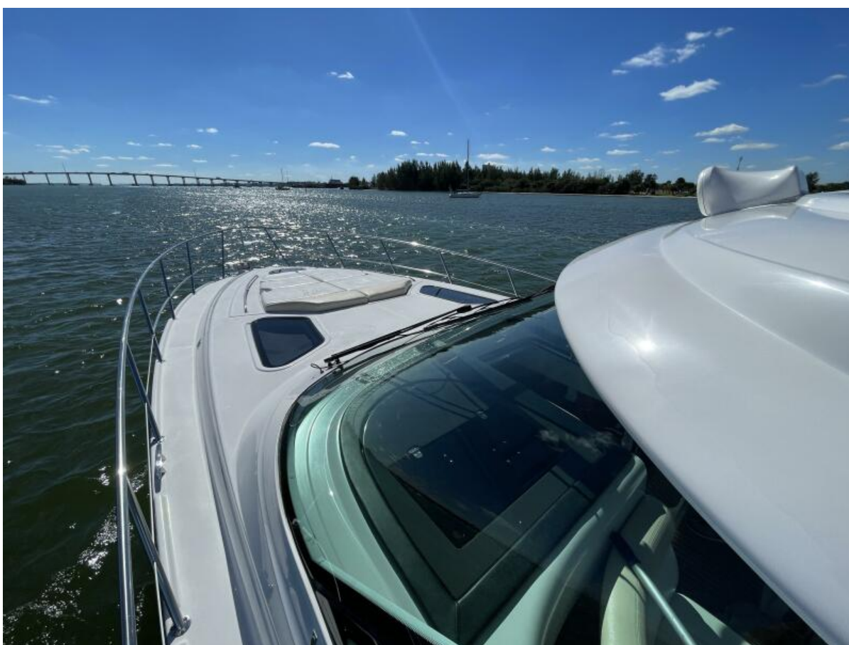
2008 50 Four Winns V458 'Island Girl'