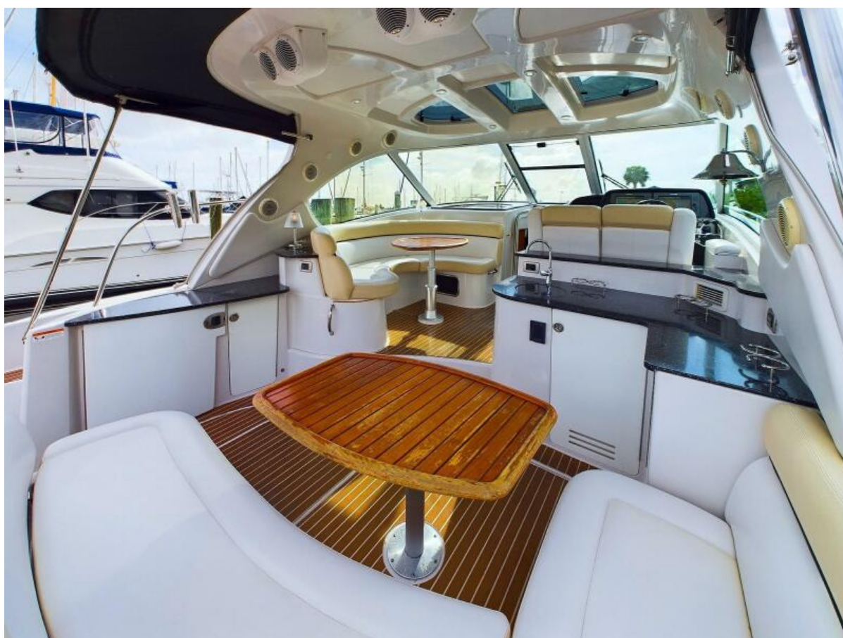
2008 50 Four Winns V458 'Island Girl' Salon