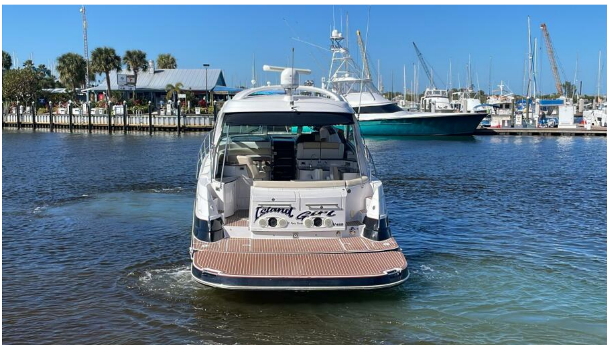
2008 50 Four Winns V458 'Island Girl'