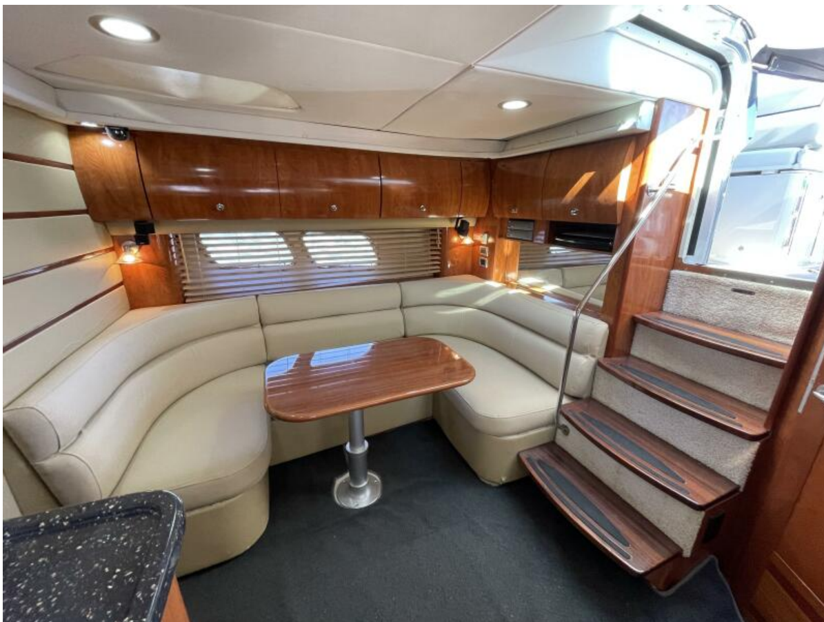
2008 50 Four Winns V458 'Island Girl' Dinette