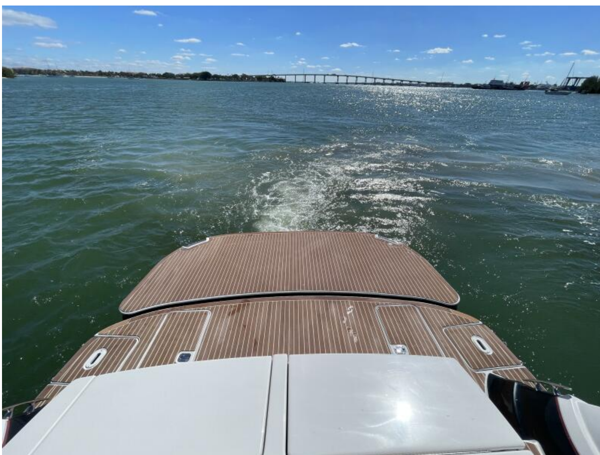
2008 50 Four Winns V458 'Island Girl'