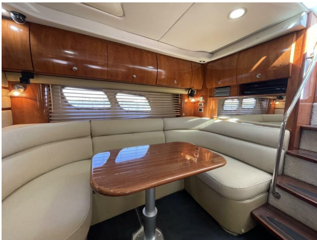
2008 50 Four Winns V458 'Island Girl'