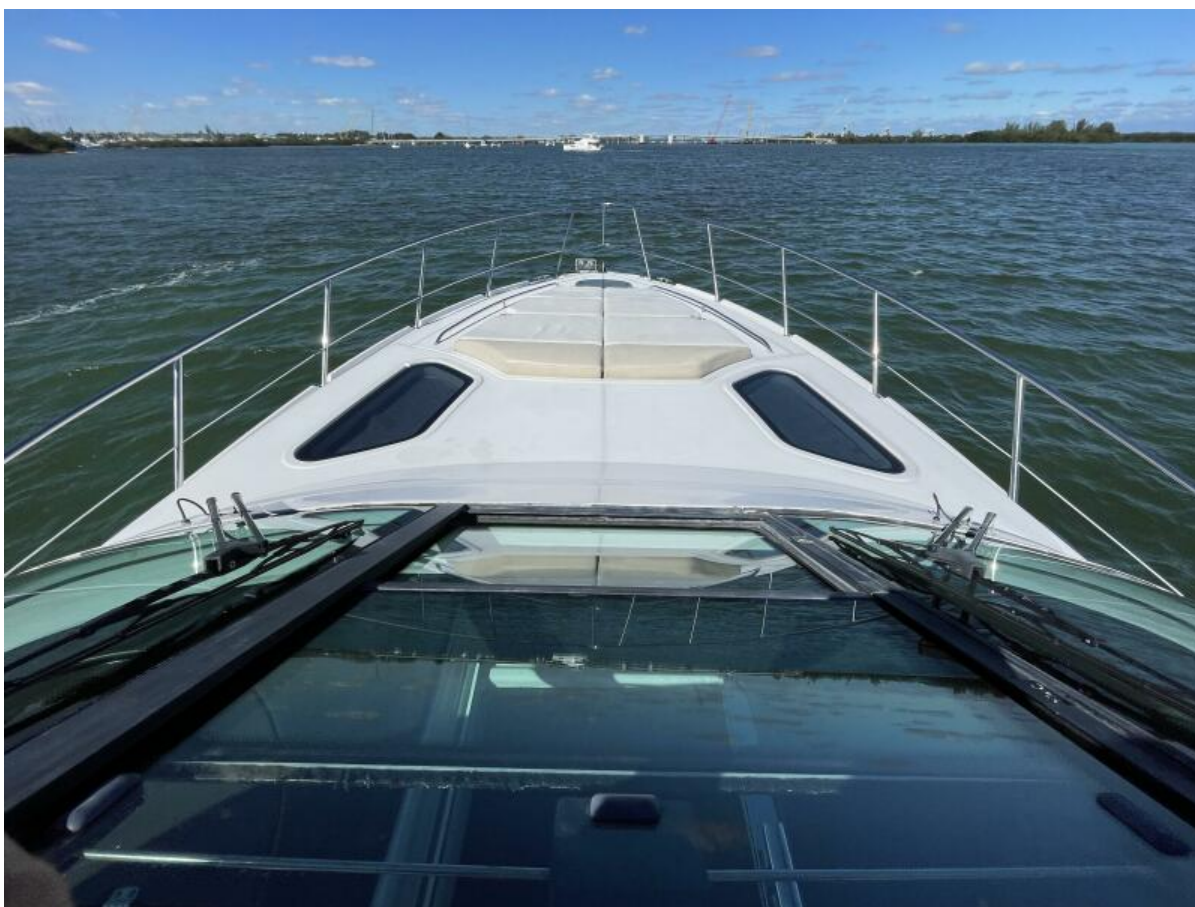
2008 50 Four Winns V458 'Island Girl'