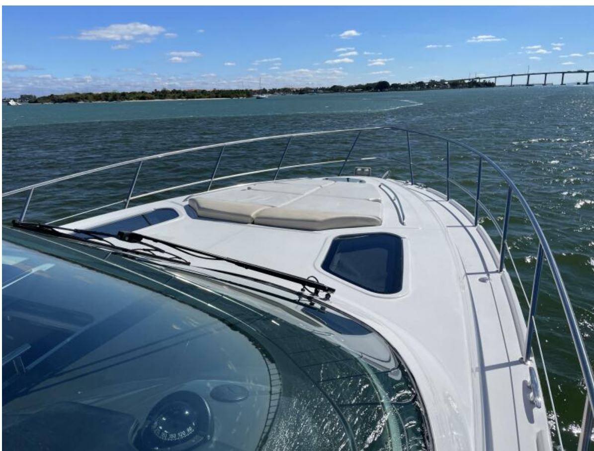
2008 50 Four Winns V458 'Island Girl'