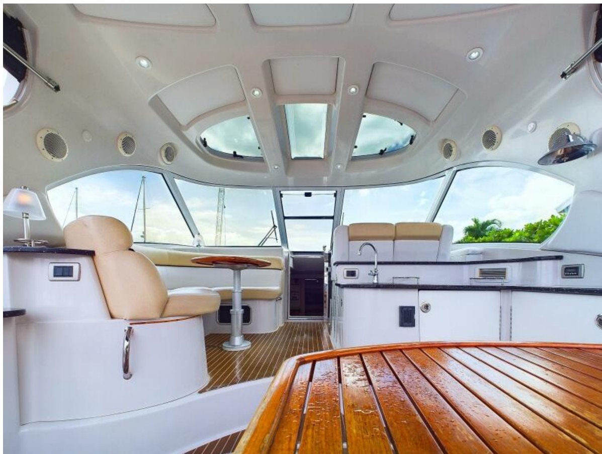
2008 50 Four Winns V458 'Island Girl' Salon