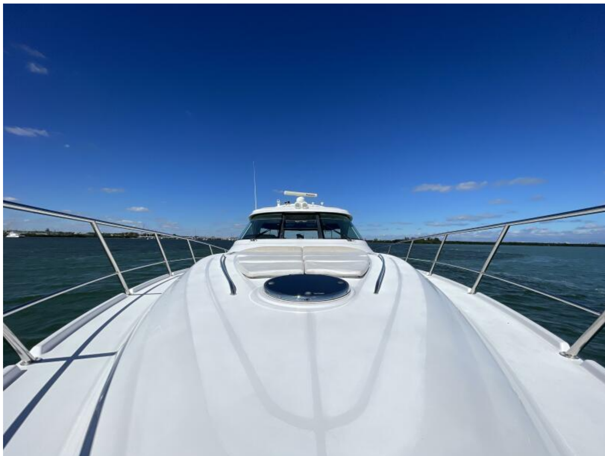
2008 50 Four Winns V458 'Island Girl'