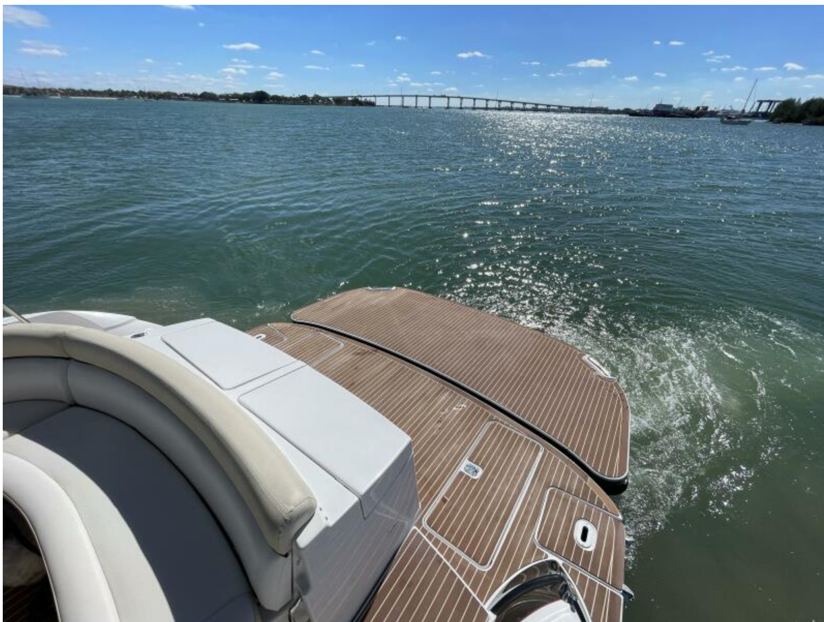
2008 50 Four Winns V458 'Island Girl'