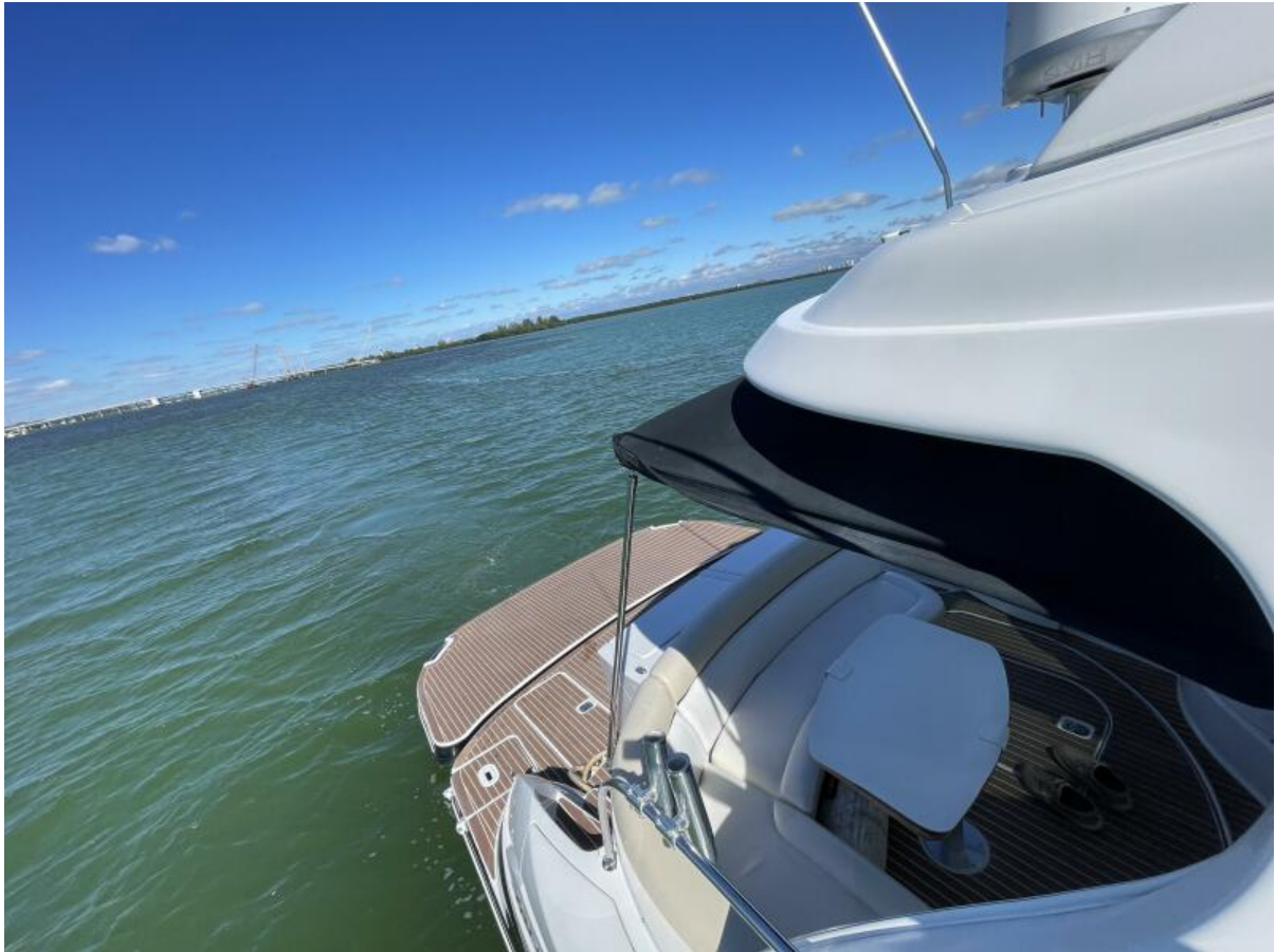
2008 50 Four Winns V458 'Island Girl'