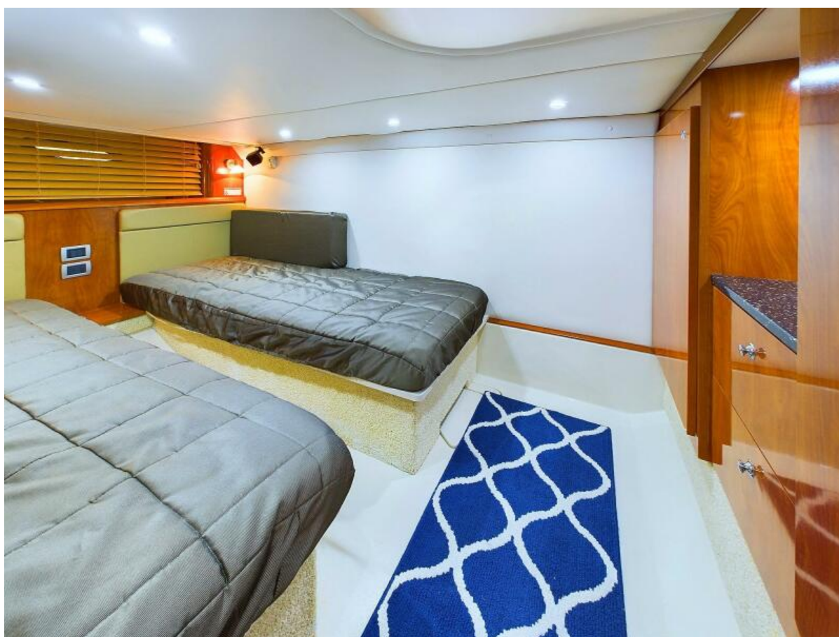
2008 50 Four Winns V458 'Island Girl'