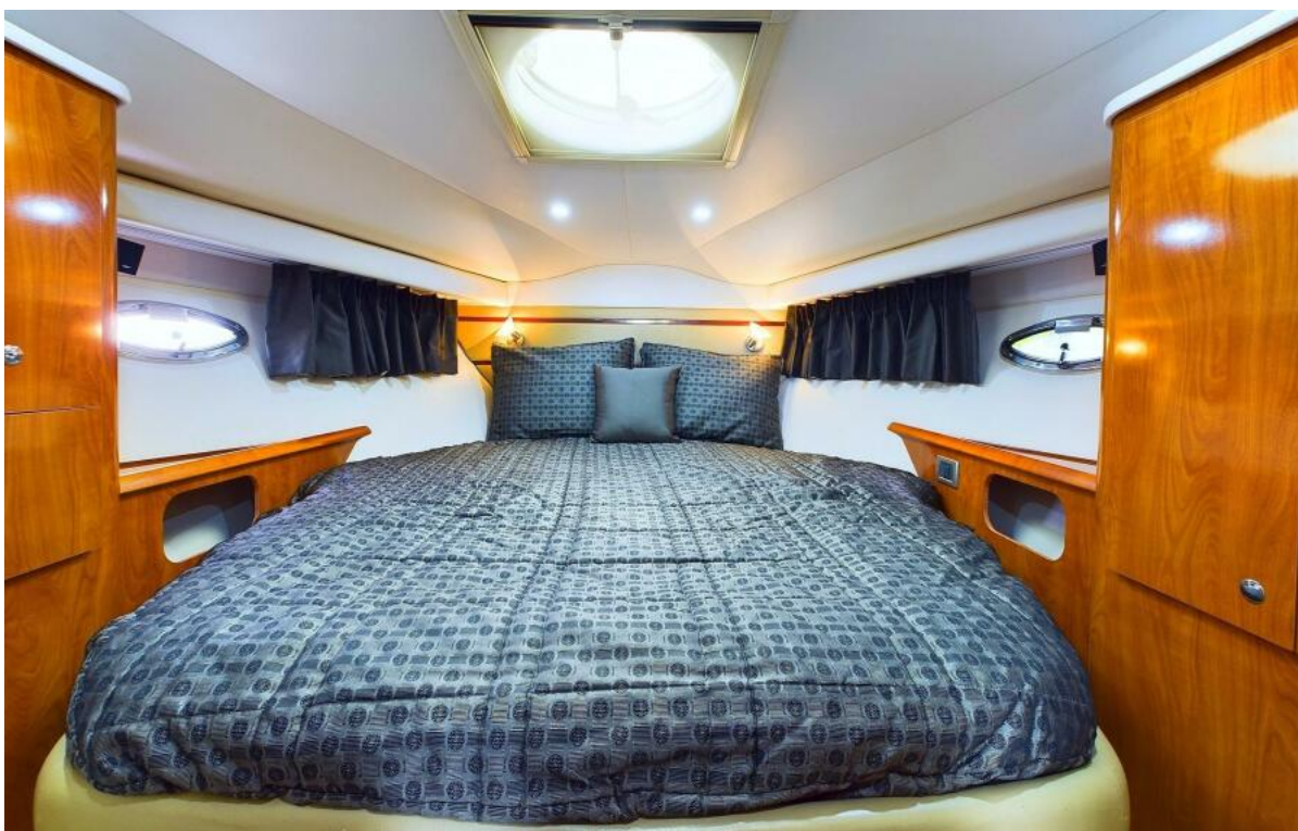
2008 50 Four Winns V458 'Island Girl' Master Stateroom