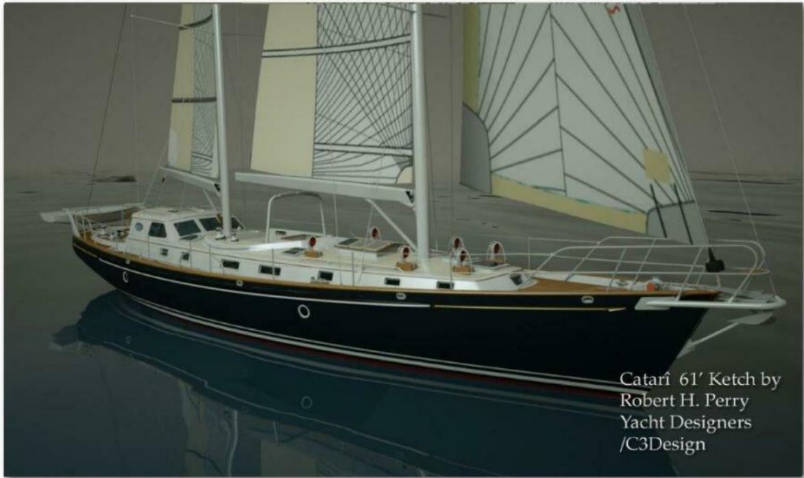
Catari 61' Ketch by Robert H. Perry Yacht Designers /C3Design