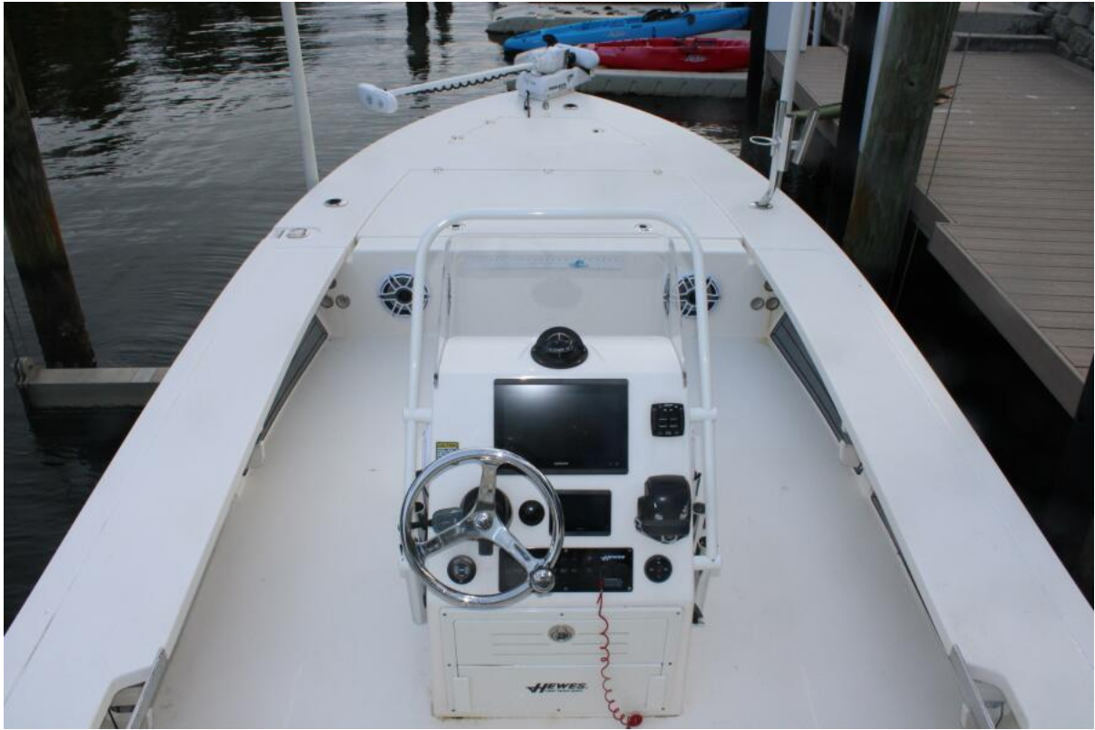
Center Console looking forward