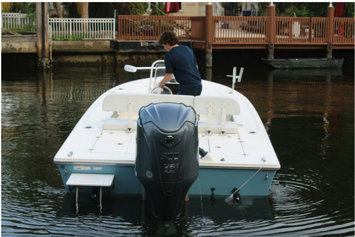
Stern in Water