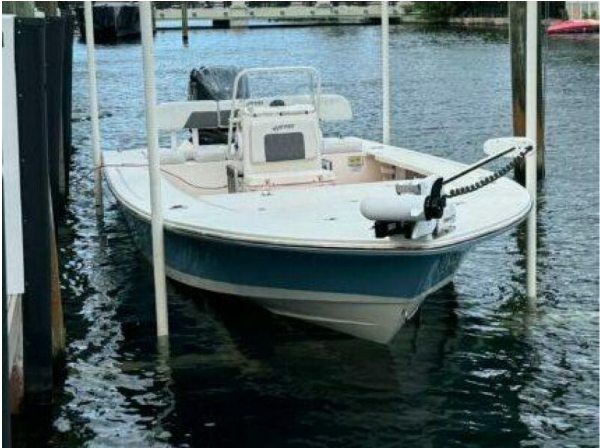
On lift in water