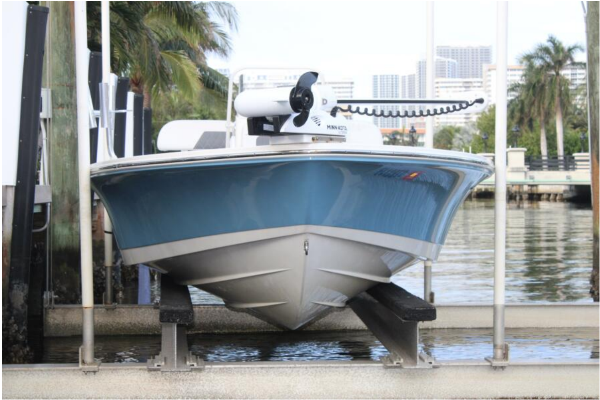
Bow out of water