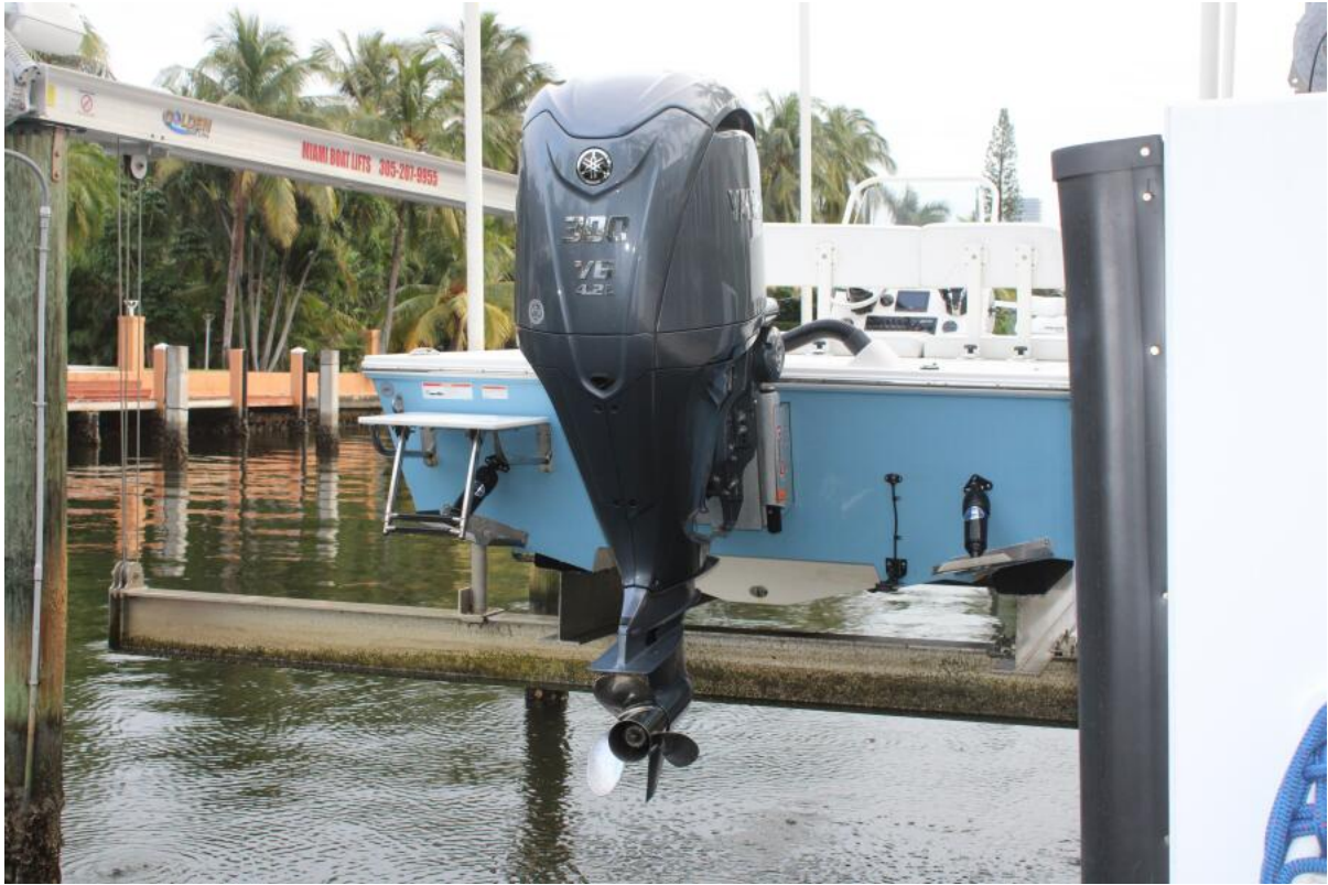
Transom out of Water