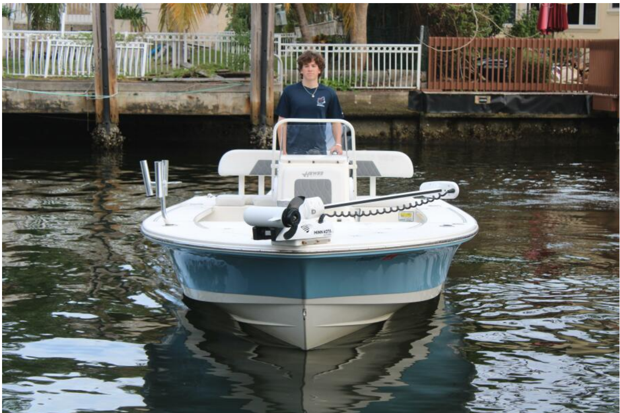
Bow in Water