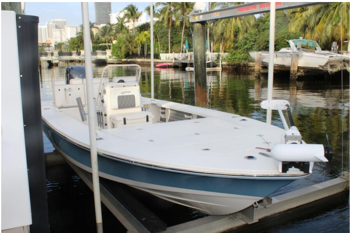
Bow and Casting Platform