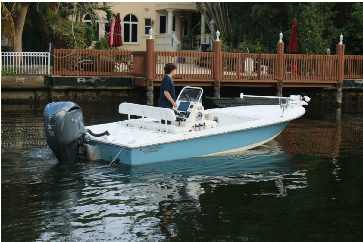
Starboard and Stern