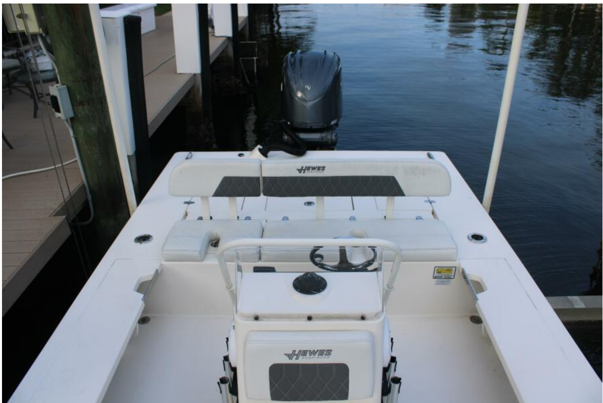
Aft Bench Seat and Cockpit