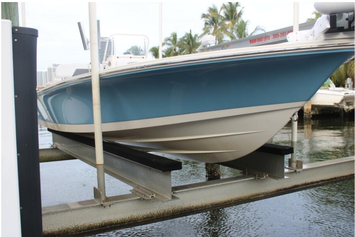
Hull and Topsides