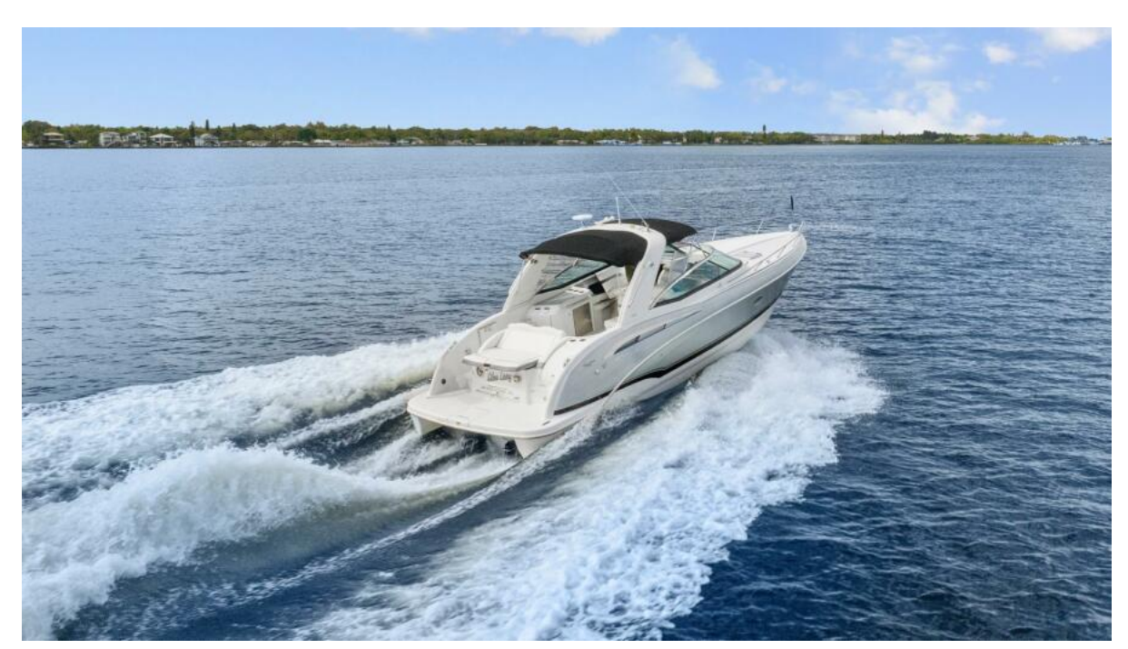
2012 Formula 350 Sun Sport For Sale