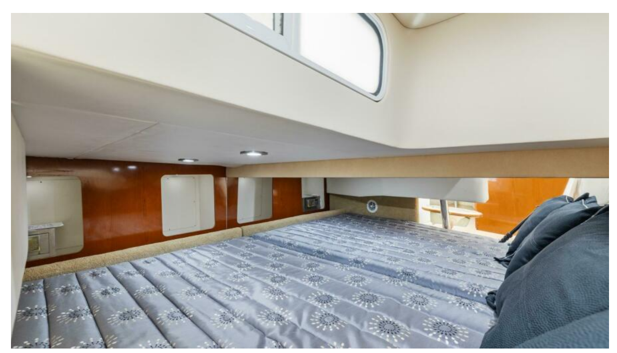
2012 Formula 350 Sun Sport For Sale