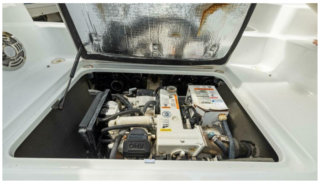
2012 Formula 350 Sun Sport For Sale