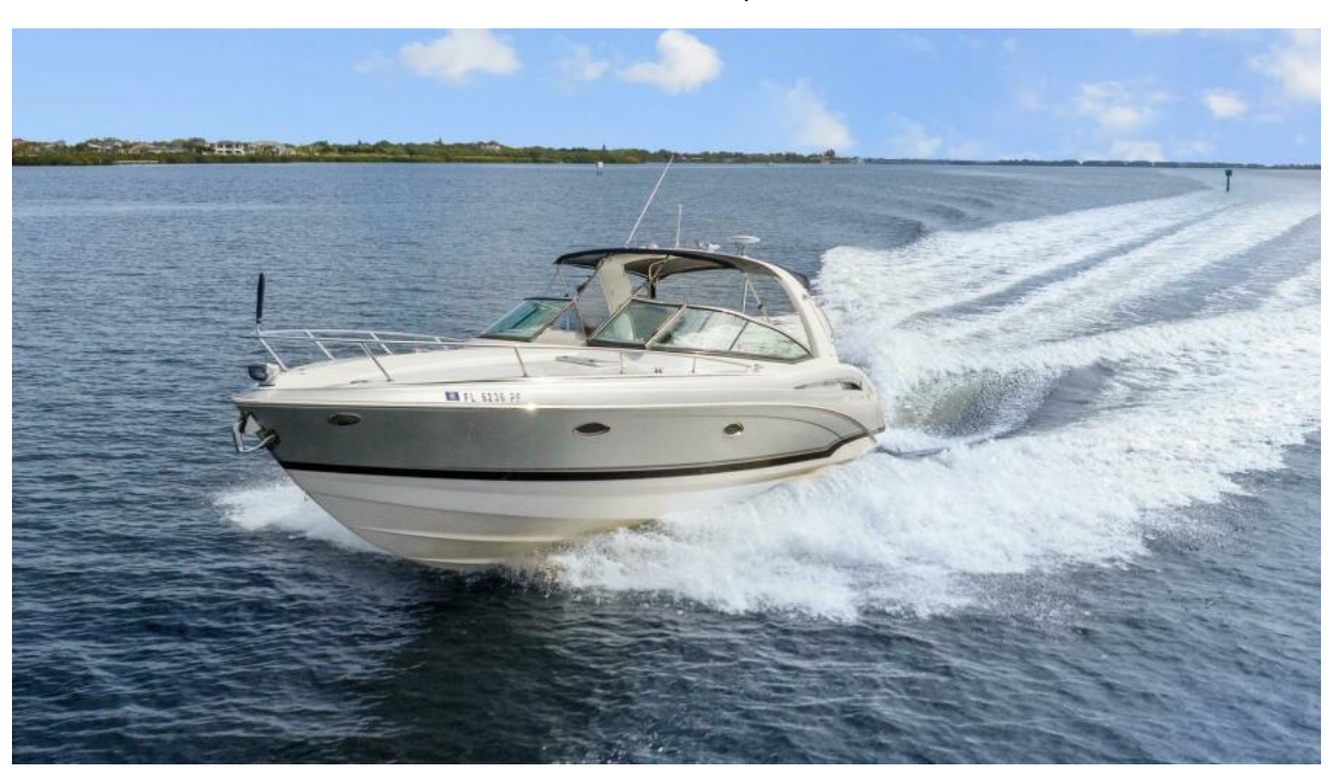
2012 Formula 350 Sun Sport For Sale