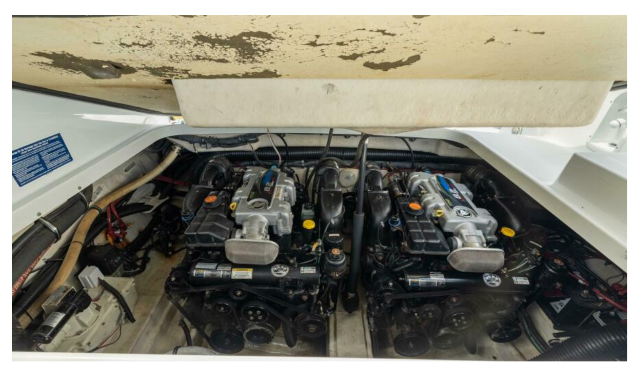
2012 Formula 350 Sun Sport For Sale