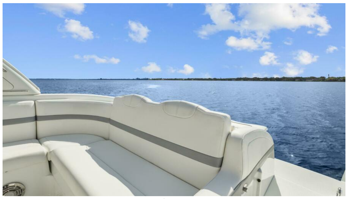
2012 Formula 350 Sun Sport