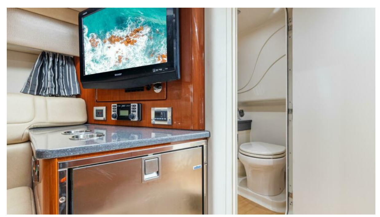
2012 Formula 350 Sun Sport