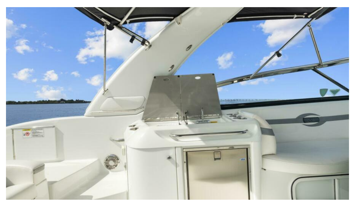
2012 Formula 350 Sun Sport