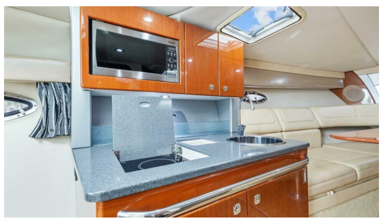
2012 Formula 350 Sun Sport For Sale