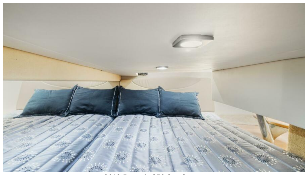
2012 Formula 350 Sun Sport