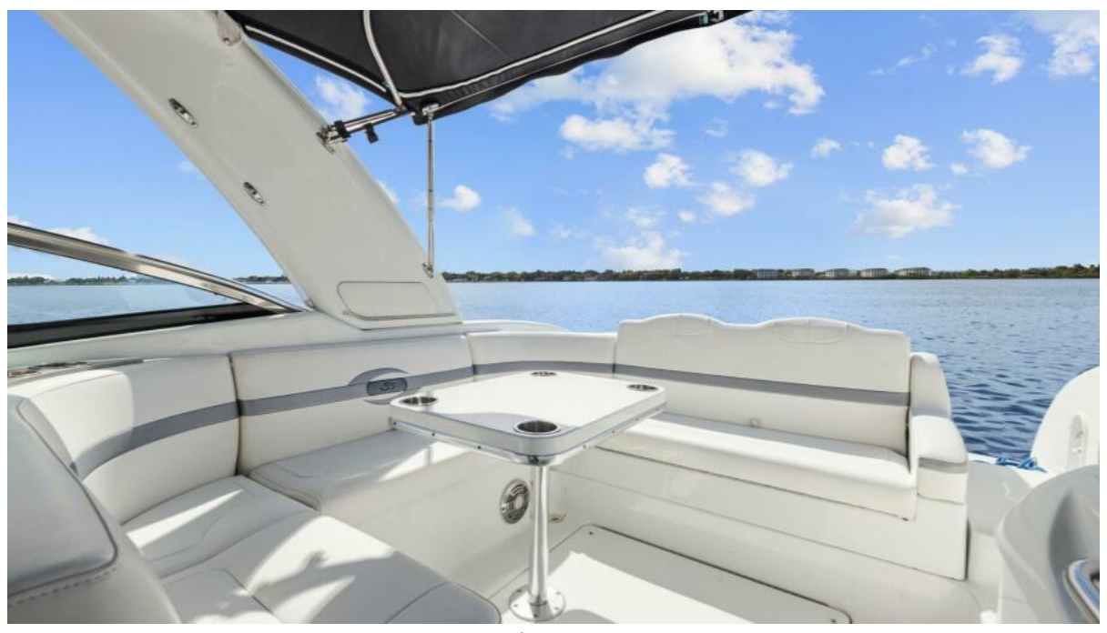
2012 Formula 350 Sun Sport