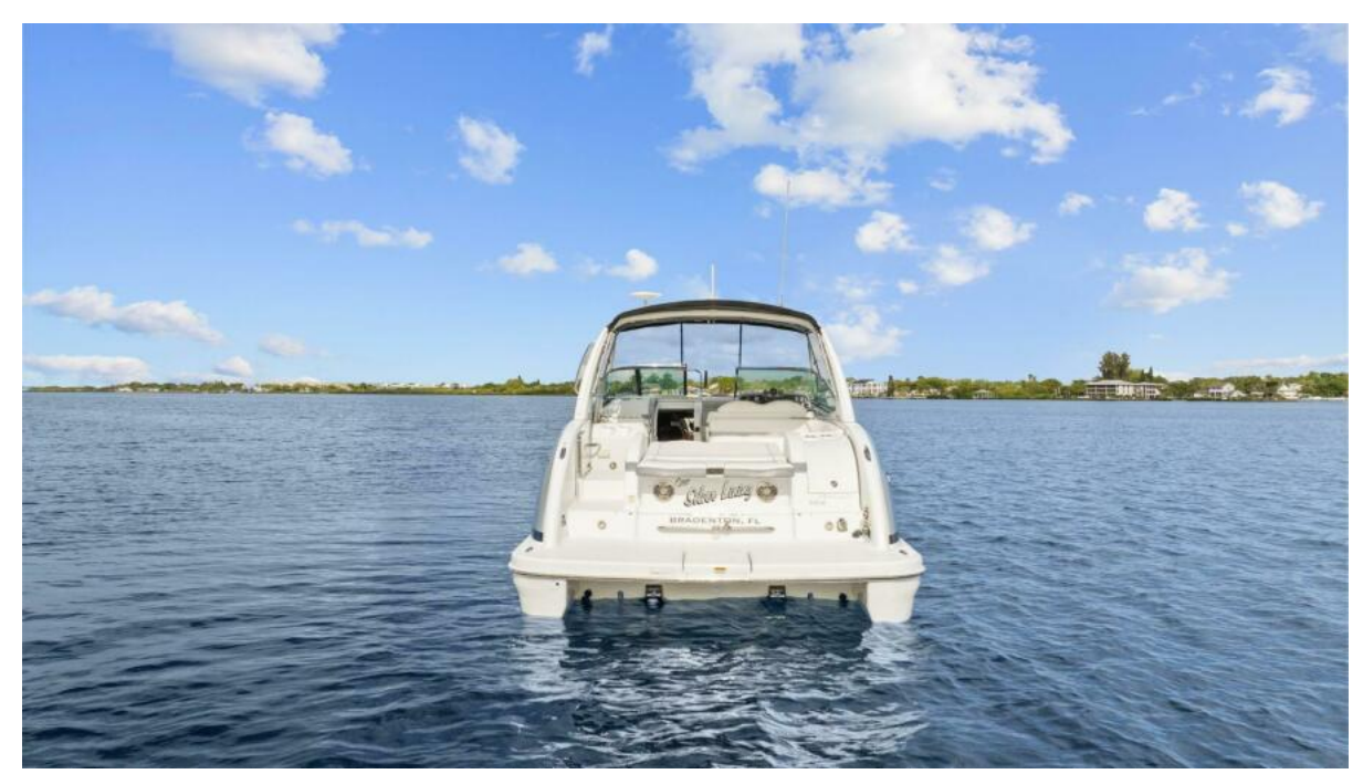
2012 Formula 350 Sun Sport