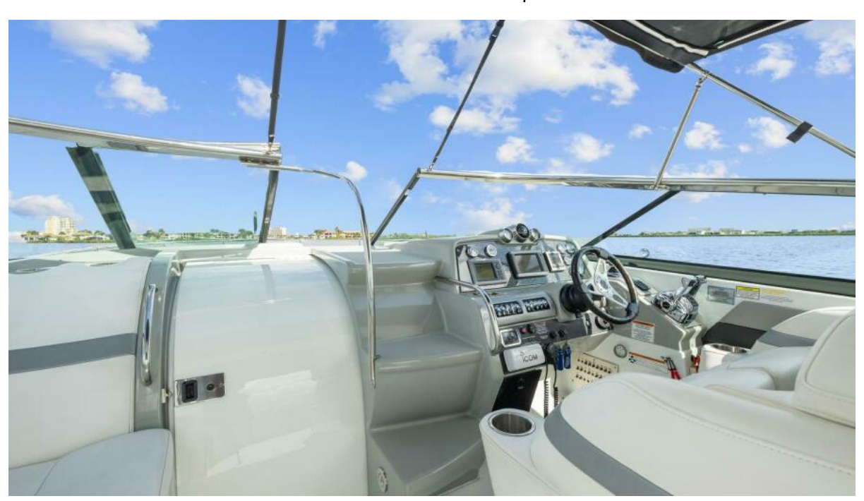
2012 Formula 350 Sun Sport