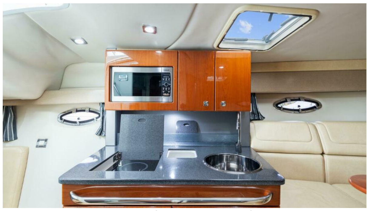
2012 Formula 350 Sun Sport For Sale