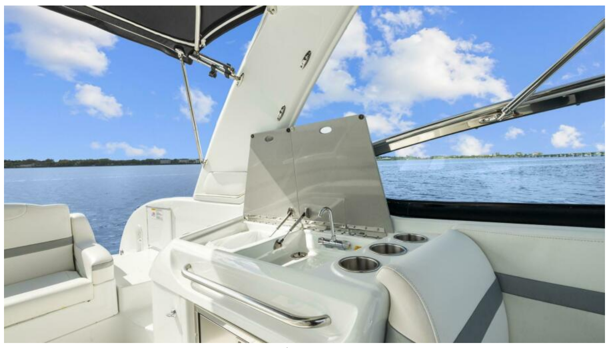
2012 Formula 350 Sun Sport