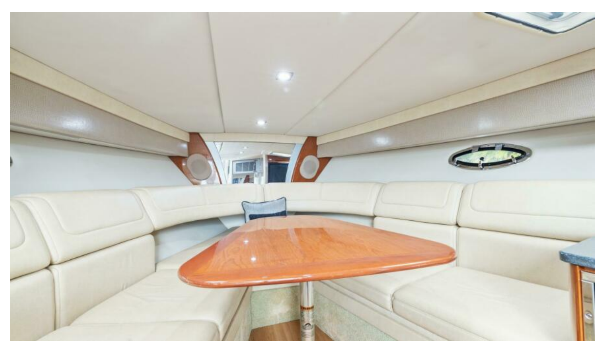
2012 Formula 350 Sun Sport For Sale