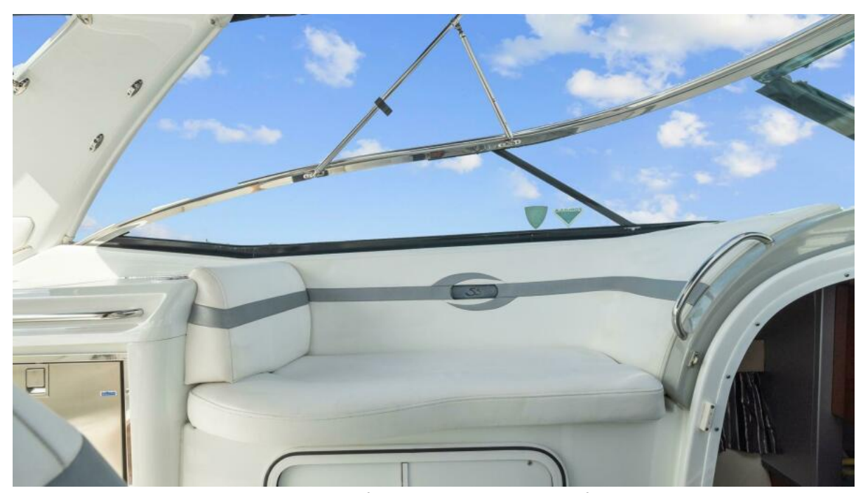
2012 Formula 350 Sun Sport For Sale