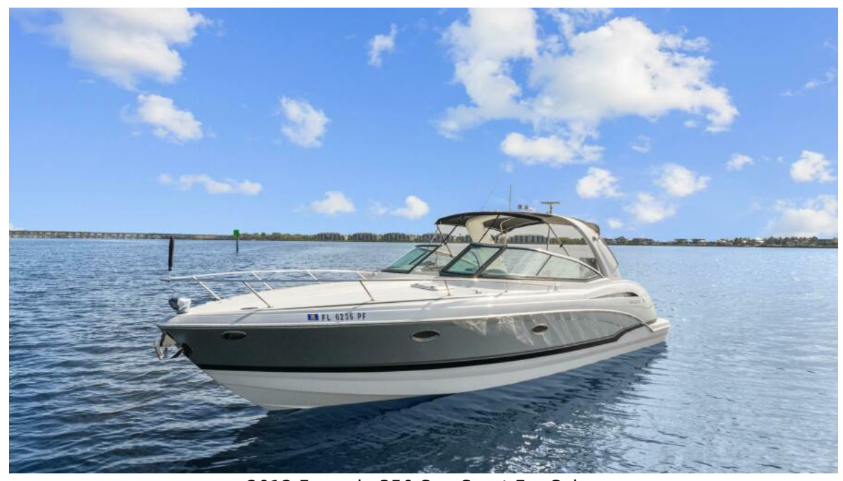
2012 Formula 350 Sun Sport For Sale