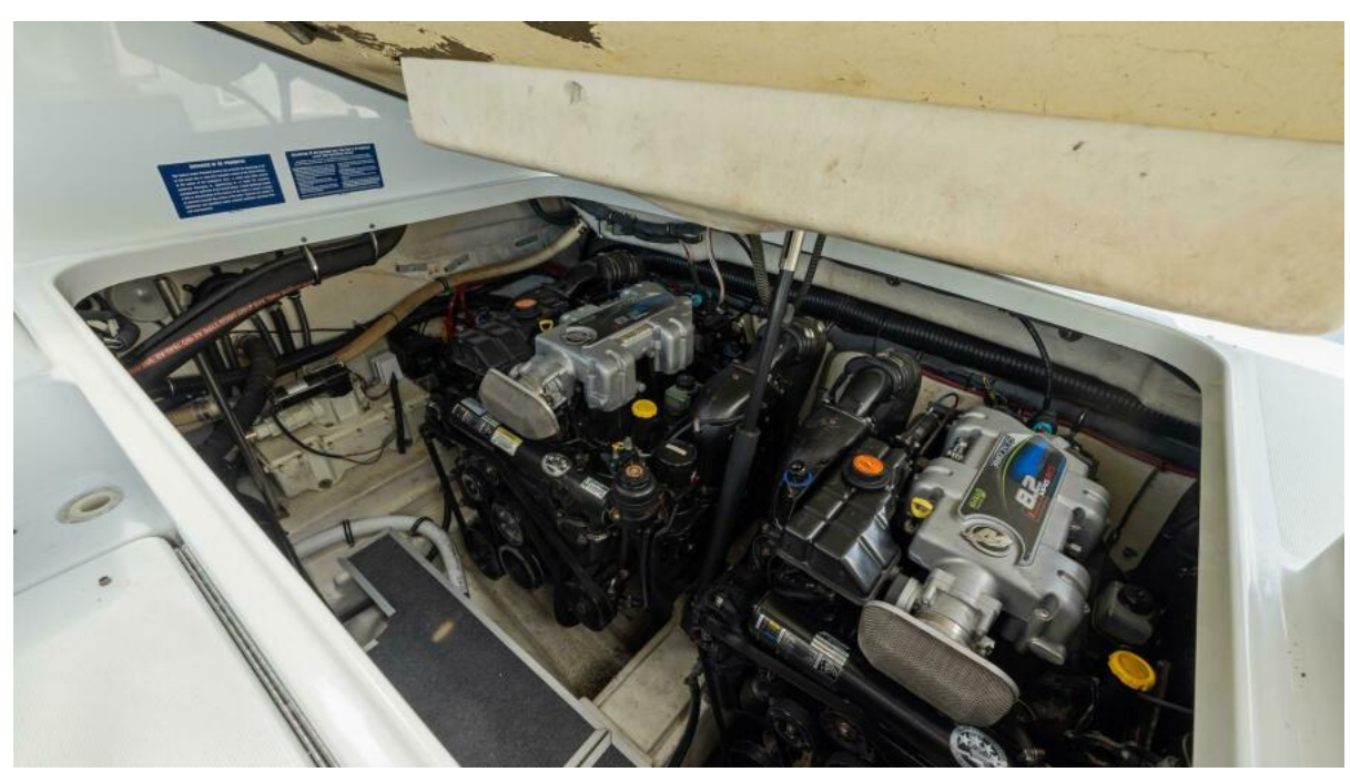
2012 Formula 350 Sun Sport For Sale