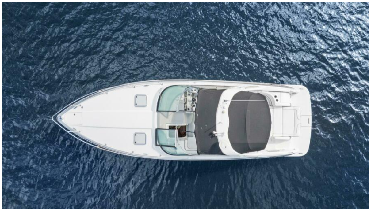
2012 Formula 350 Sun Sport For Sale