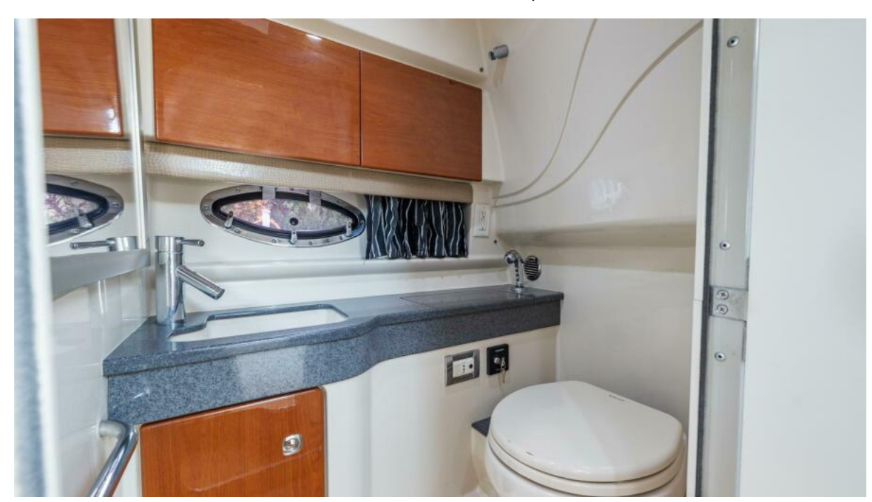
2012 Formula 350 Sun Sport