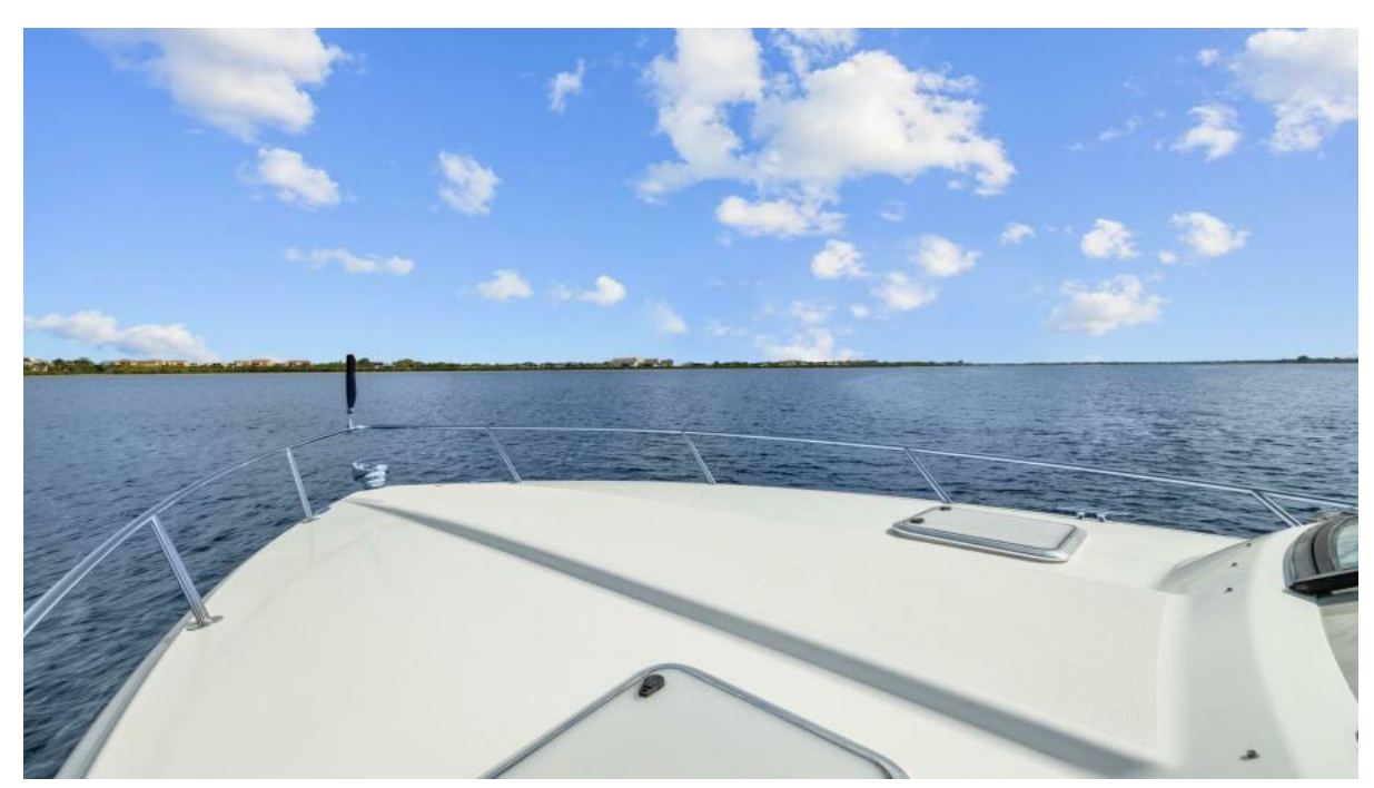
2012 Formula 350 Sun Sport