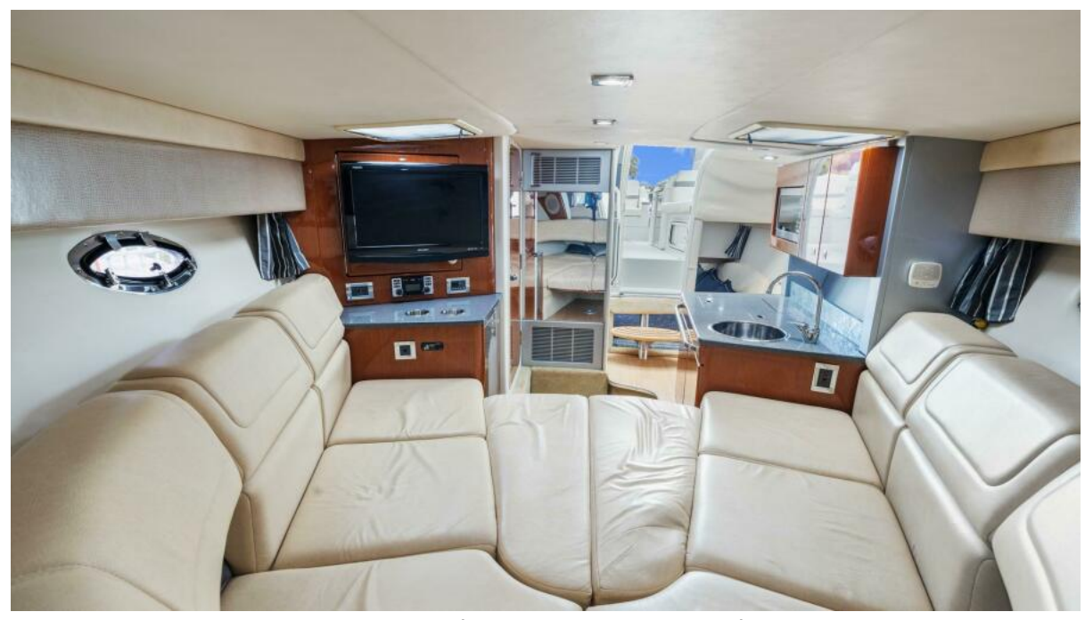
2012 Formula 350 Sun Sport For Sale