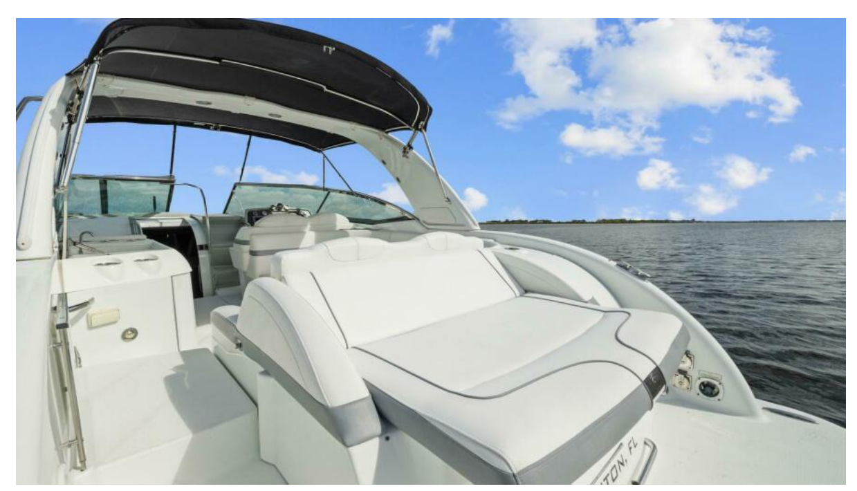
2012 Formula 350 Sun Sport