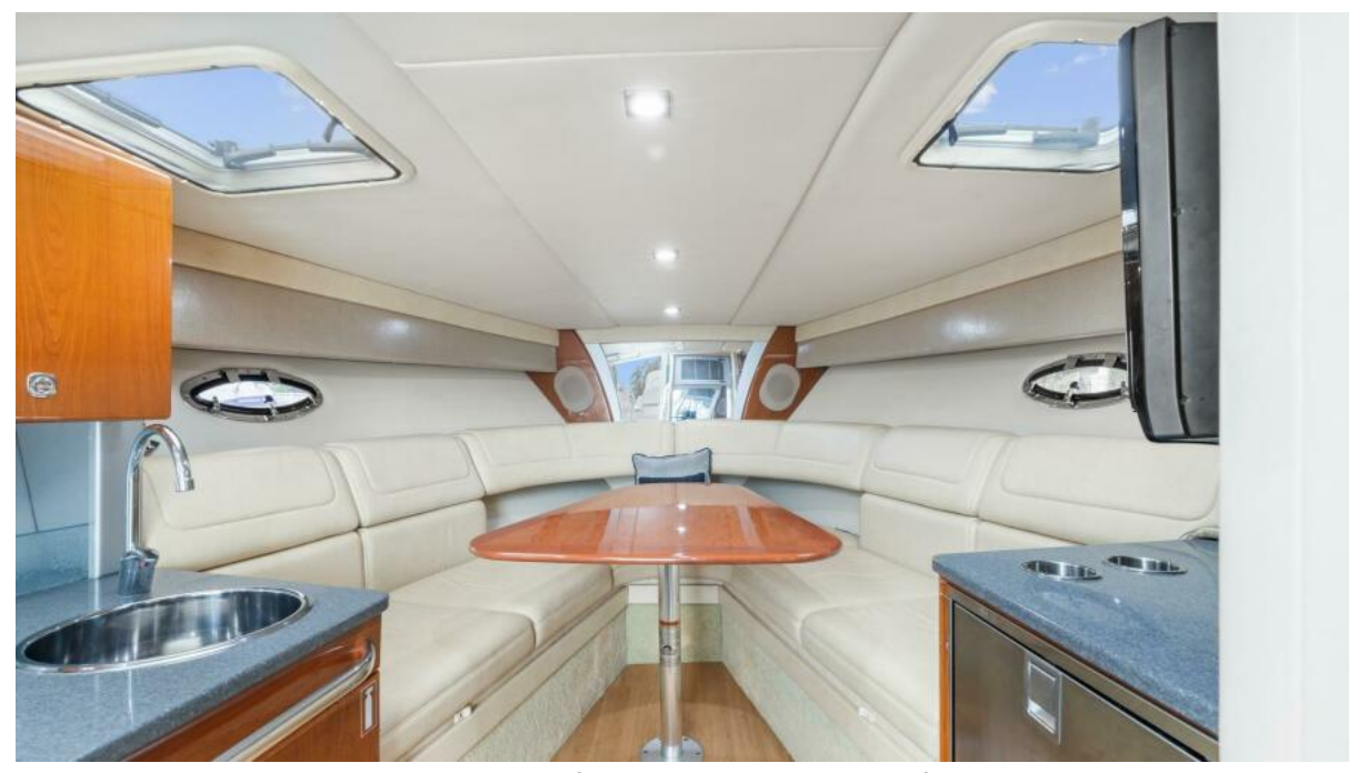
2012 Formula 350 Sun Sport For Sale