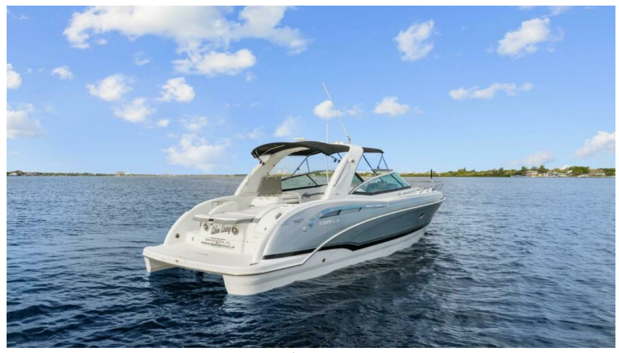
2012 Formula 350 Sun Sport