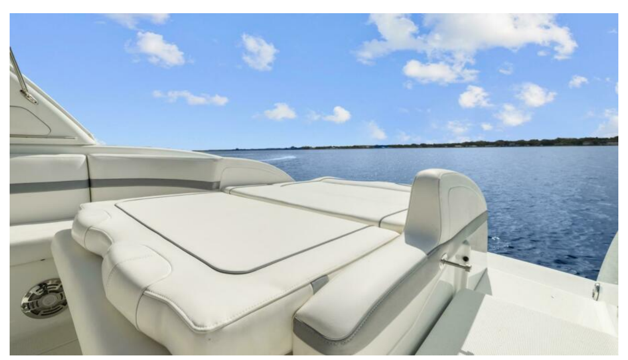
2012 Formula 350 Sun Sport