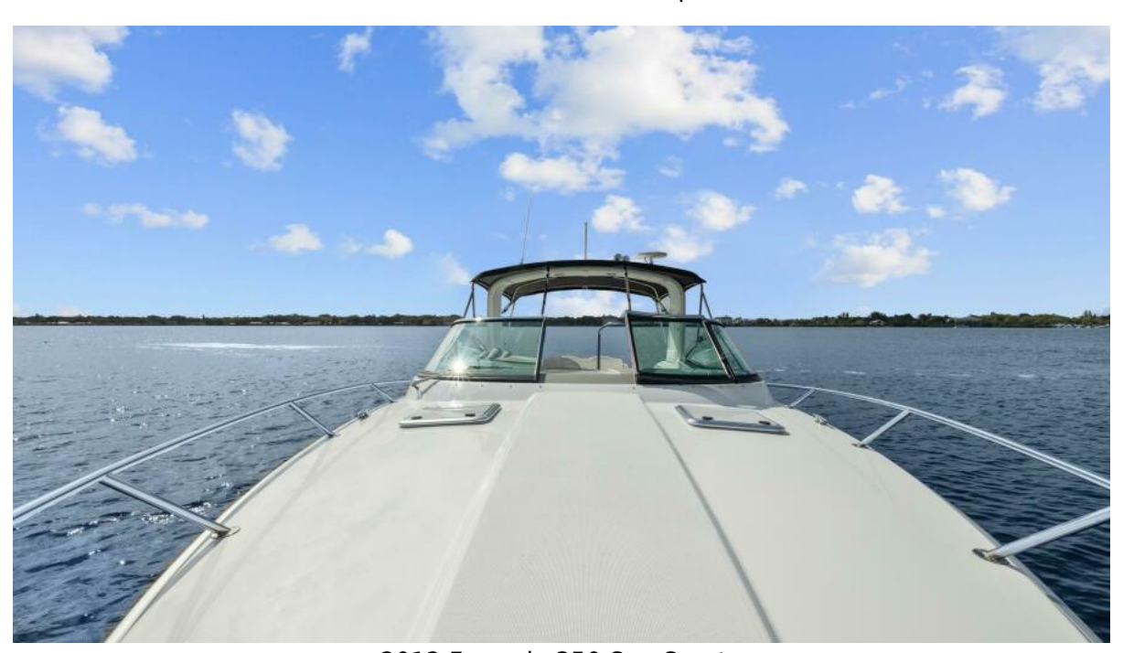
2012 Formula 350 Sun Sport