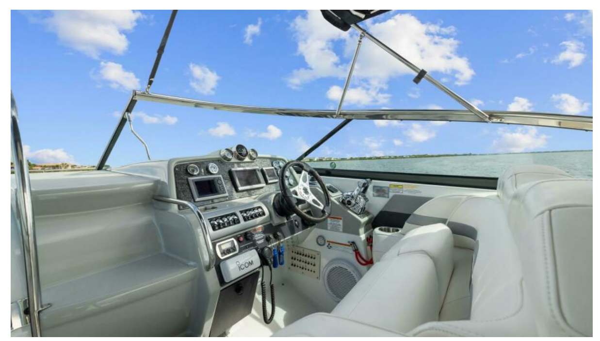
2012 Formula 350 Sun Sport For Sale