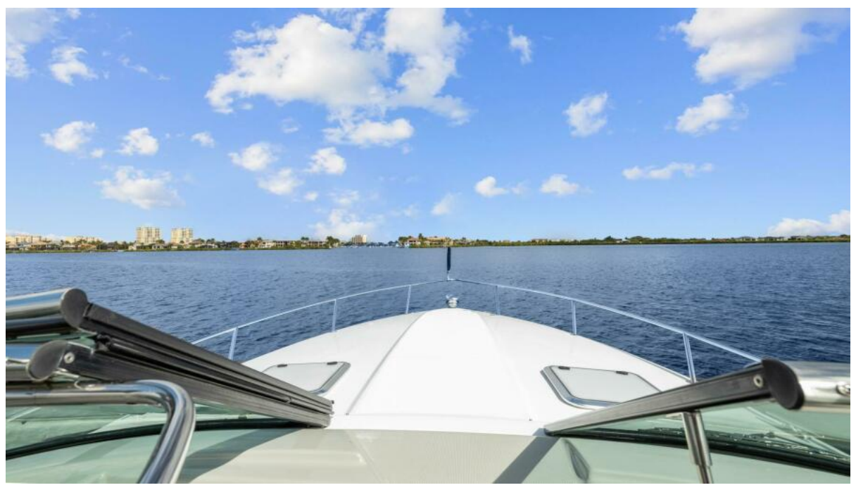
2012 Formula 350 Sun Sport