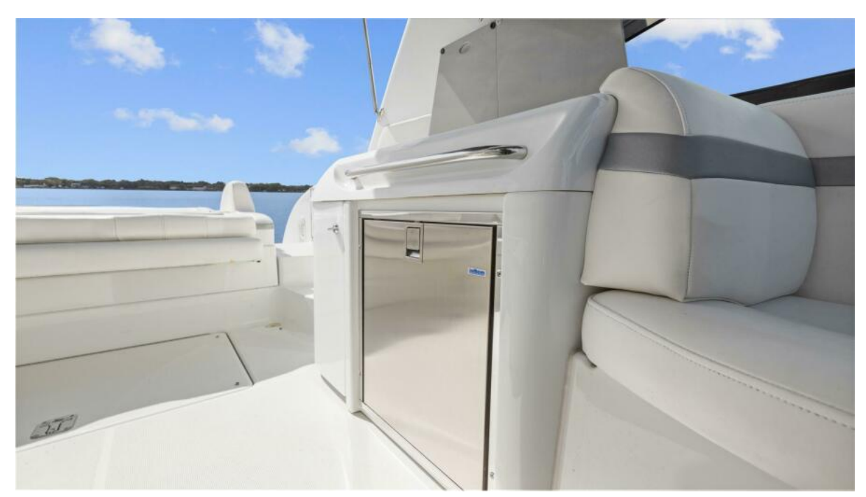
2012 Formula 350 Sun Sport