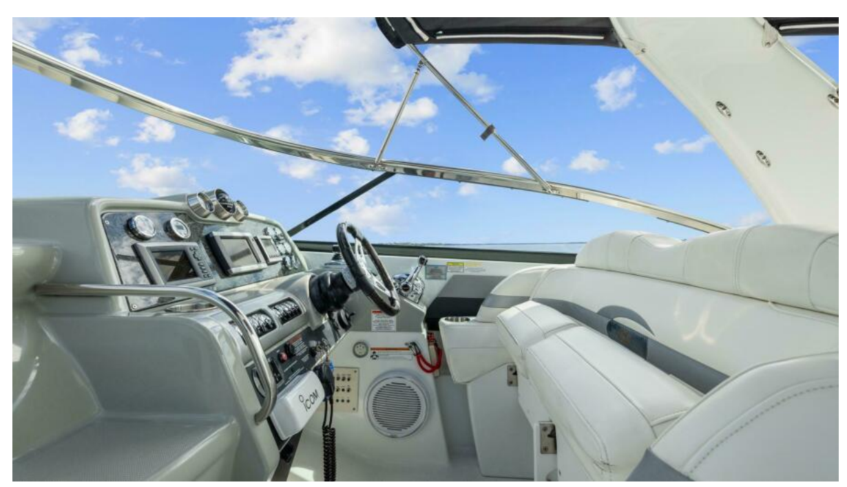
2012 Formula 350 Sun Sport For Sale