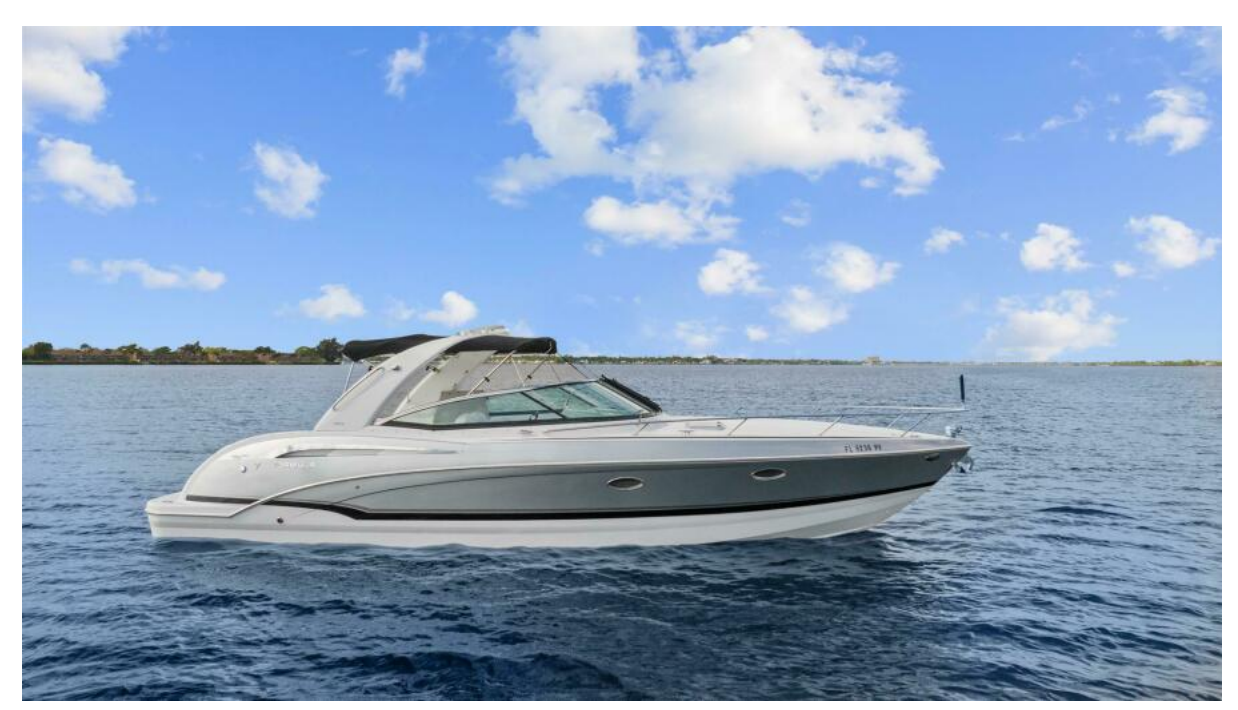
2012 Formula 350 Sun Sport For Sale