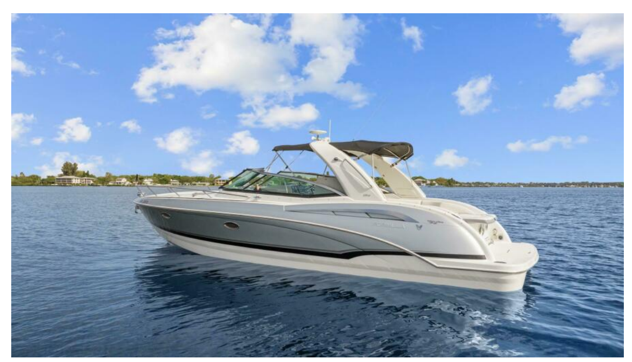
2012 Formula 350 Sun Sport For Sale