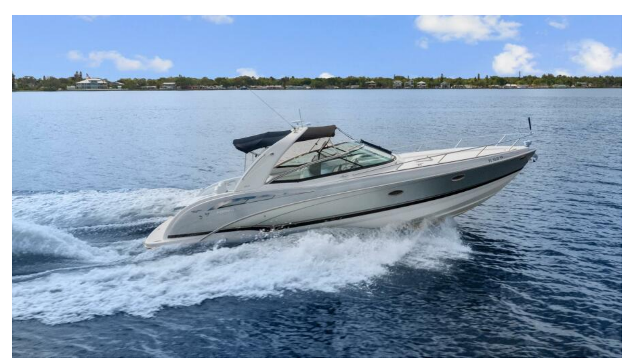
2012 Formula 350 Sun Sport For Sale