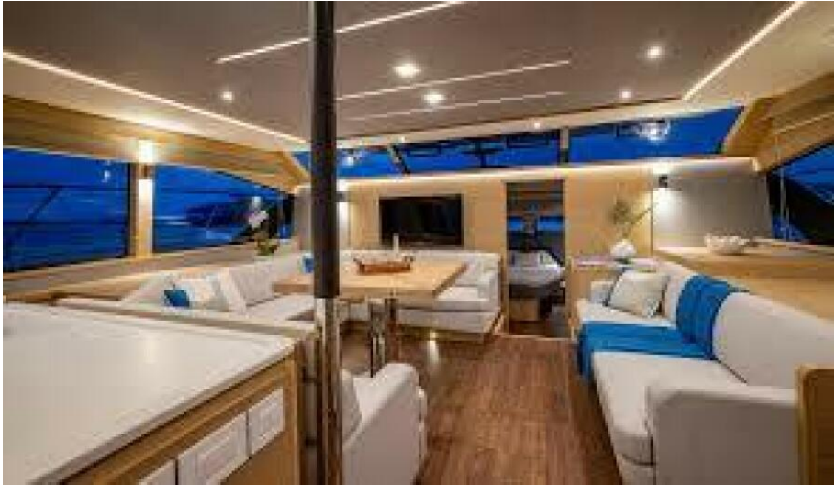
2024 Aquila 54 - Salon 2024 Aquila 54