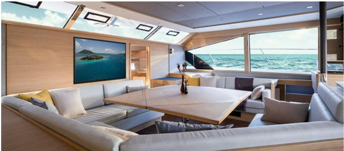
2024 Aquila 54 - Salon 2024 Aquila 54