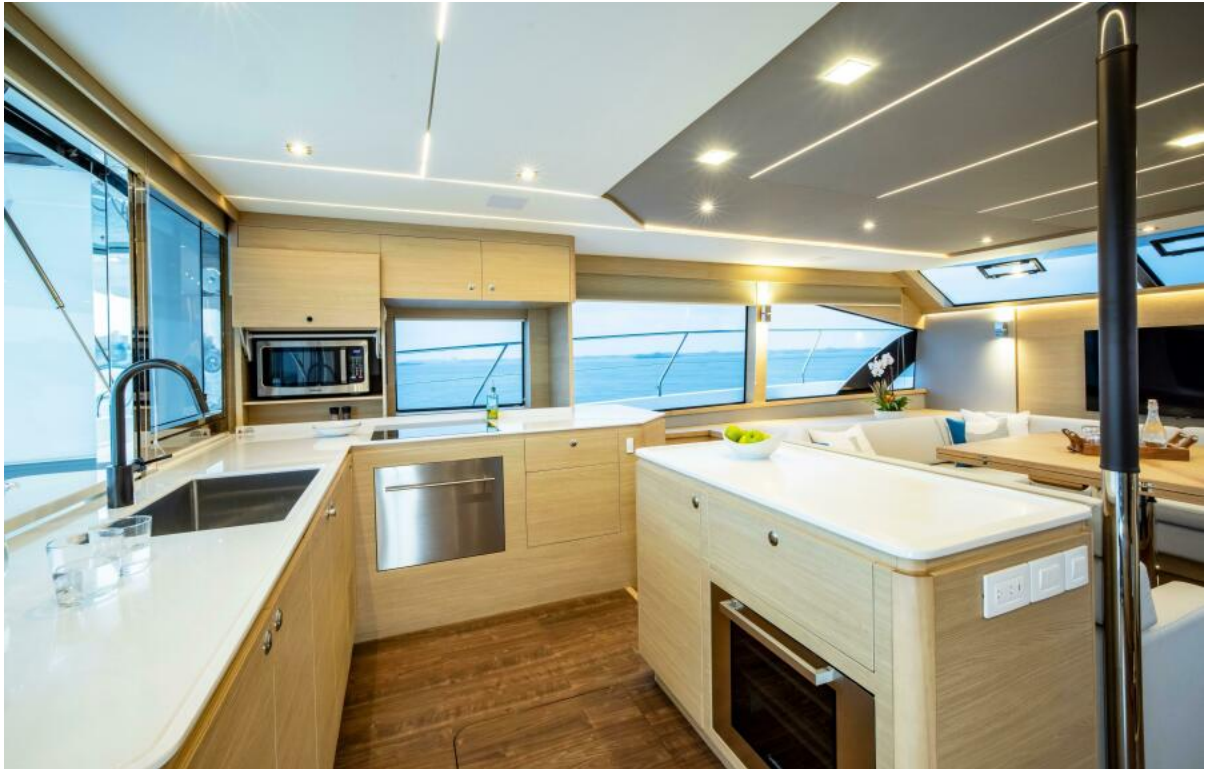
2024 Aquila 54 - Galley 2024 Aquila 54