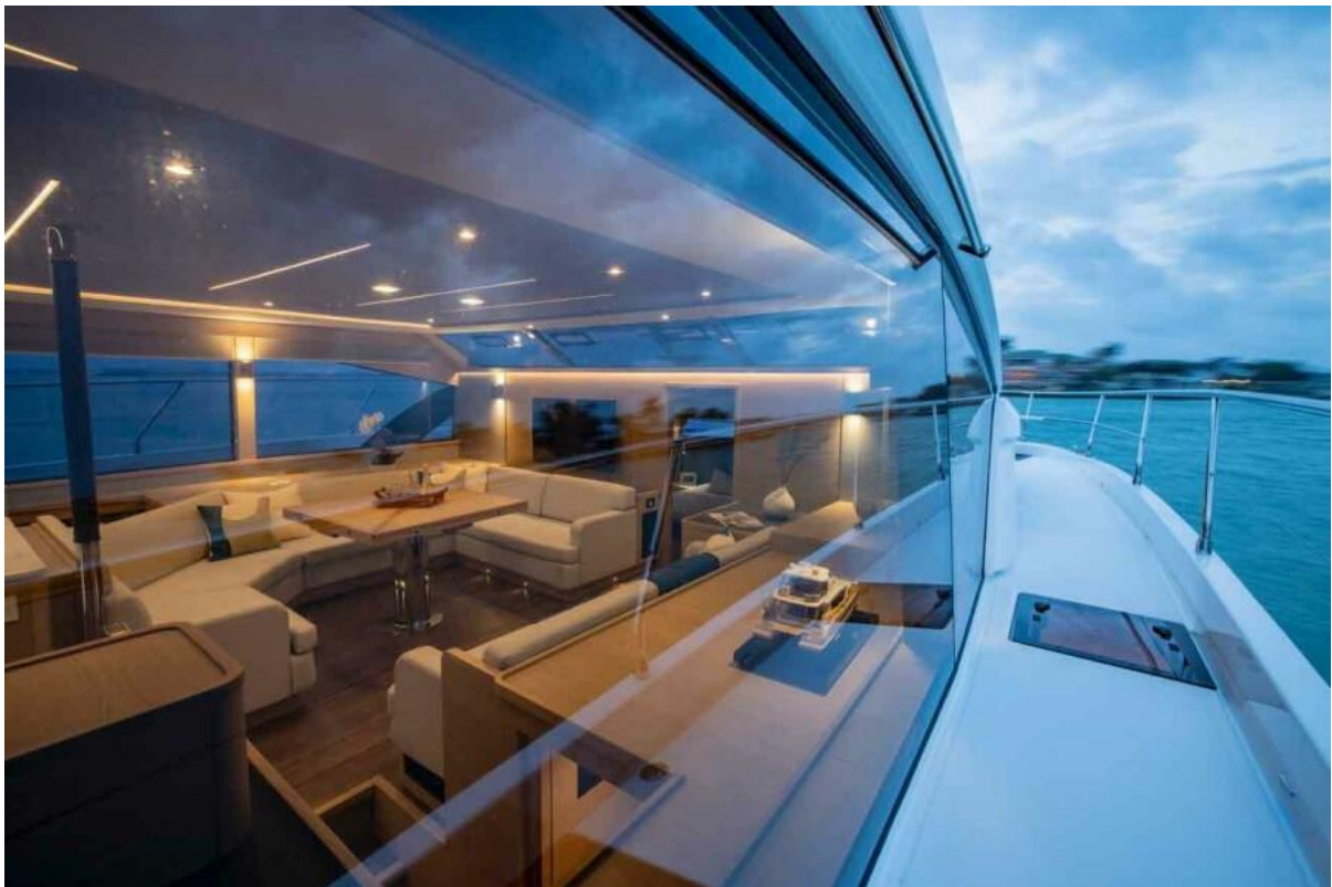
2024 Aquila 54 - Windon 2024 Aquila 54