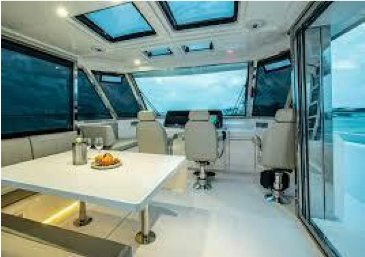
2024 Aquila 54 - Cockpit 2024 Aquila 54