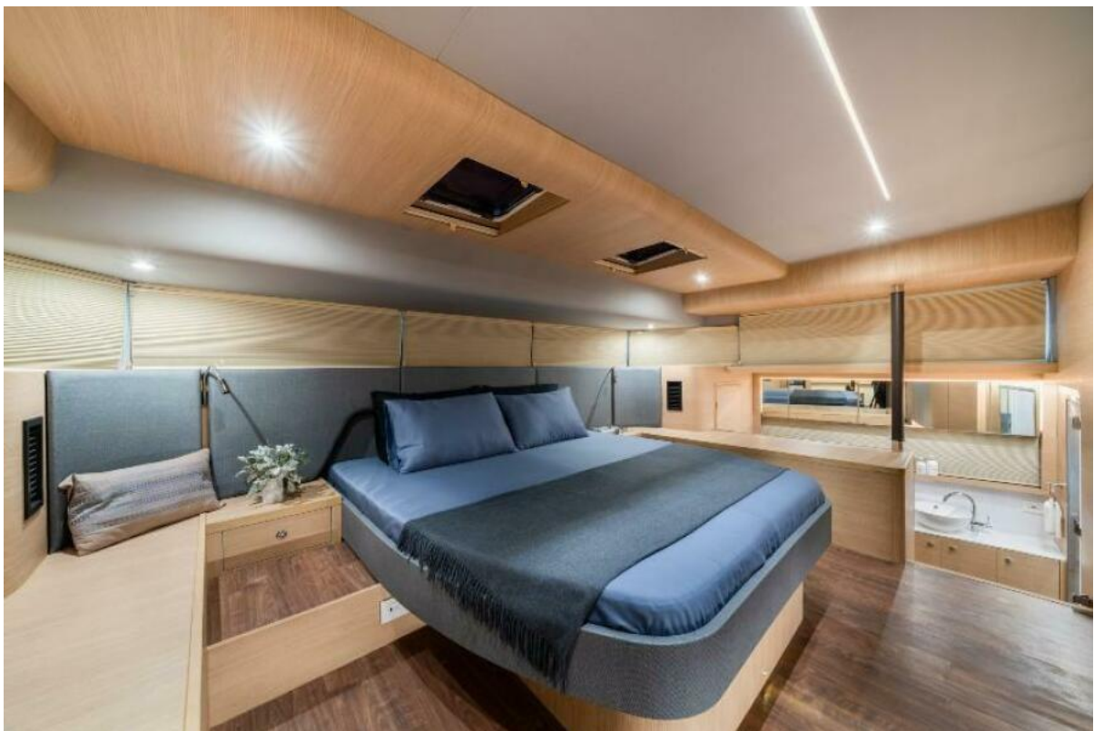
2024 Aquila 54 - Master Stateroom 2024 Aquila 54