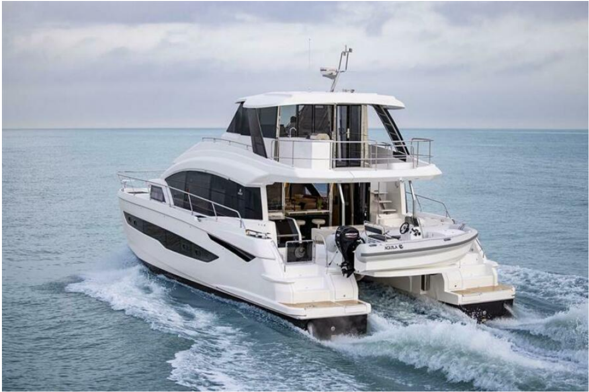
2024 Aquila 54 - Exterior Profile 2024 Aquila 54