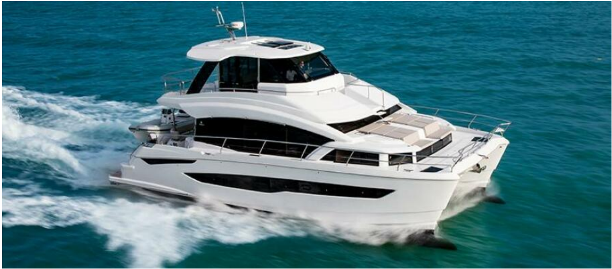
2024 Aquila 54 - Exterior Profile 2024 Aquila 54