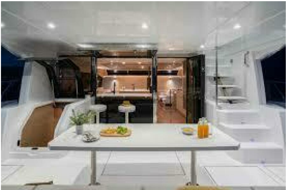
2024 Aquila 54 - Aft Deck 2024 Aquila 54