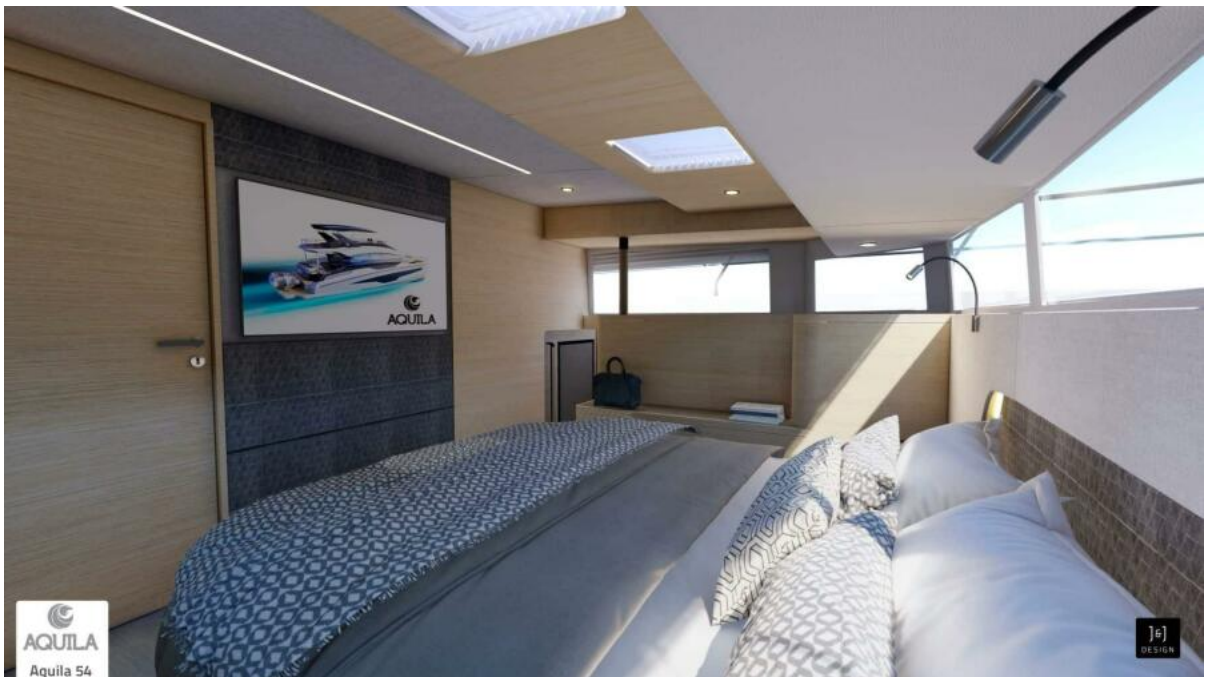
2024 Aquila 54 - Stateroom 2024 Aquila 54