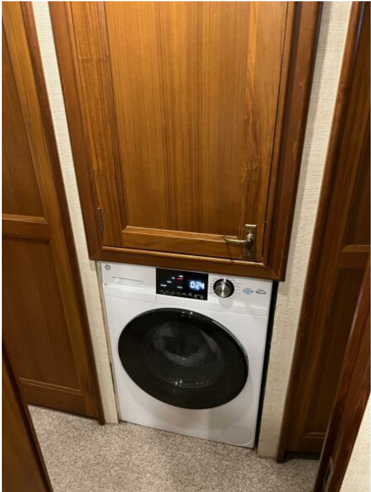
Ocean Yachts 53 Super Sport-Laundry 1995 Ocean Yachts 53 Super Sport