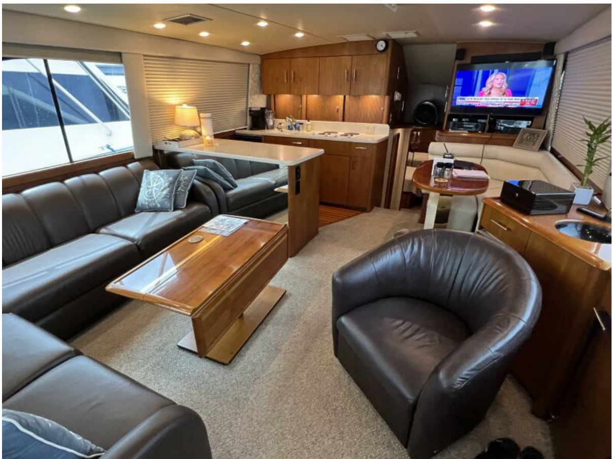
Ocean Yachts 53 Super Sport-Salon 1995 Ocean Yachts 53 Super Sport