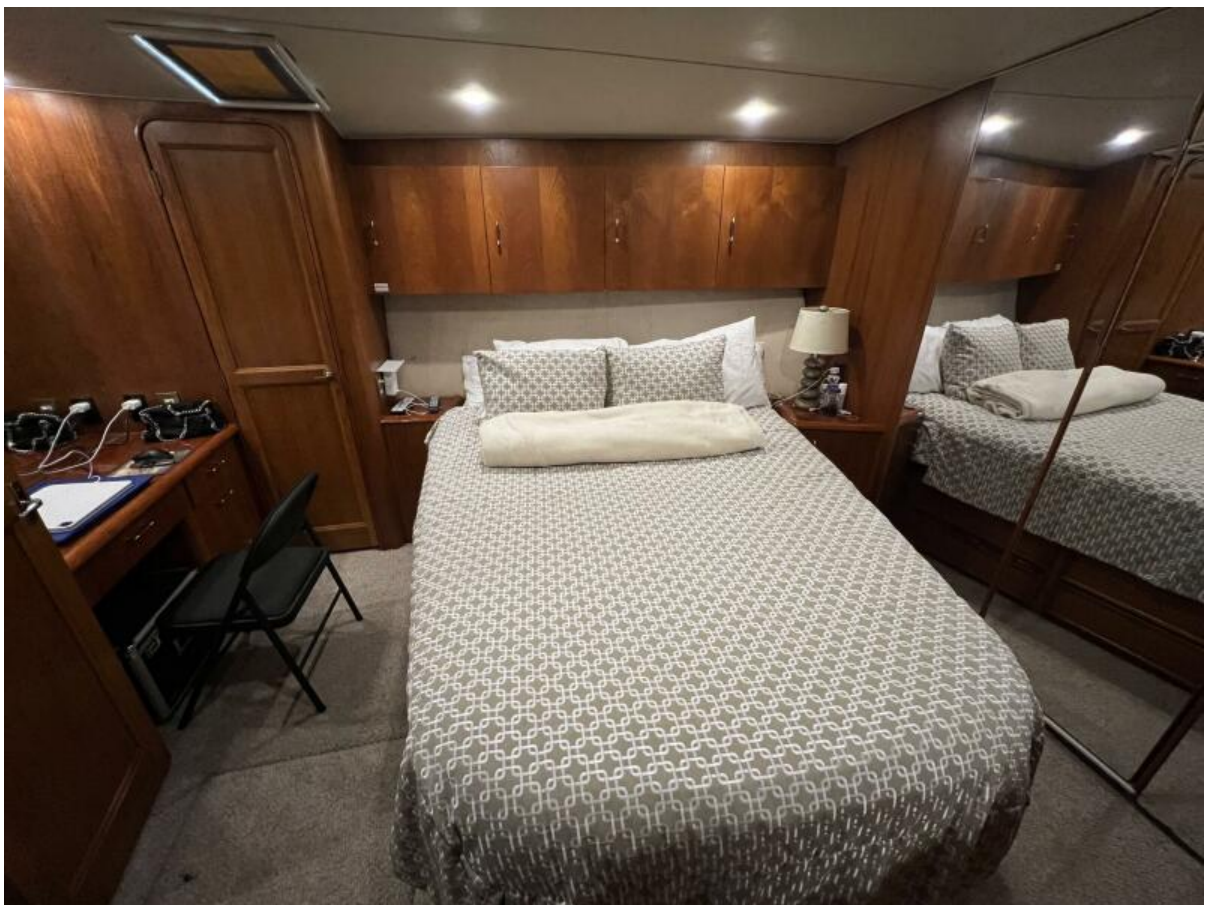
Ocean Yachts 53 Super Sport-Master 1995 Ocean Yachts 53 Super Sport