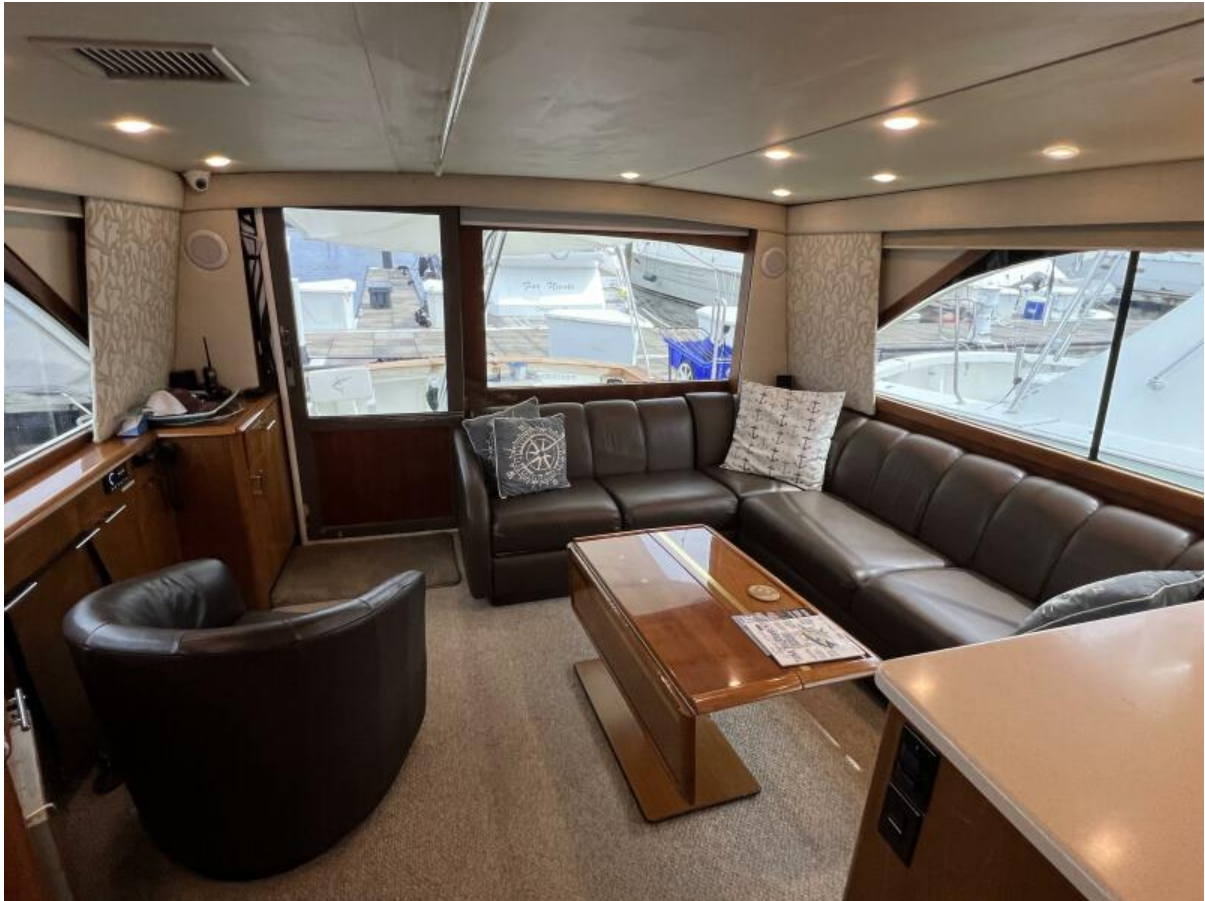
Ocean Yachts 53 Super Sport-Salon 1995 Ocean Yachts 53 Super Sport