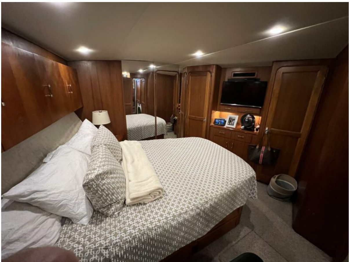
Ocean Yachts 53 Super Sport-Master 1995 Ocean Yachts 53 Super Sport