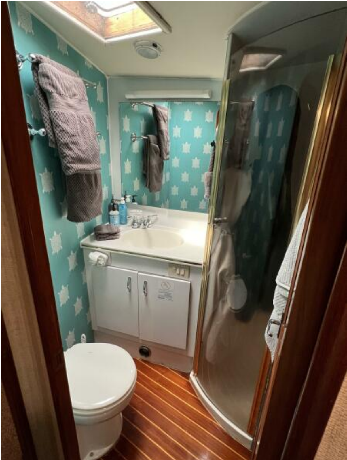
Ocean Yachts 53 Super Sport-Head 1995 Ocean Yachts 53 Super Sport