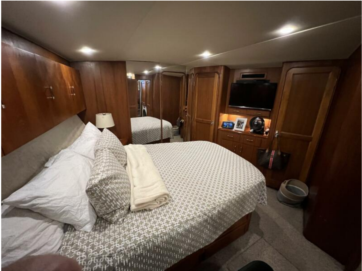
Ocean Yachts 53 Super Sport-Master 1995 Ocean Yachts 53 Super Sport