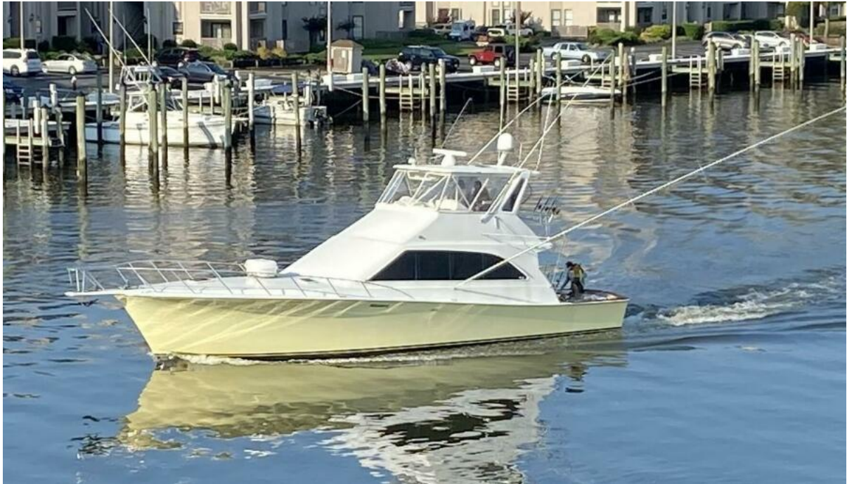
Ocean Yachts 53 Super Sport-Profile 1995 Ocean Yachts 53 Super Sport