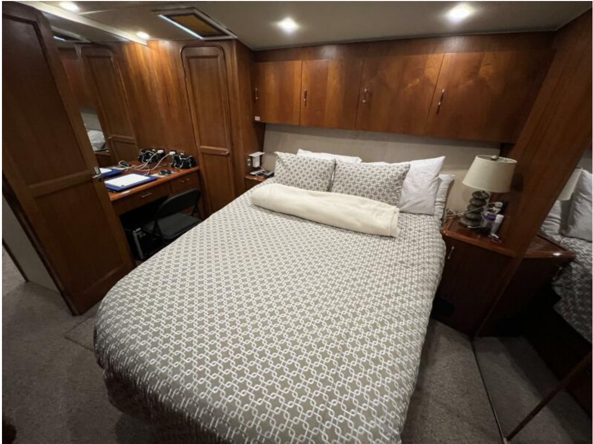
Ocean Yachts 53 Super Sport-Master 1995 Ocean Yachts 53 Super Sport