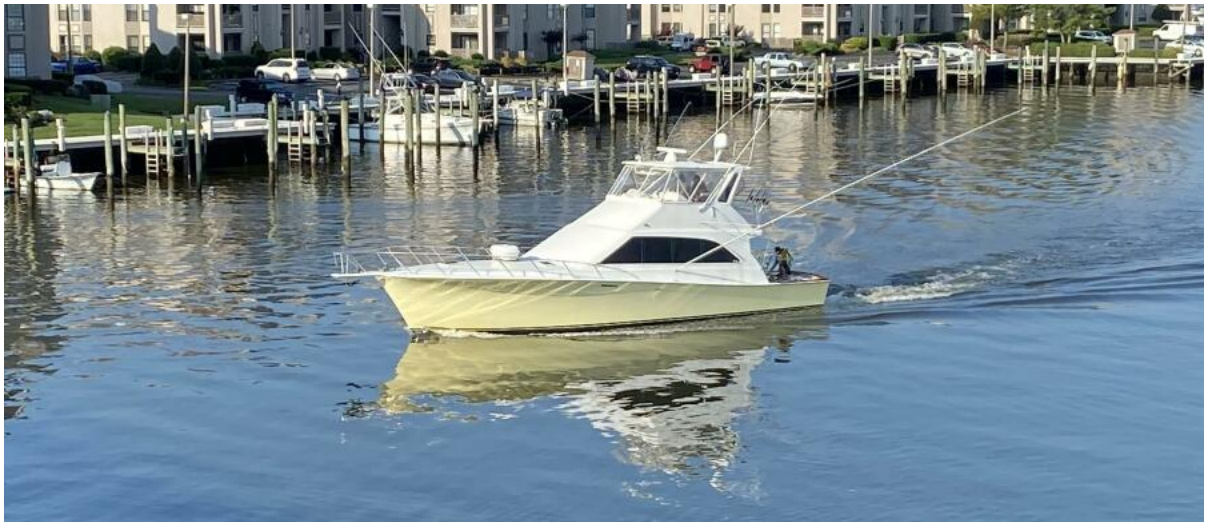
Ocean Yachts 53 Super Sport-Profile 1995 Ocean Yachts 53 Super Sport