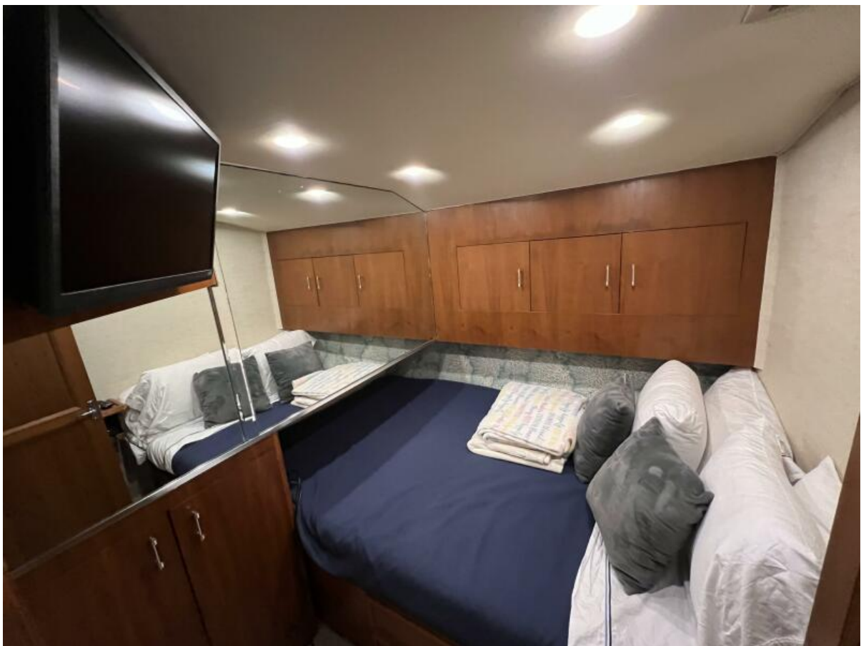
Ocean Yachts 53 Super Sport-Guest 1995 Ocean Yachts 53 Super Sport