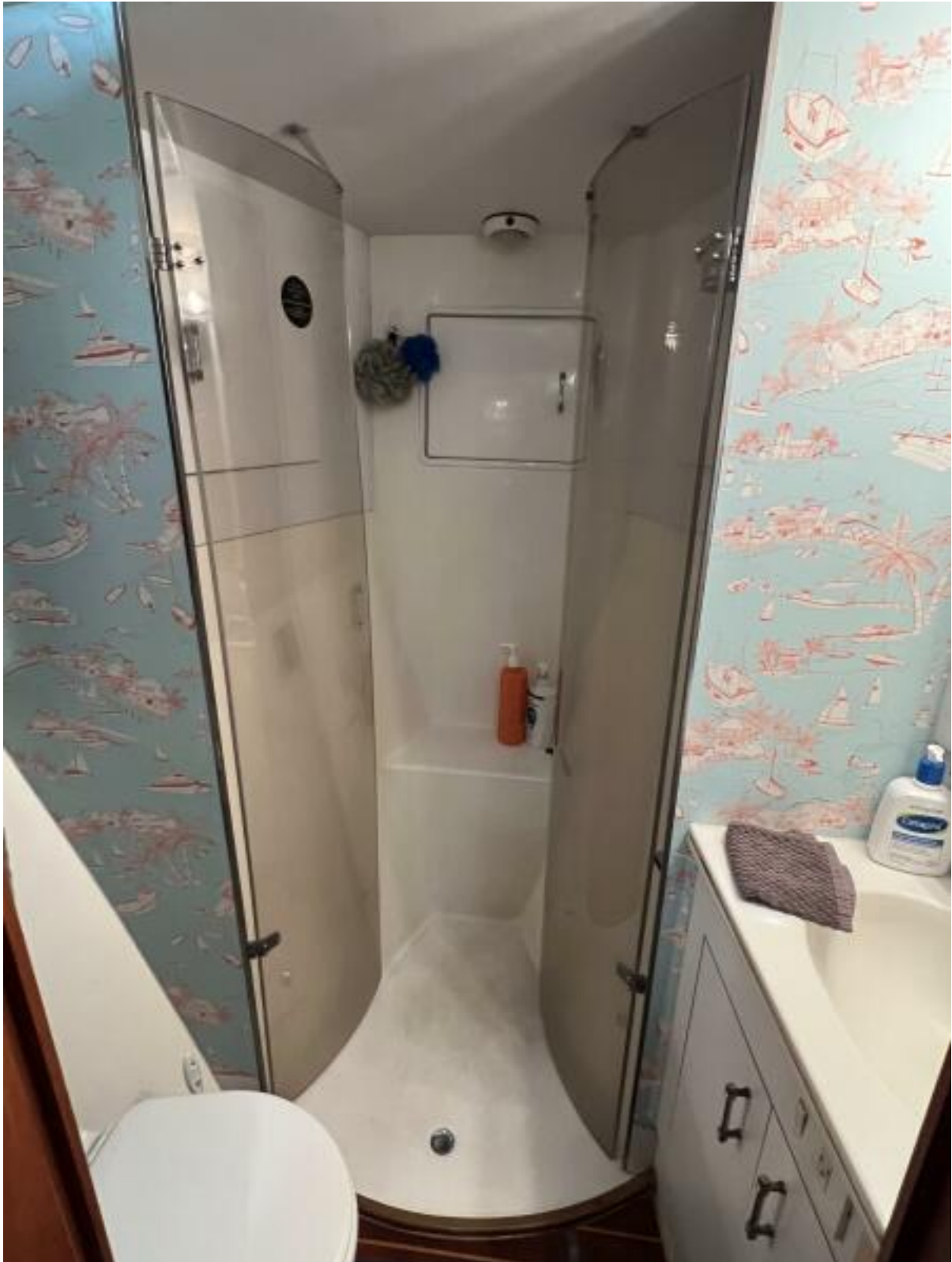
Ocean Yachts 53 Super Sport-Head 1995 Ocean Yachts 53 Super Sport