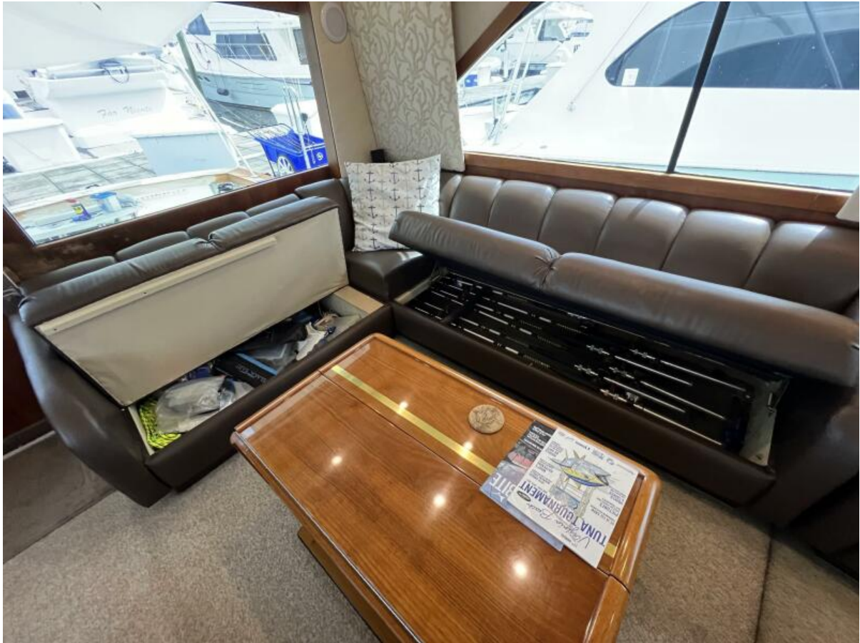
Ocean Yachts 53 Super Sport-Salon 1995 Ocean Yachts 53 Super Sport