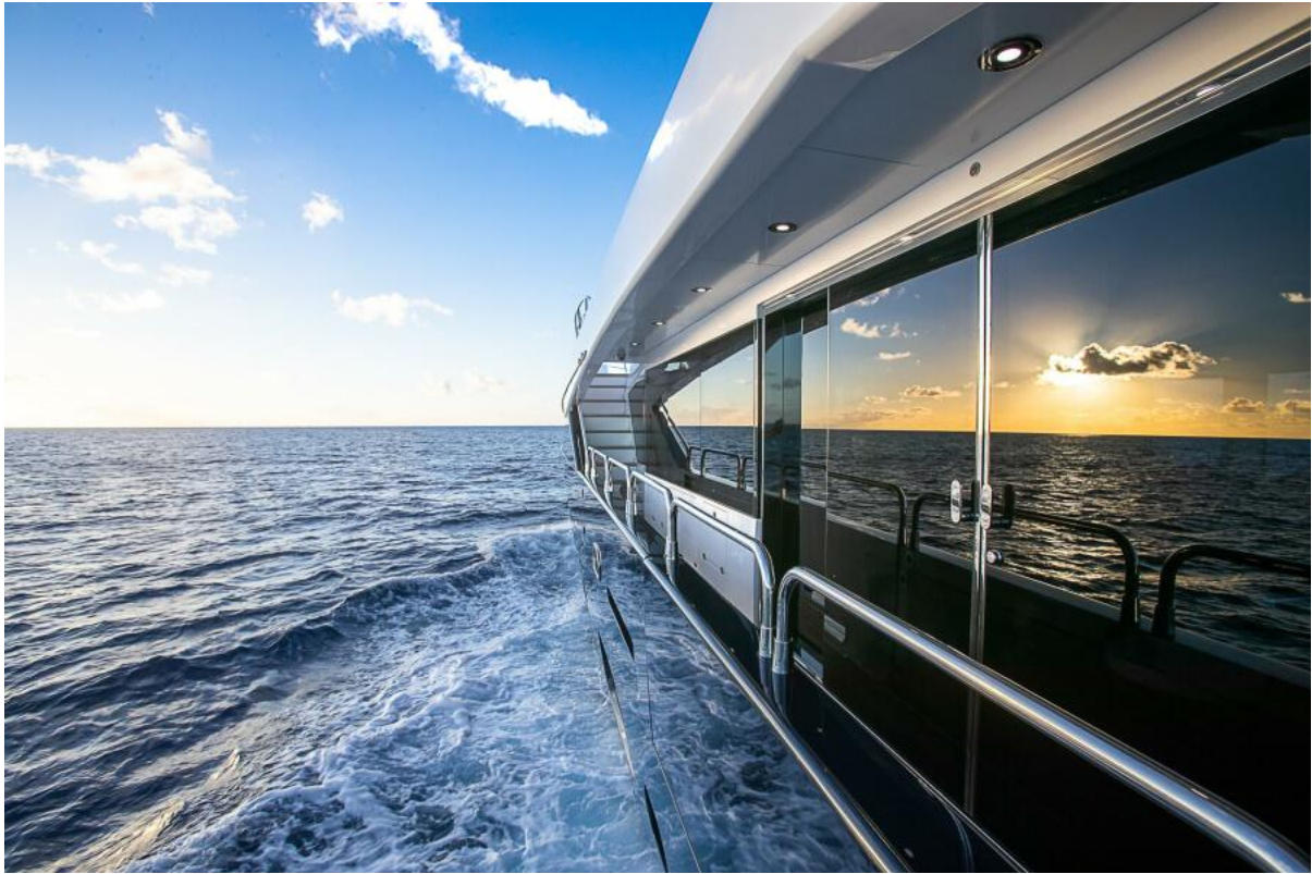
Sliding Doors And The Sun