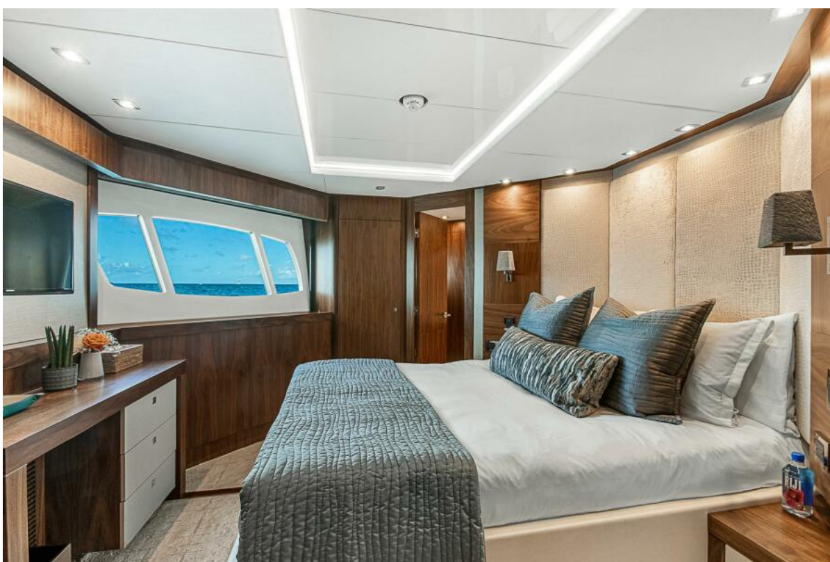
VIP Double Stateroom 2