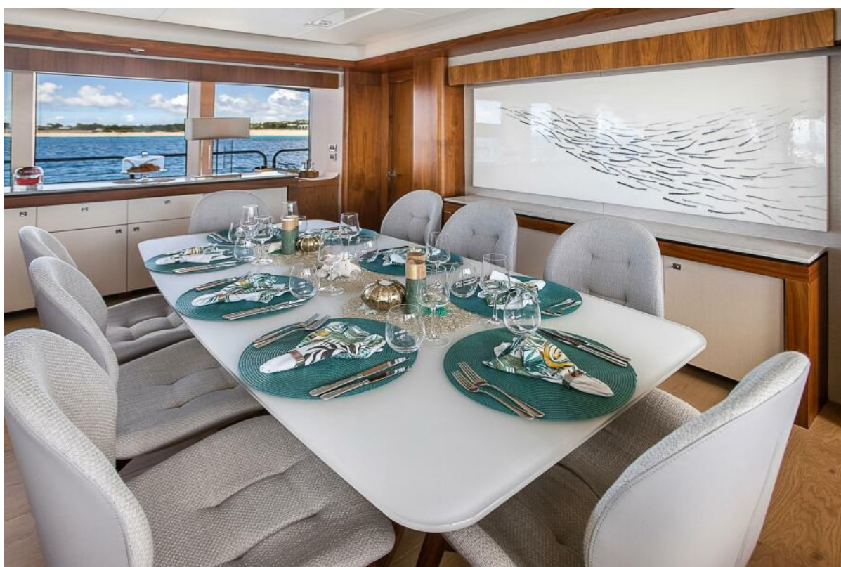
Table In Main Salon