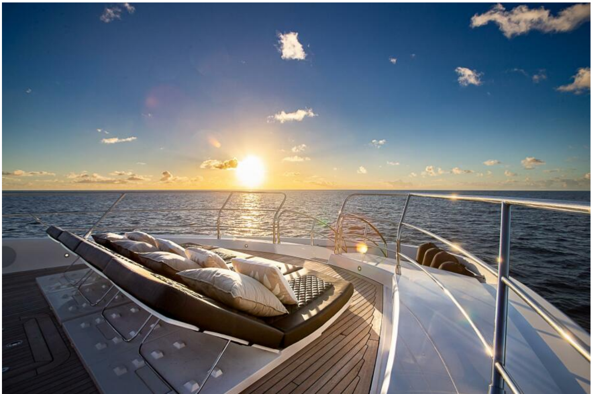
Sun Beds In The Bow