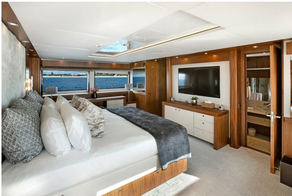
Master Stateroom 2