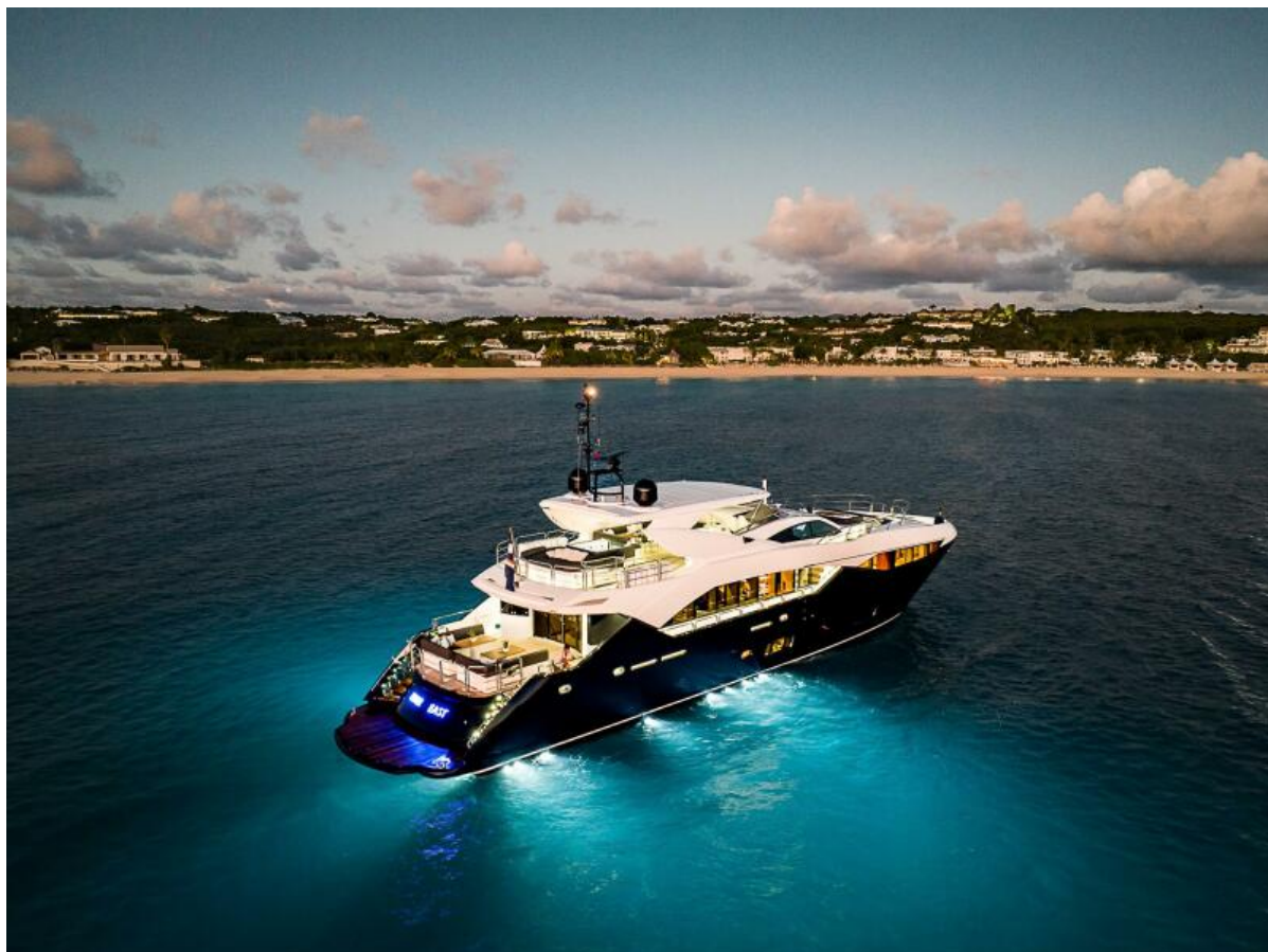
At Anchor With Lights