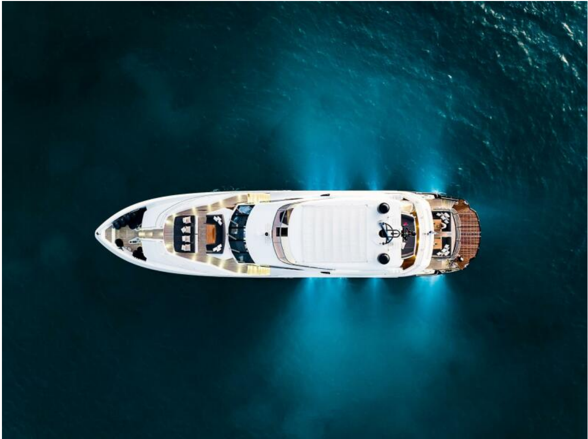
View From Above With Lights