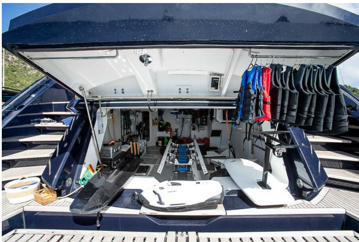
Garage And Toys