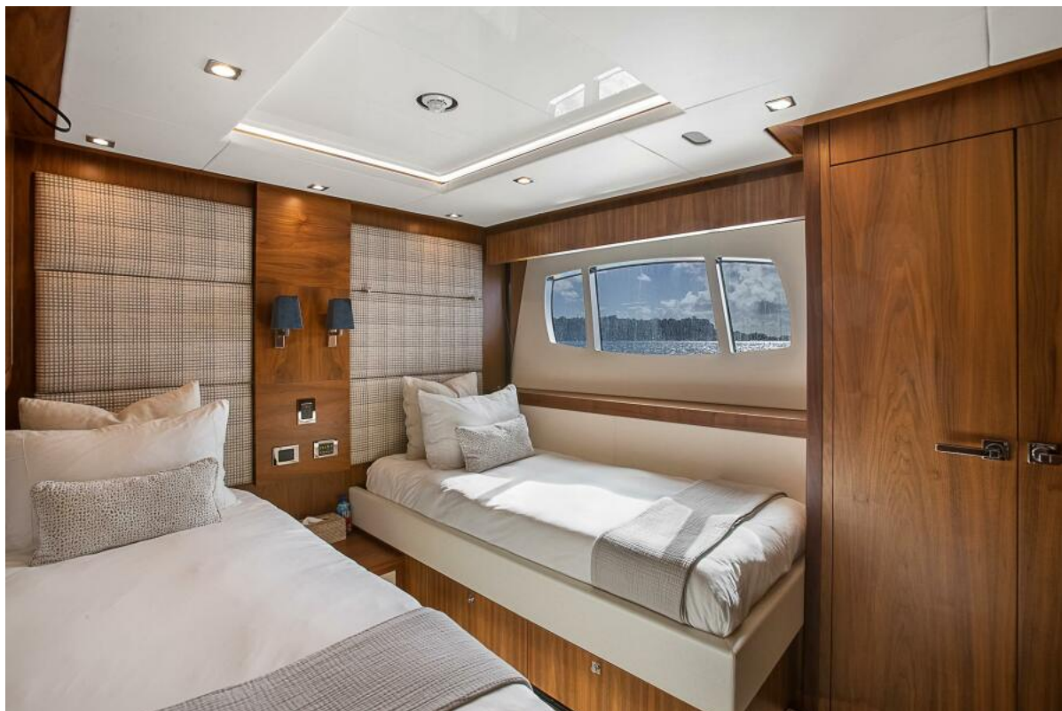
Twin Stateroom 2