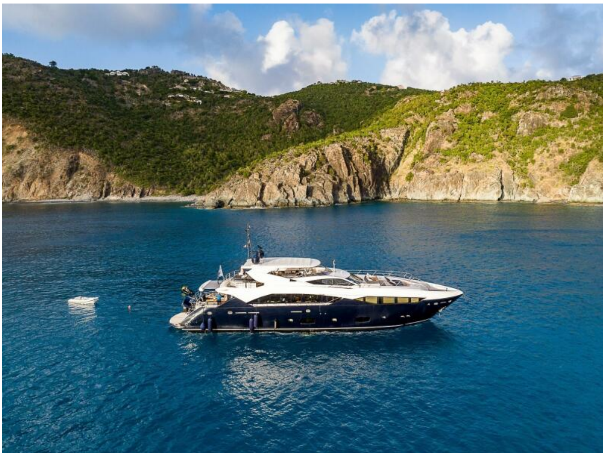
Profile At Anchor