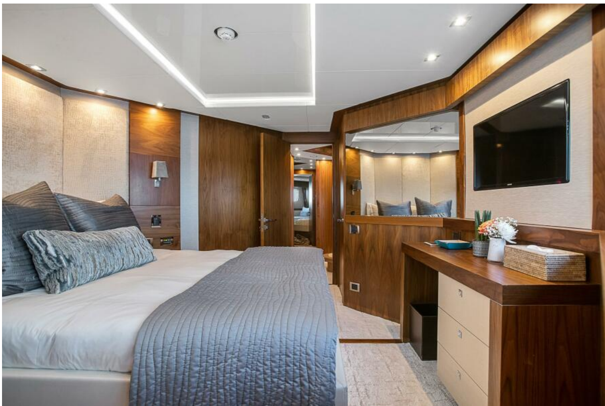
VIP Double Stateroom 1