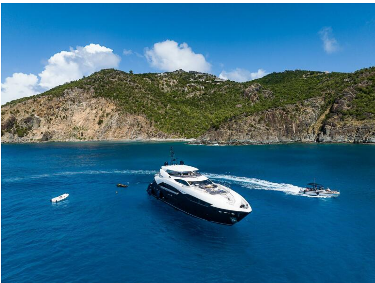
EVEREAST Tender And Toys