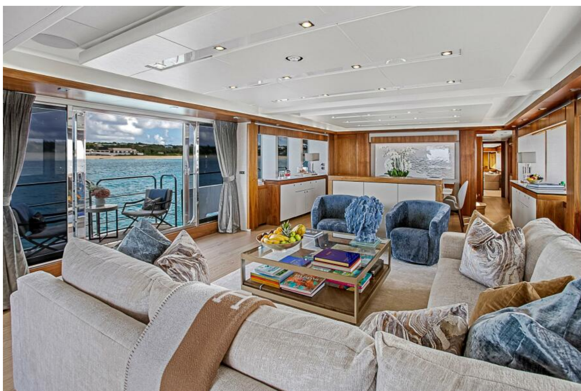
Main Salon 2