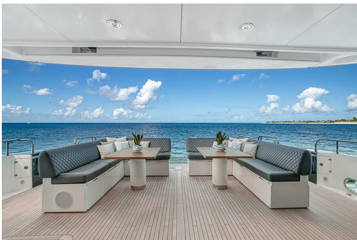
Aft Deck Seating Area