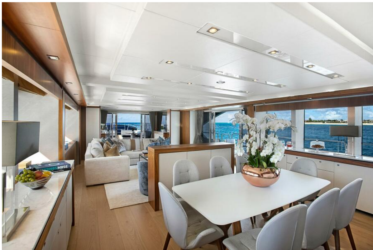
Main Salon 3