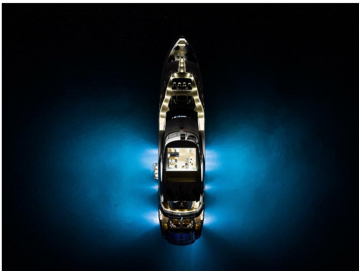
View From Above By Night