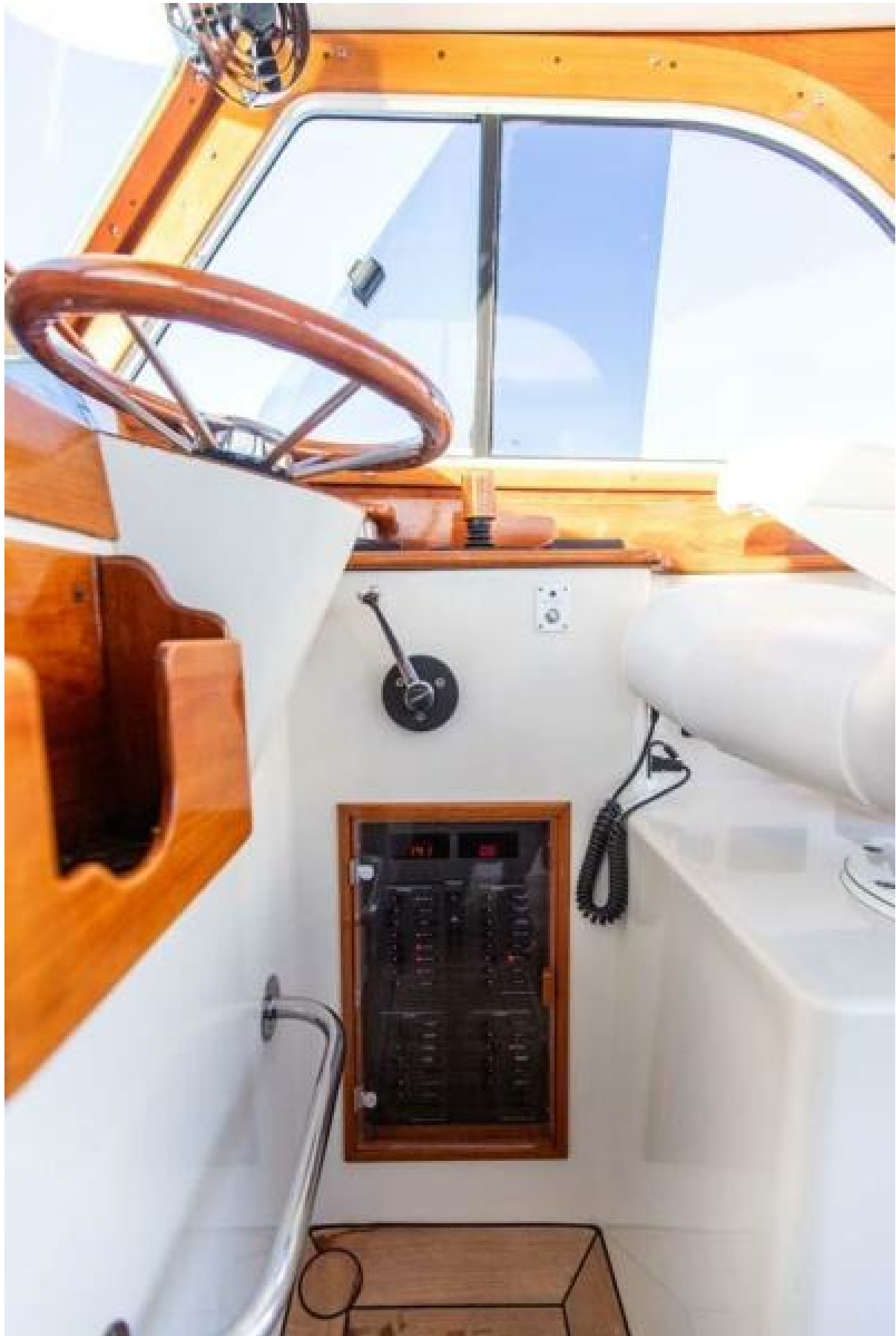
Stidd Helm Seat