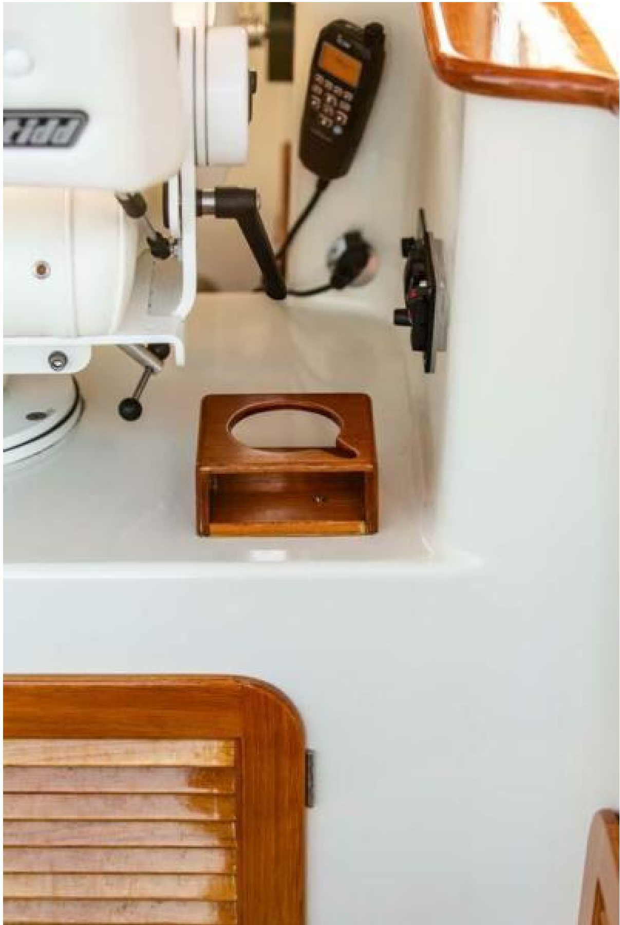
Stidd Helm Seat