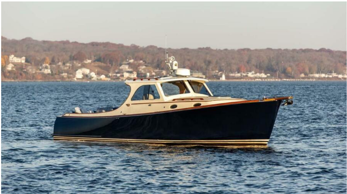
Starboard Bow Profile