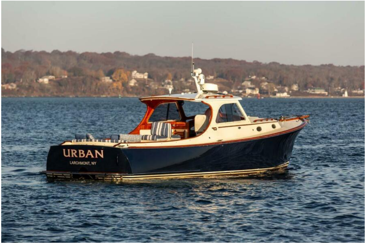
Starboard Stern Profile