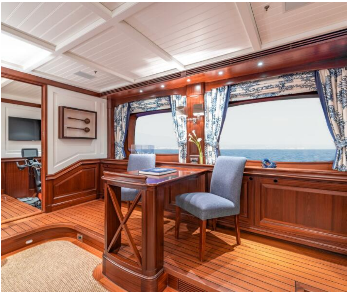
Master Stateroom Starboard Side