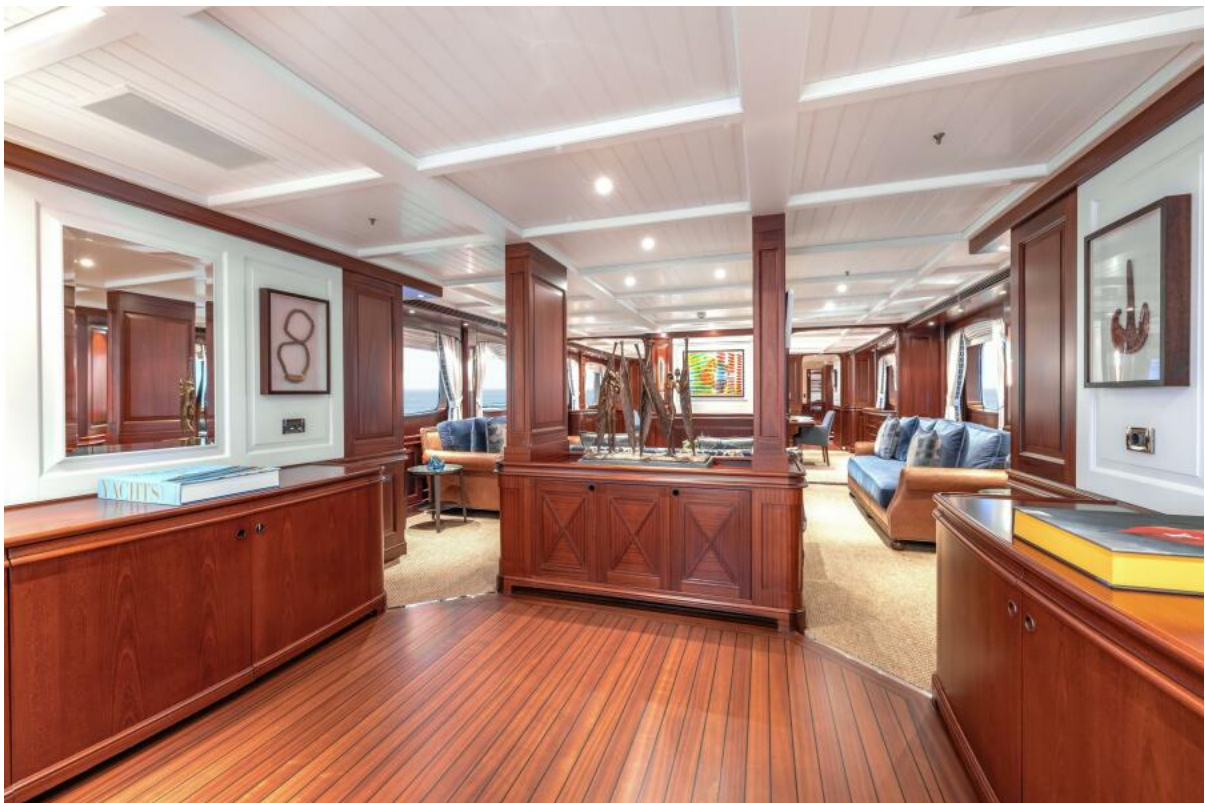
Main Salon Foyer Looking Forward