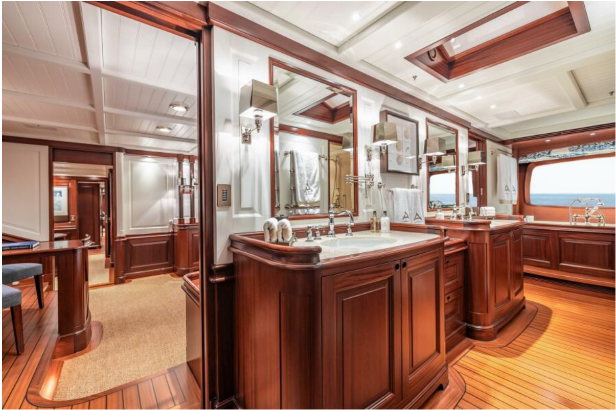
Master Bath Looking Aft To Port