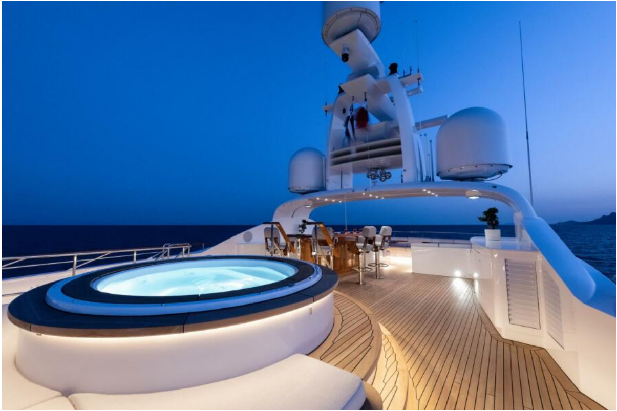
Sundeck Looking Forward