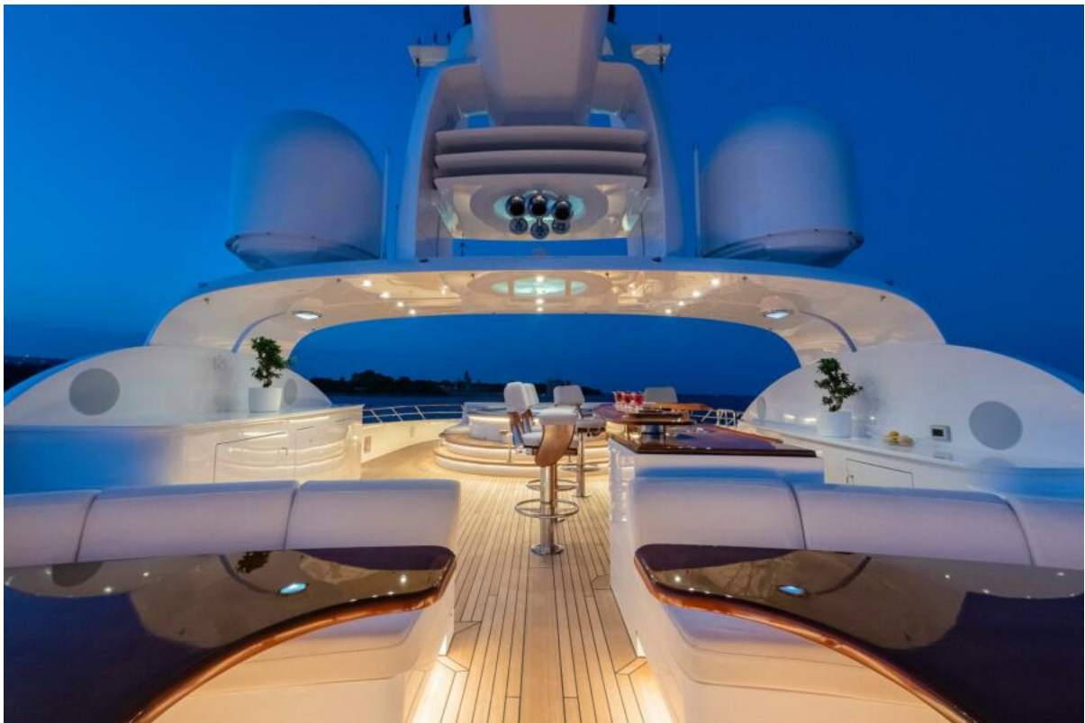
Sundeck Looking Aft