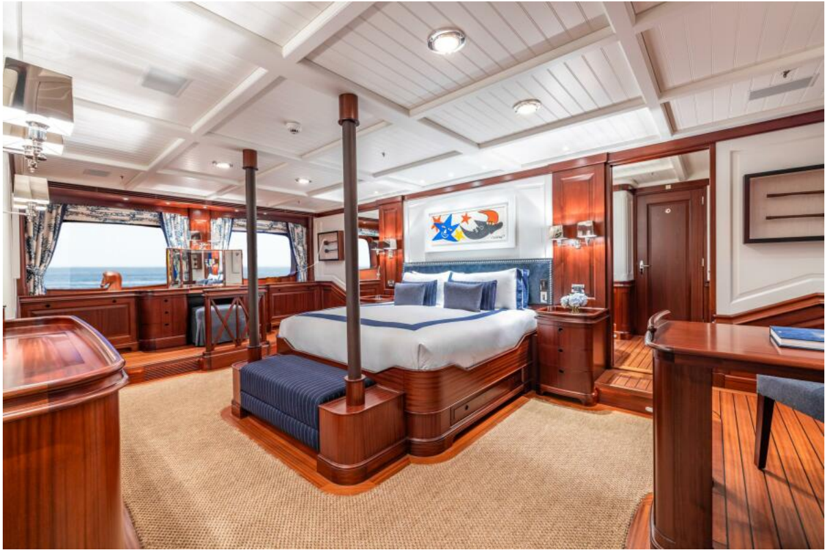
Master Stateroom Looking To Port