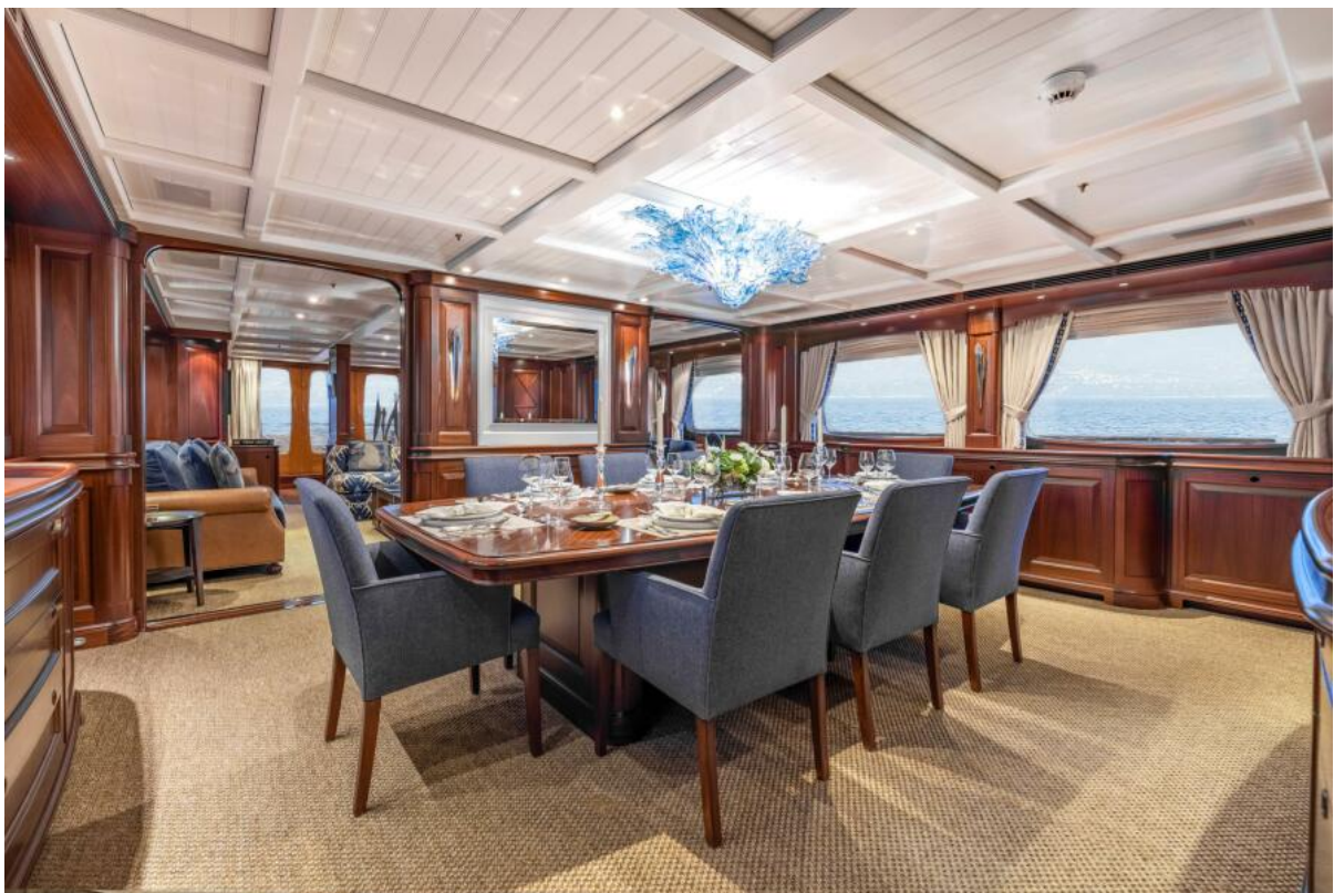
Dining Salon Looking Aft To Port