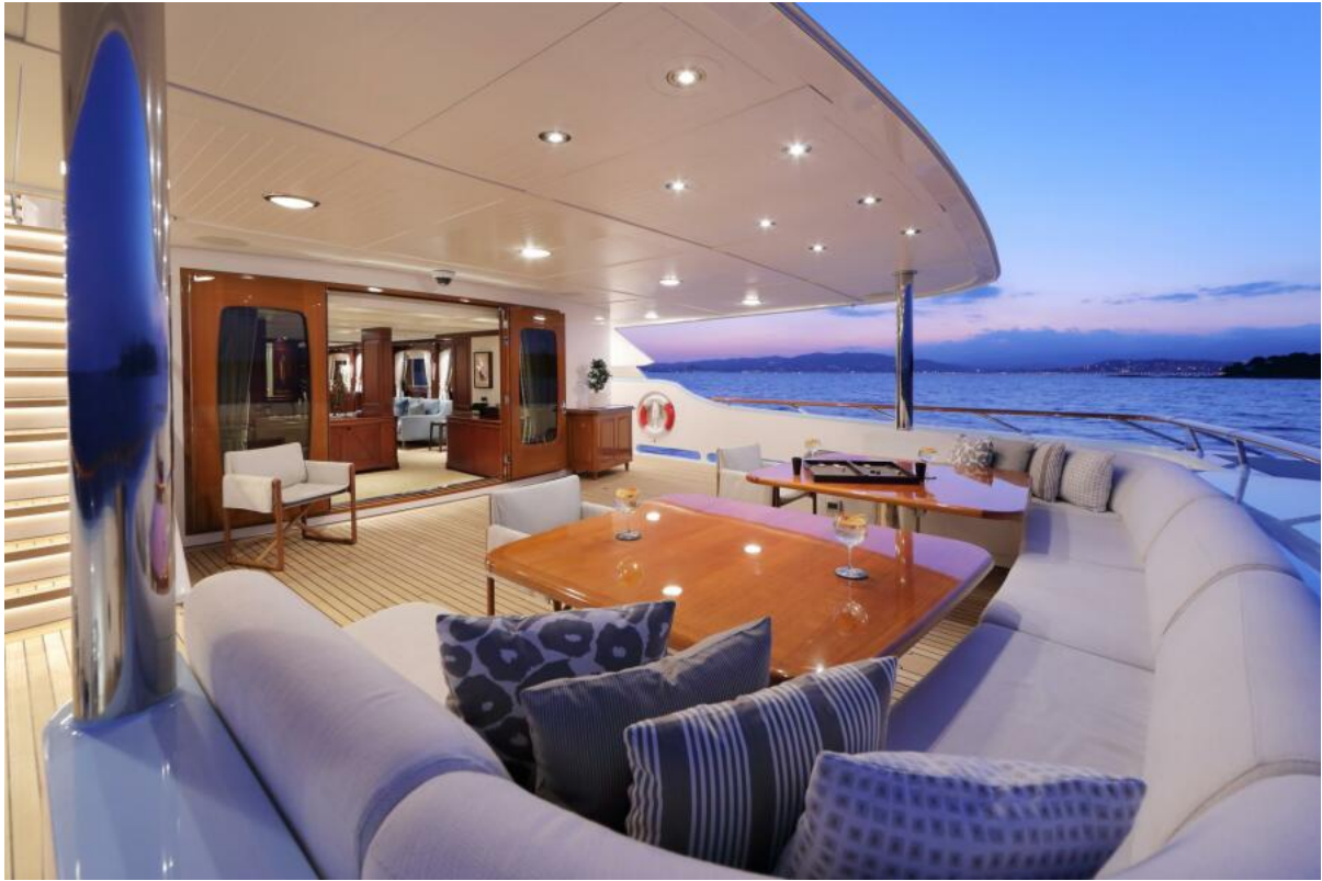
Main Deck Aft Looking To Starboard