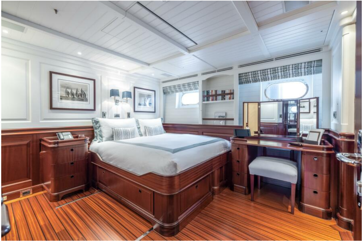
Double Convertible Guest Stateroom