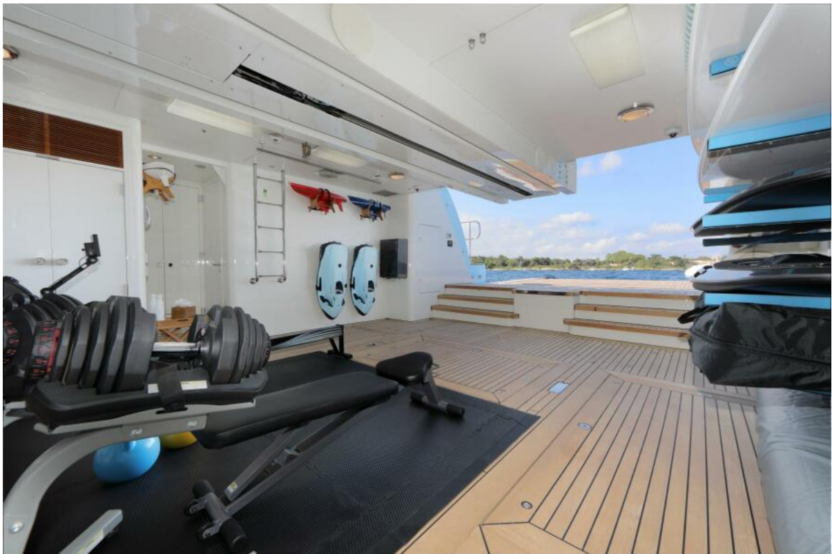
Beach Club, Tender Garage And Gym