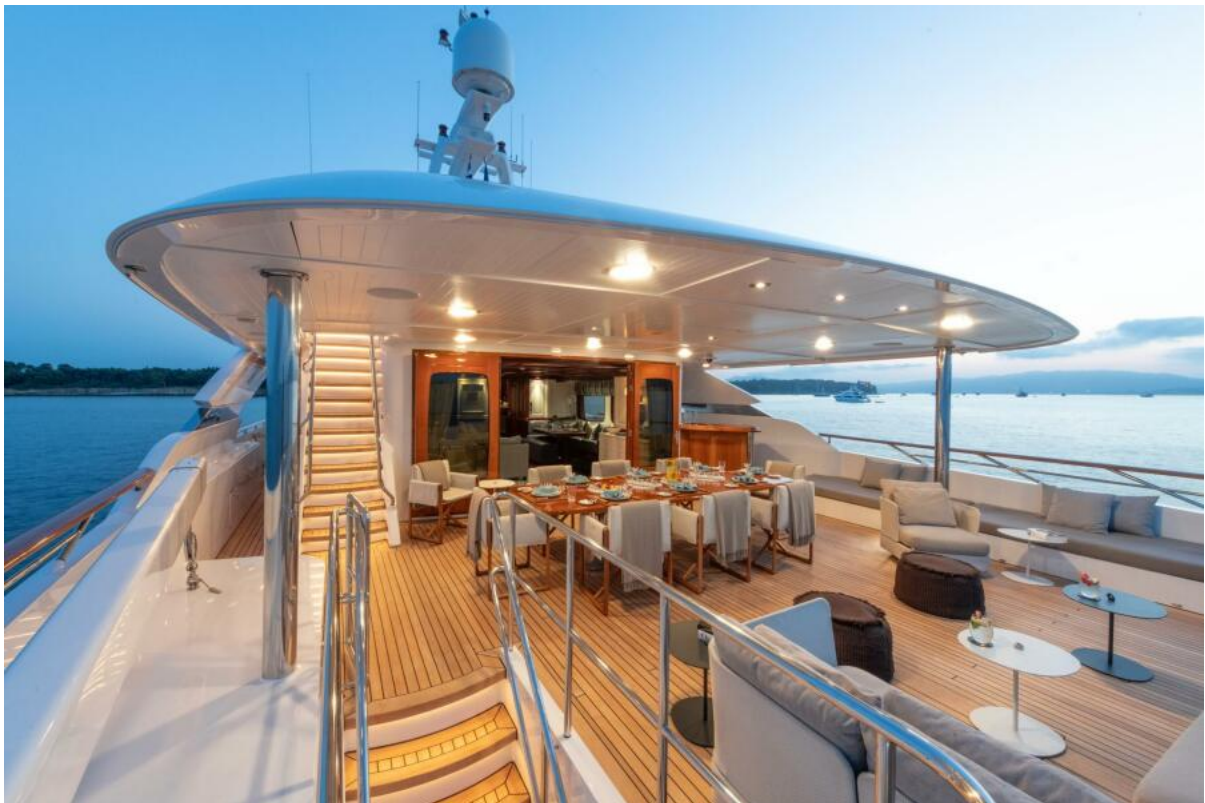
Bridge Deck Aft Dining Looking Forward