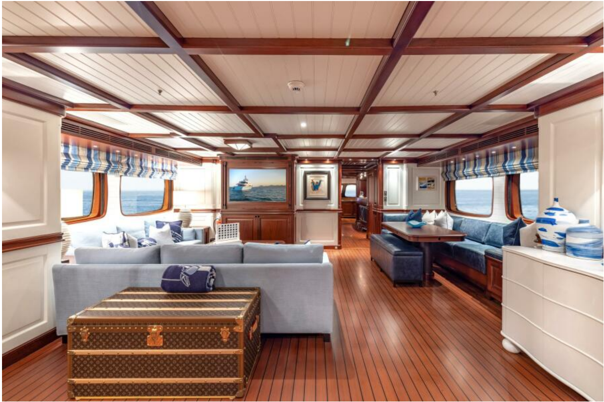
Bridge Deck Salon Looking Forward