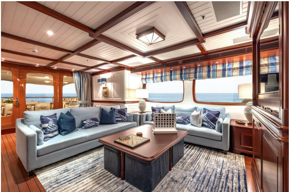
Bridge Deck Salon Looking Aft To Port