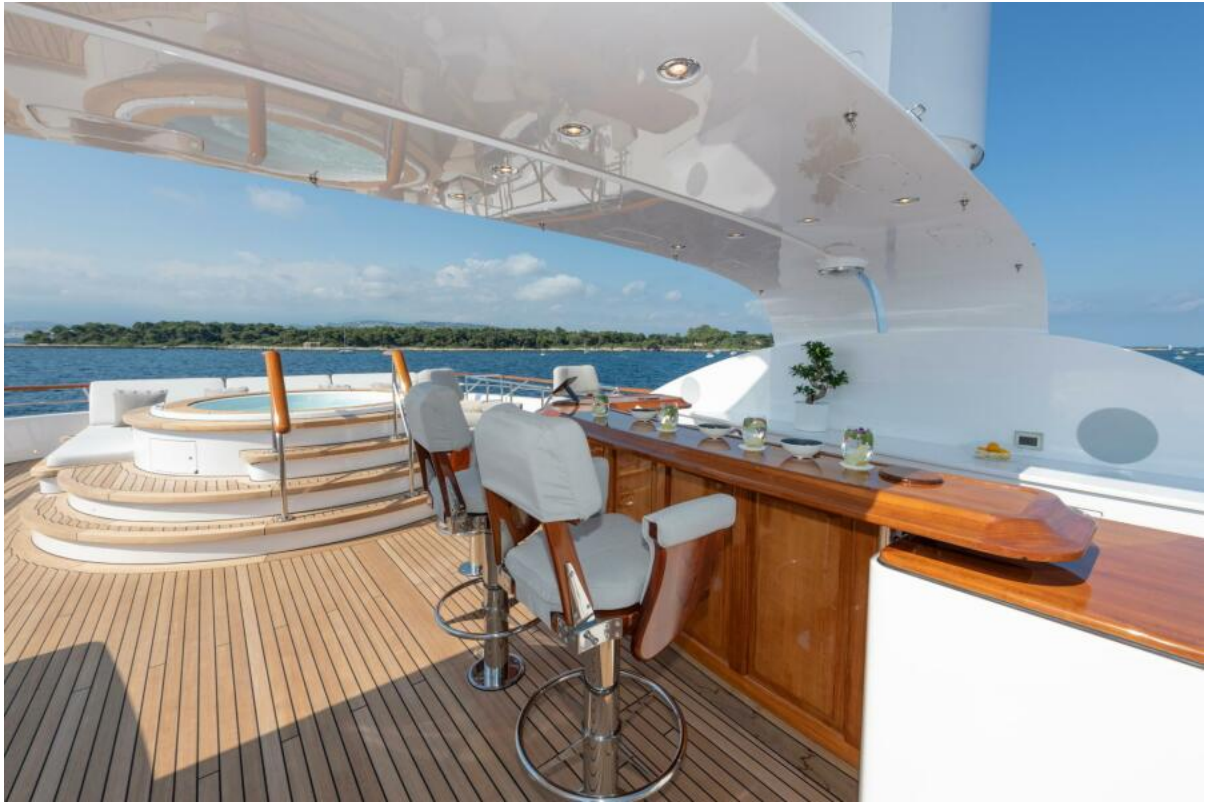
Sundeck Bar And Whirlpool