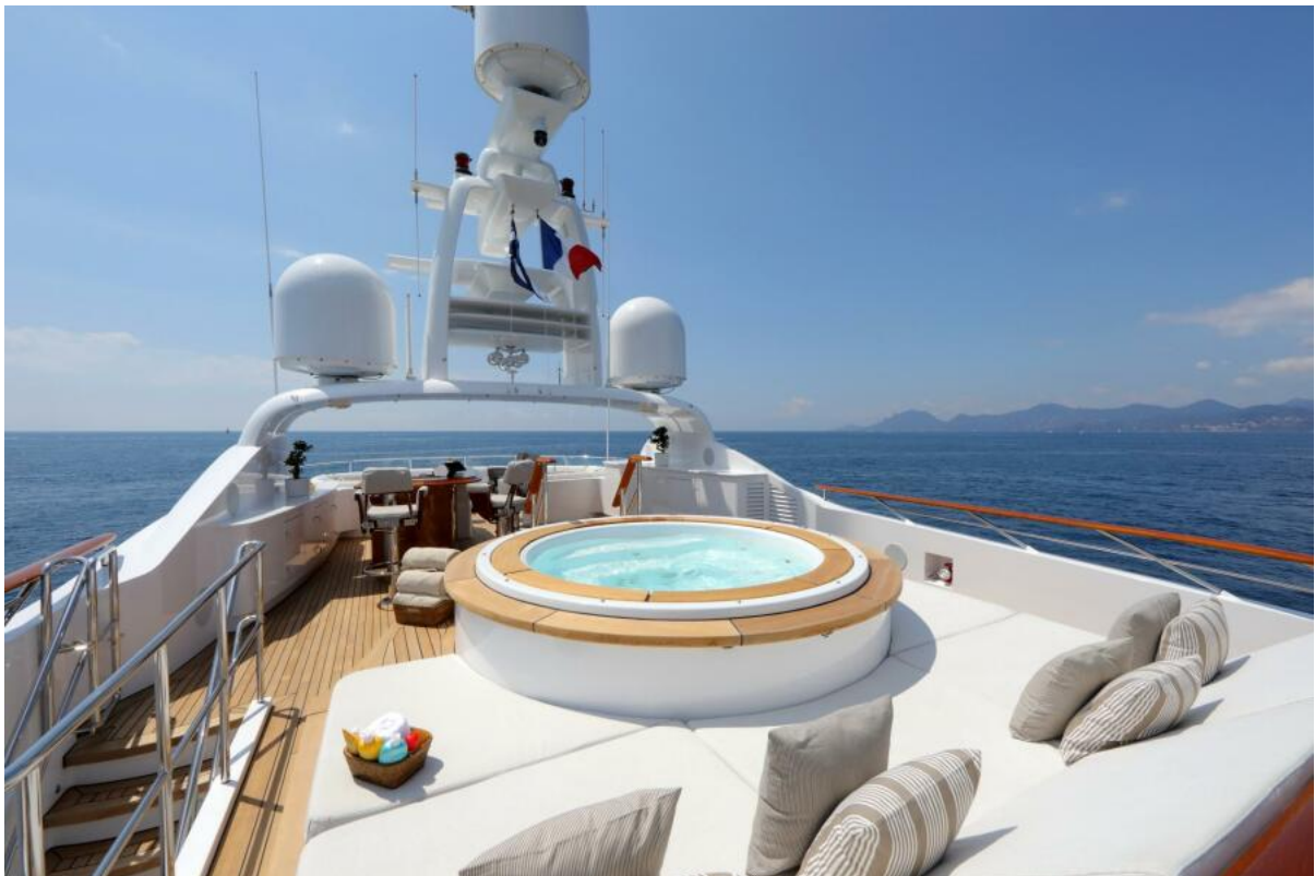
Sundeck Looking Forward