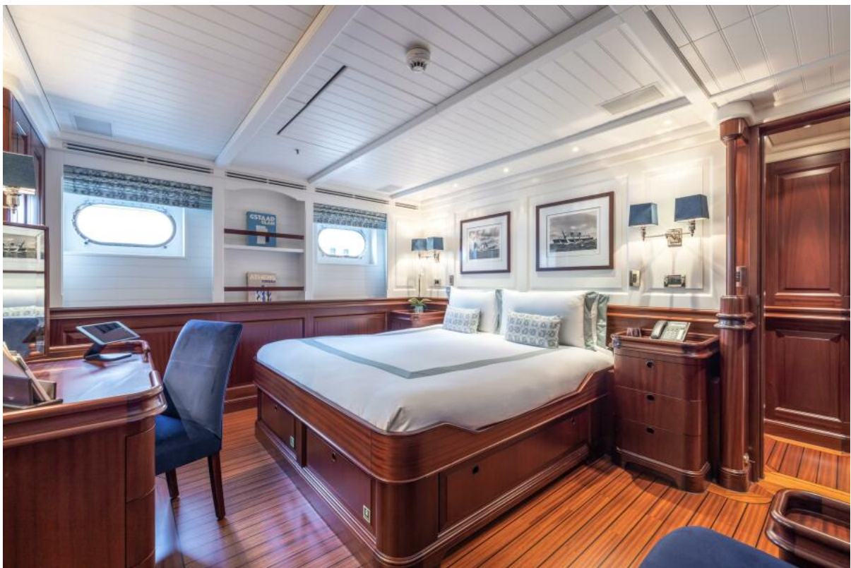
Double Guest Stateroom