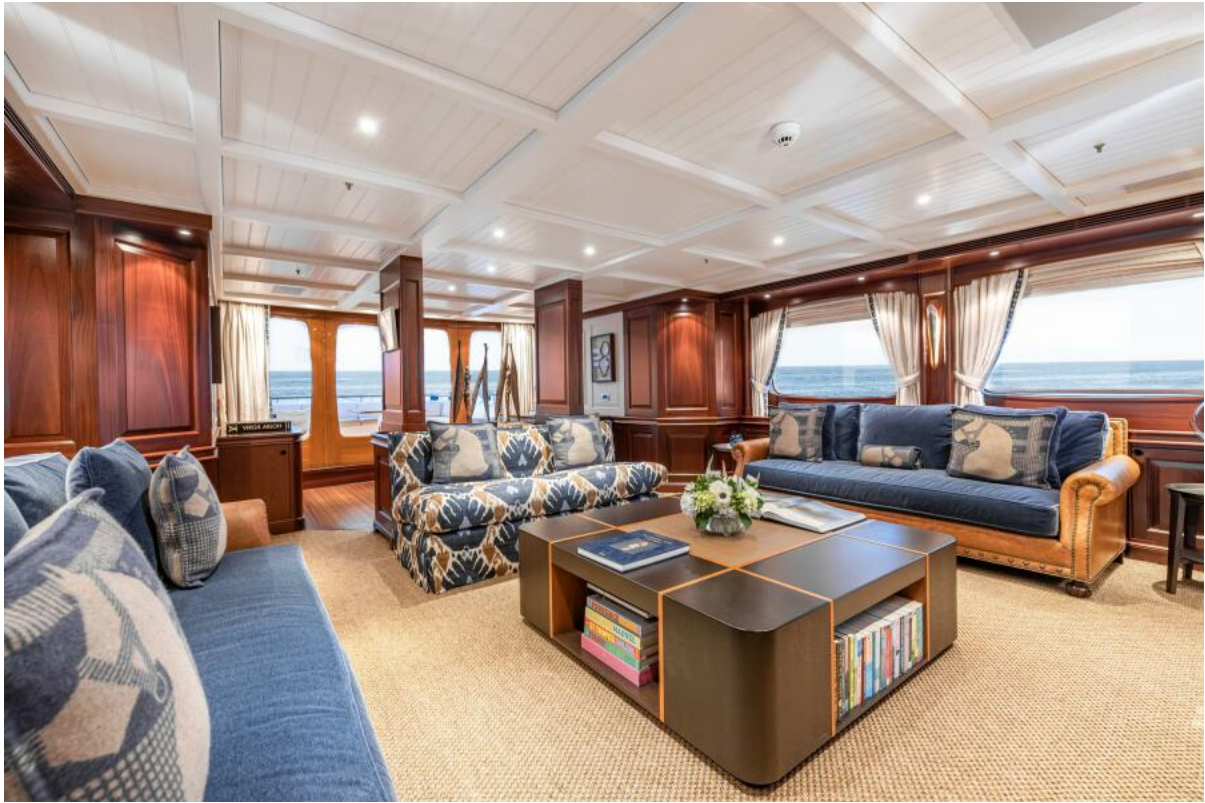
Main Salon Looking Aft To Port