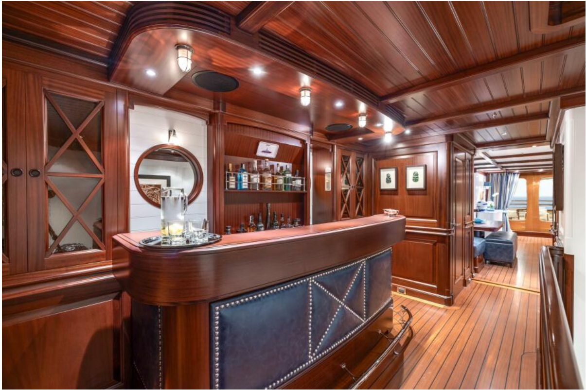
Bridge Deck Bar Starboard Side