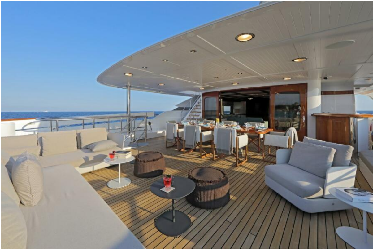
Bridge Deck Aft Dining Looking To Port