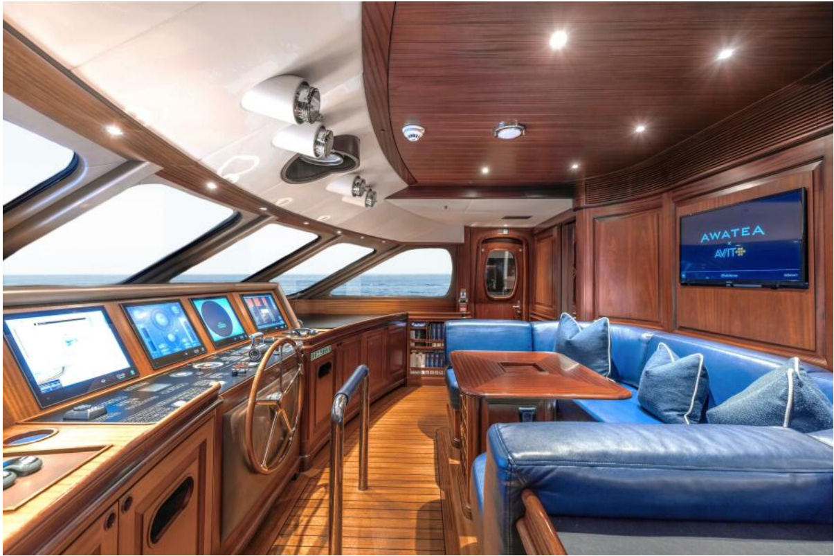
Bridge Looking To Starboard