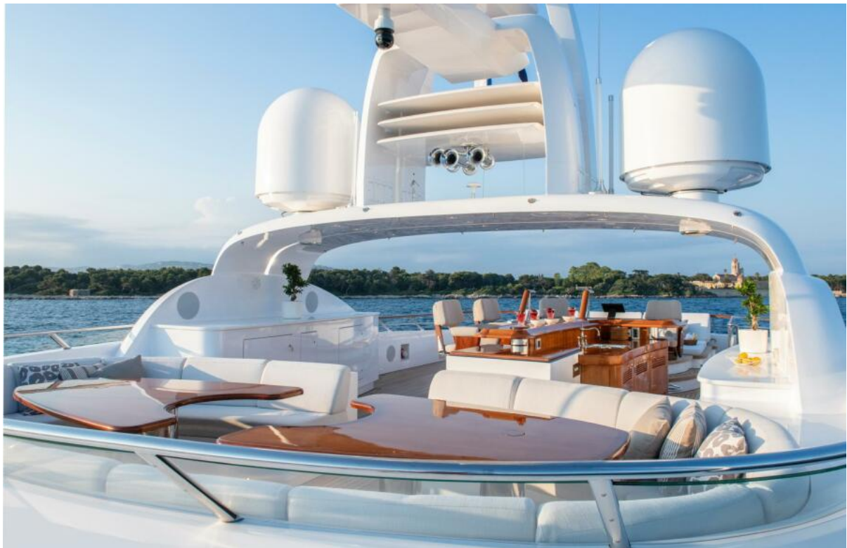
Sundeck Looking Aft