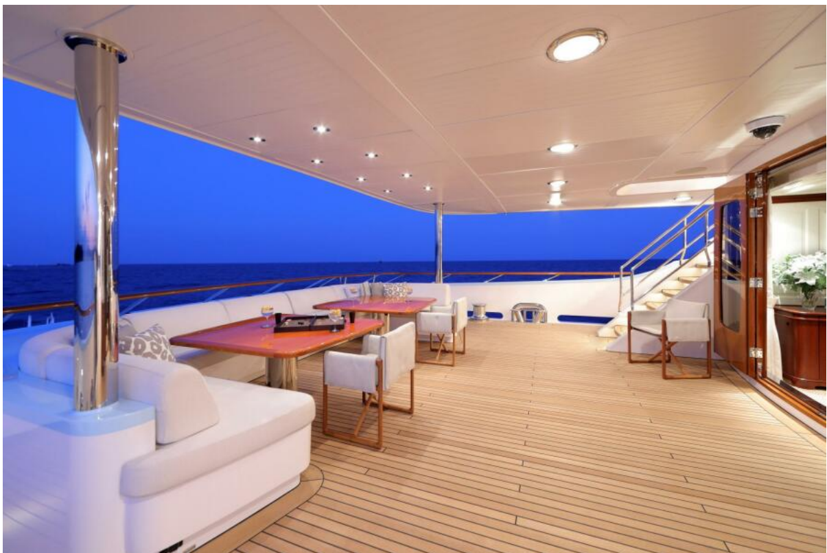
Main Deck Aft Looking To Port