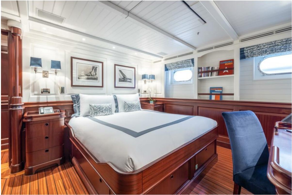
Double Guest Stateroom