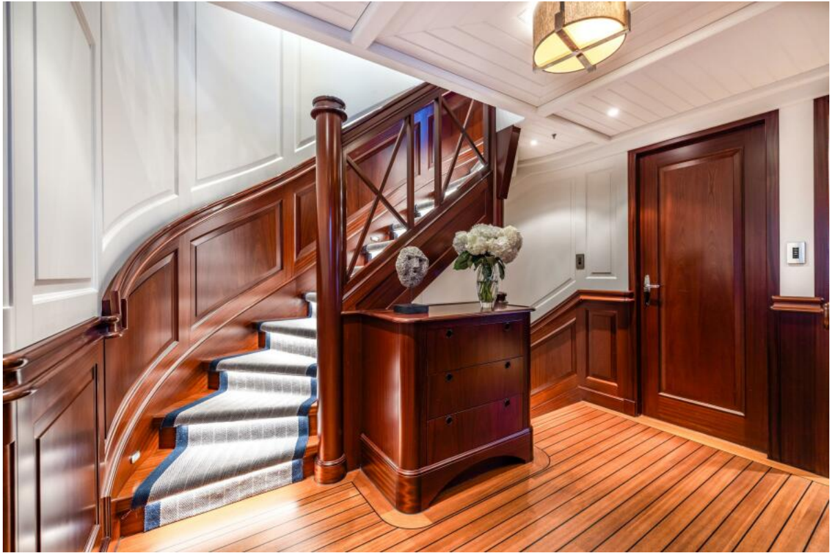
Main Deck Foyer Starboard Side