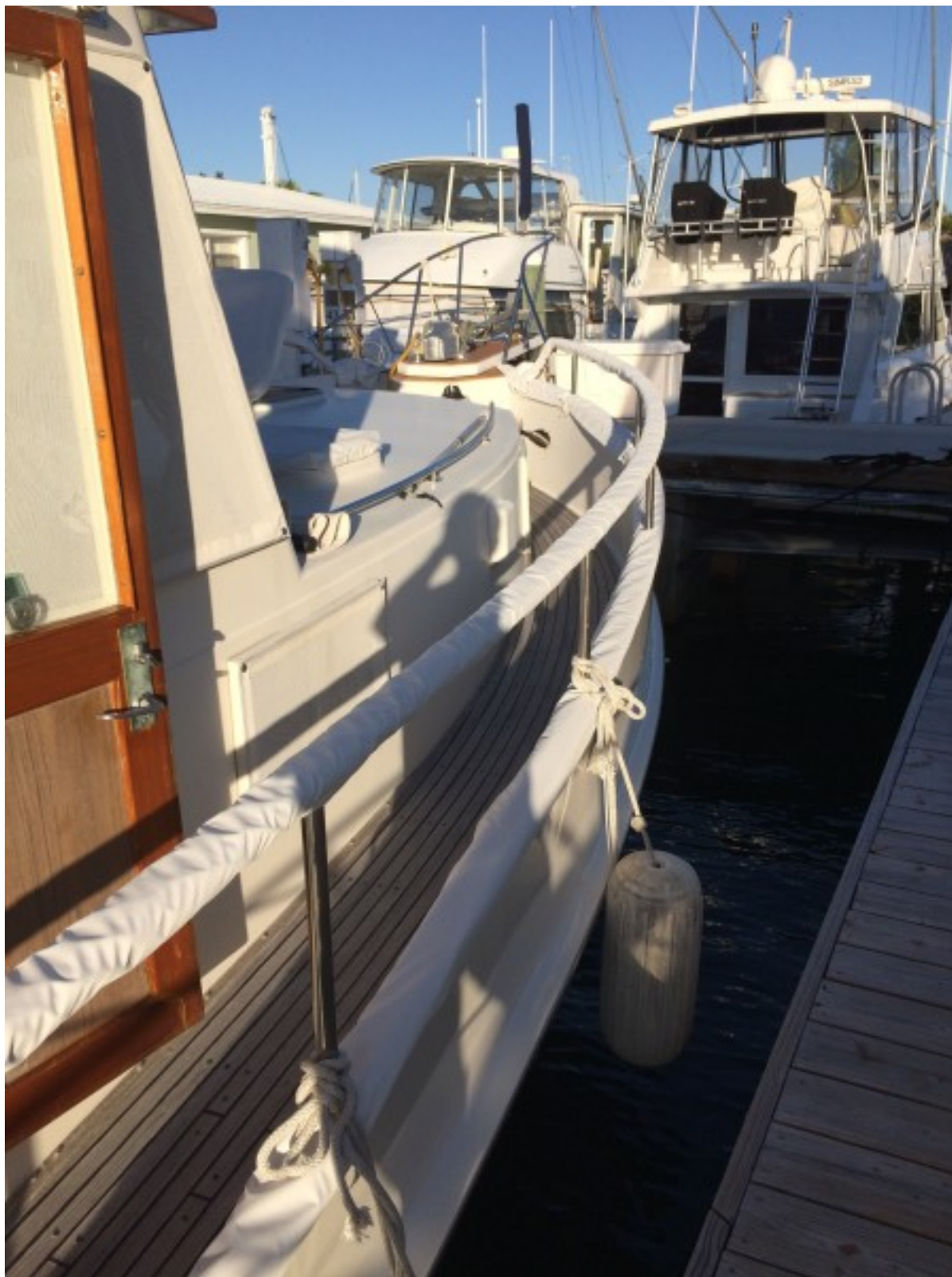
Custom Made Teak Covers