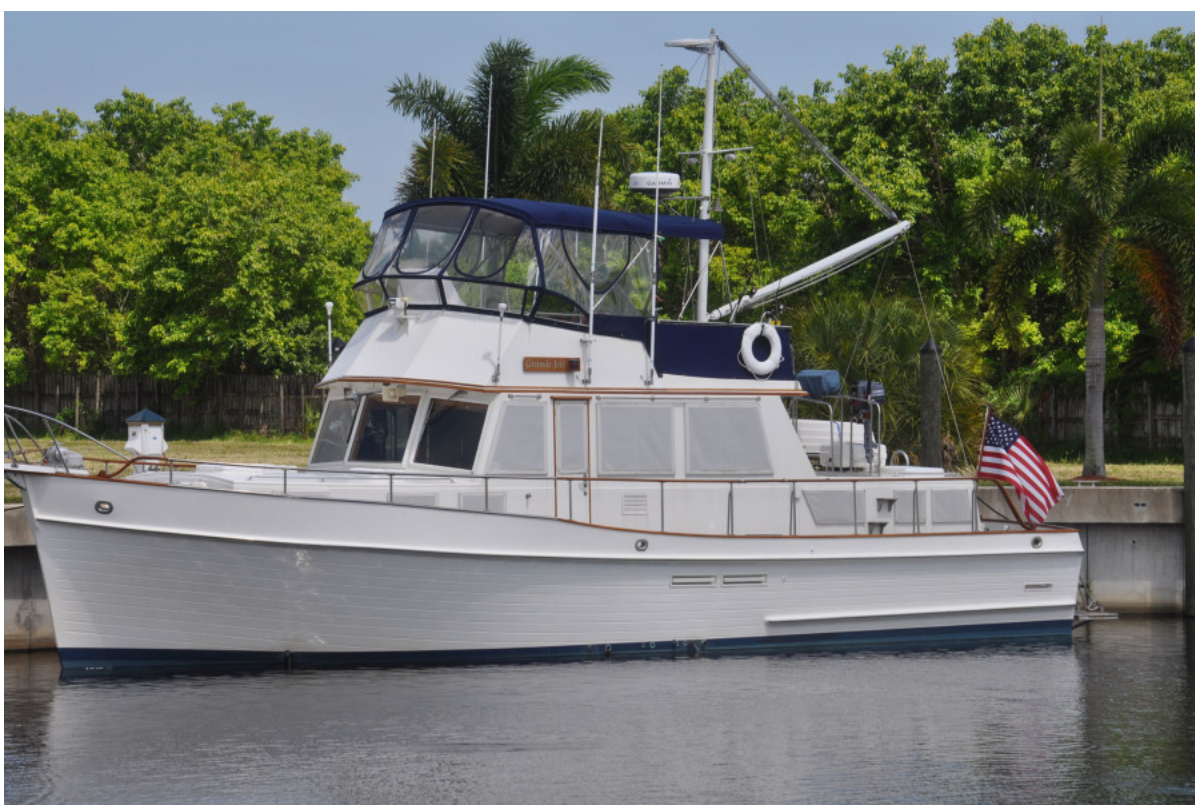
Port Side View