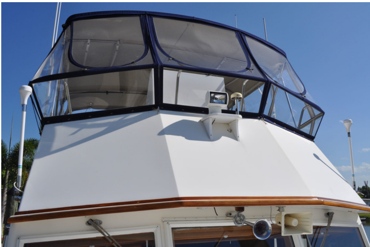
Flybridge With 4 Sided Enclosure