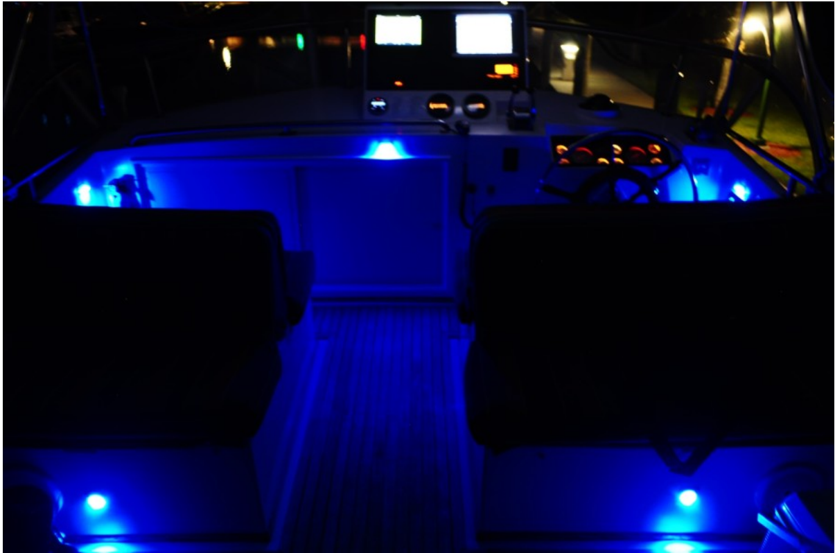
Flybridge Night Lighting