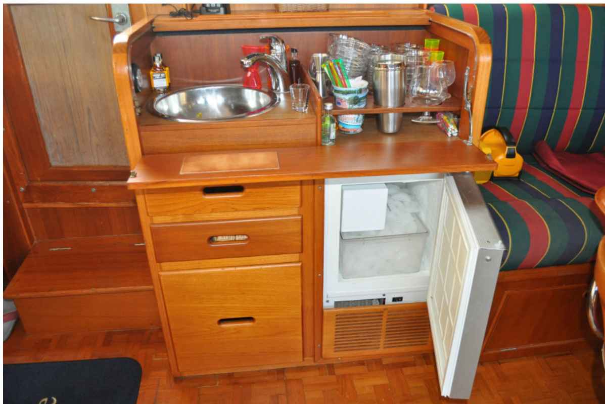
Salon Bar Cabinet With Drawer Storage And Ice Maker