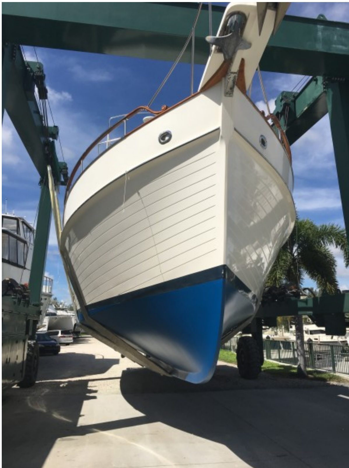
New Bottom Paint And Boot Stripe