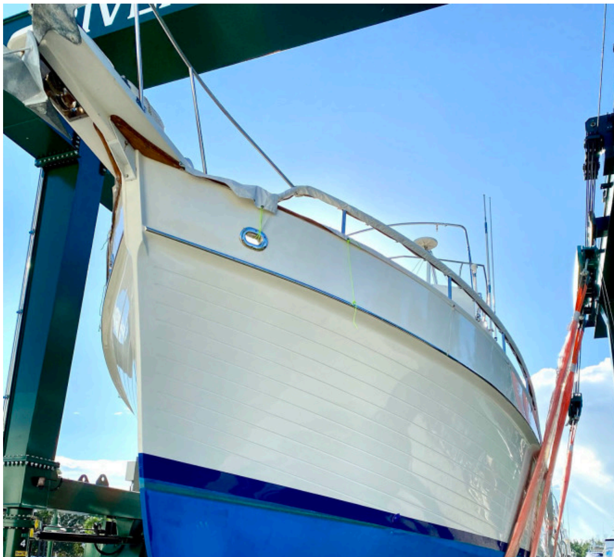
Port Bow View In Slings