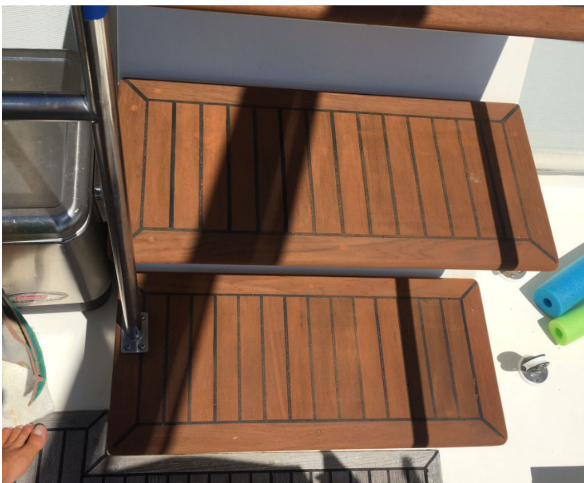
Teak Steps To Flybridge