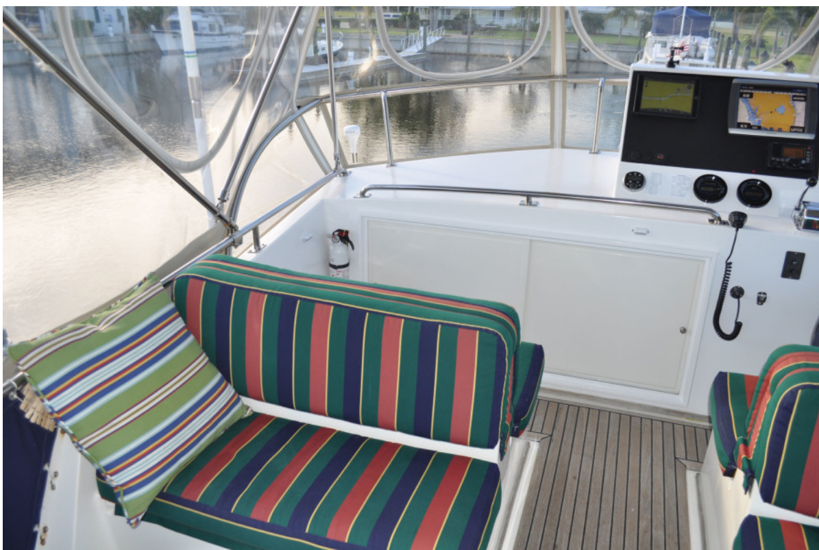
Double Wide Back To Back Helm And Companion Seating