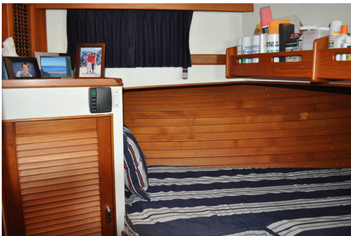
Forward V-Berth To Port