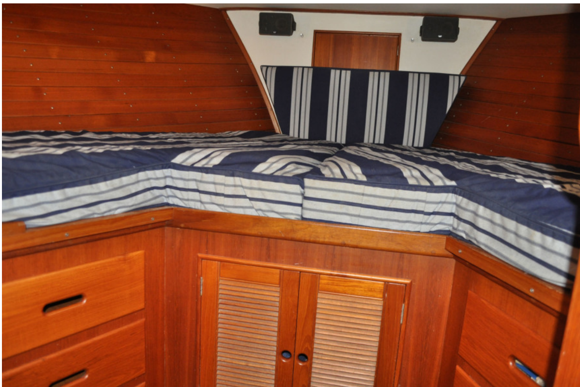
Forward Guest Stateroom