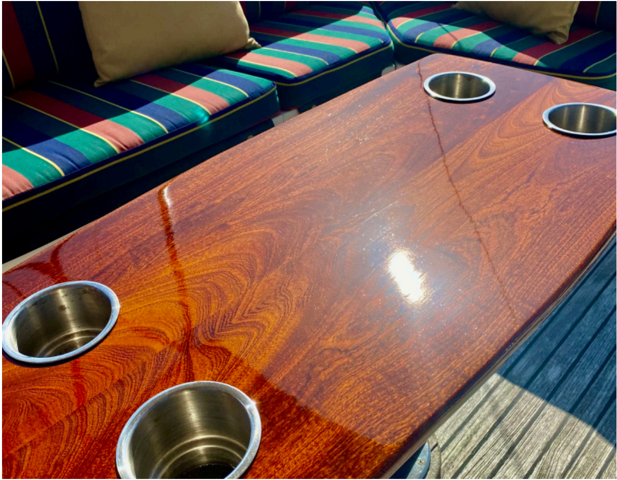
Mahogany Table With Drink Holders