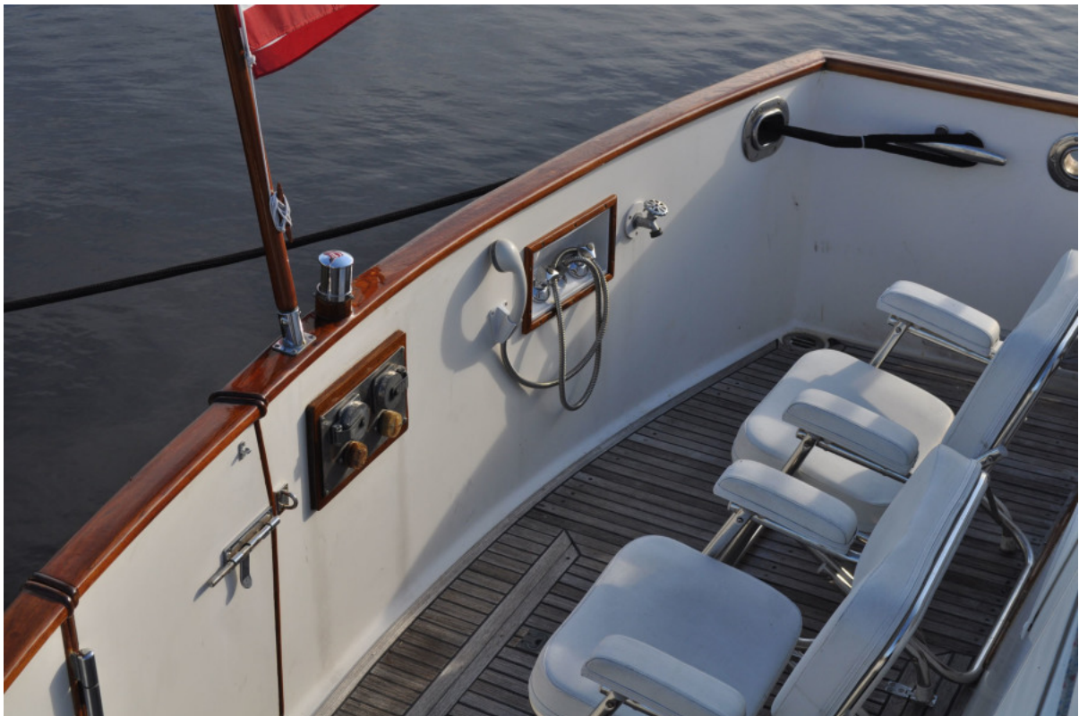
Teak Decks On Side, Cockpit And Bridge