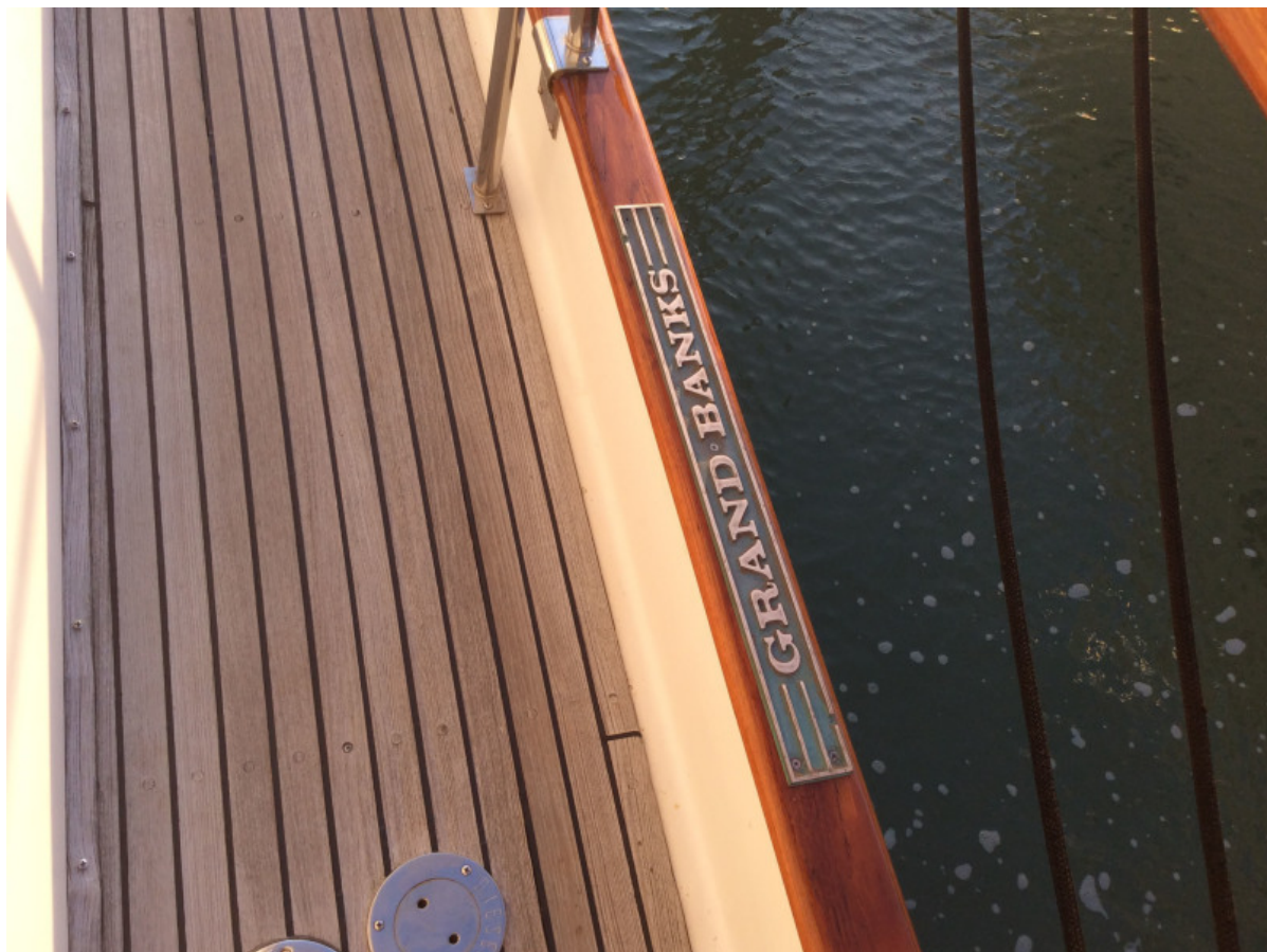
Teak Decks With Bronze Step Plates