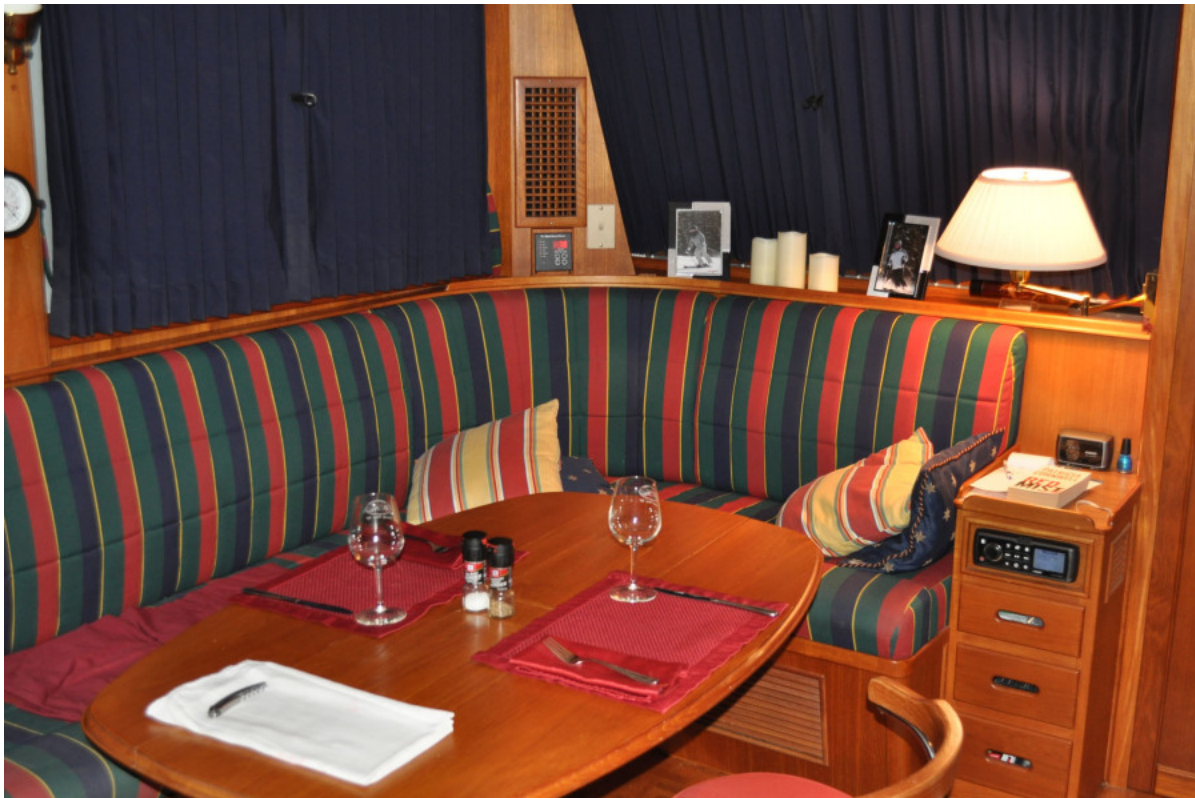
Salon L-Shaped Settee