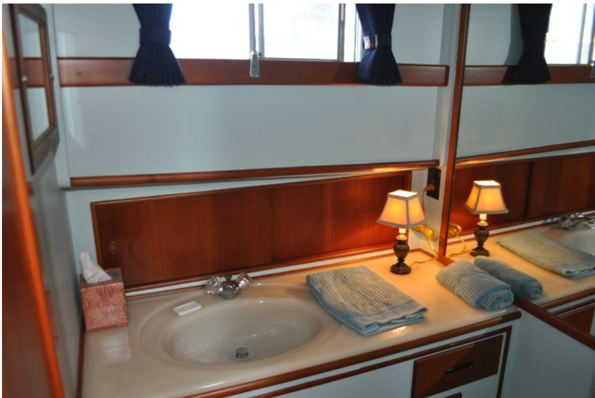
Forward En-Suite Head And Shower