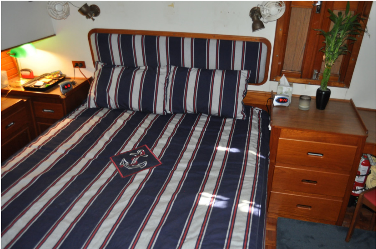
Master Island Queen Berth Stateroom