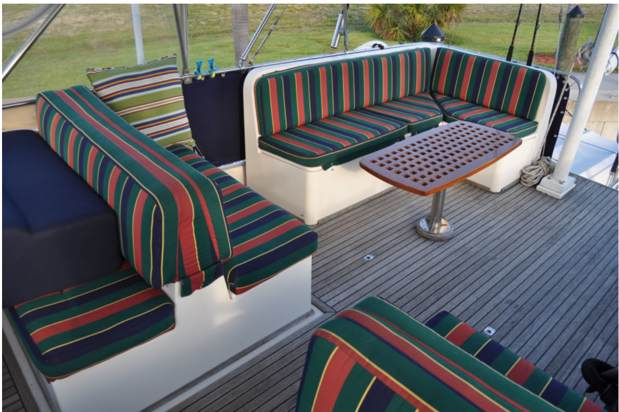
L-Shaped Seating Aft