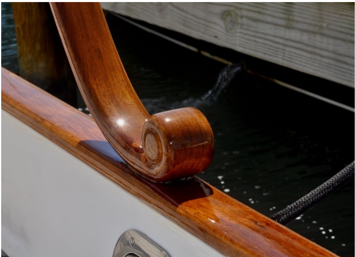
Beautiful Bright Work