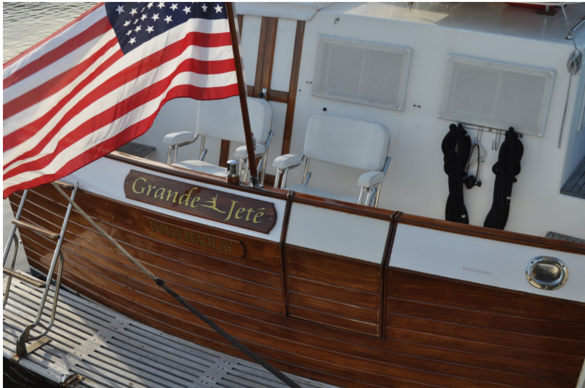
Transom And Swim Platform