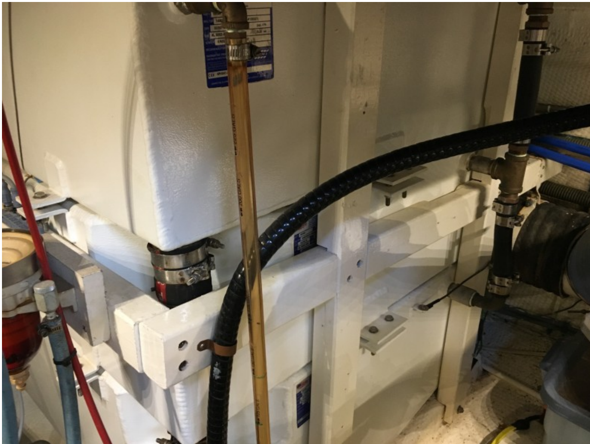
Three Aluminum Port Side Fuel Tanks