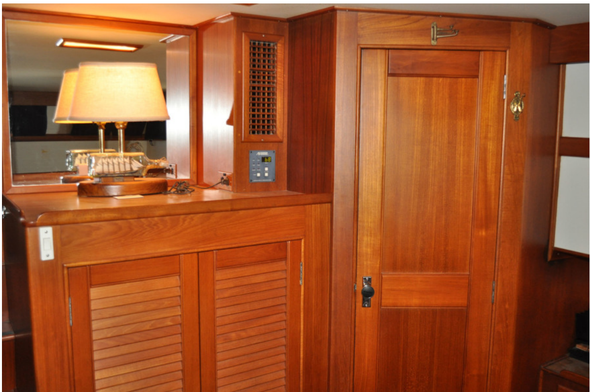
Master Stateroom Cedar Closet And Seperate Shower