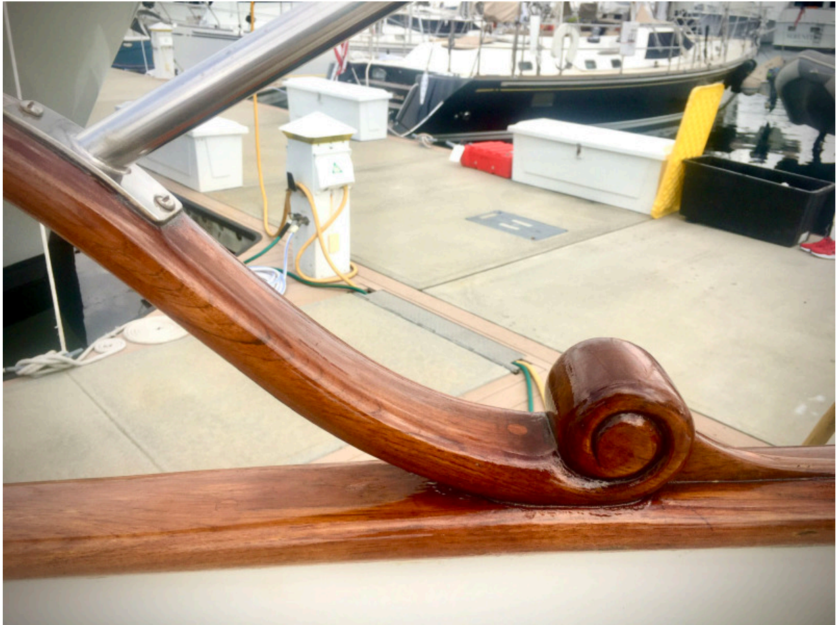
Teak Cap Rails