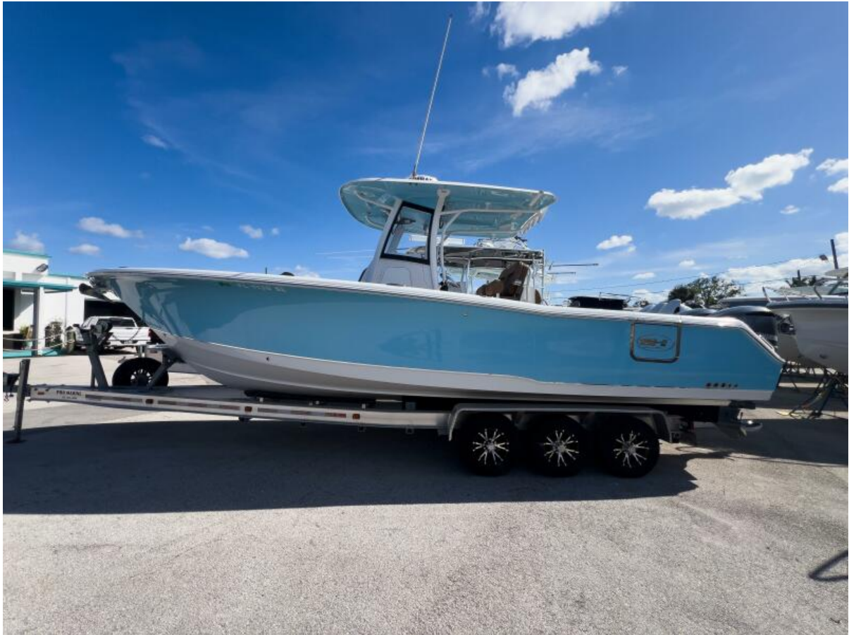
2018 30 Sea Hunt