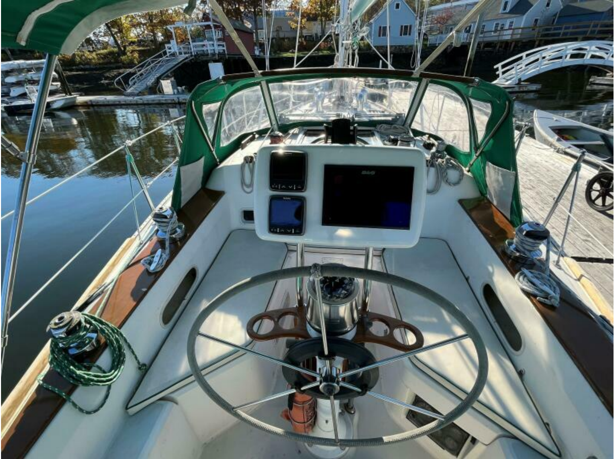
Sabre 34 Targa Dragonfly5