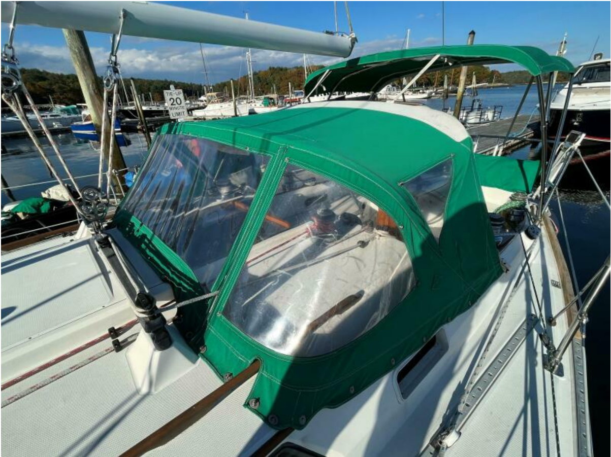
Sabre 34 Targa Dragonfly7