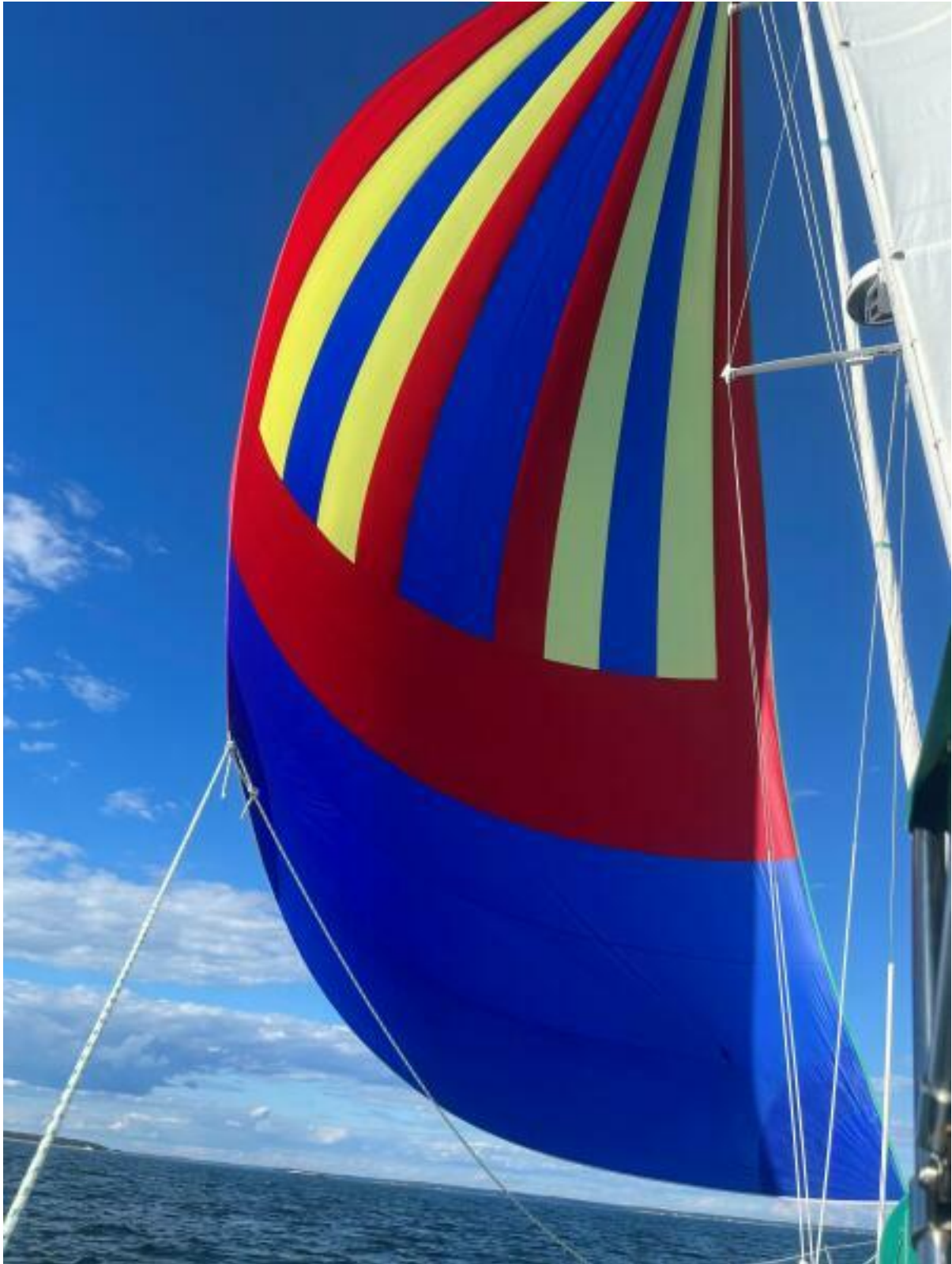
Sabre 34 Targa Dragonfly