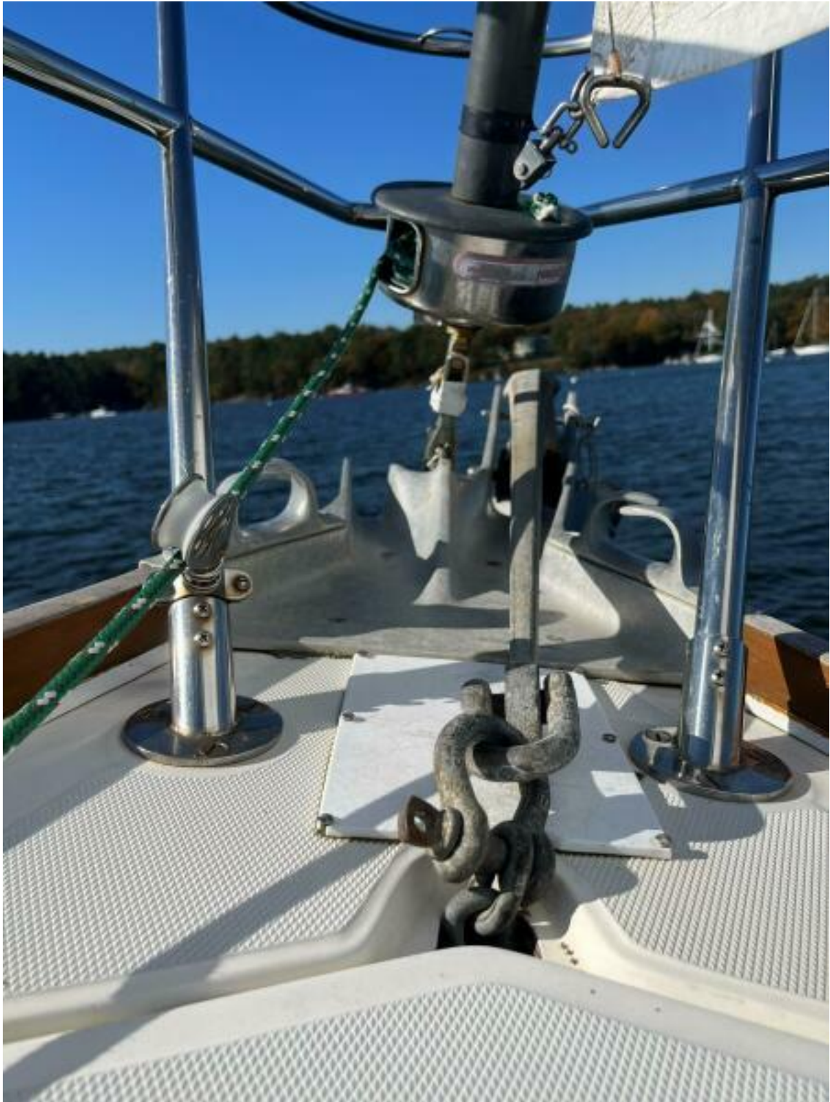
Sabre 34 Targa Dragonfly26