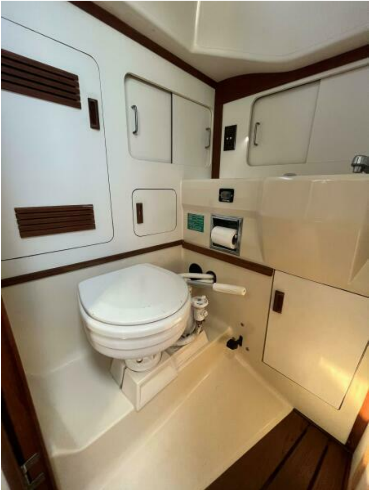
Sabre 34 Targa Dragonfly29