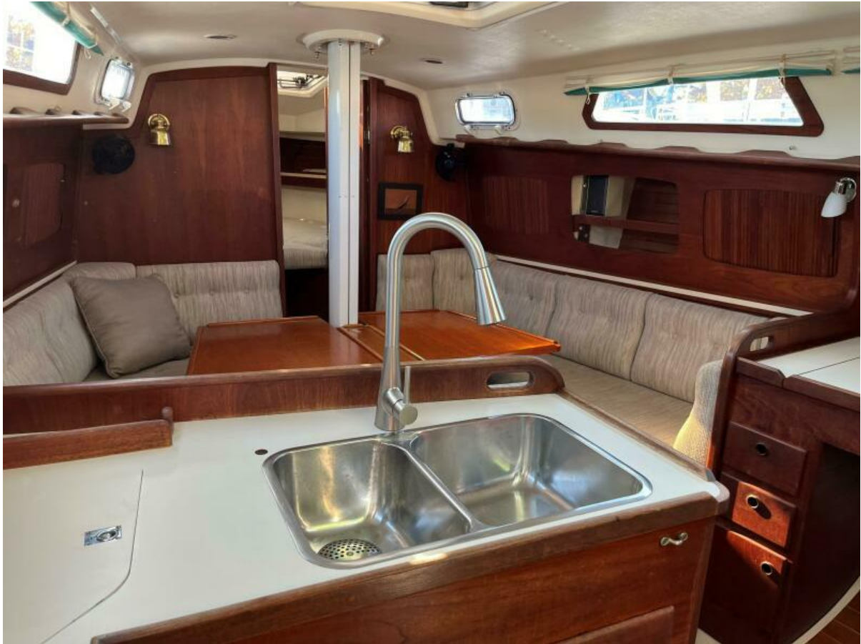
Sabre 34 Targa Dragonfly14