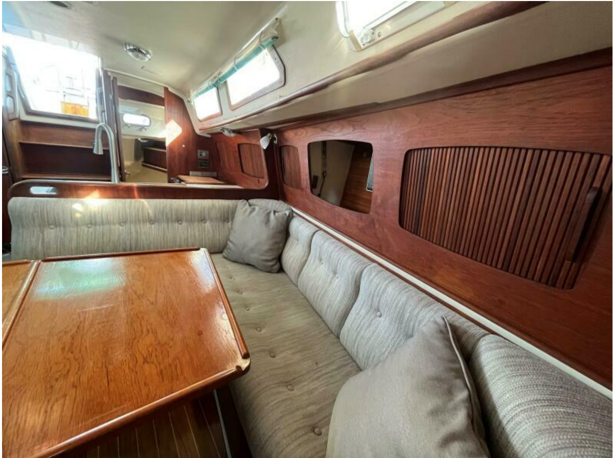
Sabre 34 Targa Dragonfly21