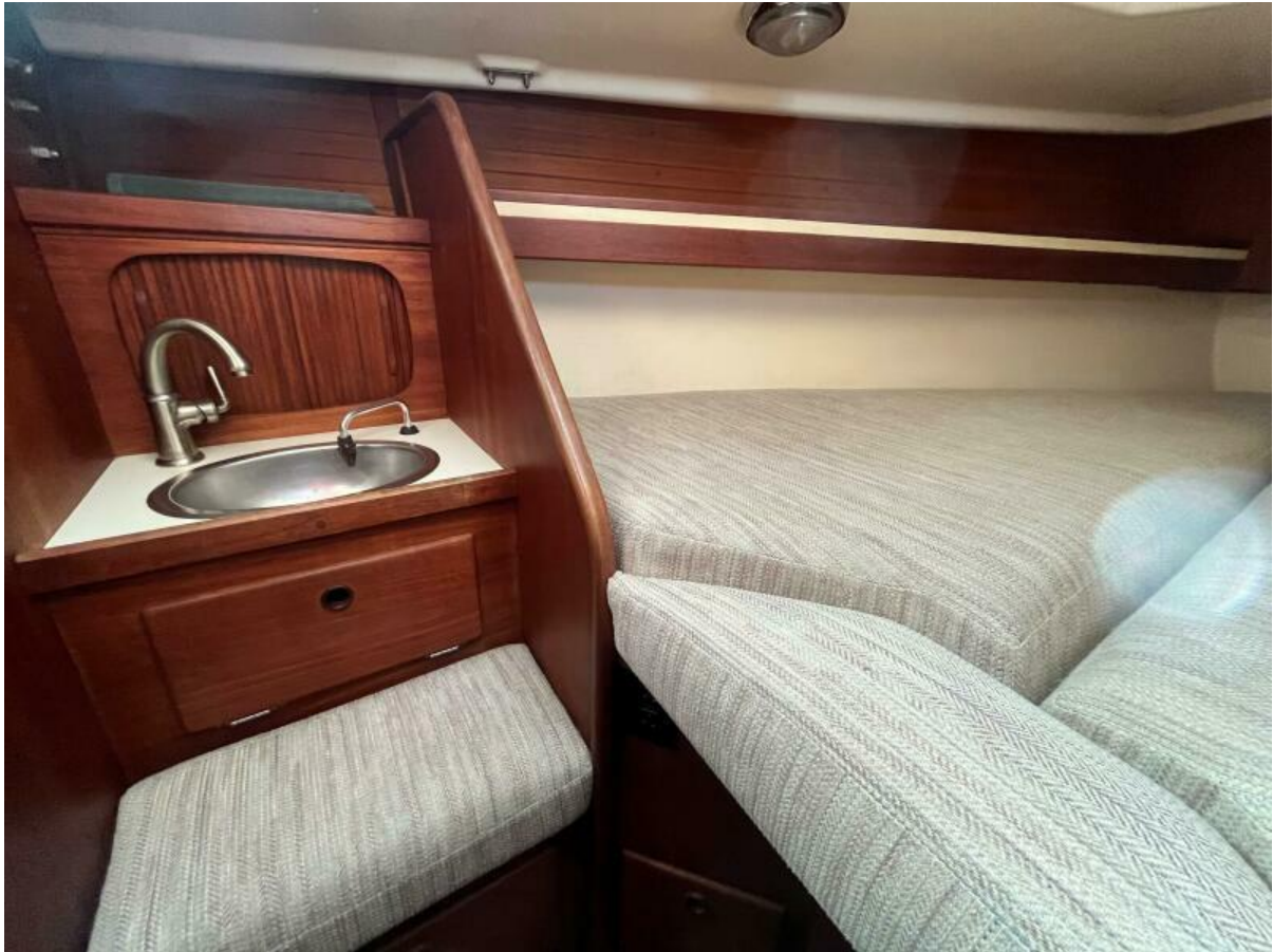
Sabre 34 Targa Dragonfly33