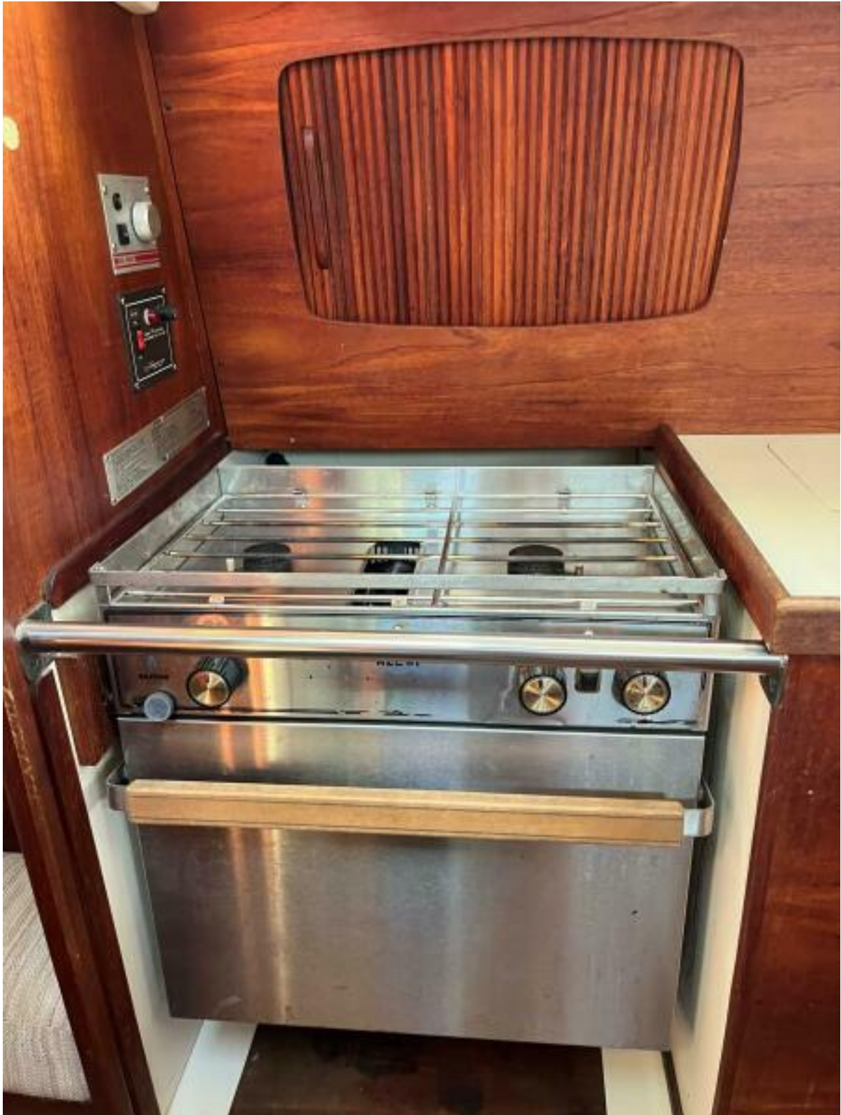
Sabre 34 Targa Dragonfly11