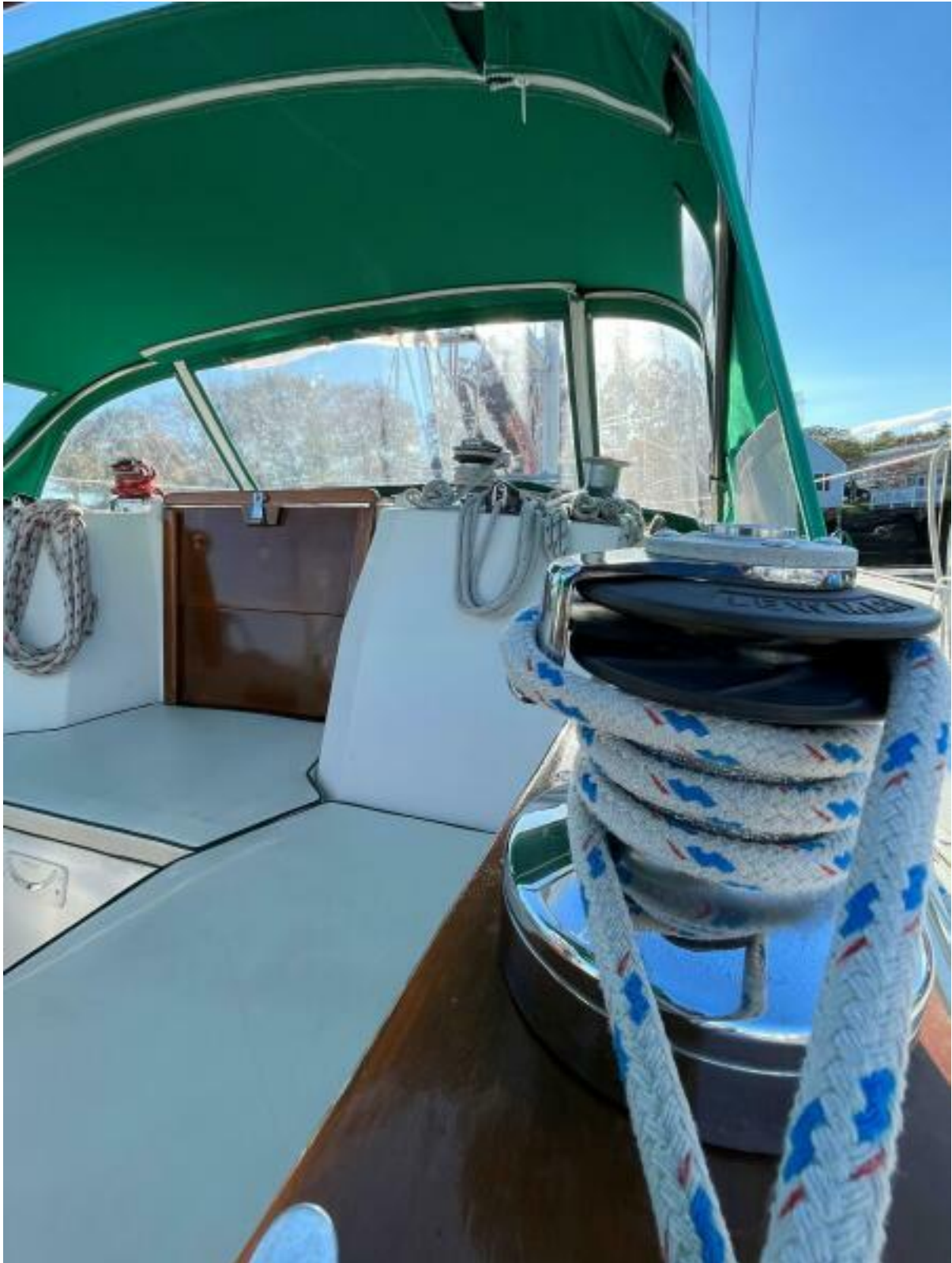
Sabre 34 Targa Dragonfly4