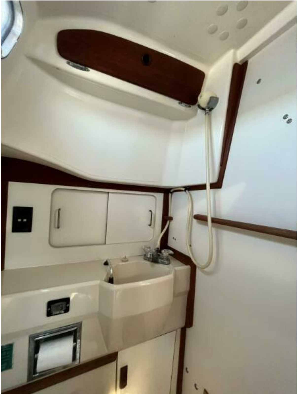
Sabre 34 Targa Dragonfly30