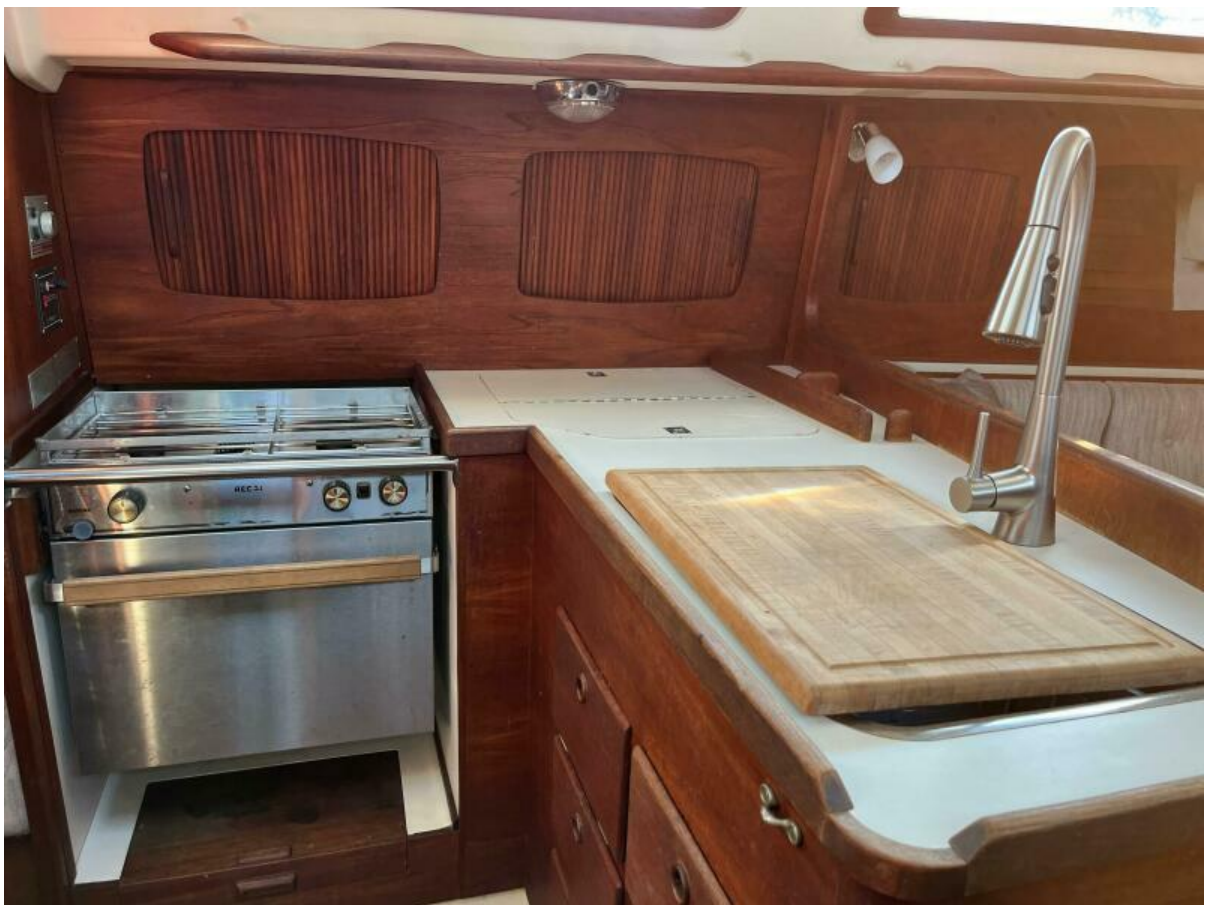
Sabre 34 Targa Dragonfly15