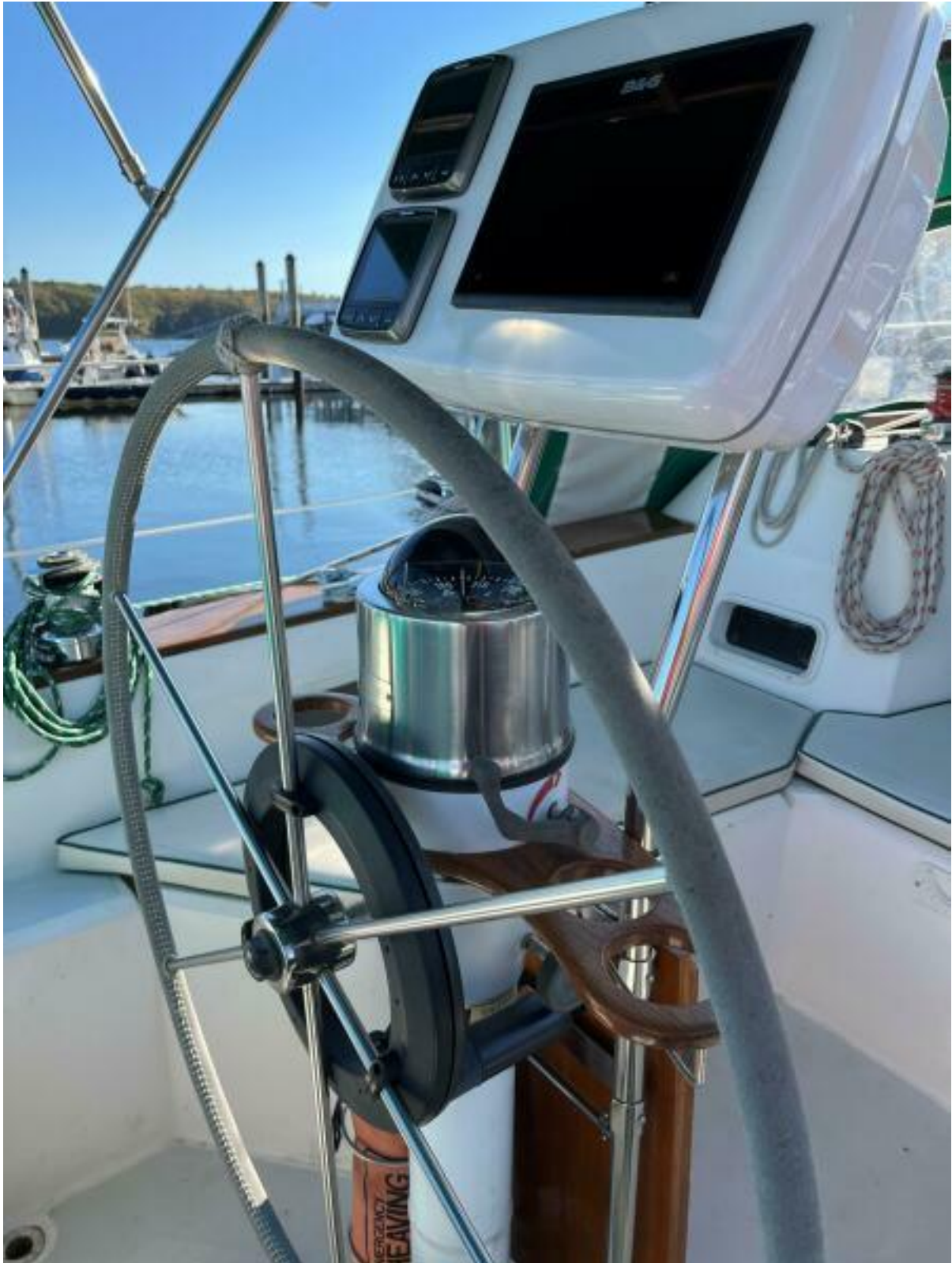
Sabre 34 Targa Dragonfly3