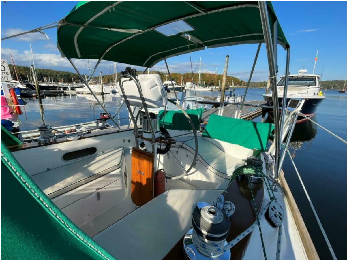
Sabre 34 Targa Dragonfly6