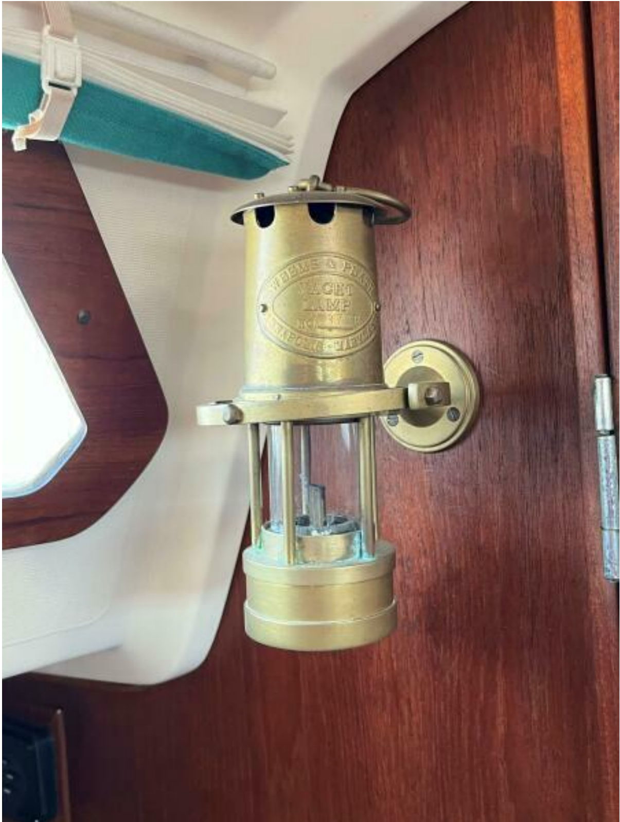
Sabre 34 Targa Dragonfly13