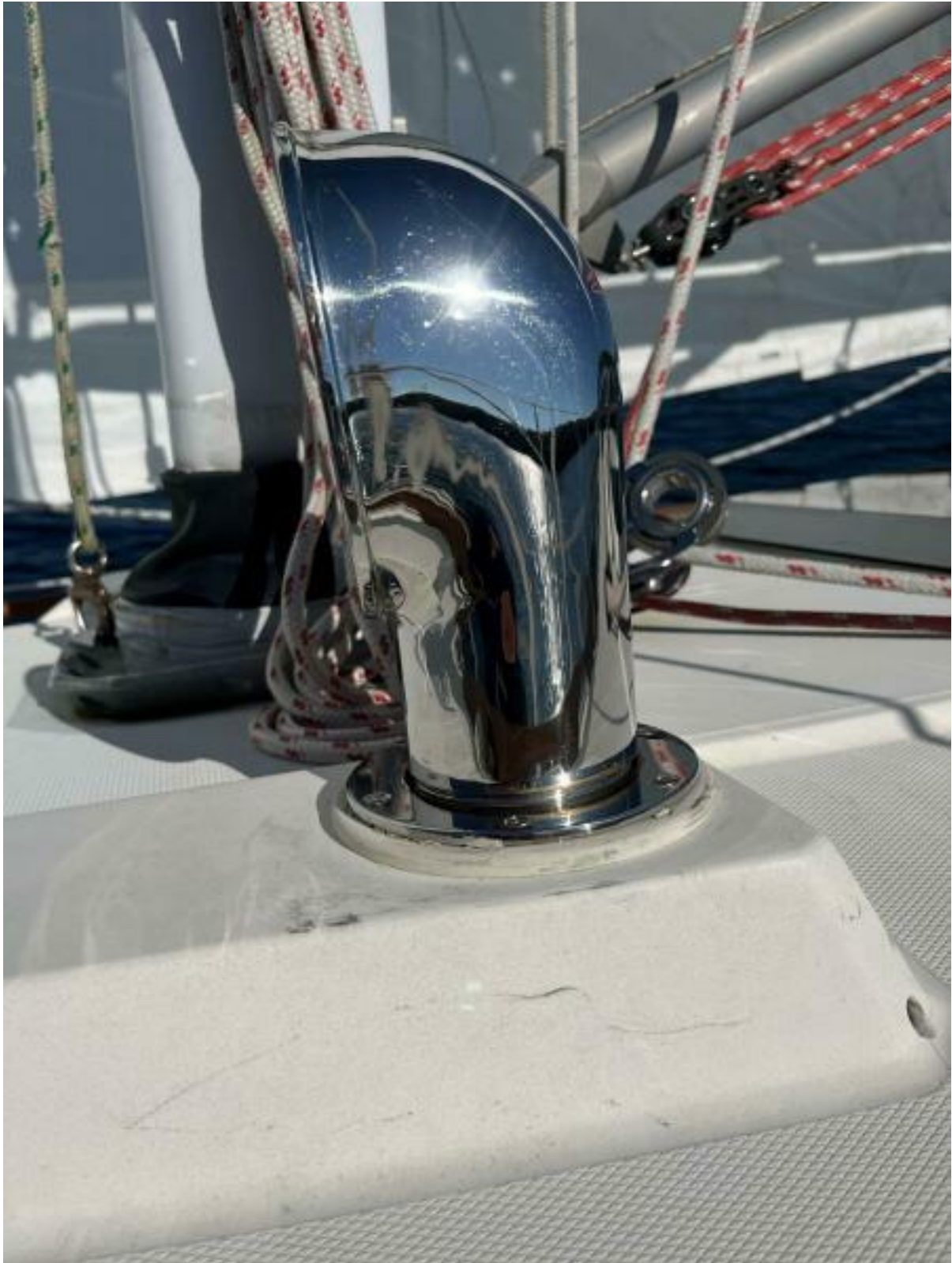
Sabre 34 Targa Dragonfly25