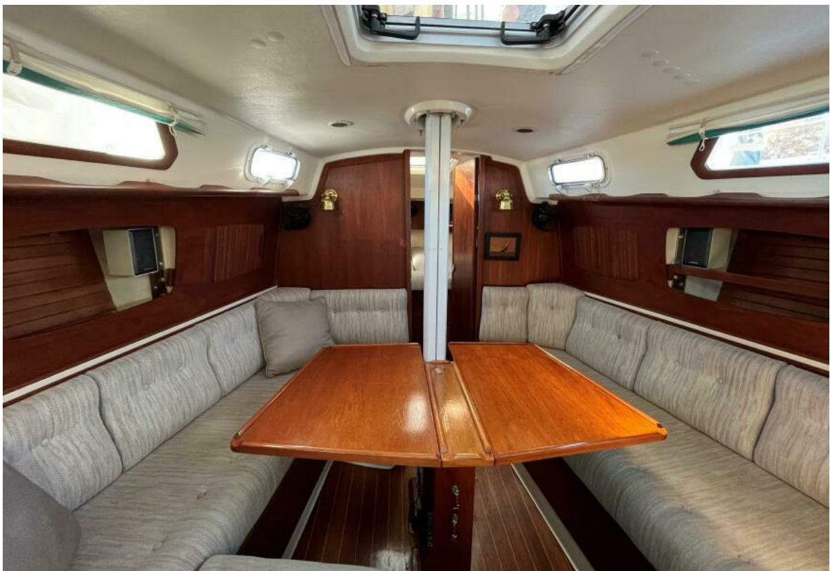
Sabre 34 Targa Dragonfly20