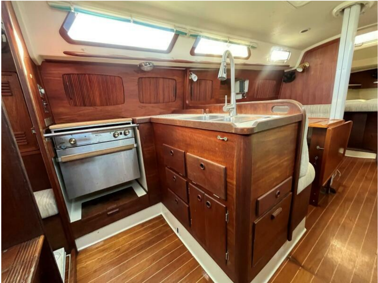
Sabre 34 Targa Dragonfly22