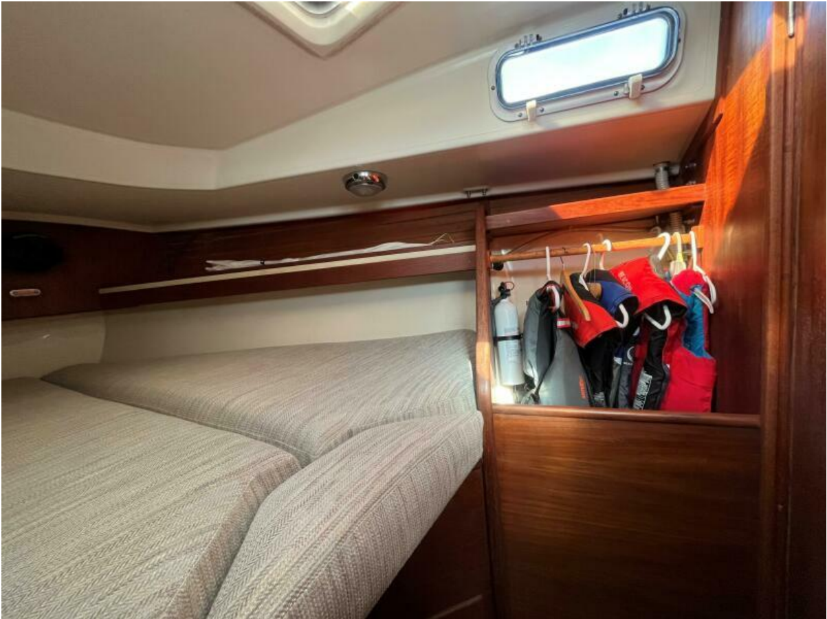
Sabre 34 Targa Dragonfly32