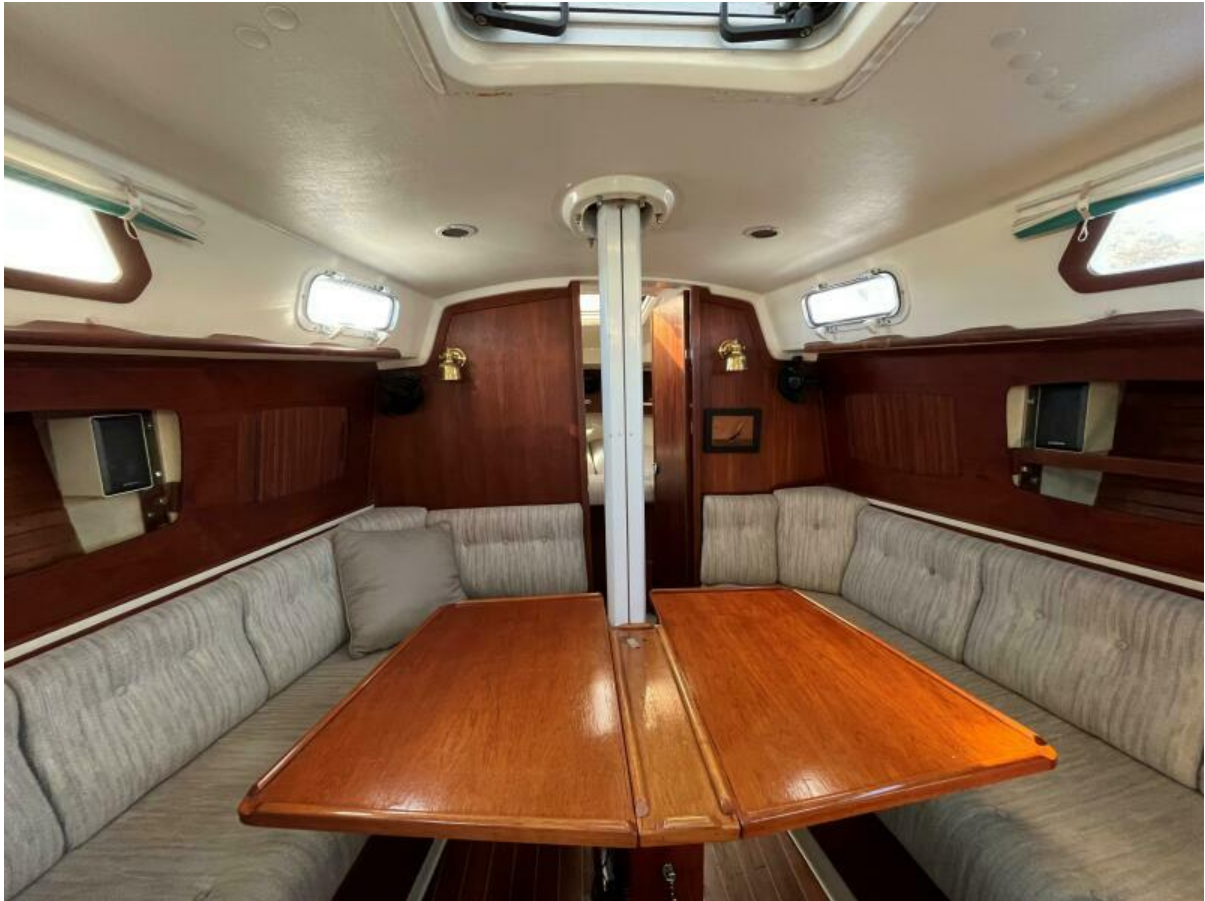
Sabre 34 Targa Dragonfly19