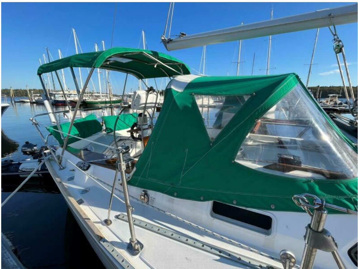
Sabre 34 Targa Dragonfly9