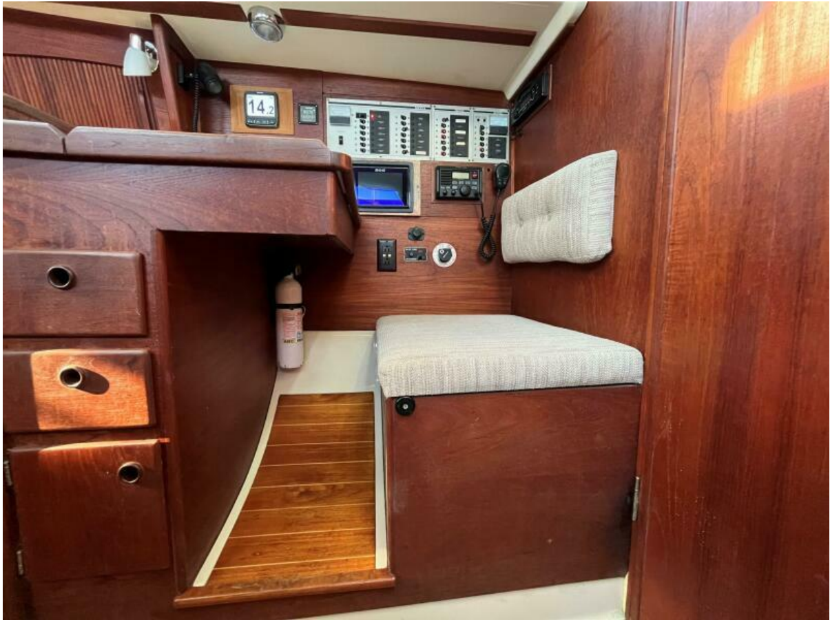
Sabre 34 Targa Dragonfly17