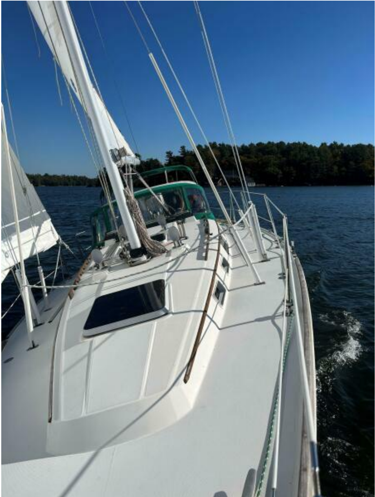
Sabre 34 Targa Dragonfly27