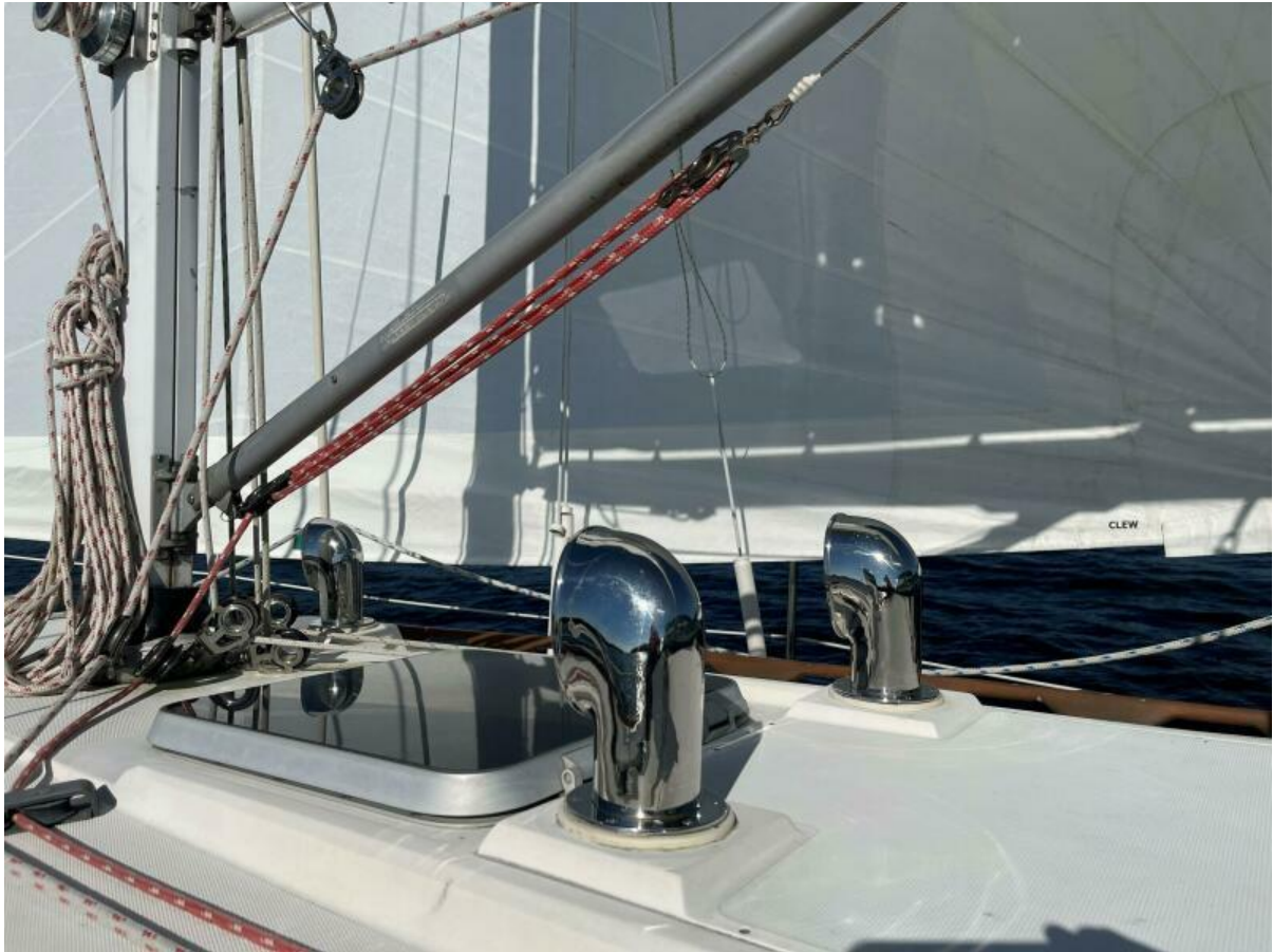
Sabre 34 Targa Dragonfly24