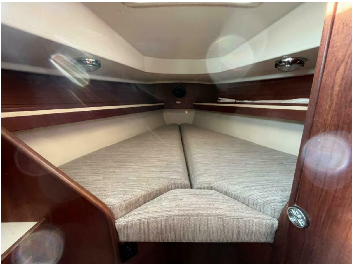
Sabre 34 Targa Dragonfly31