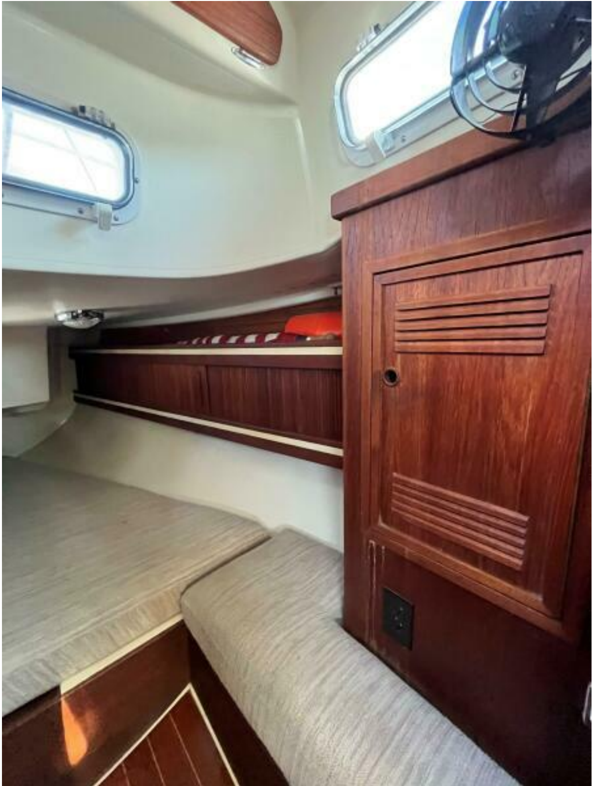
Sabre 34 Targa Dragonfly28