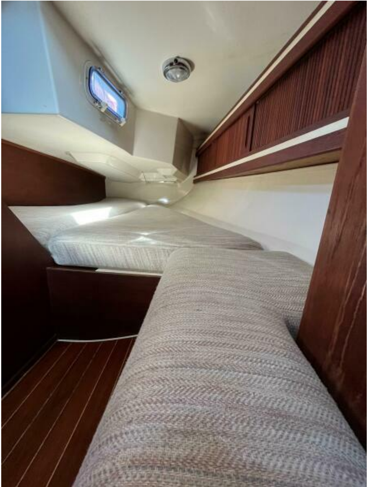
Sabre 34 Targa Dragonfly16