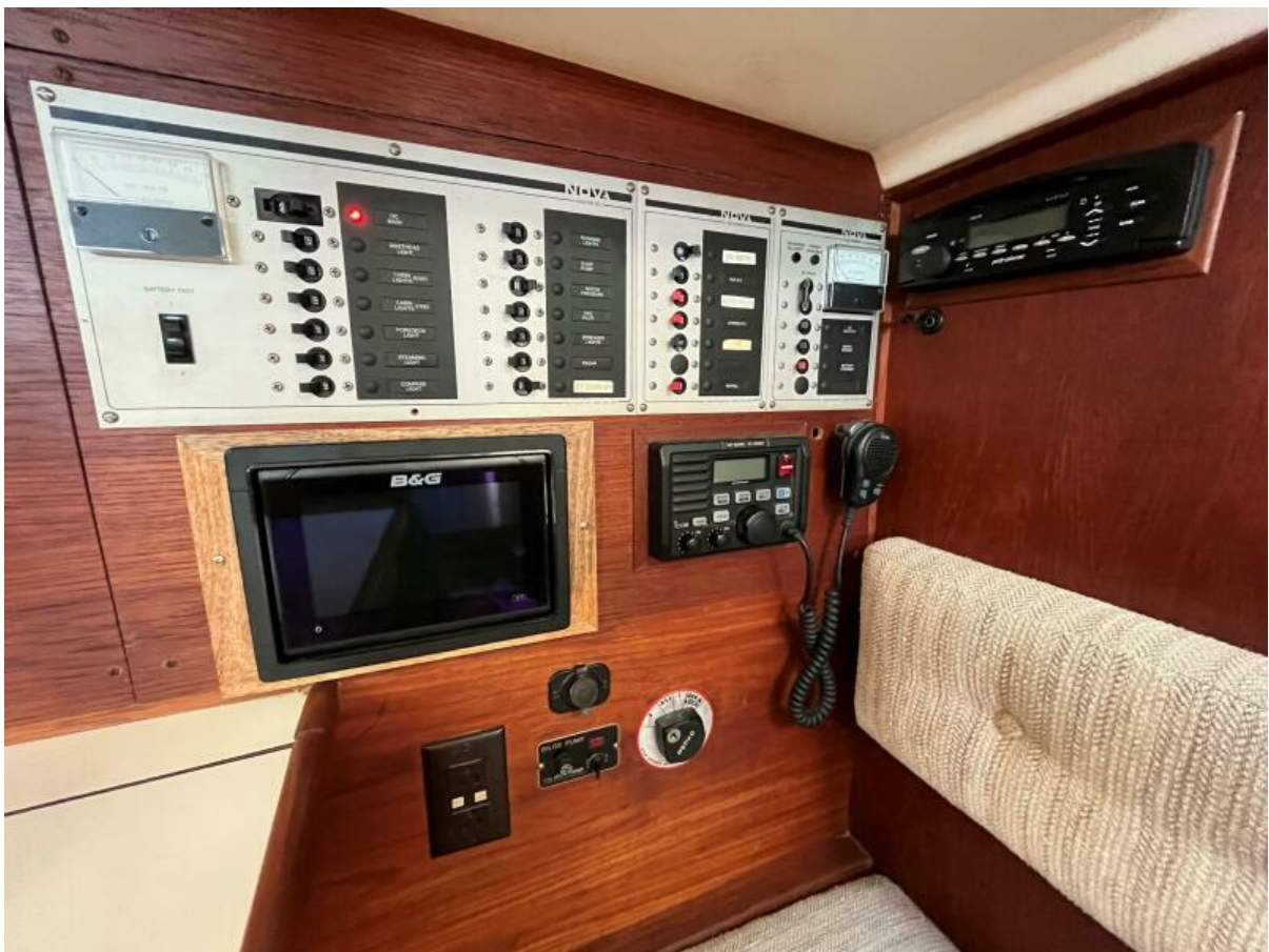
Sabre 34 Targa Dragonfly18