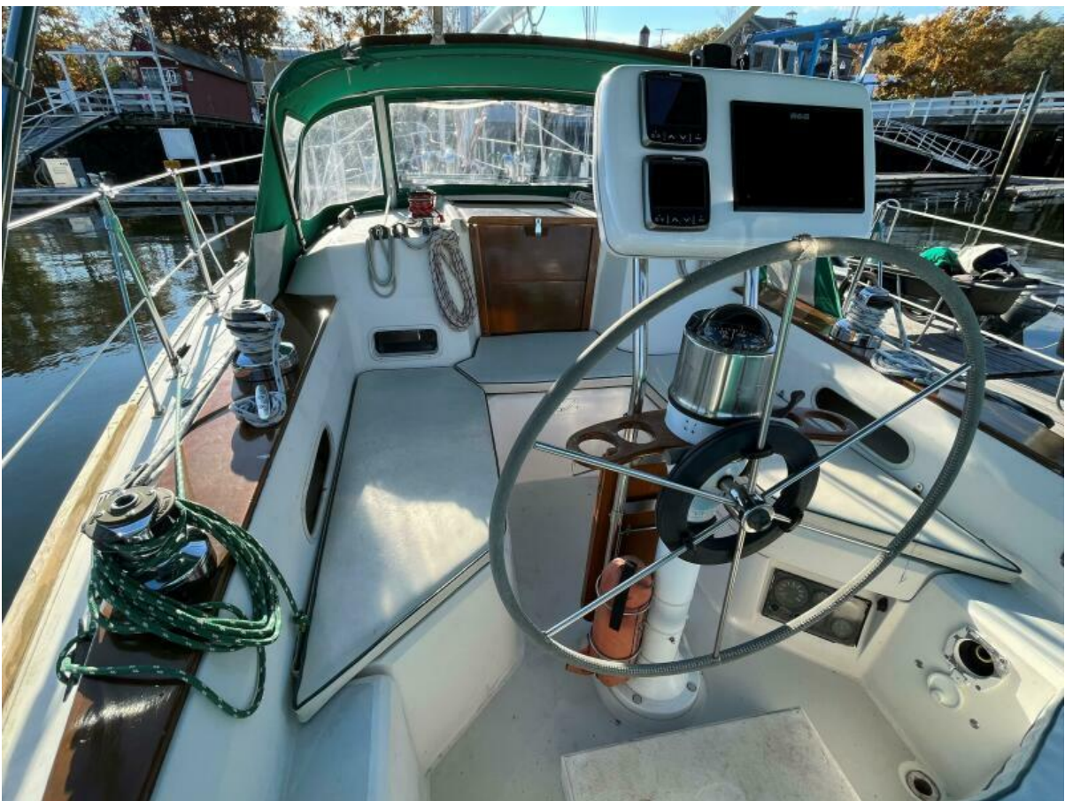
Sabre 34 Targa Dragonfly8