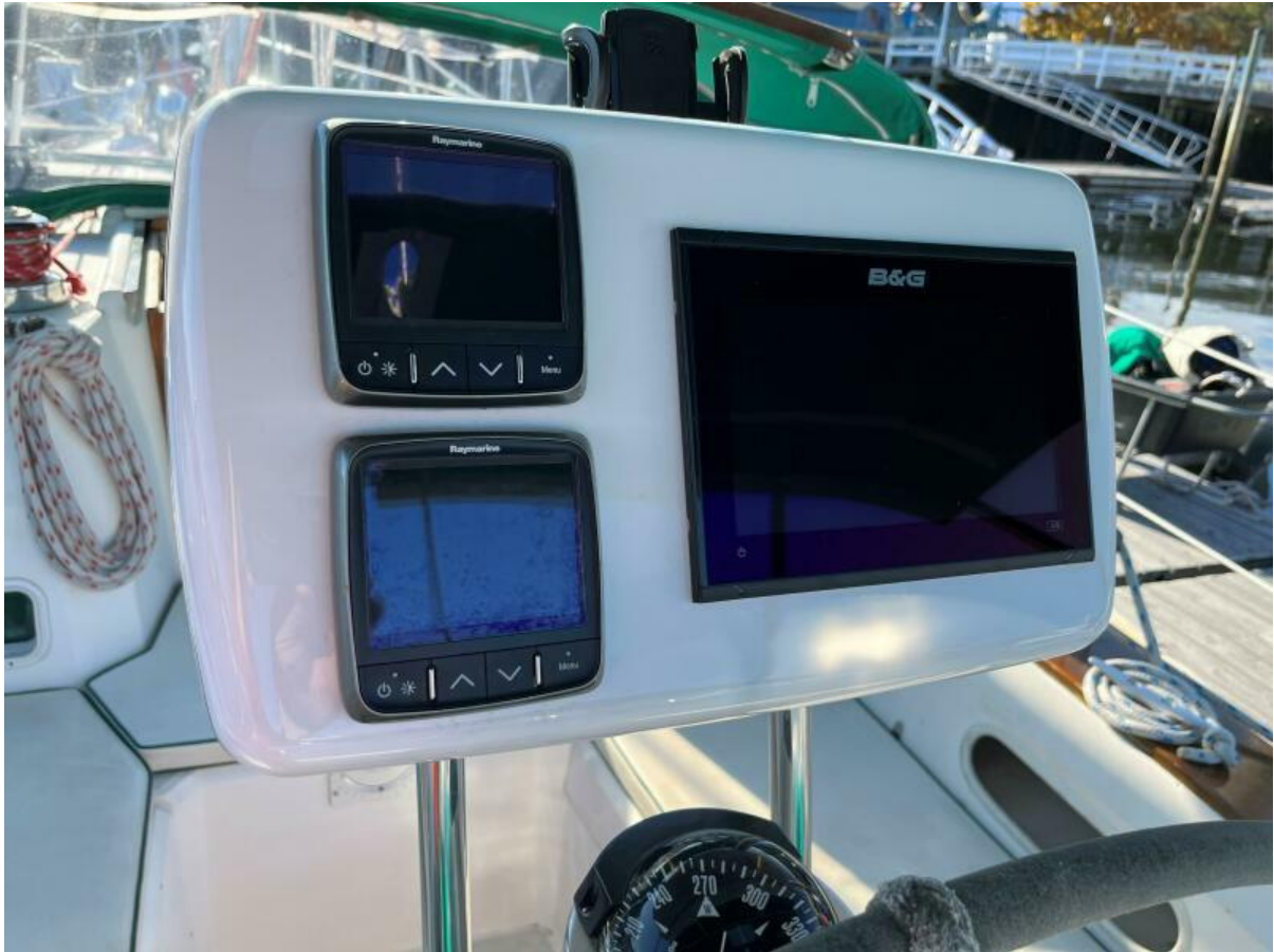
Sabre 34 Targa Dragonfly12