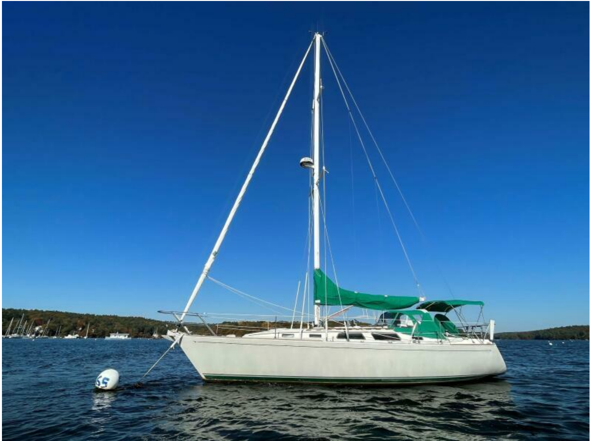
1989 Sabre 34 Targa Dragonfly