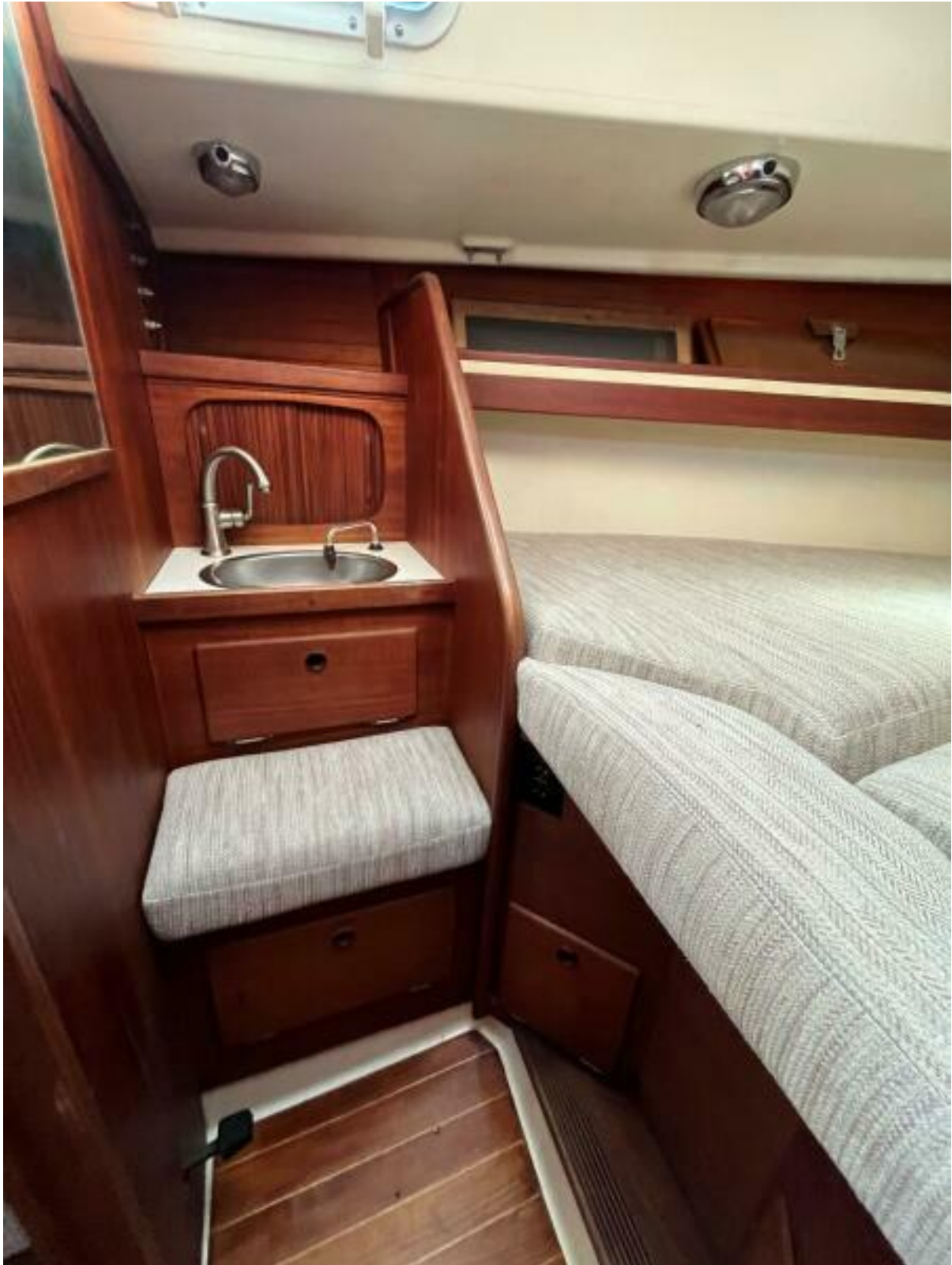
Sabre 34 Targa Dragonfly10