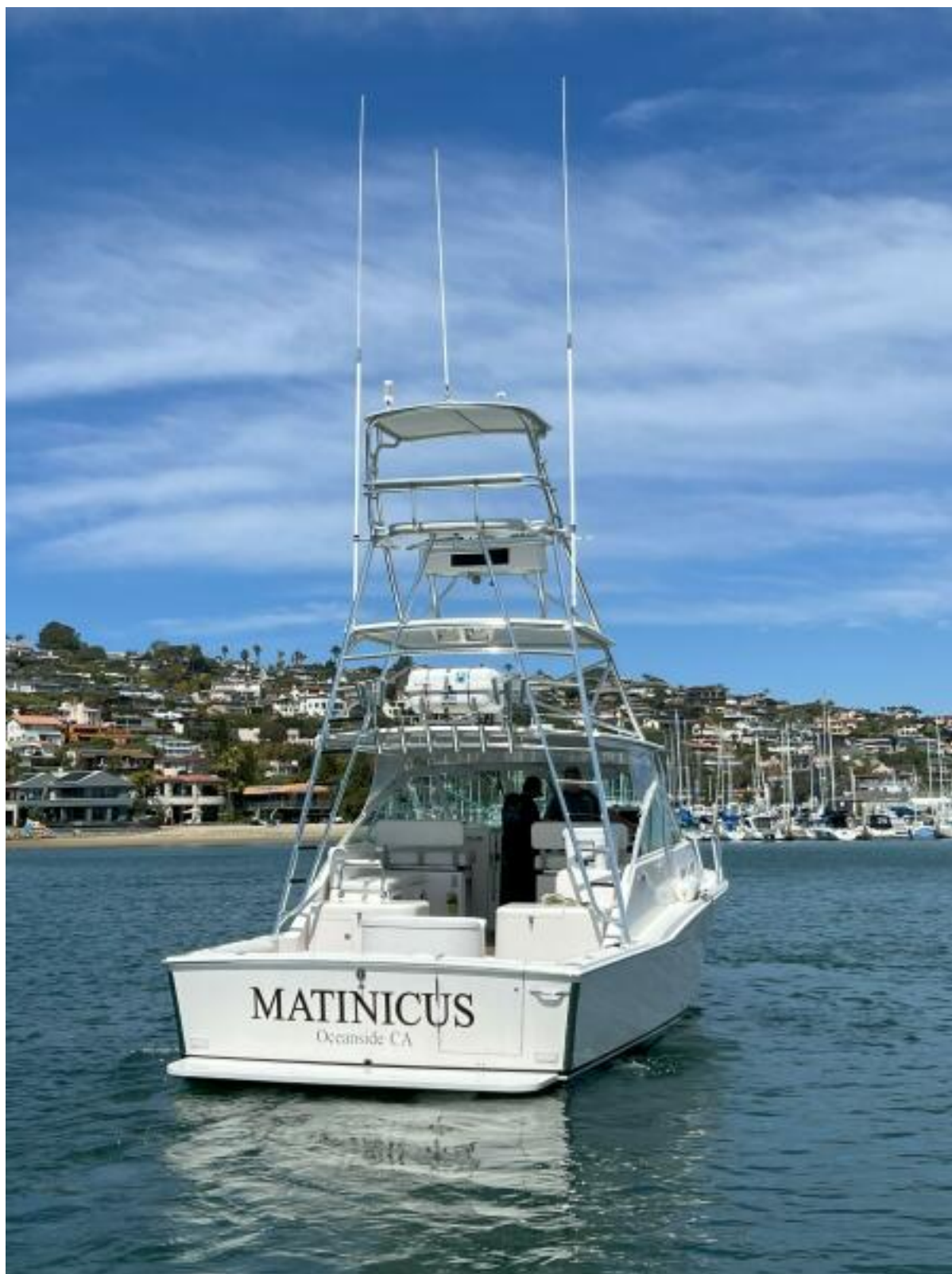
2004 Cabo 35 Express - MANTINICUS