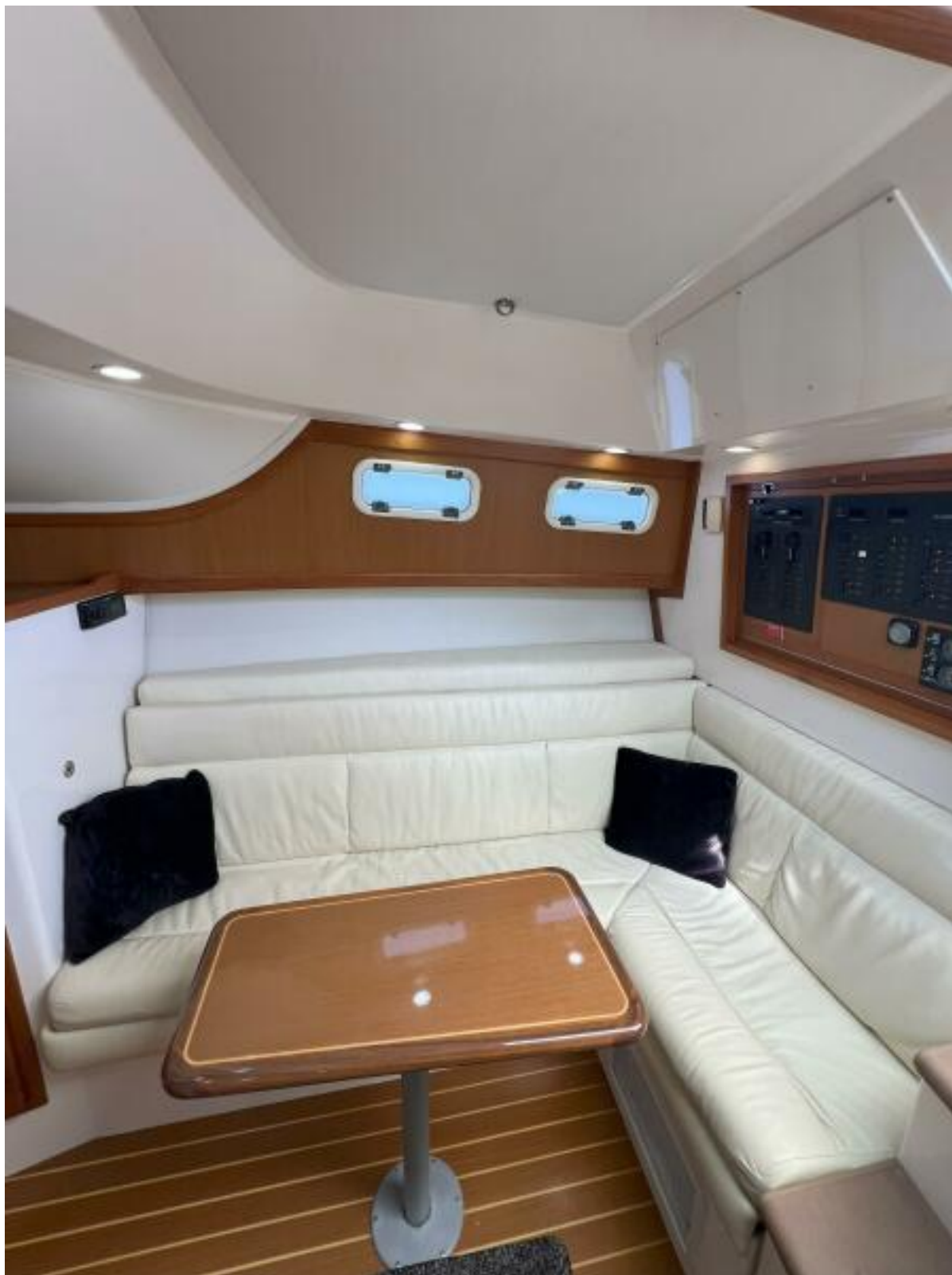
2004 Cabo 35 Express - MANTINICUS