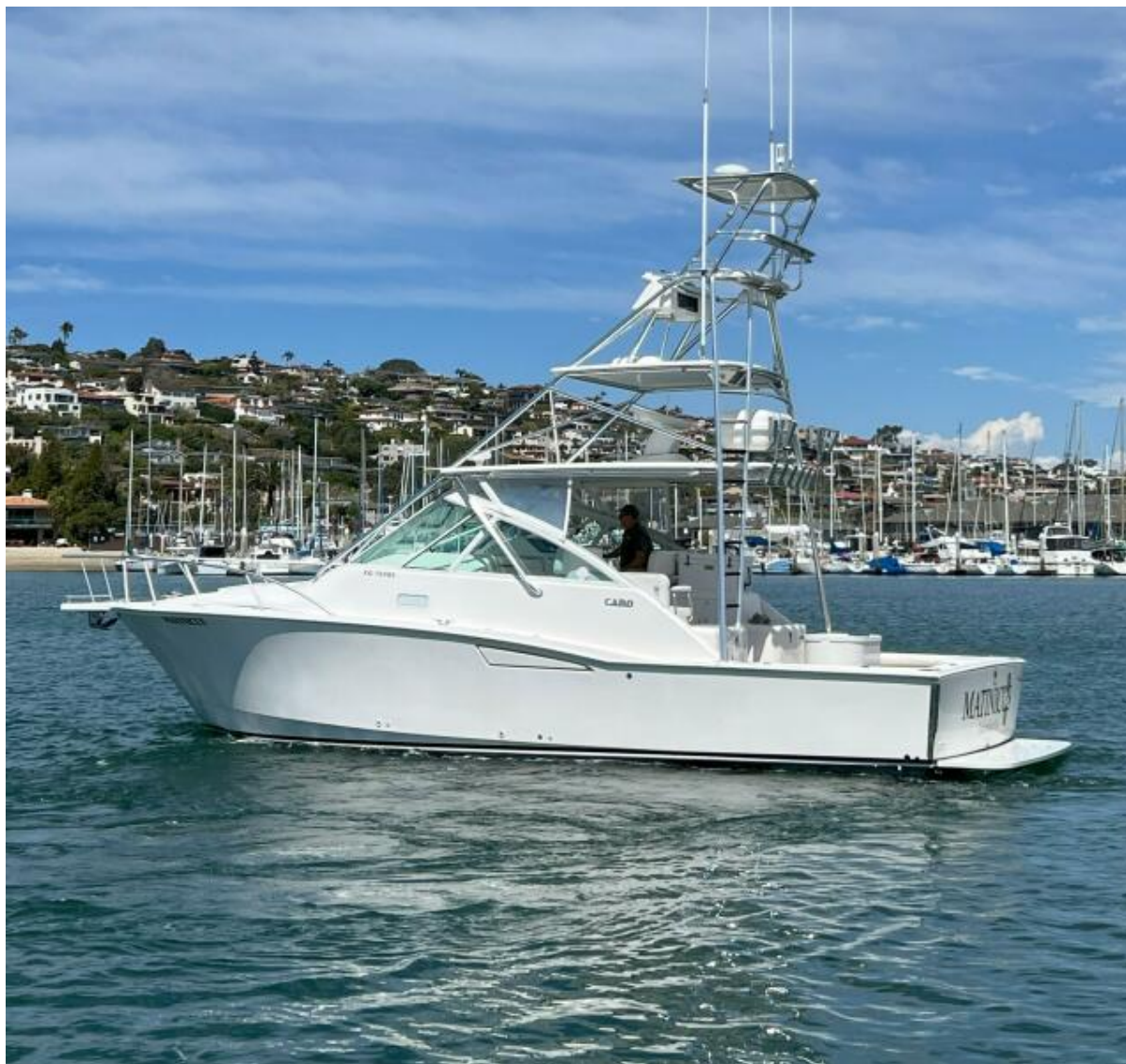
2004 Cabo 35 Express MANTINICUS