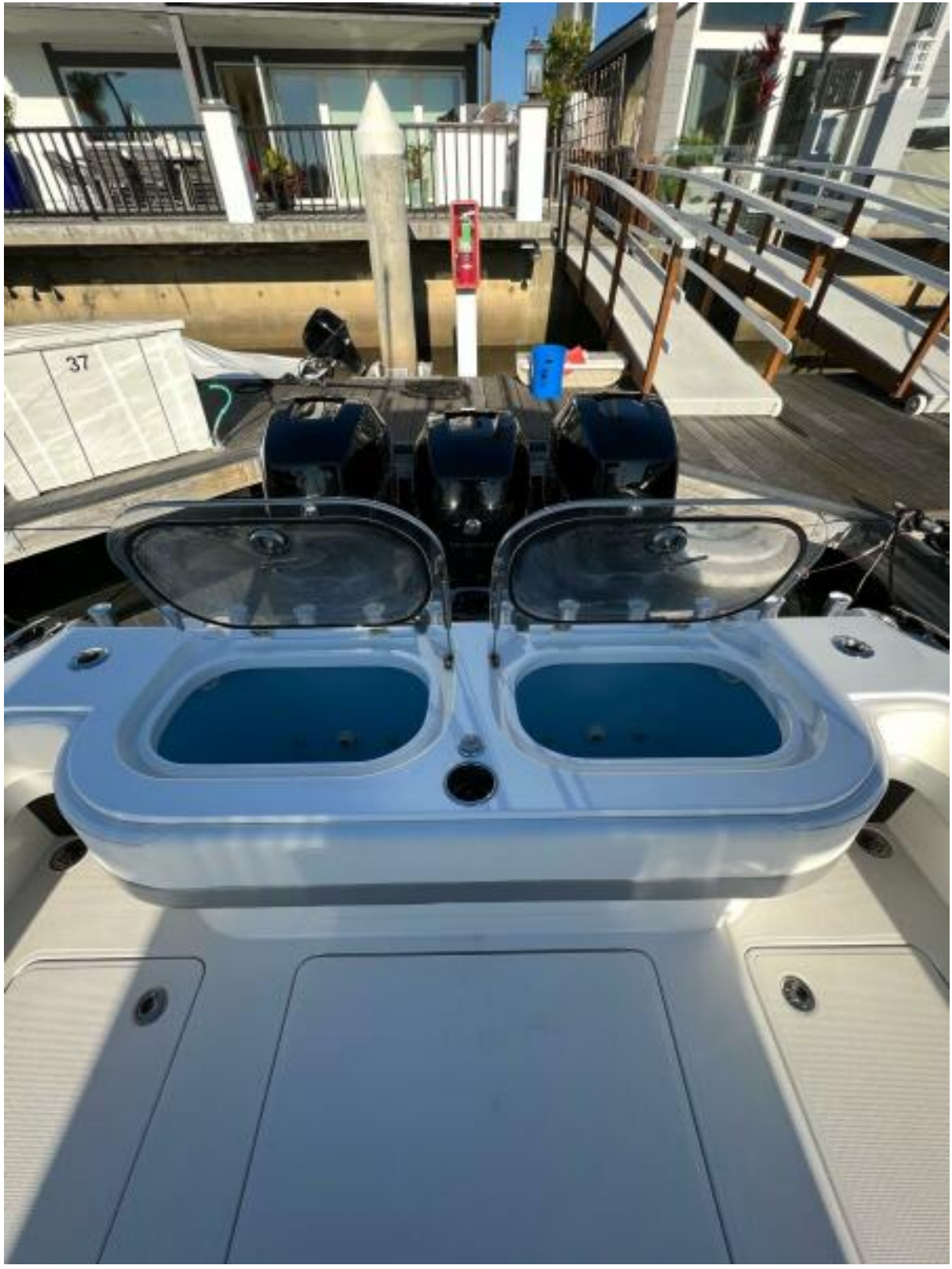
2015 Nor-Tech 390 Superfish - TOSH