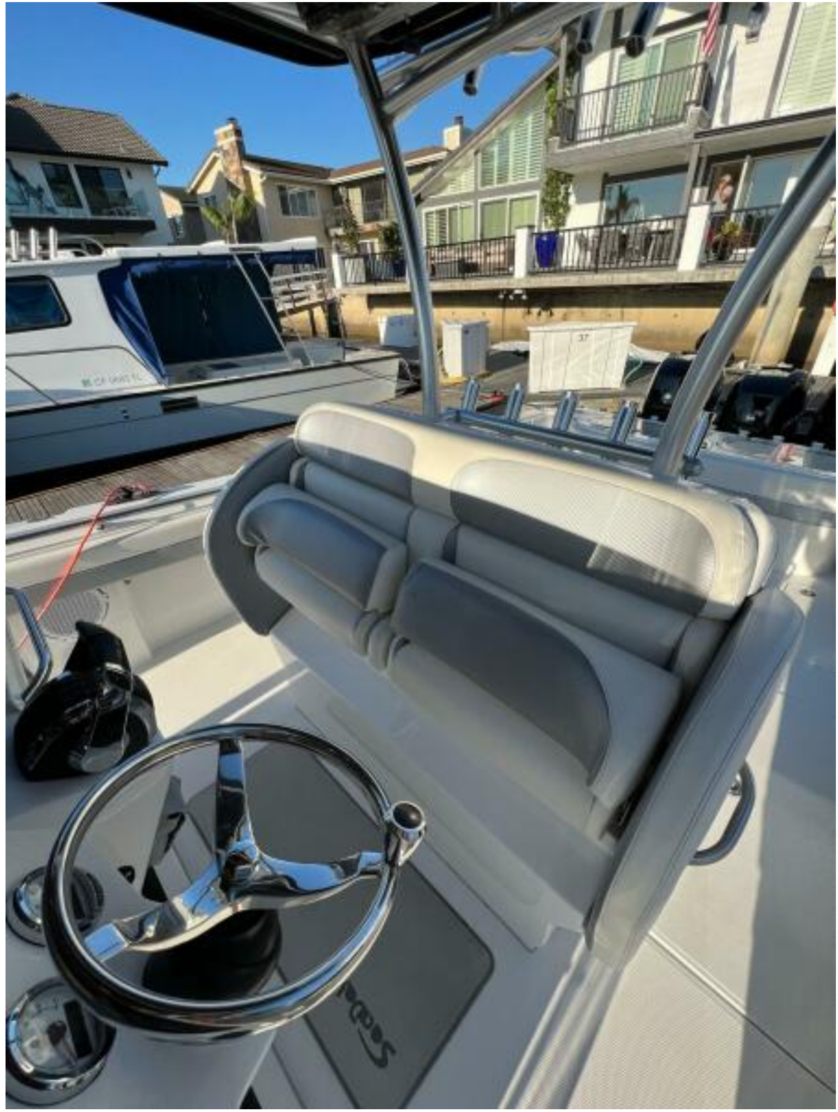
2015 Nor-Tech 390 Superfish - TOSH