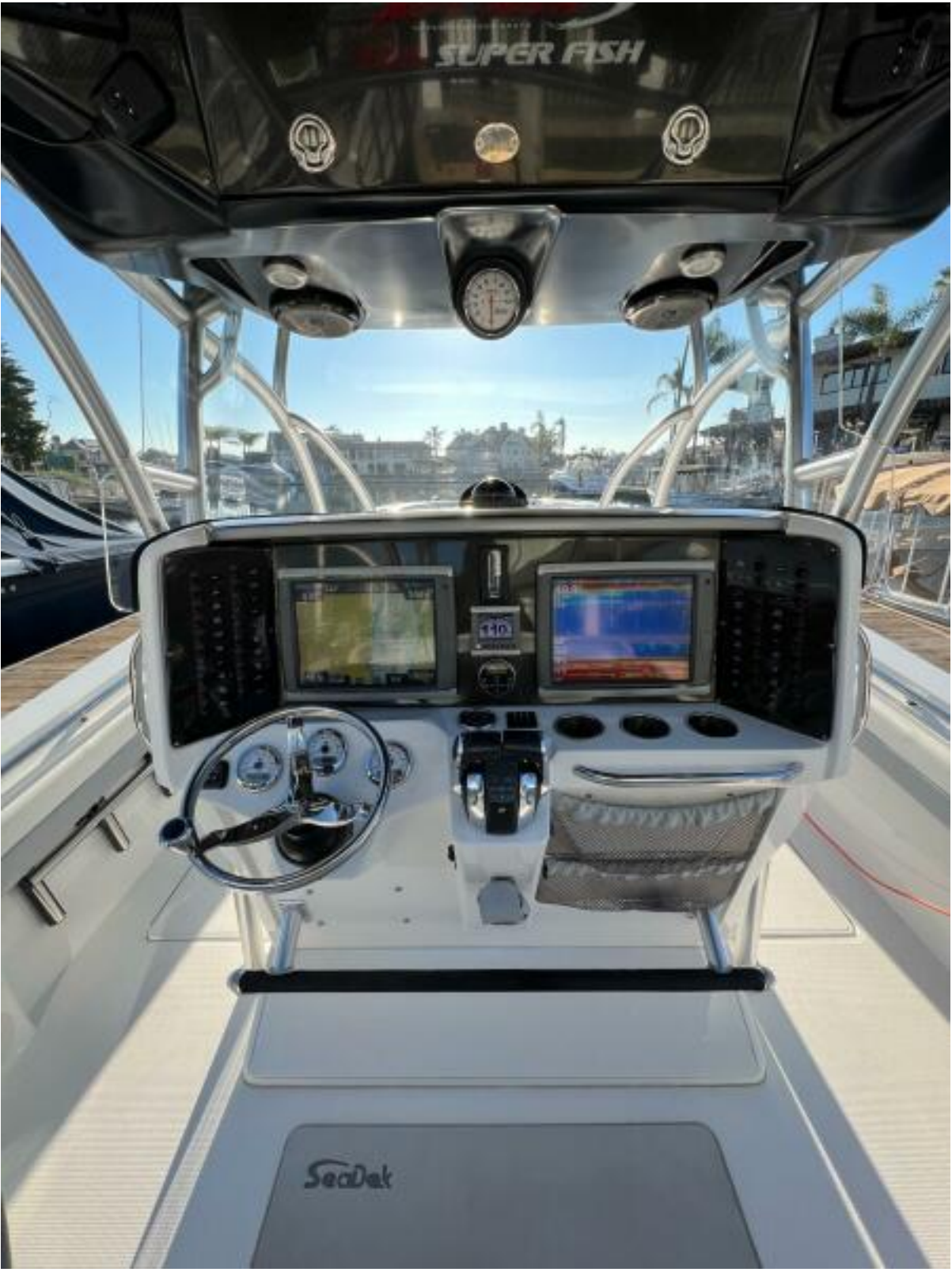
2015 Nor-Tech 390 Superfish - TOSH