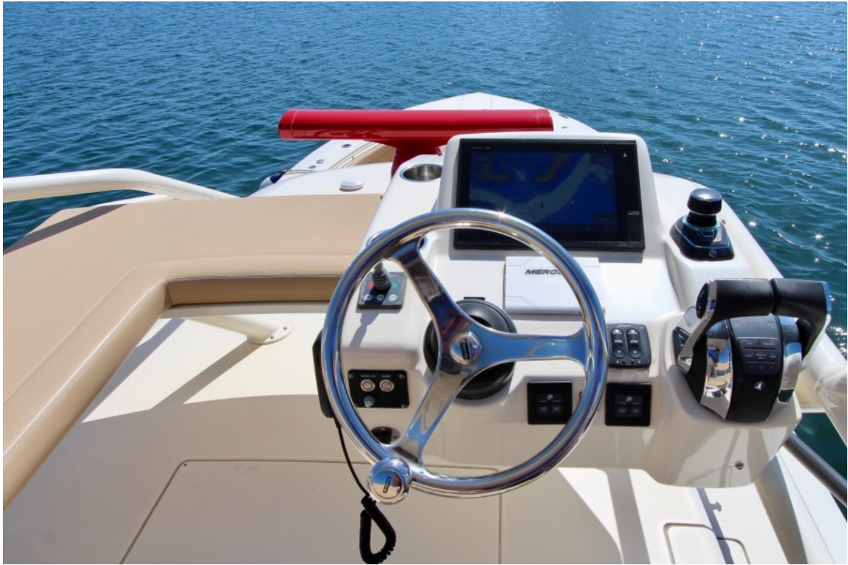
2019 Scout 42 Center Console "NO WHERE" Tower Helm