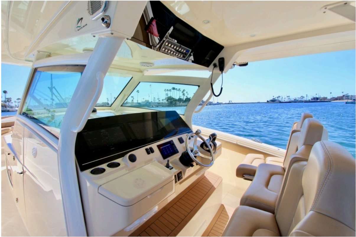
2019 Scout 42 Center Console "NO WHERE" Helm