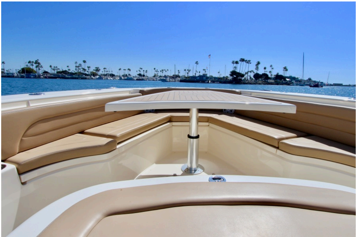
2019 Scout 42 Center Console "NO WHERE" Bow Dinette