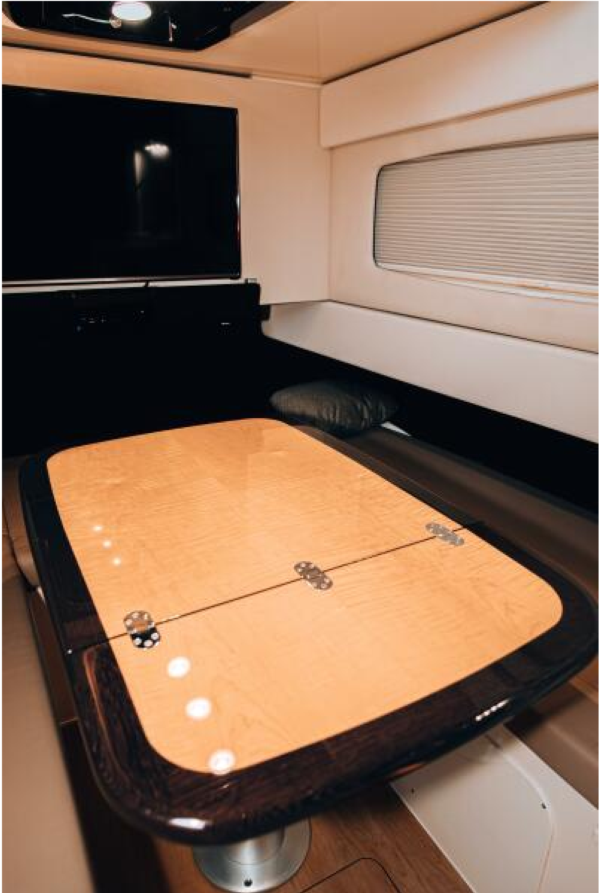
2019 Scout 42 Center Console