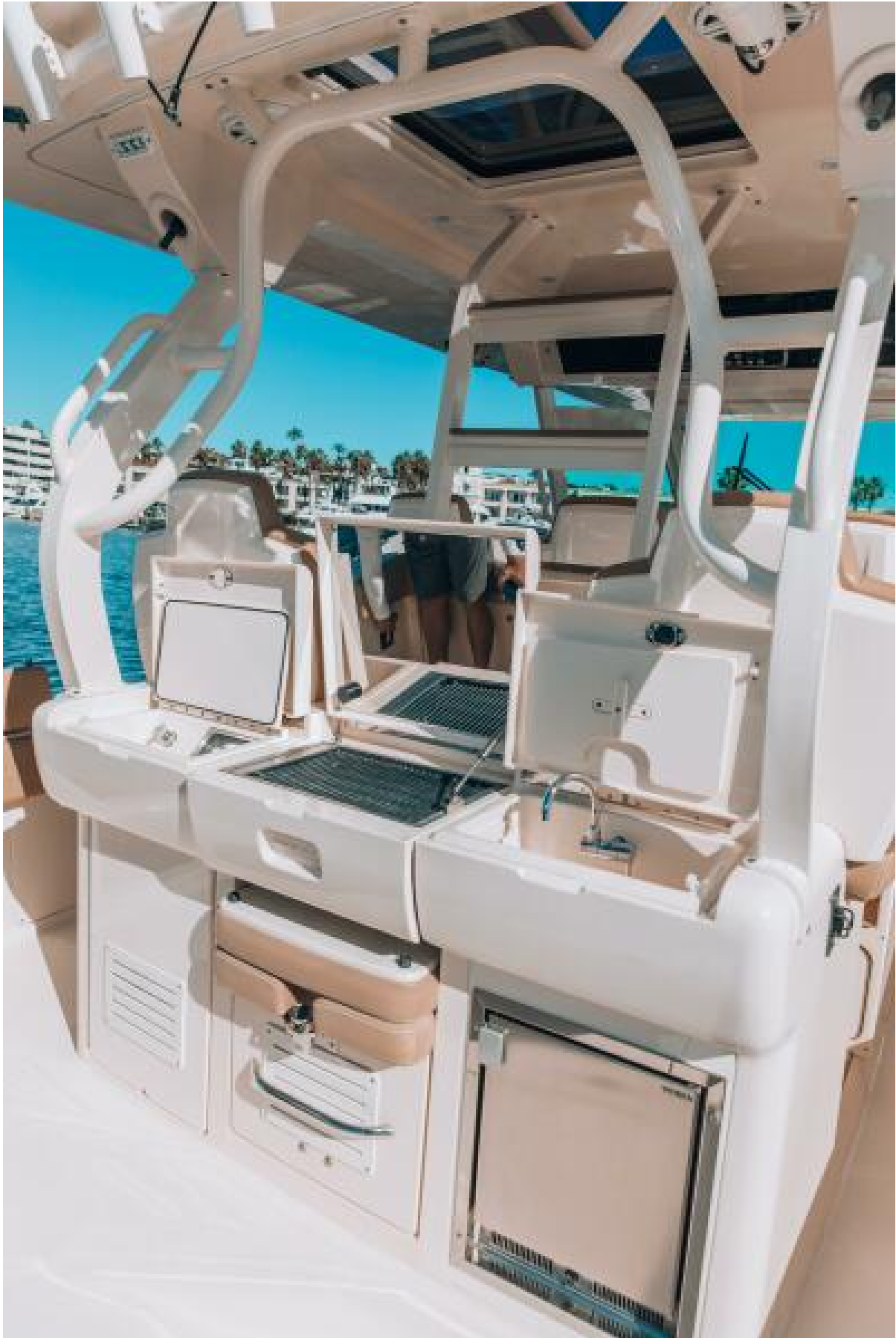
2019 Scout 42 Center Console