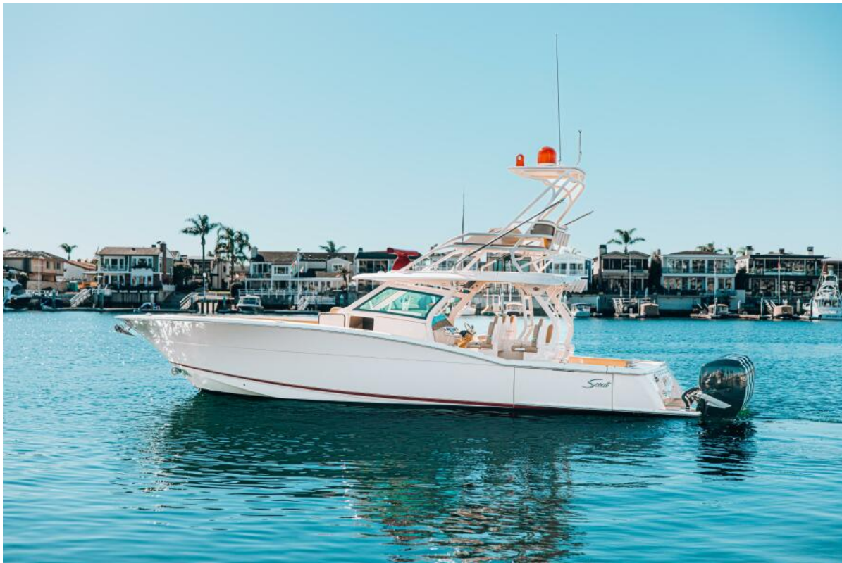
2019 Scout 42 Center Console Profile