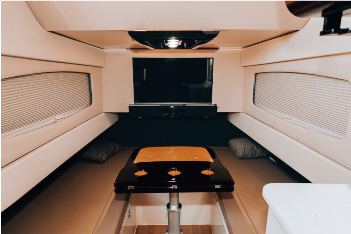
2019 Scout 42 Center Console