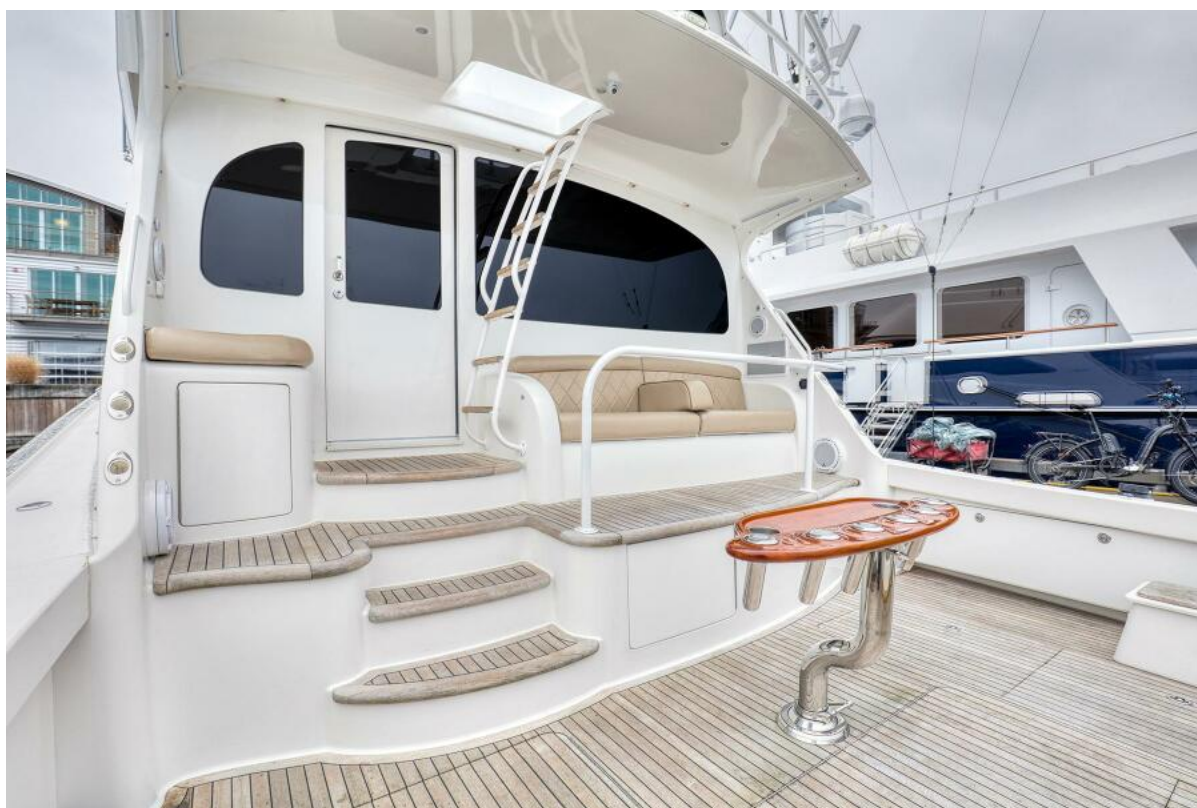
2012 Viking 70 EB - FORY NINER