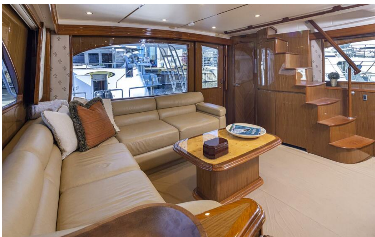
2012 Viking 70 EB - FORTY NINER