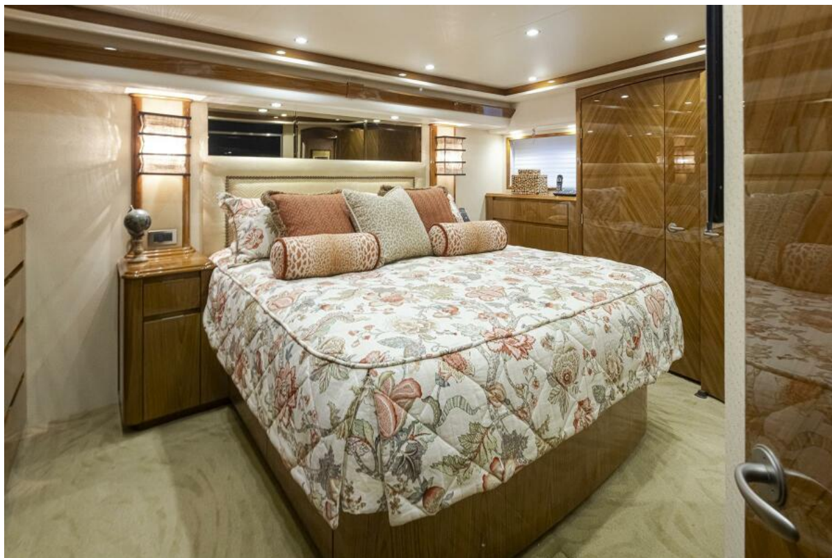
2012 Viking 70 EB - FORY NINER