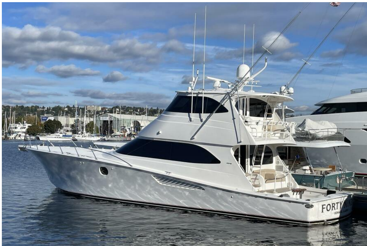
2012 Viking 70 EB - FORTY NINER