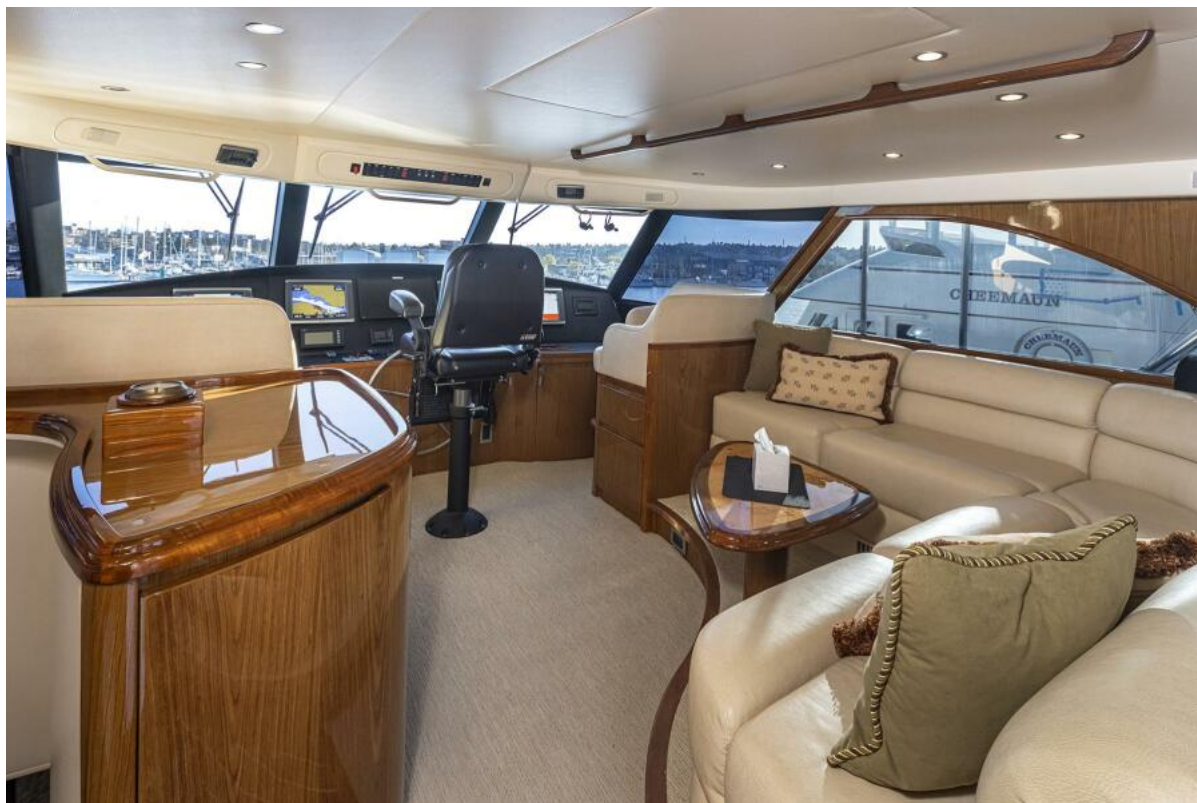
2012 Viking 70 EB - FORY NINER