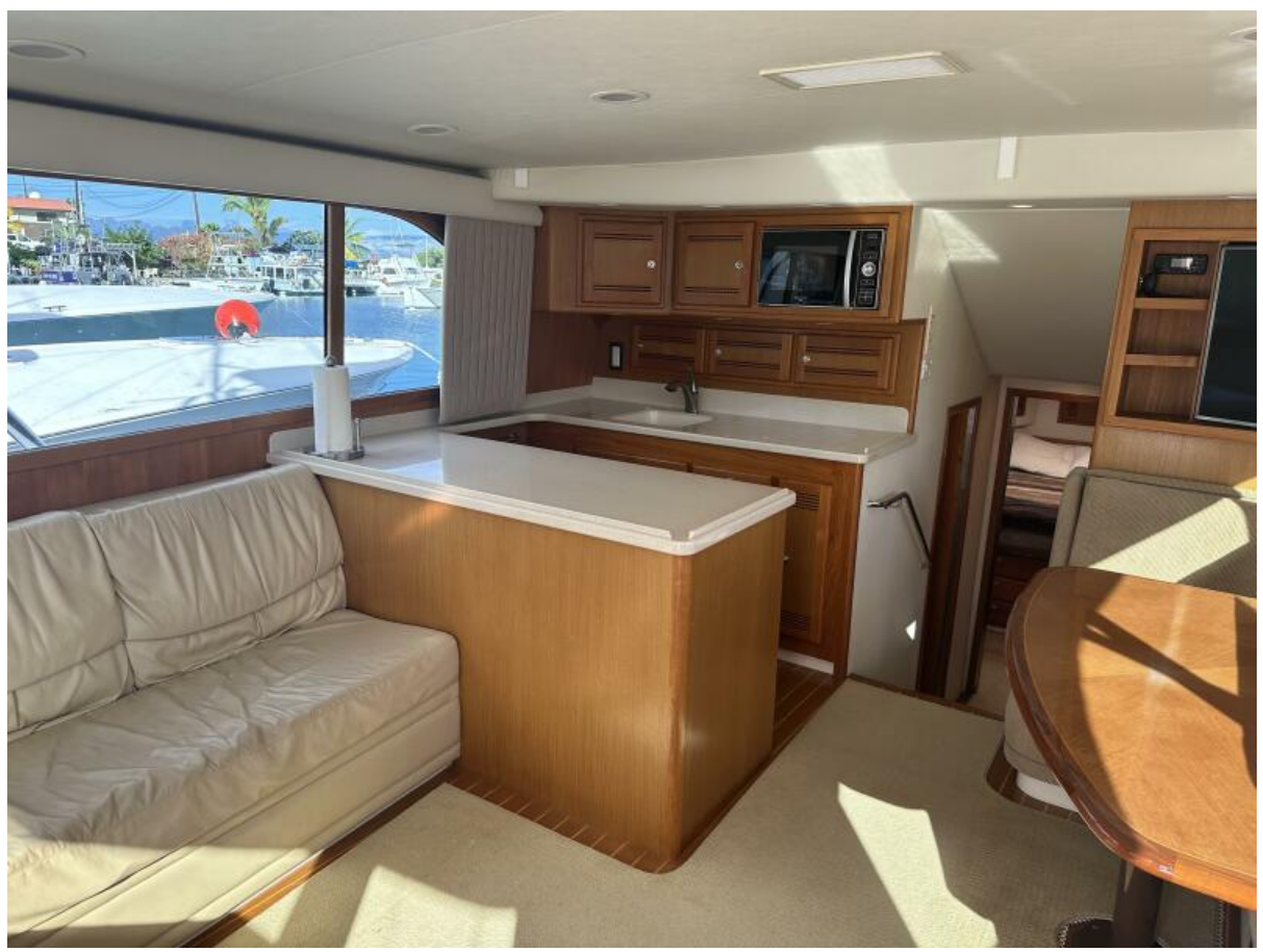
2001 Cabo 47 Flybridge - LIGHTSPEED