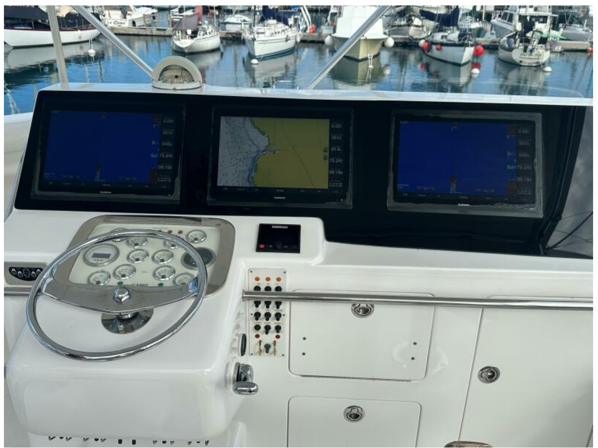
2001 Cabo 47 Flybridge - LIGHTSPEED