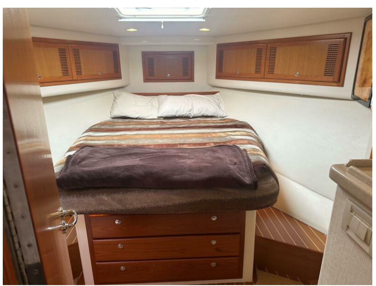
2001 Cabo 47 Flybridge - LIGHTSPEED