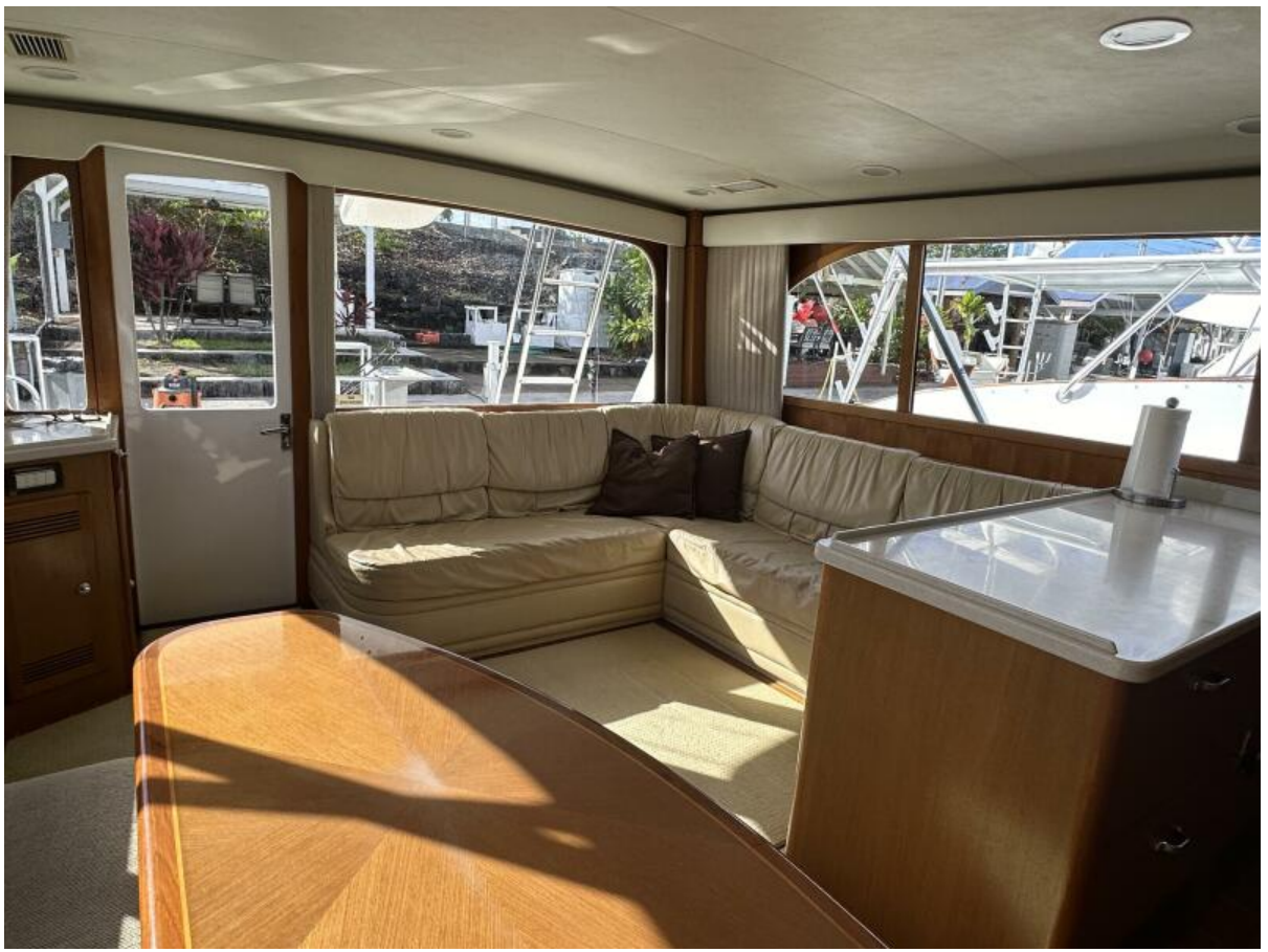
2001 Cabo 47 Flybridge - LIGHTSPEED