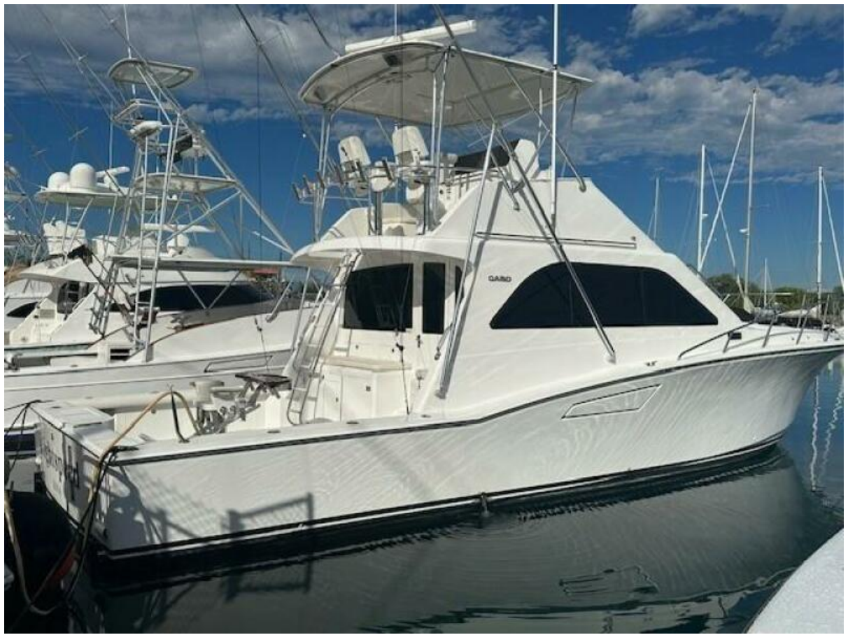
2001 Cabo 47 Flybridge - LIGHTSPEED