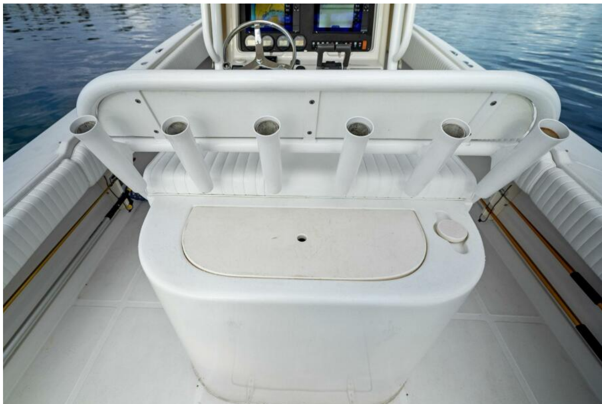
2004 Jupiter 31 CC Cuddy