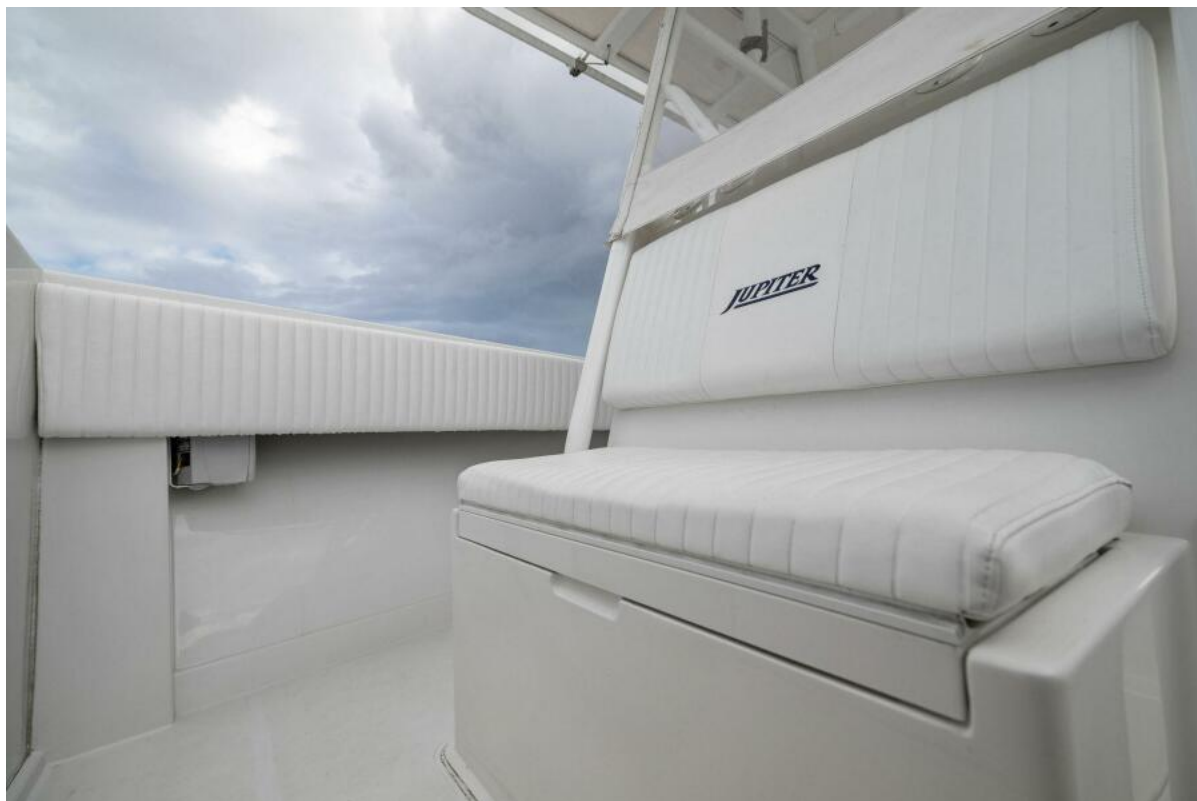
2004 Jupiter 31 CC Cuddy