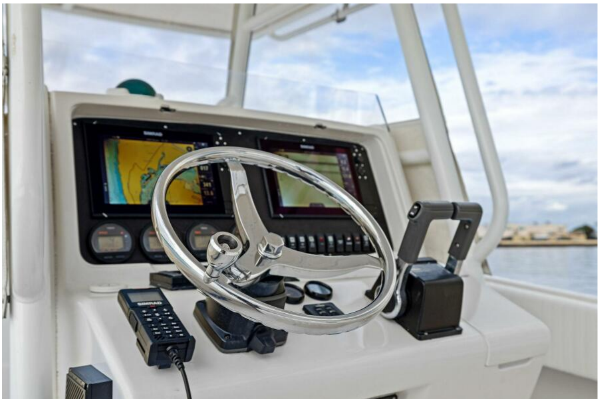
2004 Jupiter 31 CC Cuddy