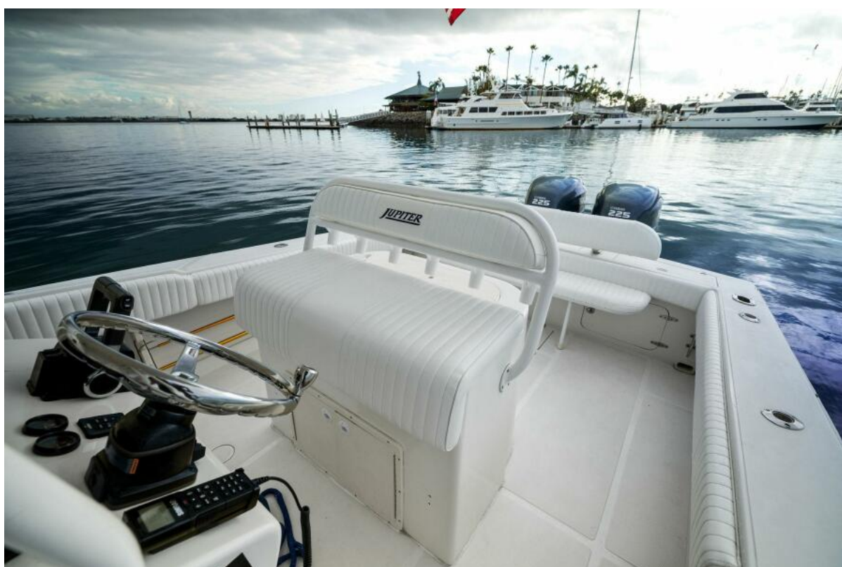
2004 Jupiter 31 CC Cuddy