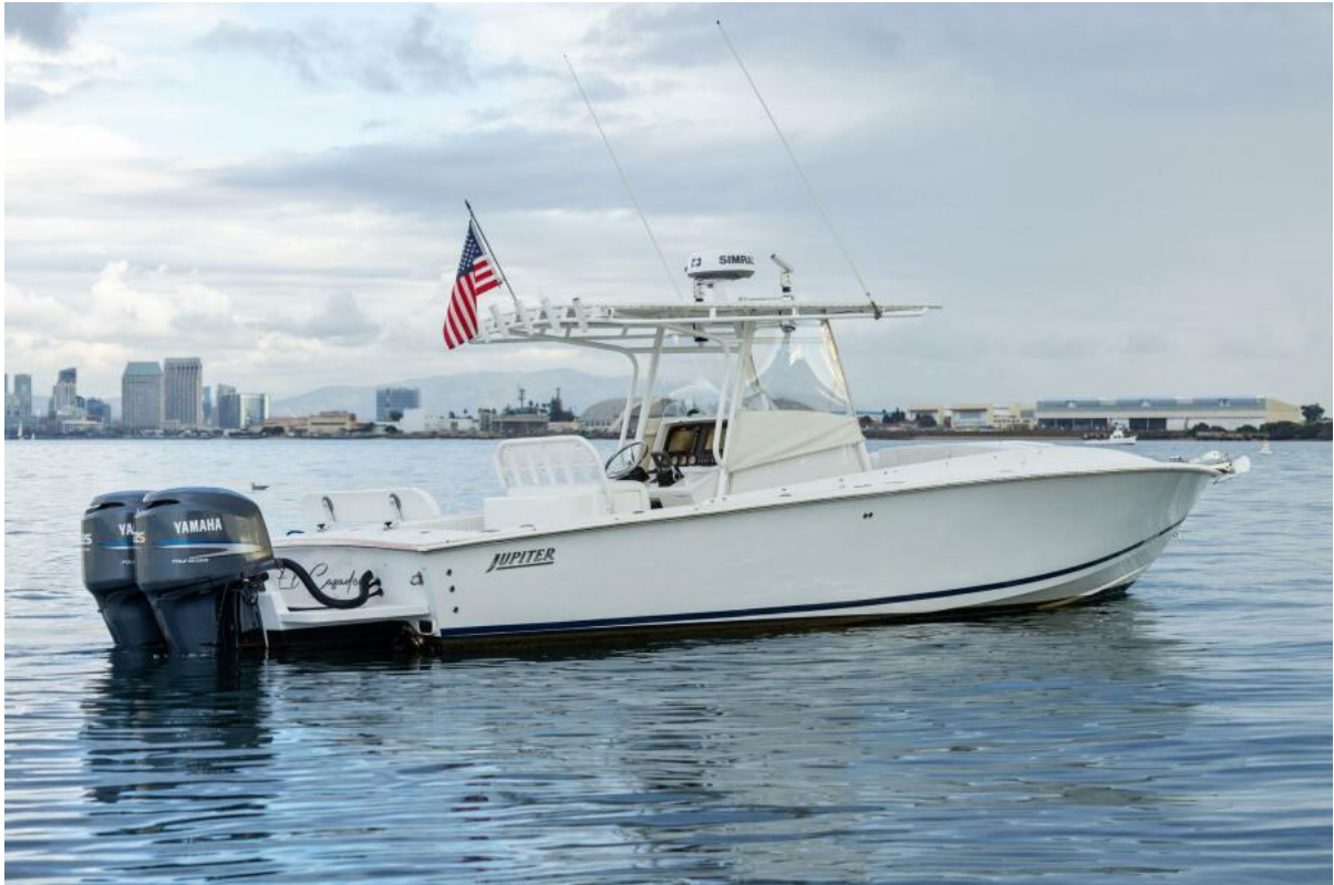
2004 Jupiter 31 CC Cuddy