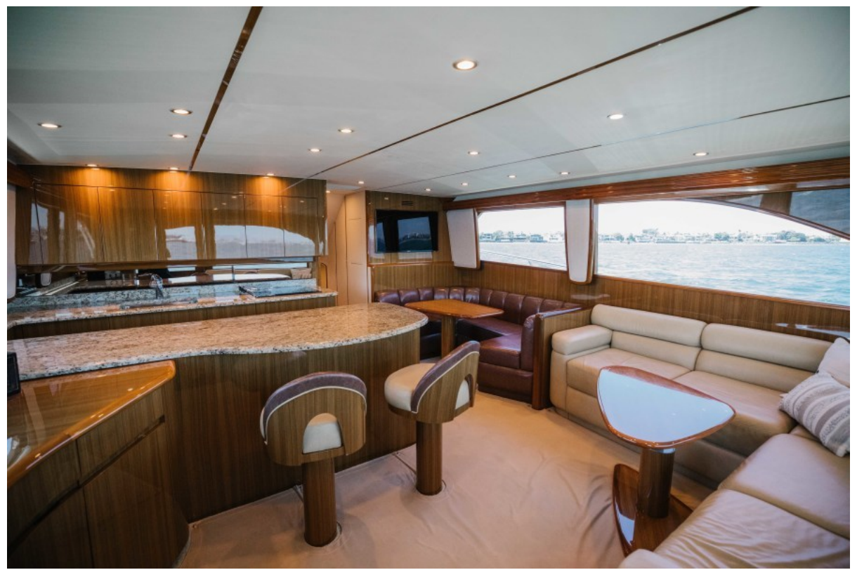
2013 Viking 60 Convertible Salon