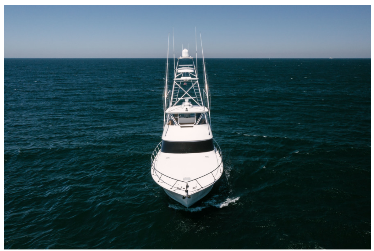
2013 Viking 60 Convertible Bow