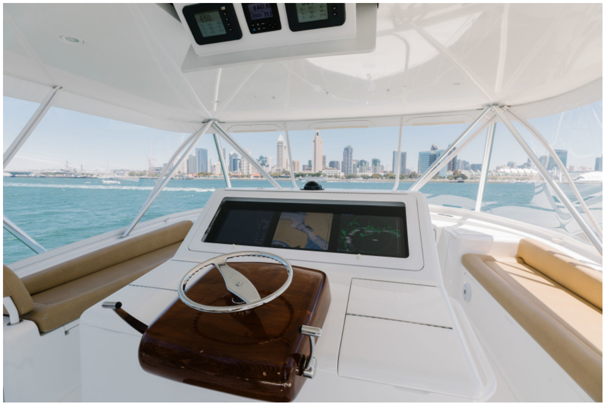
2013 Viking 60 Convertible Helm