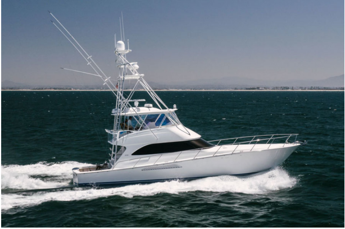
2013 Viking 60 Convertible Profile - CHASING OUR TAILS