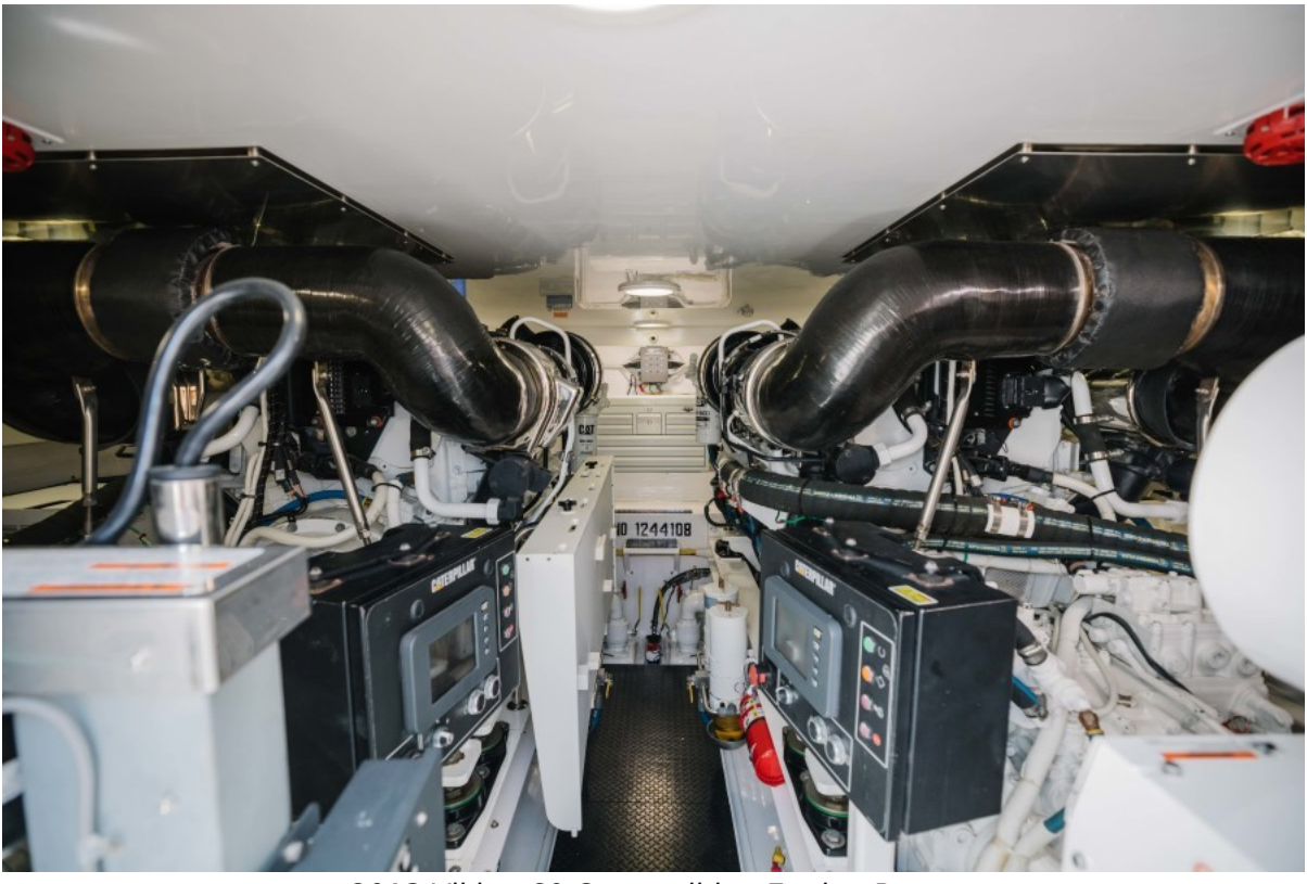
2013 Viking 60 Convertible Engine Room