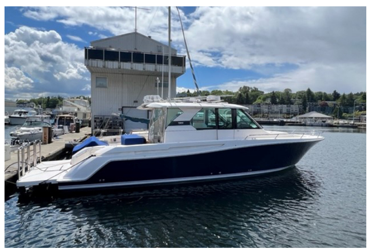
2016 Tiara 44 Express Coupe "LIVIMAC" Profile