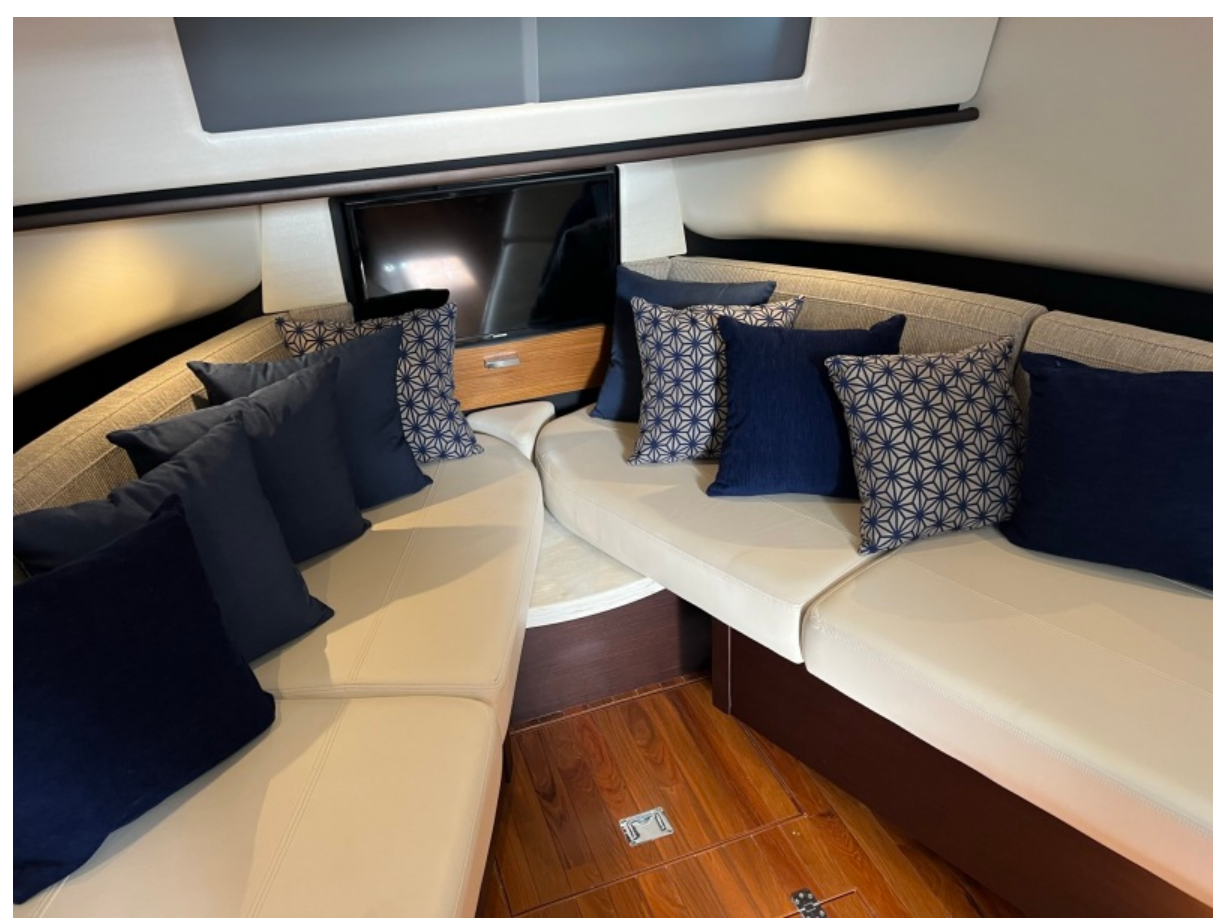
2016 Tiara 44 Express Coupe V-berth