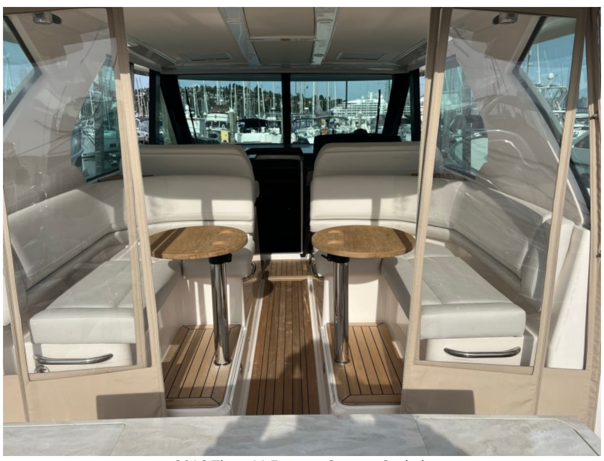
2016 Tiara 44 Express Coupe Cockpit