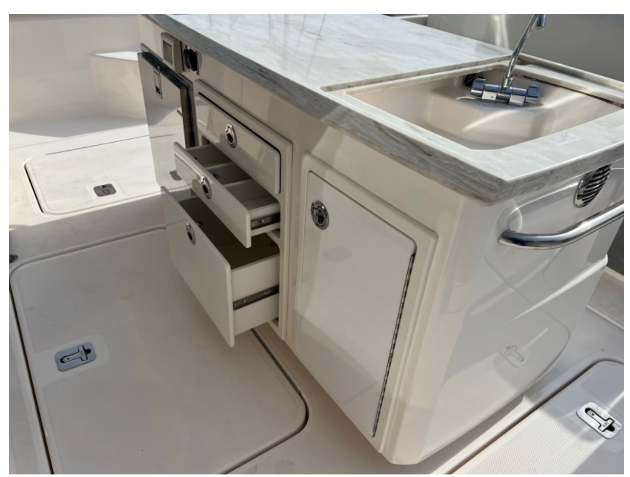
2016 Tiara 44 Express Coupe Outdoor Cooking