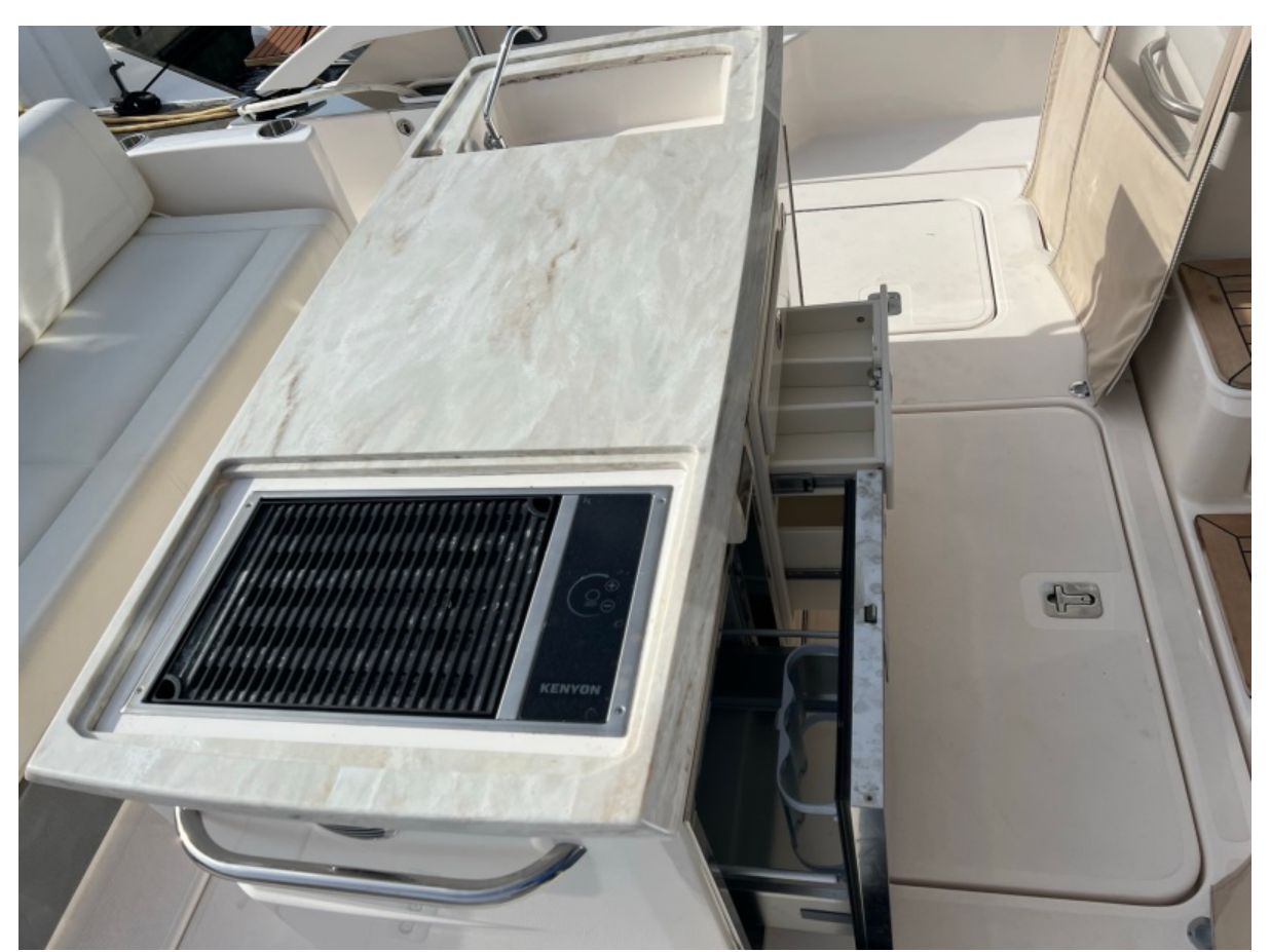
2016 Tiara 44 Express Coupe Grill