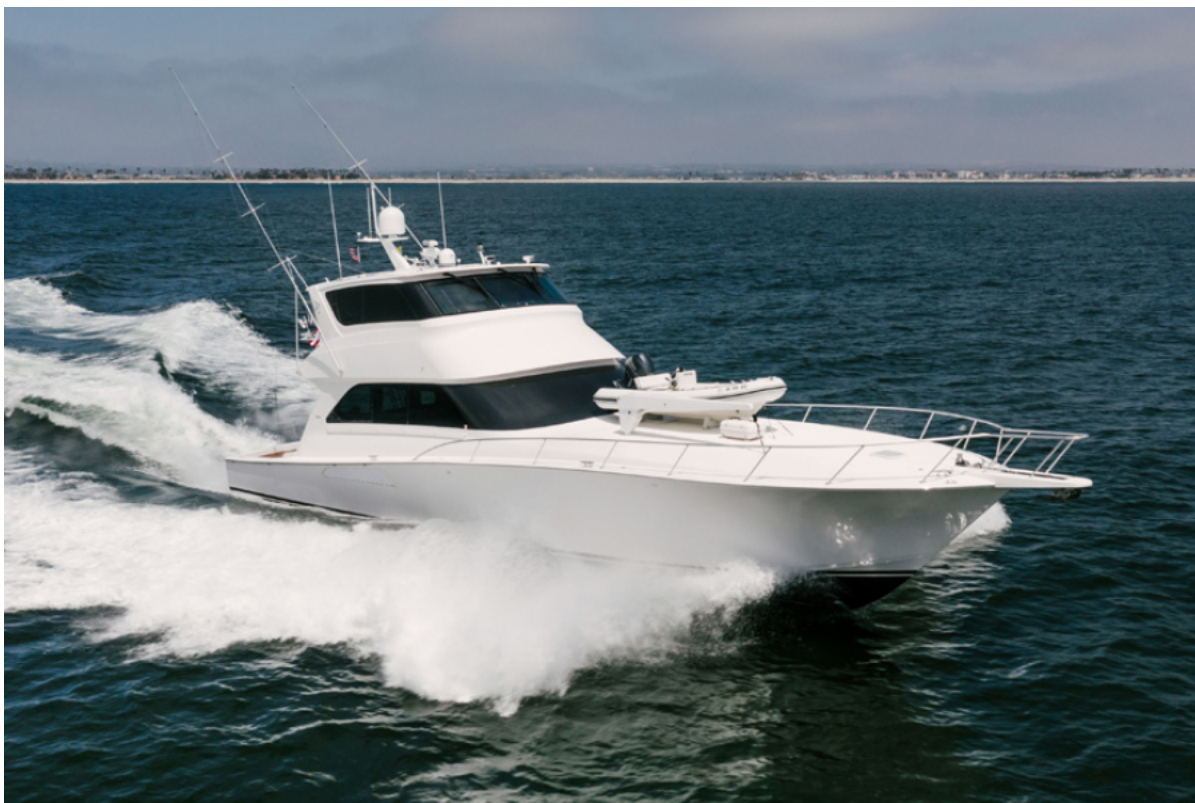
2006 Viking 74 Convertible - KICKBACK Profile