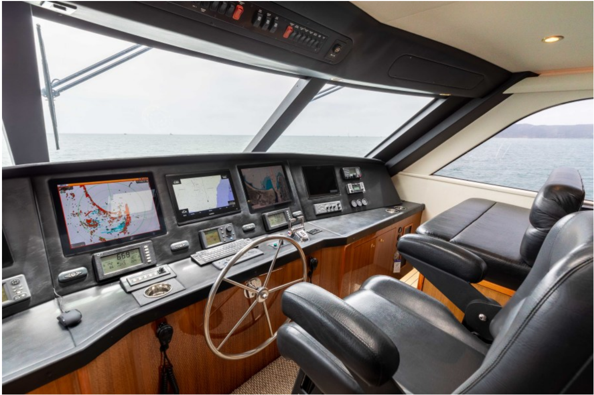
2006 Viking 74 Convertible - KICKBACK Helm