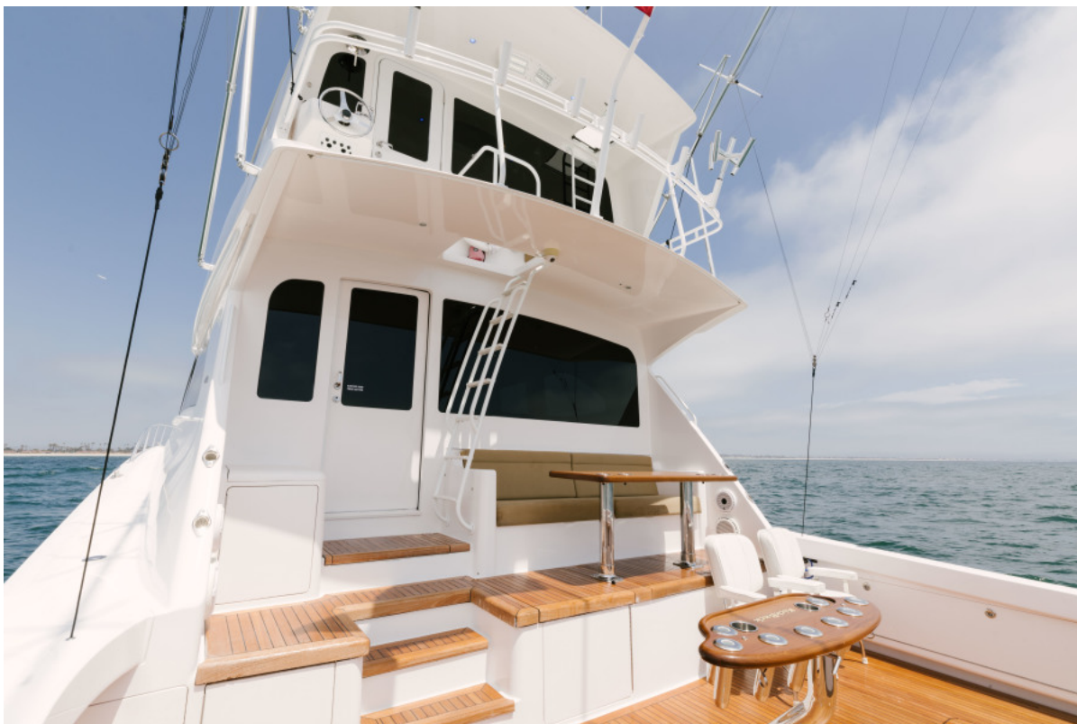
2006 Viking 74 Convertible - KICKBACK Cockpit