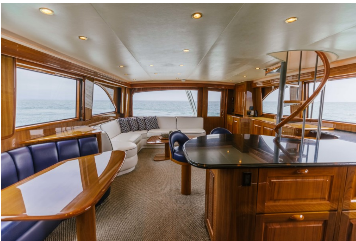
2006 Viking 74 Convertible - KICKBACK Salon