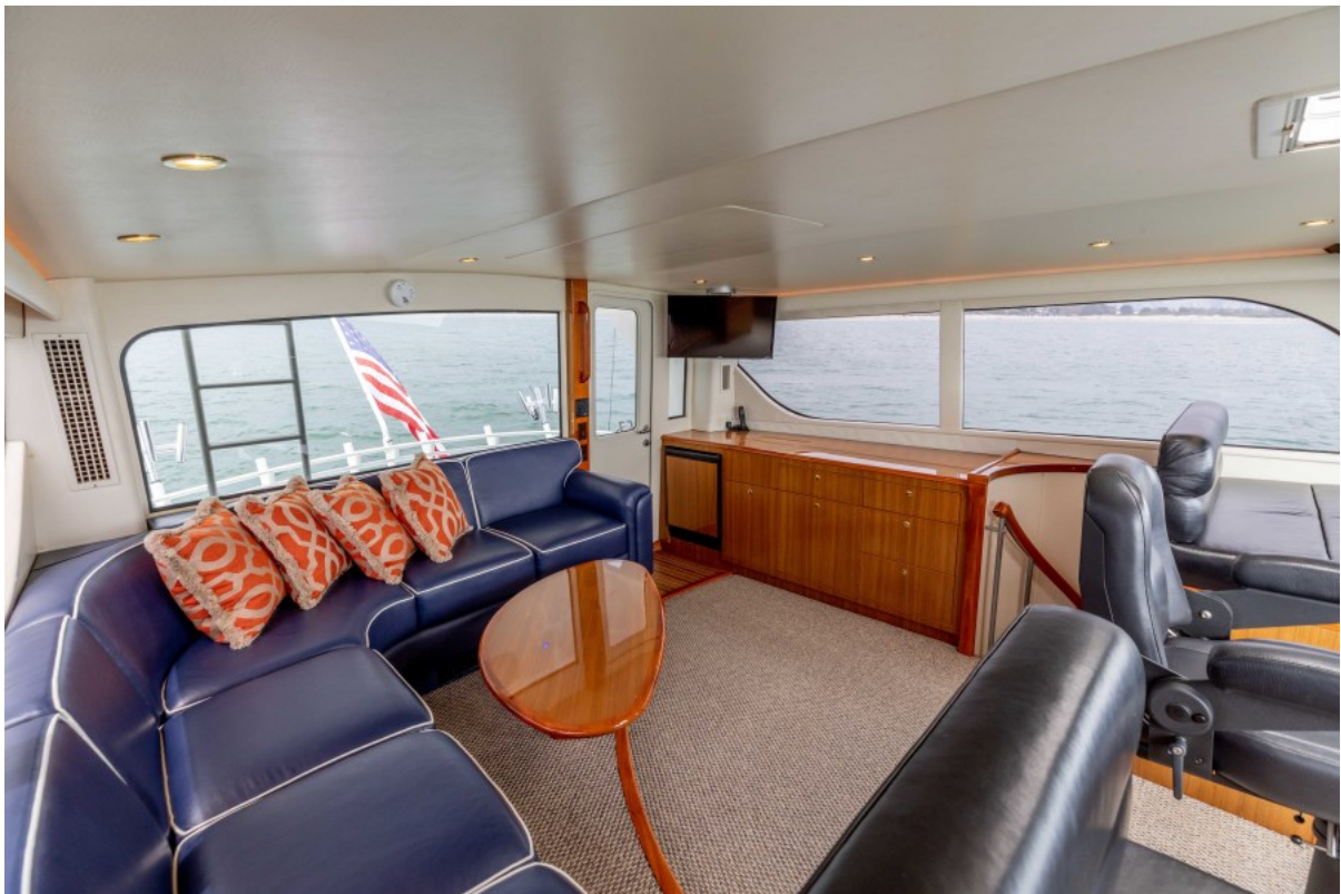
2006 Viking 74 Convertible - KICKBACK Bridge