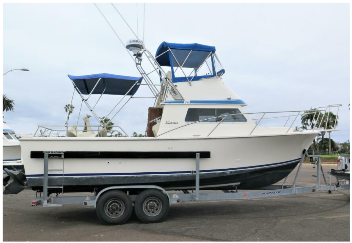
1988 Blackman 26 LAST ONE Profile