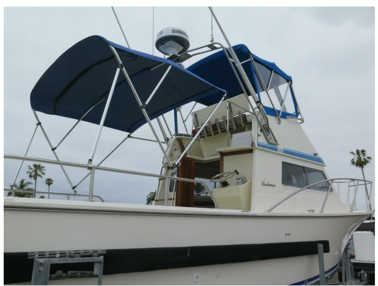
1988 Blackman 26 LAST ONE