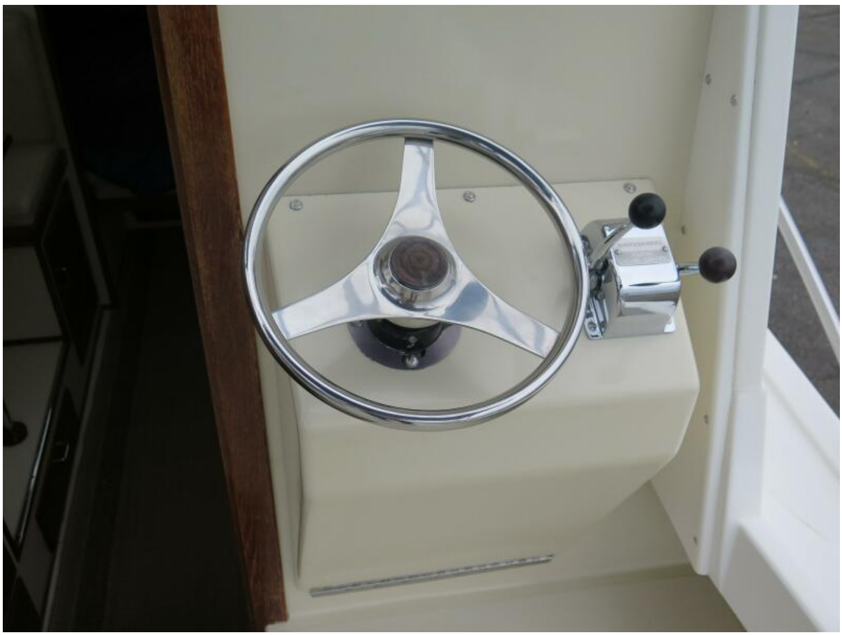
1988 Blackman 26 LAST ONE Cockpit