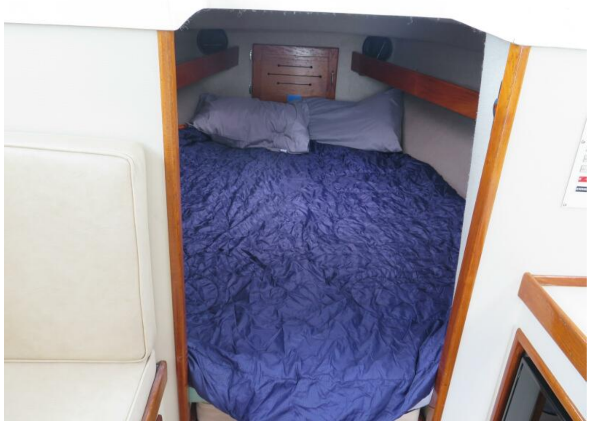
1988 Blackman 26 LAST ONE V Berth