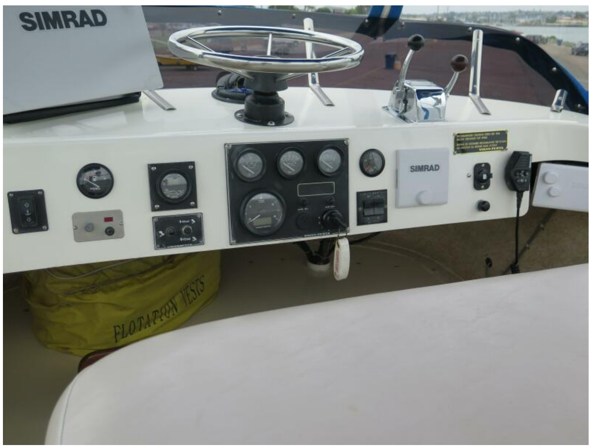
1988 Blackman 26 LAST ONE Flybridge