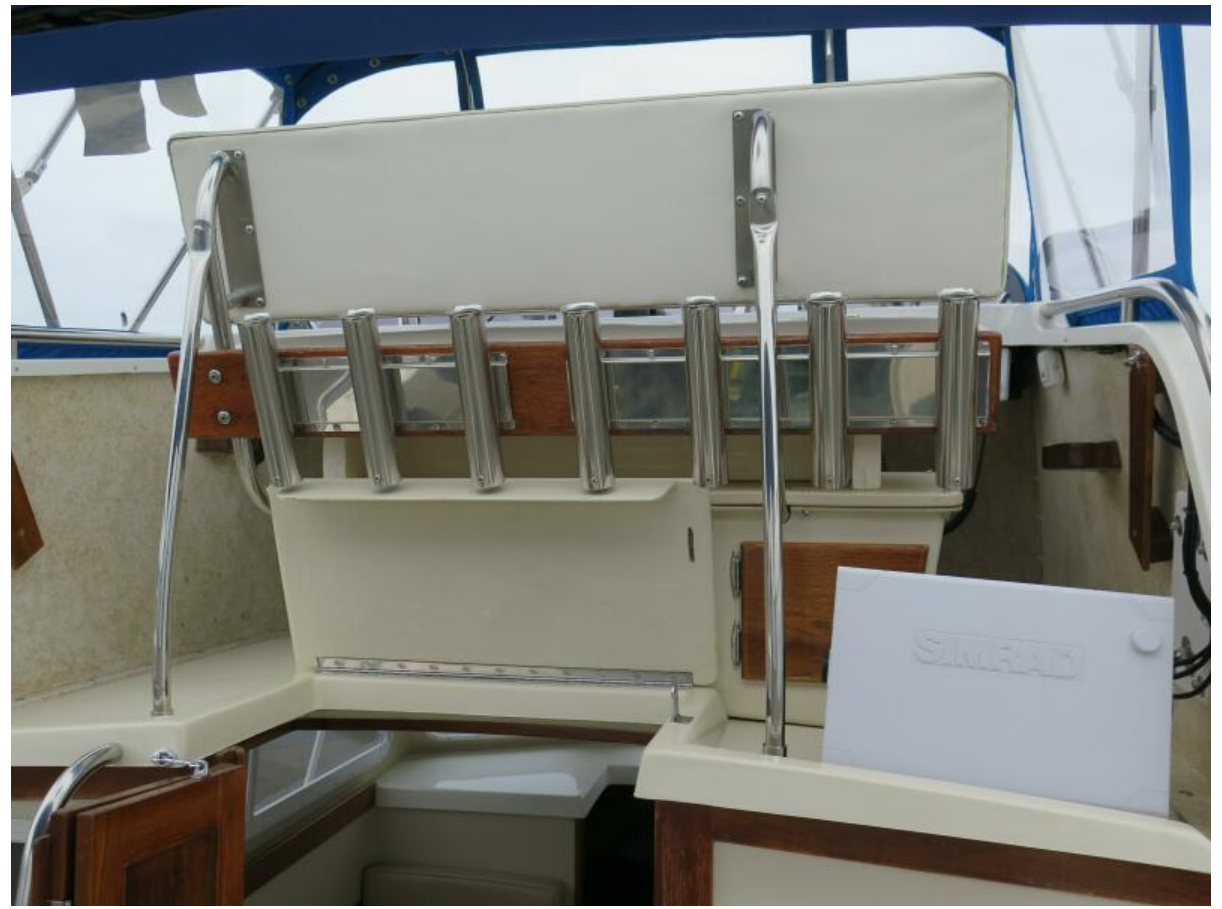
1988 Blackman 26 LAST ONE Rocket Launchers of Bridge