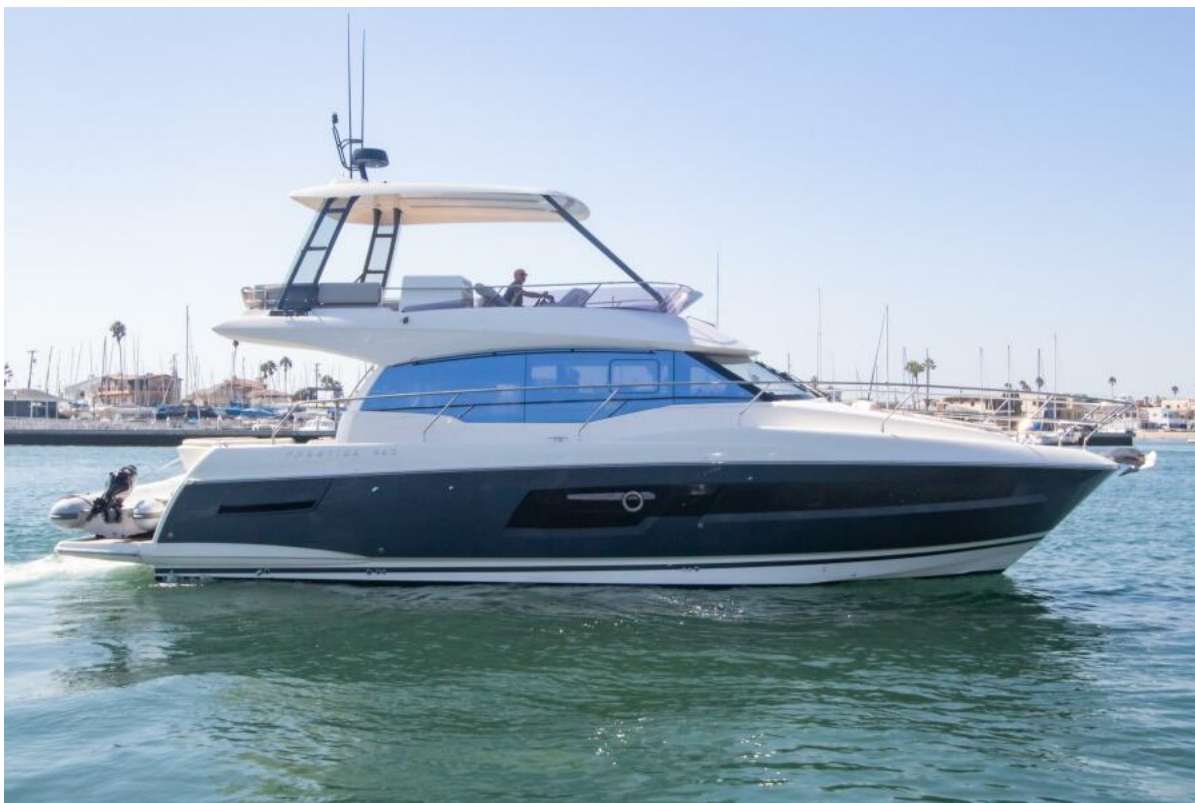
2020 Prestige 460 Flybridge - FANTASEA