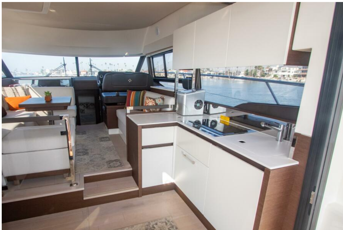
2020 Prestige 460 Flybridge - FANTASEA