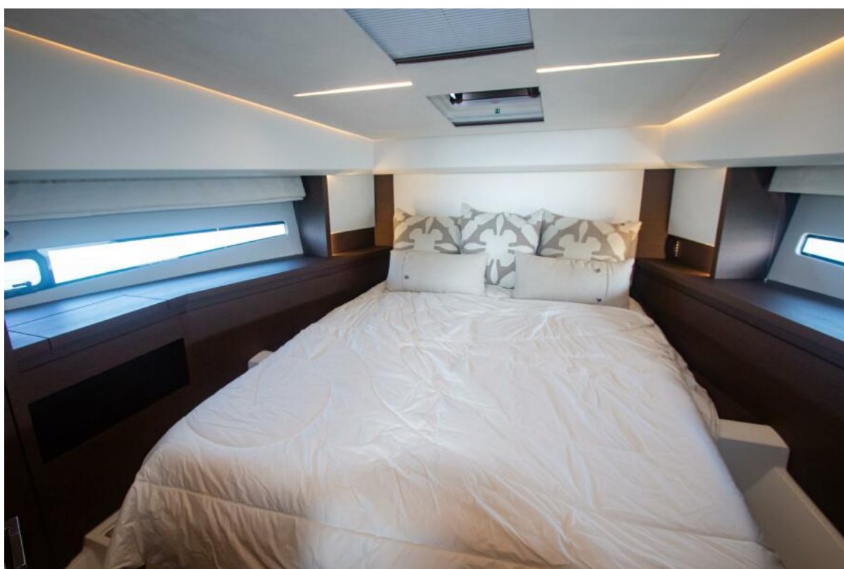
2020 Prestige 460 Flybridge - FANTASEA