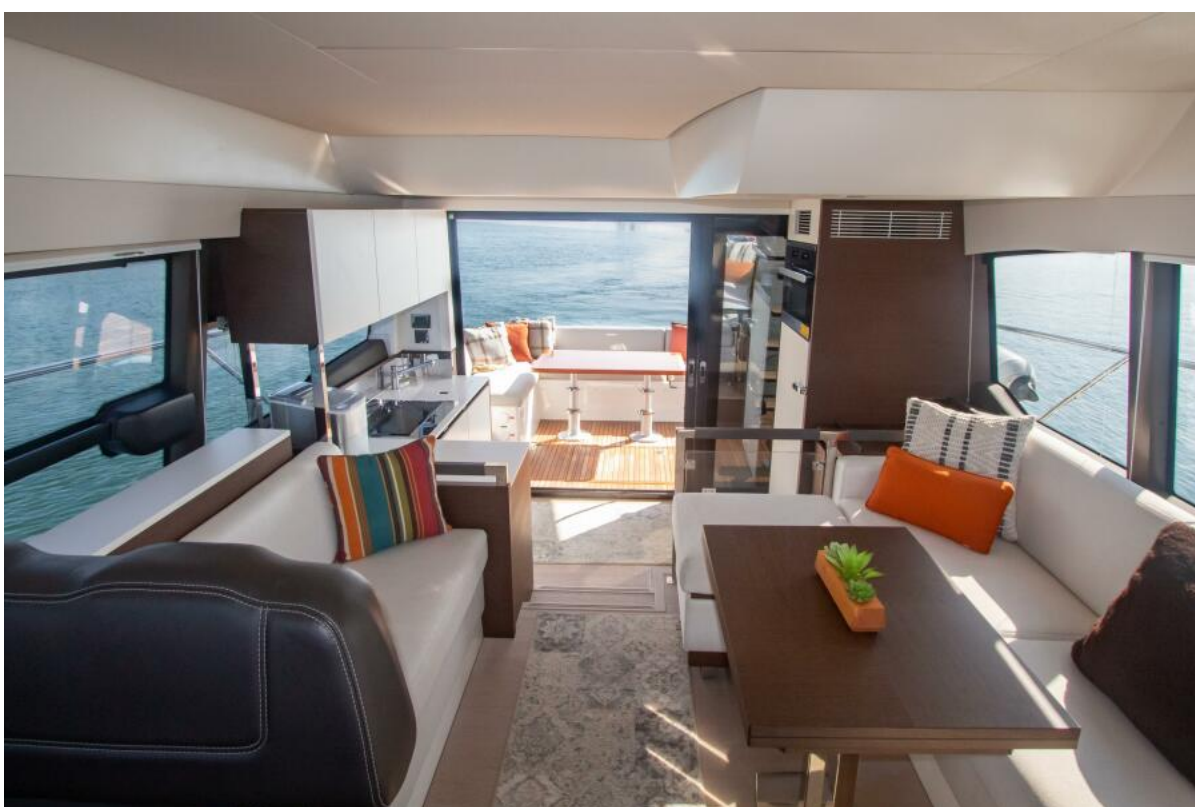
2020 Prestige 460 Flybridge - FANTASEA