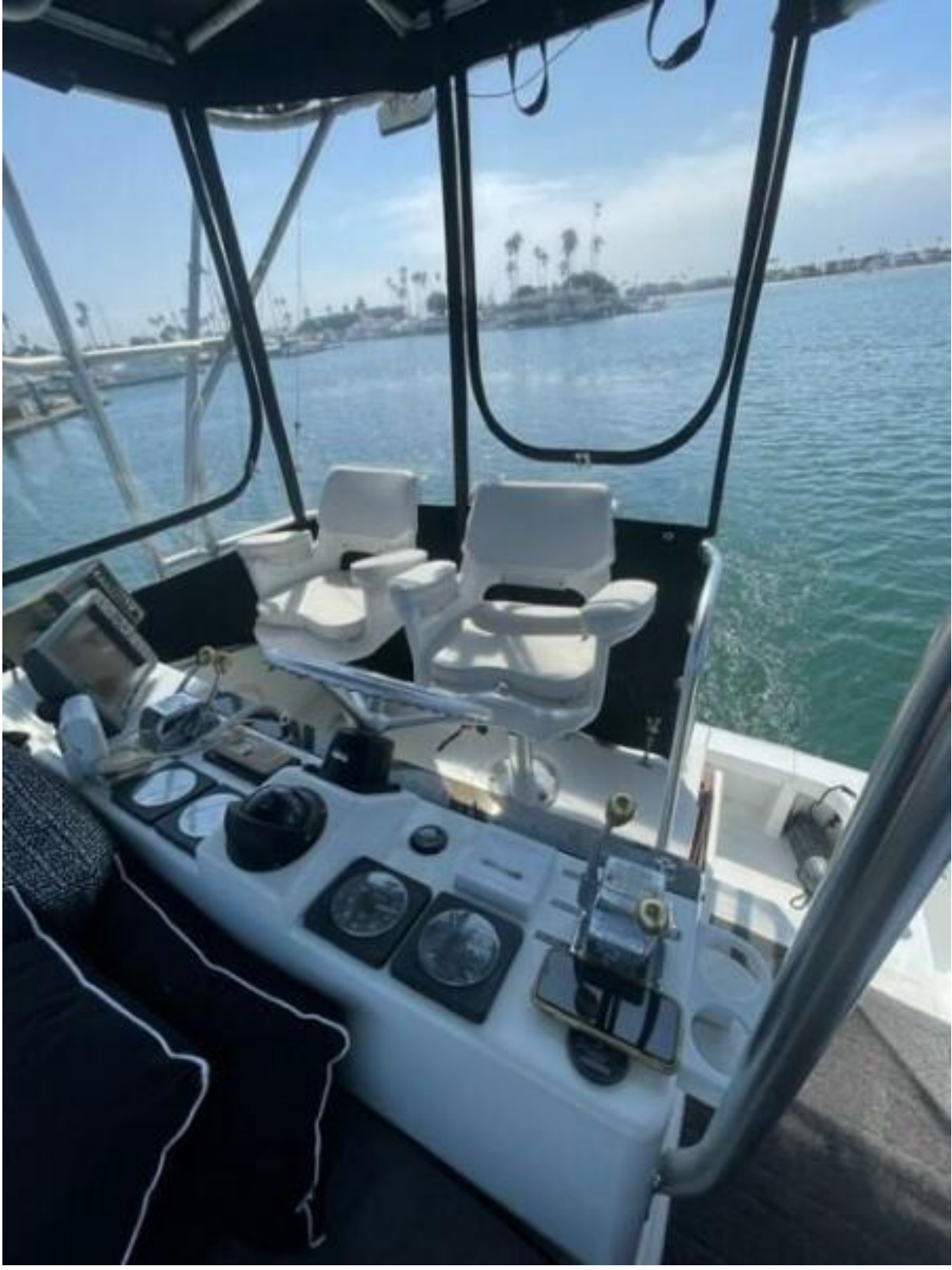
1995 Luhrs 32 Flybridge - NEXT PITCH