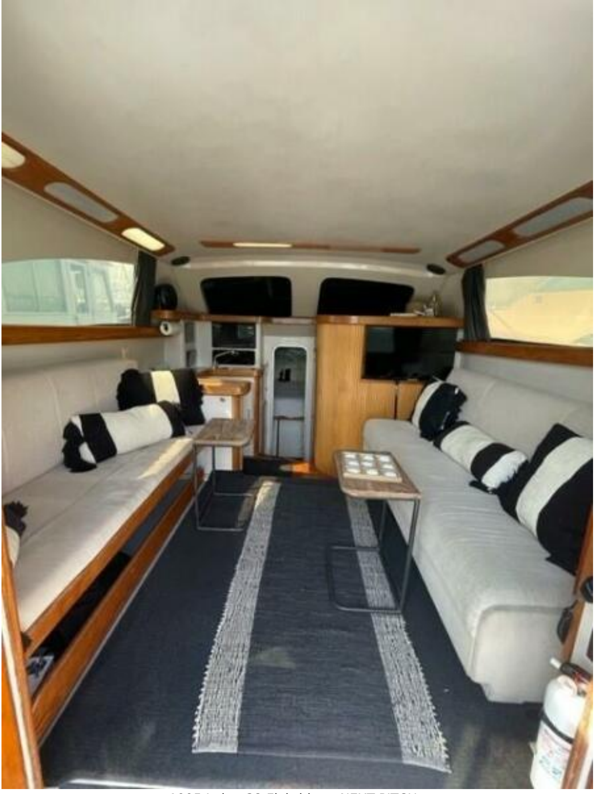
1995 Luhrs 32 Flybridge - NEXT PITCH