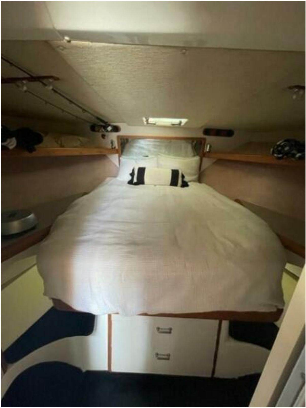
1995 Luhrs 32 Flybridge - NEXT PITCH