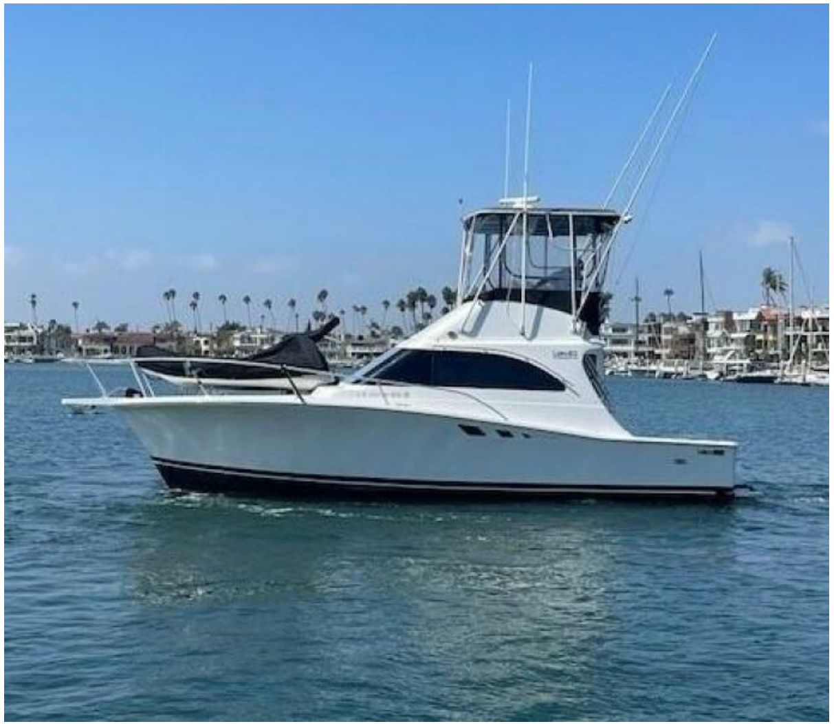
1995 Luhrs 32 Flybridge - NEXT PITCH