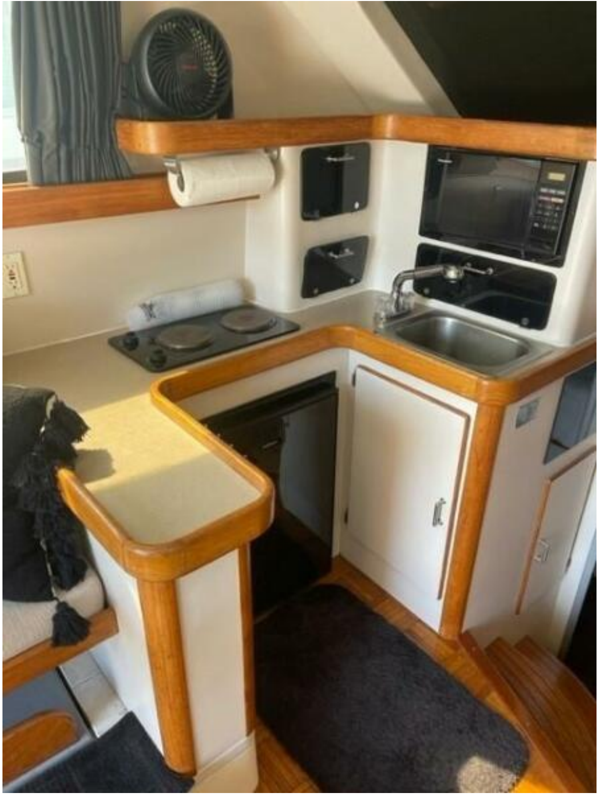
1995 Luhrs 32 Flybridge - NEXT PITCH