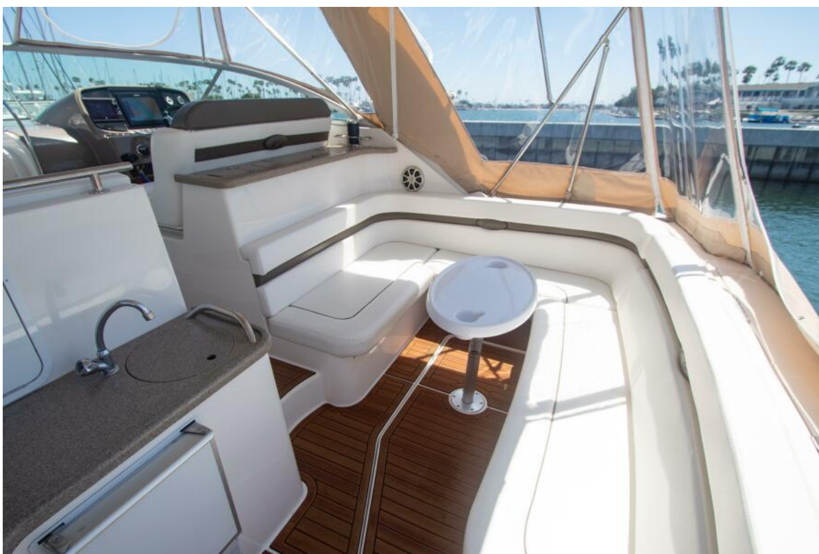
2008 Rinker 40 Express Cruiser