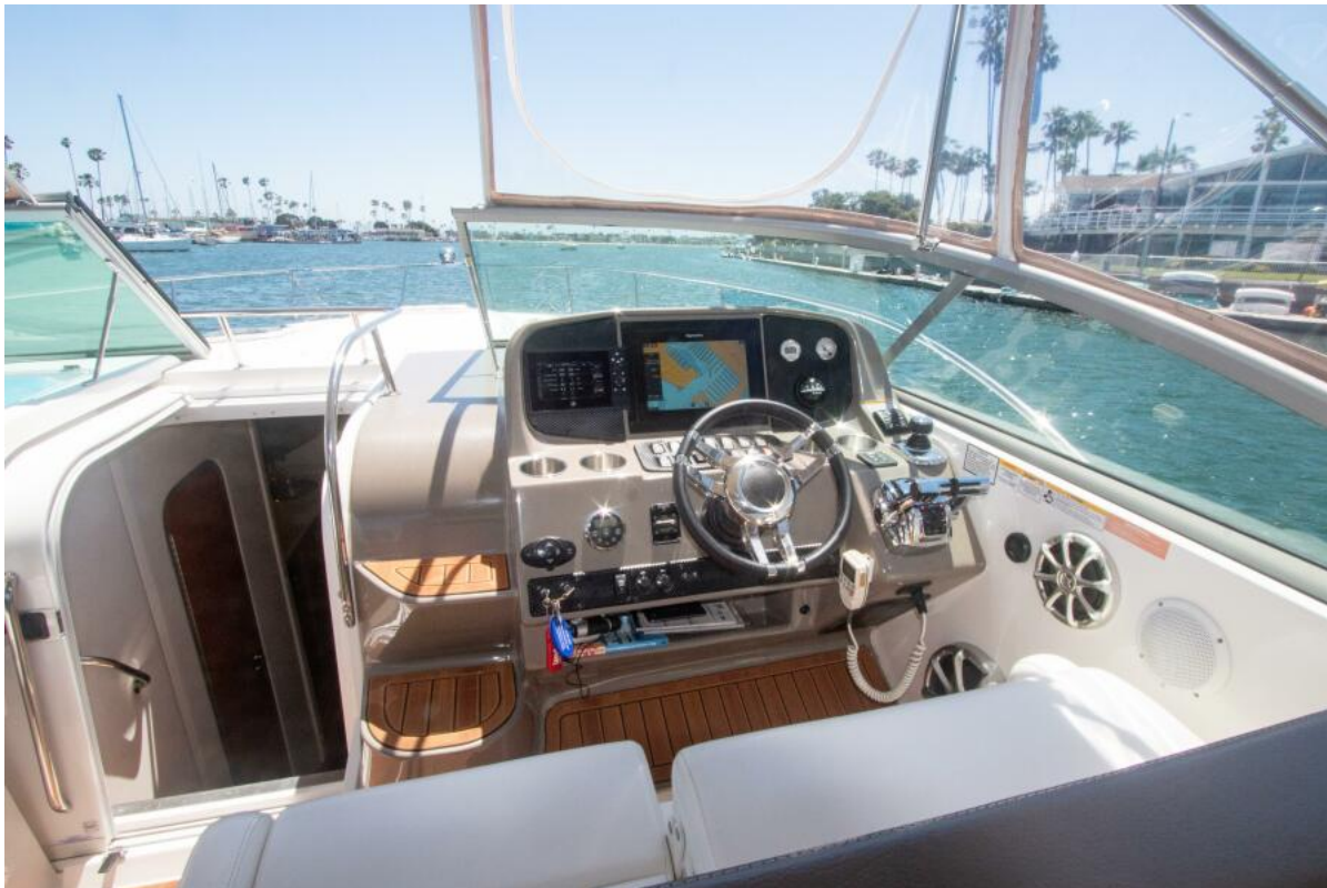
2008 Rinker 40 Express Cruiser