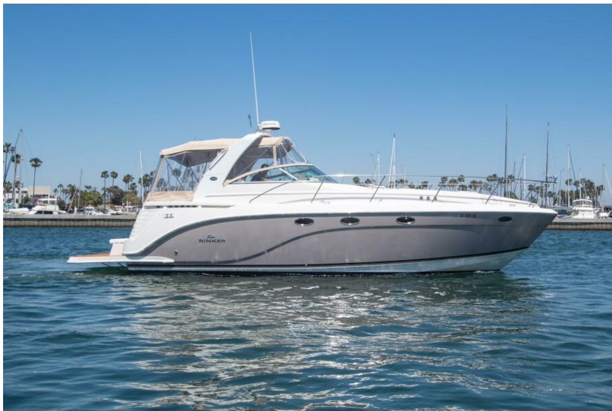
2008 Rinker 40 Express Cruiser Profile