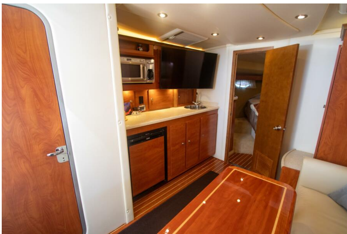
2008 Rinker 40 Express Cruiser