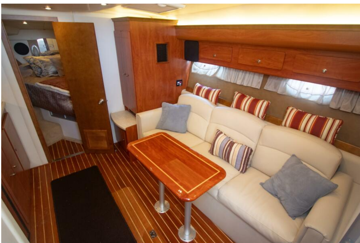
2008 Rinker 40 Express Cruiser