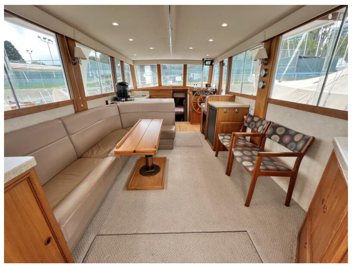
1979 Grand Banks 42 Europa