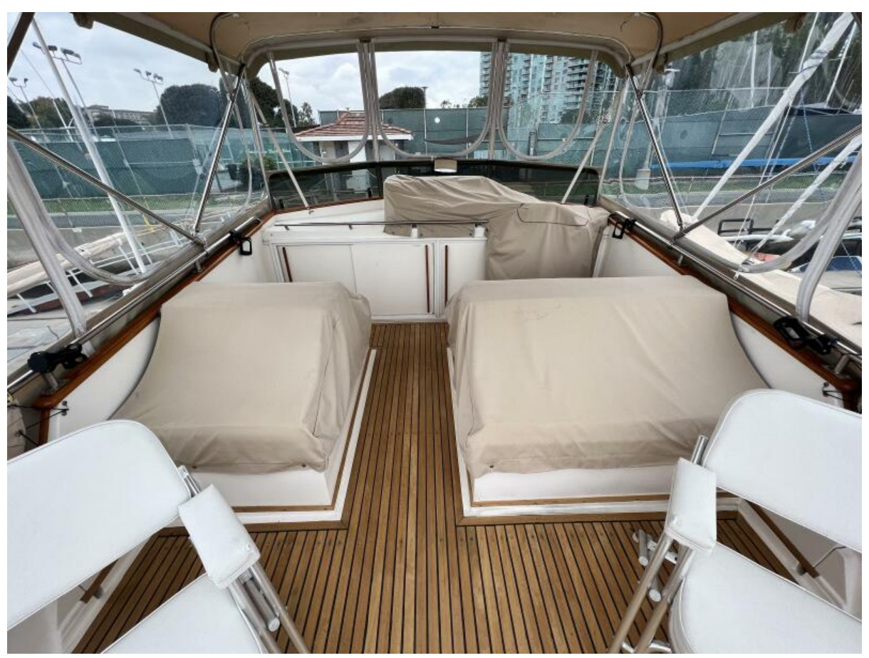
1979 Grand Banks 42 Europa