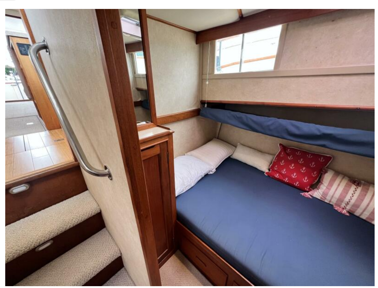
1979 Grand Banks 42 Europa