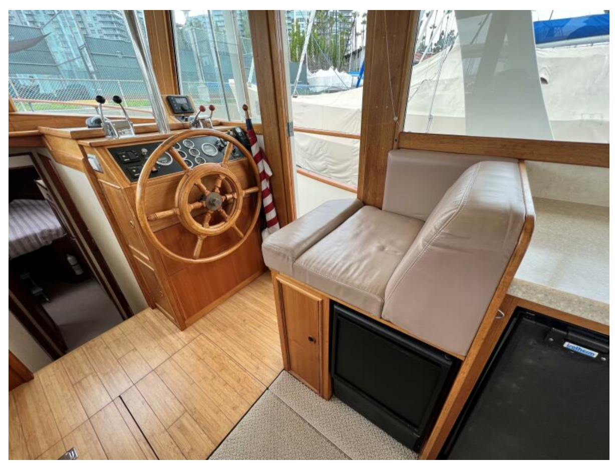
1979 Grand Banks 42 Europa