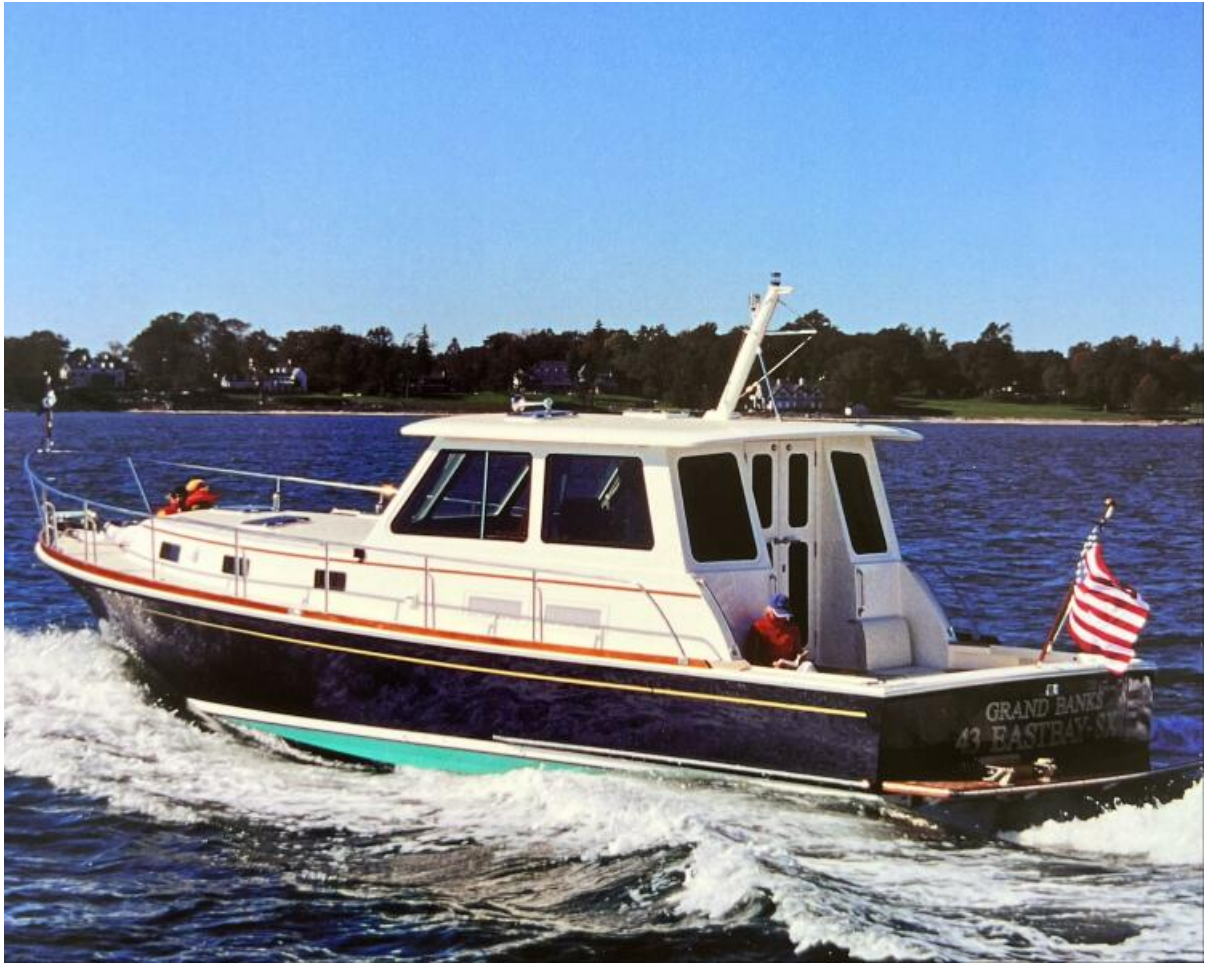
2005 Grand Banks 43SX Eastbay