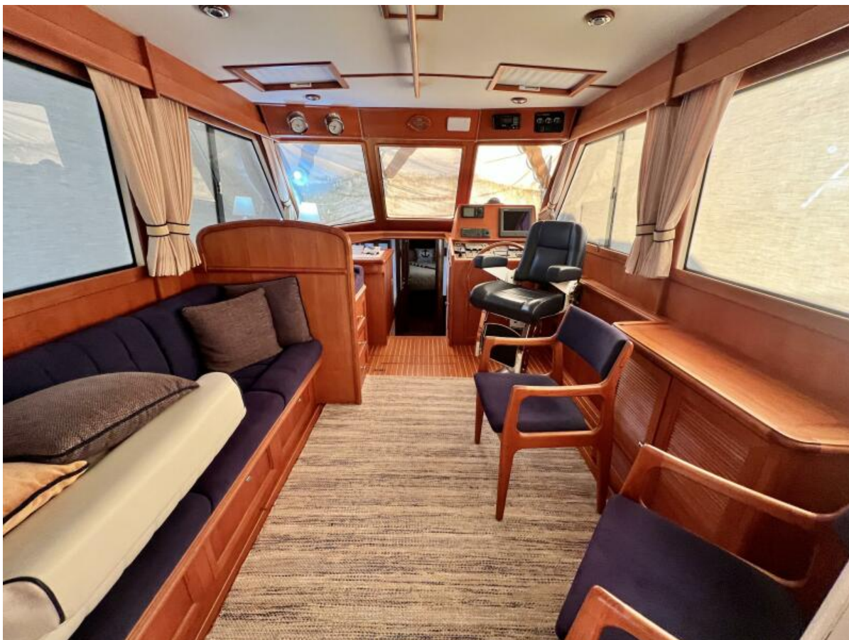
2005 Grand Banks 43SX Eastbay