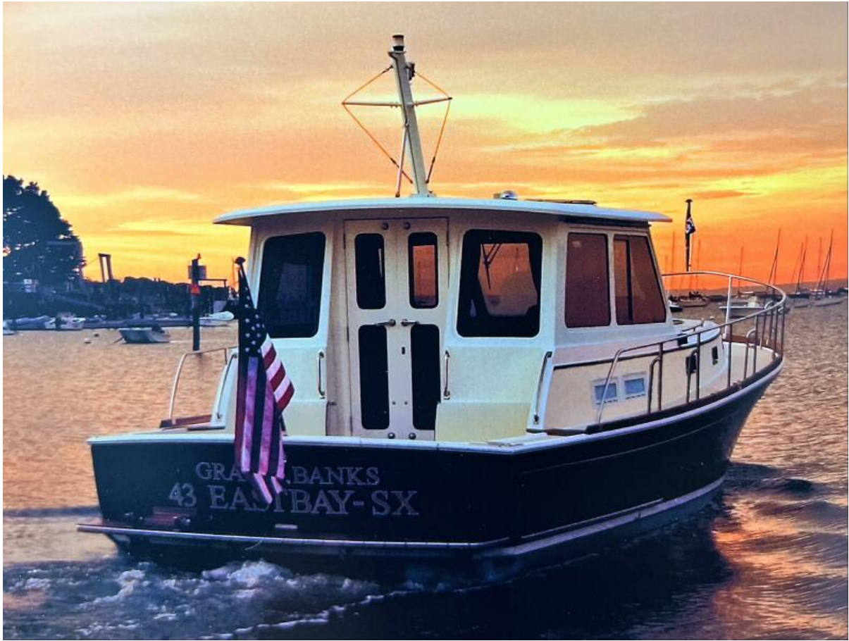
2005 Grand Banks 43SX Eastbay