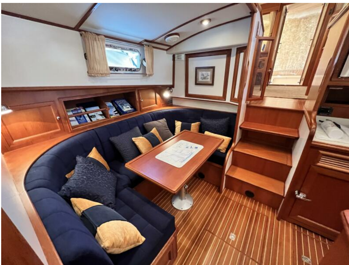
2005 Grand Banks 43SX Eastbay