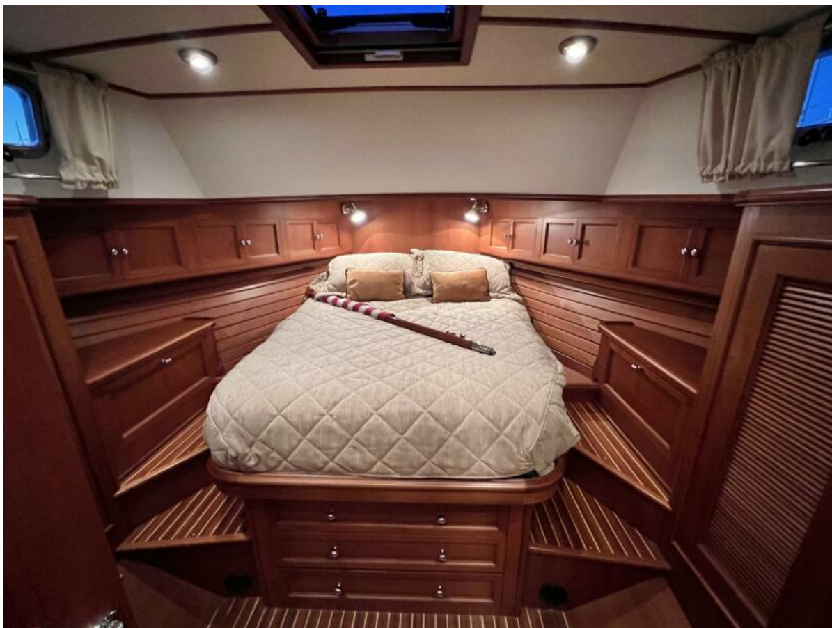
2005 Grand Banks 43SX Eastbay