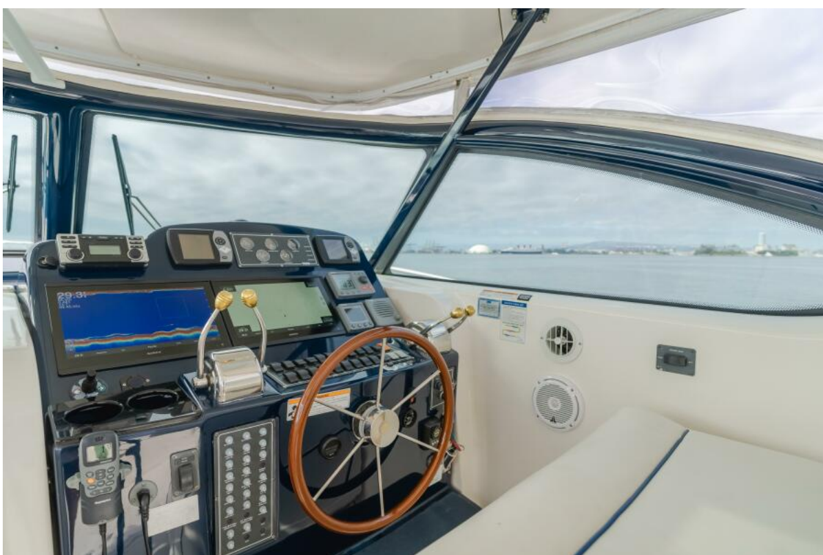
2007 Tiara 3800 Open - EL CAZADOR