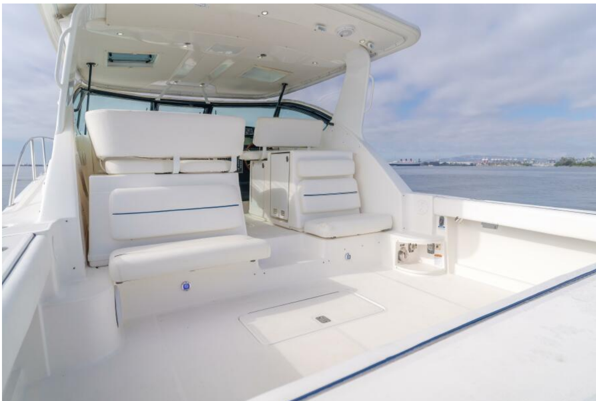
2007 Tiara 3800 Open - EL CAZADOR