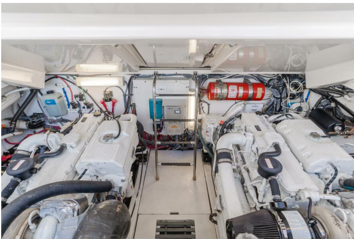
2007 Tiara 3800 Open - EL CAZADOR