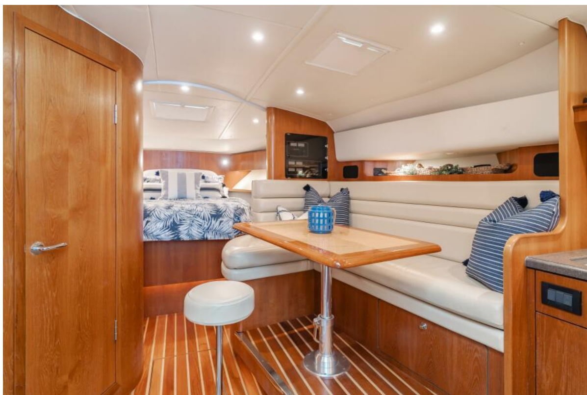
2007 Tiara 3800 Open - EL CAZADOR