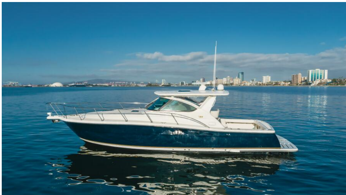
2007 Tiara 3800 Open - EL CAZADOR