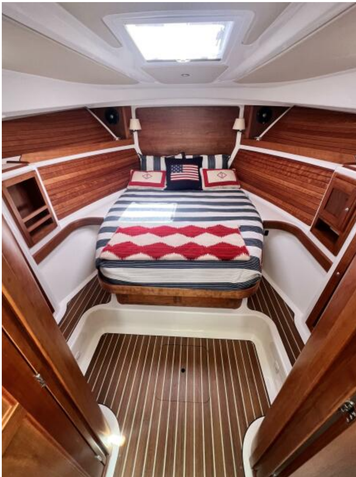
2020 Back Cove 340 - POLO LOUNGE