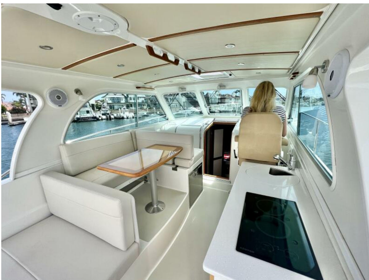
2020 Back Cove 340 - POLO LOUNGE