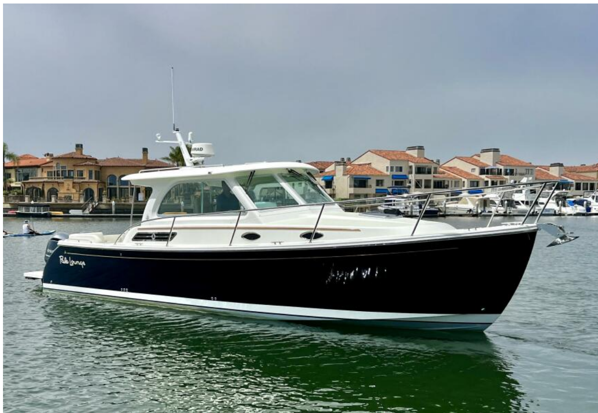
2020 Back Cove 340 - POLO LOUNGE Profile