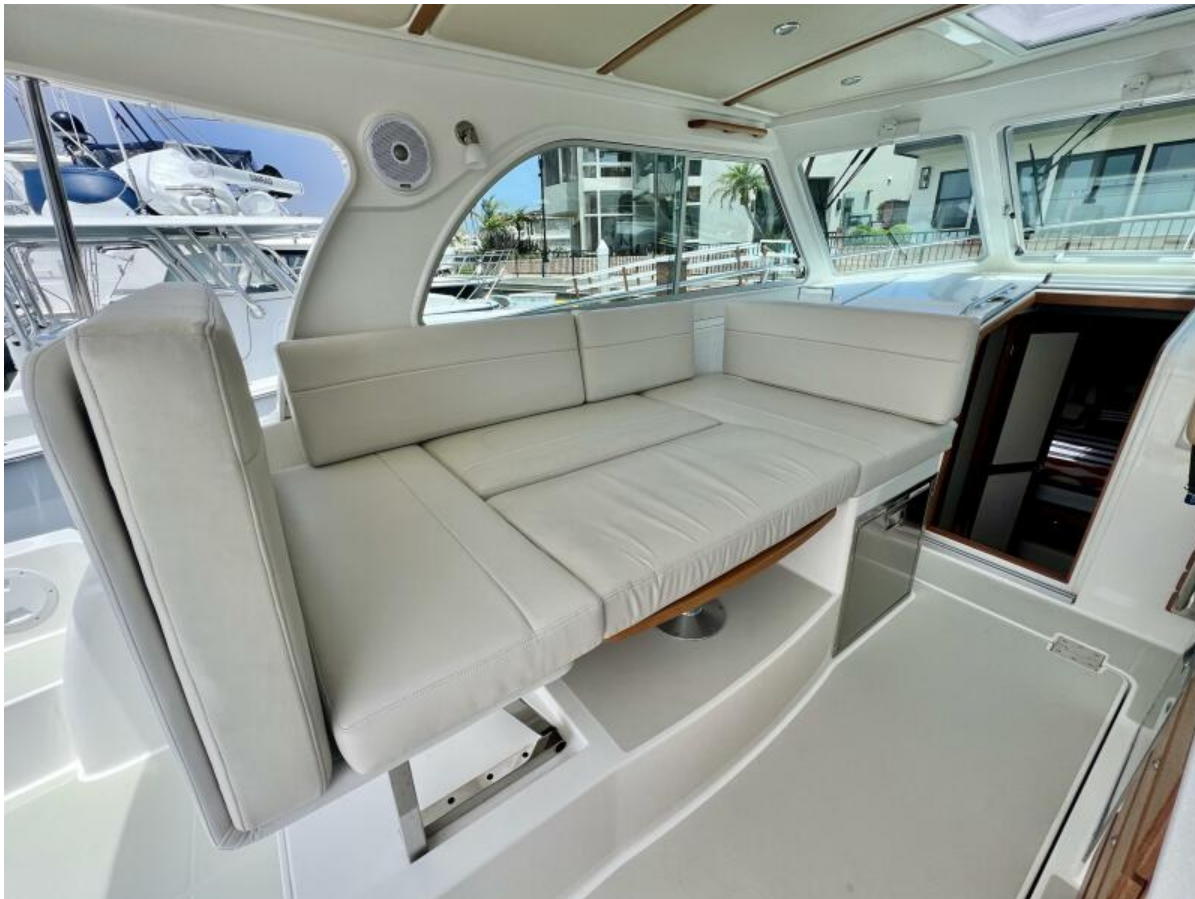
2020 Back Cove 340 - POLO LOUNGE