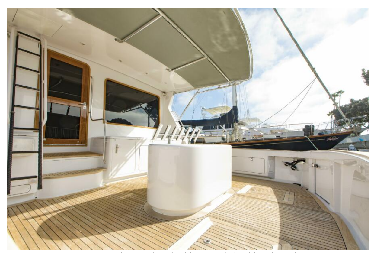
1995 Donzi 72 Enclosed Bridge Cockpit with Bait Tank