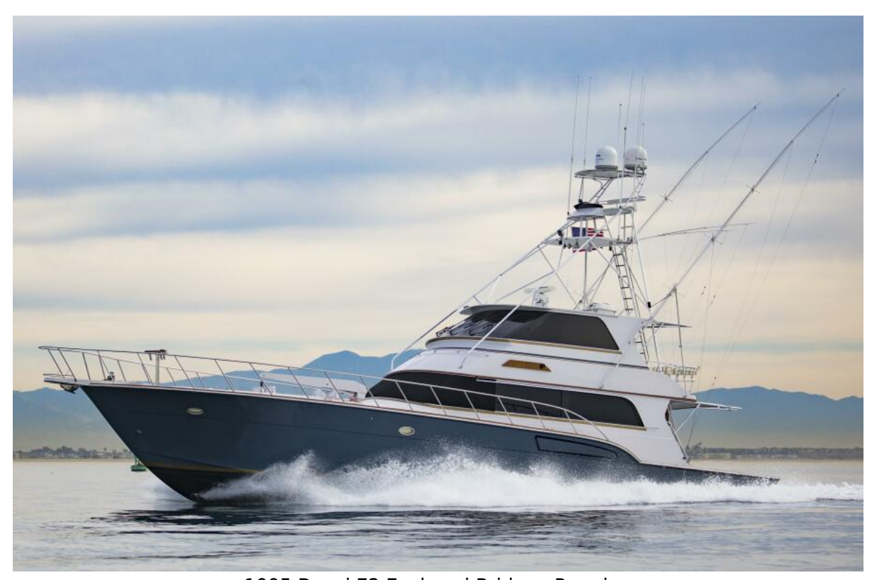
1995 Donzi 72 Enclosed Bridge Running