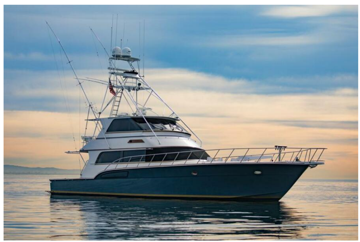
1995 Donzi 72 Enclosed Bridge Profile