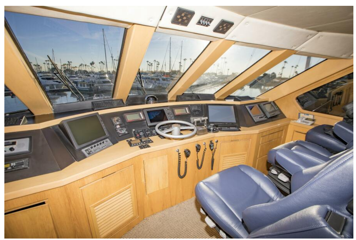
1995 Donzi 72 Enclosed Bridge Helm - Enclosed Bridge