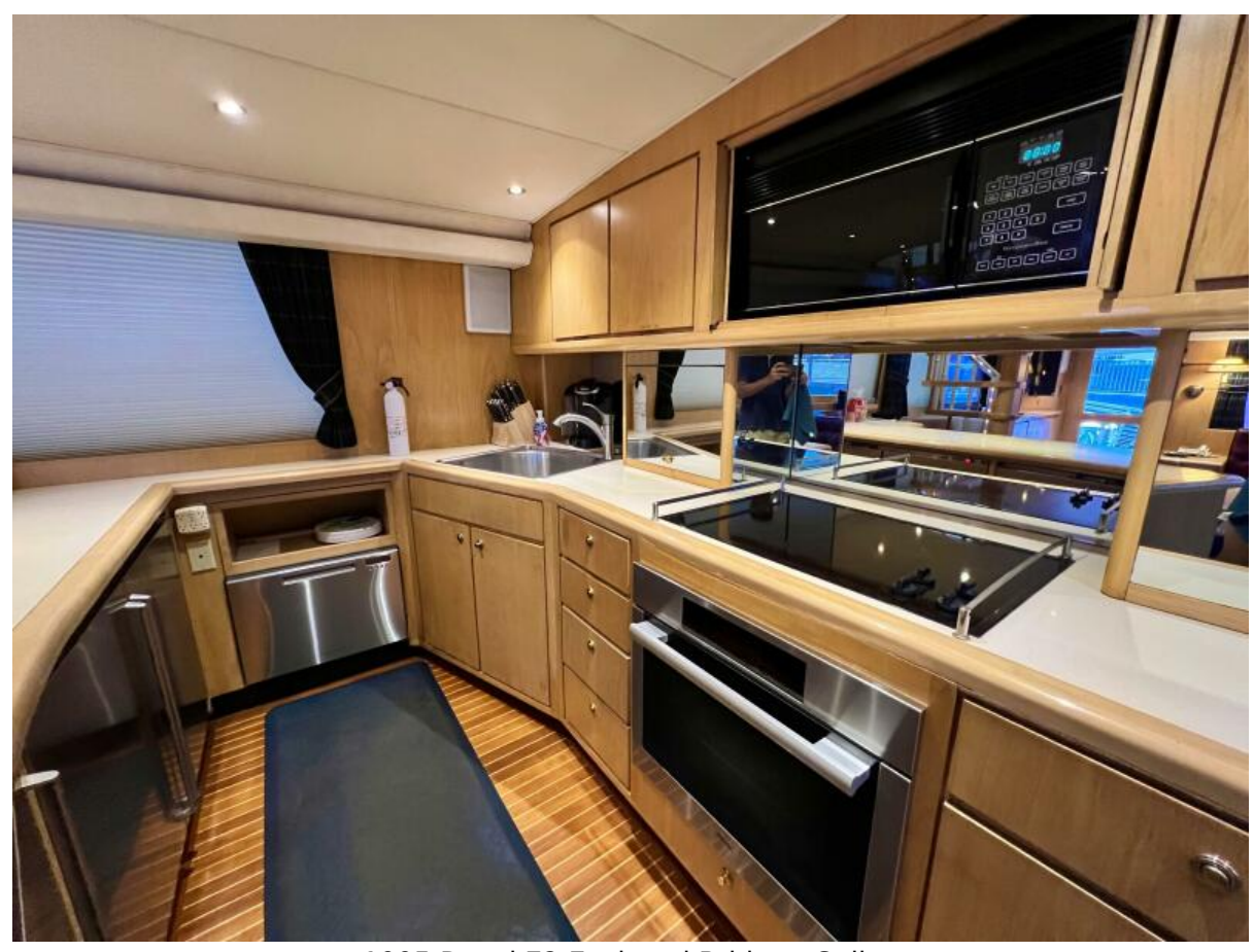
1995 Donzi 72 Enclosed Bridge Galley