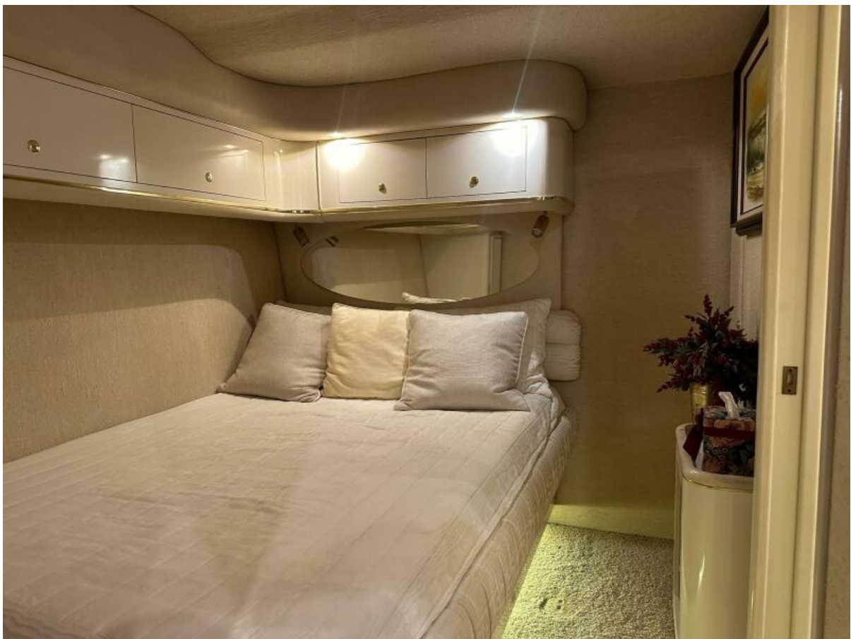
VIP Stateroom Aft