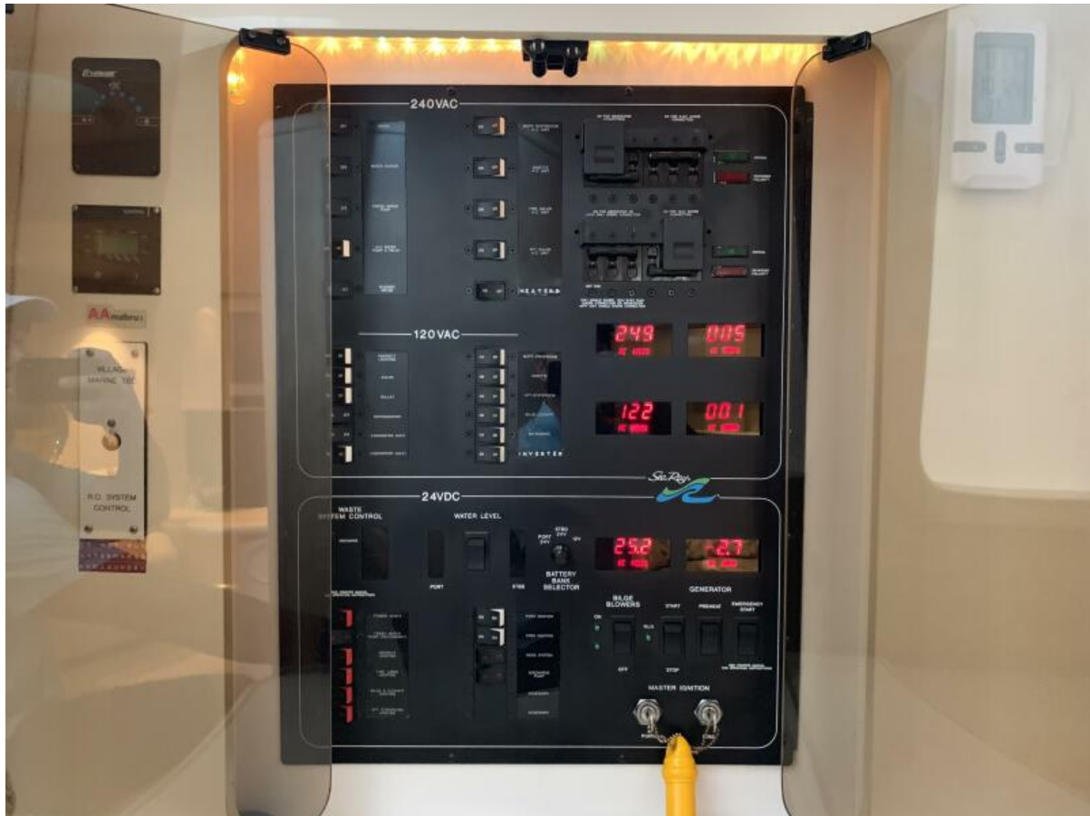
Breaker Panel at Entry to Below