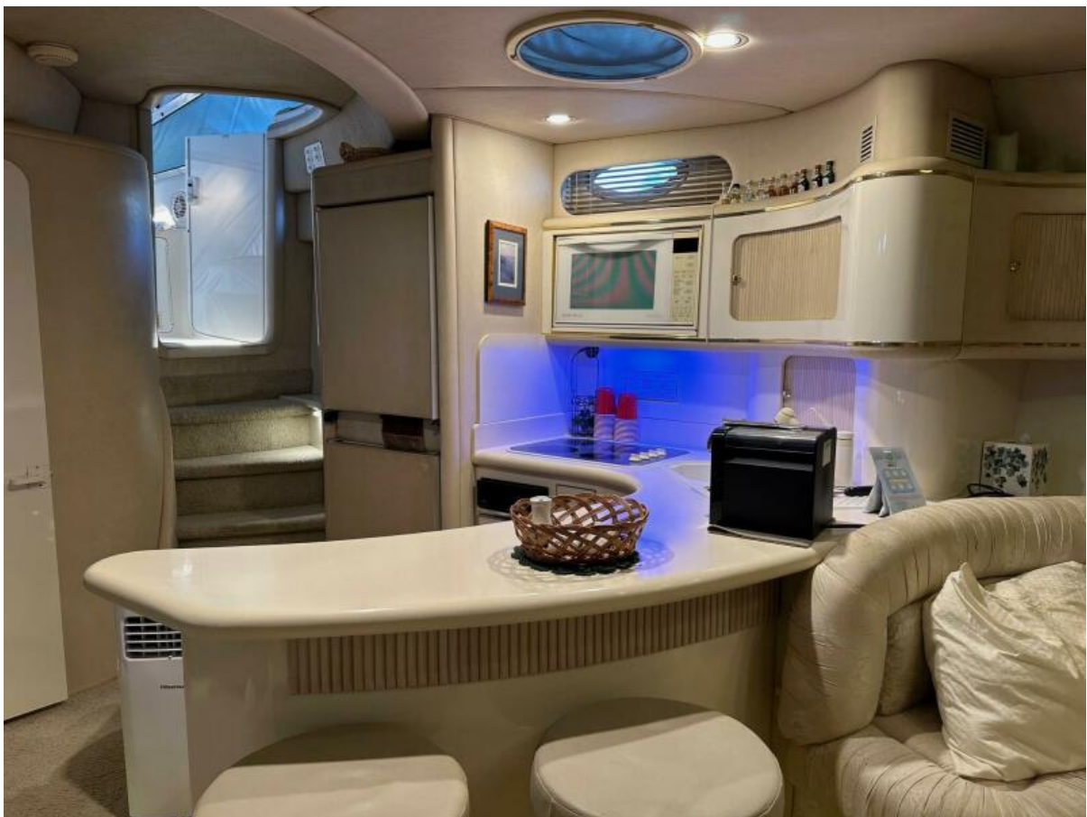
Galley Looking Aft To Stairs Up To Cockpit Deck