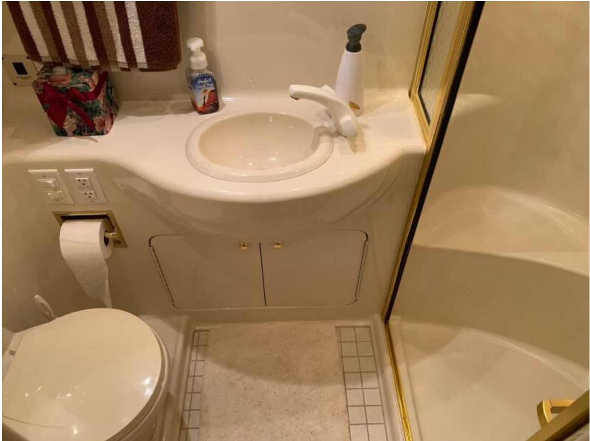
VIP Head Aft