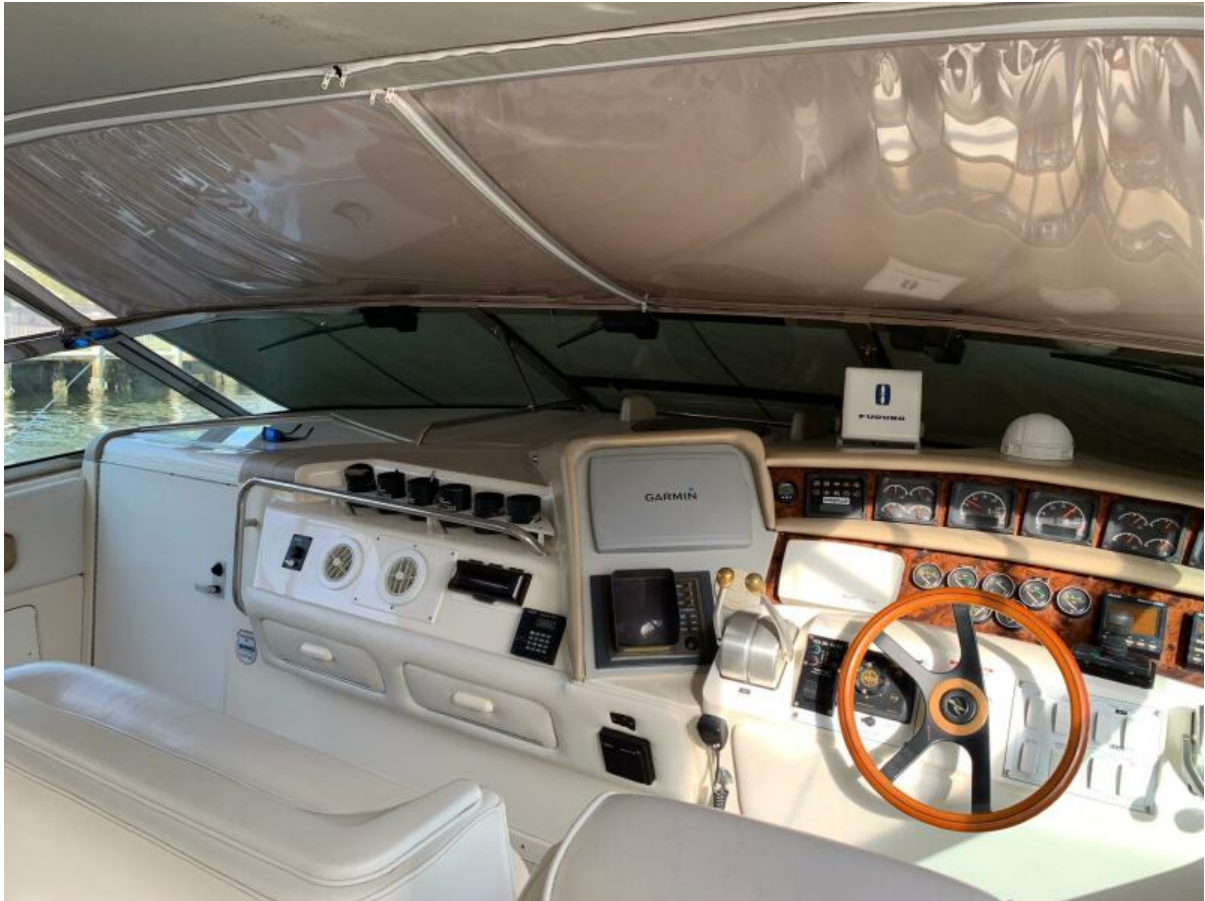
Helm and entry way to below