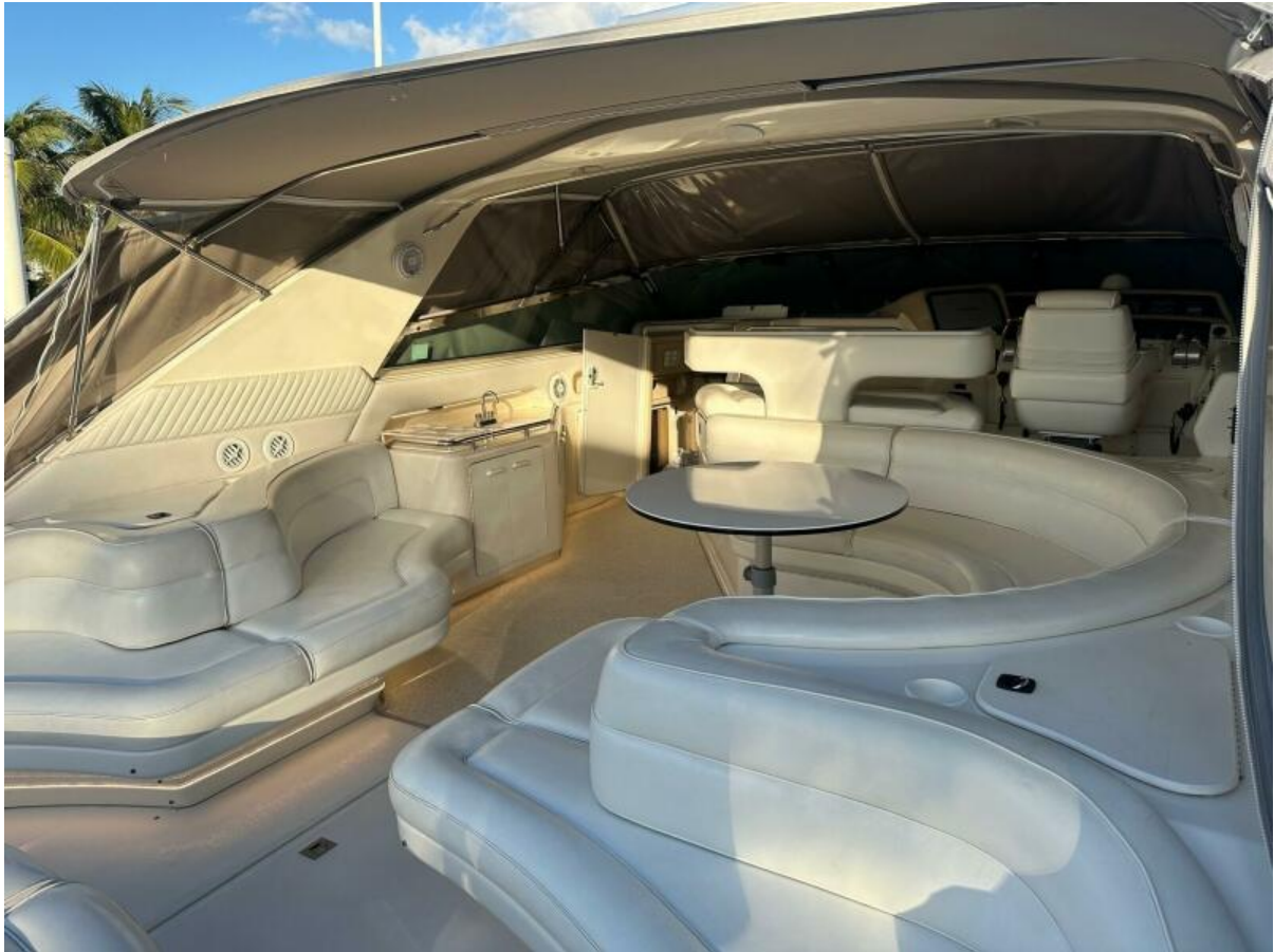
Cockpit Deck View Port