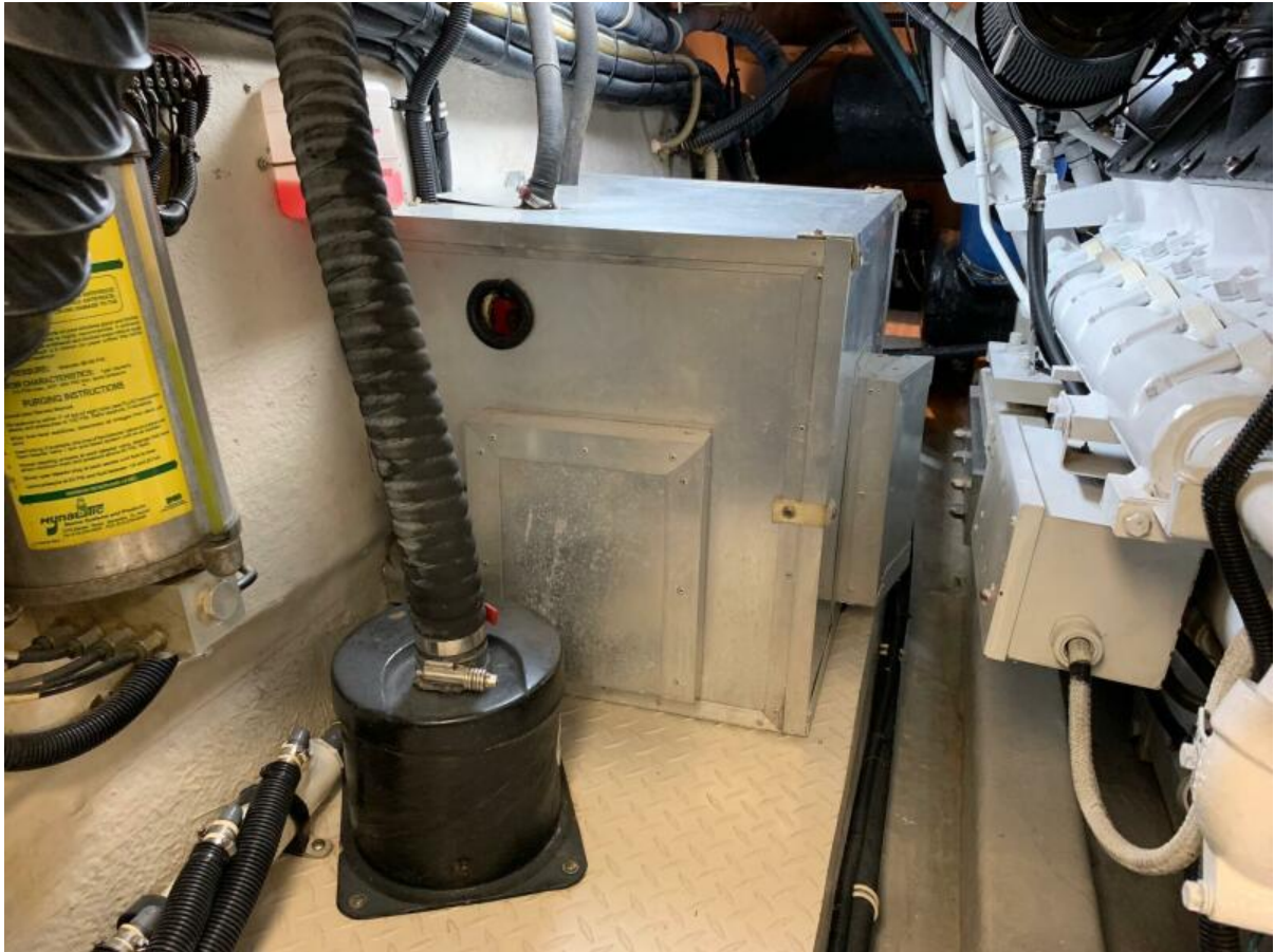
2nd Gen Set Engine Room