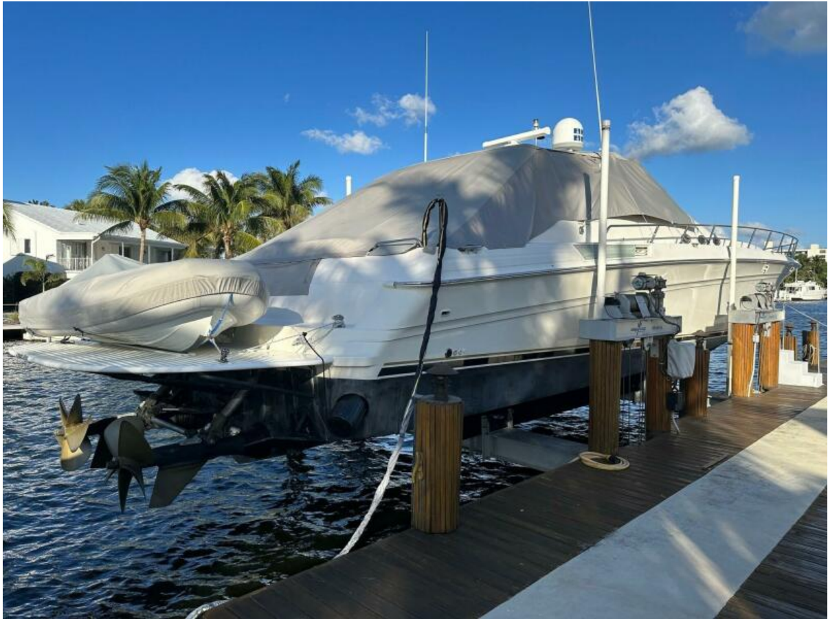
Stbd Side On Lift