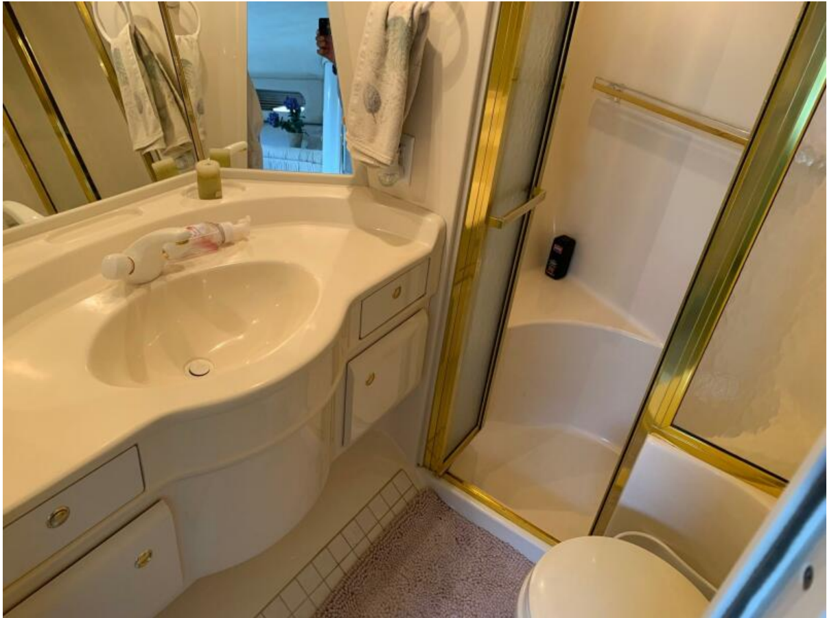
Master Ensuite Head