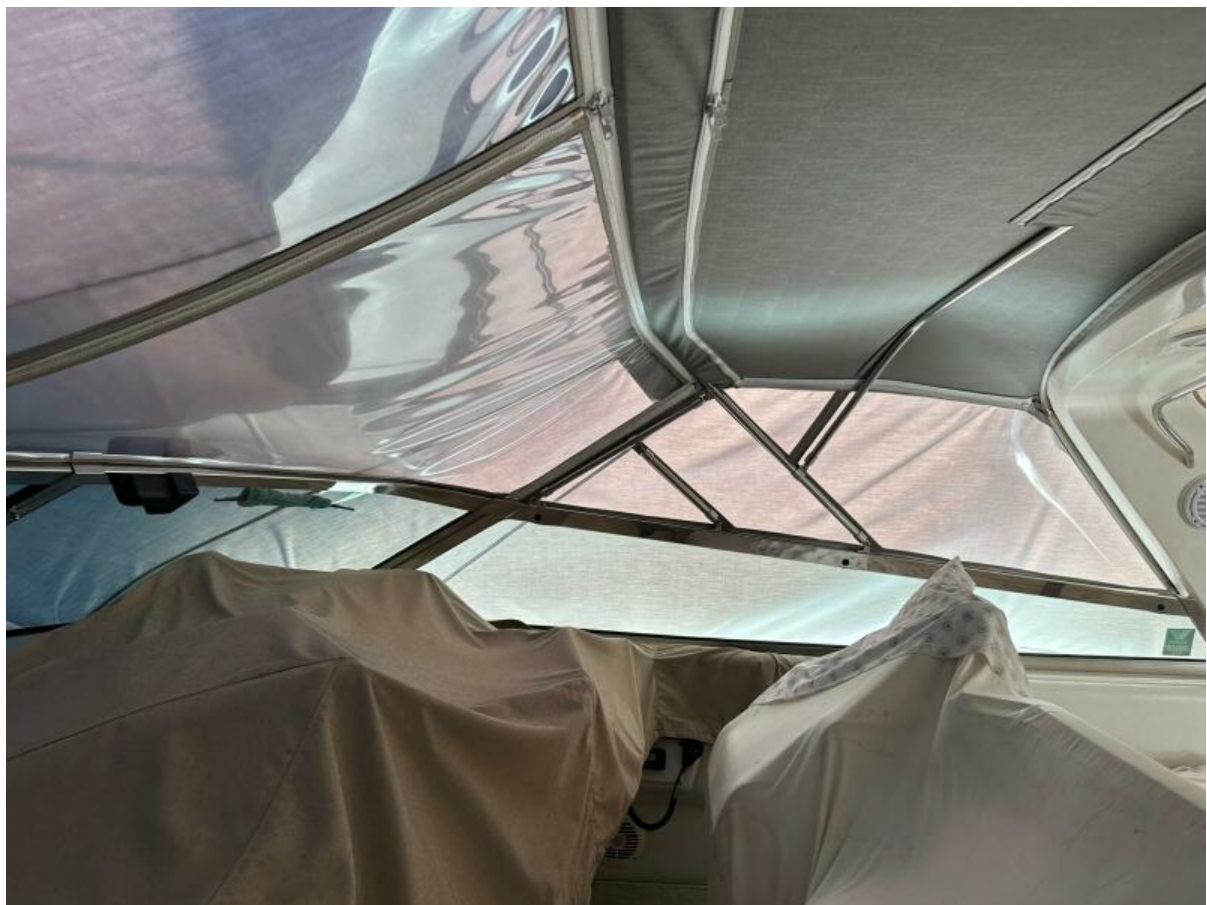
Covered Helm And Cockpit Interior