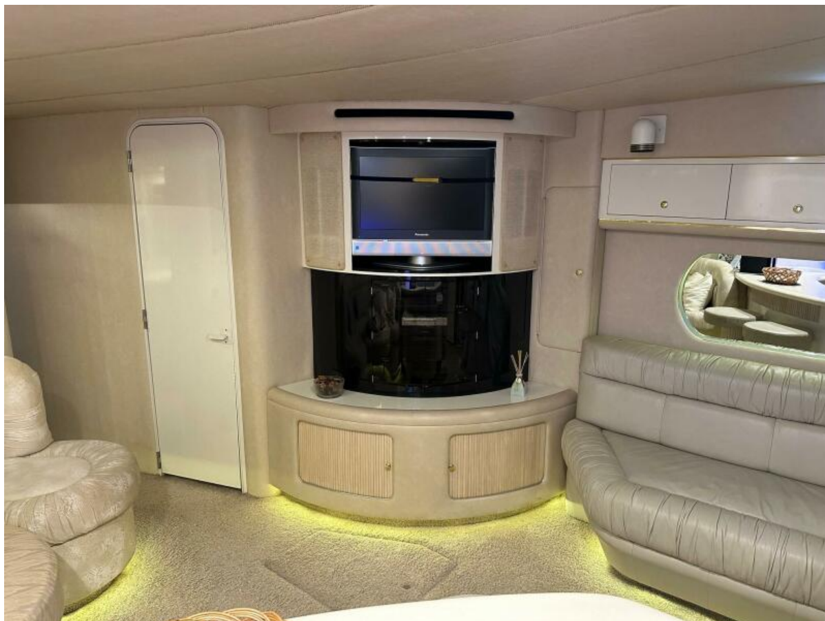
Salon Entertainment Center