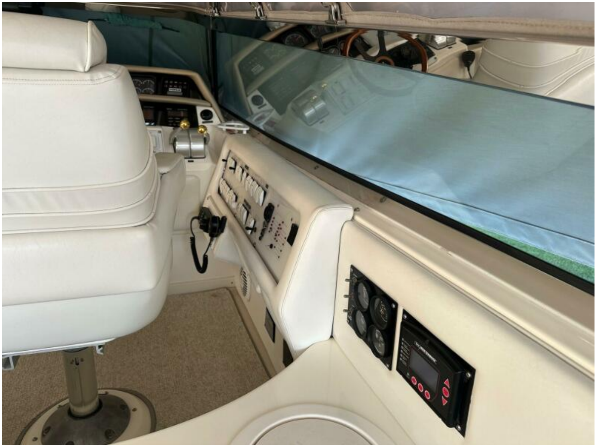
Helm Area Control Panel