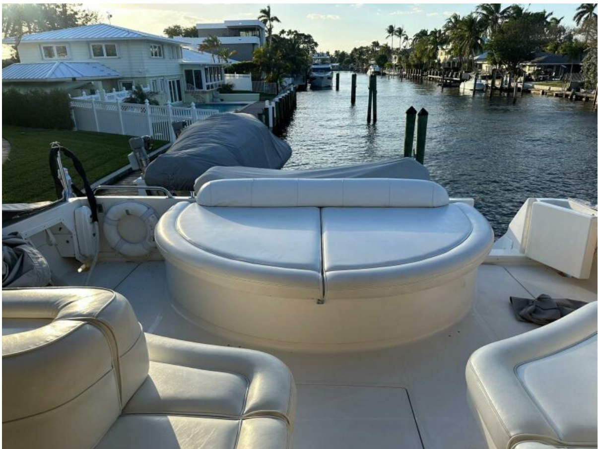
Cockpit Area Sunpad And Transom Door To Swim Platform