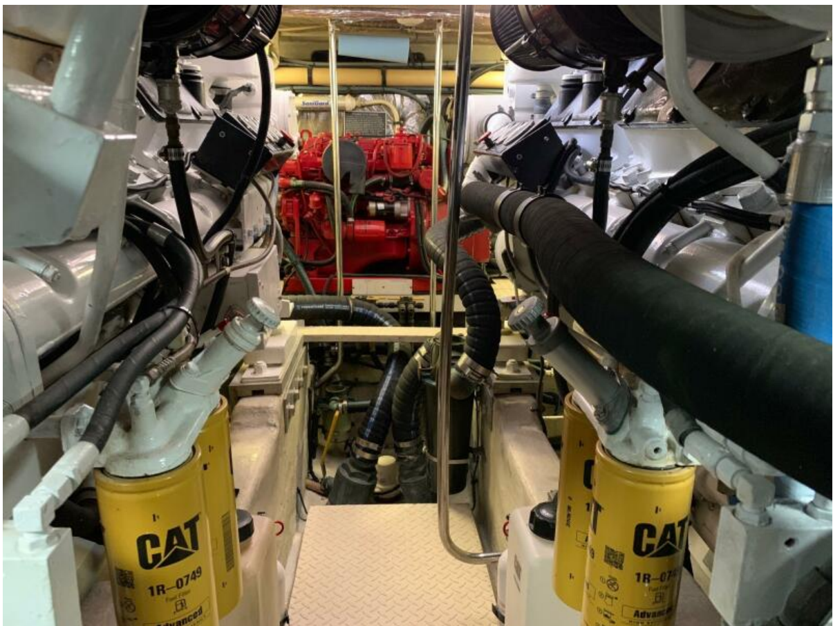
Engine Room CAT 3412's