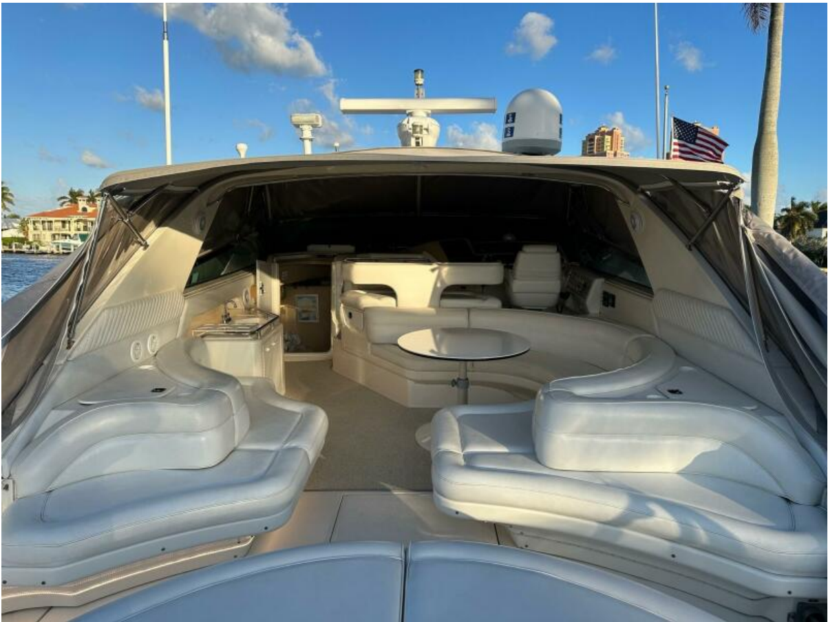
Cockpit Deck Looking Fwd To Helm Area