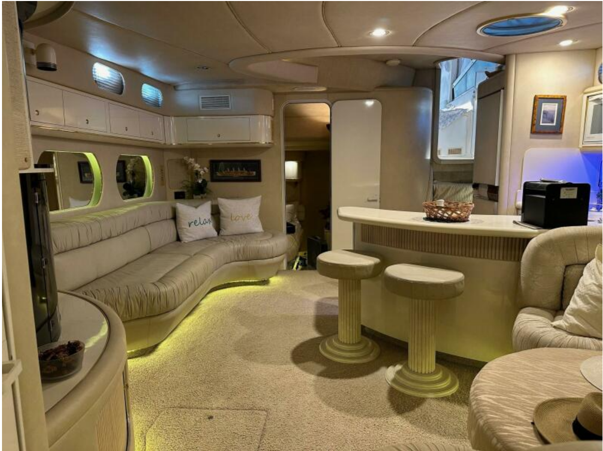
Salon Looking Aft To Guest SR And Stairs Up To Helm Deck