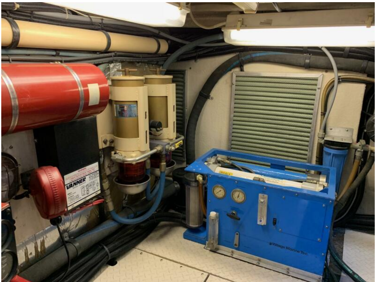
Engine Room Water Maker, Halon System, Racor