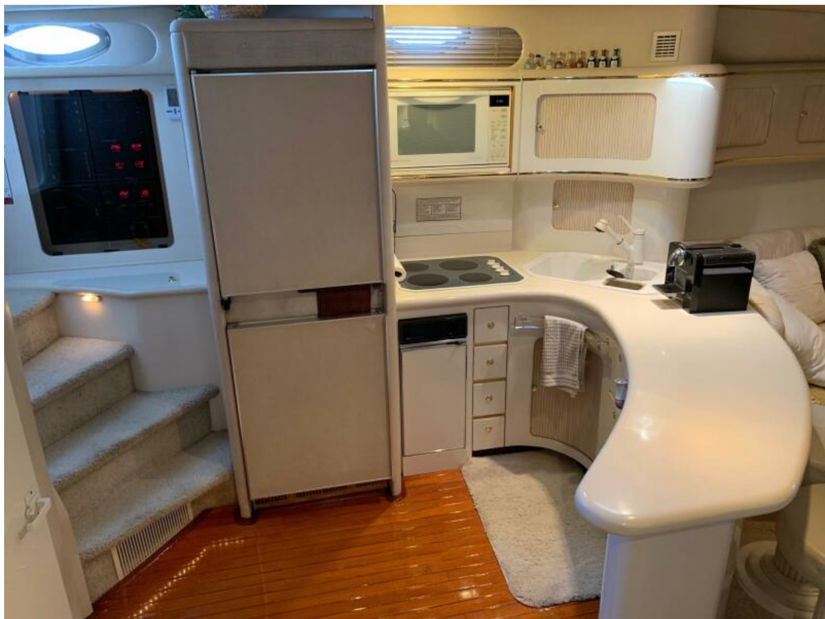
Down to Galley