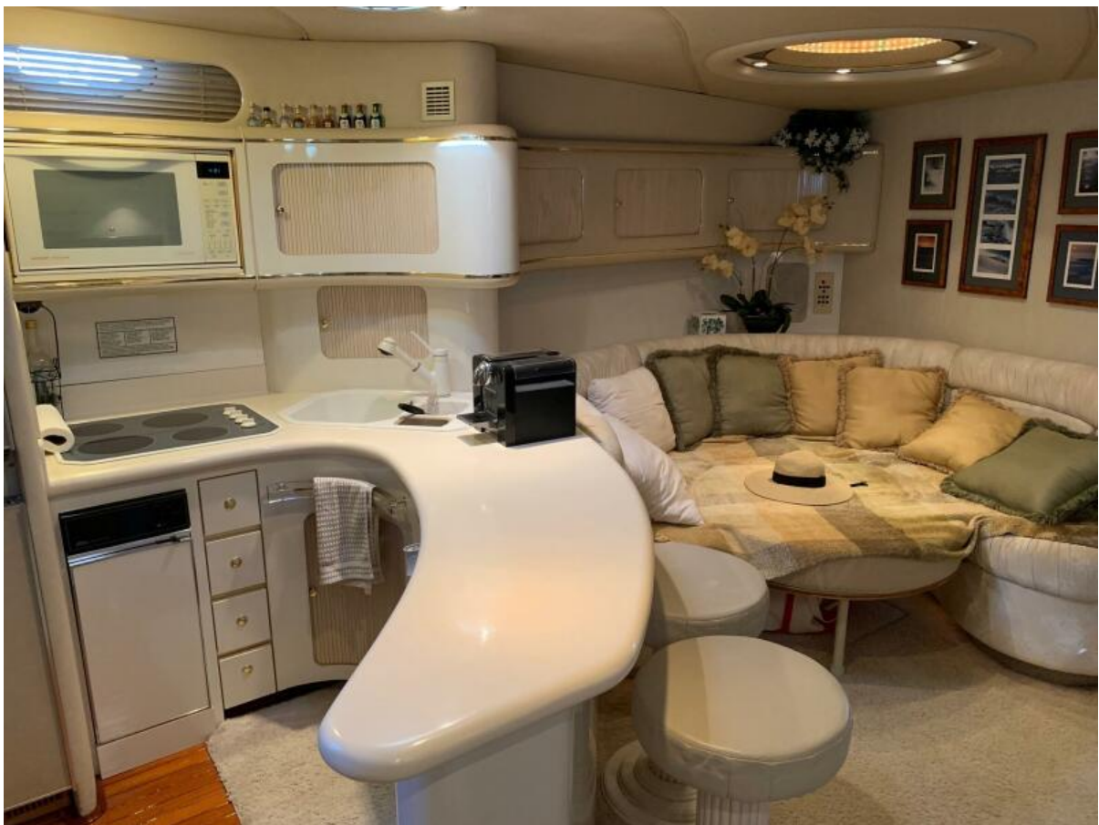
Galley and port side salon