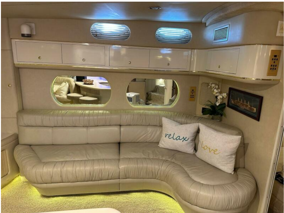
Salon Couch To Starboard