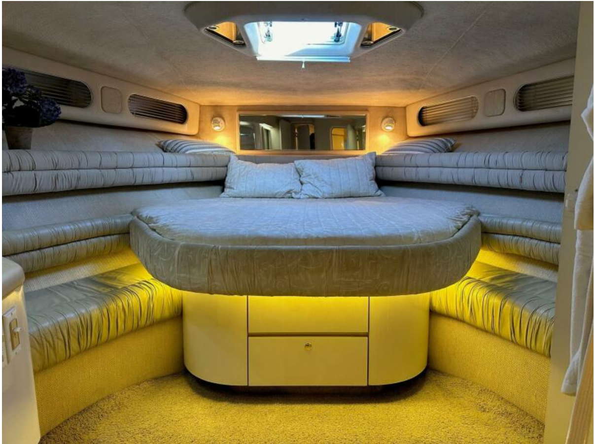
Master Stateroom Forward