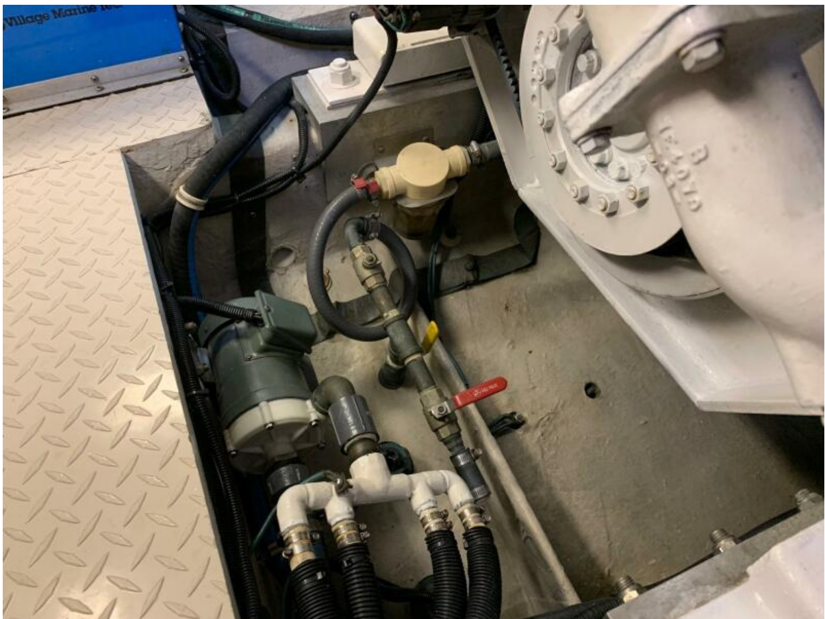
Engine Room Bilges