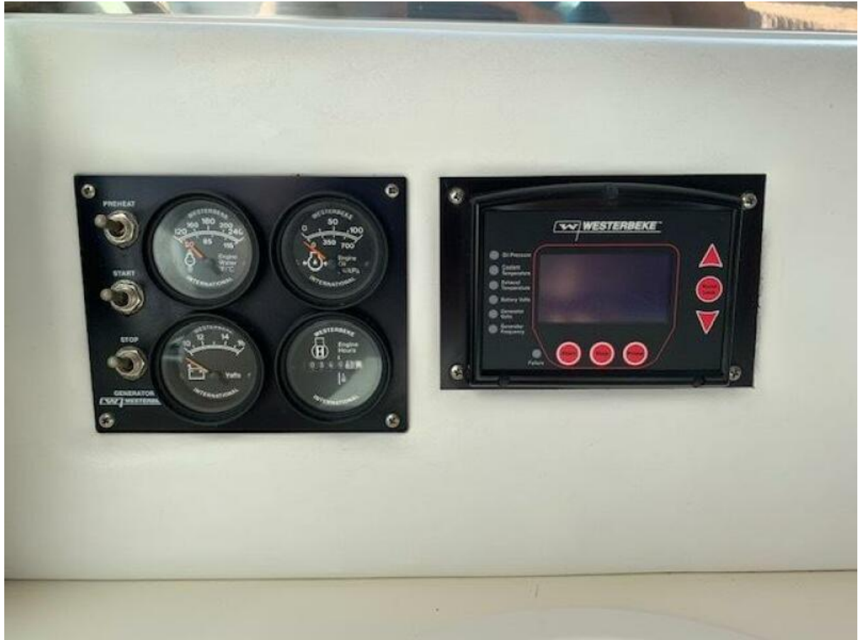
2nd Gen Control Panel