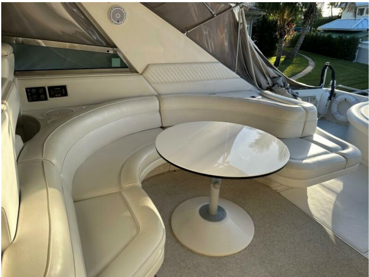
Cockpit Deck Seating Behind Helm