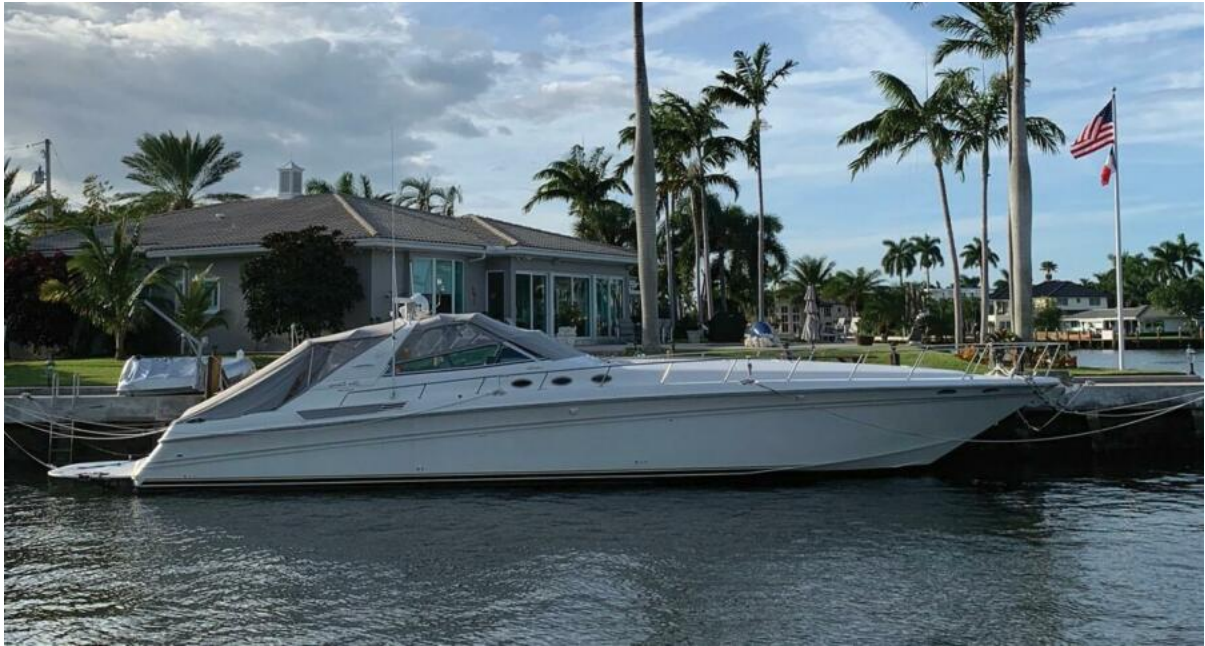
LUCHY, 63' Sea Ray 1995