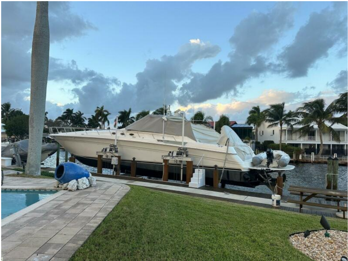
Port Side On Lift