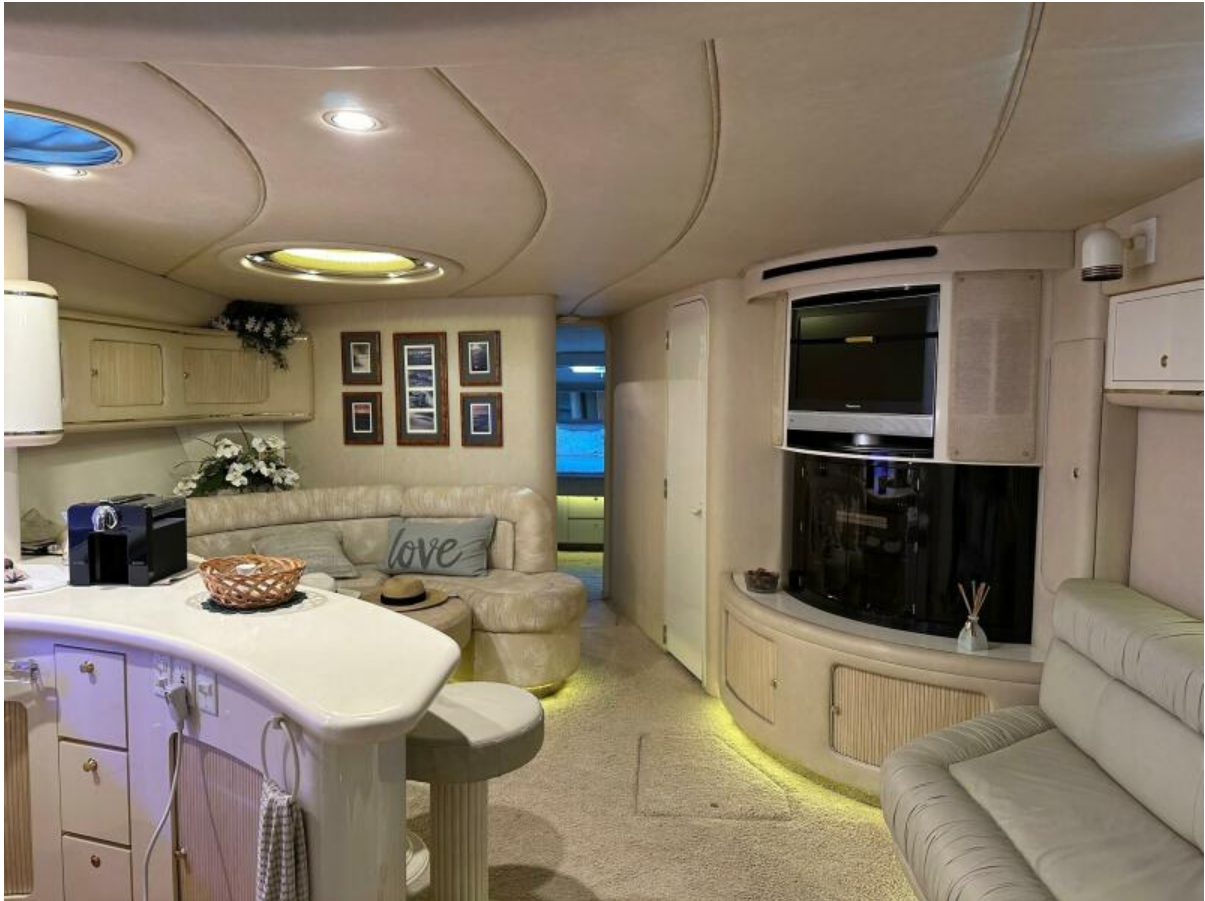
Salon Looking Fwd