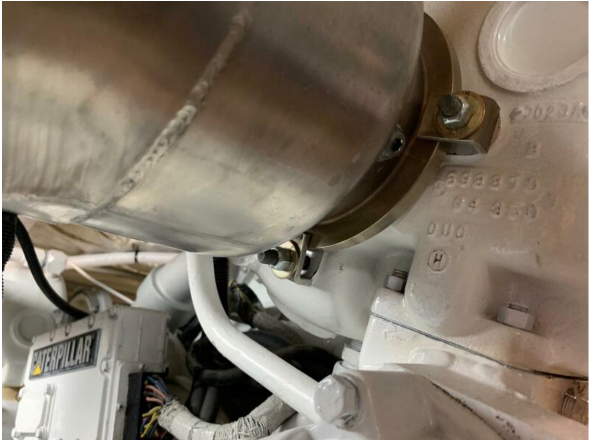
Engine Room Exhaust