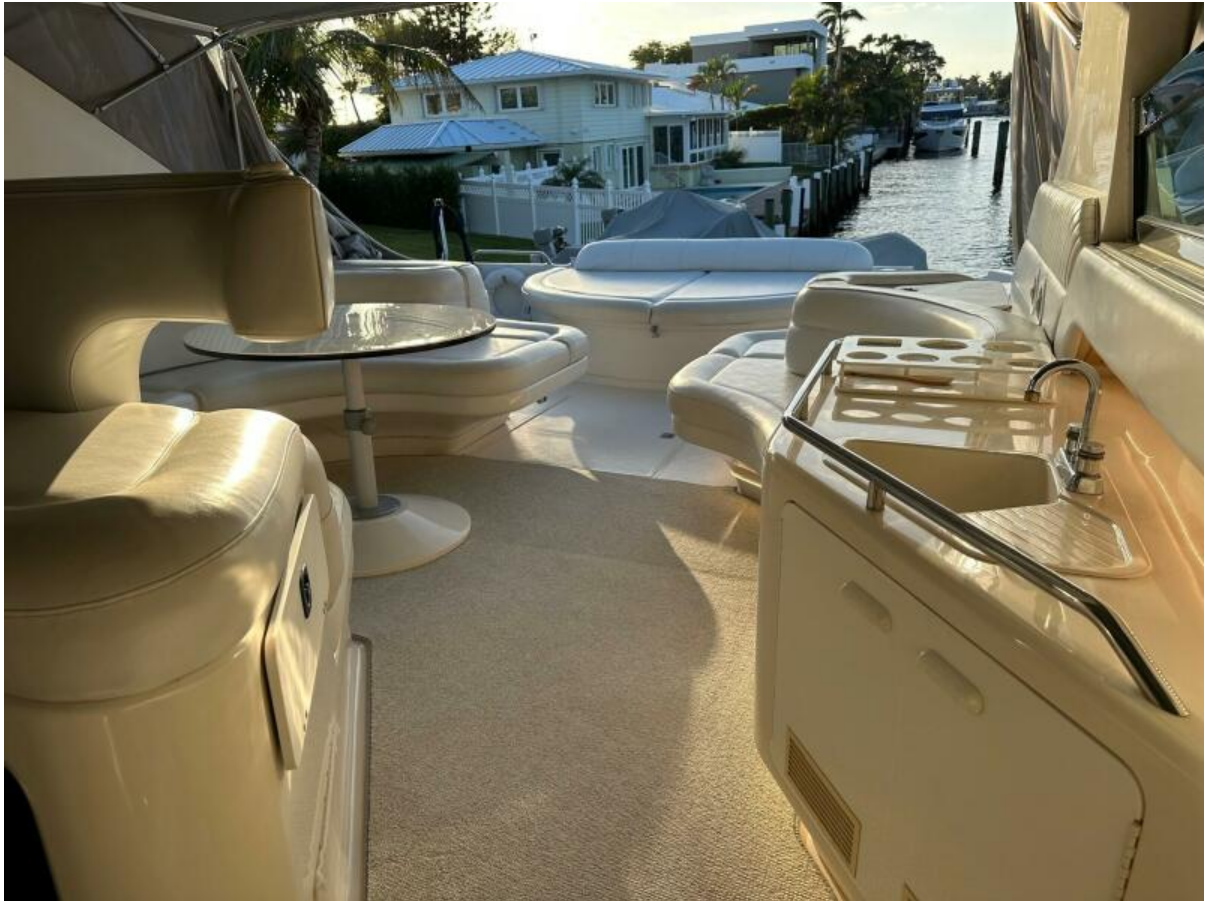
Looking Aft To Cockpit Deck