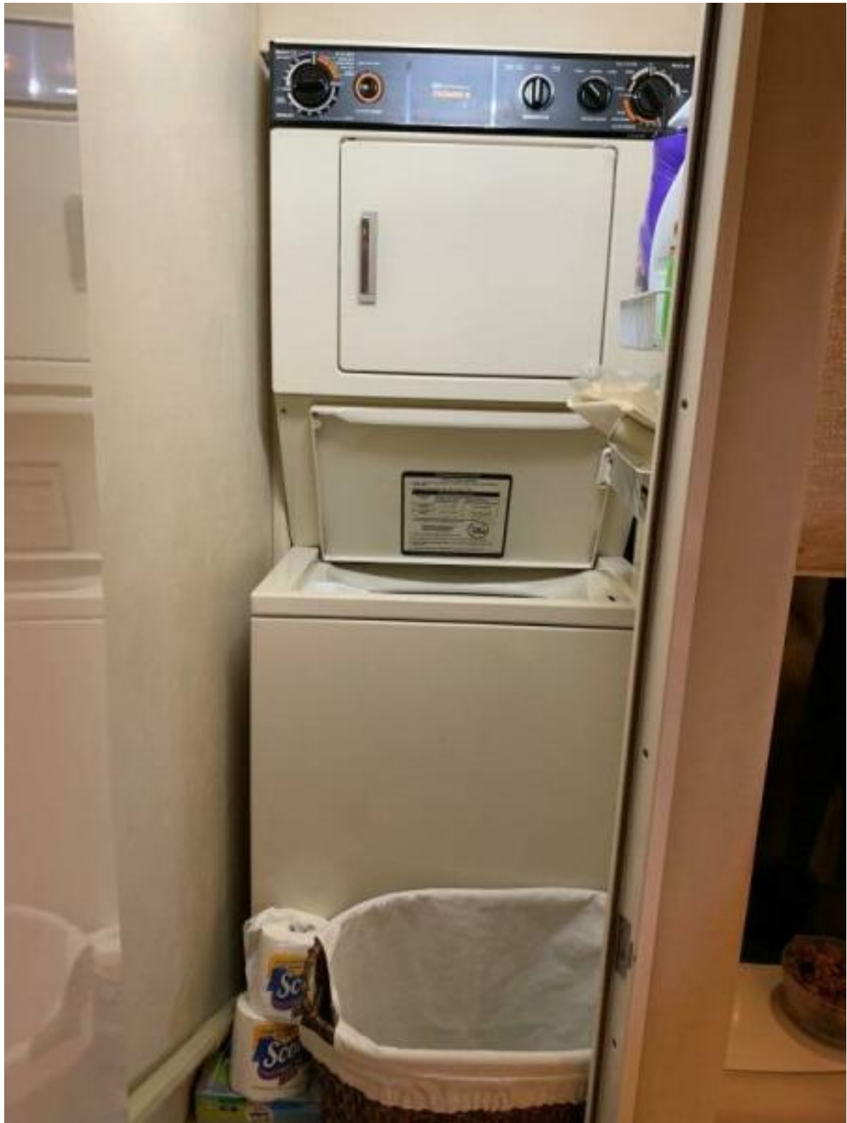
Mid Ship Laundry