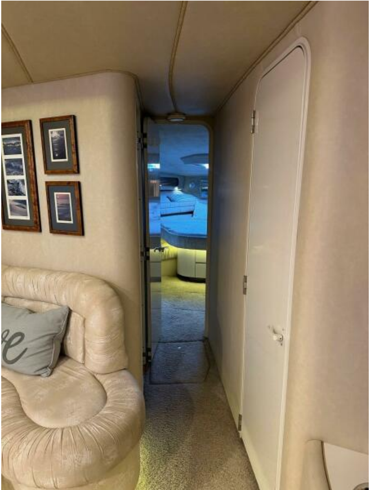
Companionway Fwd to VIP