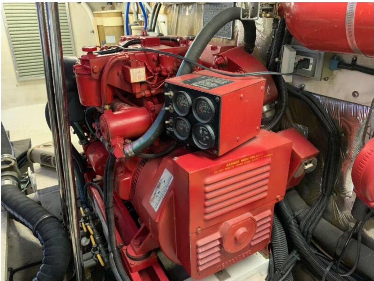
Main Gen Set Engine Room