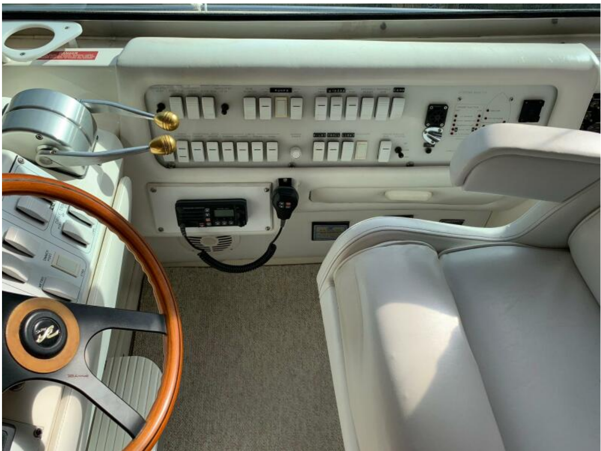
Control Panel starboard of Helm