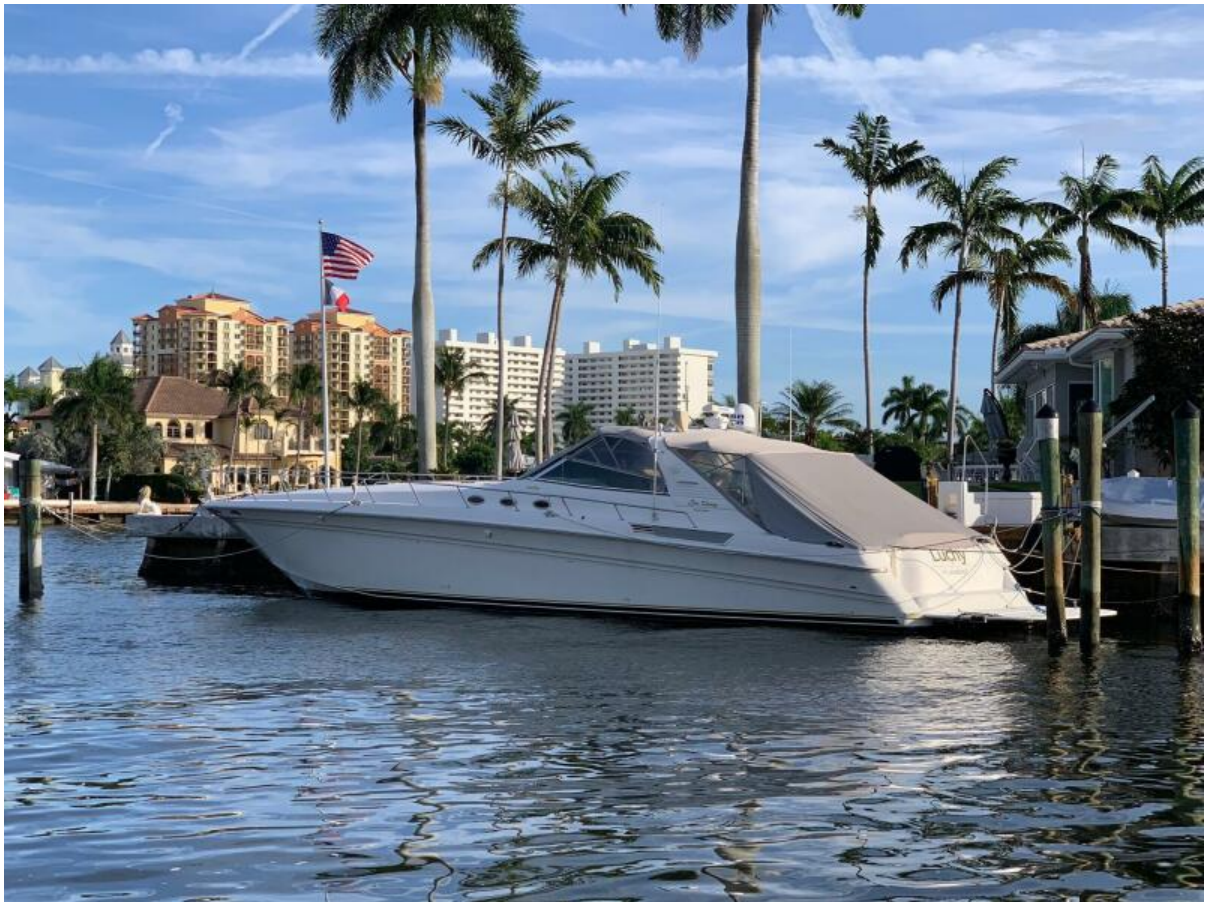
Port side profile