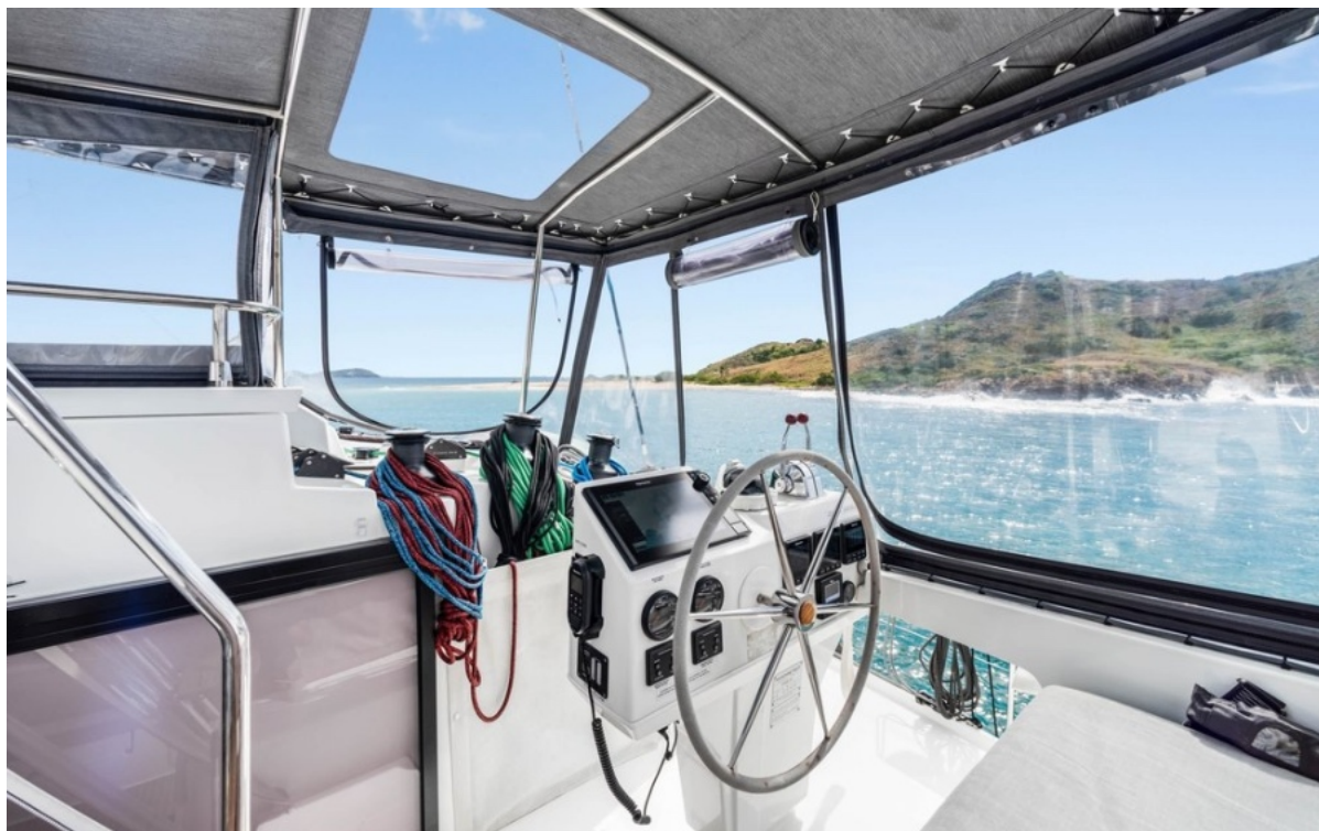
Used Sail Catamaran for sale 2021 FOUNTAINE PAJOT Saba 50 - SOURCE OF WANDER