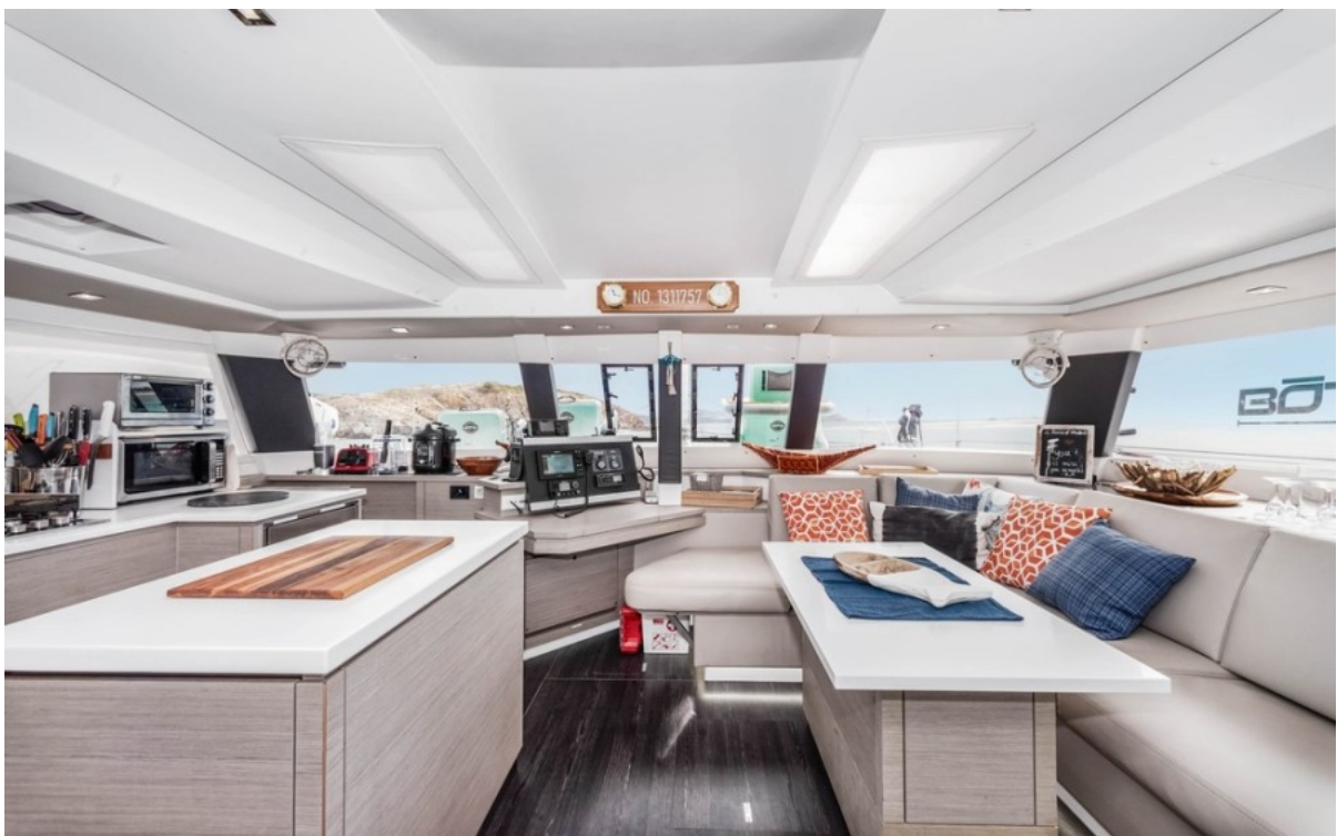
Used Sail Catamaran for sale 2021 FOUNTAINE PAJOT Saba 50 - SOURCE OF WANDER