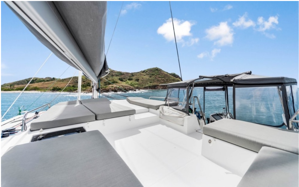
Used Sail Catamaran for sale 2021 FOUNTAINE PAJOT Saba 50 - SOURCE OF WANDER