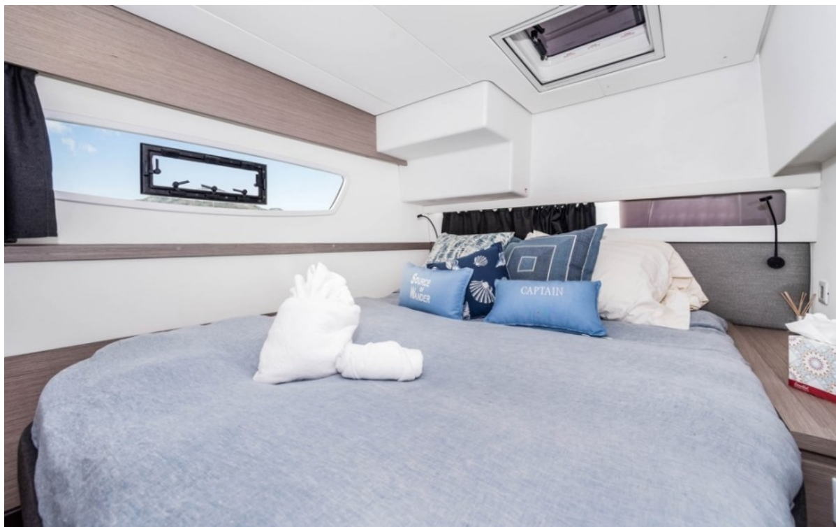
Used Sail Catamaran for sale 2021 FOUNTAINE PAJOT Saba 50 - SOURCE OF WANDER