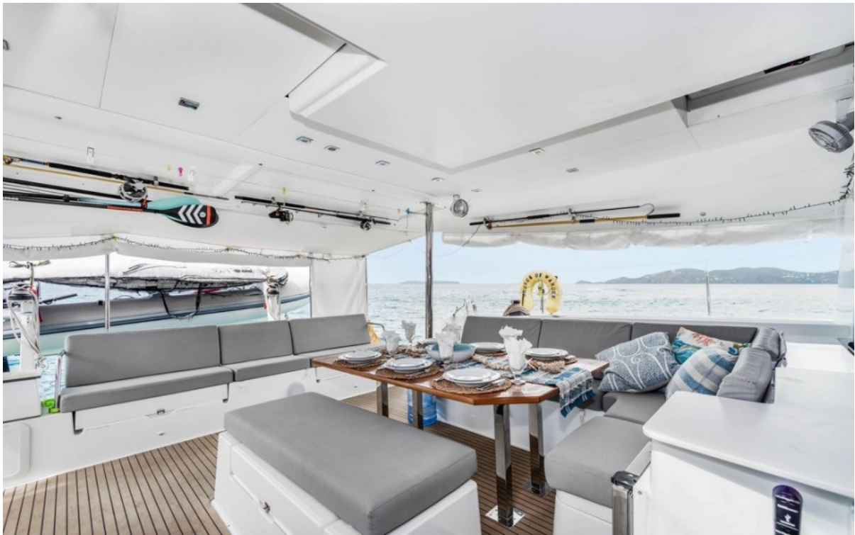
Used Sail Catamaran for sale 2021 FOUNTAINE PAJOT Saba 50 - SOURCE OF WANDER