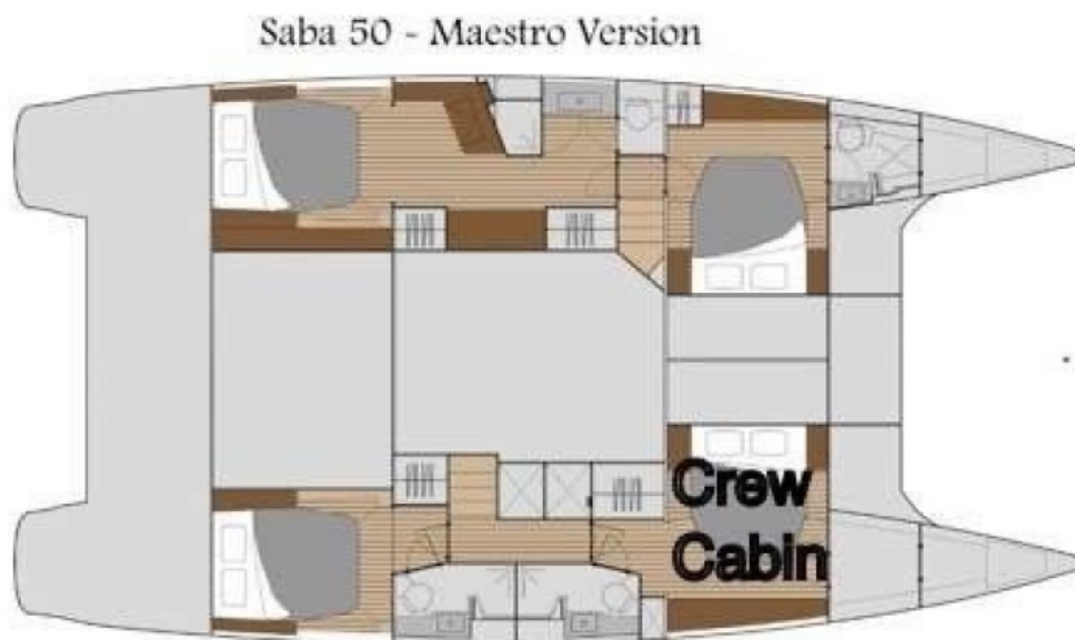
Used Sail Catamaran for sale 2021 FOUNTAINE PAJOT Saba 50 - SOURCE OF WANDER