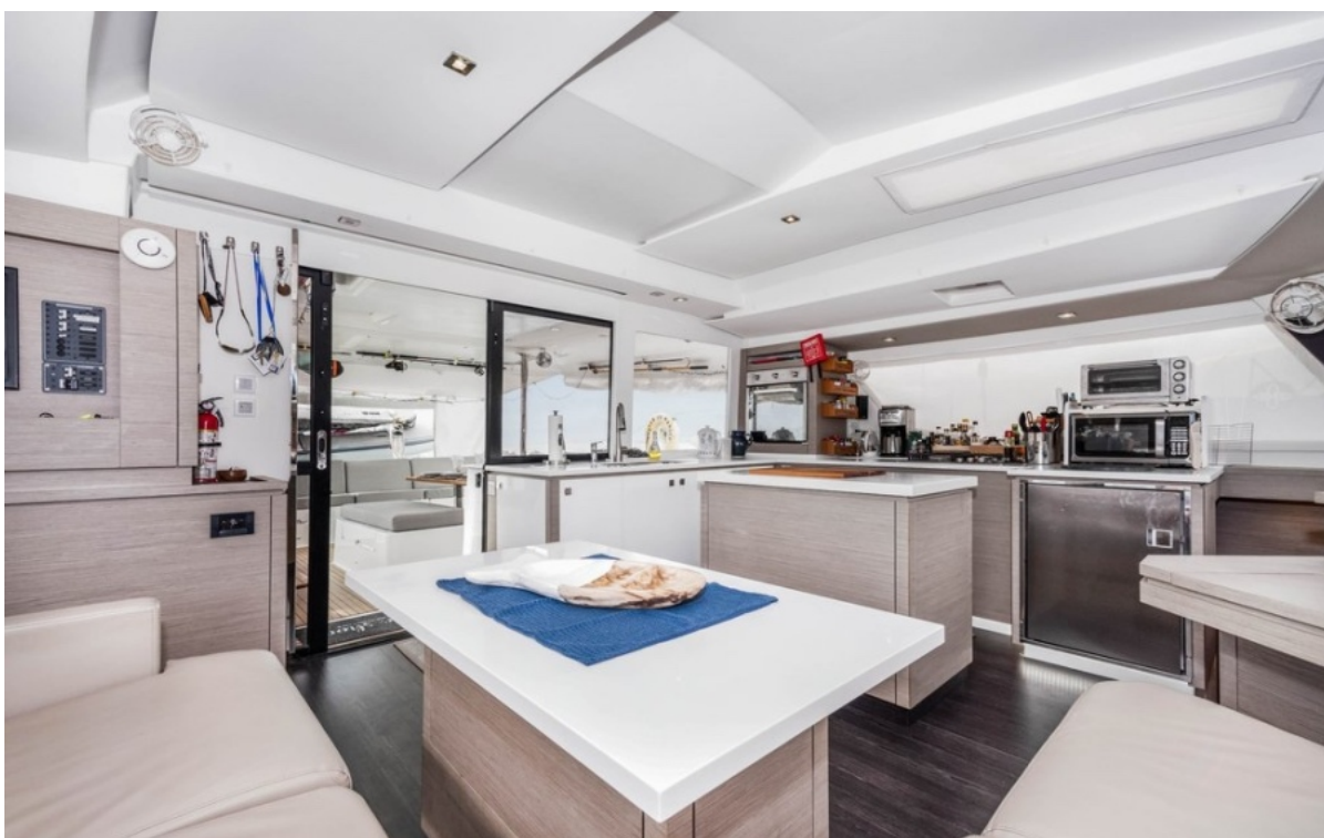
Used Sail Catamaran for sale 2021 FOUNTAINE PAJOT Saba 50 - SOURCE OF WANDER