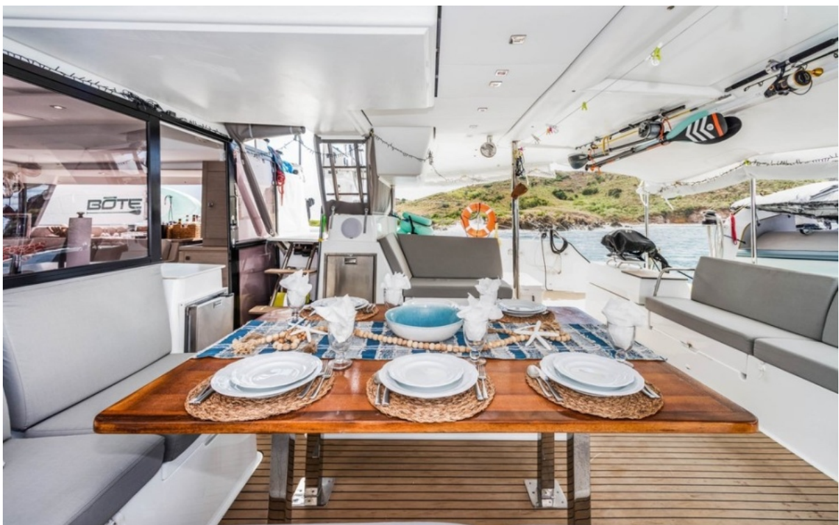
Used Sail Catamaran for sale 2021 FOUNTAINE PAJOT Saba 50 - SOURCE OF WANDER