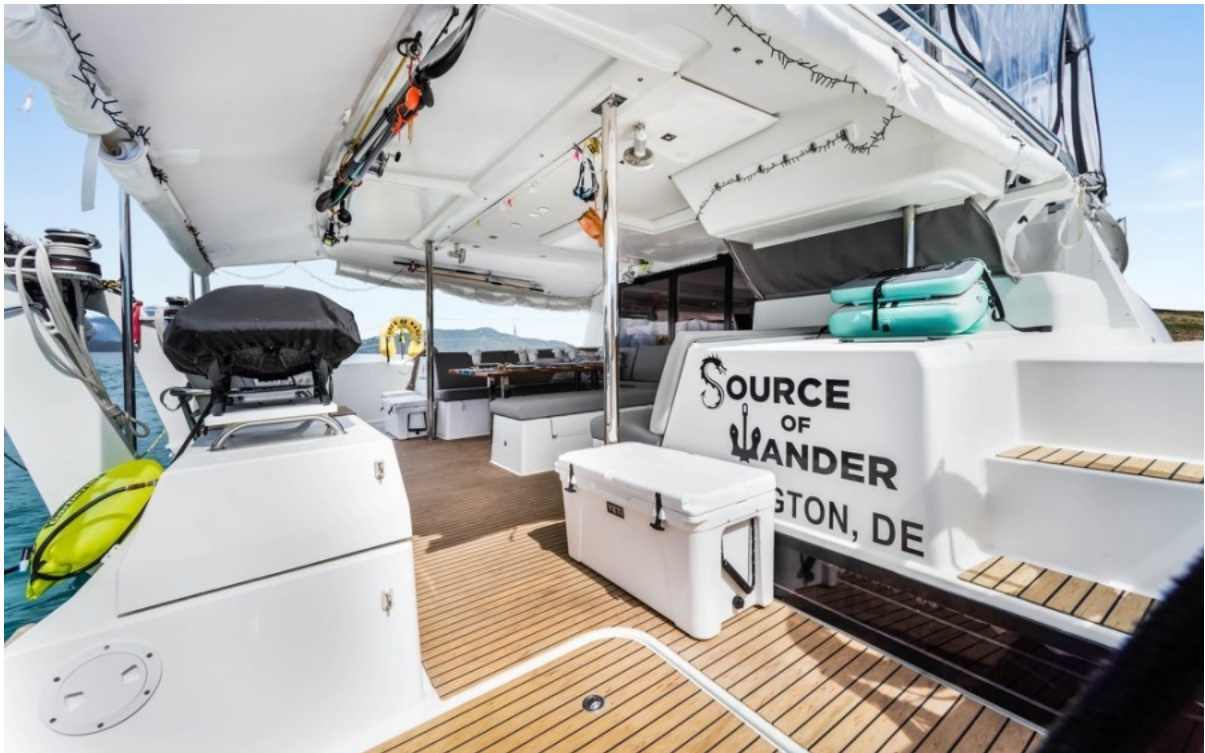
Used Sail Catamaran for sale 2021 FOUNTAINE PAJOT Saba 50 - SOURCE OF WANDER