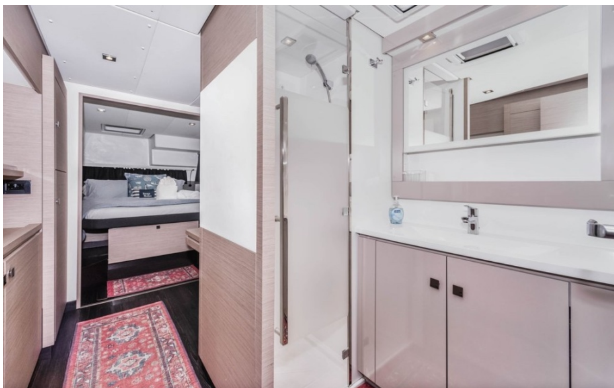
Used Sail Catamaran for sale 2021 FOUNTAINE PAJOT Saba 50 - SOURCE OF WANDER