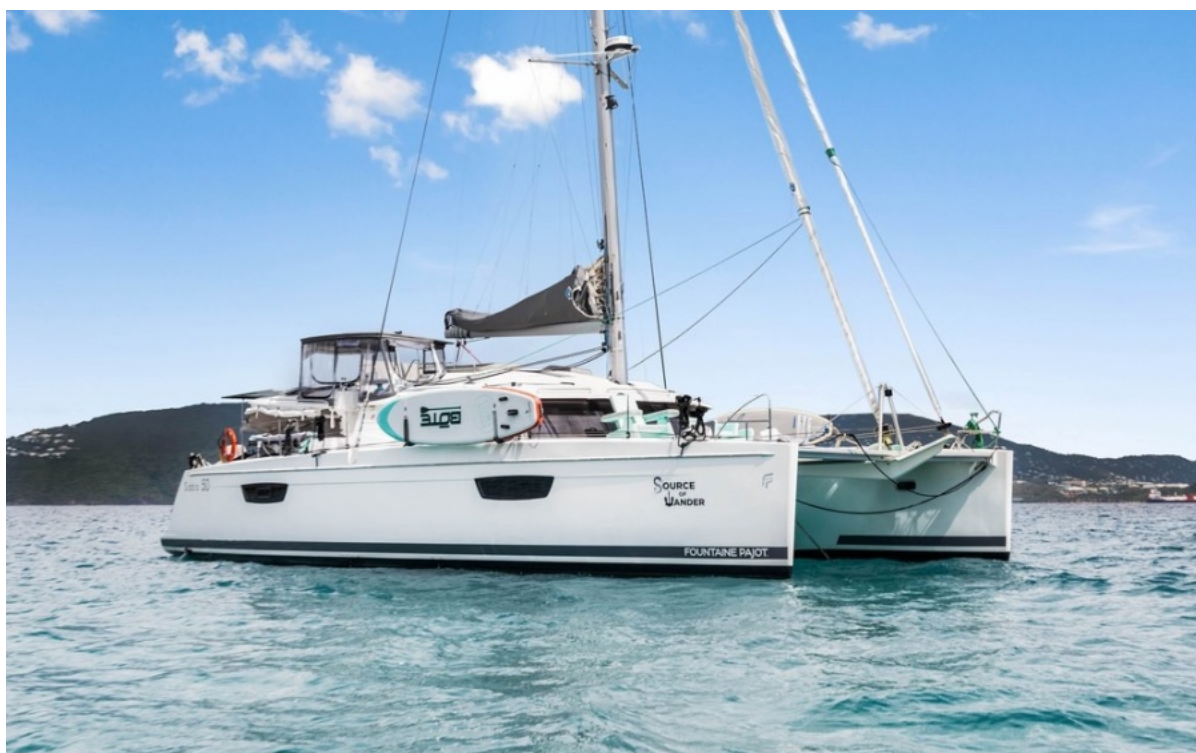
Used Sail Catamaran for sale 2021 FOUNTAINE PAJOT Saba 50 - SOURCE OF WANDER