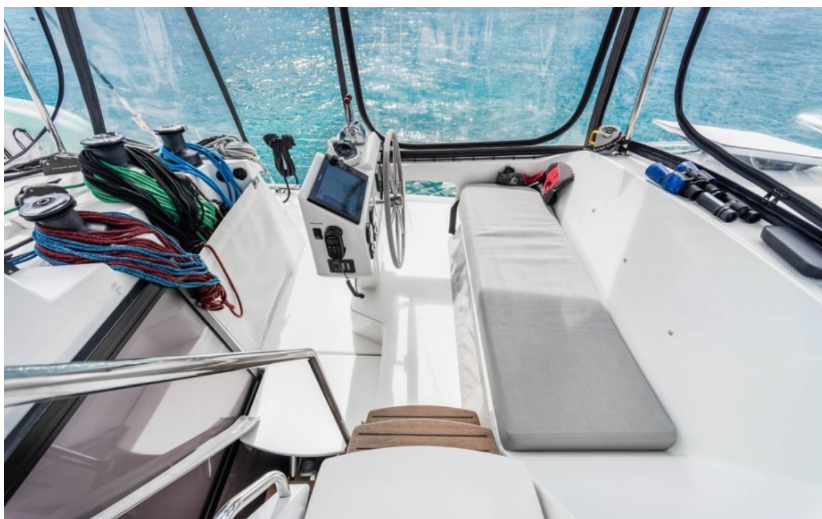
Used Sail Catamaran for sale 2021 FOUNTAINE PAJOT Saba 50 - SOURCE OF WANDER