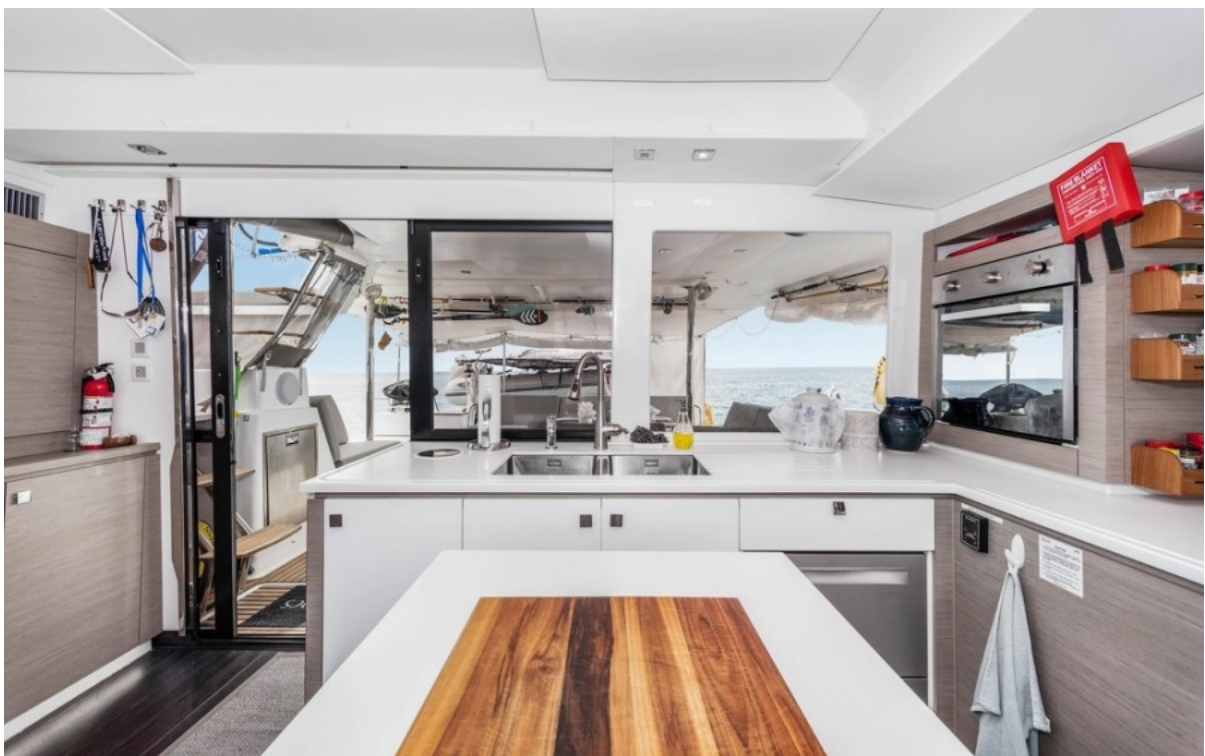
Used Sail Catamaran for sale 2021 FOUNTAINE PAJOT Saba 50 - SOURCE OF WANDER