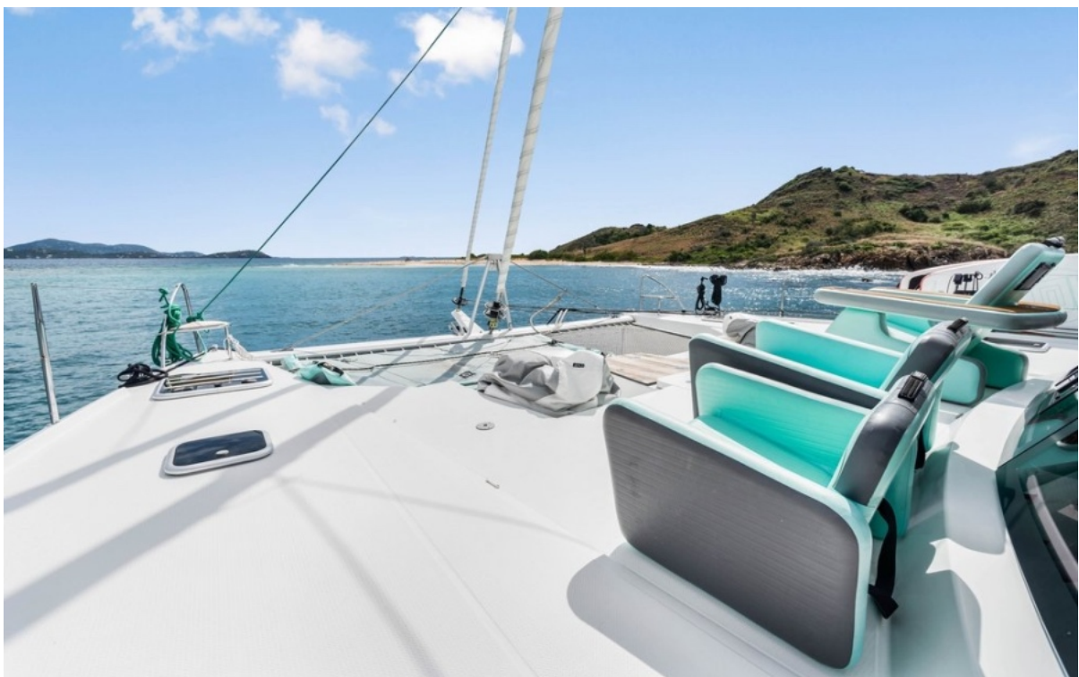
Used Sail Catamaran for sale 2021 FOUNTAINE PAJOT Saba 50 - SOURCE OF WANDER