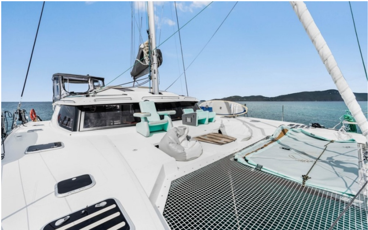
Used Sail Catamaran for sale 2021 FOUNTAINE PAJOT Saba 50 - SOURCE OF WANDER