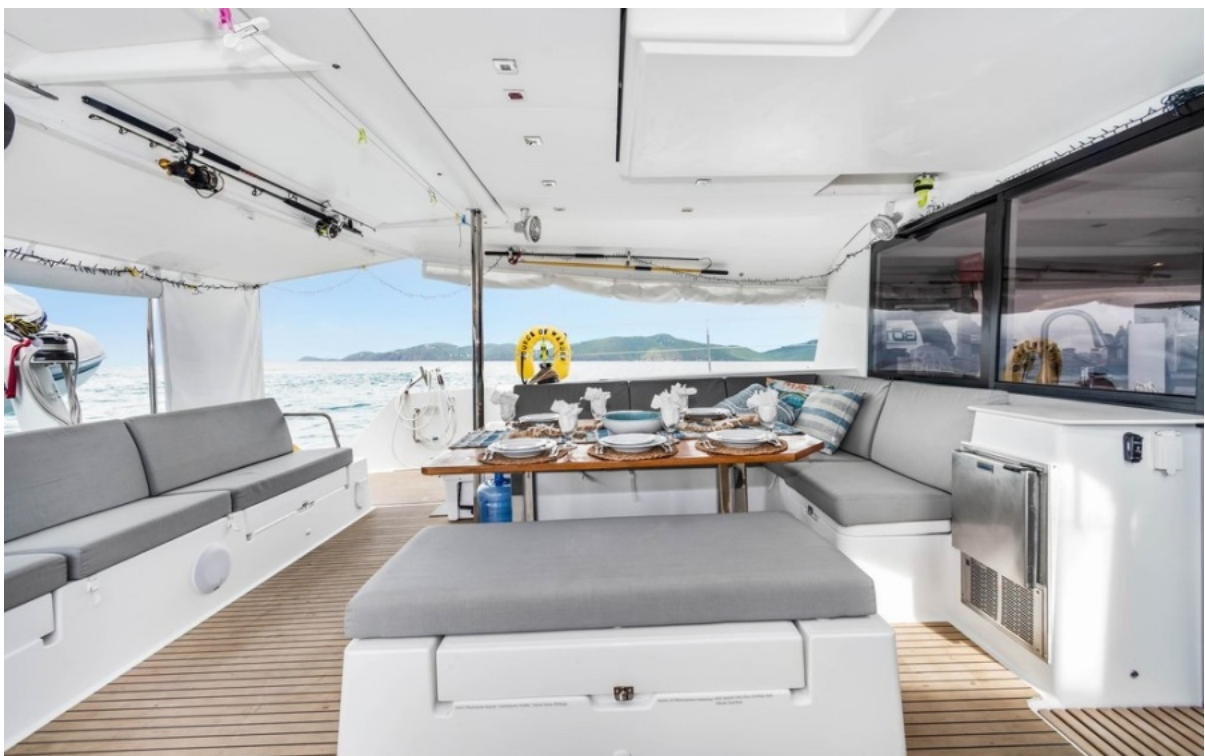
Used Sail Catamaran for sale 2021 FOUNTAINE PAJOT Saba 50 - SOURCE OF WANDER