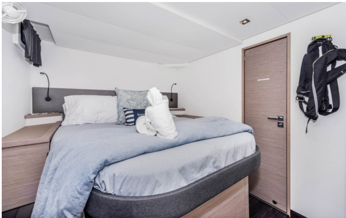
Used Sail Catamaran for sale 2021 FOUNTAINE PAJOT Saba 50 - SOURCE OF WANDER