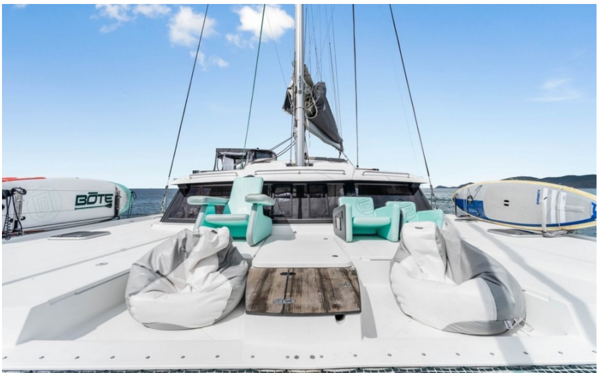
Used Sail Catamaran for sale 2021 FOUNTAINE PAJOT Saba 50 - SOURCE OF WANDER