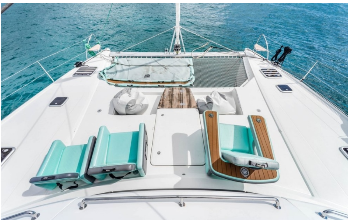
Used Sail Catamaran for sale 2021 FOUNTAINE PAJOT Saba 50 - SOURCE OF WANDER