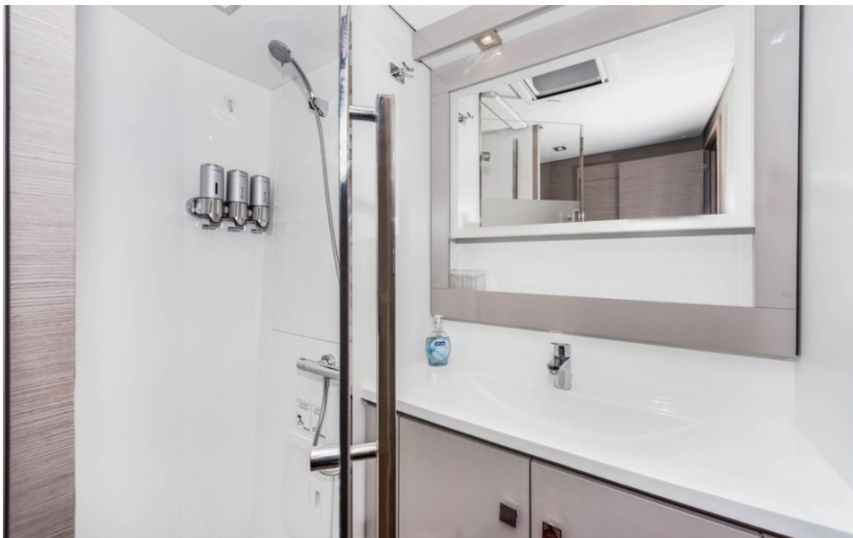
Used Sail Catamaran for sale 2021 FOUNTAINE PAJOT Saba 50 - SOURCE OF WANDER