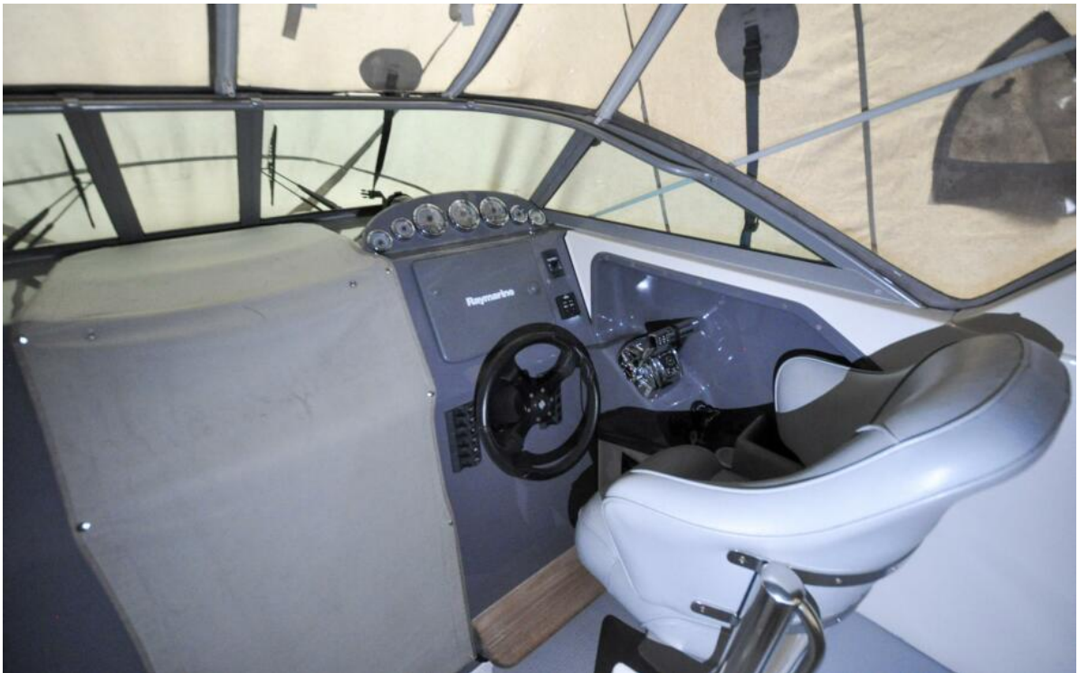
Protector 28 Targa Wikipi Offered For Sale35