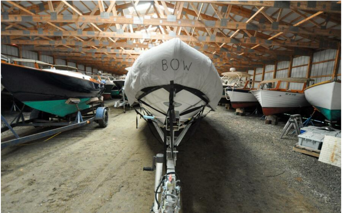
Protector 28 Targa Wiwiki Offered For Sale06