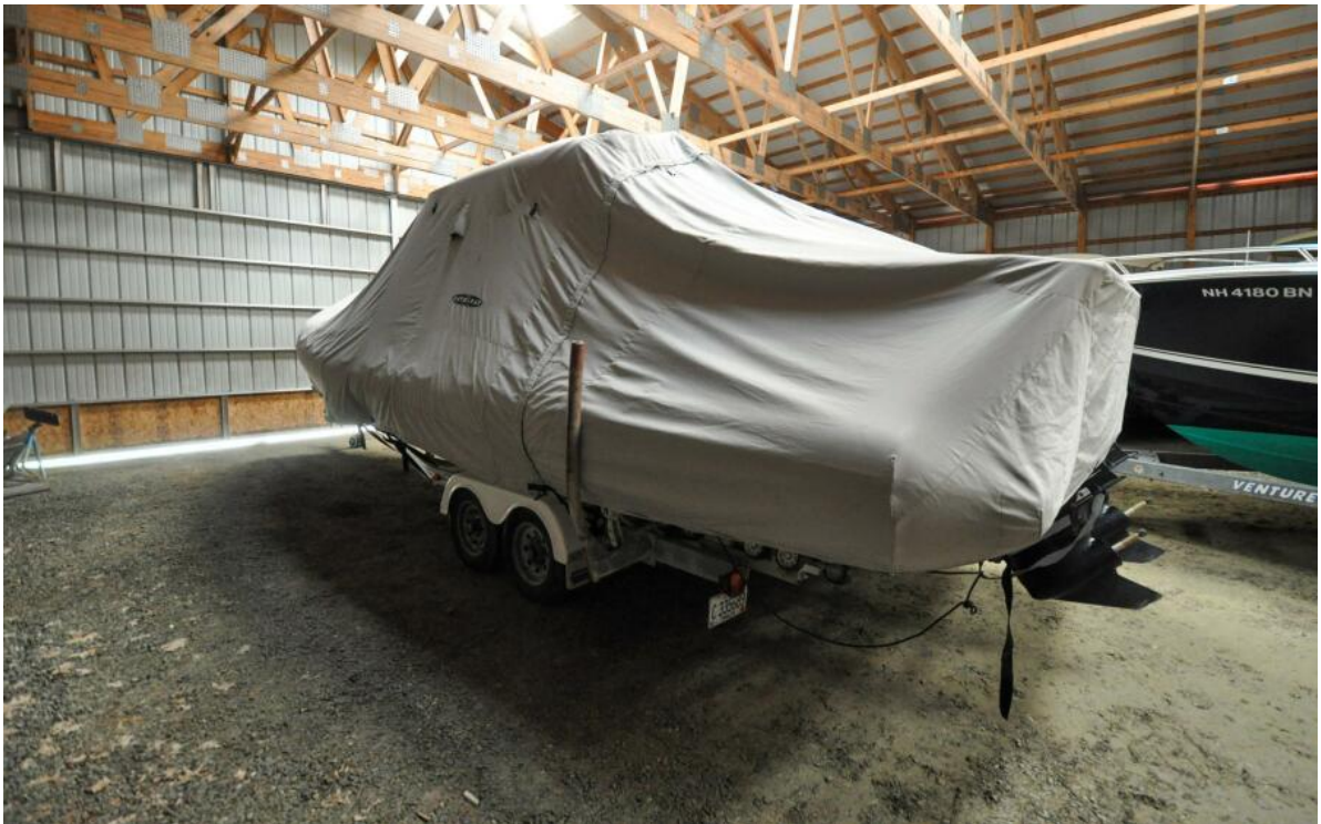
Protector 28 Targa Wiwiki Offered For Sale08