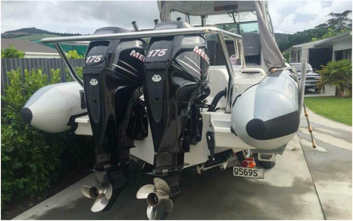
Protector 28 Targa Wikipi Offered For Sale 47 13 3