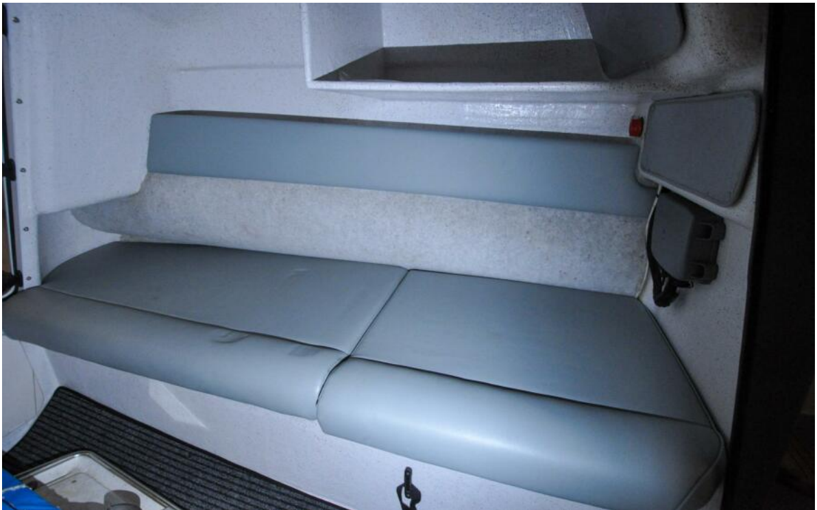
Protector 28 Targa Wiwiki Offered For Sale28