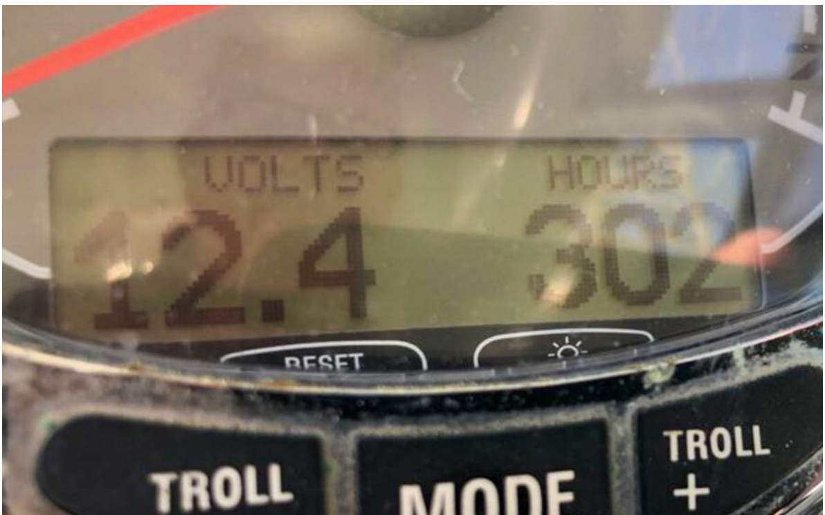
Protector 28 Targa Wiwiki Offered For Sale 50 33 2