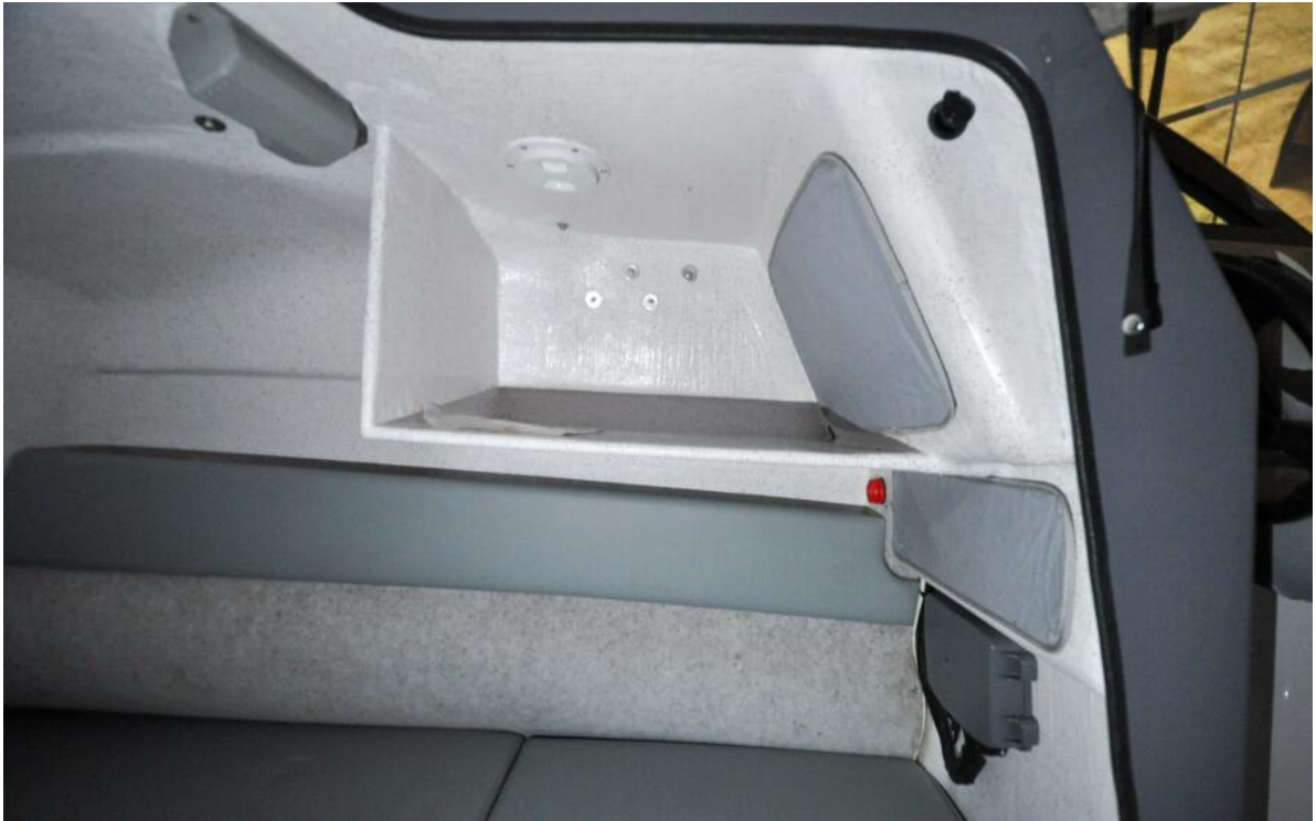
Protector 28 Targa Wiwiki Offered For Sale30