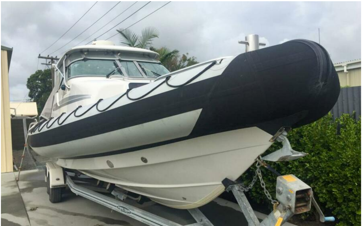
Protector 28 Targa Wiwiki Offered For Sale 47 13