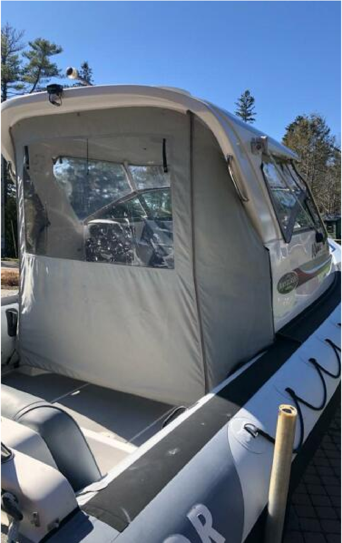
Protector 28 Targa Wiwiki Offered For Sale 47 13 13