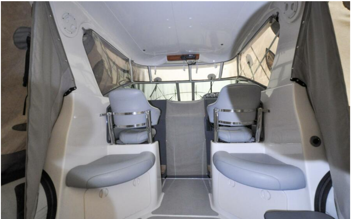
Protector 28 Targa Wiwiki Offered For Sale33