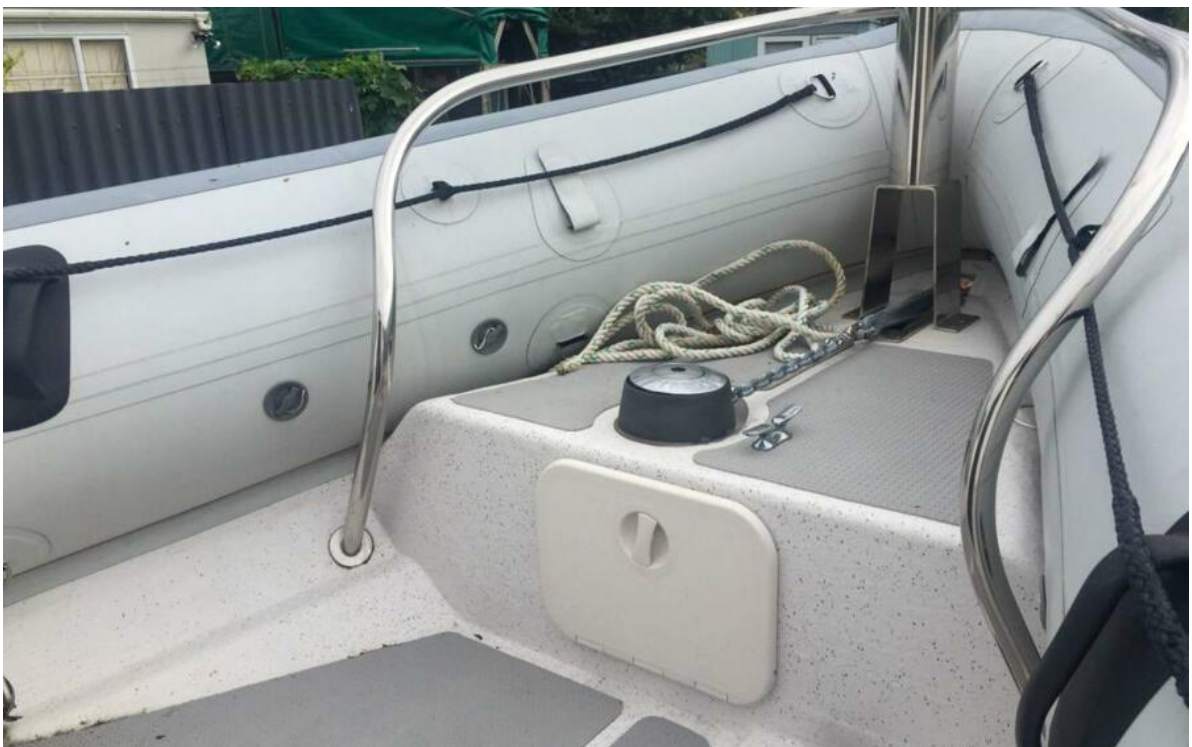
Protector 28 Targa Wikipi Offered For Sale 47 13 5