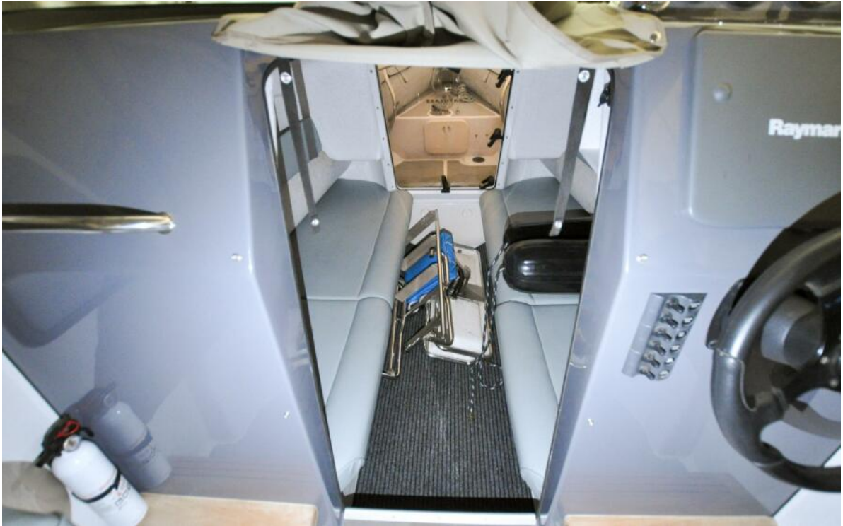
Protector 28 Targa Wiwiki Offered For Sale27