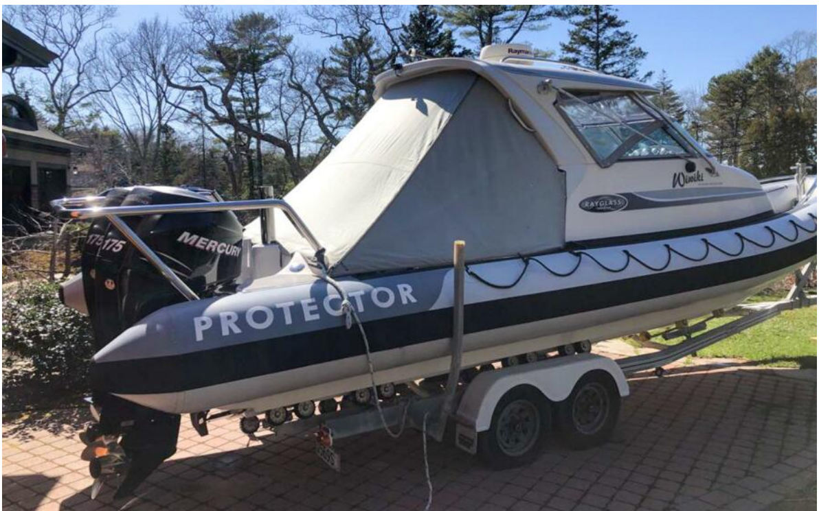
Protector 28 Targa Wiwiki Offered For Sale 47 13 12