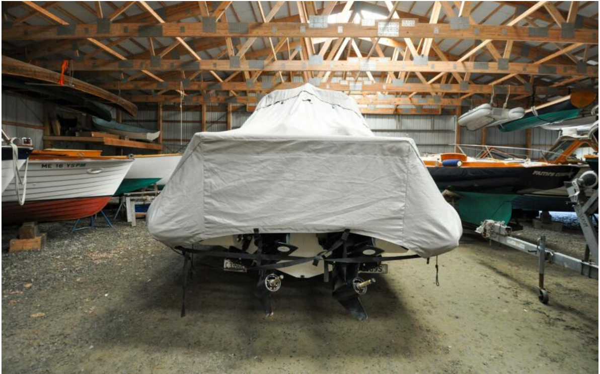
Protector 28 Targa Wiwiki Offered For Sale09