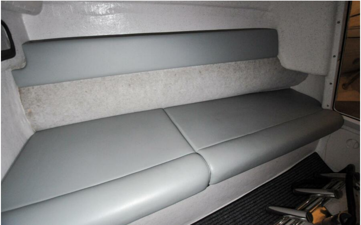
Protector 28 Targa Wiwiki Offered For Sale31