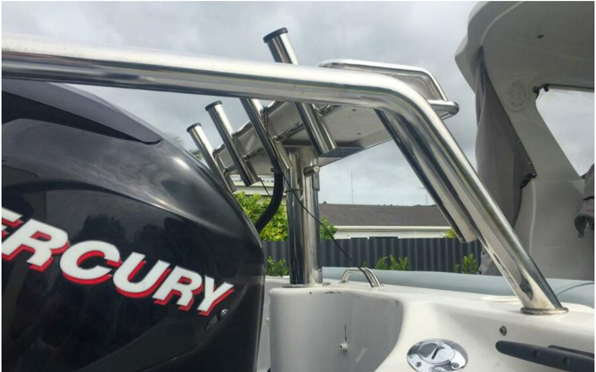
Protector 28 Targa Wiwiki Offered For Sale 47 13 4