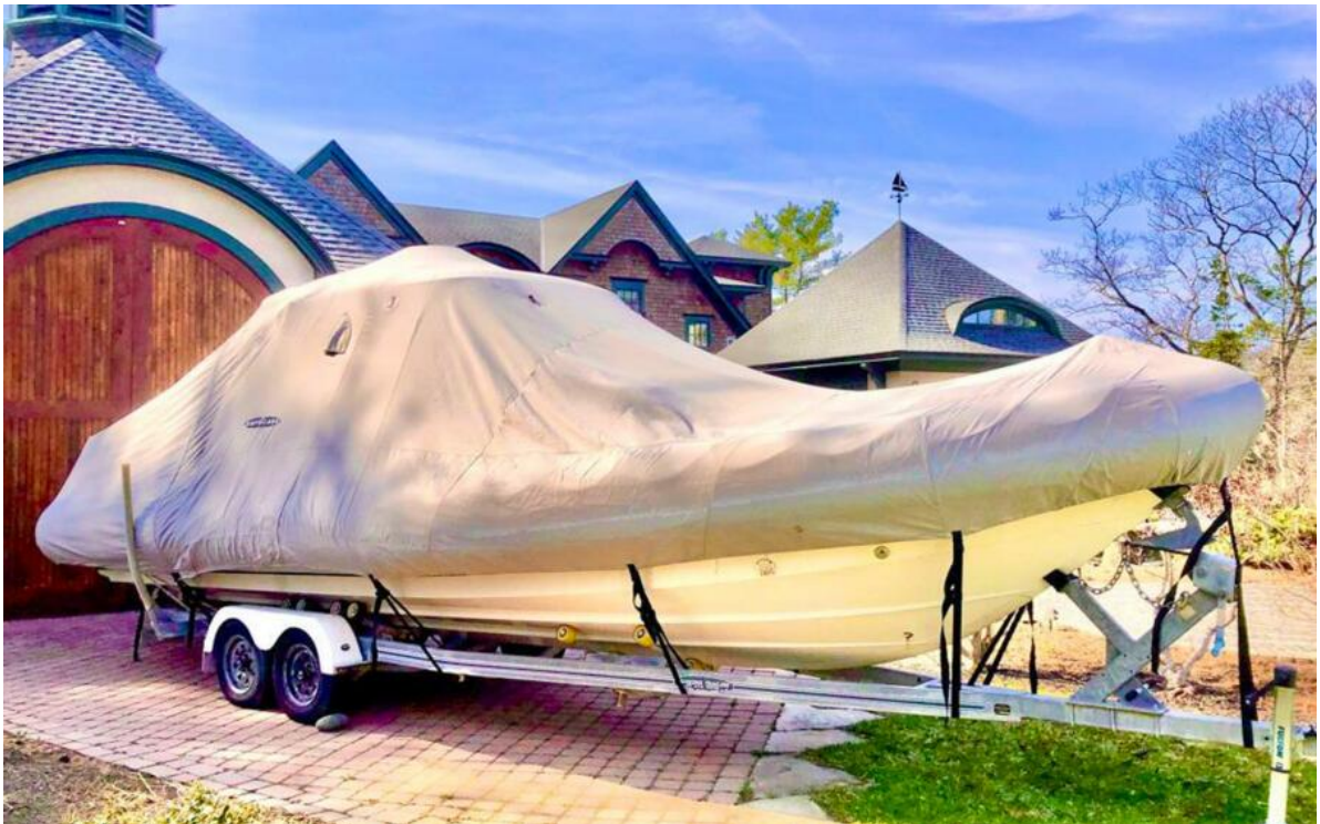
Protector 28 Targa Wiwiki Offered For Sale 50 33