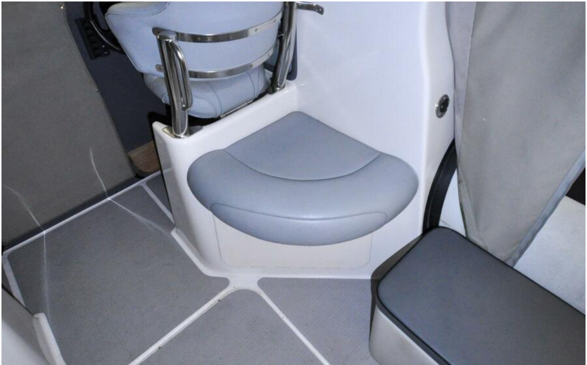
Protector 28 Targa Wiwiki Offered For Sale38