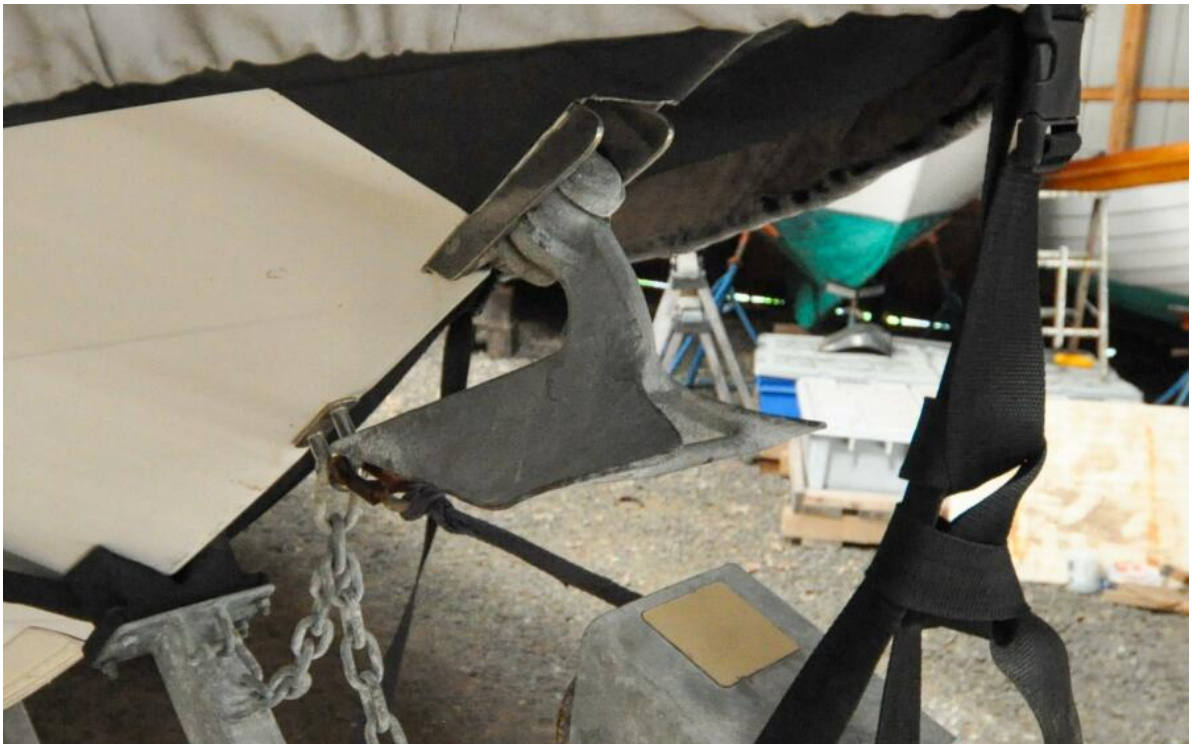
Protector 28 Targa Wikipi Offered For Sale44