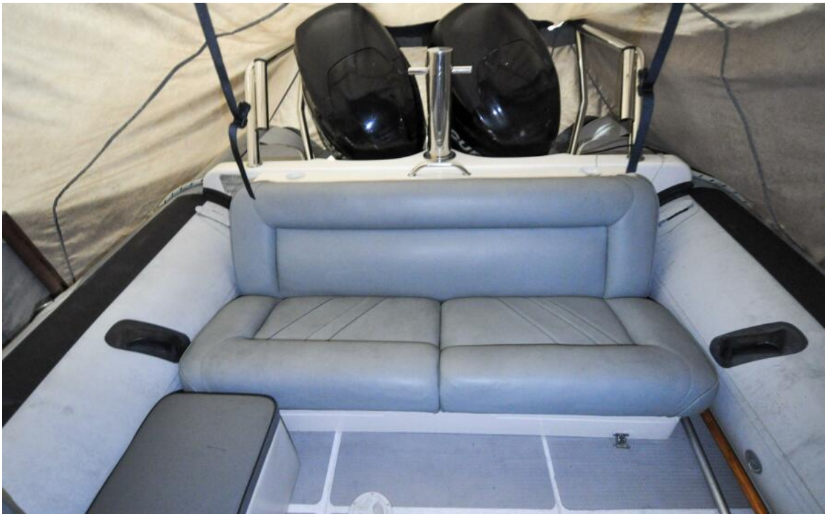
Protector 28 Targa Wiwiki Offered For Sale41