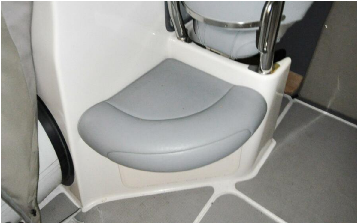
Protector 28 Targa Wiwiki Offered For Sale37