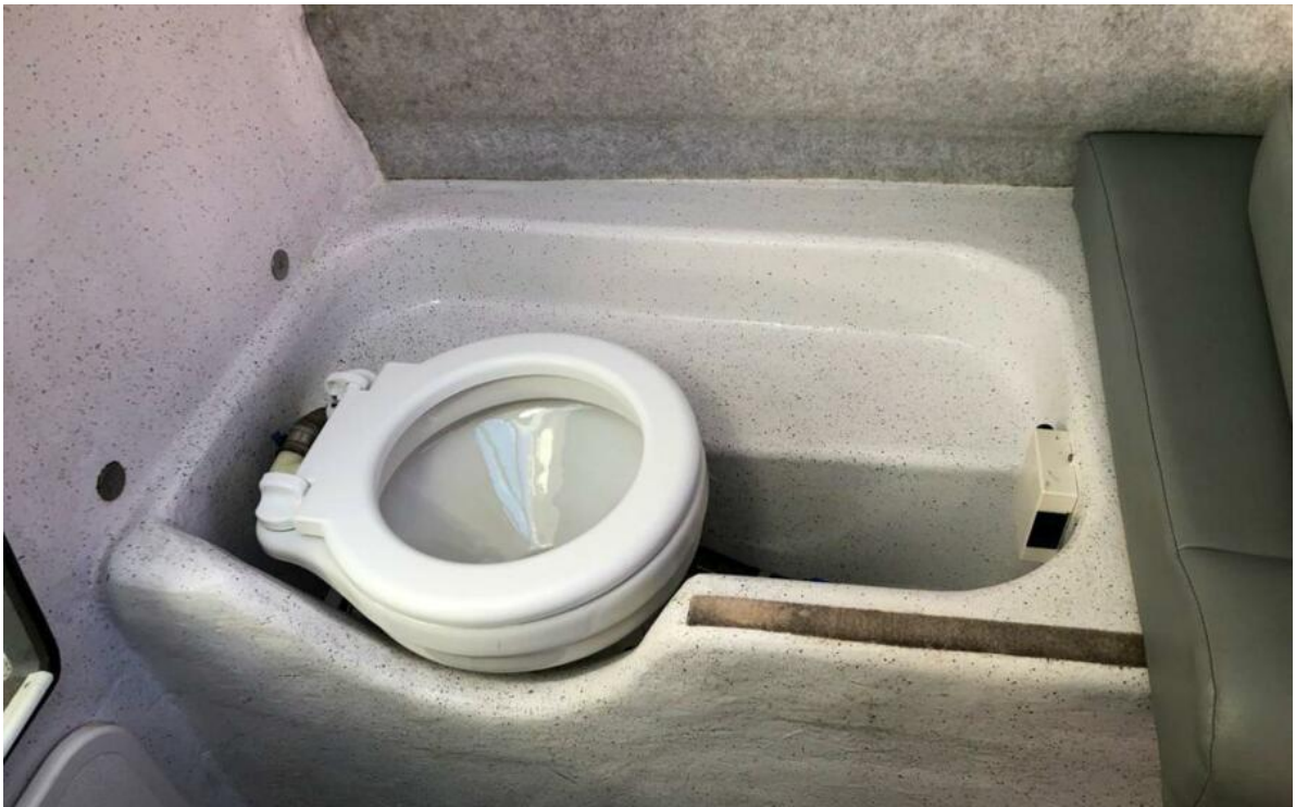
Protector 28 Targa Wiwiki Offered For Sale 47 13 19