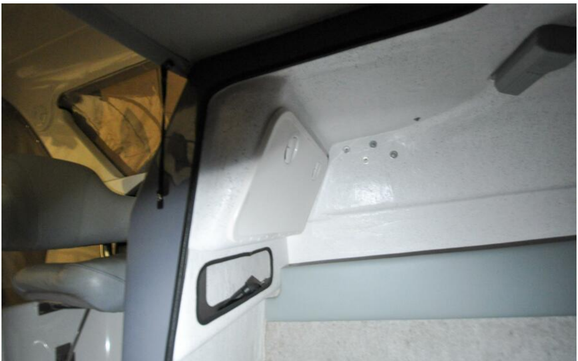
Protector 28 Targa Wiwiki Offered For Sale32