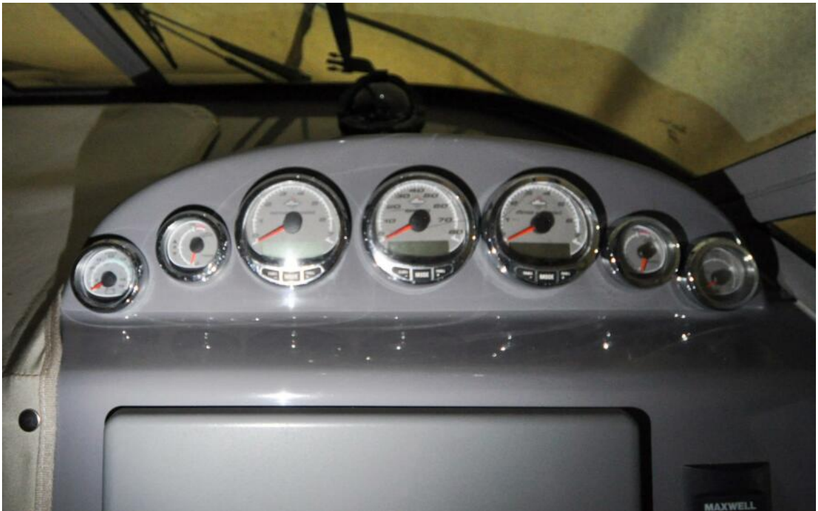
Protector 28 Targa Wiwiki Offered For Sale20