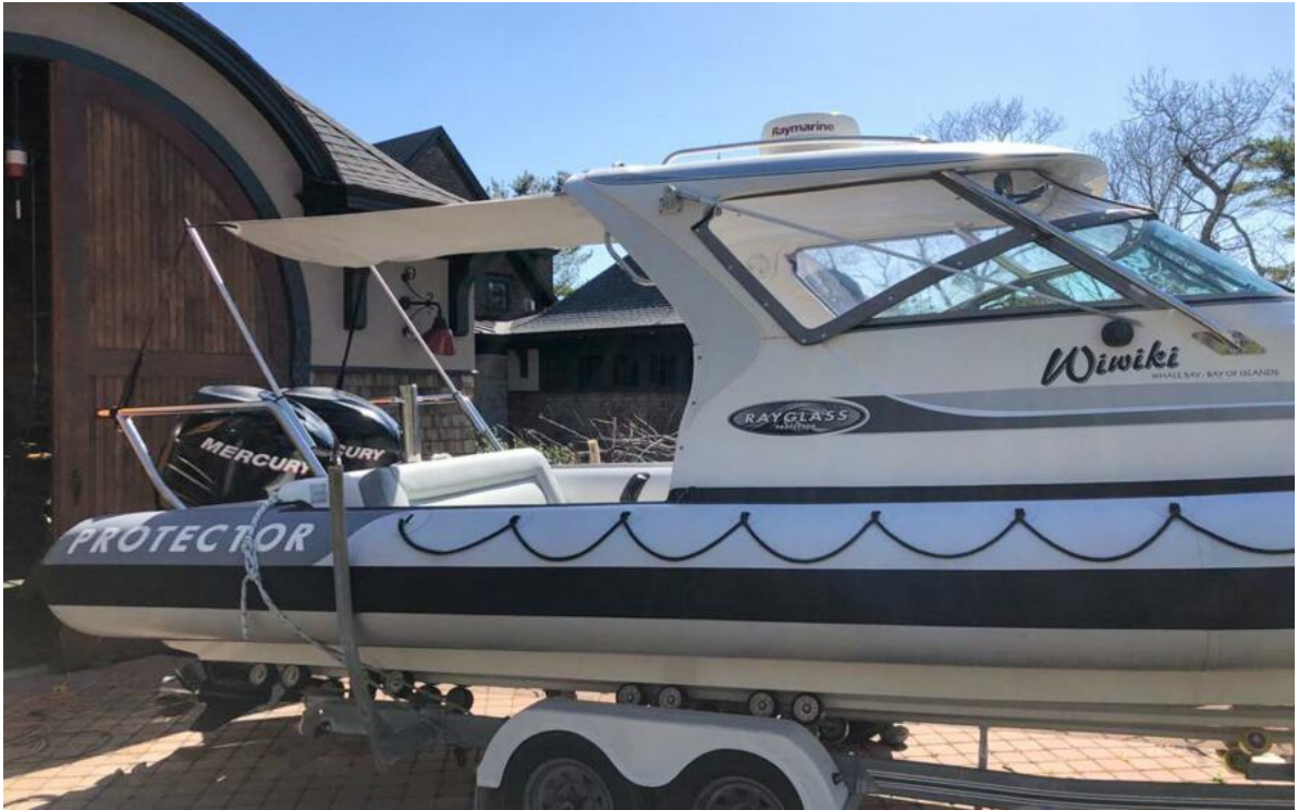
Protector 28 Targa Wiwiki Offered For Sale 47 13 10