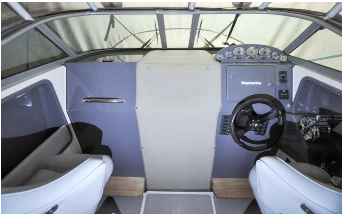
Protector 28 Targa Wikipi Offered For Sale26