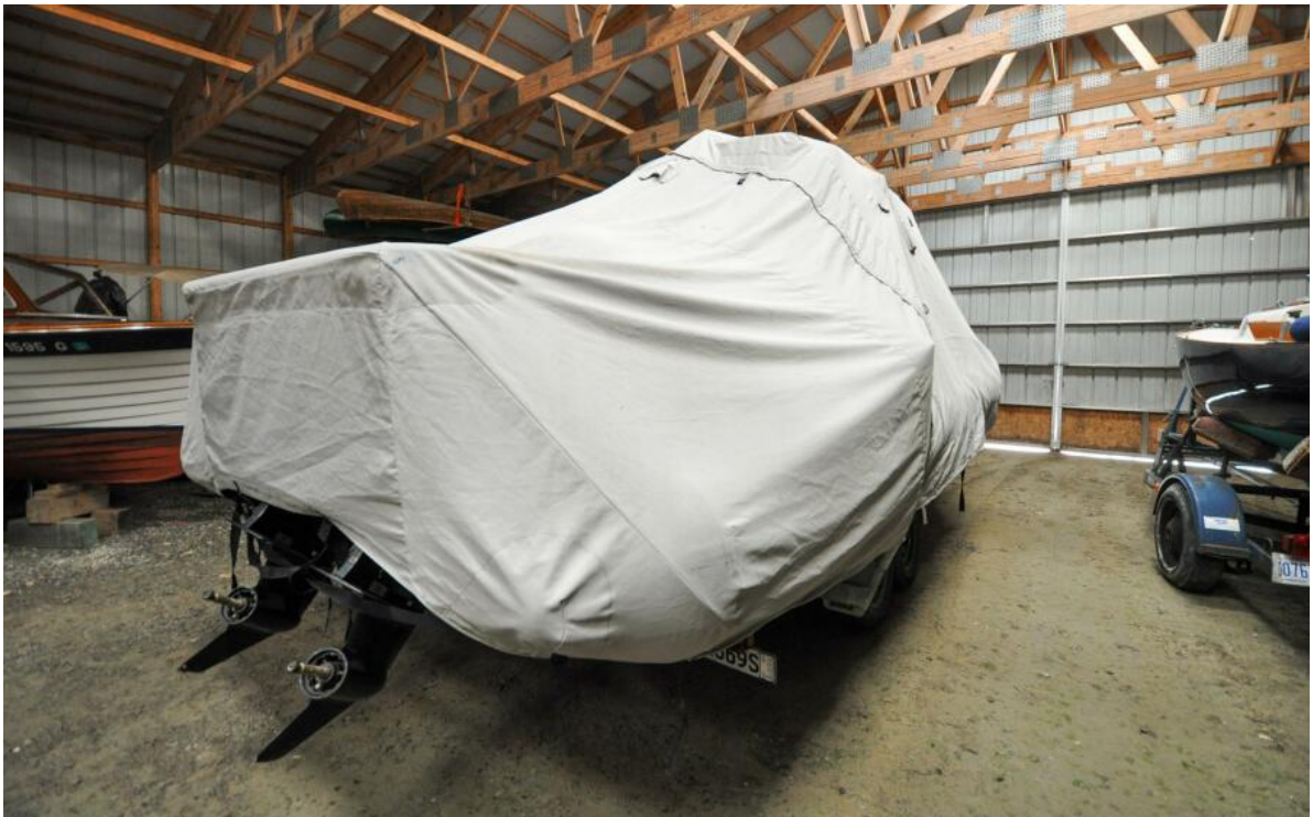
Protector 28 Targa Wiwiki Offered For Sale10