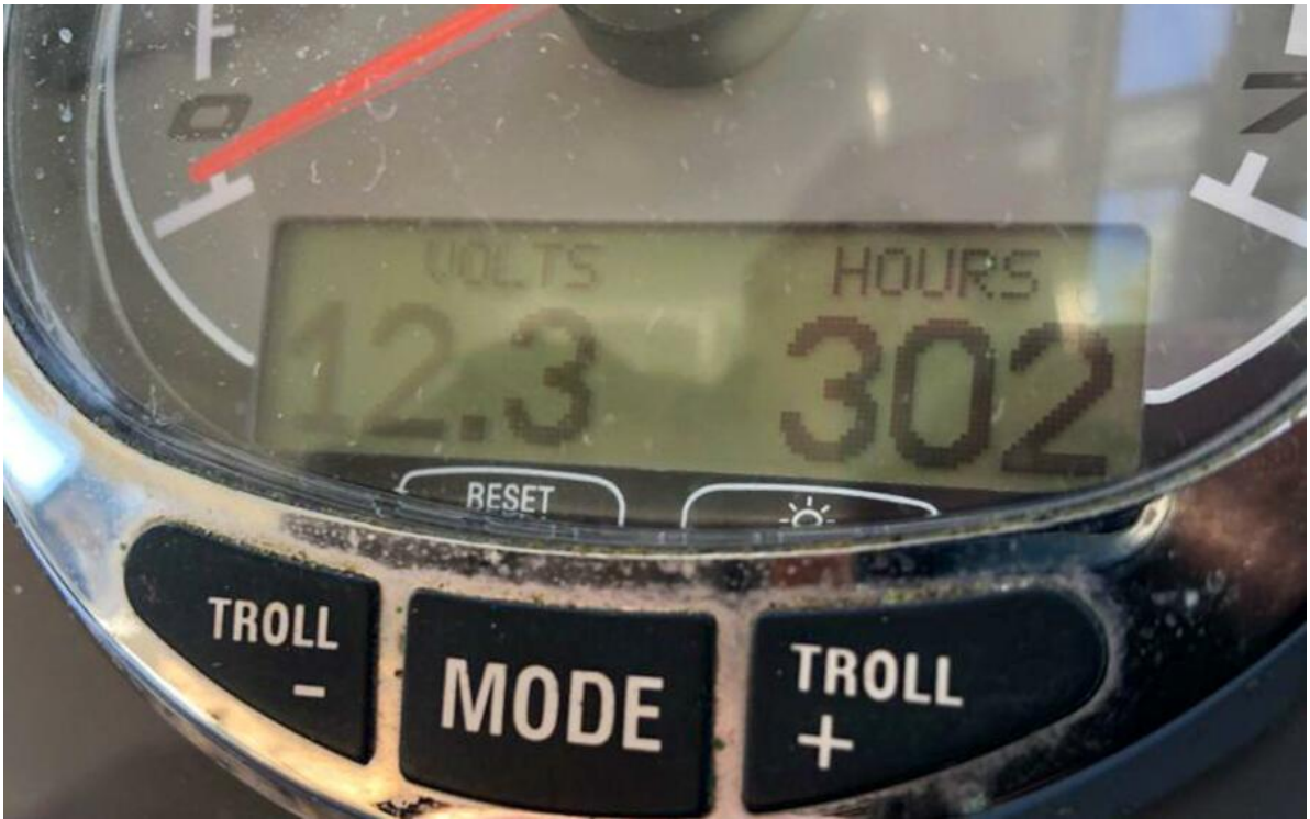
Protector 28 Targa Wiwiki Offered For Sale 50 33 3