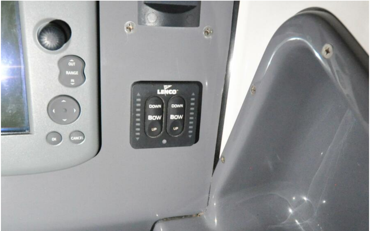
Protector 28 Targa Wiwiki Offered For Sale24