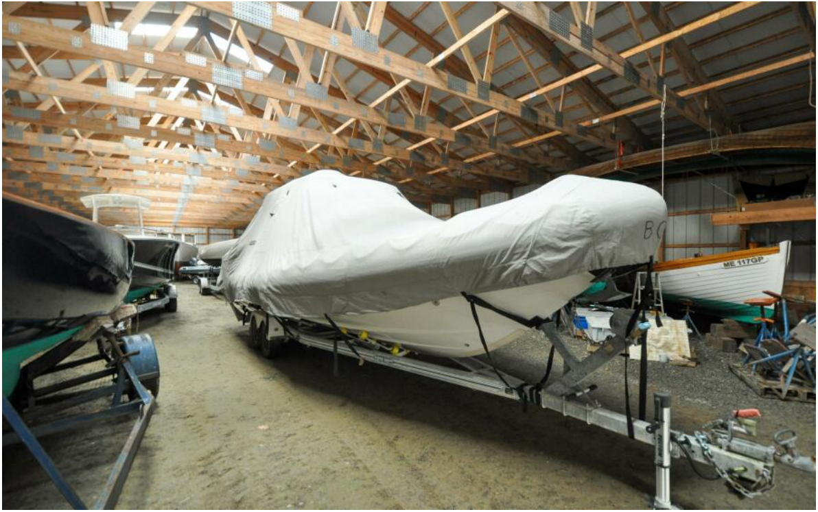
Protector 28 Targa Wikipi Offered For Sale05