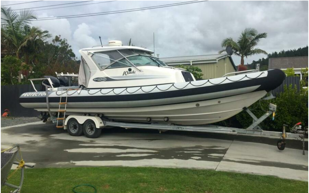
Protector 28 Targa Wiwiki Offered For Sale 47 13 2