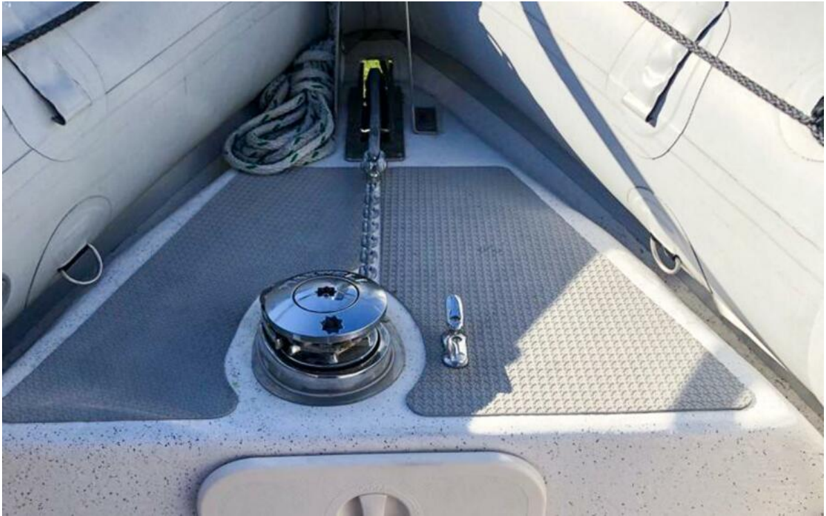
Protector 28 Targa Wiwiki Offered For Sale 47 13 16