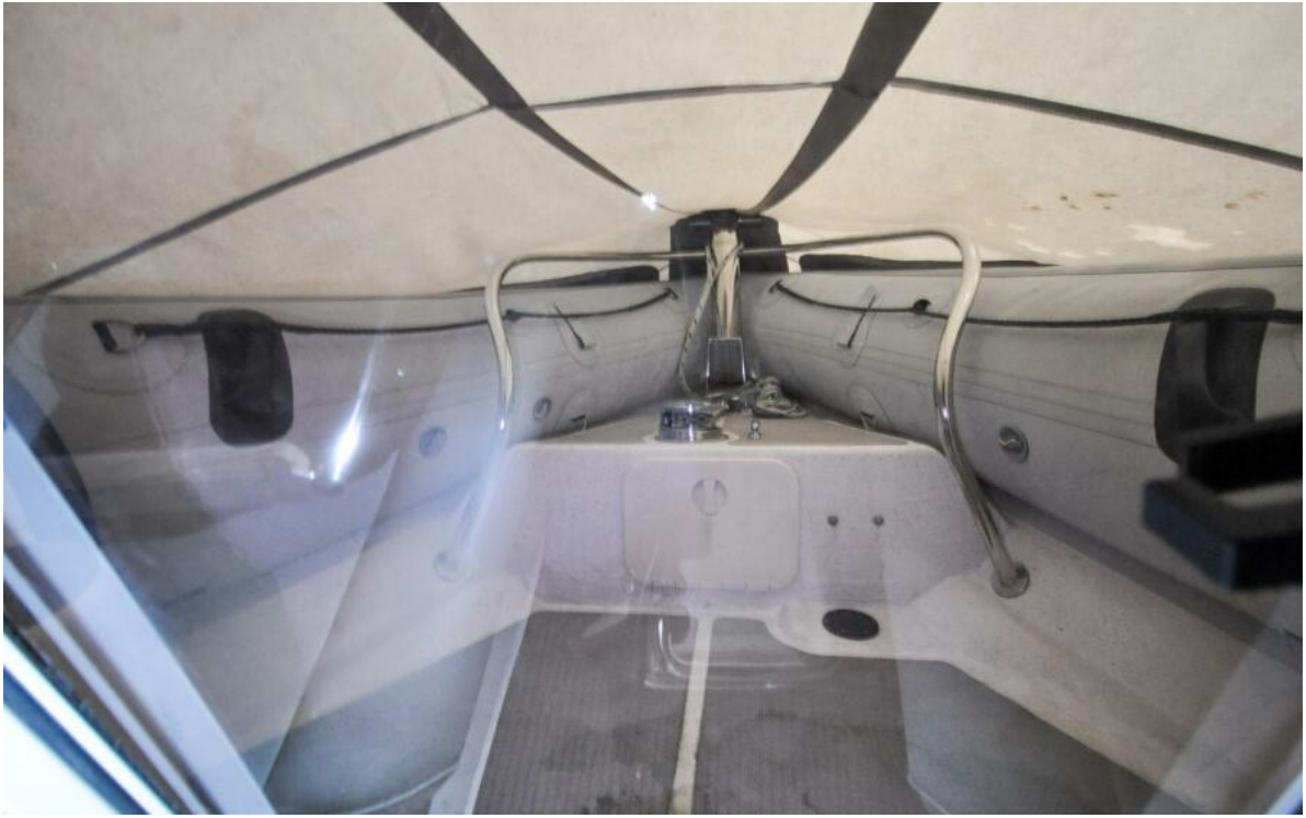
Protector 28 Targa Wikipi Offered For Sale 29