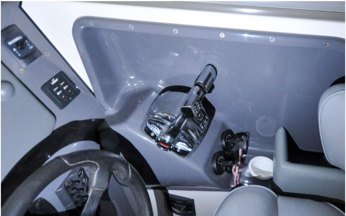
Protector 28 Targa Wiwiki Offered For Sale19