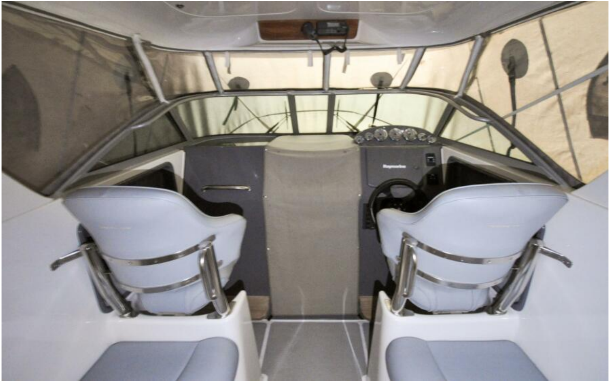
Protector 28 Targa Wikipi Offered For Sale42