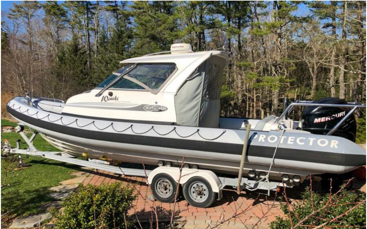
Protector 28 Targa Wikipi Offered For Sale 47 13 14