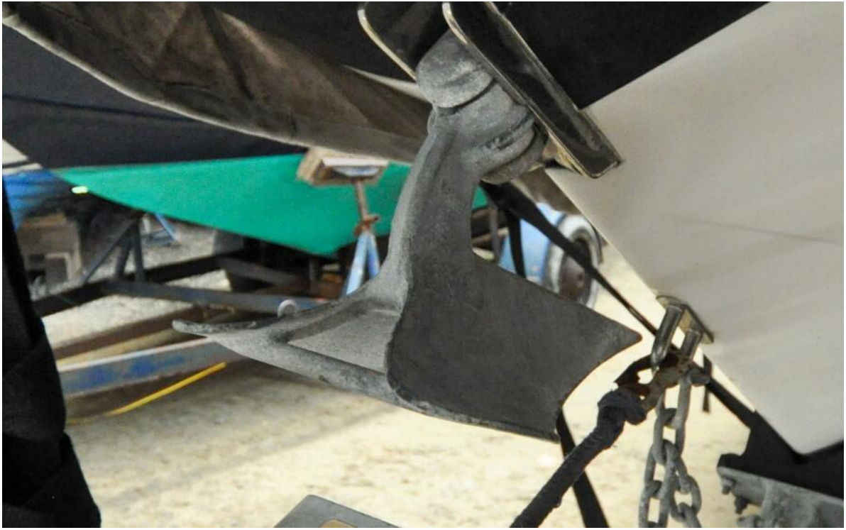
Protector 28 Targa Wiwiki Offered For Sale43