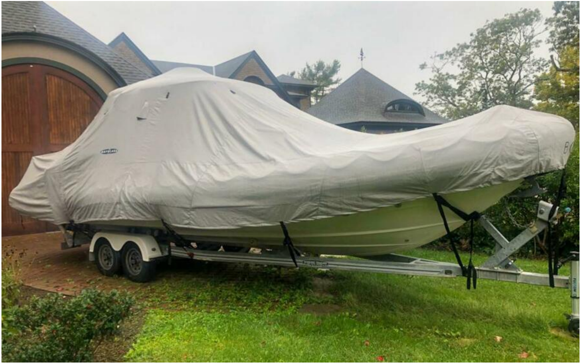
Protector 28 Targa Wiwiki Offered For Sale 50 33 4