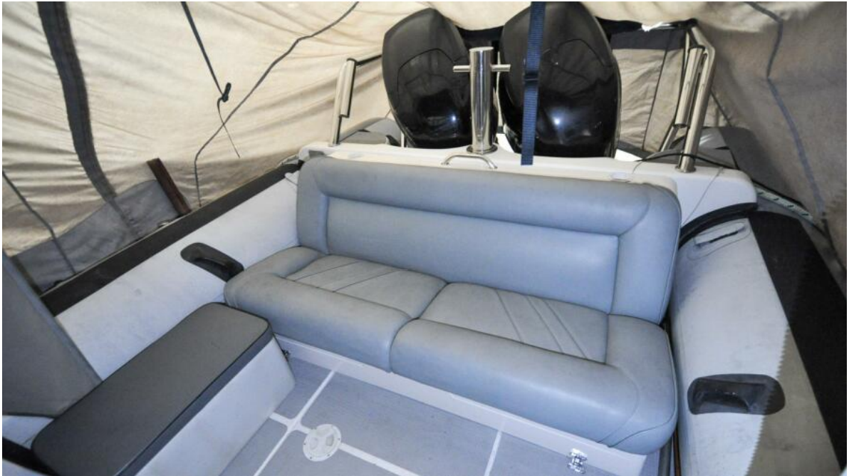
Protector 28 Targa Wiwiki Offered For Sale39