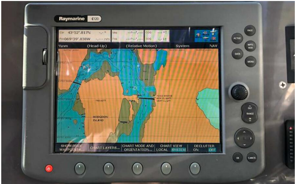
Protector 28 Targa Wiwiki Offered For Sale 47 13 18