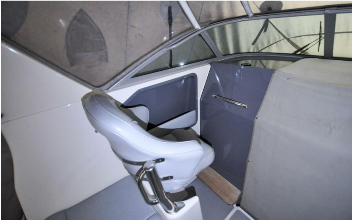
Protector 28 Targa Wikipi Offered For Sale36