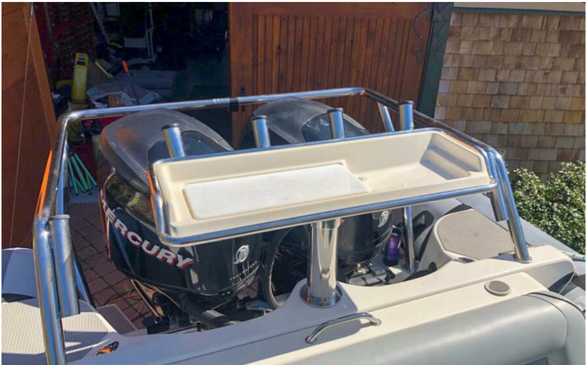
Protector 28 Targa Wiwiki Offered For Sale 47 13 7