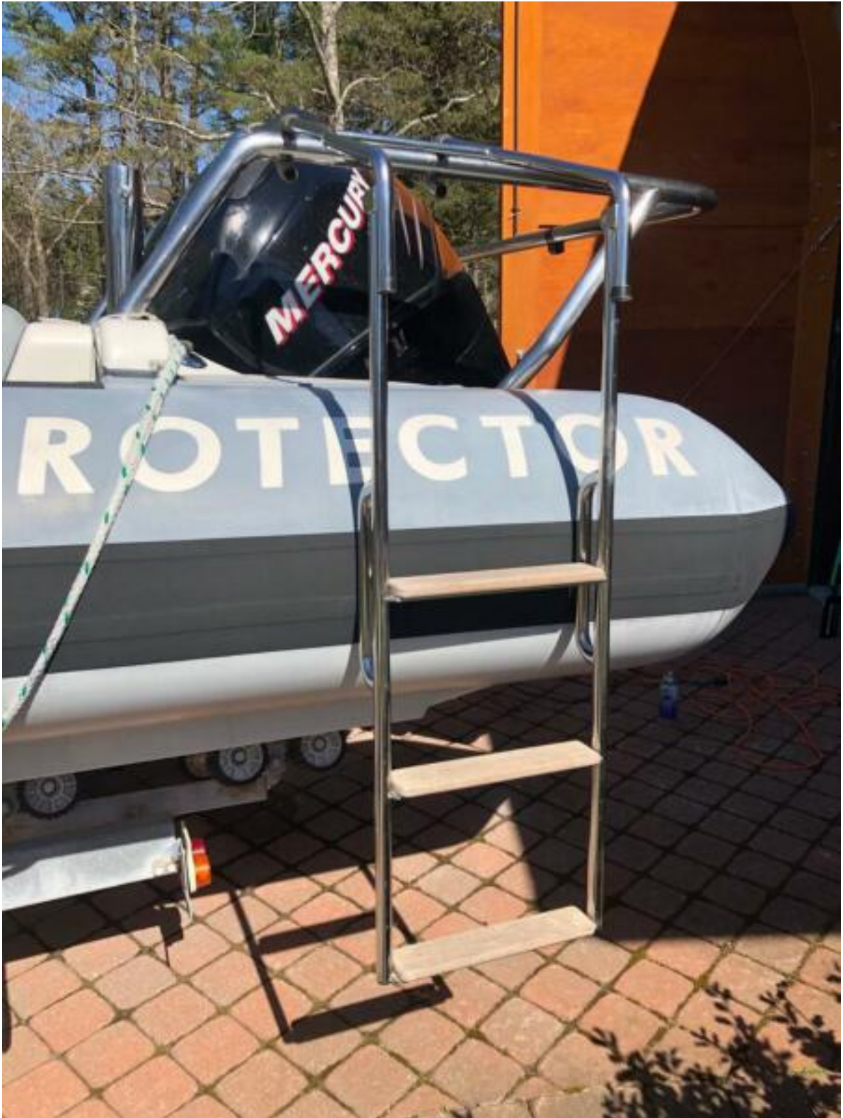
Protector 28 Targa Wiwiki Offered For Sale 47 13 6