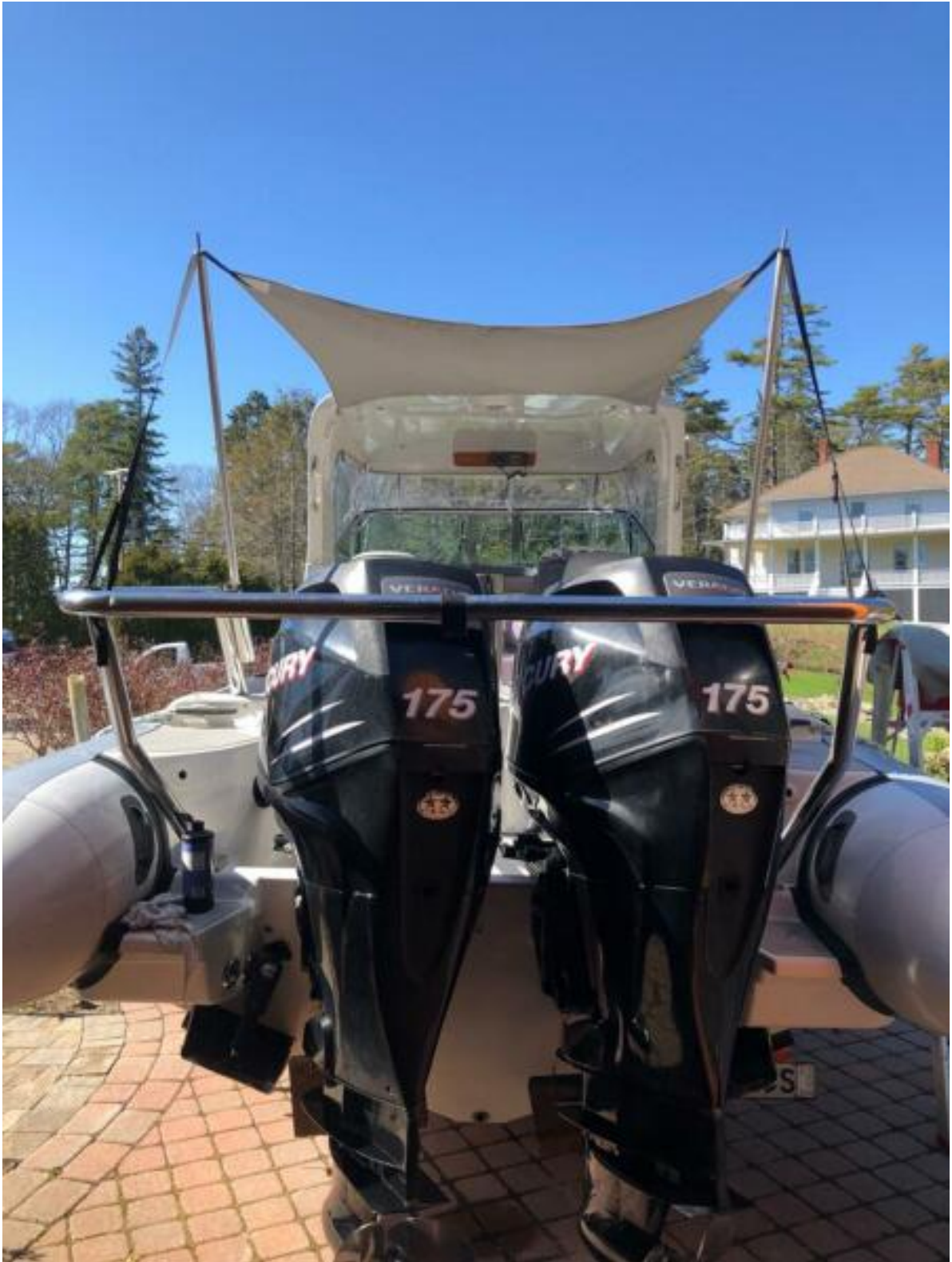
Protector 28 Targa Wiwiki Offered For Sale 47 13 9