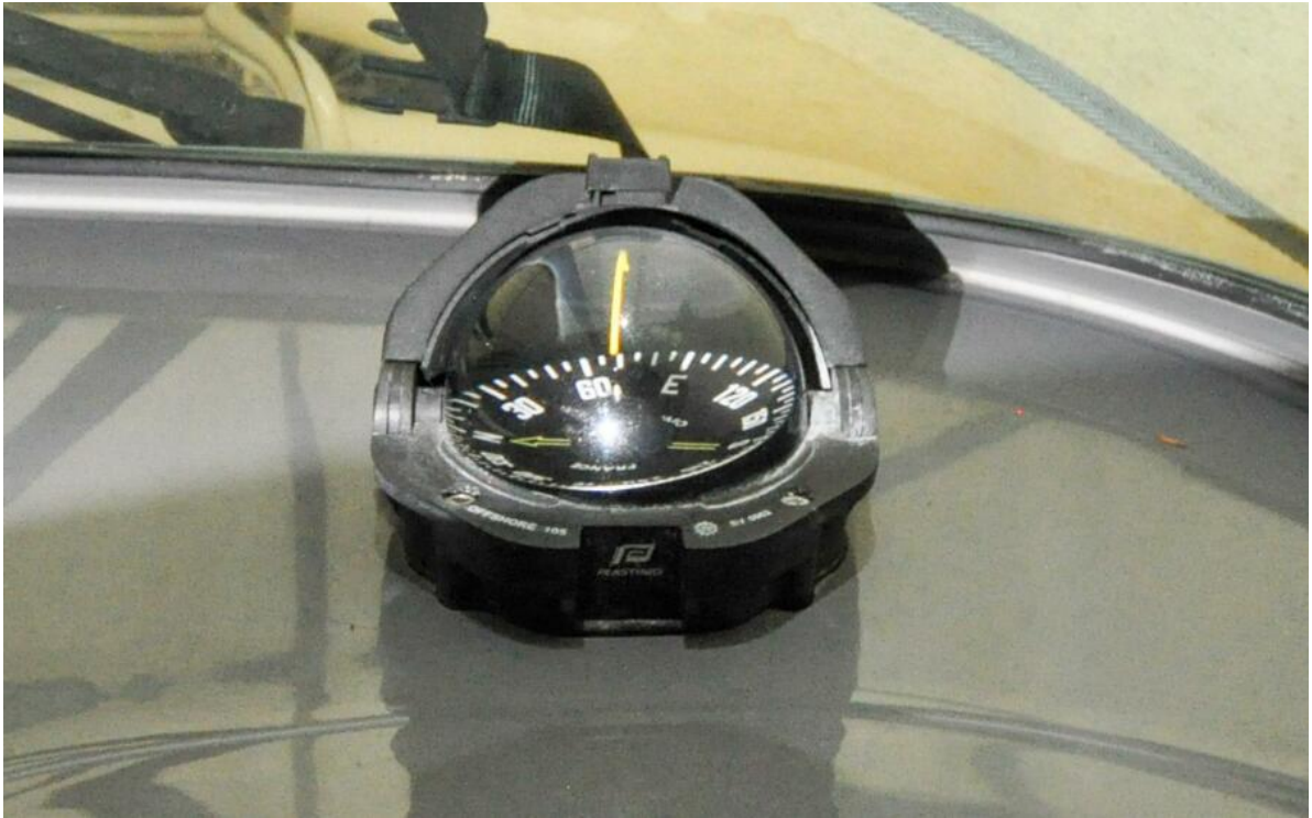
Protector 28 Targa Wiwiki Offered For Sale21