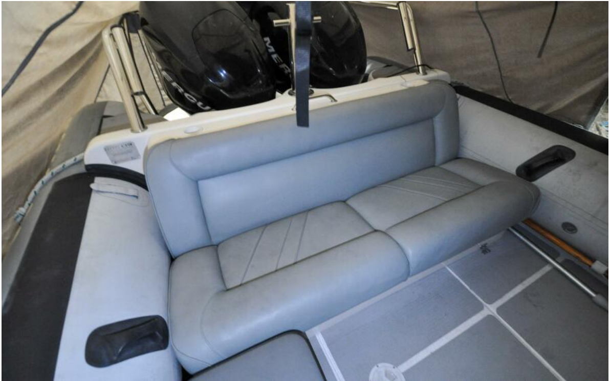
Protector 28 Targa Wiwiki Offered For Sale40