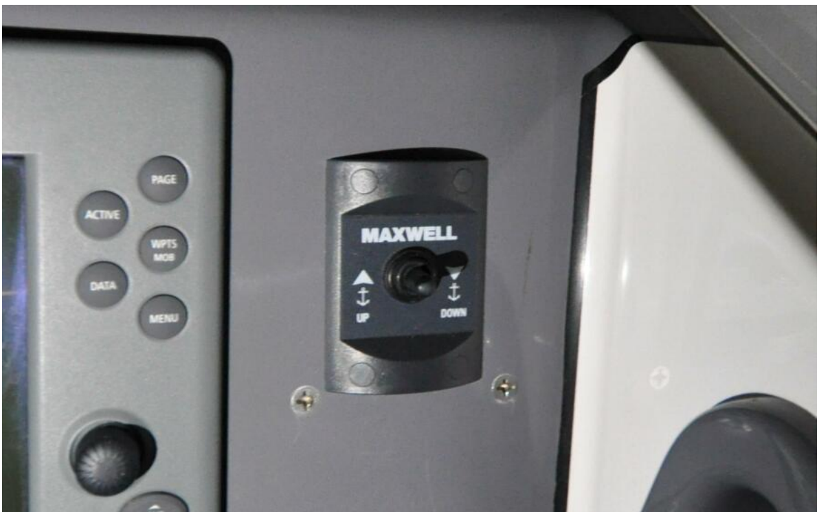
Protector 28 Targa Wiwiki Offered For Sale23