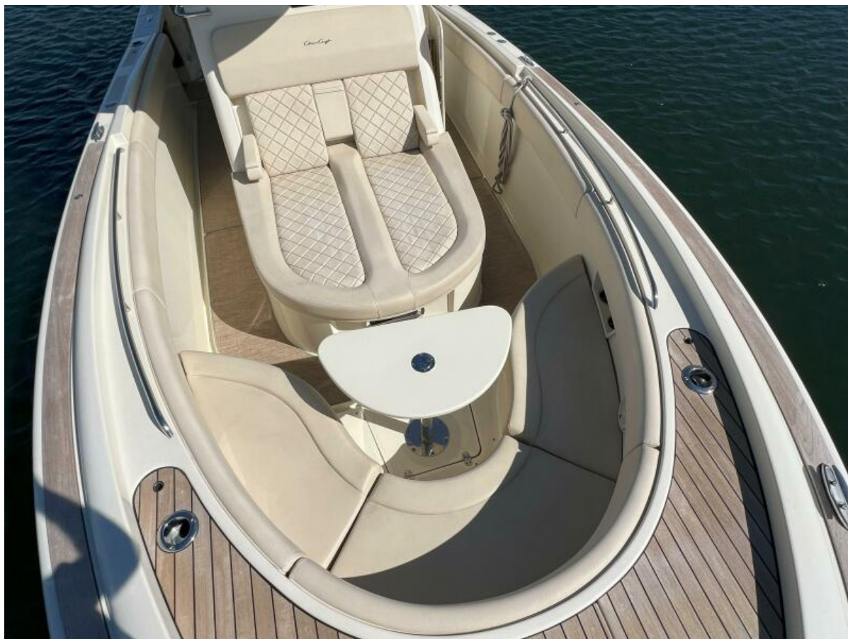
2018 30 Chris-Craft Catalina - Southern Run - Bow