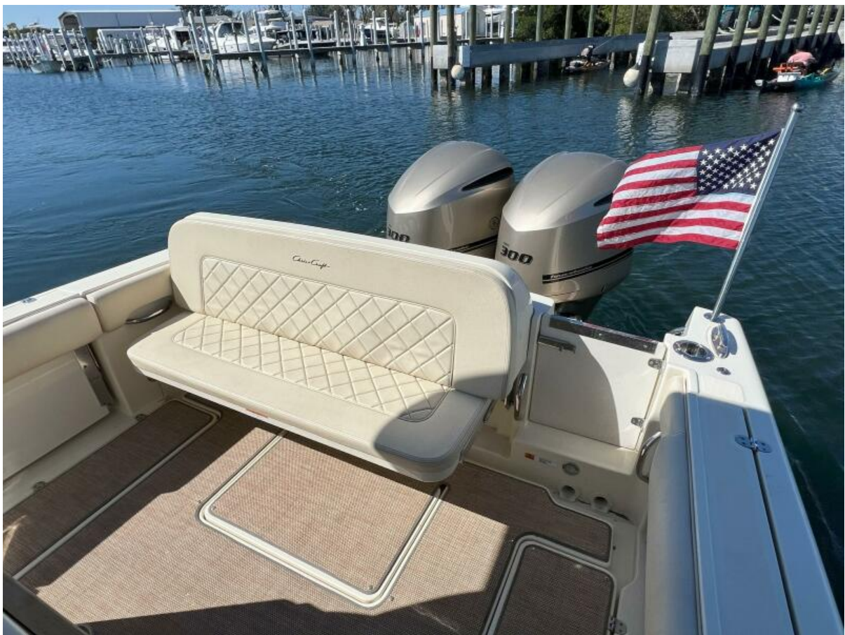
2018 30 Chris-Craft Catalina - Southern Run - Cockpit