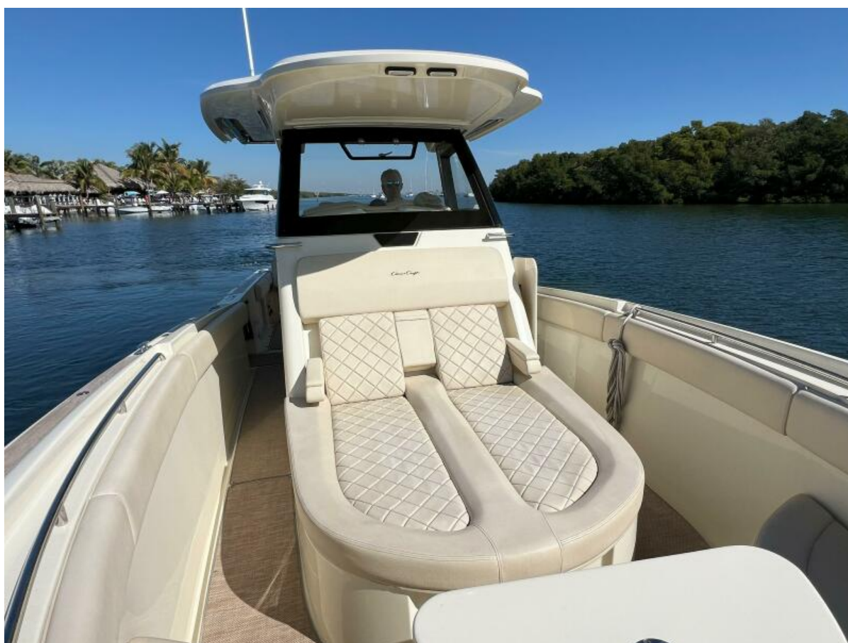
2018 30 Chris-Craft Catalina - Southern Run - Bow