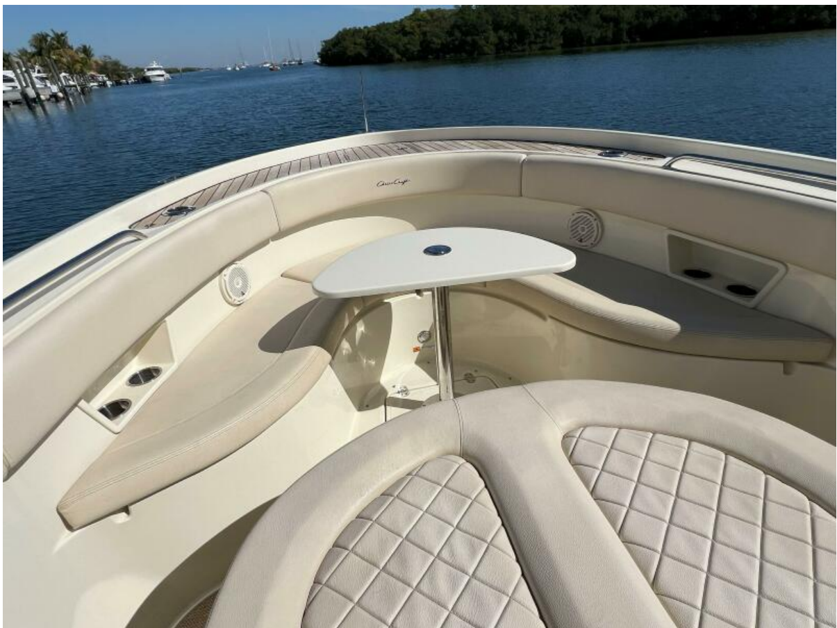
2018 30 Chris-Craft Catalina - Southern Run - Bow