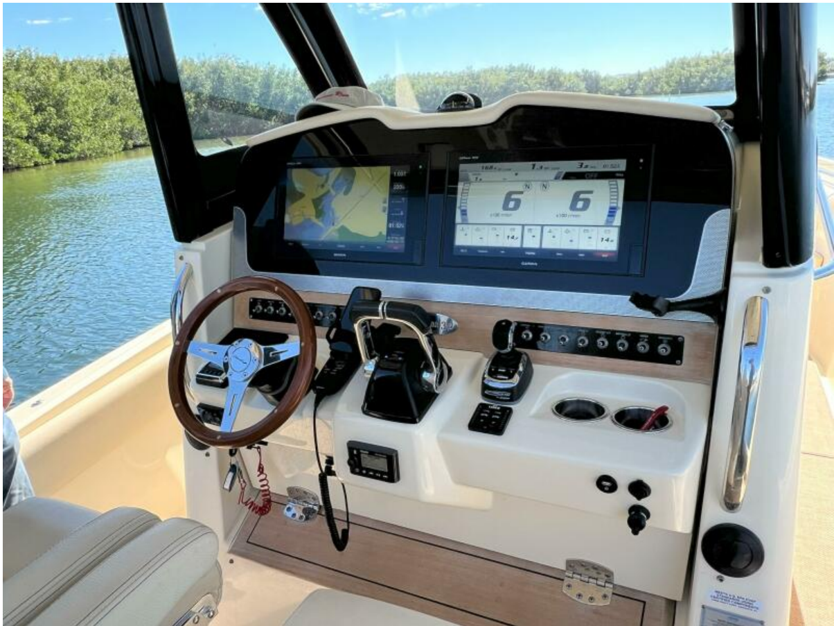
2018 30 Chris-Craft Catalina - Southern Run - Helm