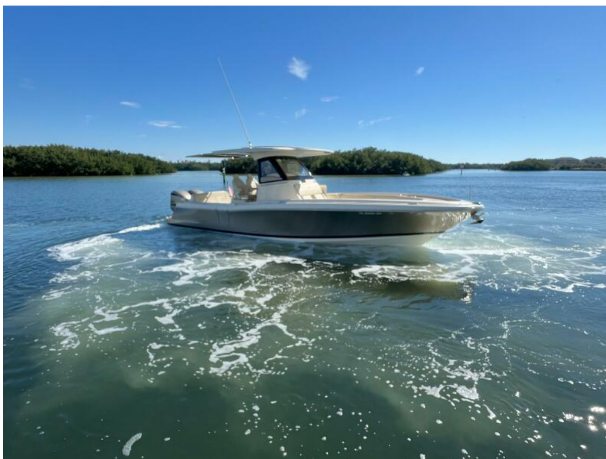
2018 30 Chris-Craft Catalina - Southern Run - Profile