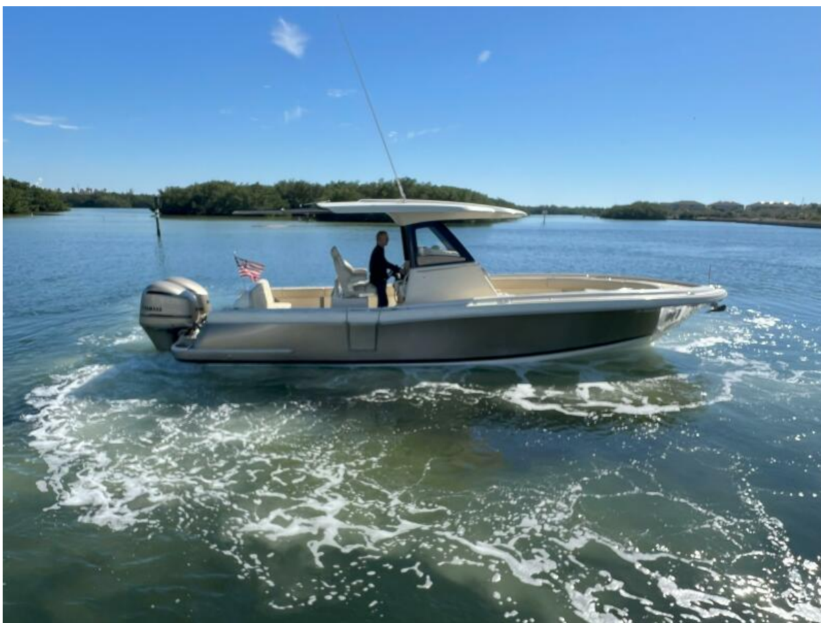
2018 30 Chris-Craft Catalina - Southern Run - Profile