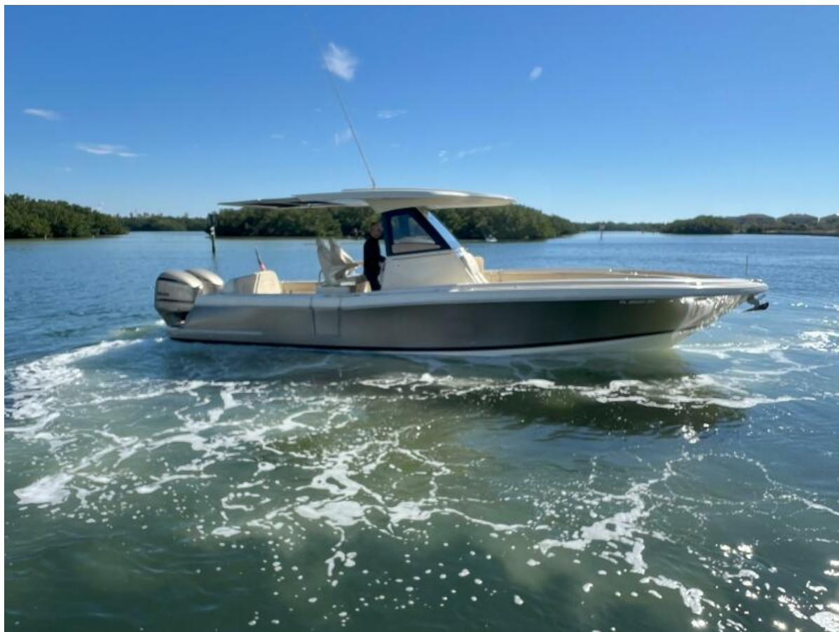
2018 30 Chris-Craft Catalina - Southern Run - Profile