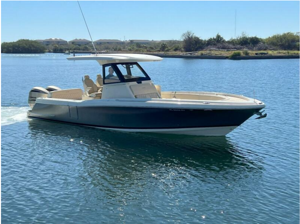
2018 30 Chris-Craft Catalina - Southern Run - Profile