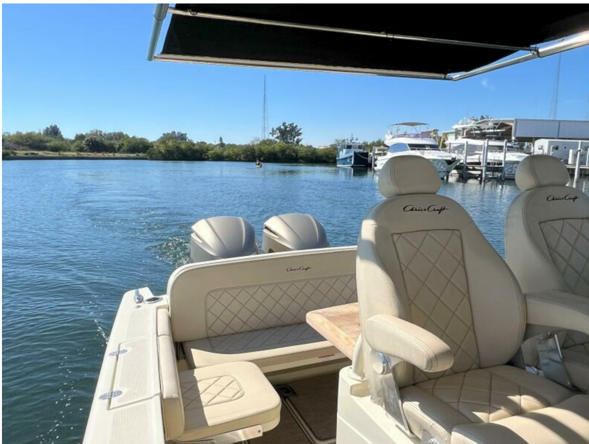
2018 30 Chris-Craft Catalina - Southern Run - Cockpit