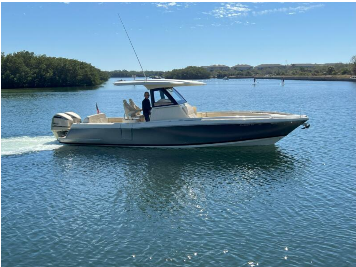
2018 30 Chris-Craft Catalina - Southern Run - Profile