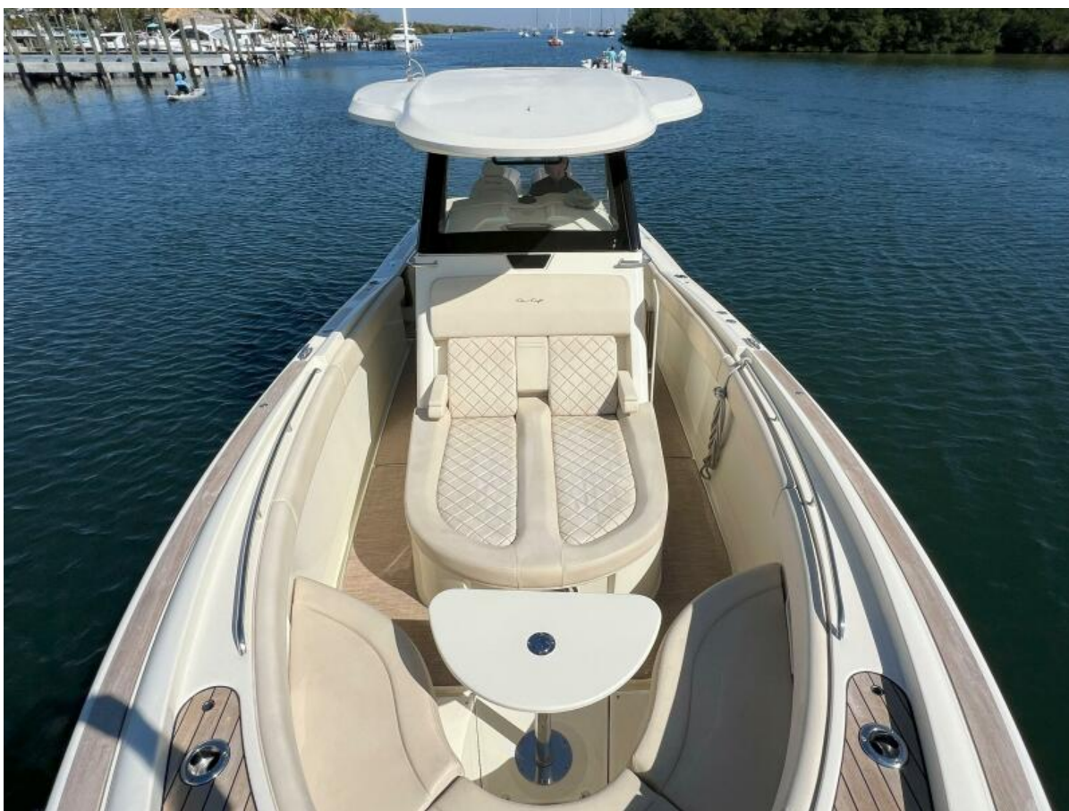
2018 30 Chris-Craft Catalina - Southern Run - Bow