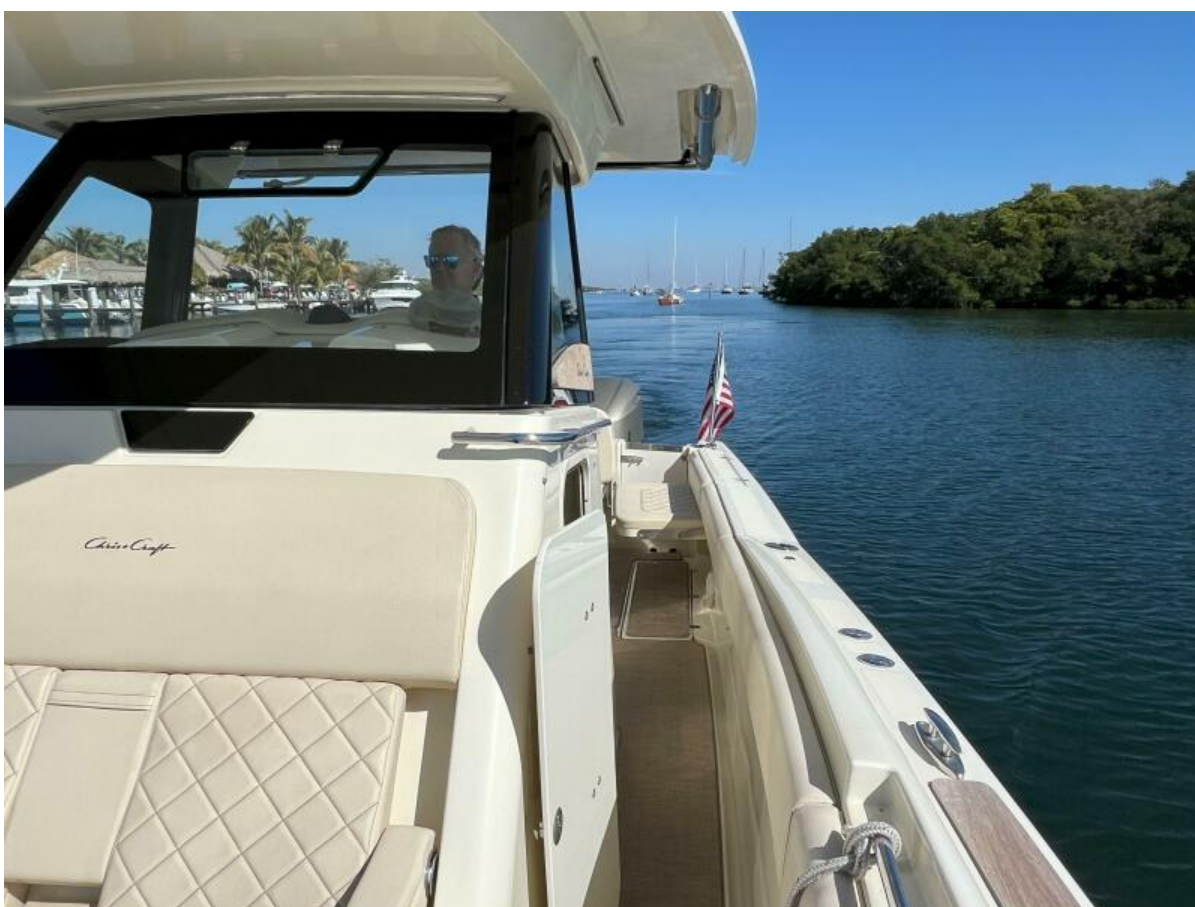
2018 30 Chris-Craft Catalina - Southern Run - Helm