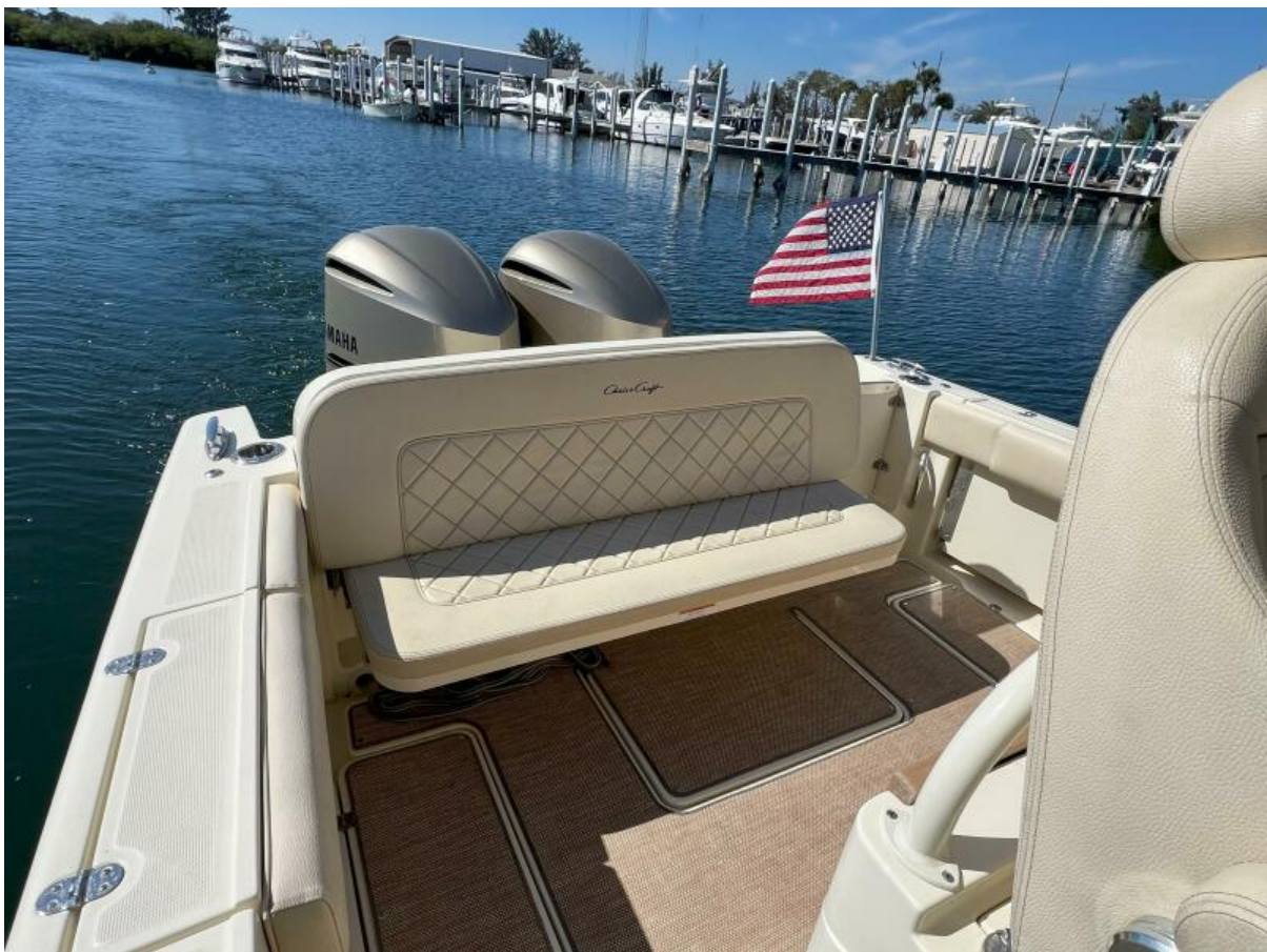
2018 30 Chris-Craft Catalina - Southern Run - Cockpit