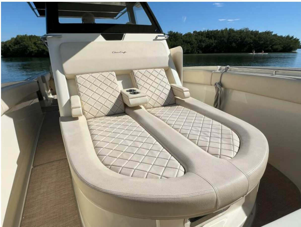
2018 30 Chris-Craft Catalina - Southern Run - Bow