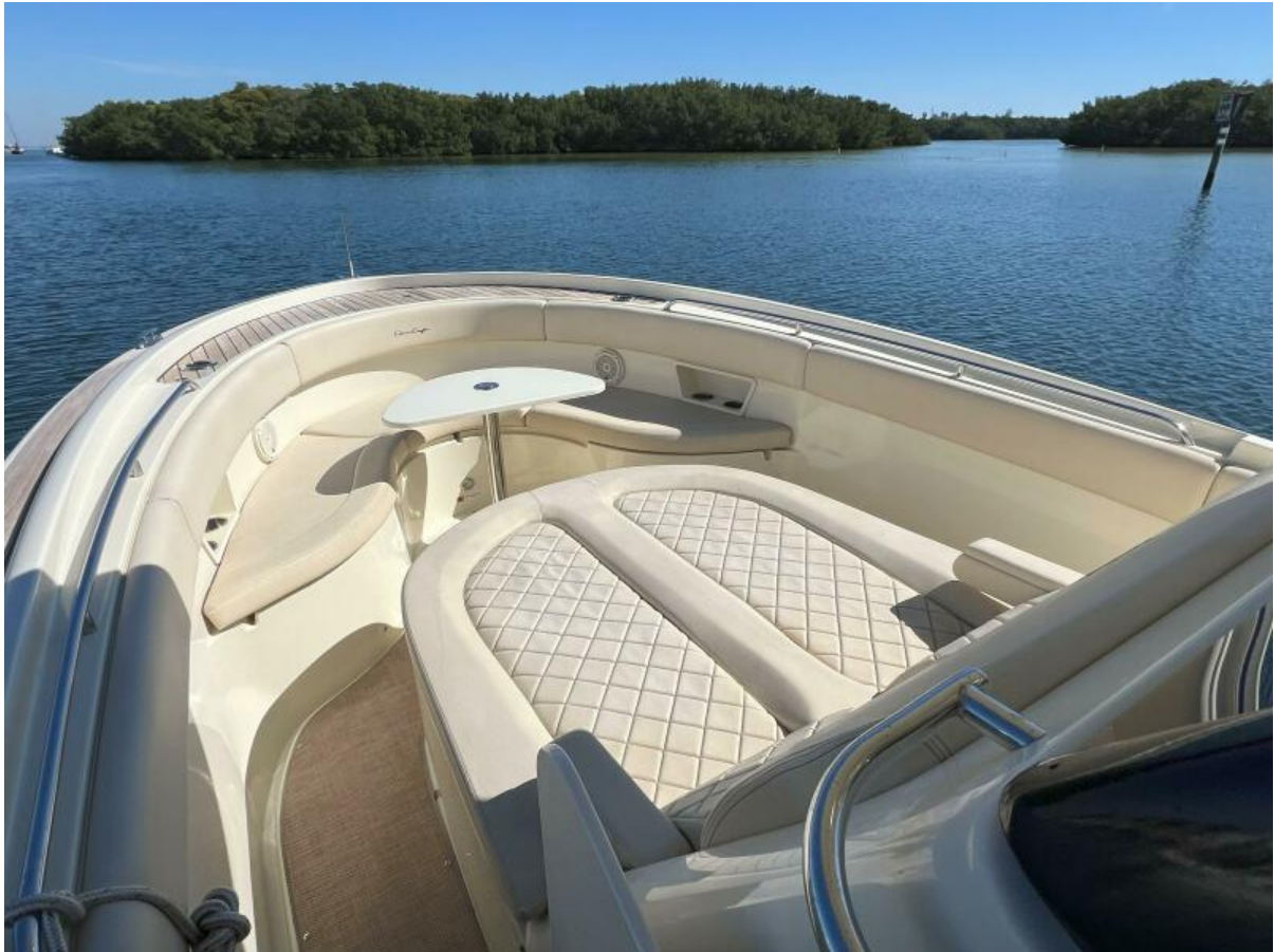
2018 30 Chris-Craft Catalina - Southern Run - Bow