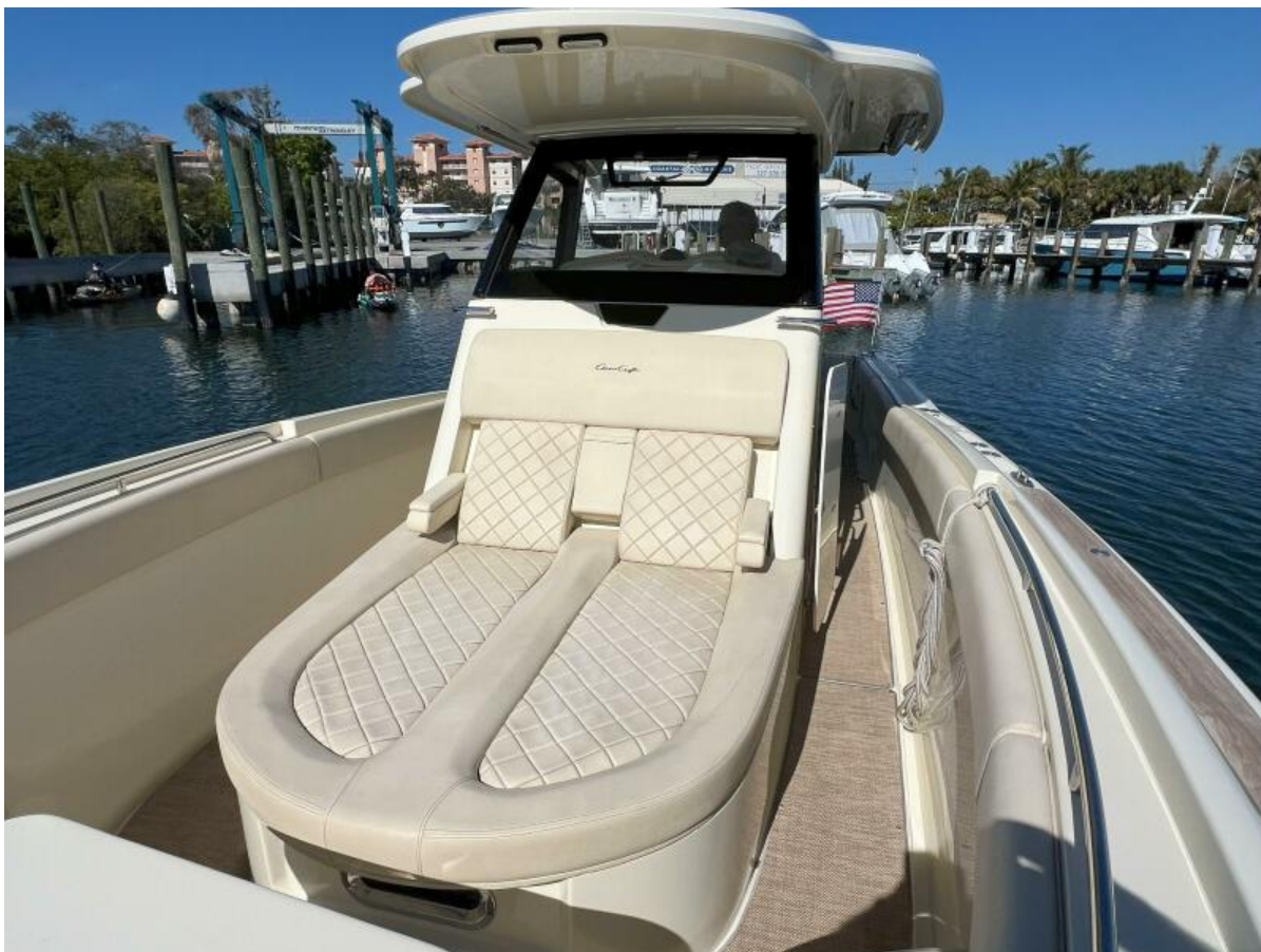
2018 30 Chris-Craft Catalina - Southern Run - Bow