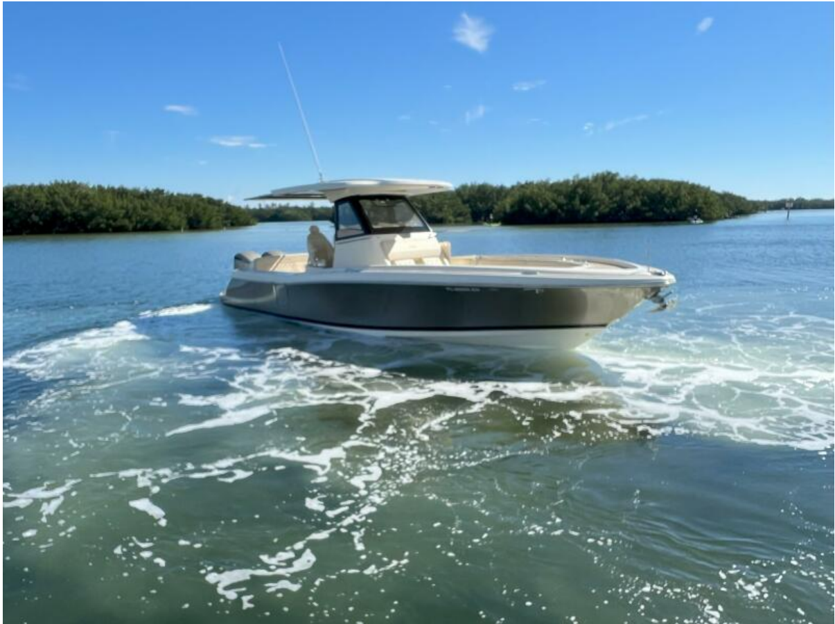
2018 30 Chris-Craft Catalina - Southern Run - Profile