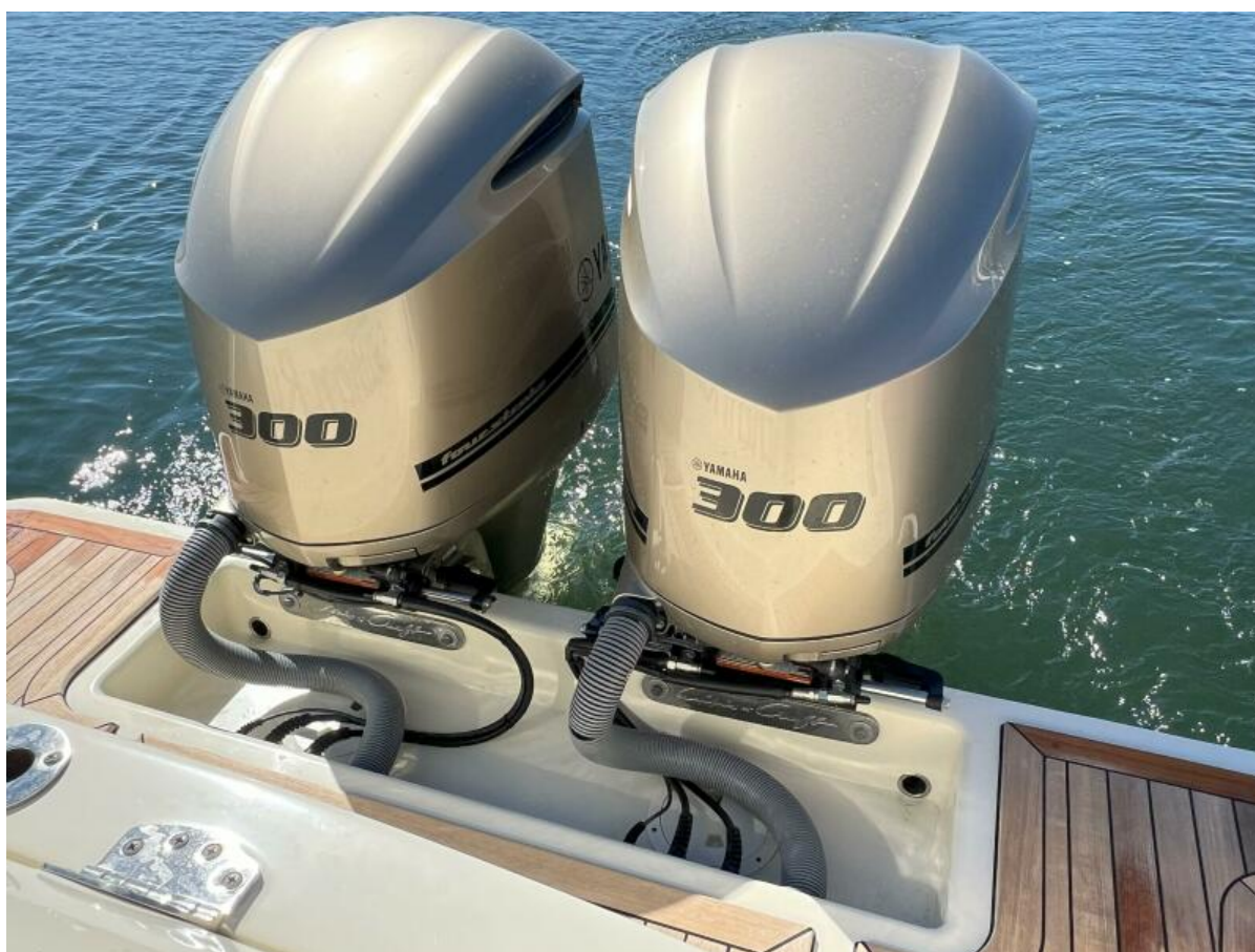
2018 30 Chris-Craft Catalina - Southern Run - Twin Yamaha