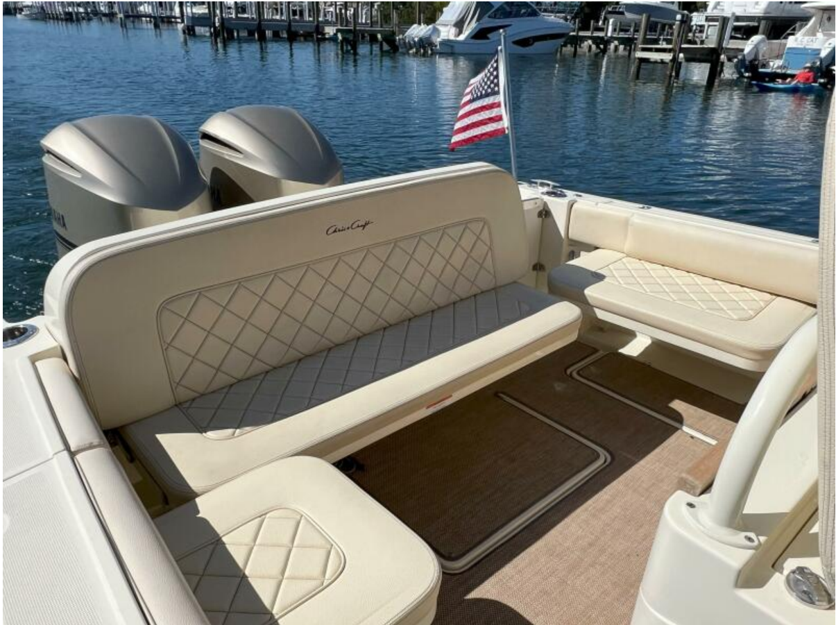
2018 30 Chris-Craft Catalina - Southern Run - Cockpit