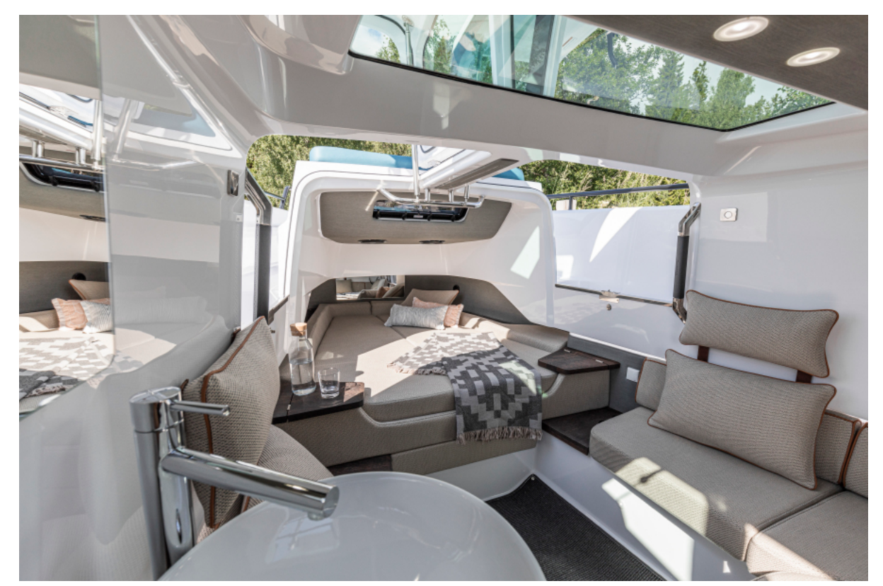
Axopar 37 XC East Coast Yacht Sales Available East Coast Yacht Sales Axopar 37 XC Cross Cabin