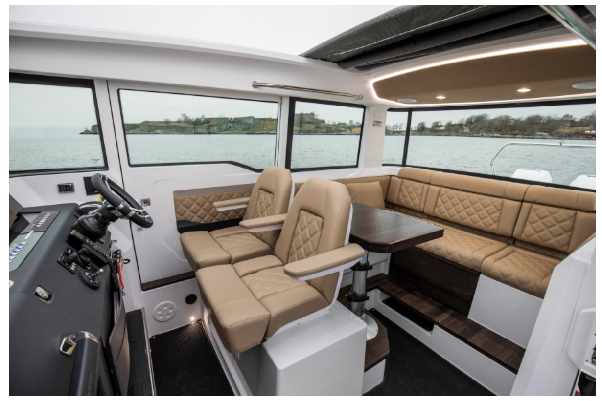
Axopar 37 XC East Coast Yacht Sales Available Salon East Coast Yacht Sales Axopar 37 XC Cross Cabin