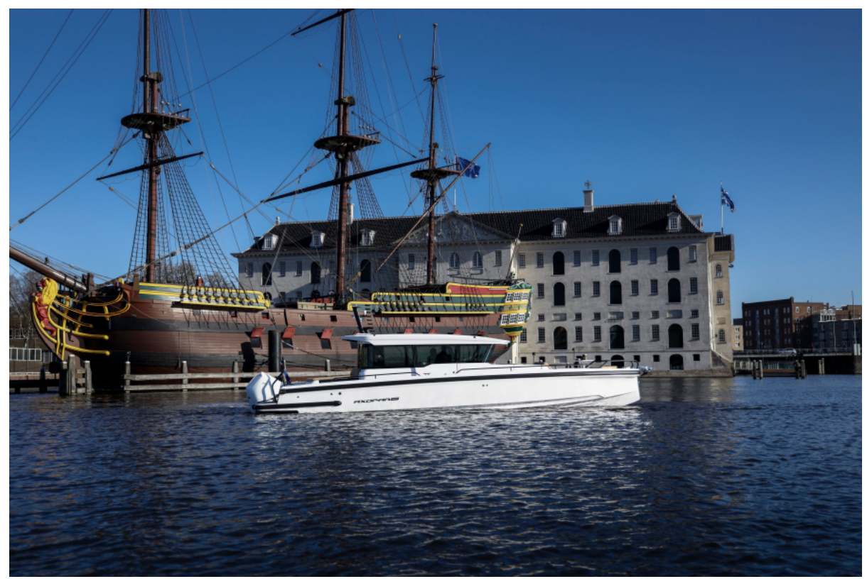
Axopar 37 XC East Coast Yacht Sales Available East Coast Yacht Sales Axopar 37 XC Cross Cabin