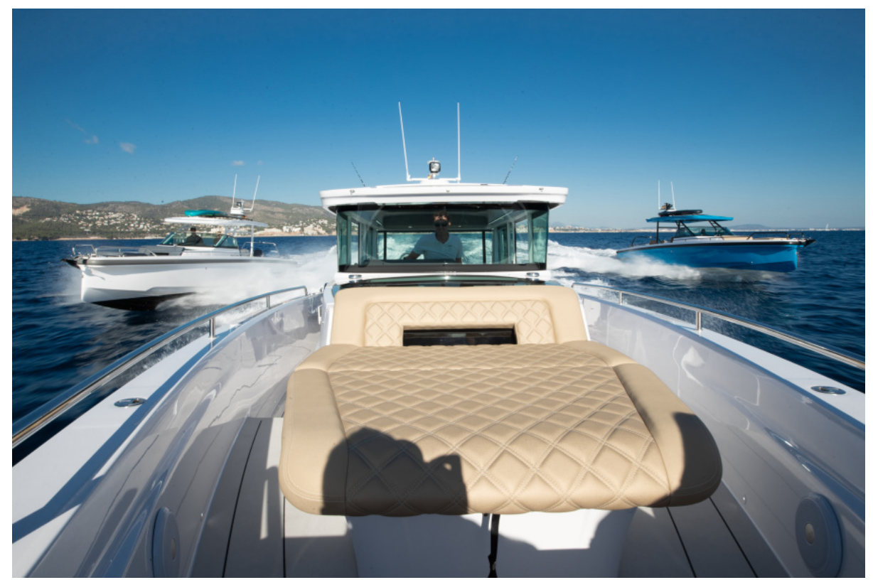
Axopar 37 XC East Coast Yacht Sales Available Sun Bed East Coast Yacht Sales Axopar 37 XC Cross Cabin