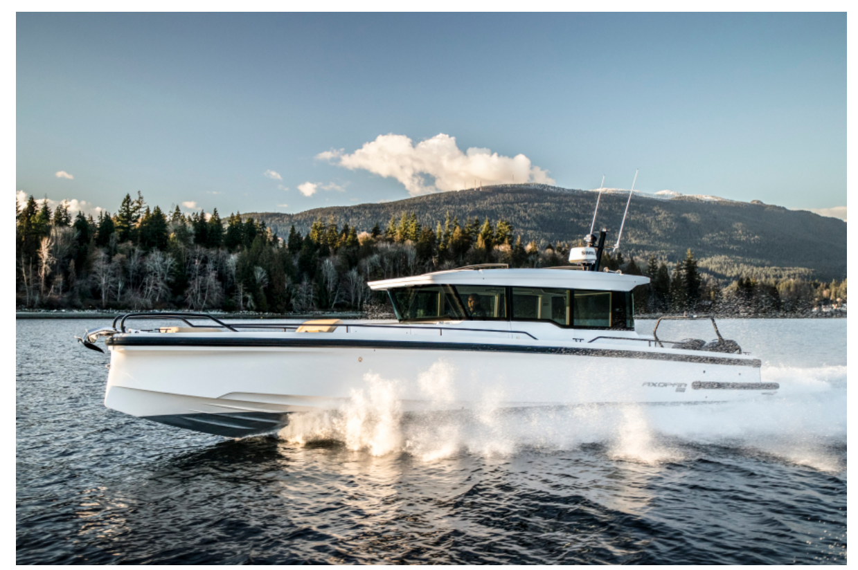
Axopar 37 XC East Coast Yacht Sales Available East Coast Yacht Sales Axopar 37 XC Cross Cabin