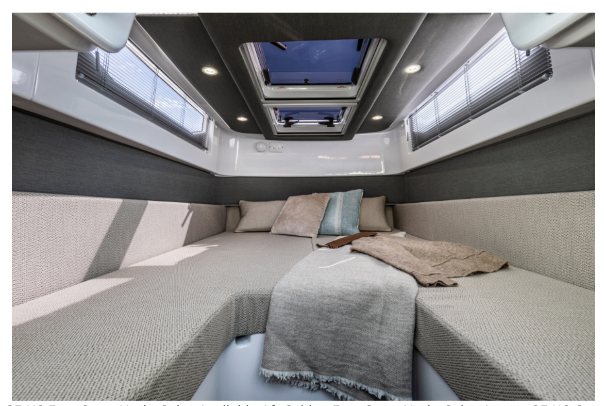
Axopar 37 XC East Coast Yacht Sales Available Aft Cabin East Coast Yacht Sales Axopar 37 XC Cross Cabin