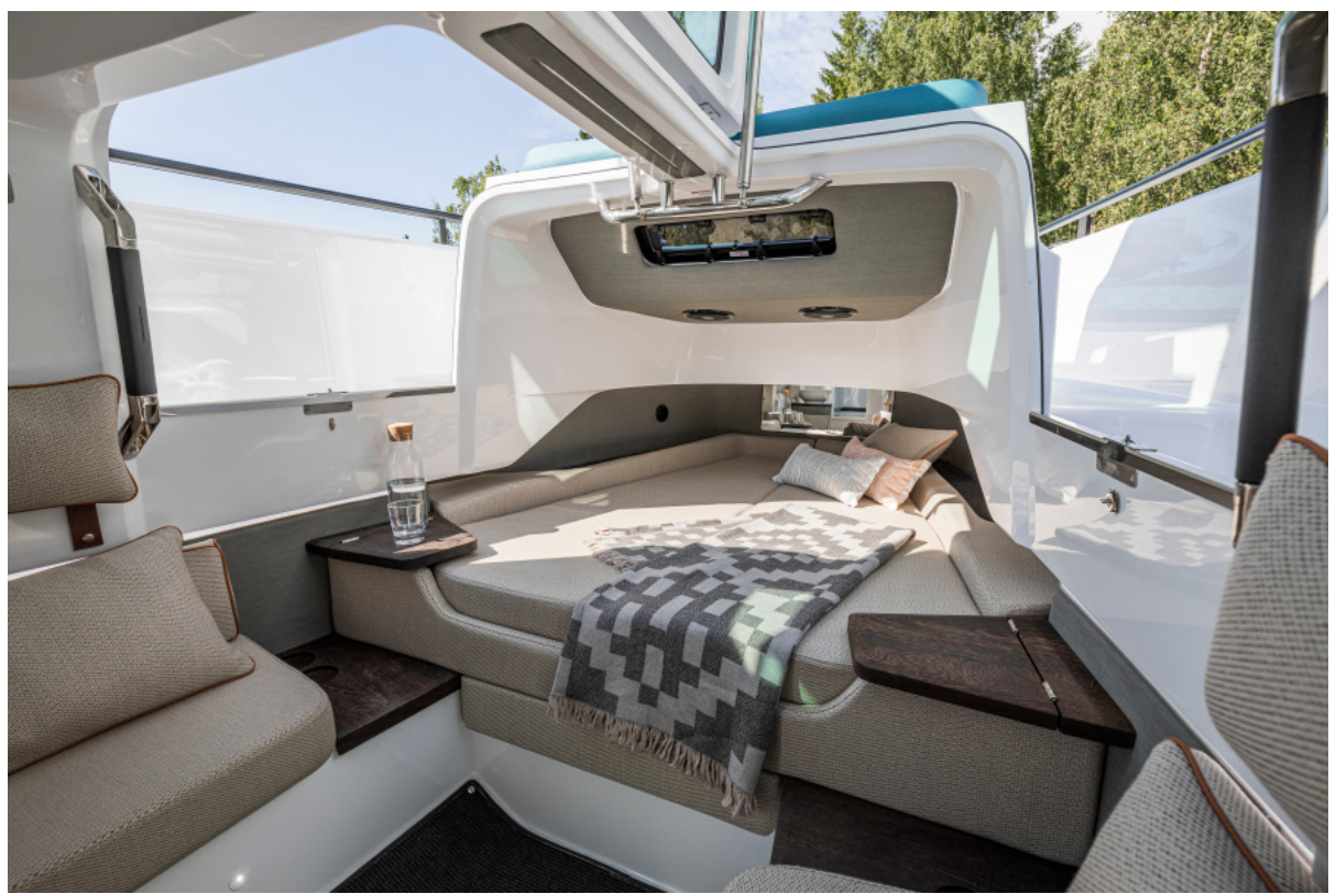
Axopar 37 XC East Coast Yacht Sales Available Forward Cabin East Coast Yacht Sales Axopar 37 XC Cross Cabin