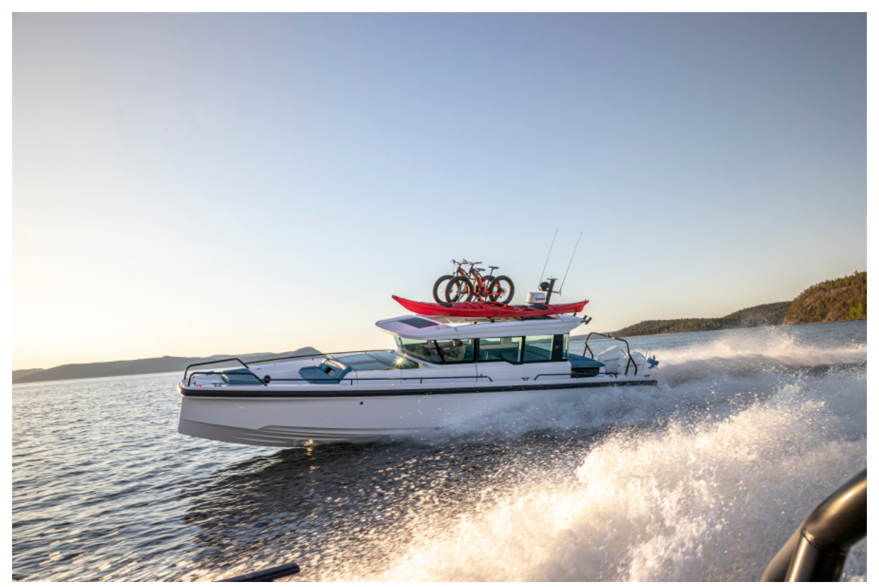
Axopar 37 XC East Coast Yacht Sales Available East Coast Yacht Sales Axopar 37 XC Cross Cabin