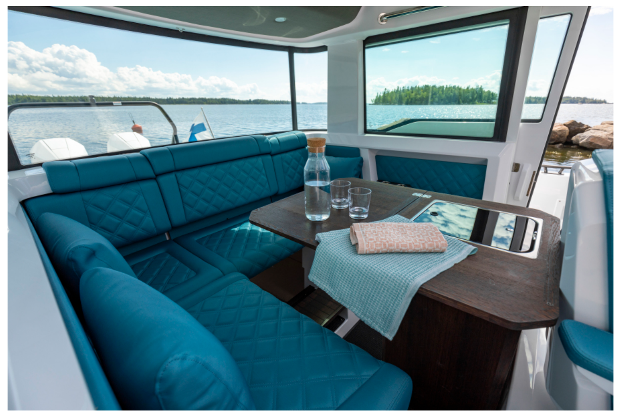
Axopar 37 XC East Coast Yacht Sales Available Salon East Coast Yacht Sales Axopar 37 XC Cross Cabin