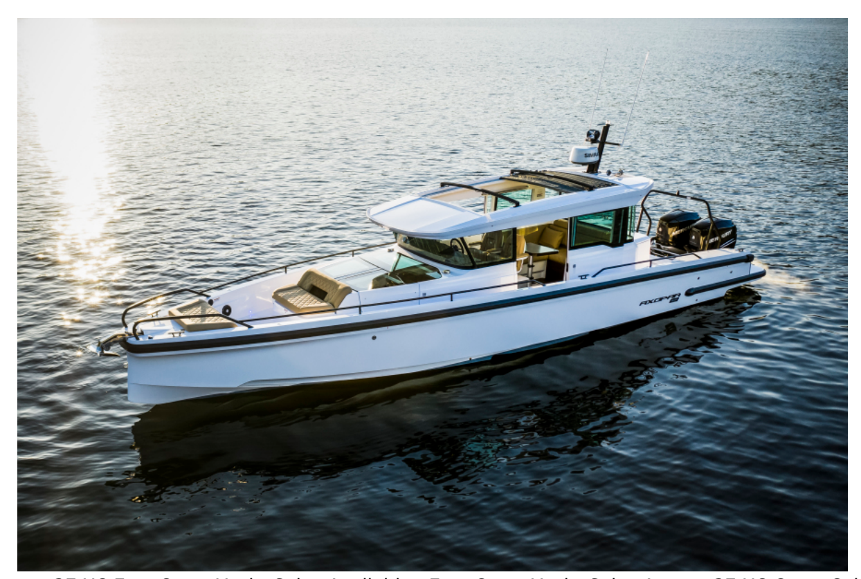
Axopar 37 XC East Coast Yacht Sales Available East Coast Yacht Sales Axopar 37 XC Cross Cabin