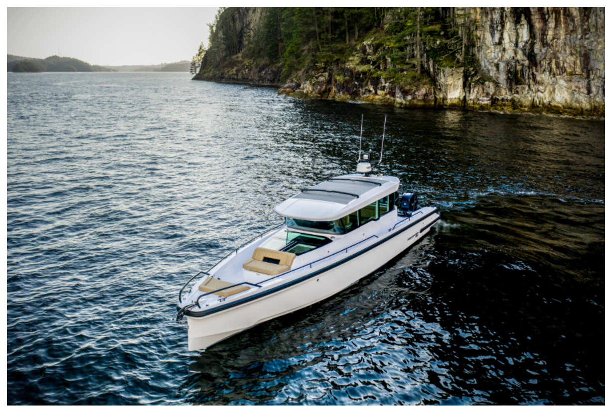
Axopar 37 XC East Coast Yacht Sales Available East Coast Yacht Sales Axopar 37 XC Cross Cabin