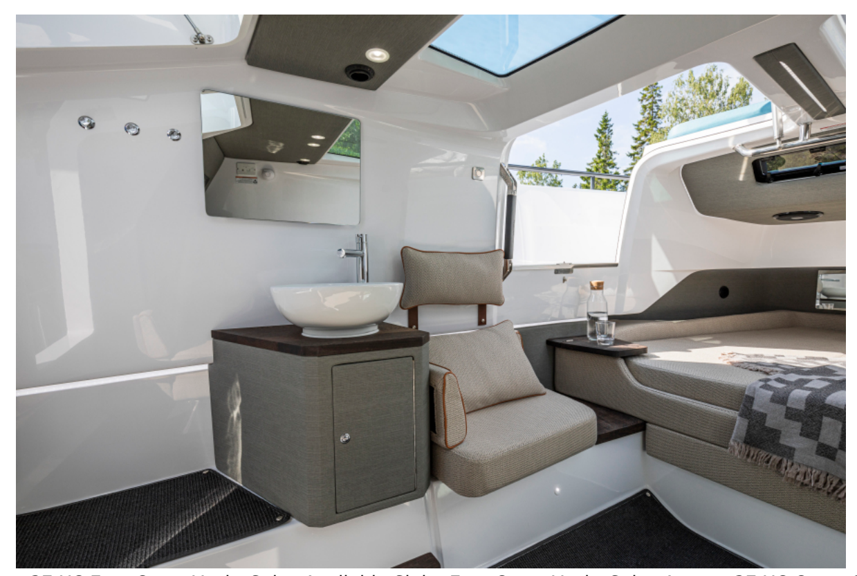
Axopar 37 XC East Coast Yacht Sales Available Sink East Coast Yacht Sales Axopar 37 XC Cross Cabin