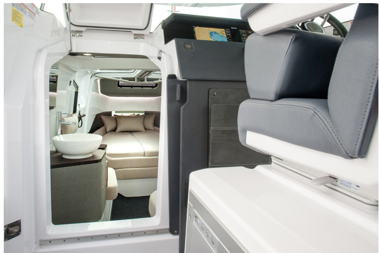
Axopar 37 XC East Coast Yacht Sales AvailableCompanionway East Coast Yacht Sales Axopar 37 XC Cross Cabin