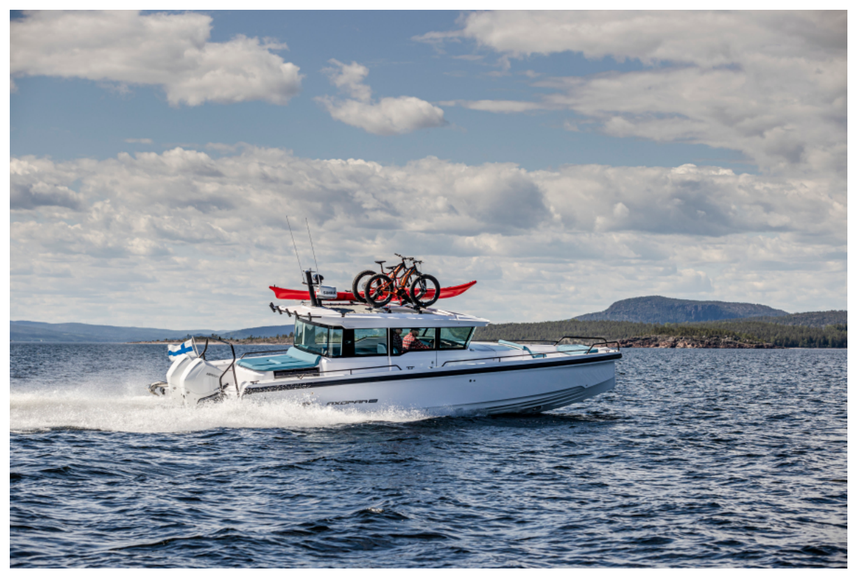
Axopar 37 XC East Coast Yacht Sales Available East Coast Yacht Sales Axopar 37 XC Cross Cabin