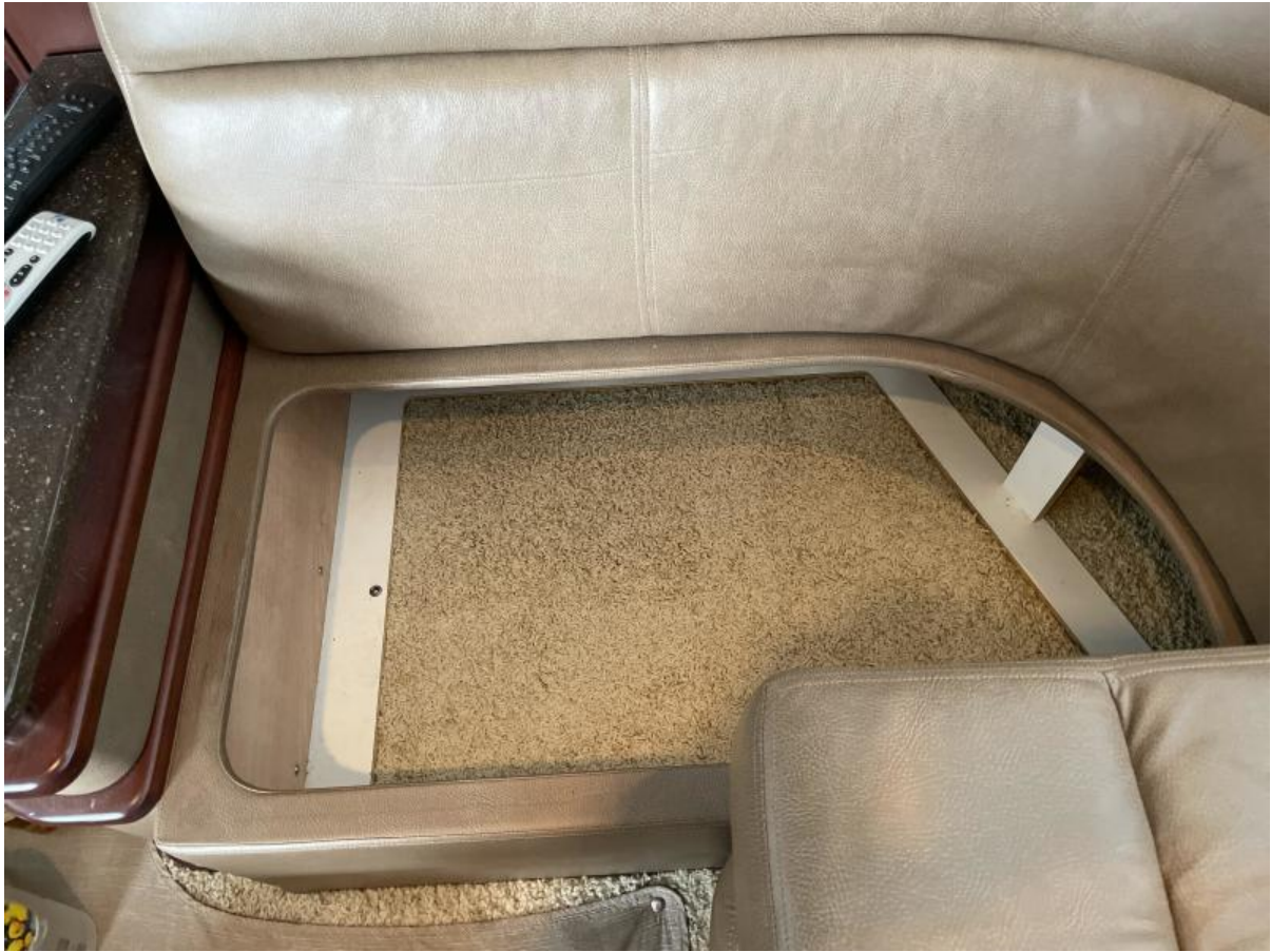
deep storage under the sofa/lounge