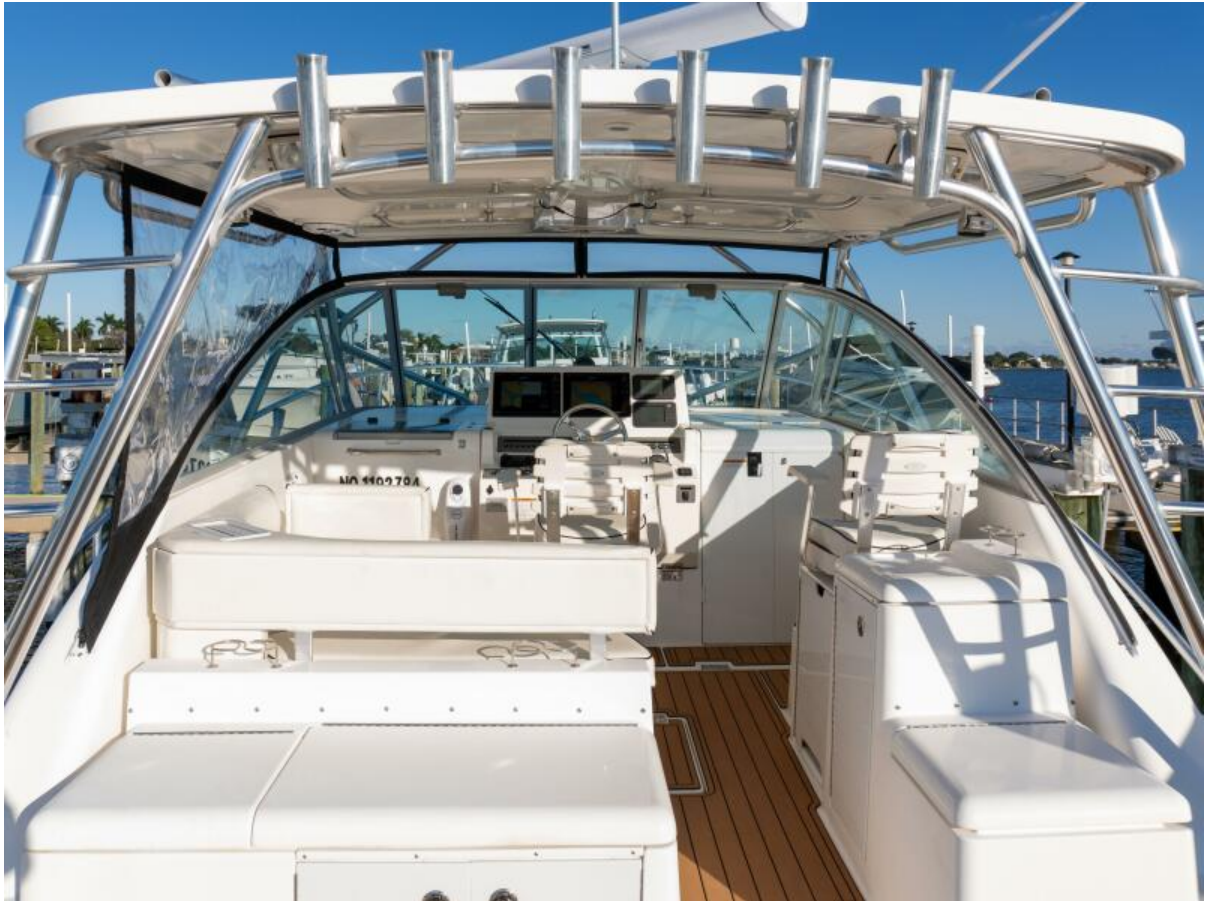
38 Rampage Express Whistle in the Sky- Cockpit 2007 Rampage Express 38 Whistle in the Sky