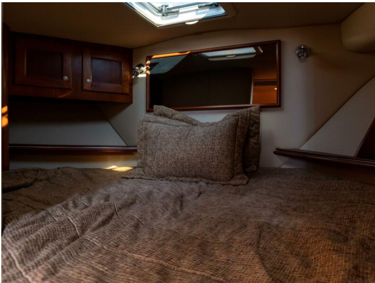
38 Rampage Express Whistle in the Sky- Cabin 2007 Rampage Express 38 Whistle in the Sky