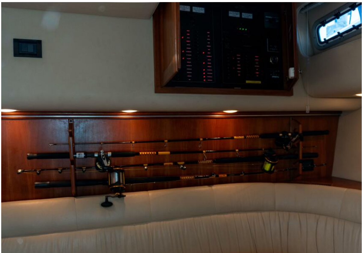
38 Rampage Express Whistle in the Sky- Features 2007 Rampage Express 38 Whistle in the Sky