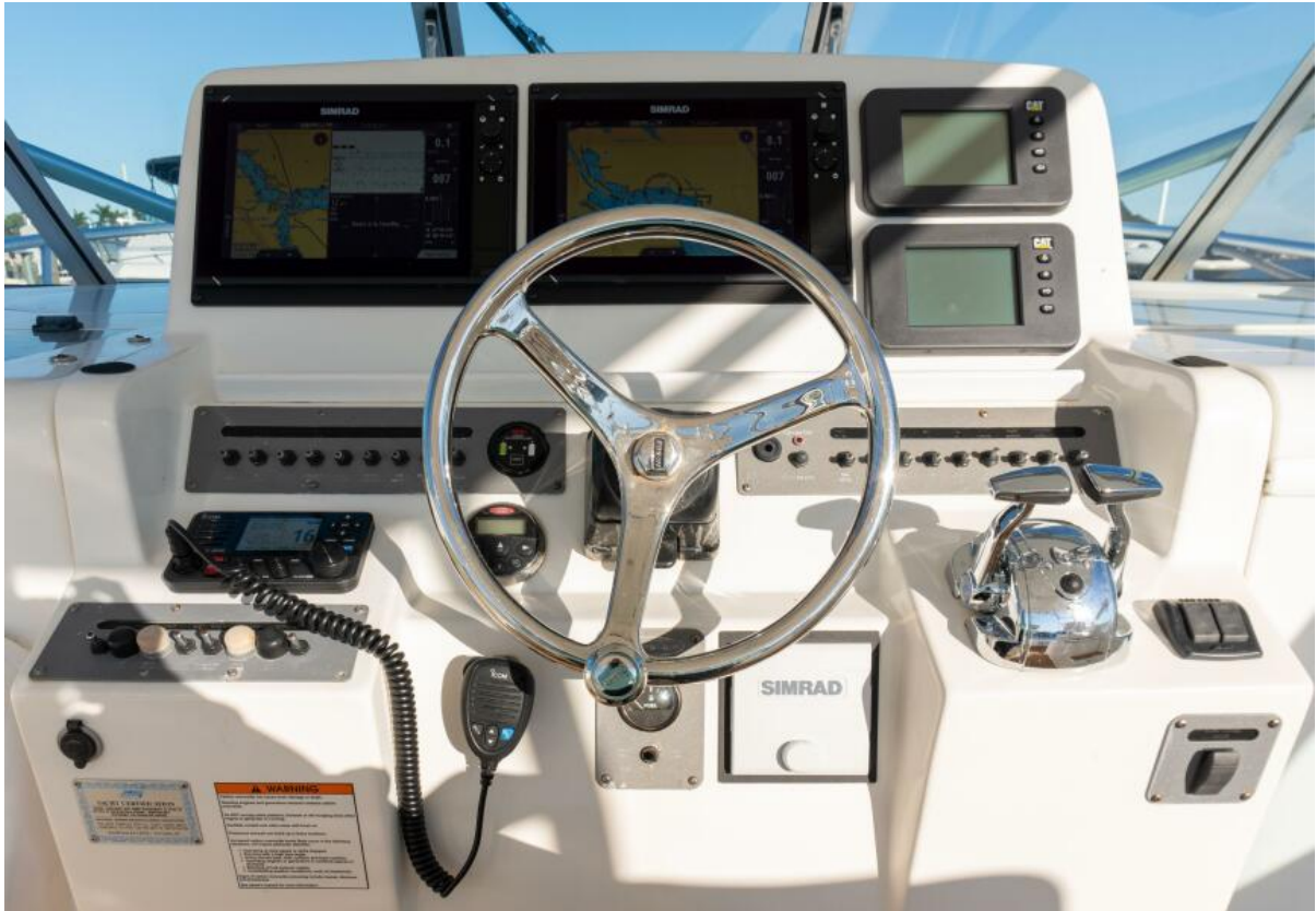
38 Rampage Express Whistle in the Sky- Helm 2007 Rampage Express 38 Whistle in the Sky