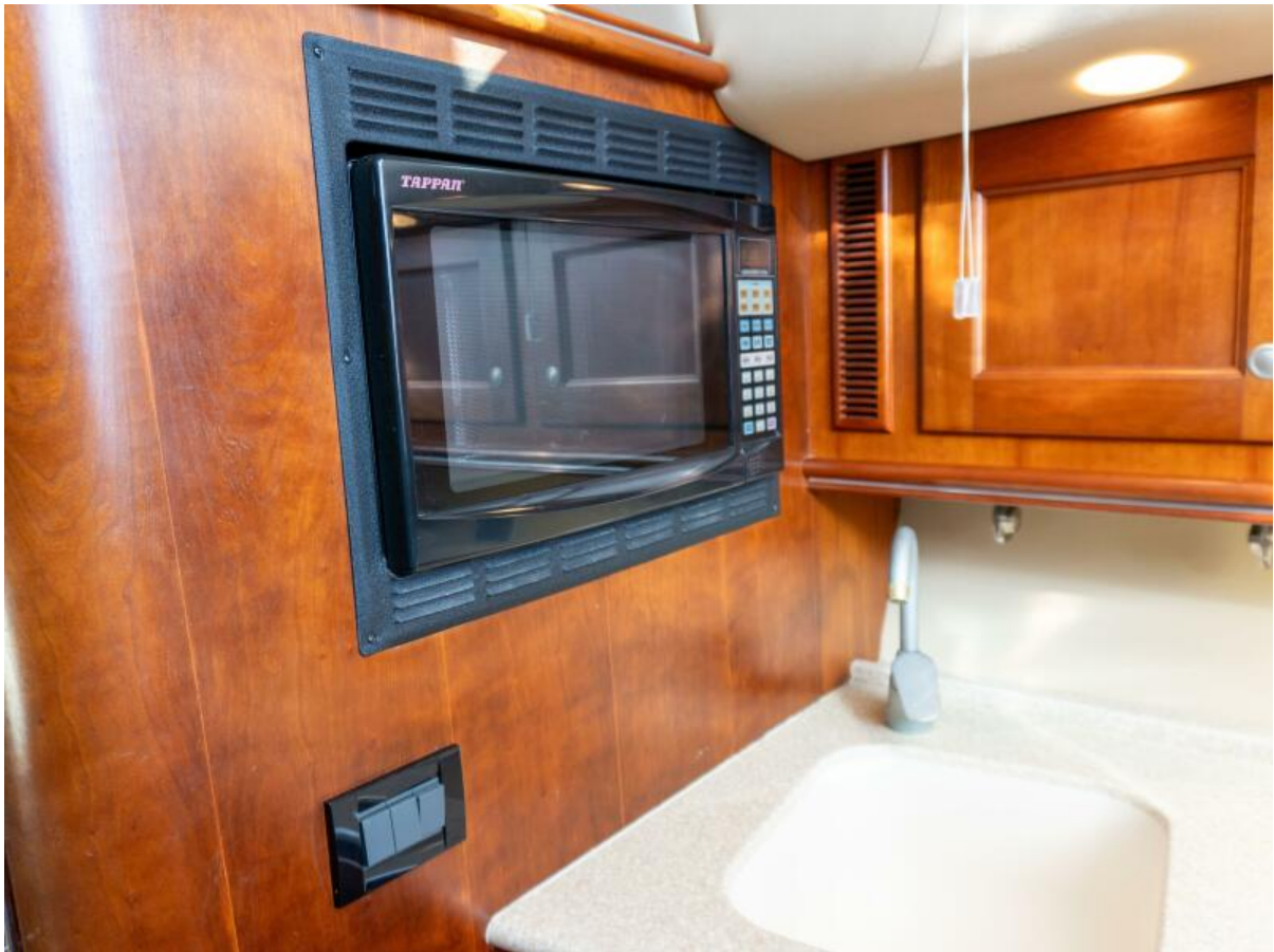
38 Rampage Express Whistle in the Sky- Galley 2007 Rampage Express 38 Whistle in the Sky