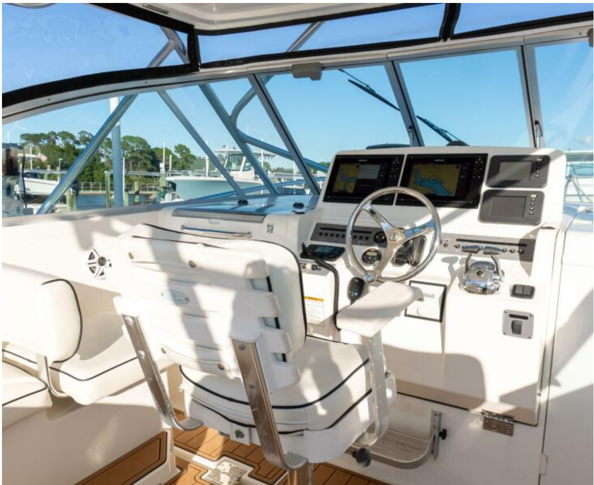
38 Rampage Express Whistle in the Sky- Helm 2007 Rampage Express 38 Whistle in the Sky