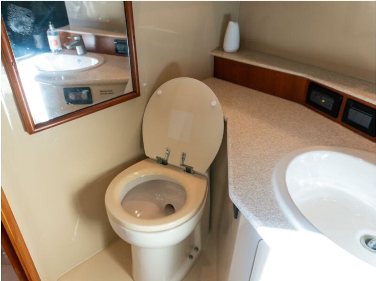
38 Rampage Express Whistle in the Sky- Head 2007 Rampage Express 38 Whistle in the Sky