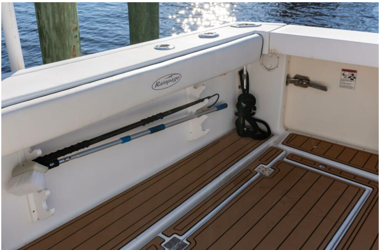
38 Rampage Express Whistle in the Sky- Cockpit 2007 Rampage Express 38 Whistle in the Sky