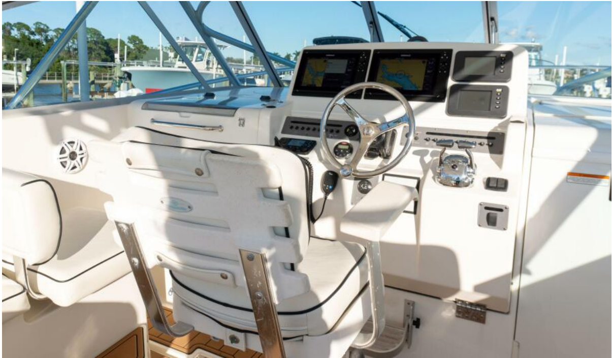
38 Rampage Express Whistle in the Sky- Helm 2007 Rampage Express 38 Whistle in the Sky