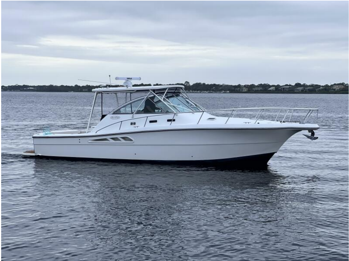
38 Rampage Express Whistle in the Sky- Profile 2007 Rampage Express 38 Whistle in the Sky