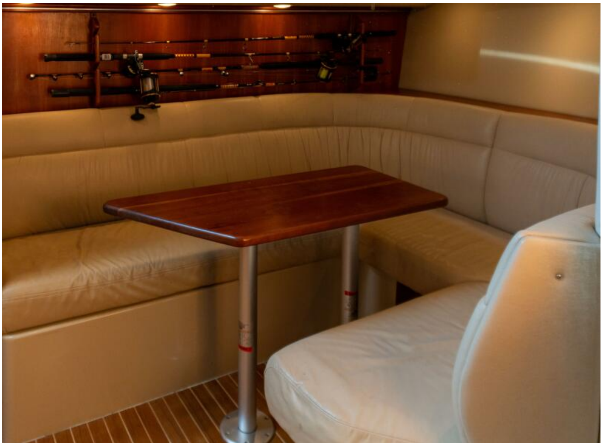
38 Rampage Express Whistle in the Sky- Dinette 2007 Rampage Express 38 Whistle in the Sky