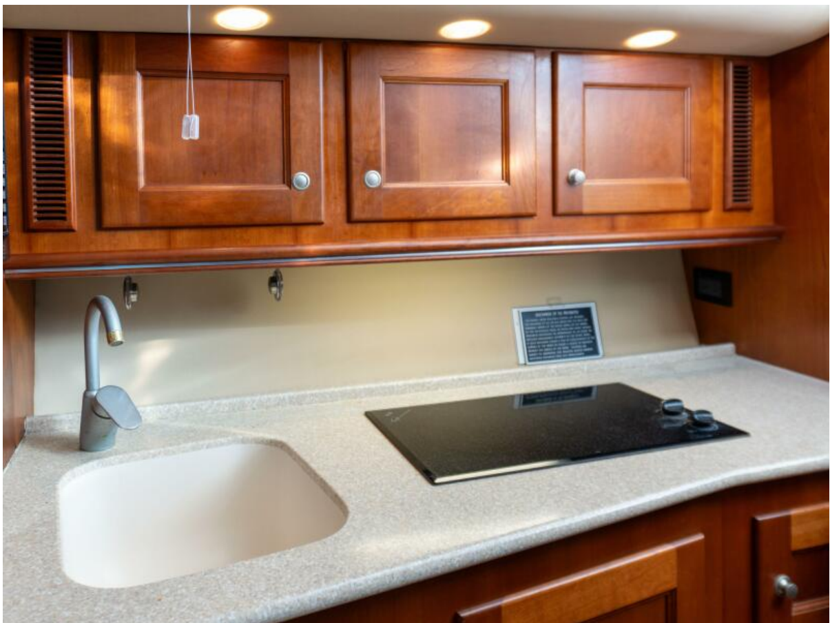
38 Rampage Express Whistle in the Sky- Galley 2007 Rampage Express 38 Whistle in the Sky