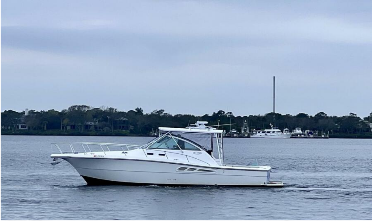
38 Rampage Express Whistle in the Sky- Profile 2007 Rampage Express 38 Whistle in the Sky