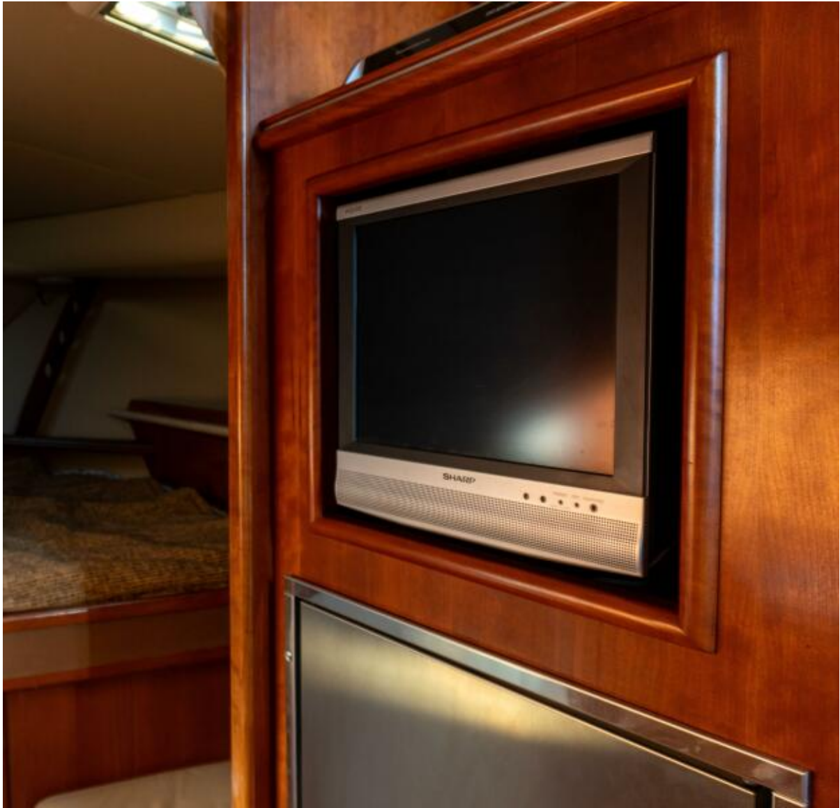
38 Rampage Express Whistle in the Sky- Salon 2007 Rampage Express 38 Whistle in the Sky