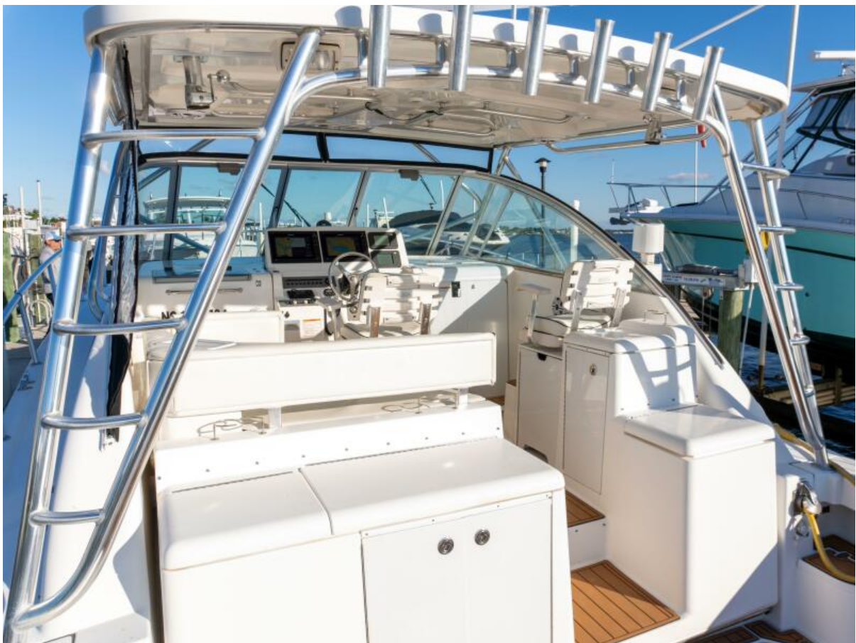
38 Rampage Express Whistle in the Sky- Cockpit 2007 Rampage Express 38 Whistle in the Sky