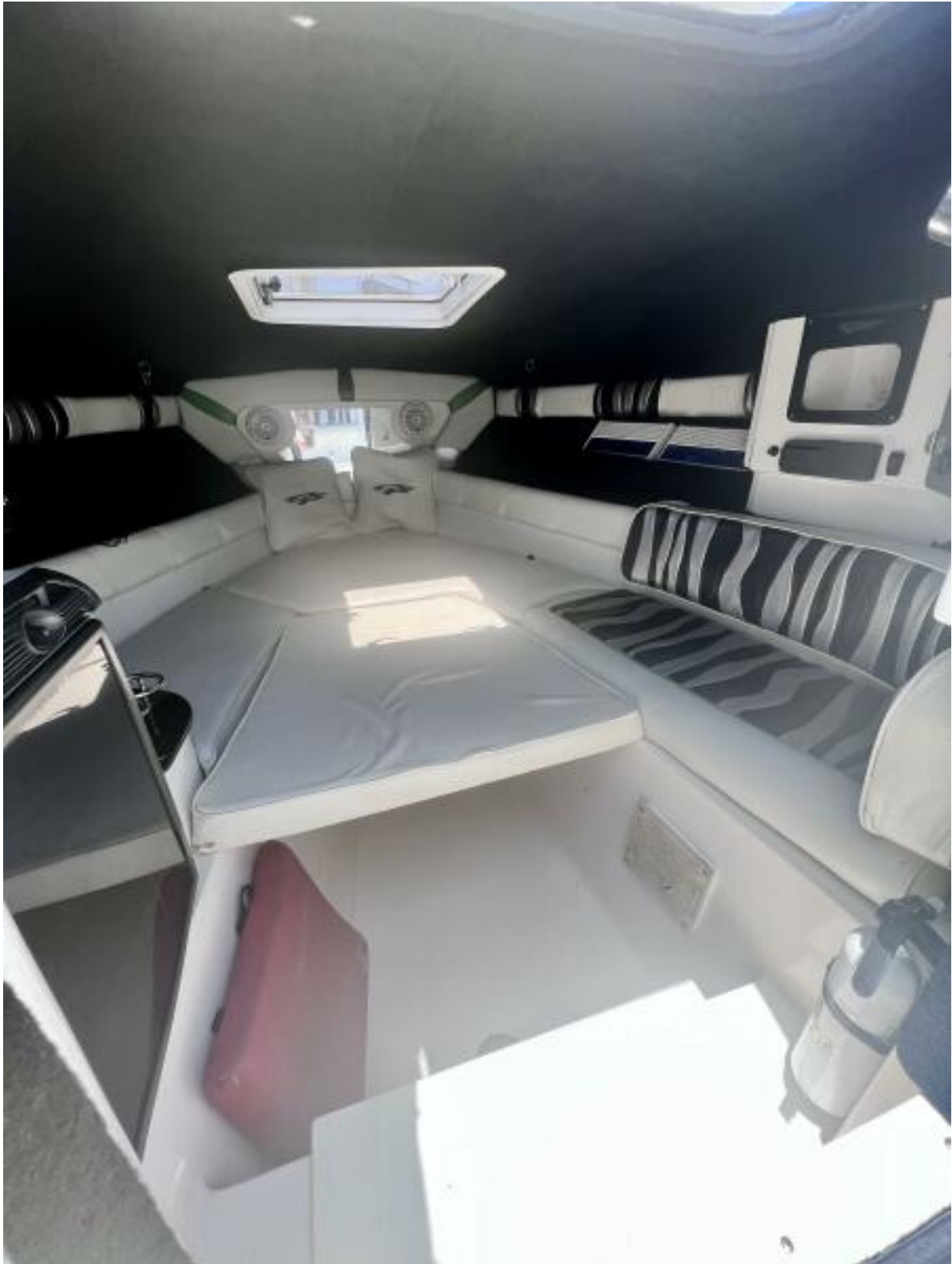
Glasstream 36 Reel Nauti 2010 Glasstream 36 Center Console - Reel Nauti