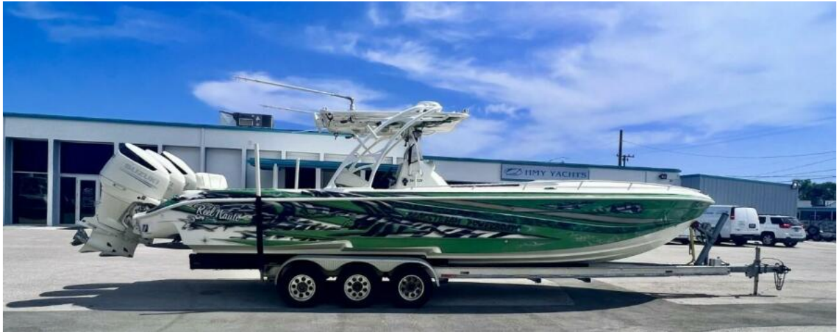
Glasstream 36 Reel Nauti 2010 Glasstream 36 Center Console - Reel Nauti