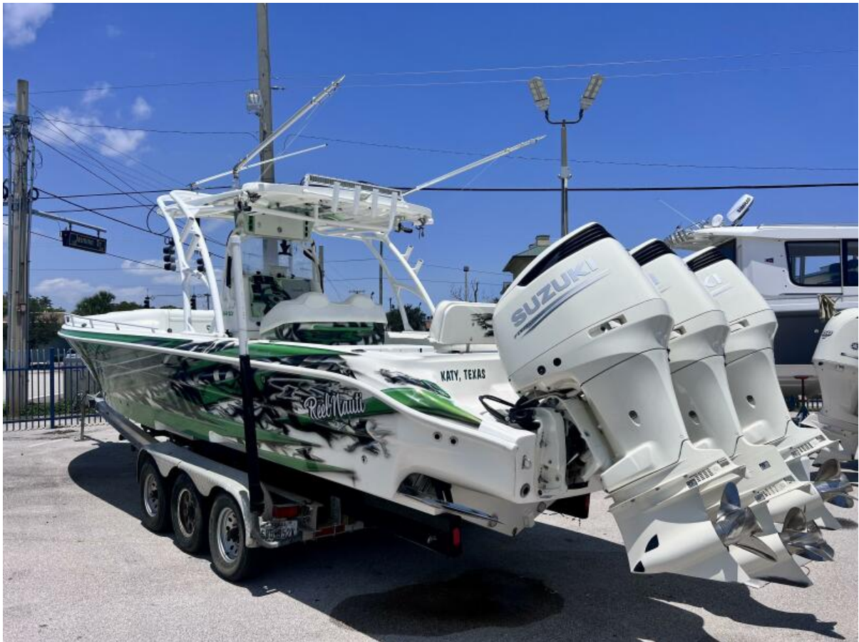
Glasstream 36 Reel Nauti 2010 Glasstream 36 Center Console - Reel Nauti