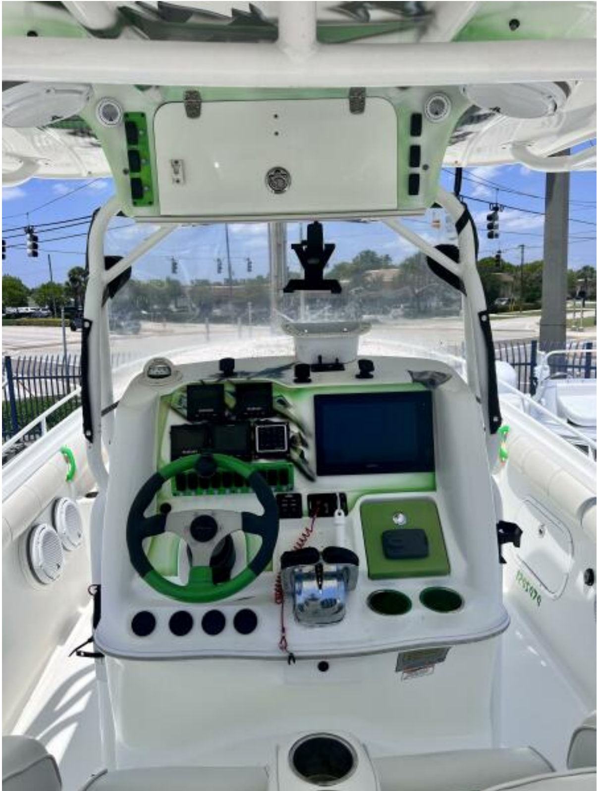
Glasstream 36 Reel Nauti 2010 Glasstream 36 Center Console - Reel Nauti