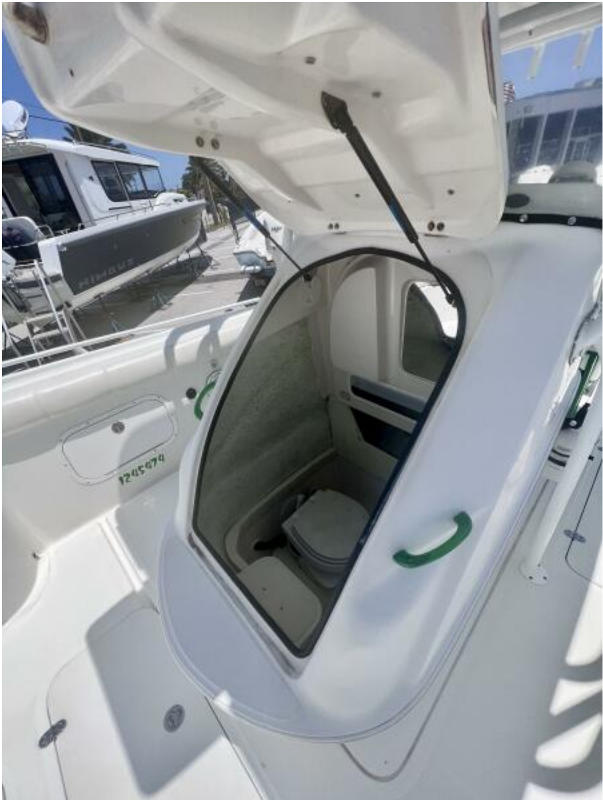
Glasstream 36 Reel Nauti 2010 Glasstream 36 Center Console - Reel Nauti