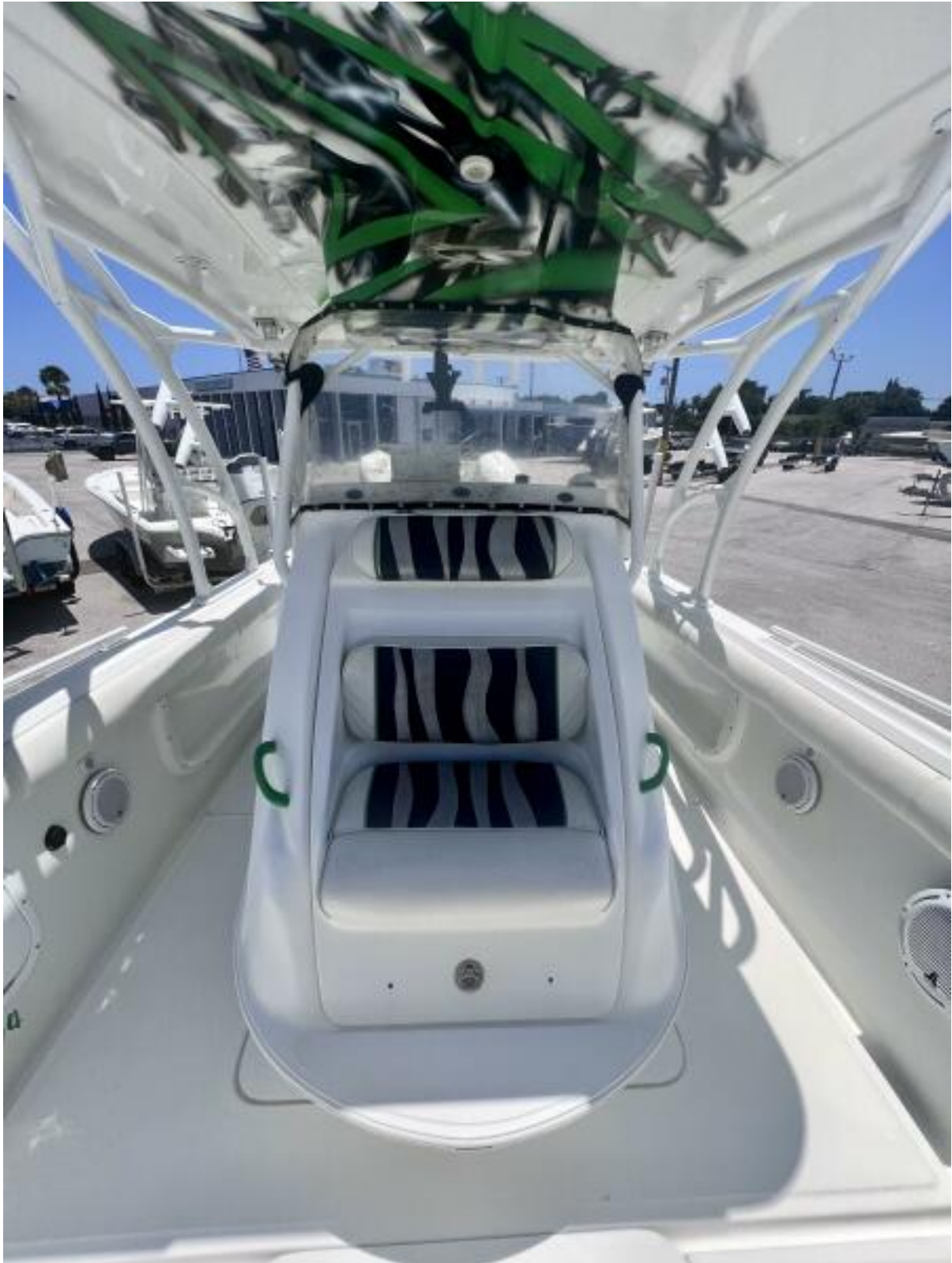
Glasstream 36 Reel Nauti 2010 Glasstream 36 Center Console - Reel Nauti