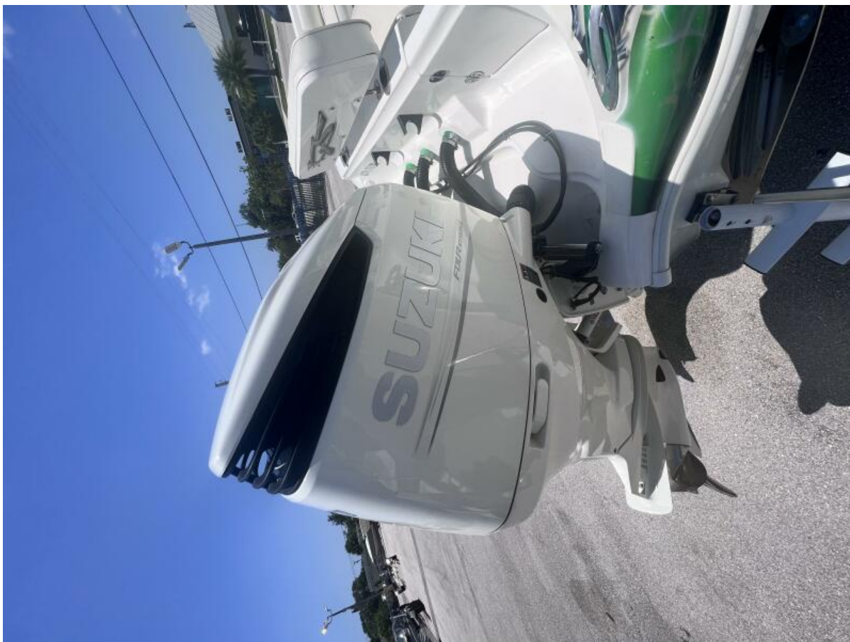
Glasstream 36 Reel Nauti 2010 Glasstream 36 Center Console - Reel Nauti