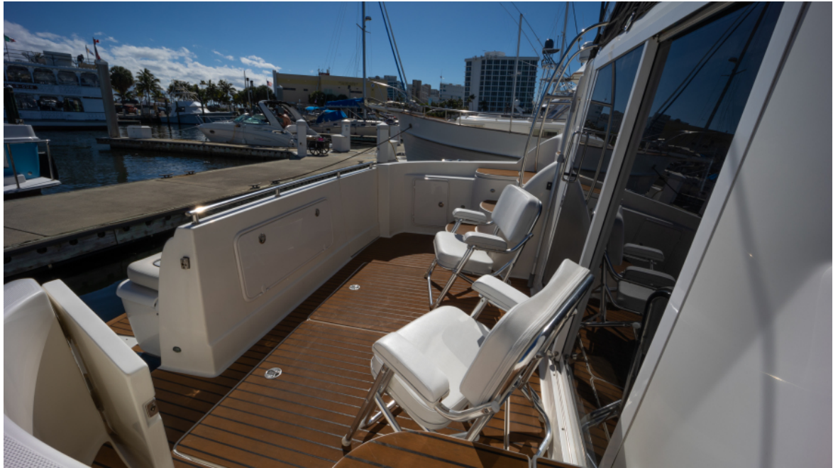
Meridian 45- Swimm eze - Aft Seating 2008 Meridian 45 Motor Yacht - Swimm eze