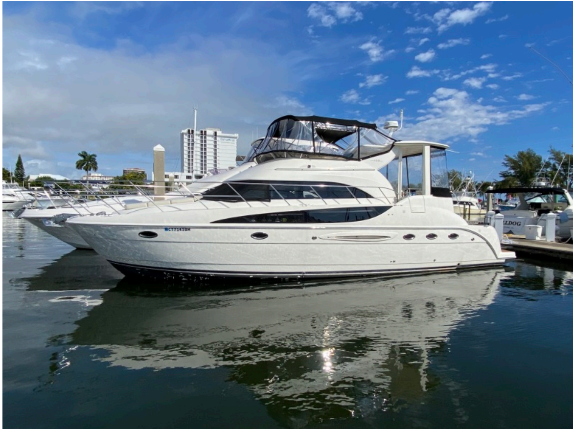
Meridian 45- Swimm eze- Profile 2008 Meridian 45 Motor Yacht - Swimm eze