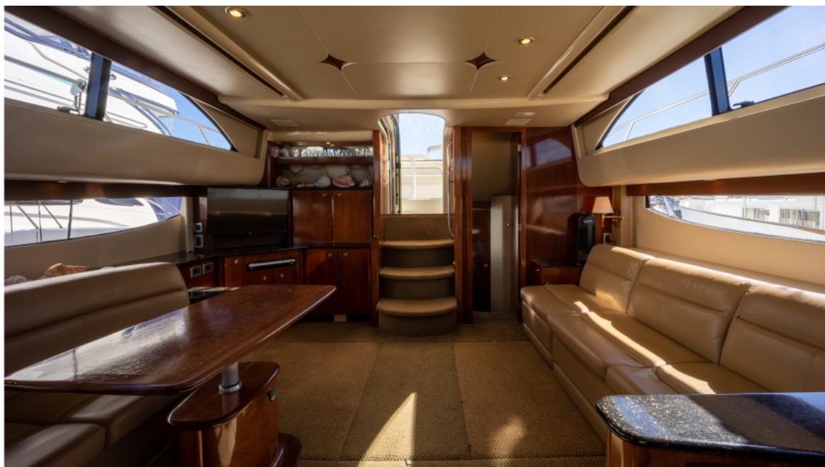
Meridian 45- Swimm eze- Salon Seating 2008 Meridian 45 Motor Yacht - Swimm eze