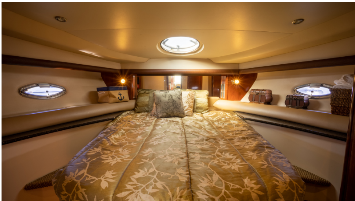
Meridian 45 - Swimm eze - Master Stateroom 2008 Meridian 45 Motor Yacht - Swimm eze