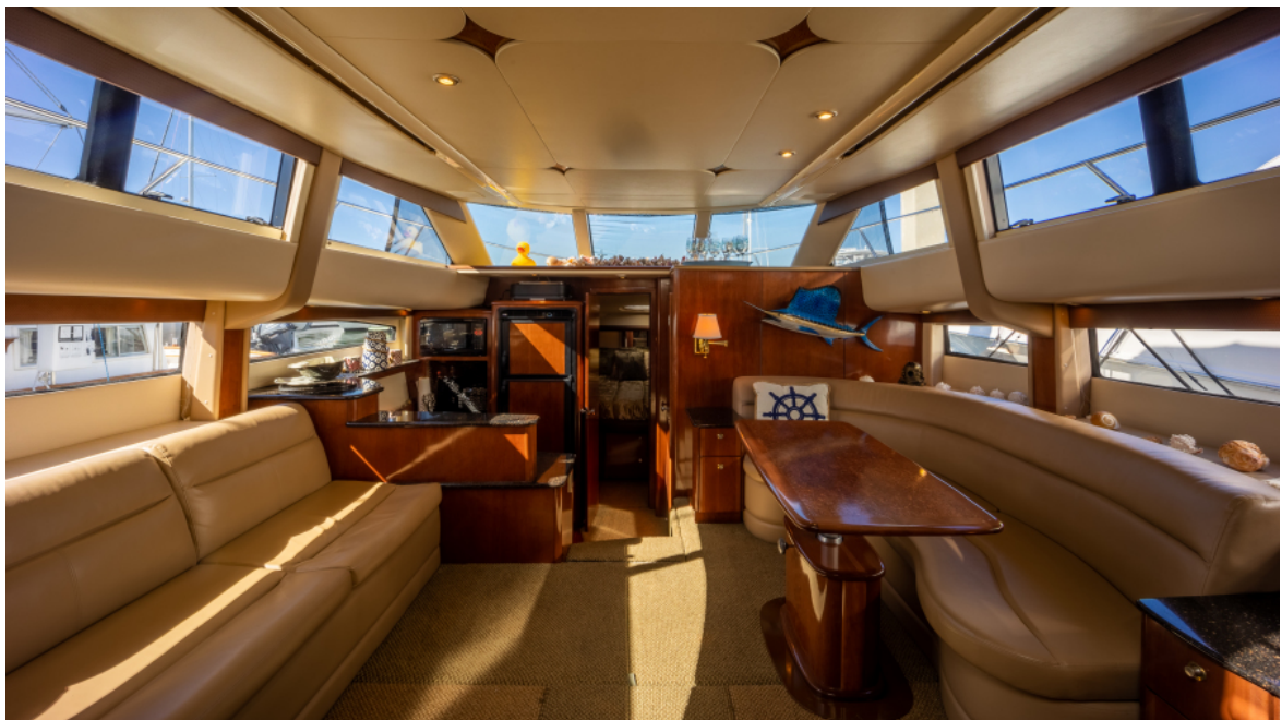
Meridian 45- Swimm eze- Salon Seating 2008 Meridian 45 Motor Yacht - Swimm eze