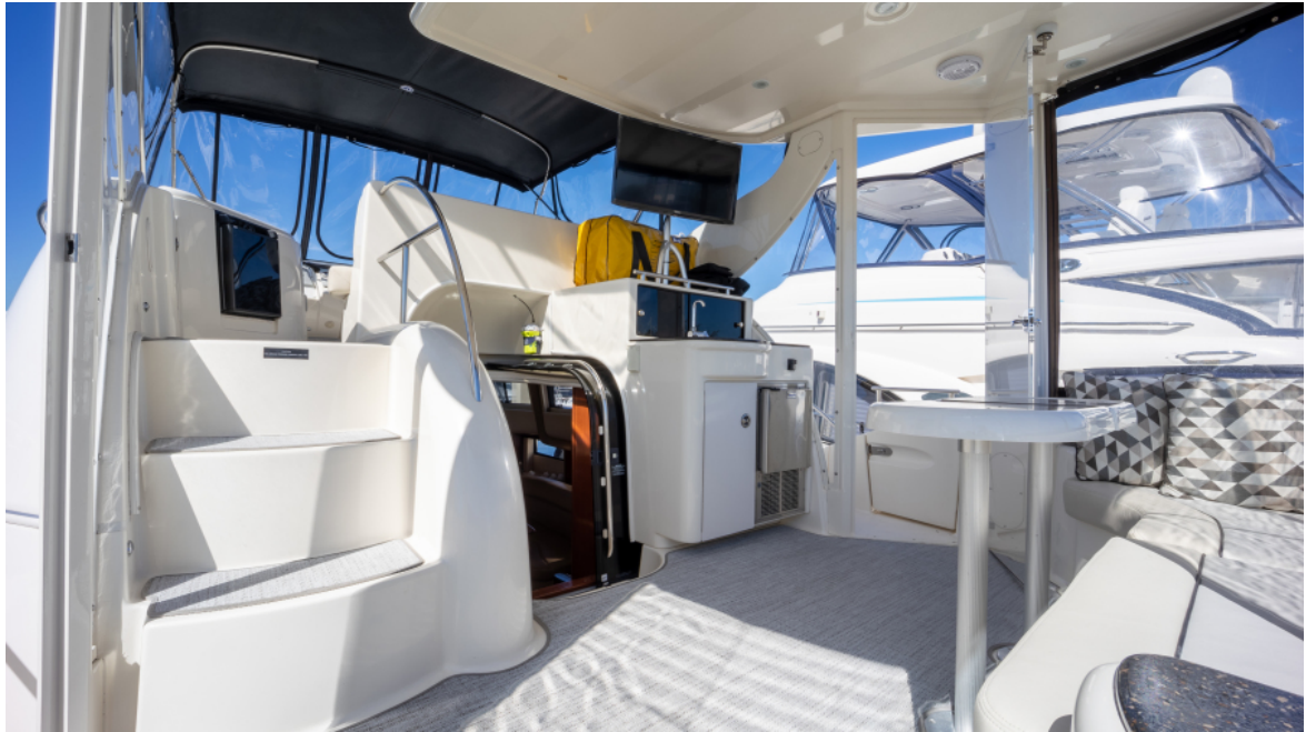
Meridian 45- Swimm eze - Aft seating 2008 Meridian 45 Motor Yacht - Swimm eze