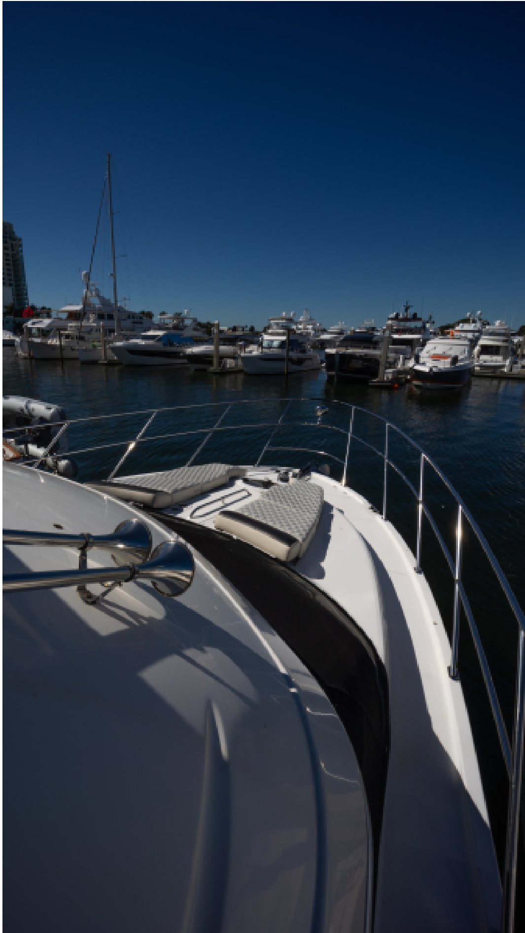
Meridian 45- Schwimm eze Starboard Bow 2008 Meridian 45 Motor Yacht - Schwimm eze