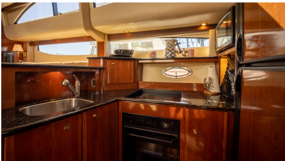
Meridian 45 - Swimm eze - Galley 2008 Meridian 45 Motor Yacht - Swimm eze