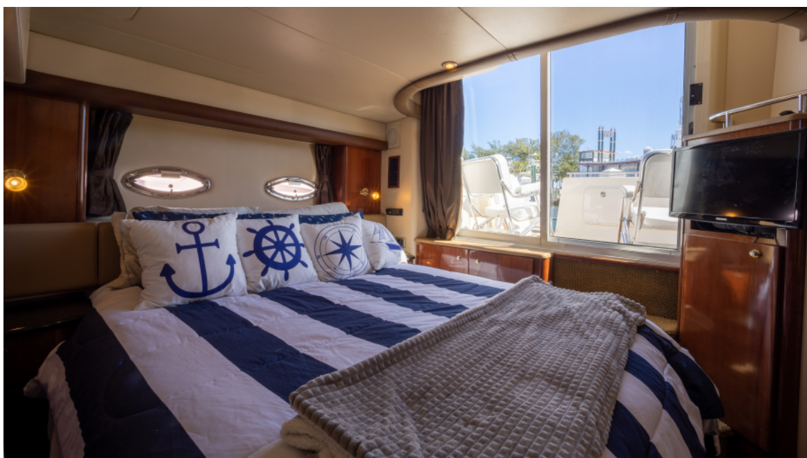
Meridian 45- Swimm eze - Stateroom 2008 Meridian 45 Motor Yacht - Swimm eze