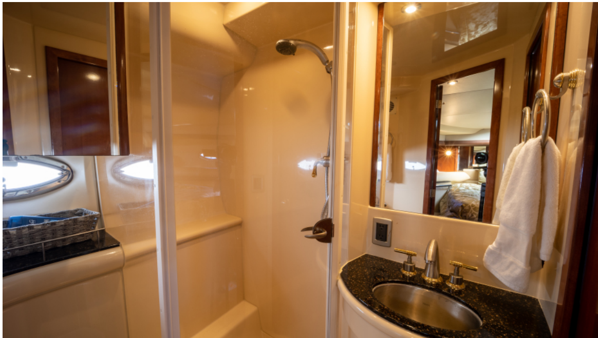
Meridian 45- Swimm eze - Head 2008 Meridian 45 Motor Yacht - Swimm eze