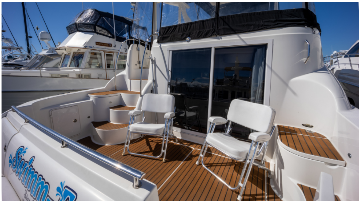
Meridian 45- Swimm eze- Aft Seating 2008 Meridian 45 Motor Yacht - Swimm eze