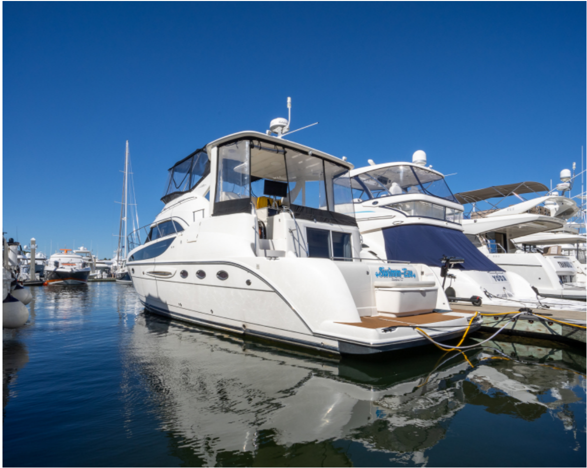
Meridian 45- Swimm eze- Profile 2008 Meridian 45 Motor Yacht - Swimm eze