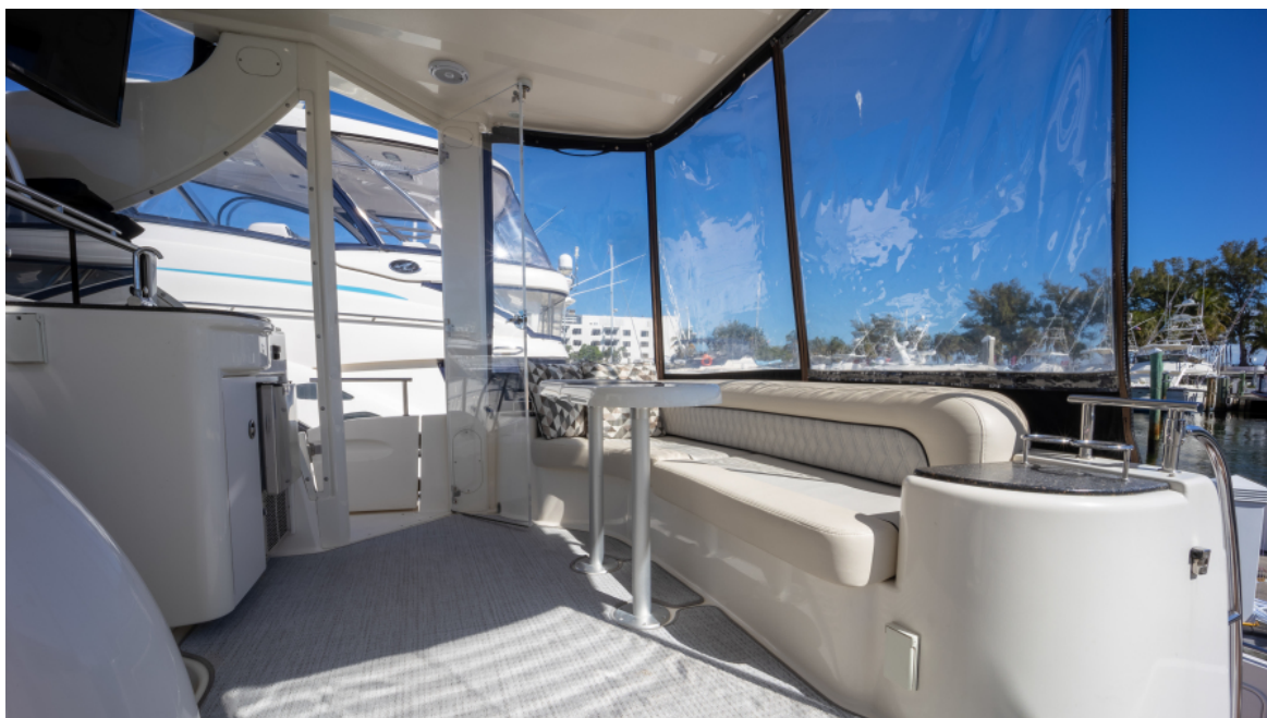
Meridian 45- Swimmeze -Aft seating 2008 Meridian 45 Motor Yacht - Swimm eze