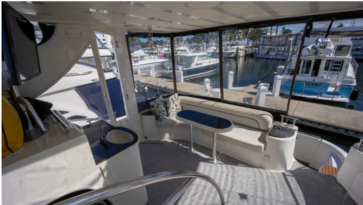
Meridian 45- Swimm eze -Aft seating 2008 Meridian 45 Motor Yacht - Swimm eze