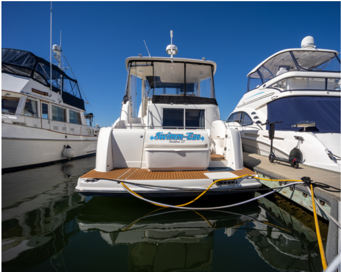
Meridian 45- Swimm eze- Stern Profile 2008 Meridian 45 Motor Yacht - Swimm eze