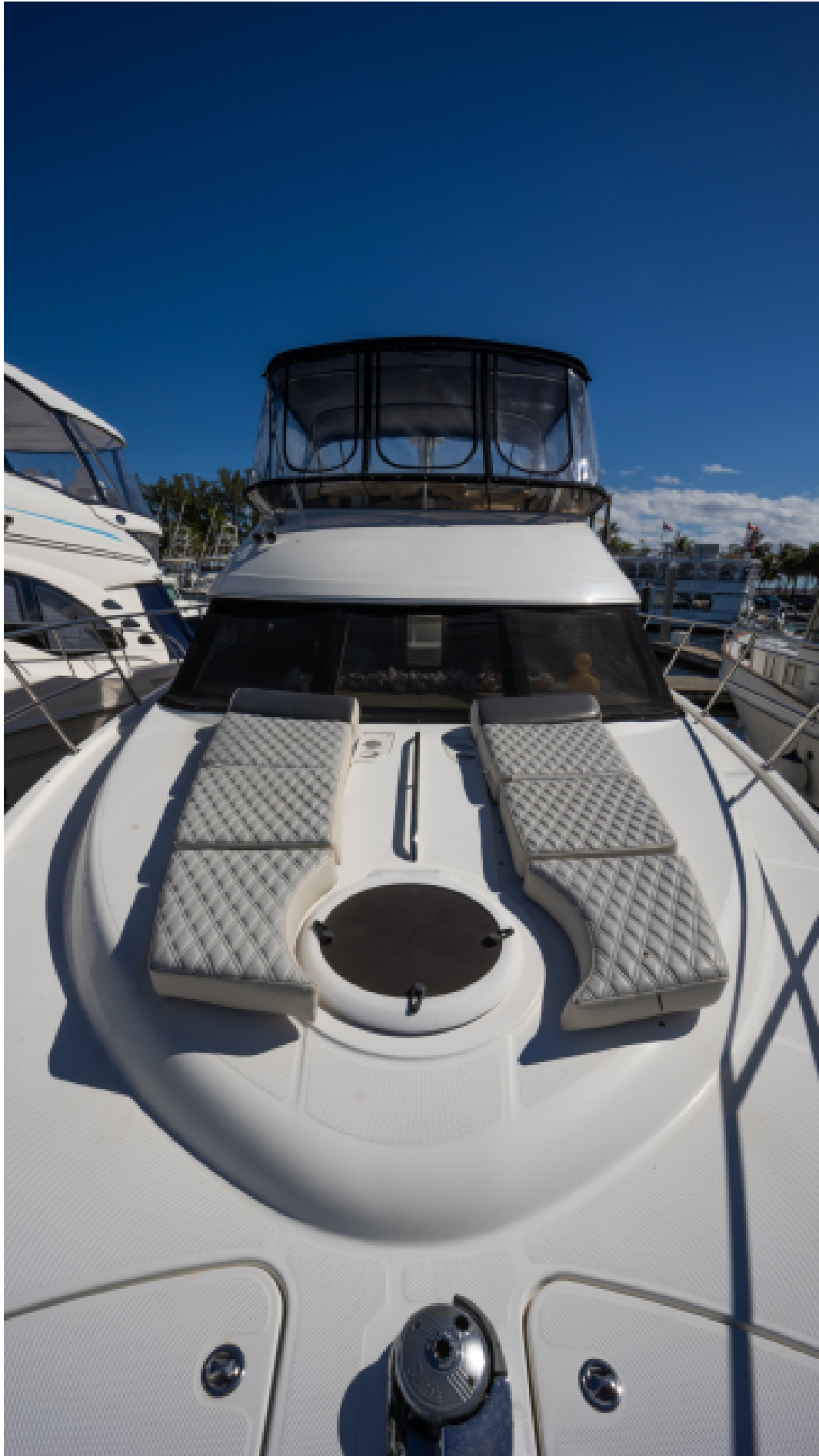
Meridian 45- Swimm eze- Bow Sun Pad 2008 Meridian 45 Motor Yacht - Swimm eze