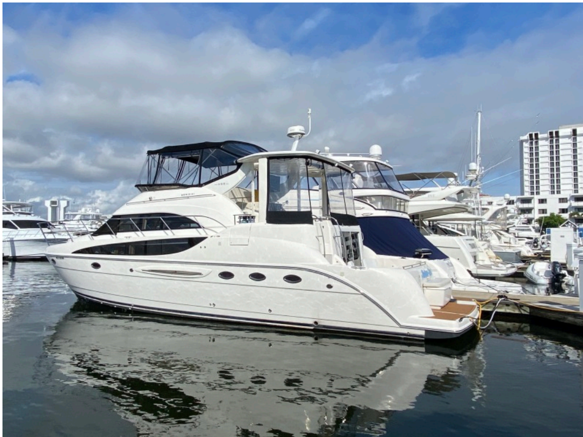
Meridian 45- Swimm eze- Port Profile 2008 Meridian 45 Motor Yacht - Swimm eze