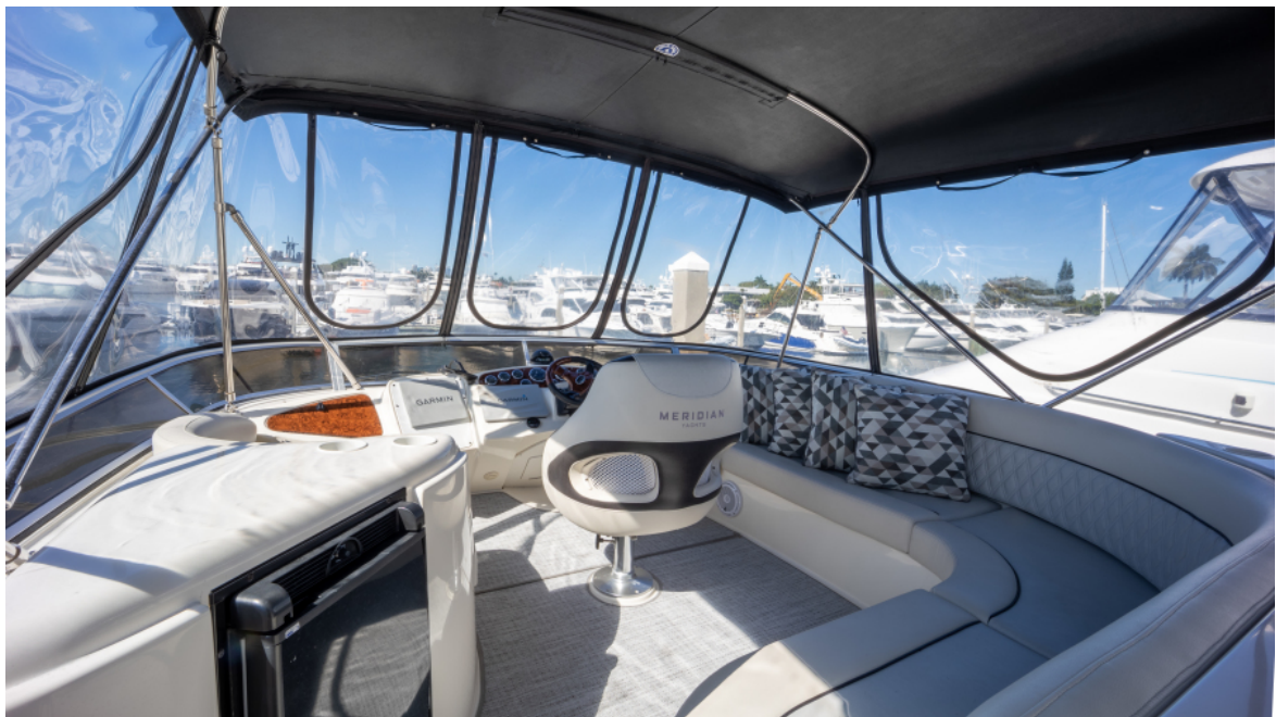
Meridian 45- Swimm eze - Helm seating 2008 Meridian 45 Motor Yacht - Swimm eze