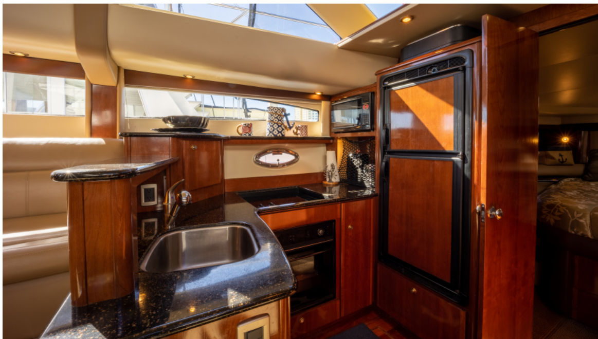
Meridian 45 - Swimm eze - Galley 2008 Meridian 45 Motor Yacht - Swimm eze