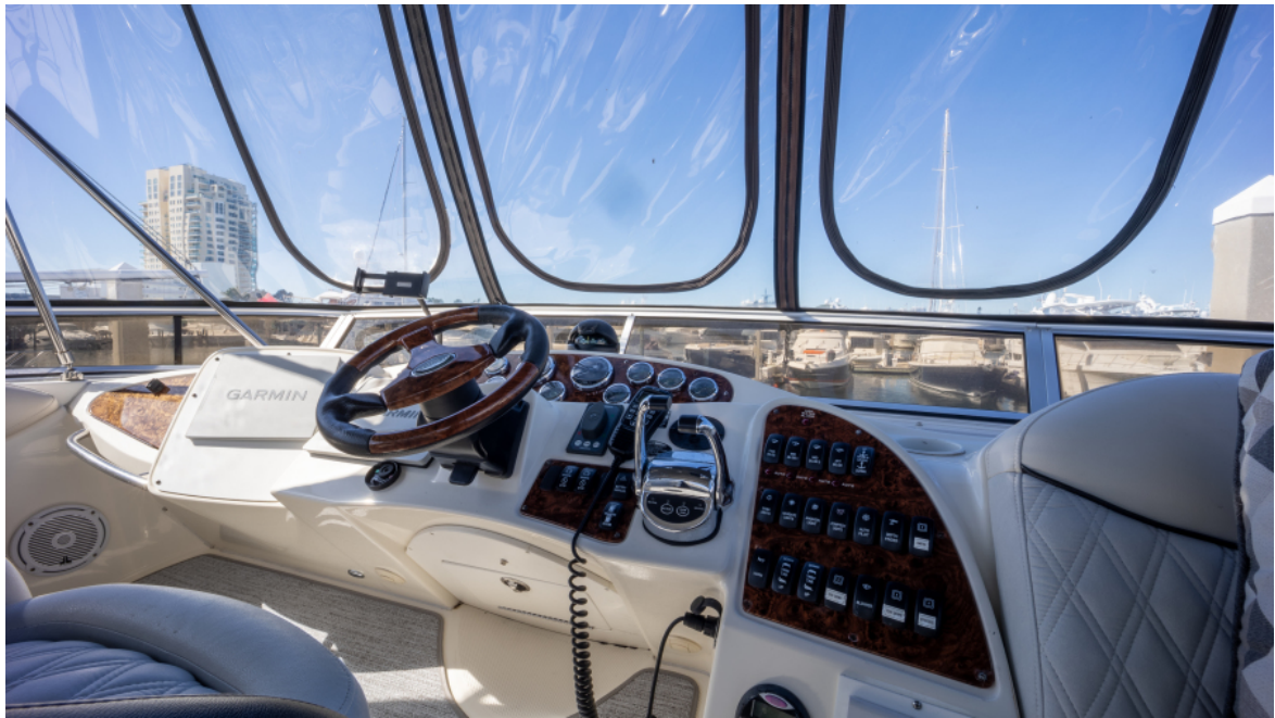
Meridian 45- Swimm eze- Helm 2008 Meridian 45 Motor Yacht - Swimm eze