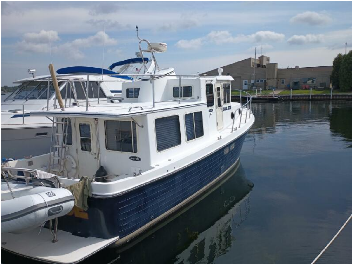
2002 American Tug 34