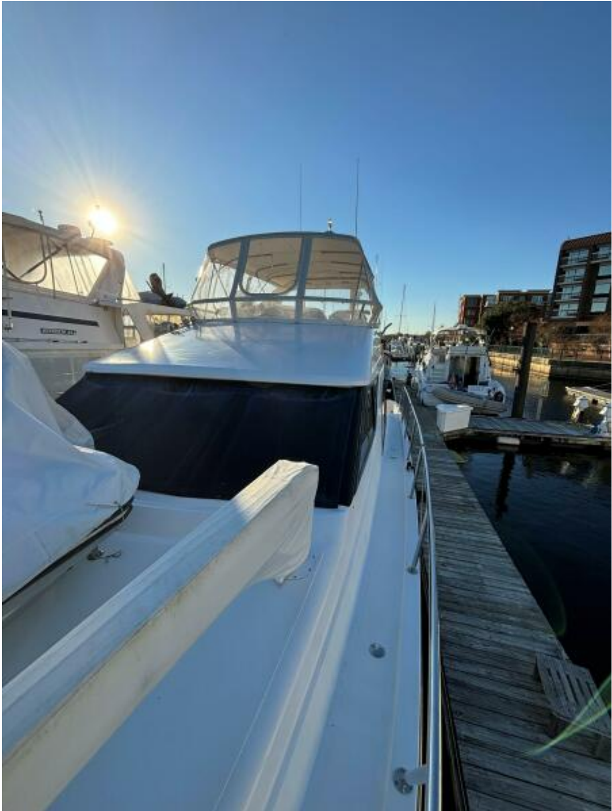
Port Bow Davit