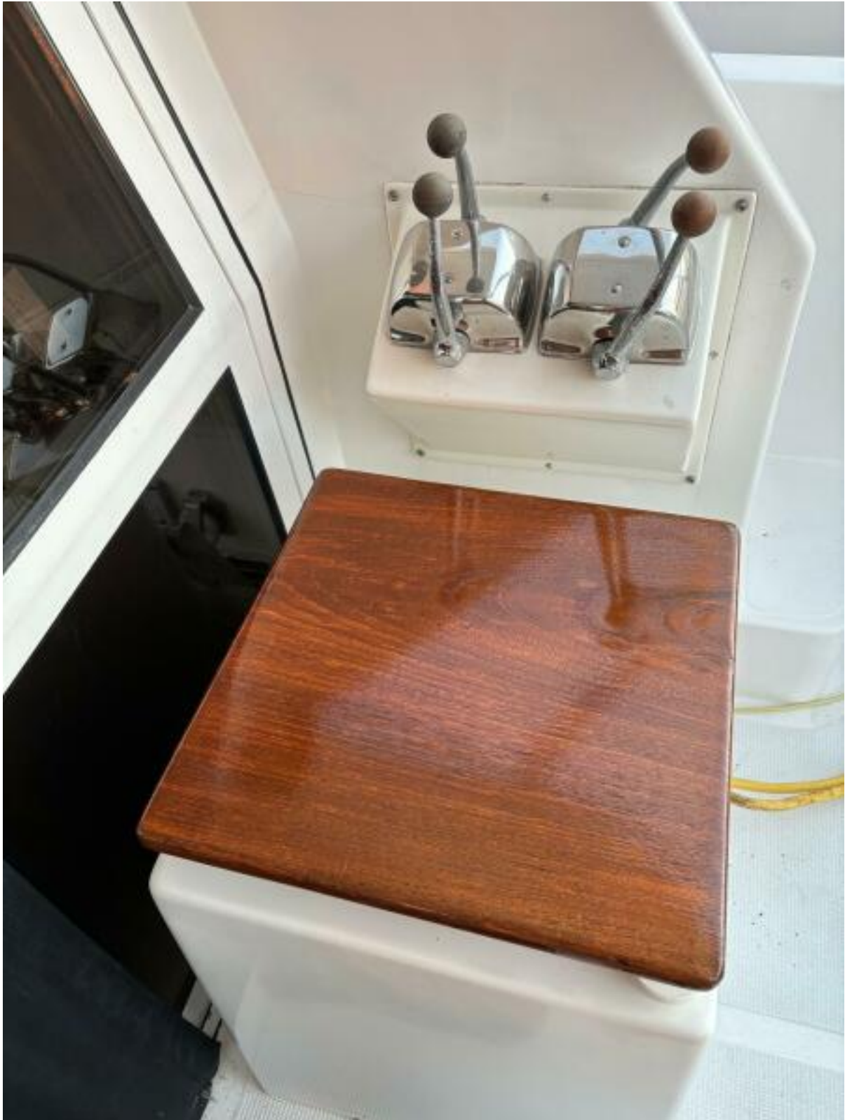
Aft Cockpit Controls