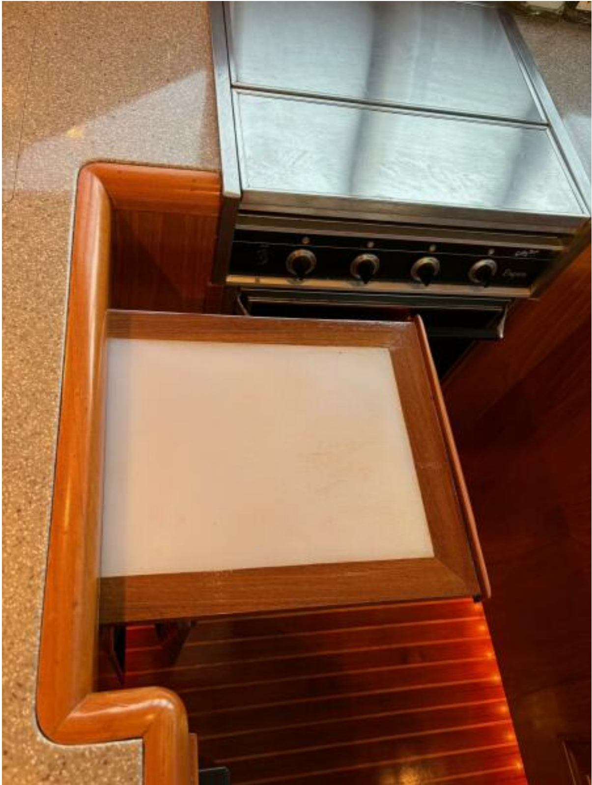
Cutting Board Workspace