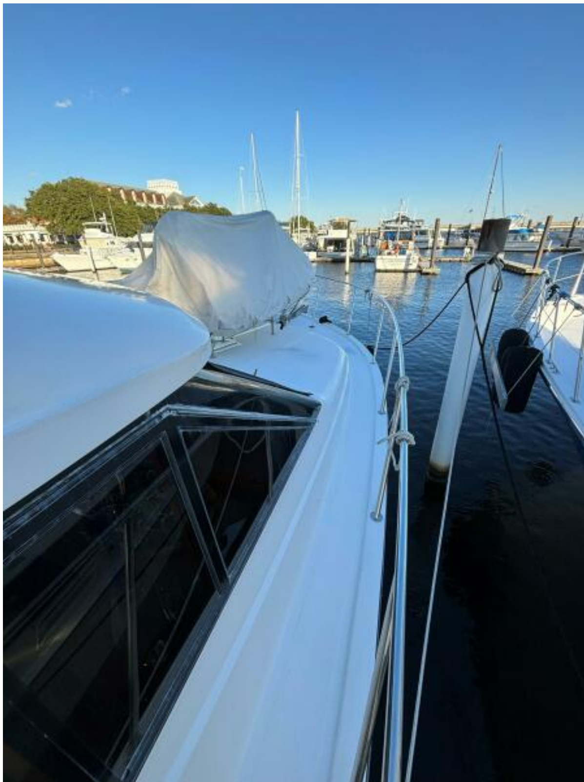
Stbd Bow Tender