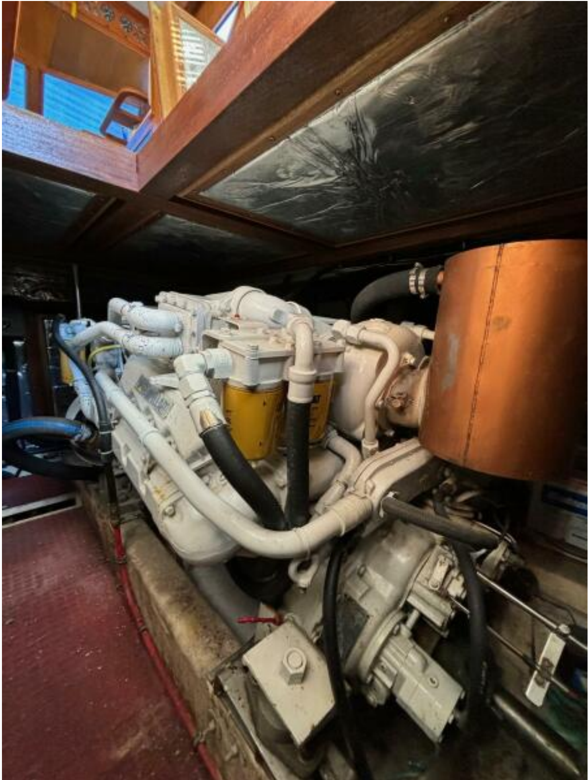
Stbd End Aft