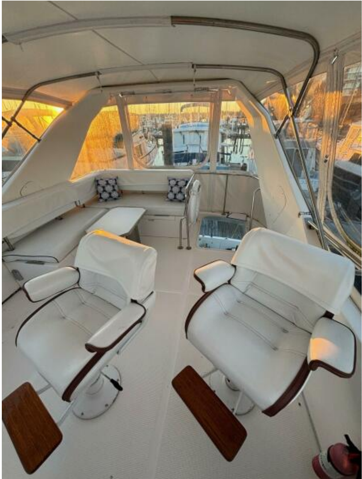
Flybridge Lounge Facing Aft