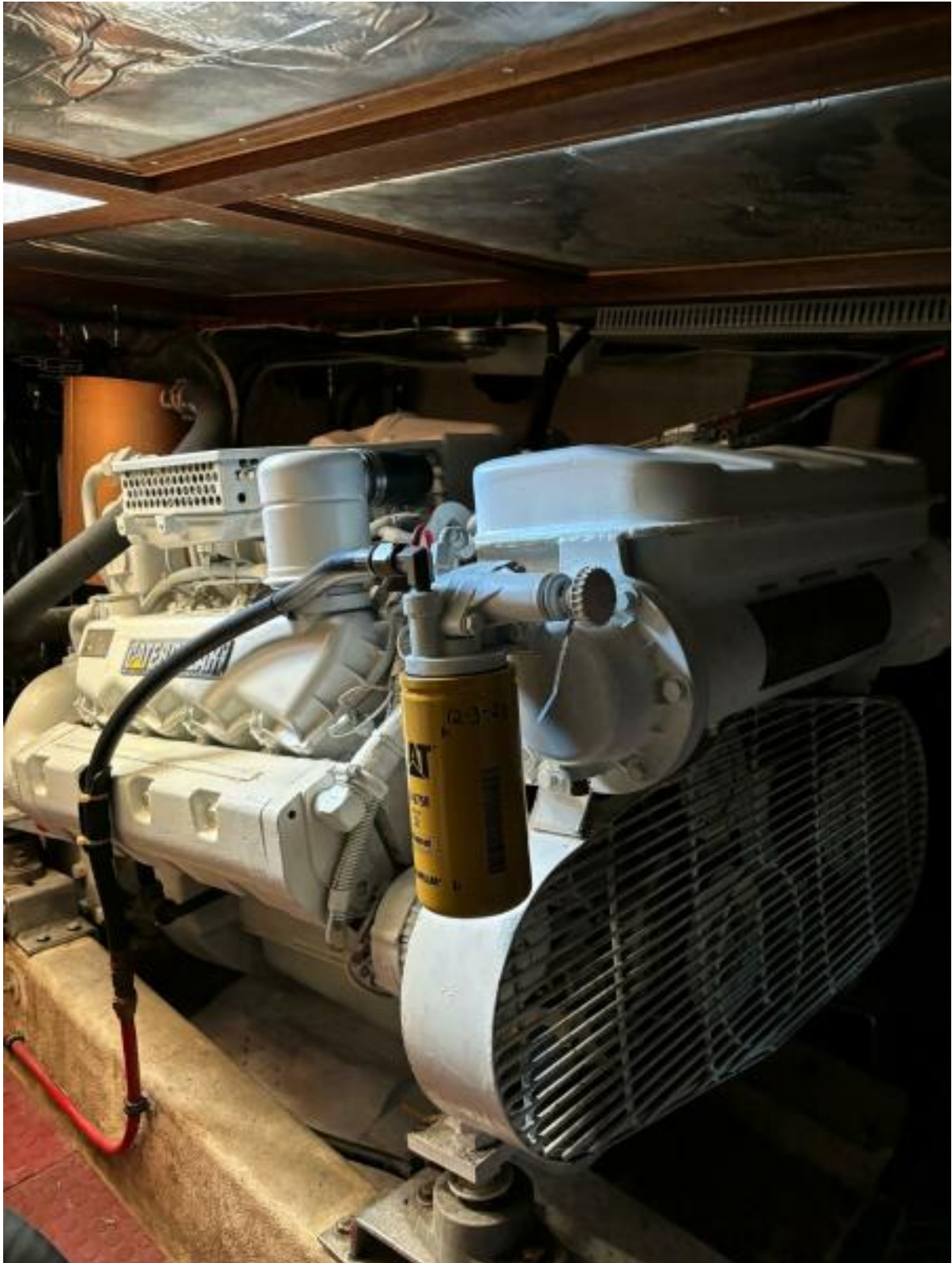
Port Eng Fwd