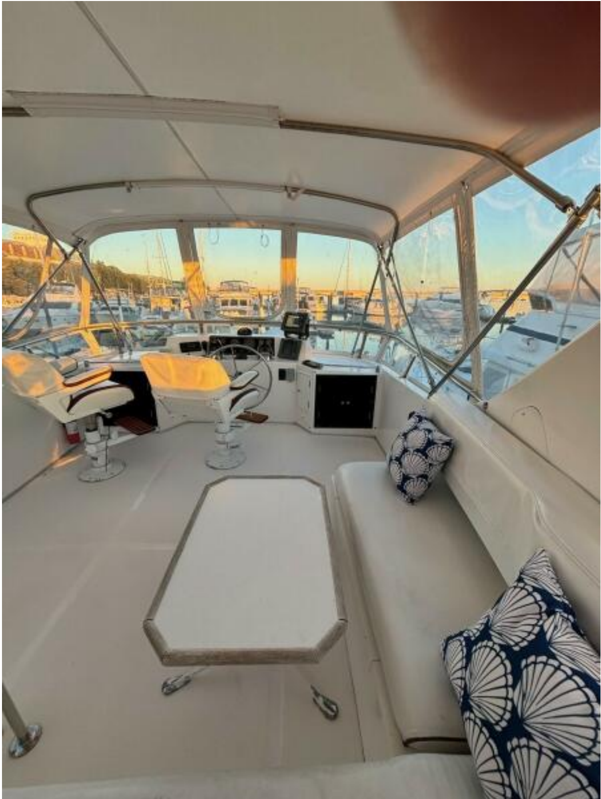
Flybridge Lounge Area