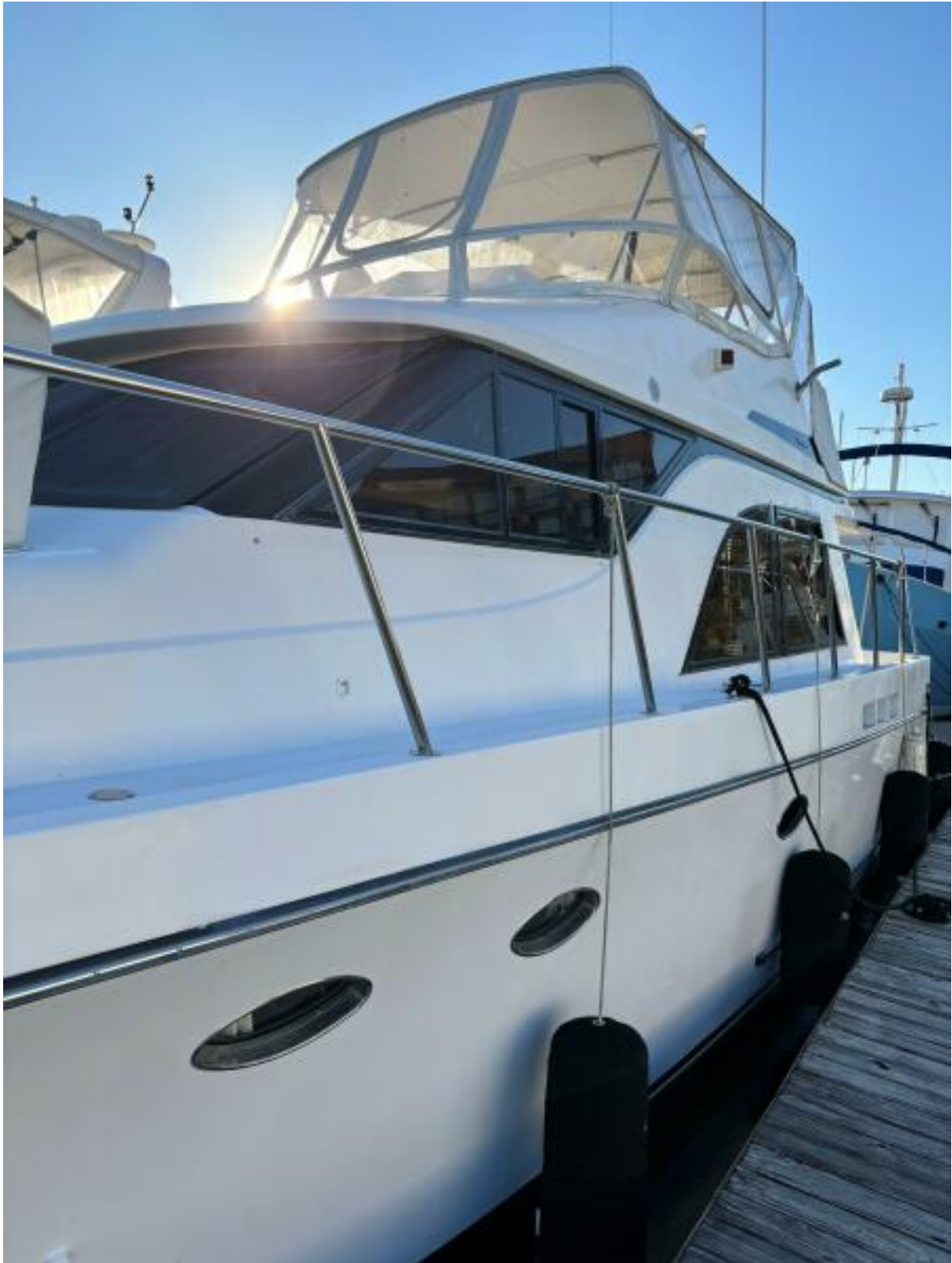
Port Side Flybridge