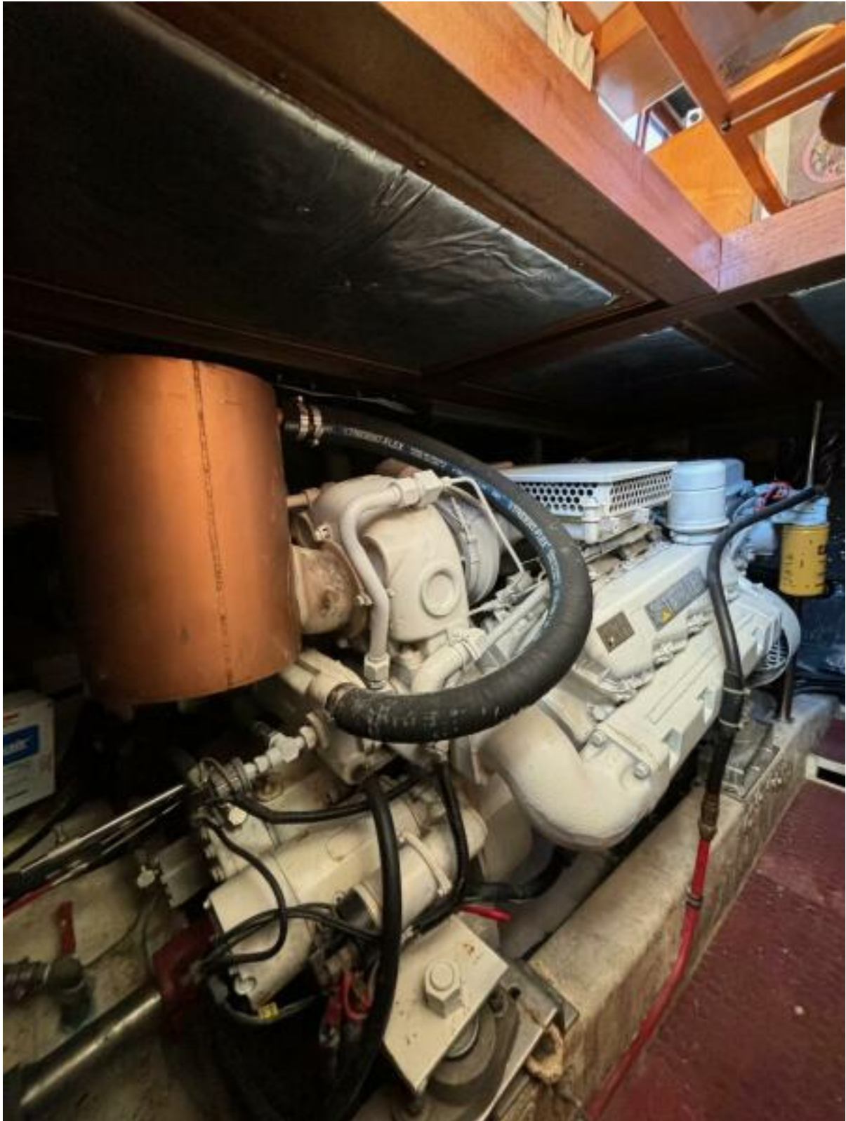
Port Eng Aft