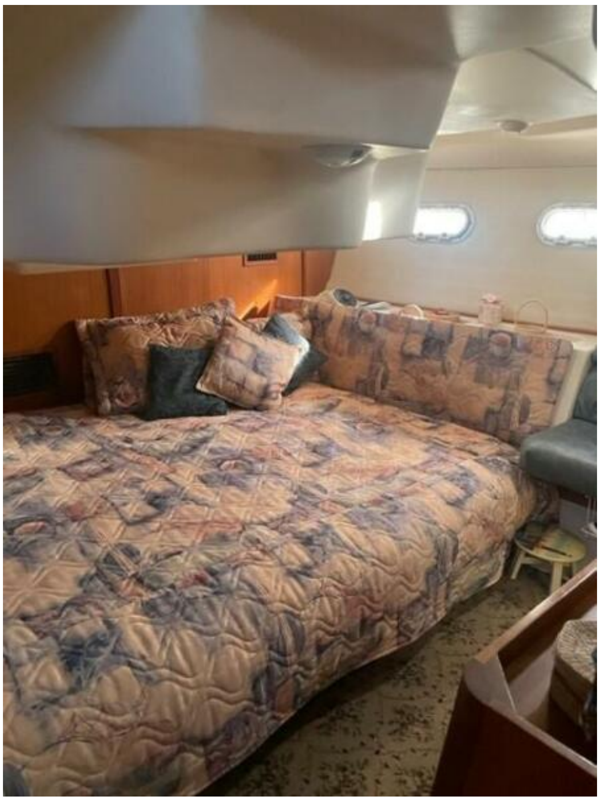
Port side Art Cab