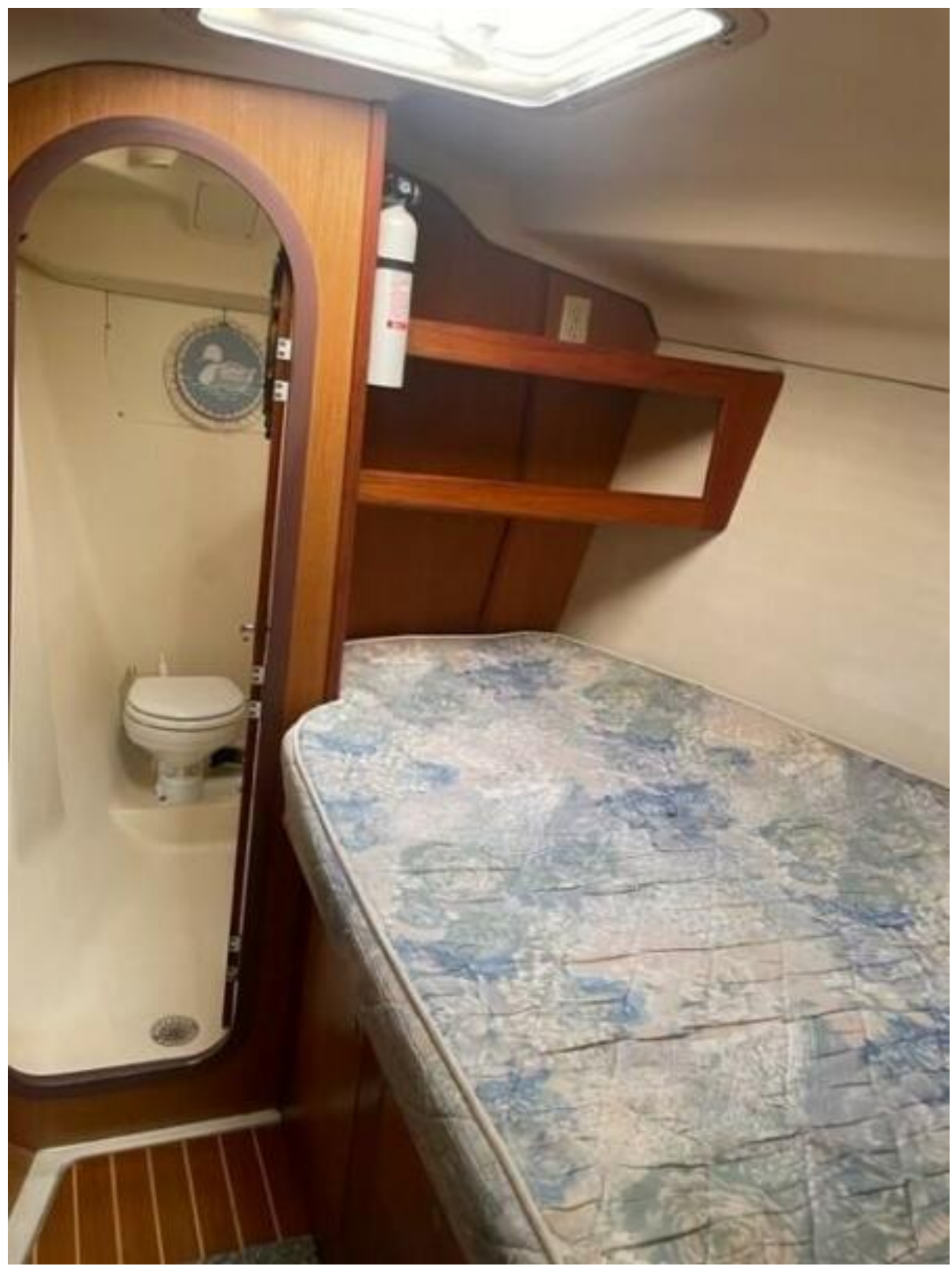
Forward Berth into Head