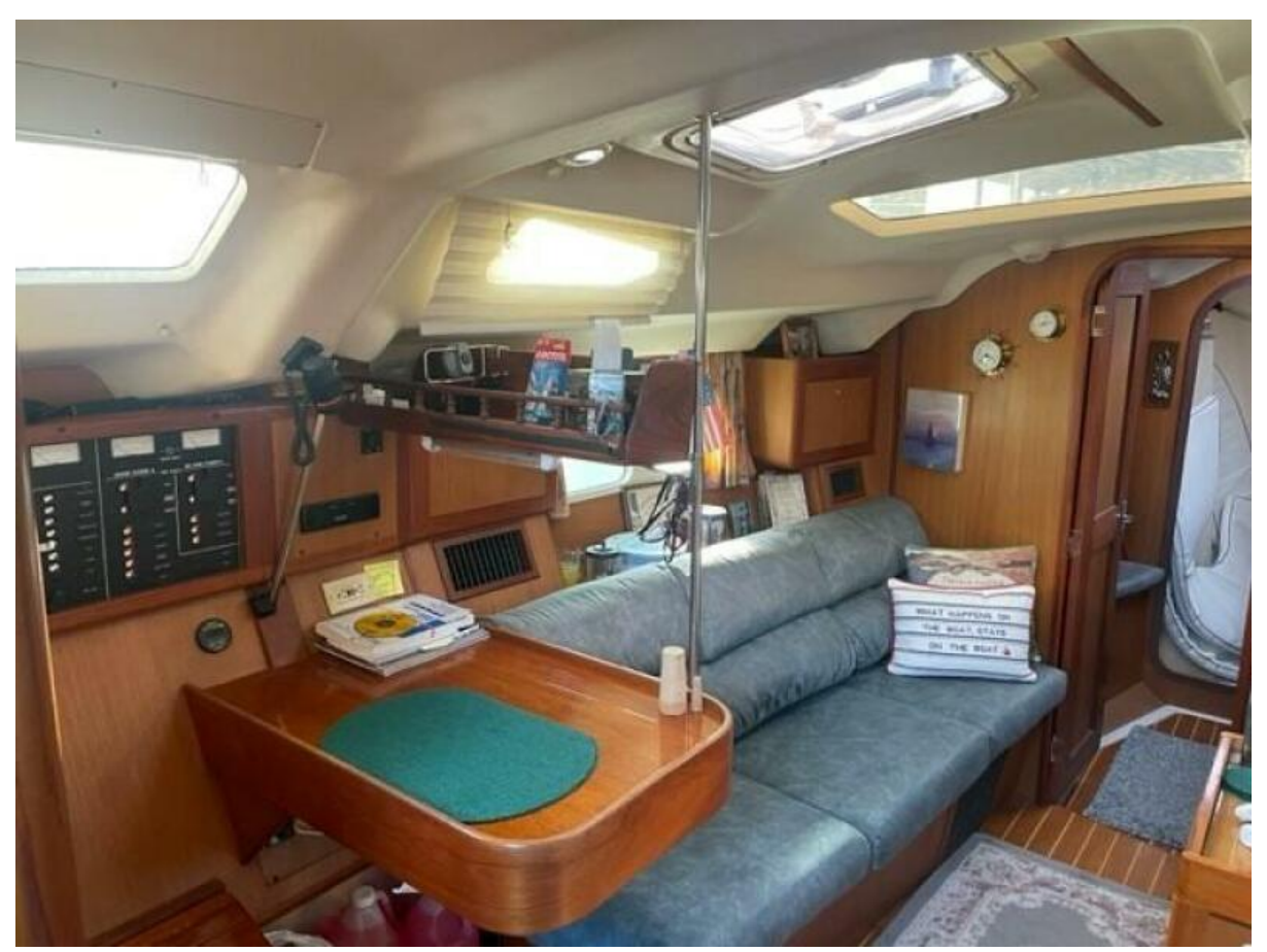
Port Side Saloon