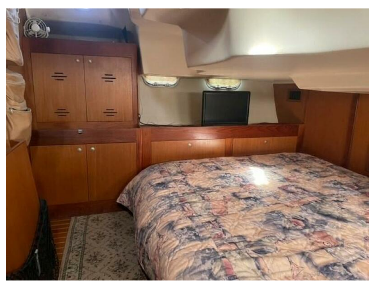
Strbrd Side Aft Cab