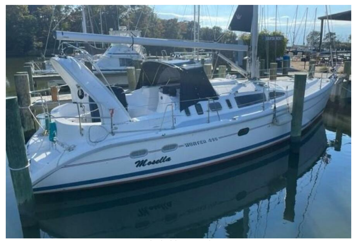
Strbrd Side at Dock