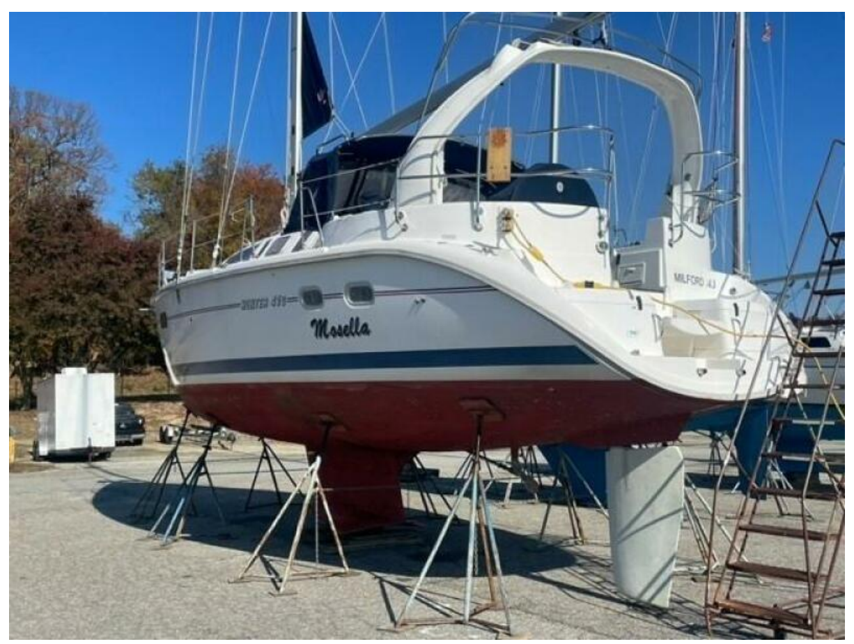
Port Side on Land