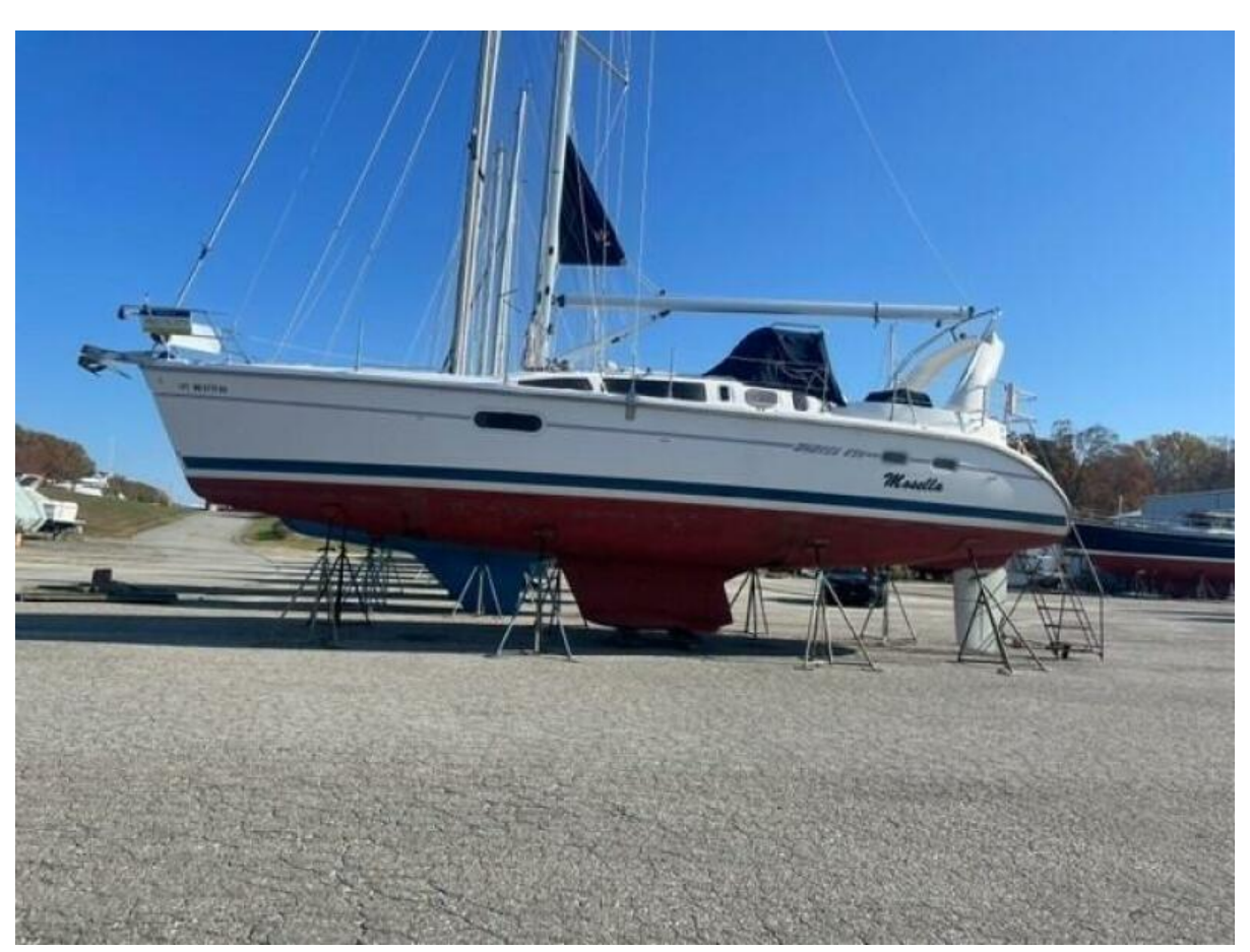
On Land Winter Storage