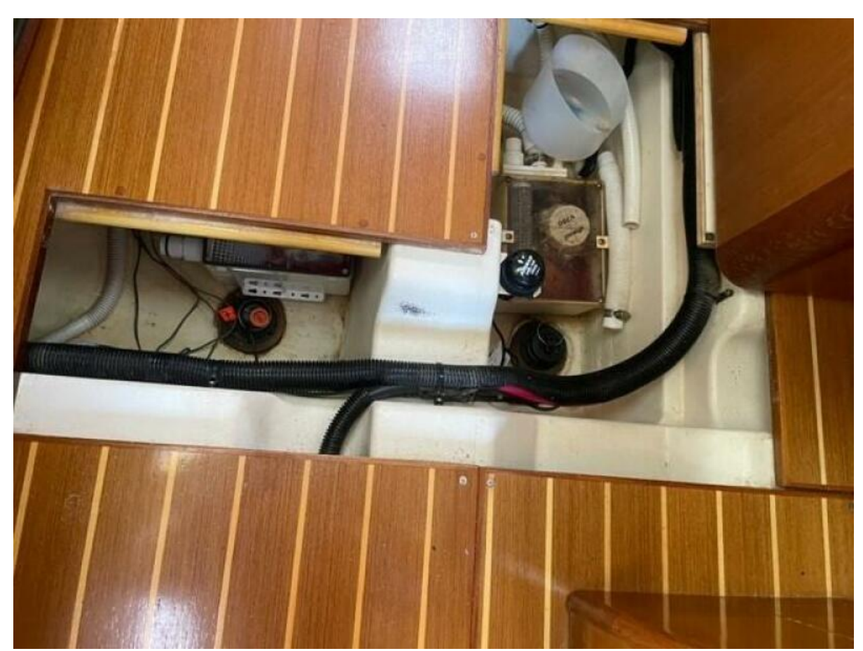
Sole & Bilge