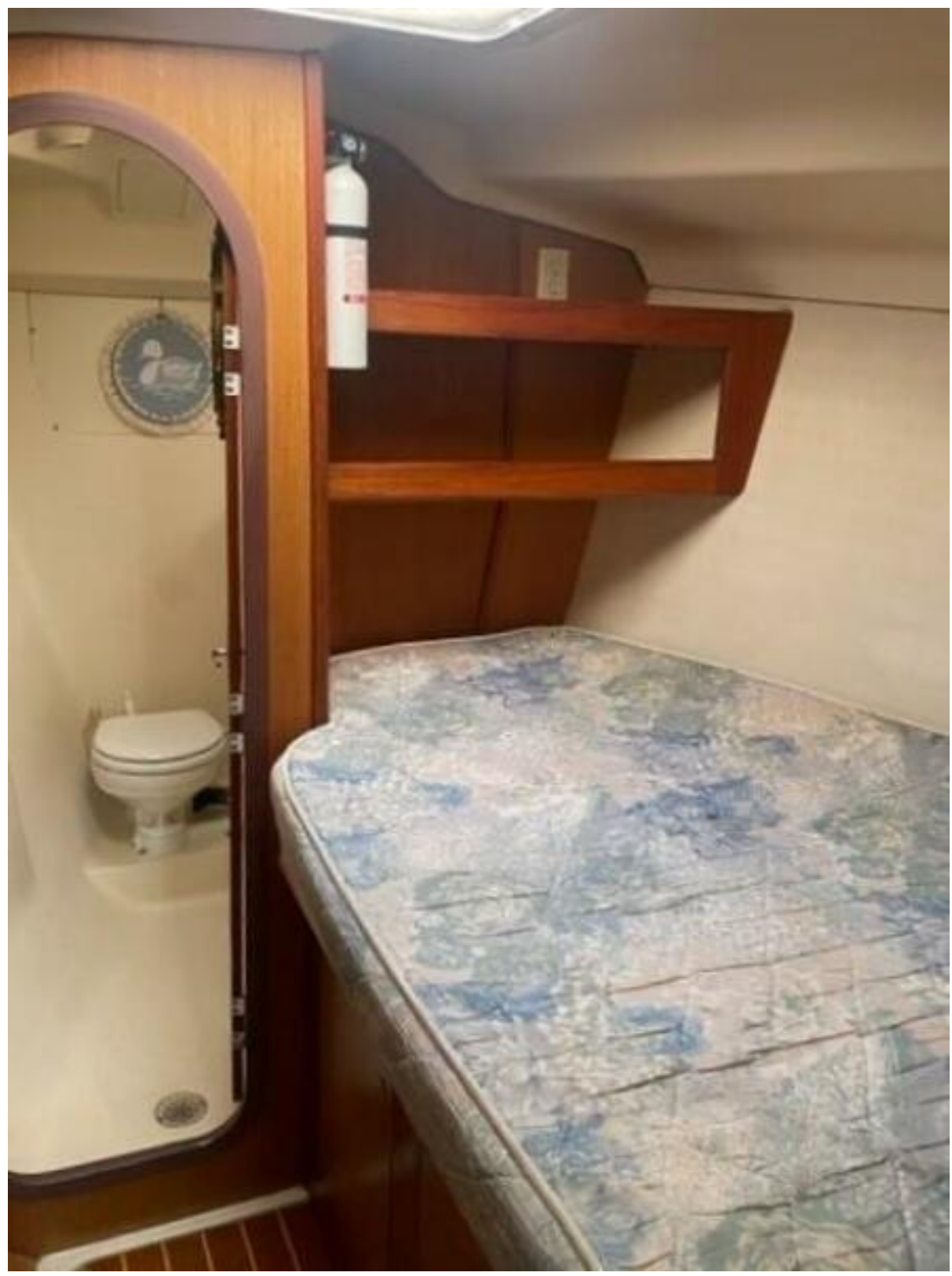
frwrd Berth into Head