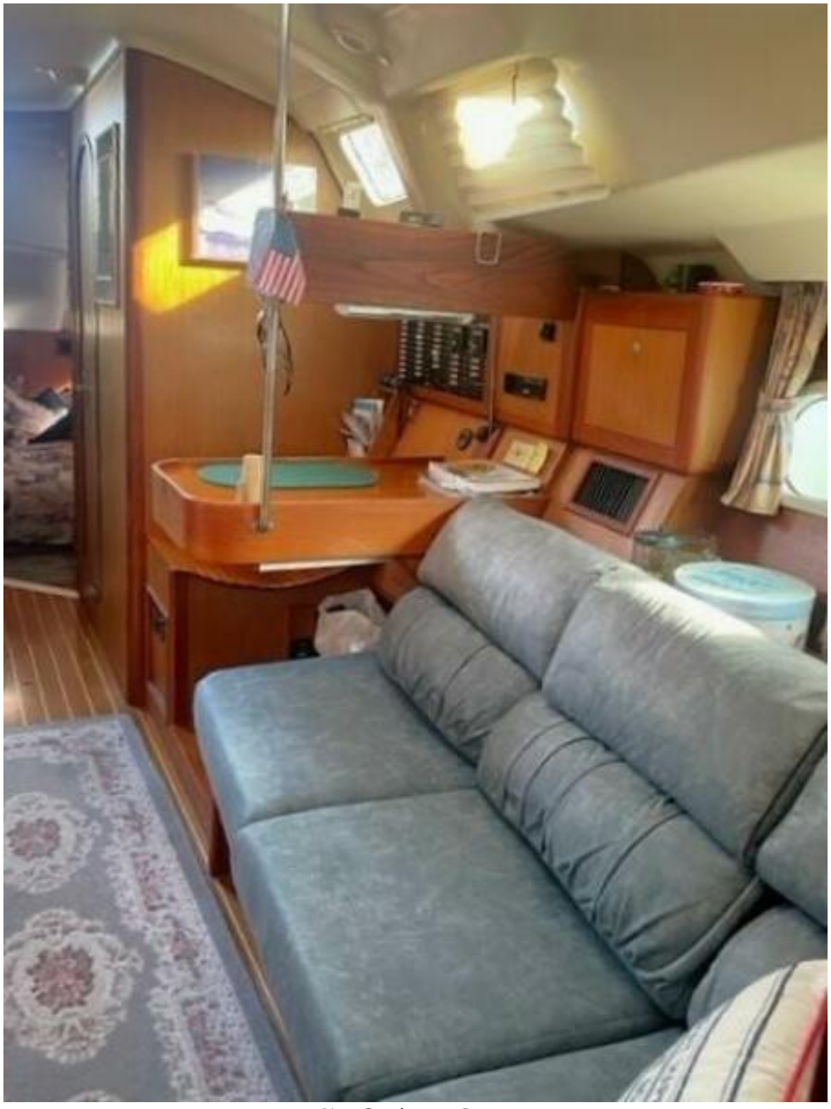
Nav Station on Port