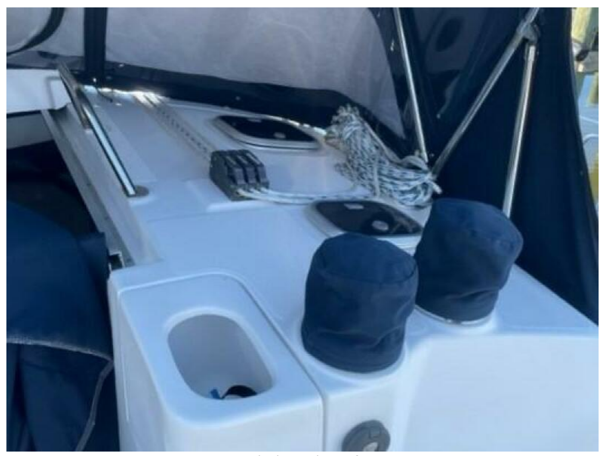
Strbrd Coach Roof