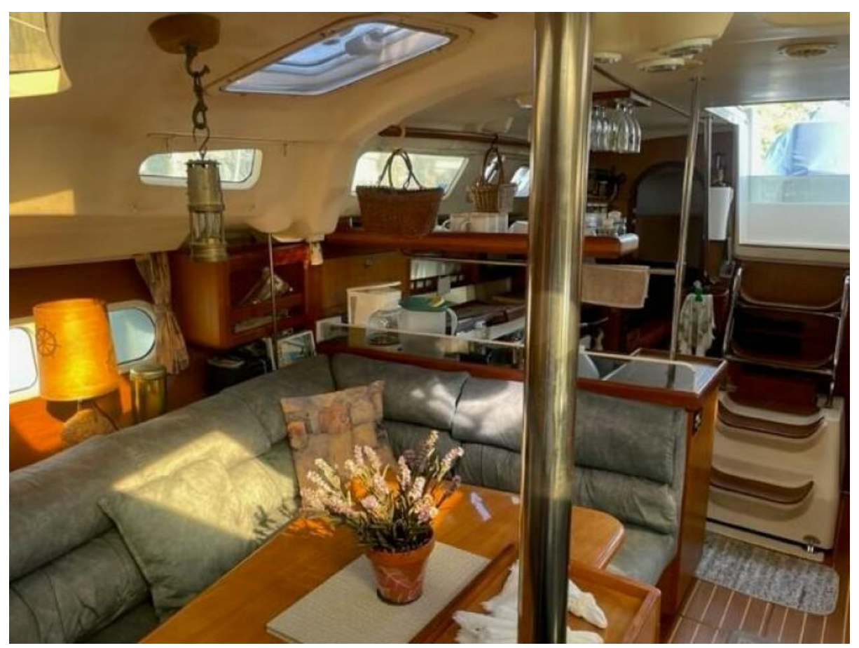
Looking Aft on Port