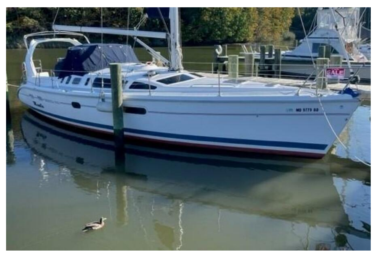
Starboard Hull at Dock