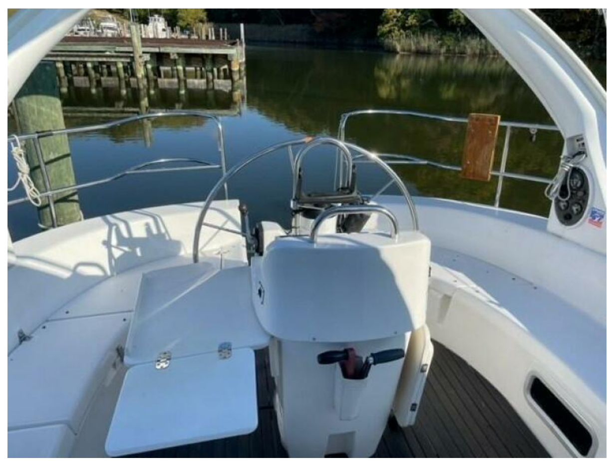
Binnacle and Table