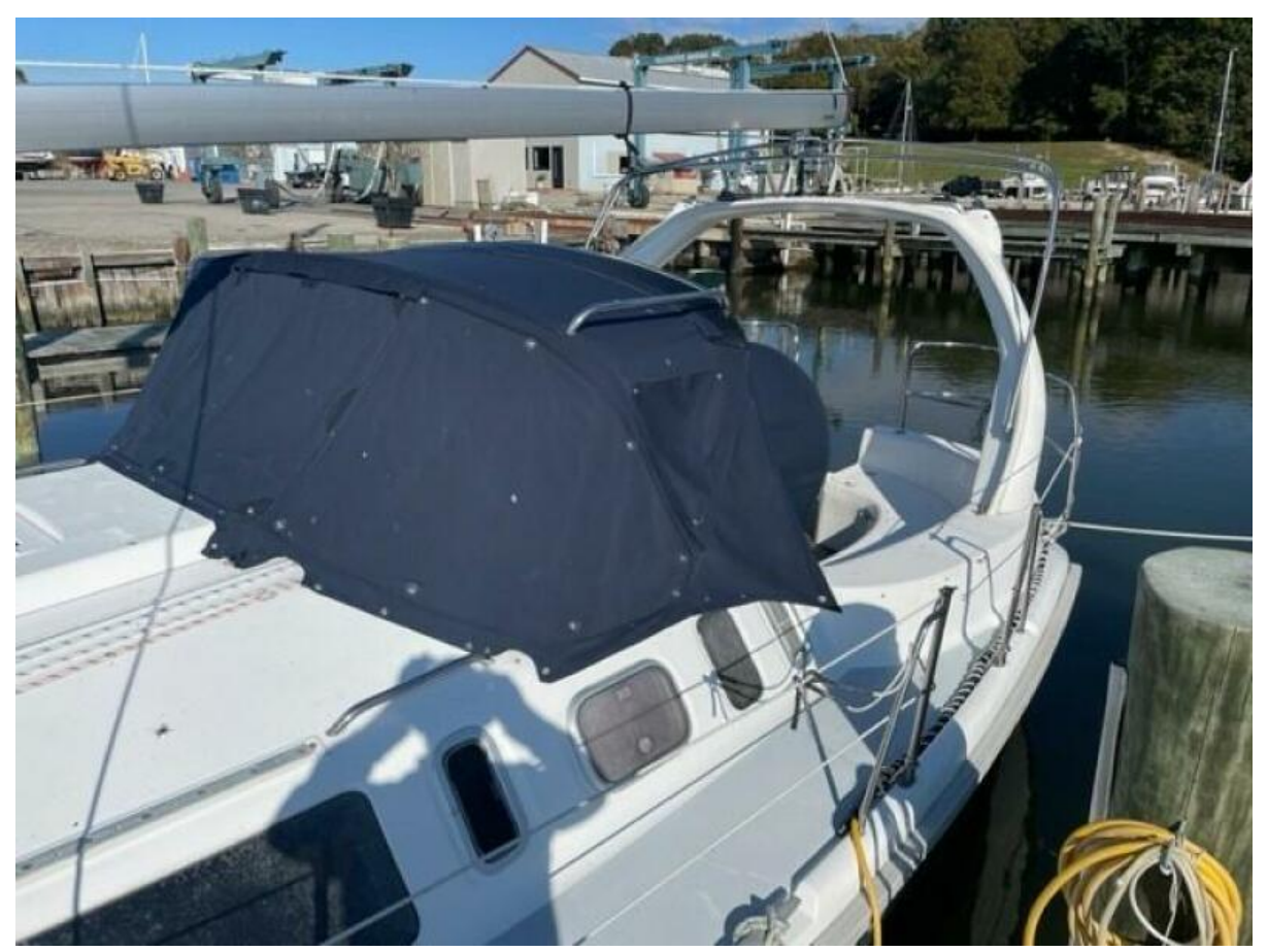
Dodger w/Sun Covers