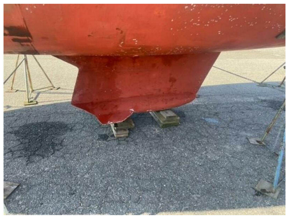
Bulbed Wing Keel