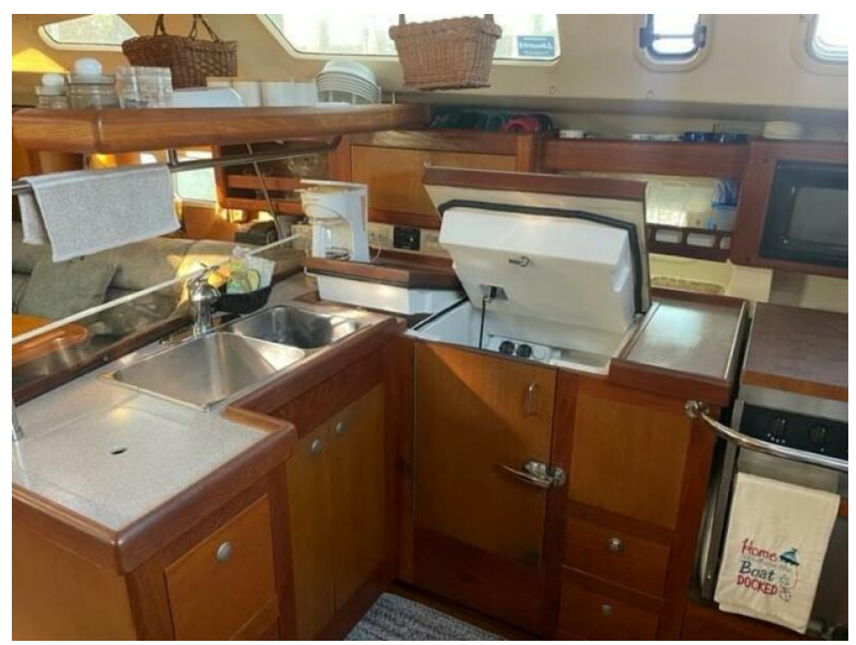
Large "U" Galley