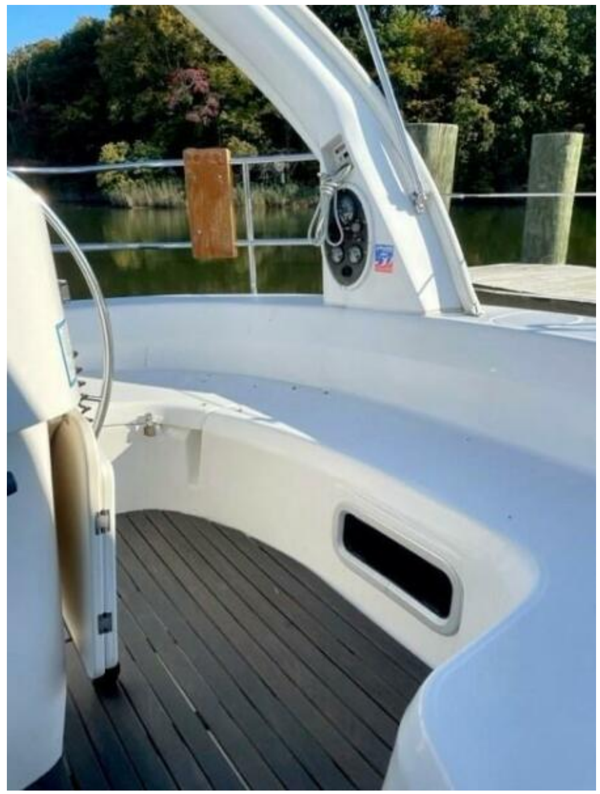
Cockpit Eng Panel