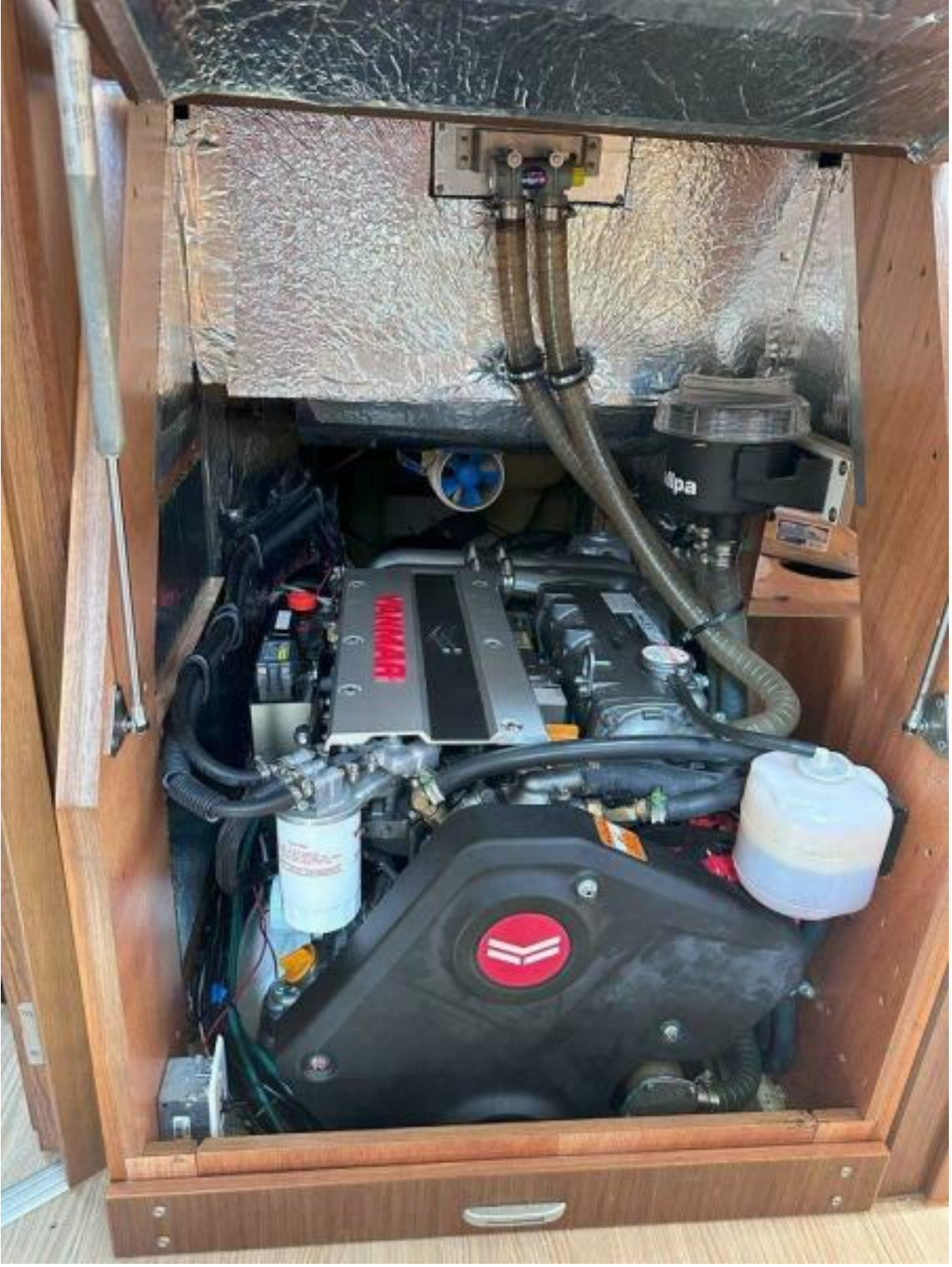
Engine, 80 HP Yanmar