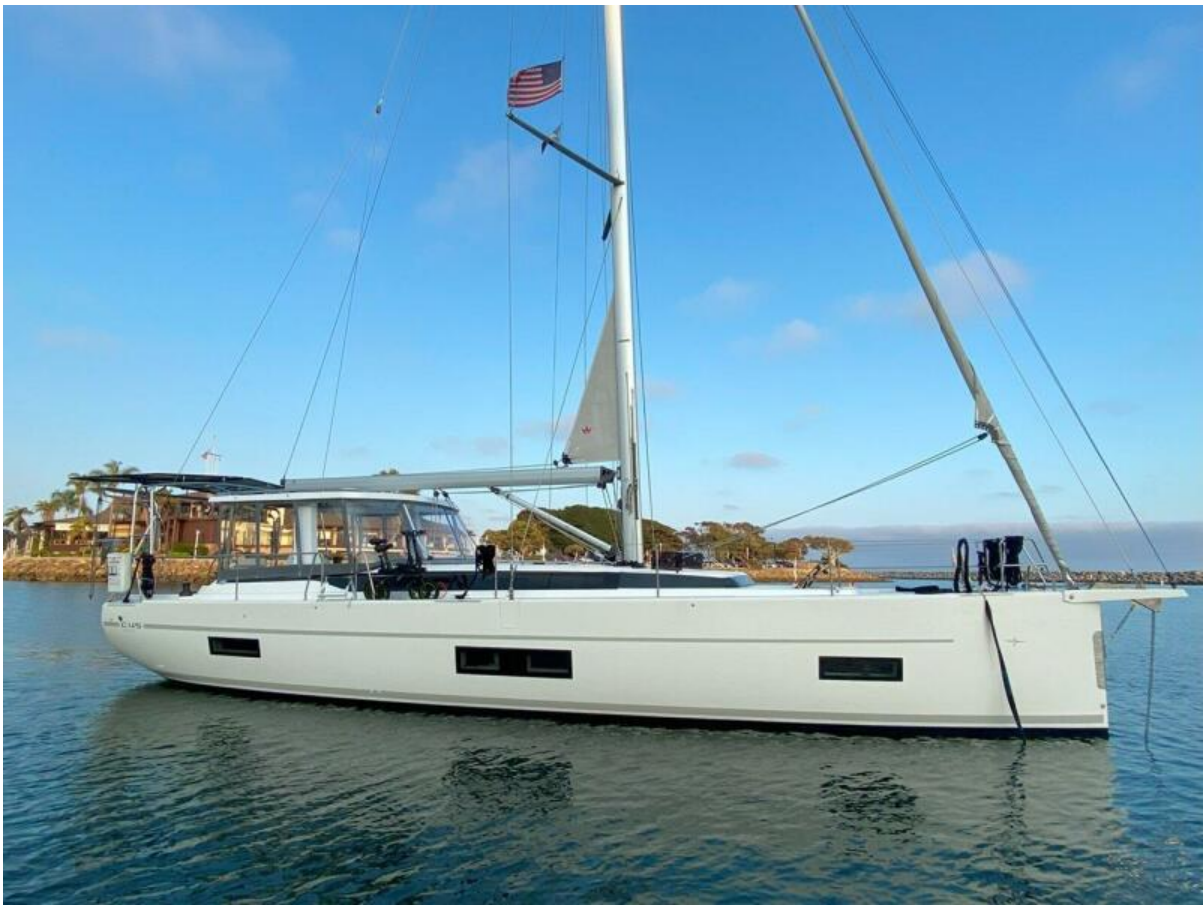
2019 Bavaria C45 Style with custom hard top