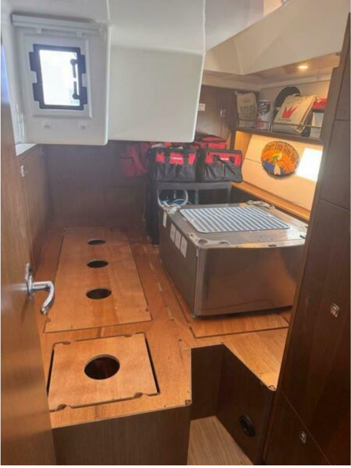
Aft port cabin