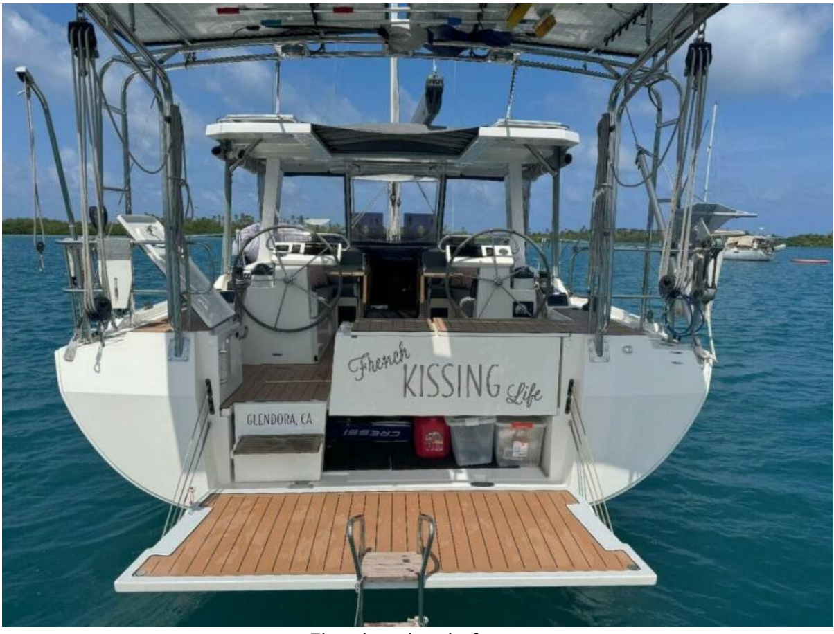
Electric swim platform