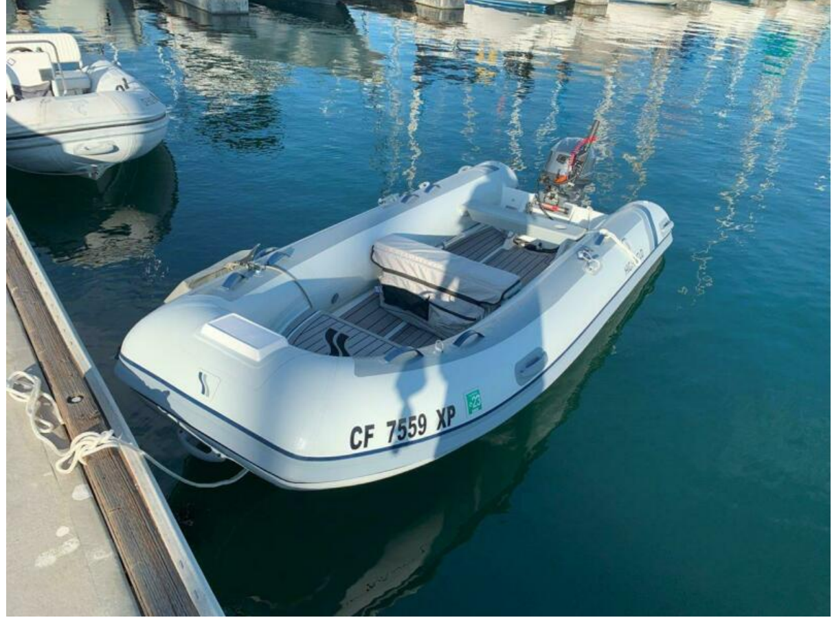
Dinghy without chaps