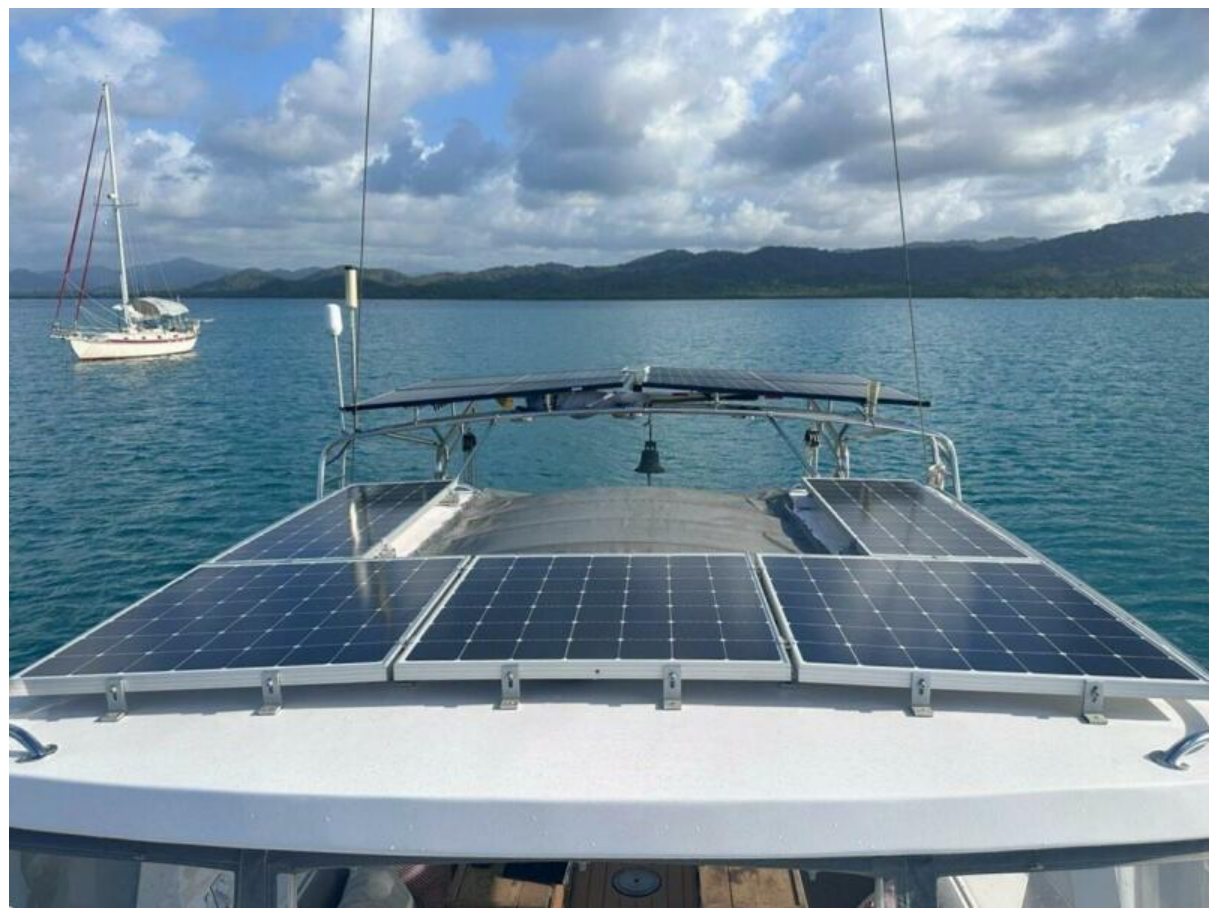
Nine solar panels