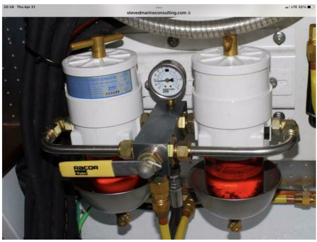
Dual Racor Fuel Filters