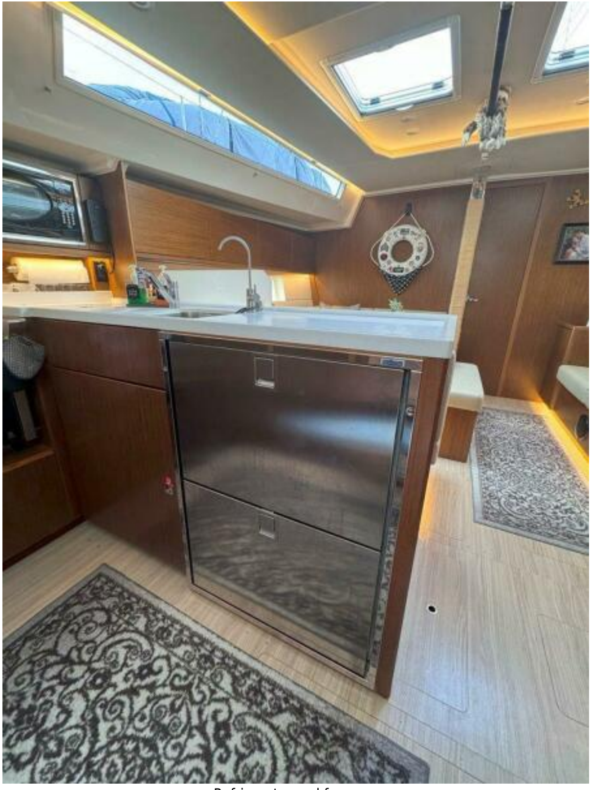
Refrigerator and freezer