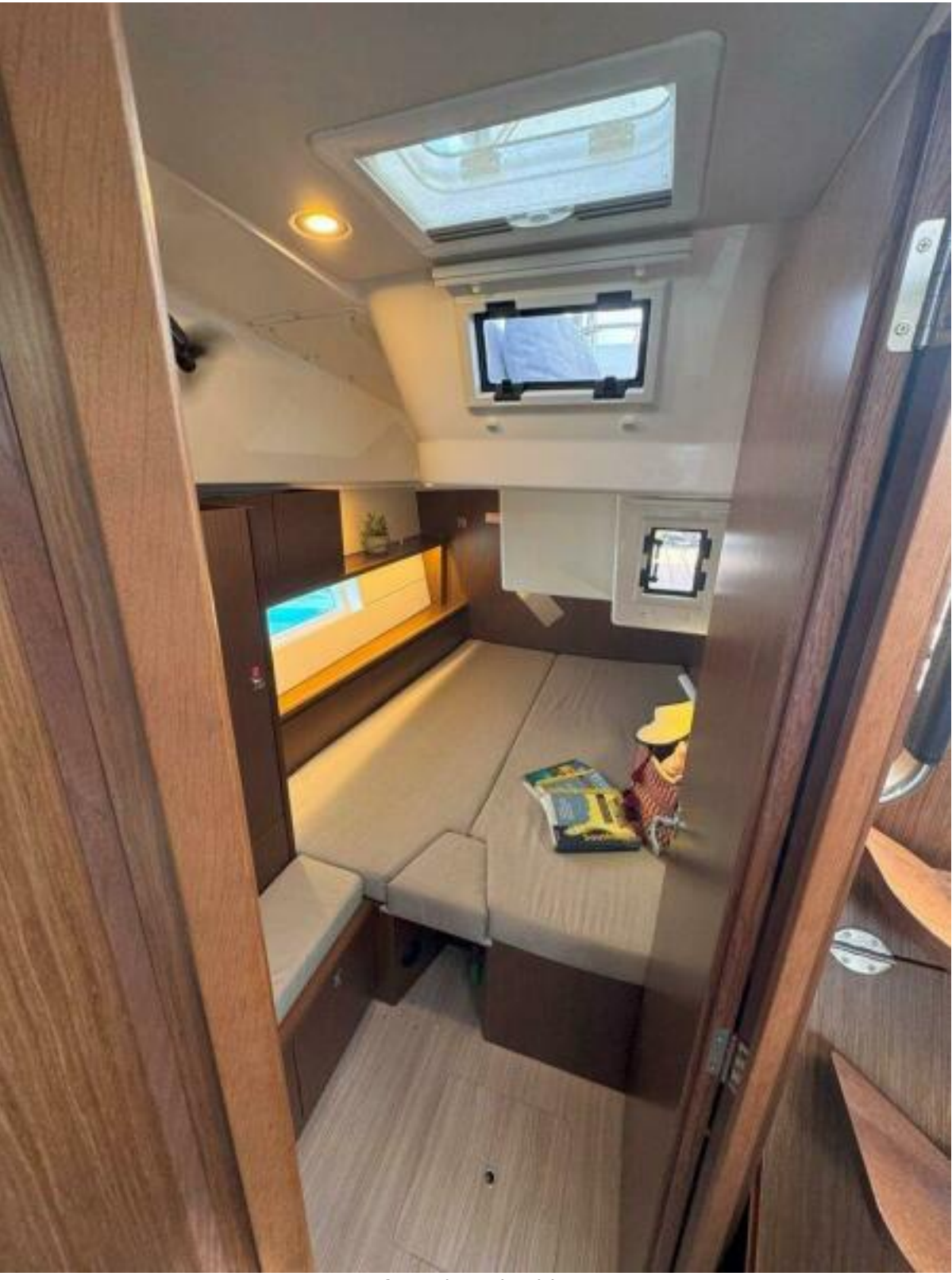
Aft starboard cabin