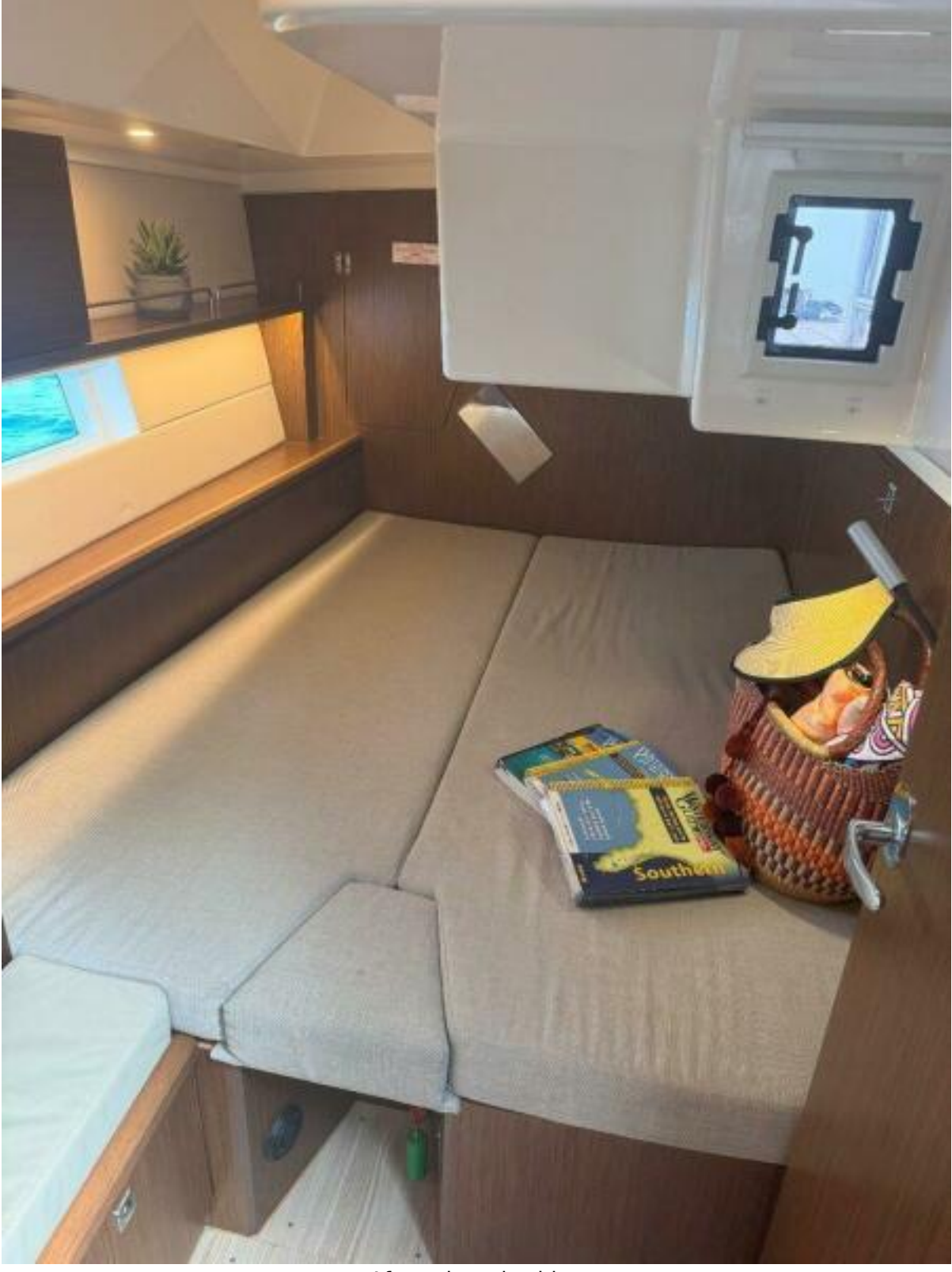
Aft starboard cabin