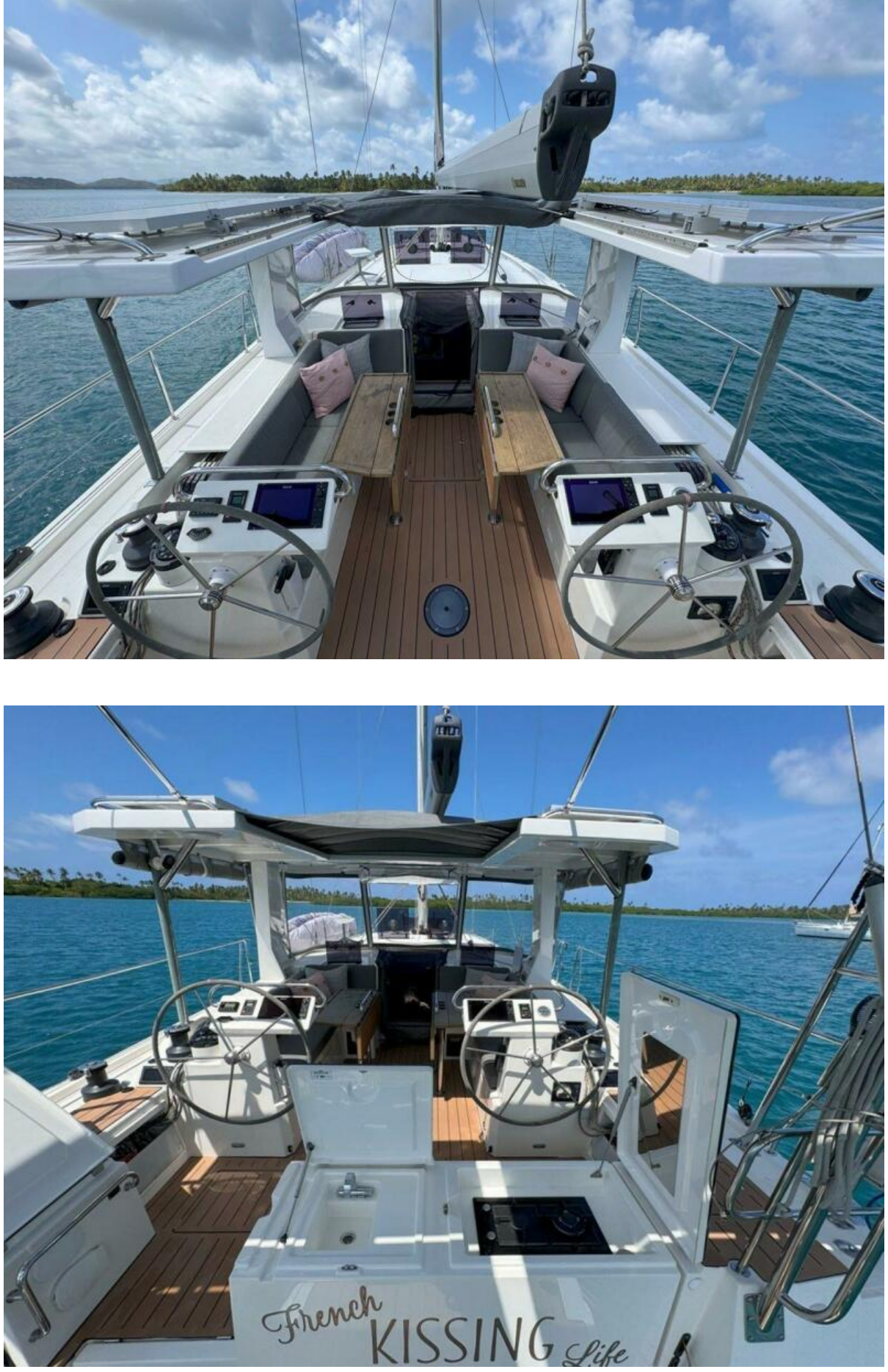
Sink and stove