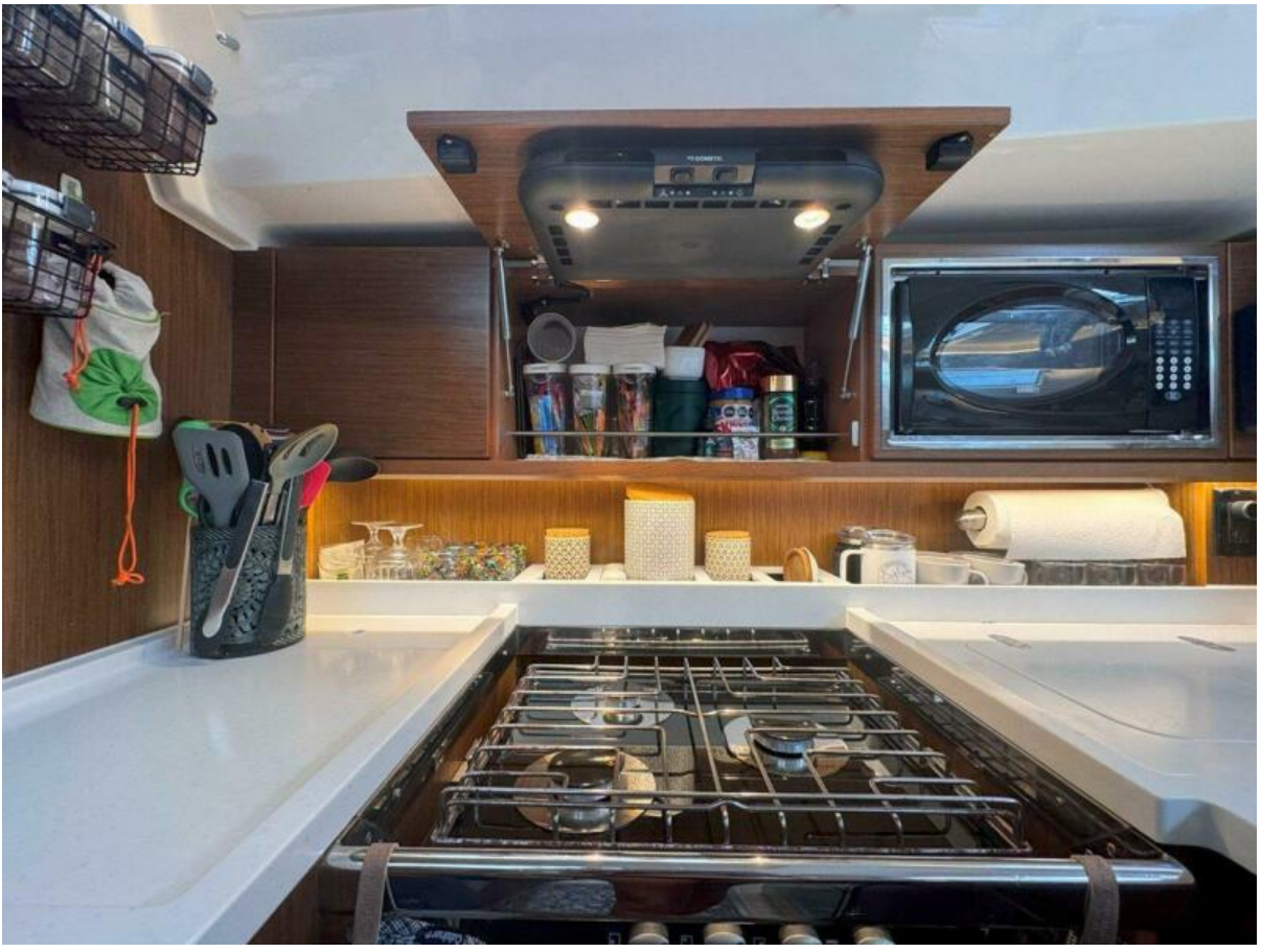
Stove and fan