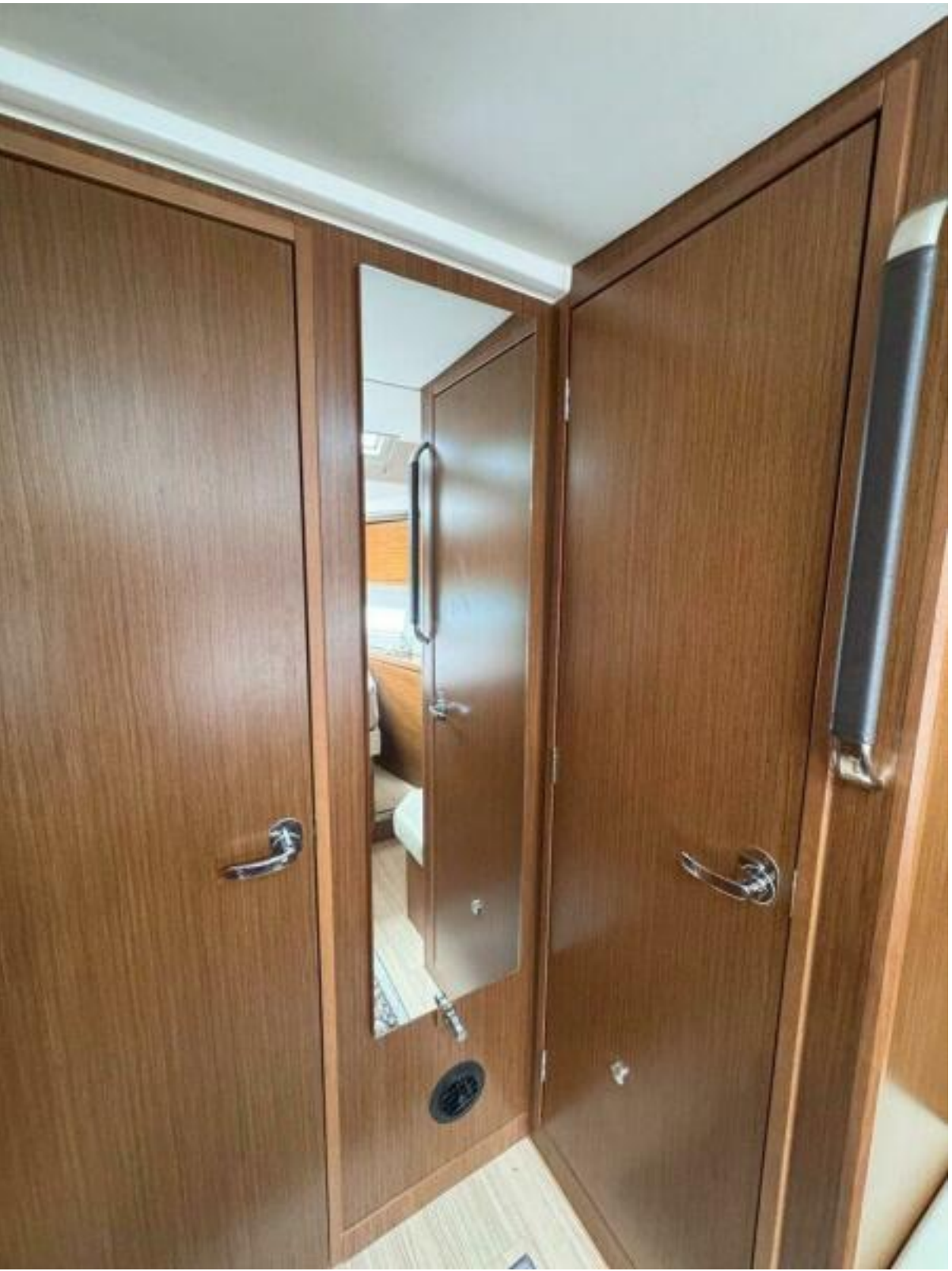
Forward Cabin, Mirror Behind Shower Door