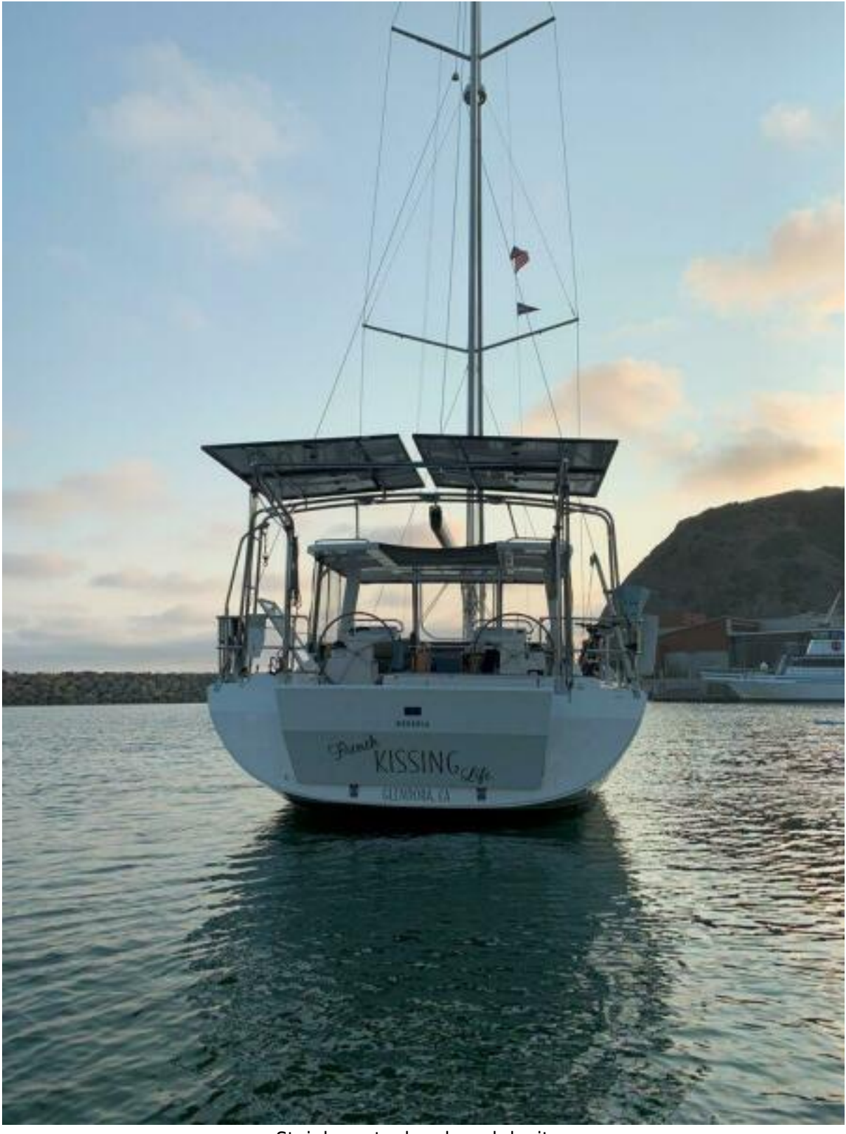
Stainless steel arch and davits