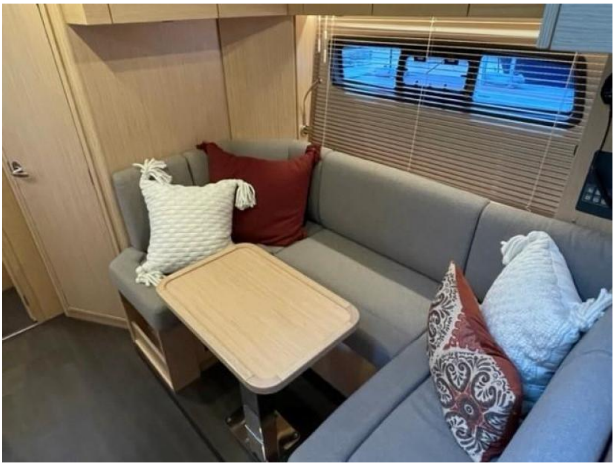
Bavaria SR41 Salon Seating