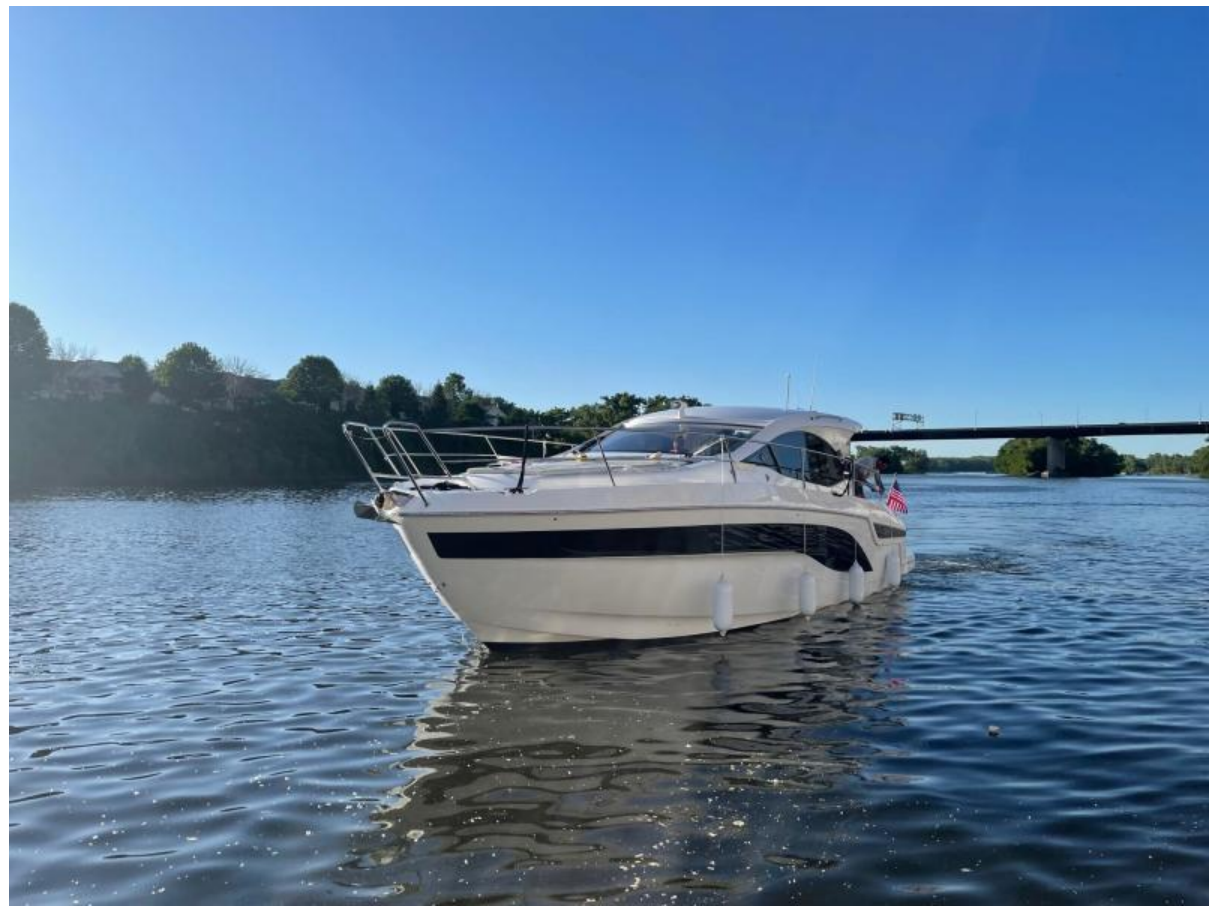
2022 Bavaria SR41 Coupe