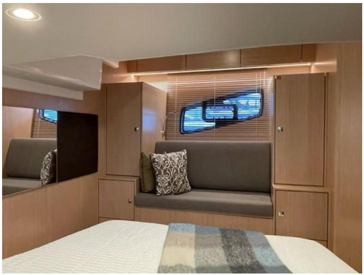
Aft Cabin Seat