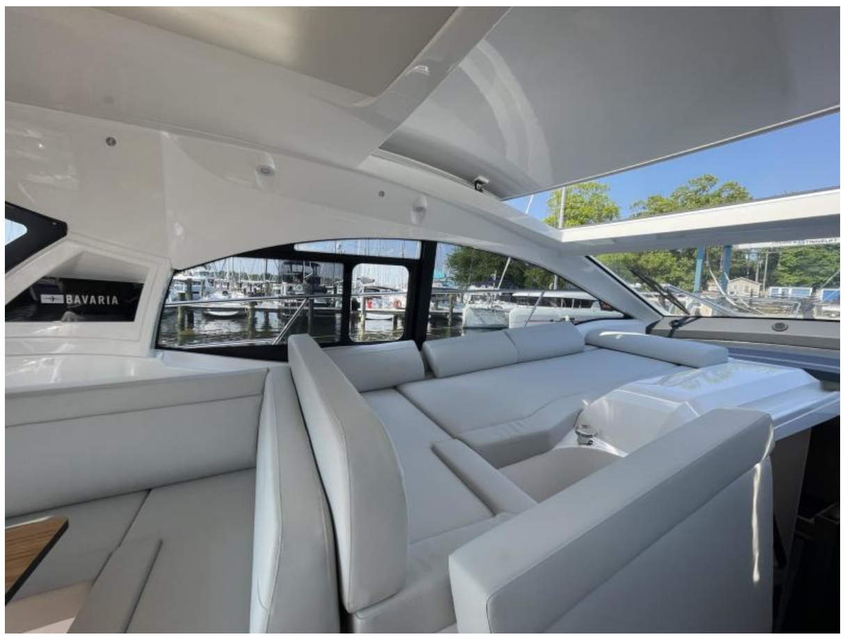
Bavaria SR41 Coupe Lounge Area