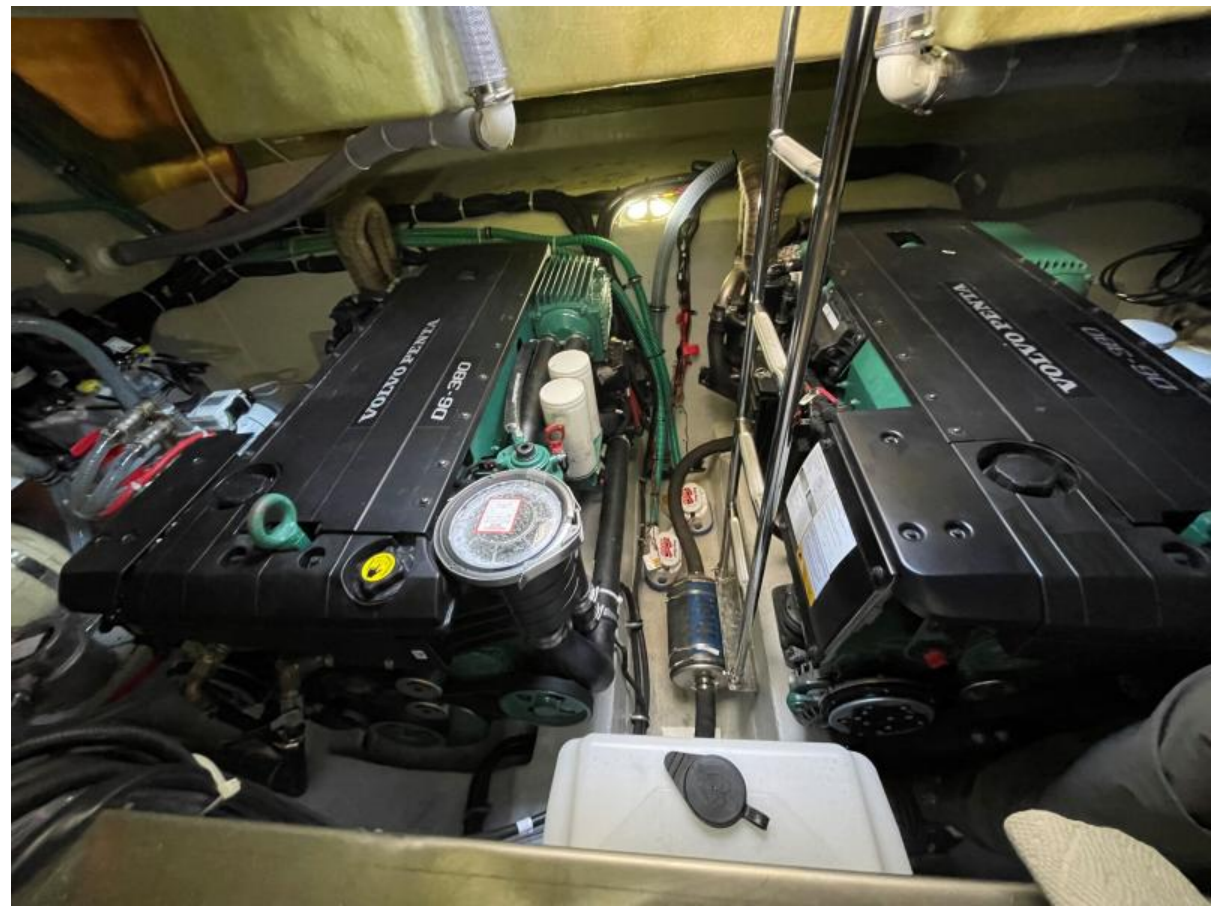
Bavaria SR41 Coupe Engines