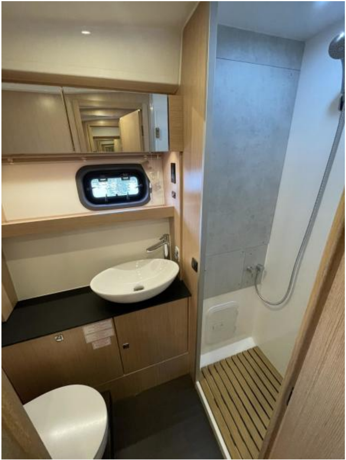
Bavaria SR41 Coupe Aft Head 3