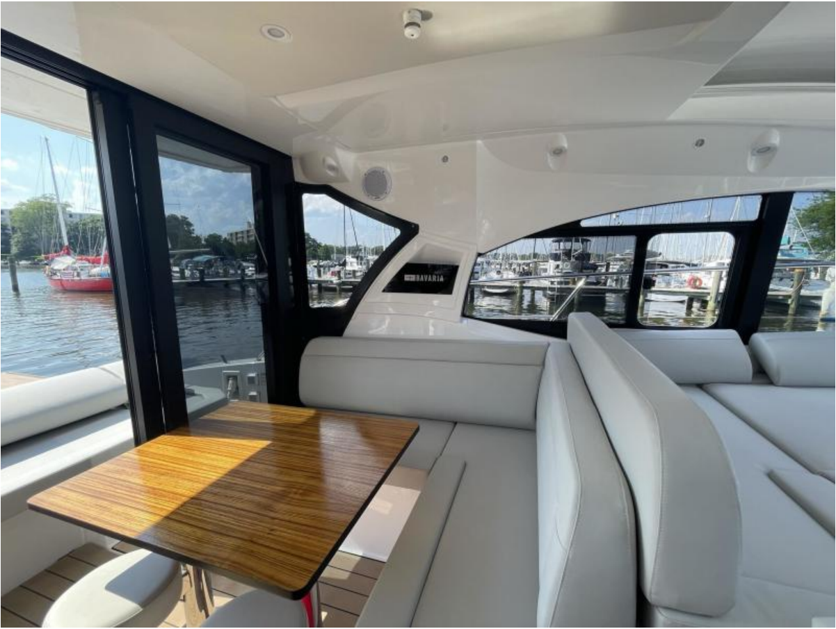
Bavaria SR41 Coupe Aft Cockpit Table