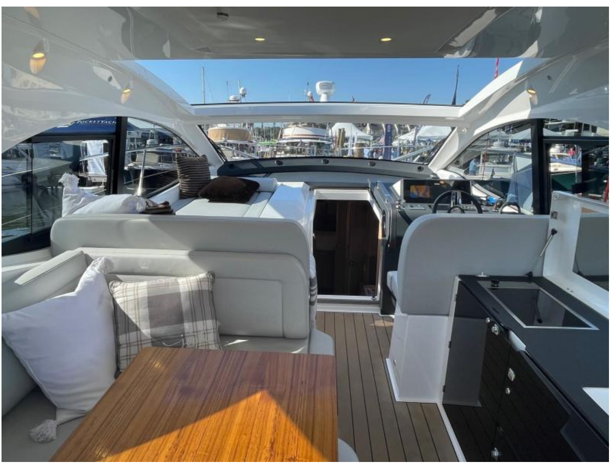
Cockpit w/Roof Open