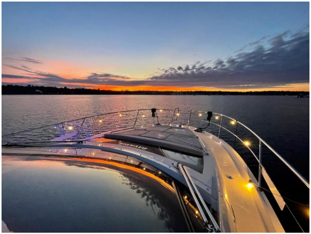
2022 Bavaria SR41 Foredeck Lounge Area