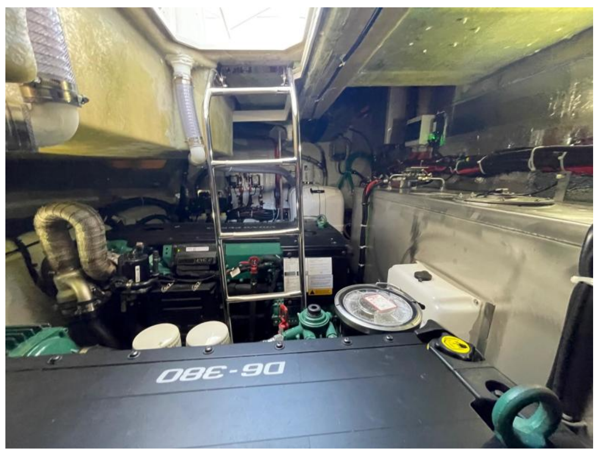
Bavaria SR41 Mechanical Room