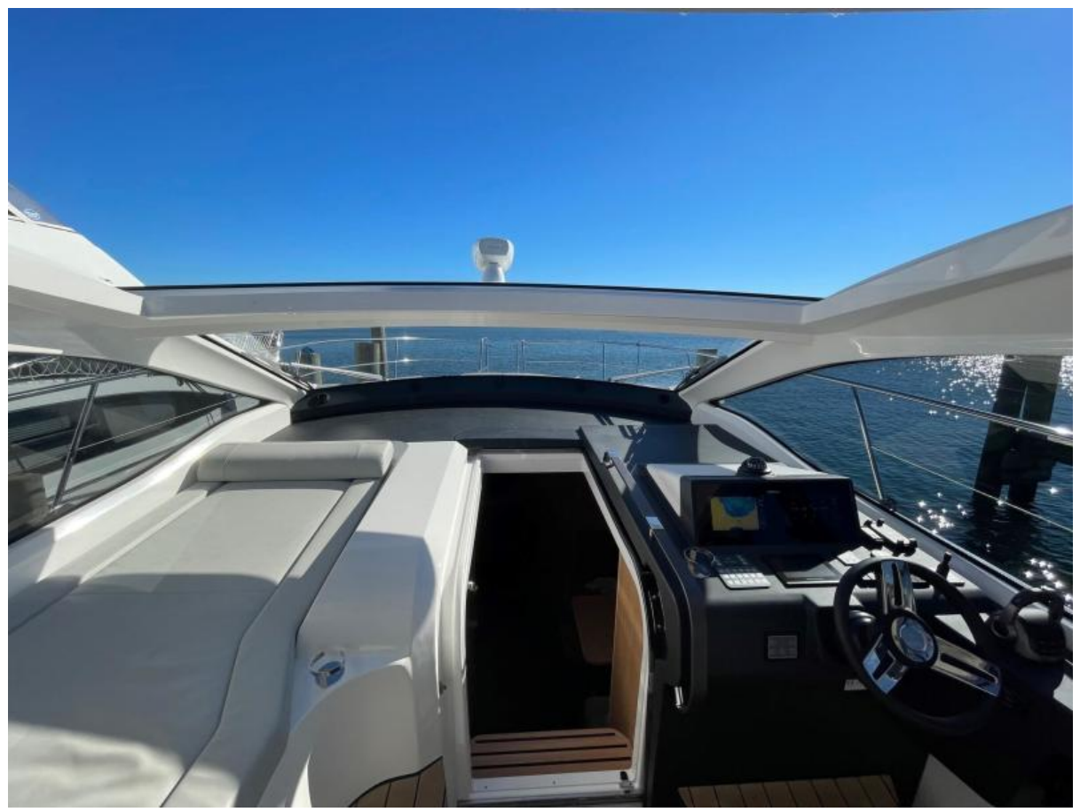
Bavaria SR41 Coupe Cockpit With Roof Open 2