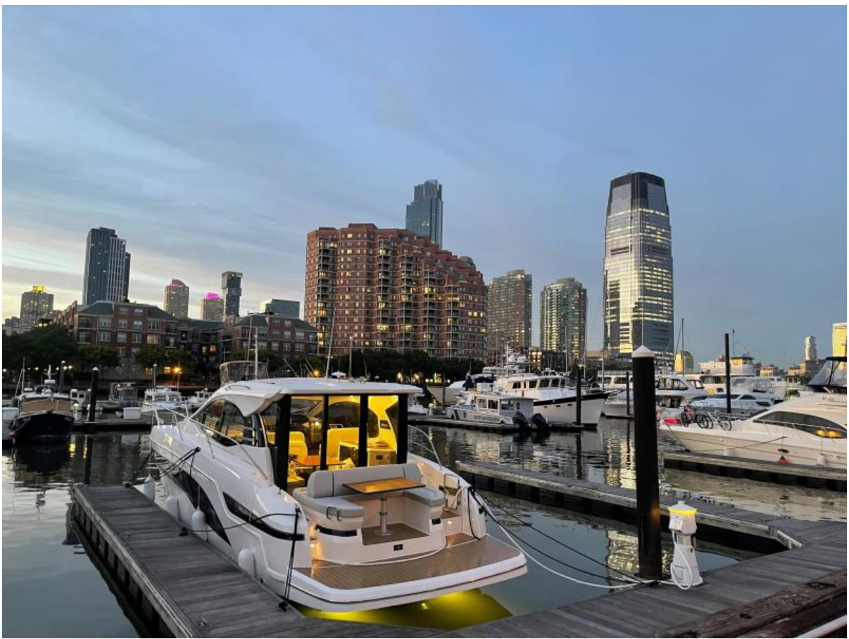
2022 Bavaria SR41 Coupe_Liberty Landing Marina