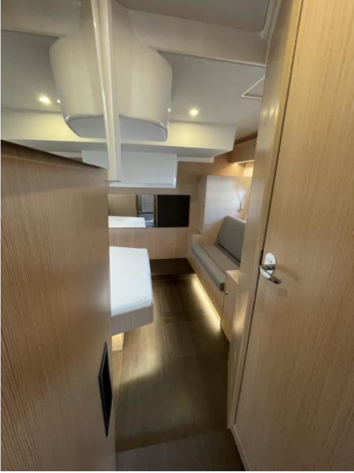
Bavaria SR41 Coupe Aft Cabin