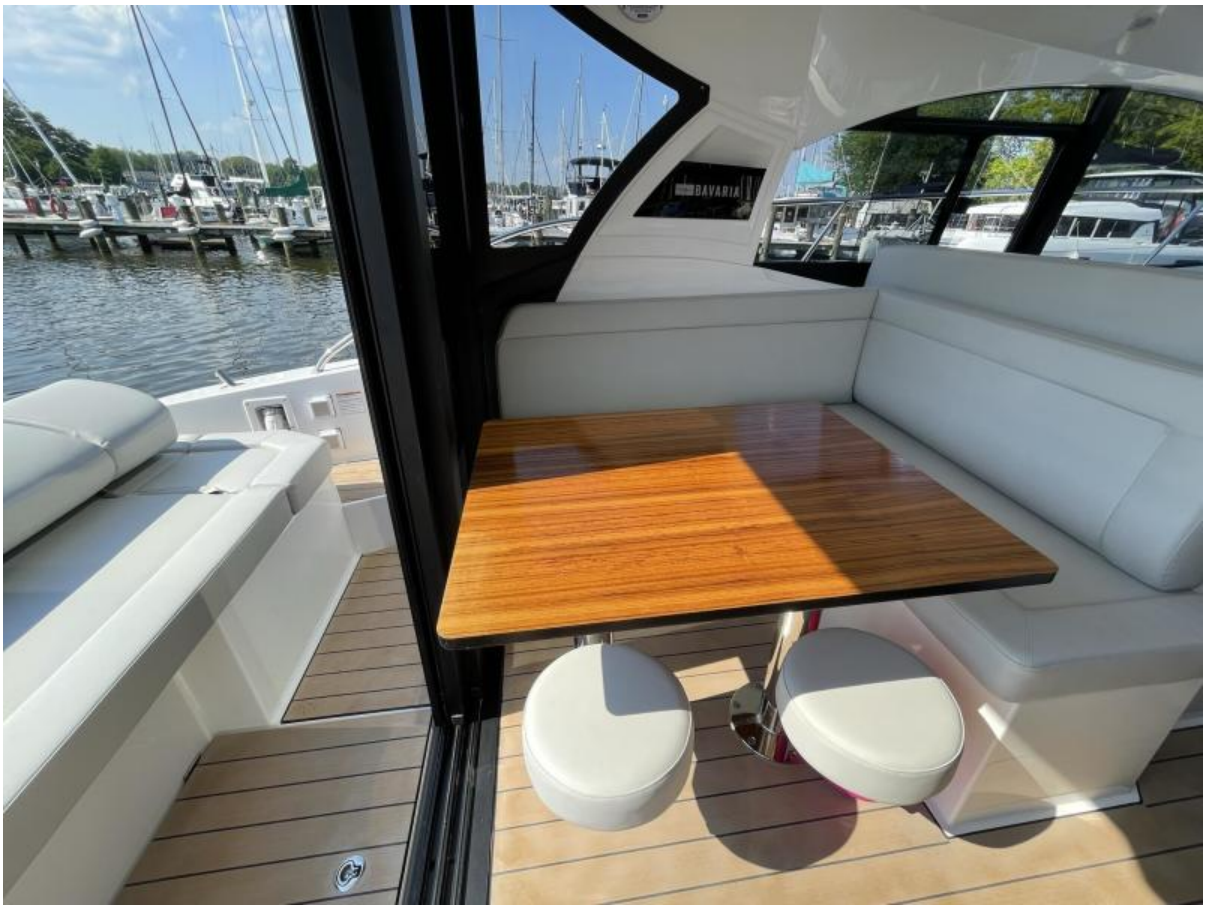
Bavaria SR41 Coupe Cockpit Table