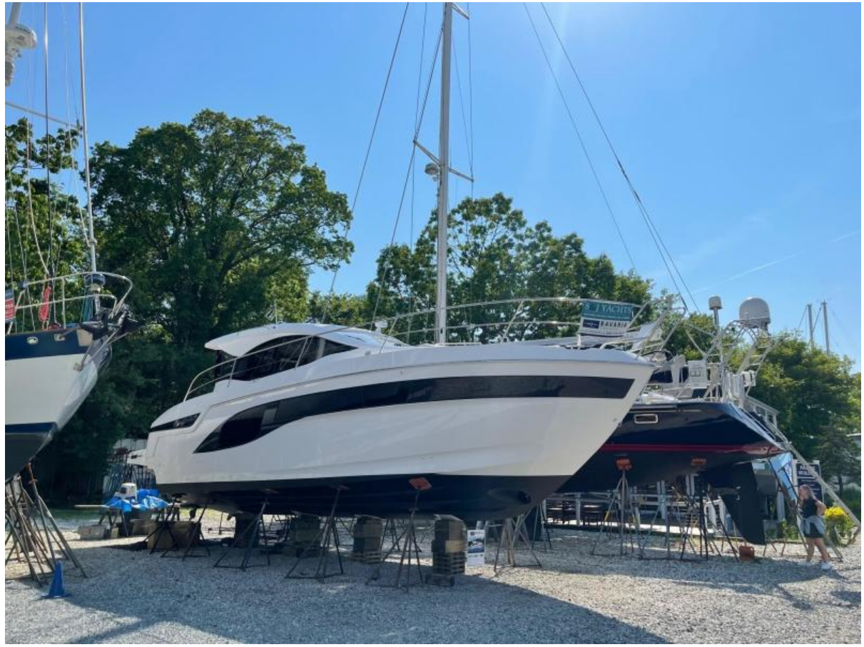
2022 Bavaria SR41 Starboard Side Out Of Water