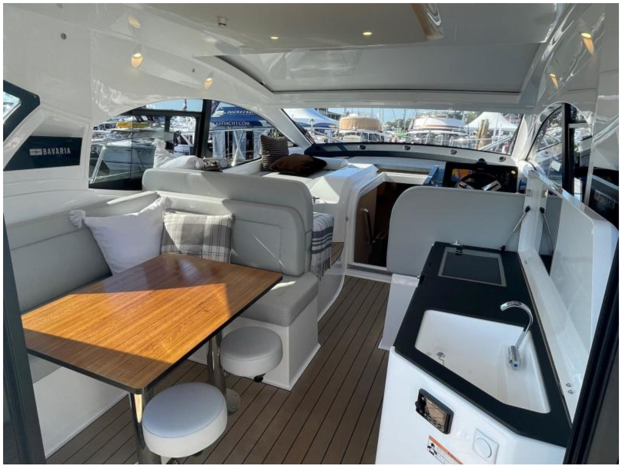
Cockpit w/Roof closed