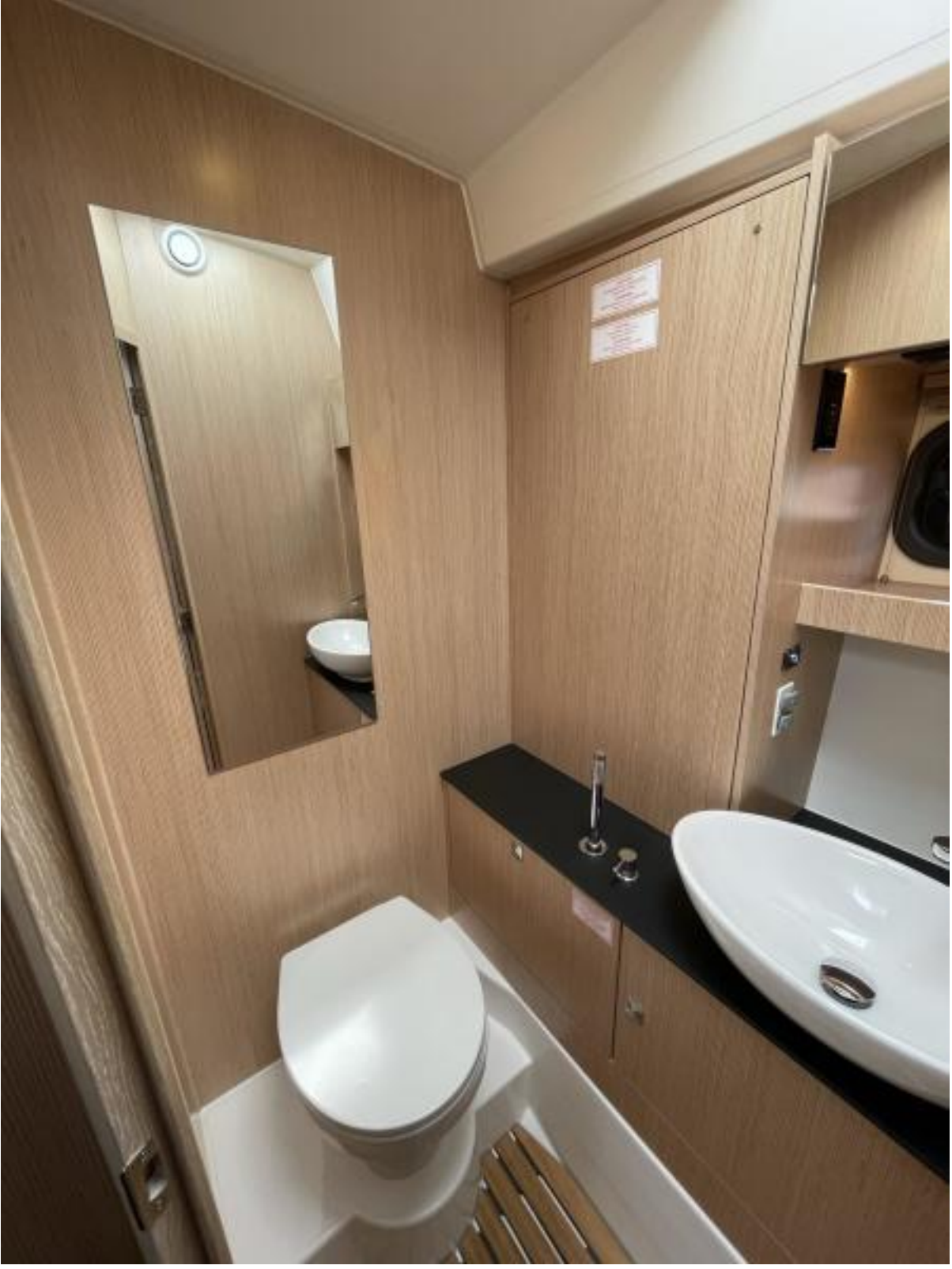
Bavaria SR41 Coupe Fwd Head