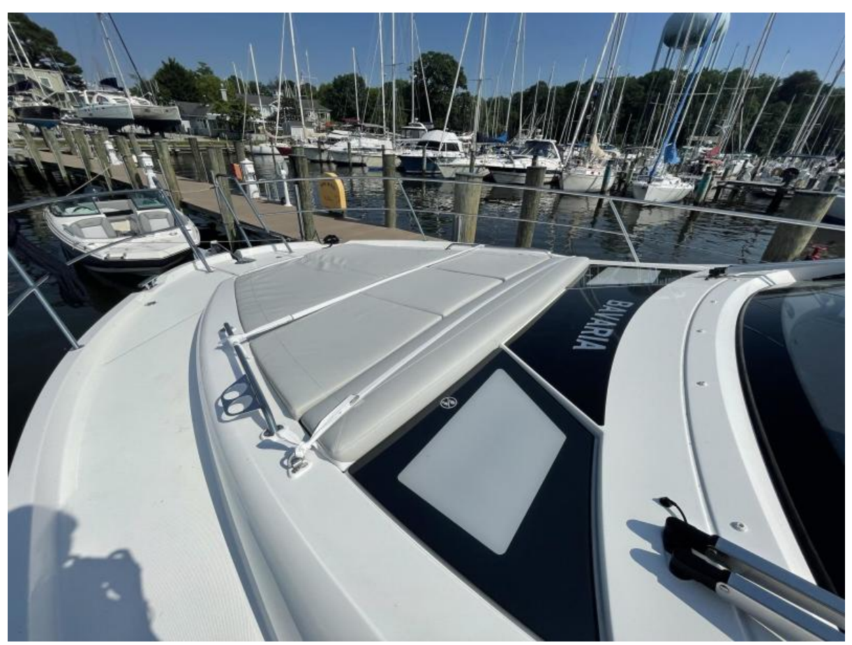
Bavaria SR41 Coupe Foredeck