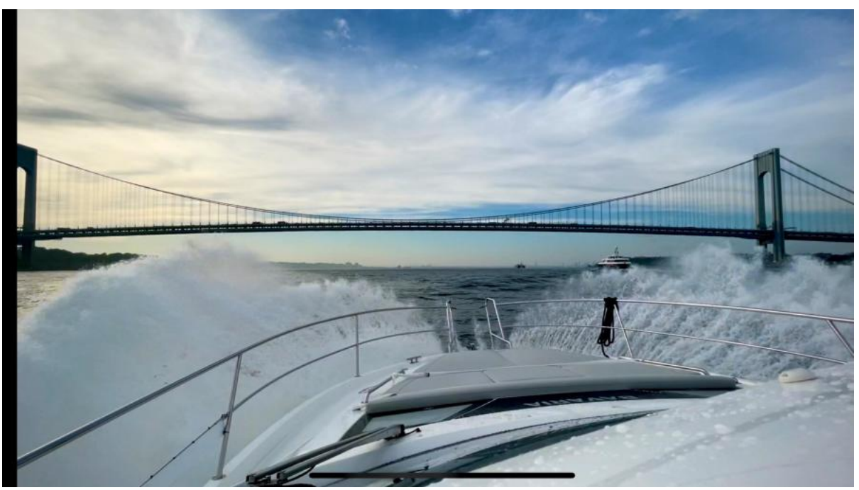
2022 Bavaria SR41 Coupe NYC