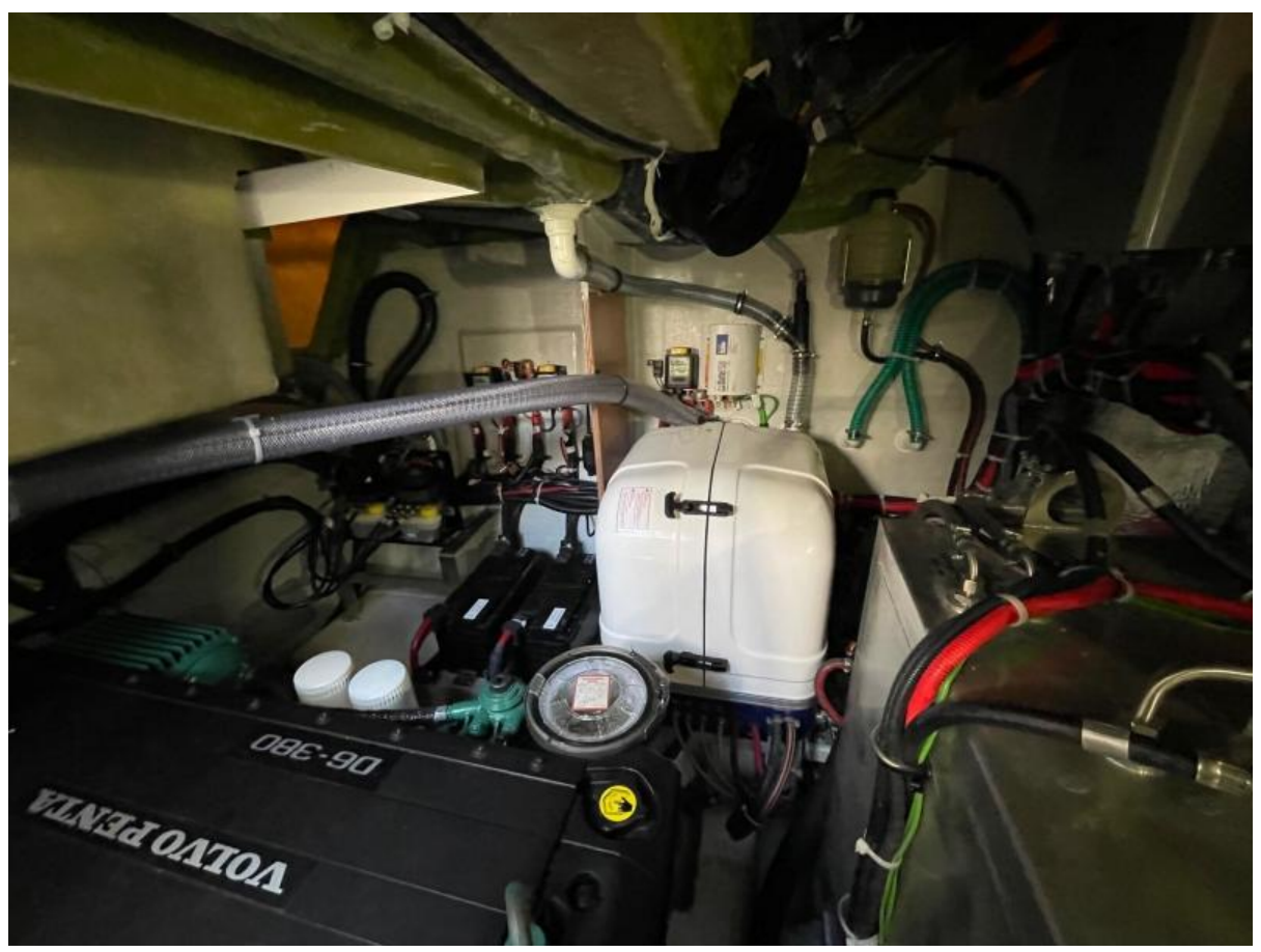
Bavaria SR41 Coupe Generator