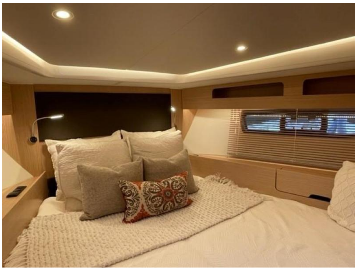
Bavaria SR41 Coupe Forward Cabin