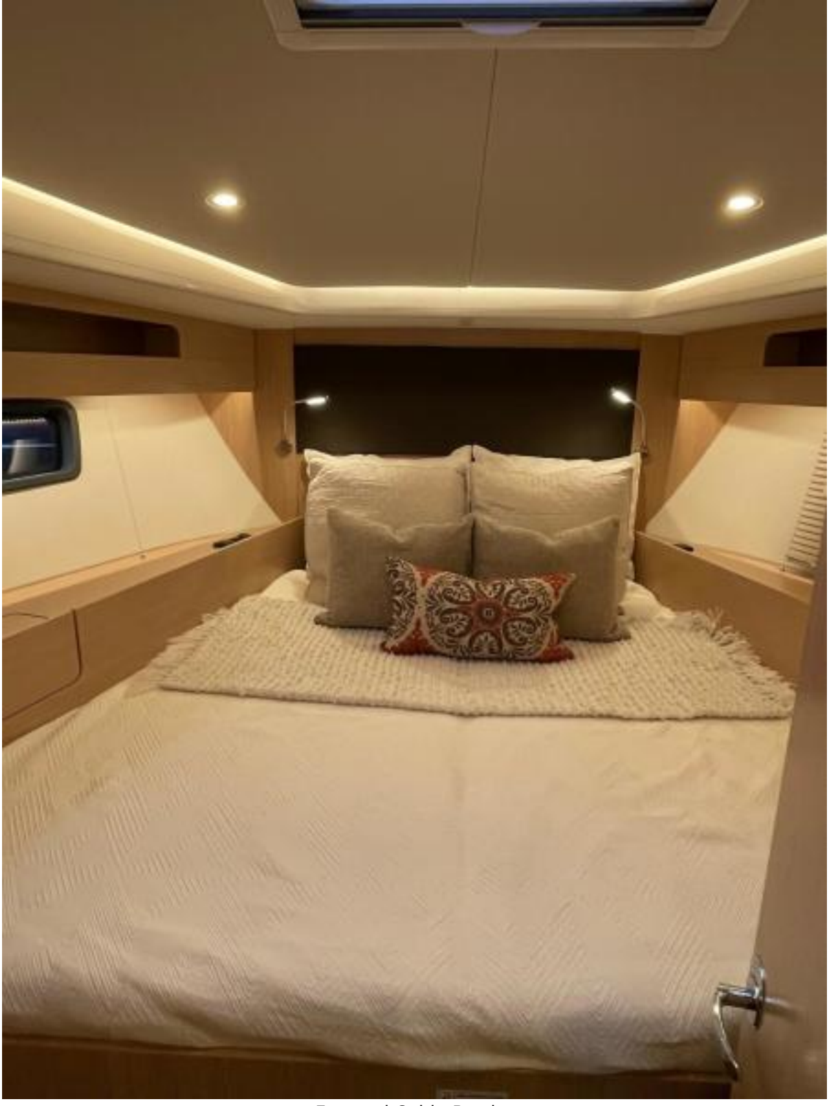
Forward Cabin Berth