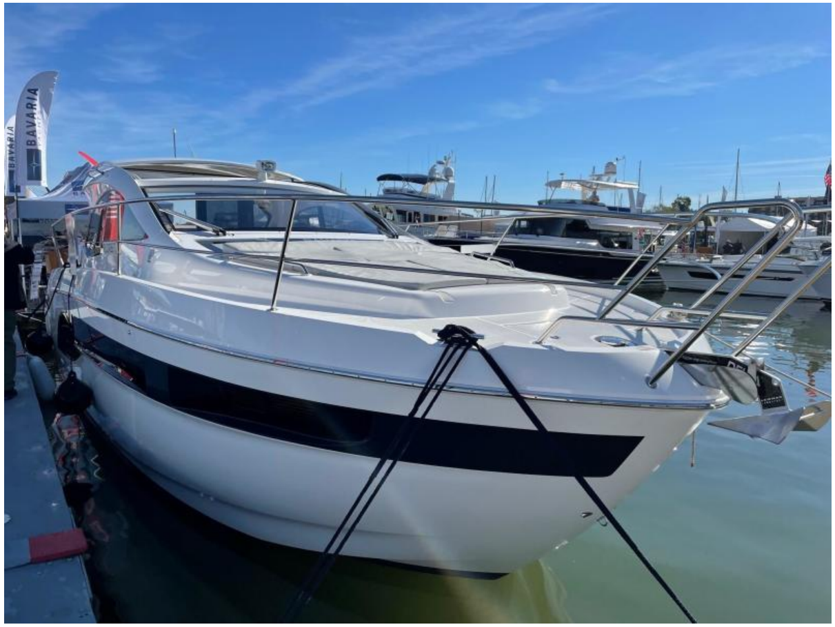
2022 Bavaria SR41 Coupe "Boss Baby"