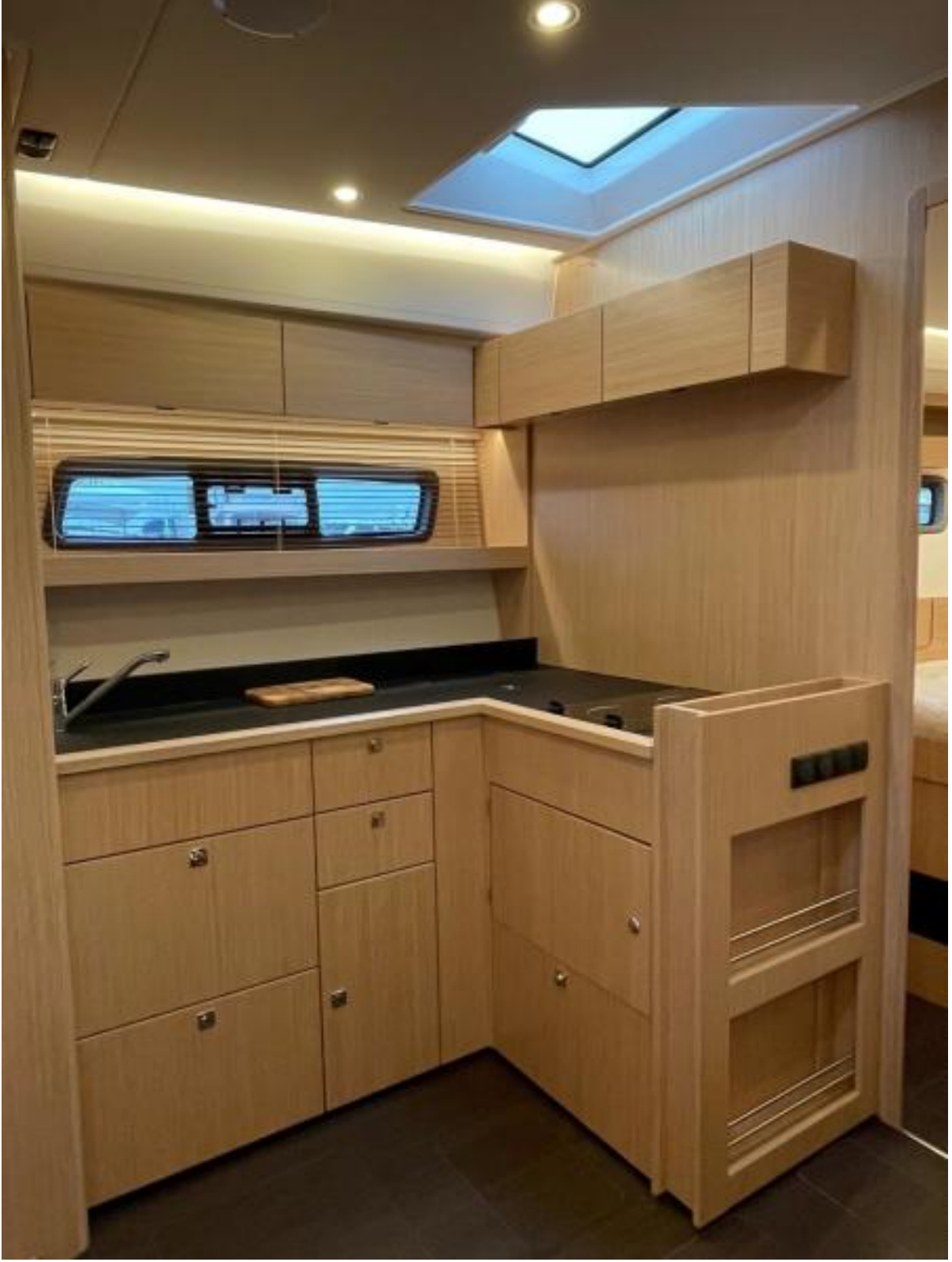
Bavaria SR41 Galley