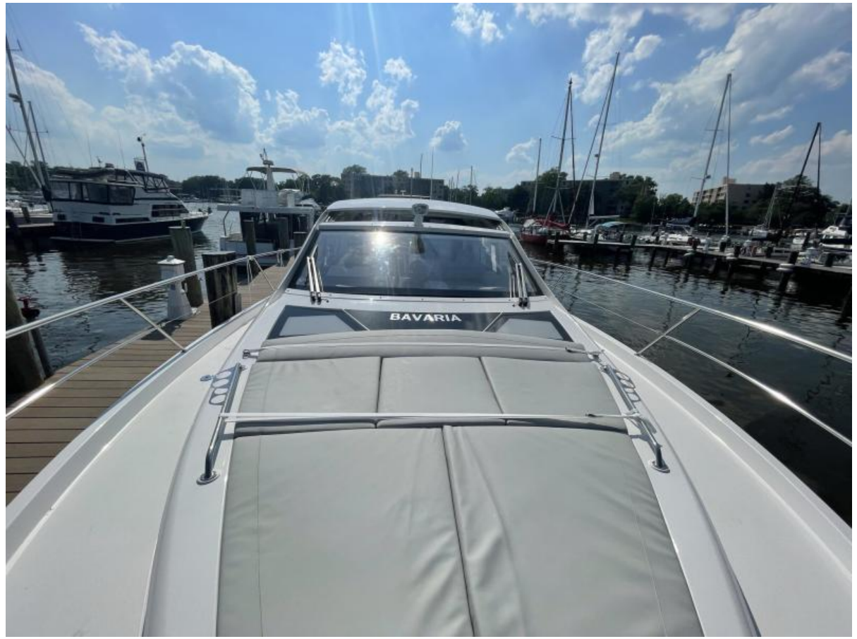
Bavaria SR41 Fwd Sun Pad