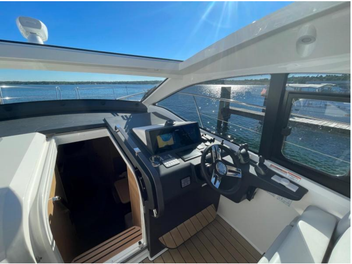
Bavaria SR41 Coupe Helm Station