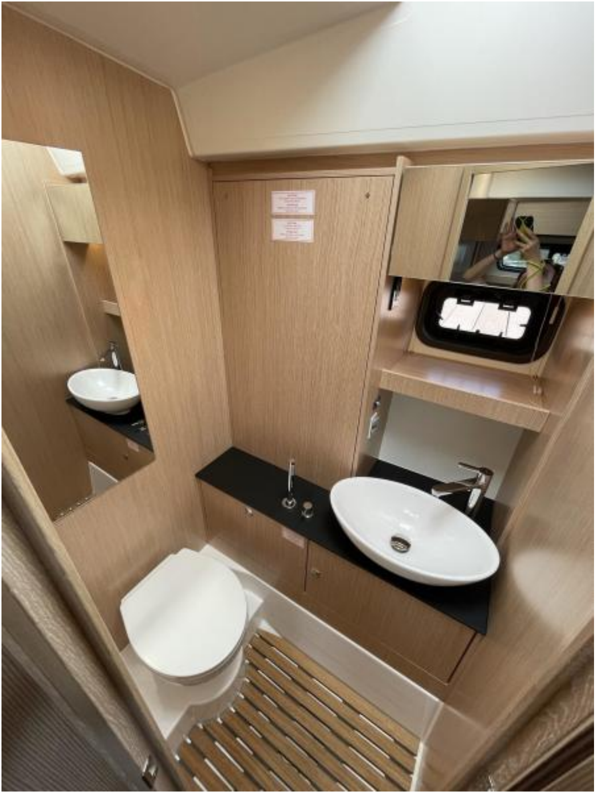
Bavaria SR41 Coupe Fwd Head 2