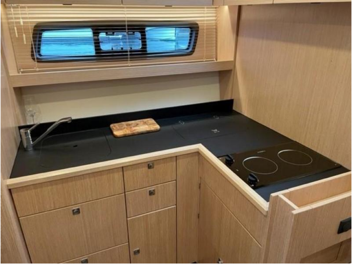
Sink, Electric Stove, Microwave and Refrigerator