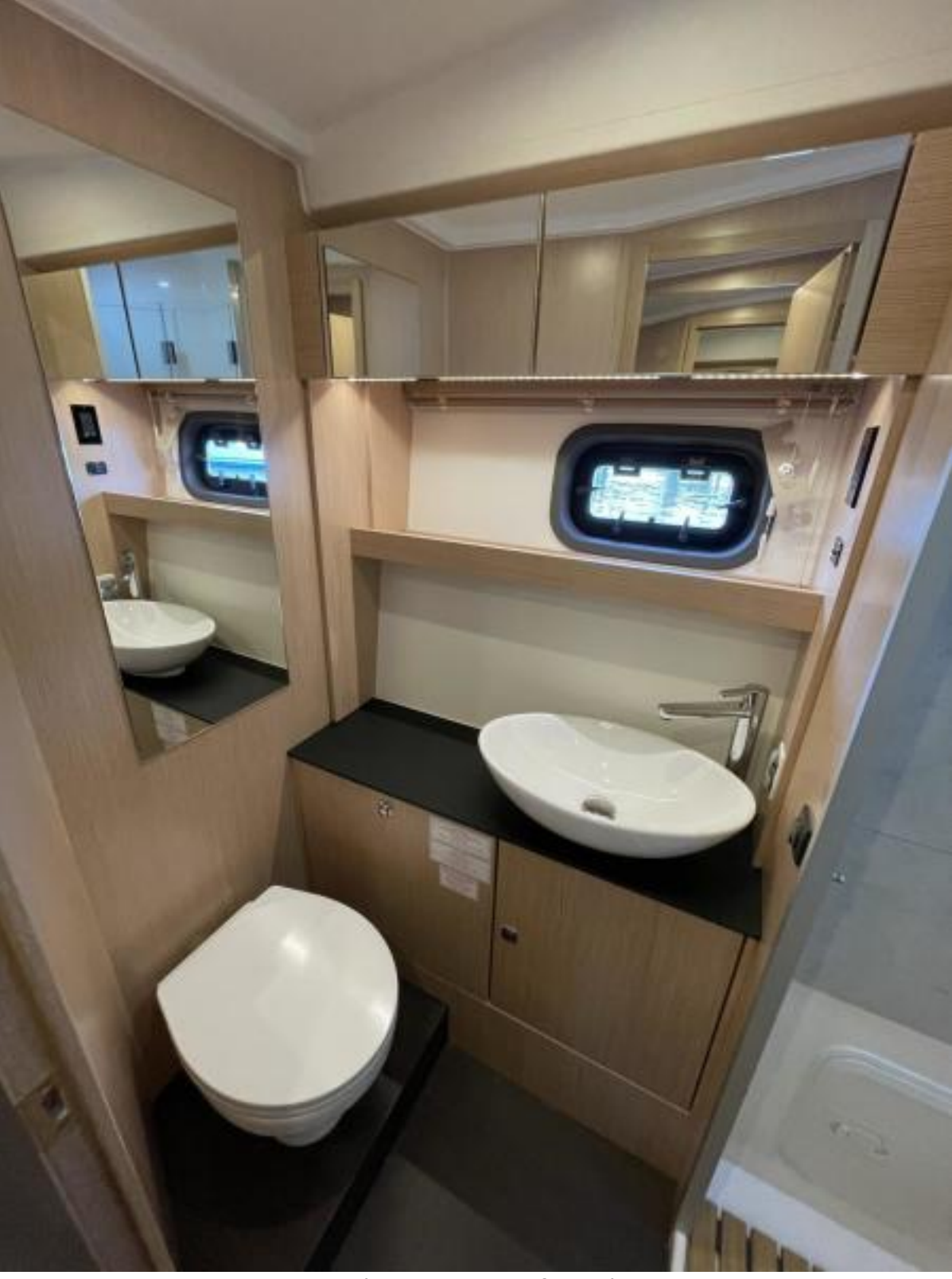
Bavaria SR41 Coupe Aft Head 2