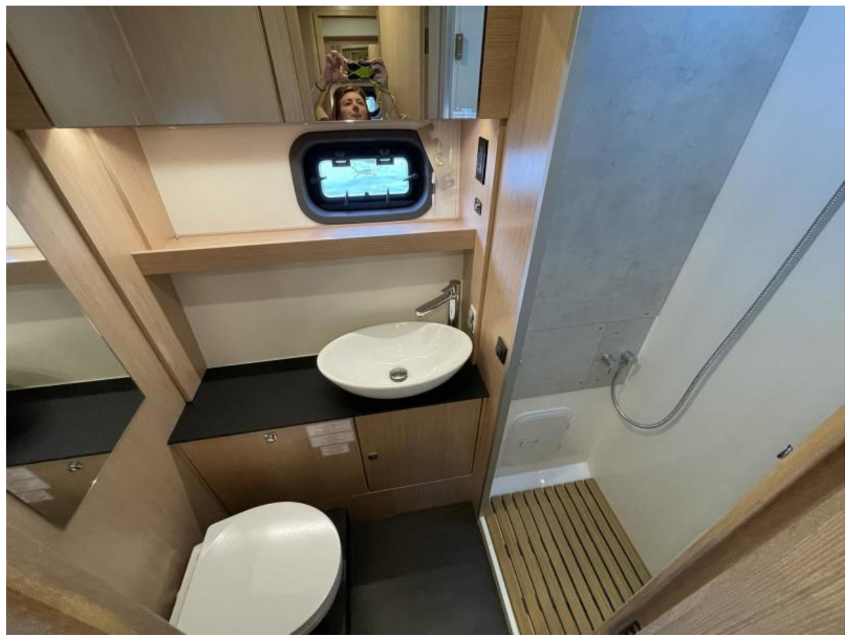
Bavaria SR41 Coupe Aft Head