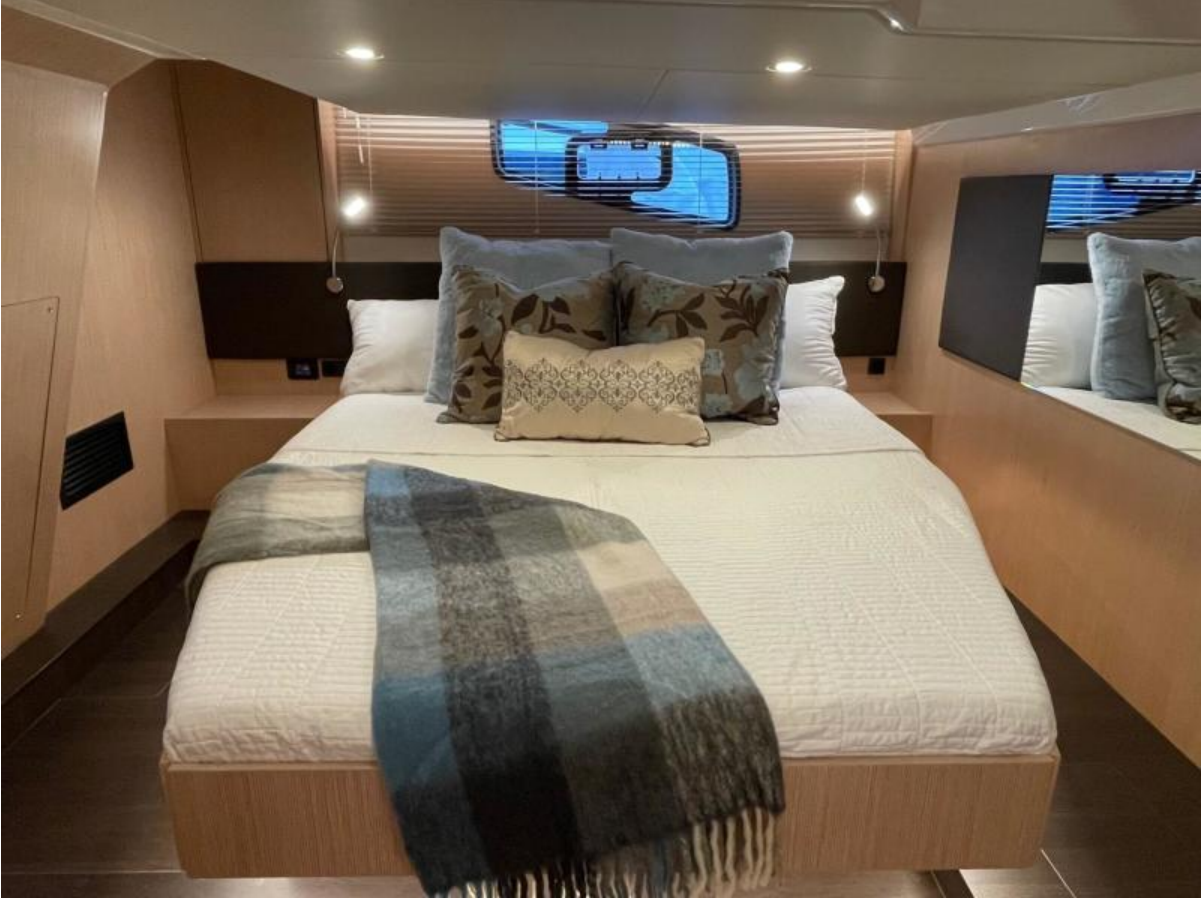
Bavaria SR41 Coupe Aft Cabin Berth